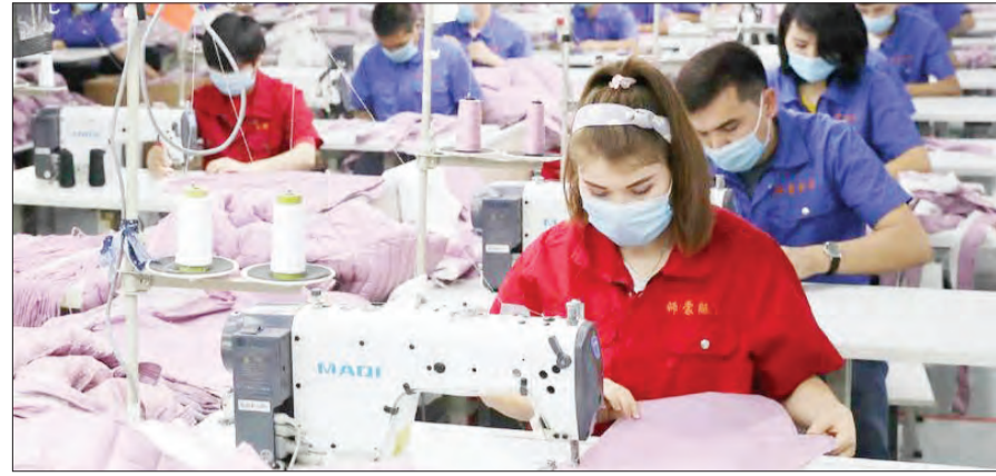
Workers make down-filled coats at a factory in Jiashi county, Xinjiang Uygur autonomous region. File photo

"The sanctions have affected the exports of cotton and cotton products from the XPCC," Sun said. "It means that many foreign businesses will be unable to