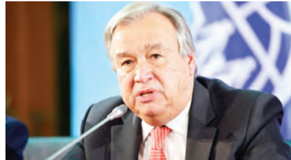
be our New Year's Resolution for 2021."

"Healing from the impact of a deadly virus. Healing broken economies and societies. Healing divisions. And starting to heal the planet," the secretary-general added, noting that "that must