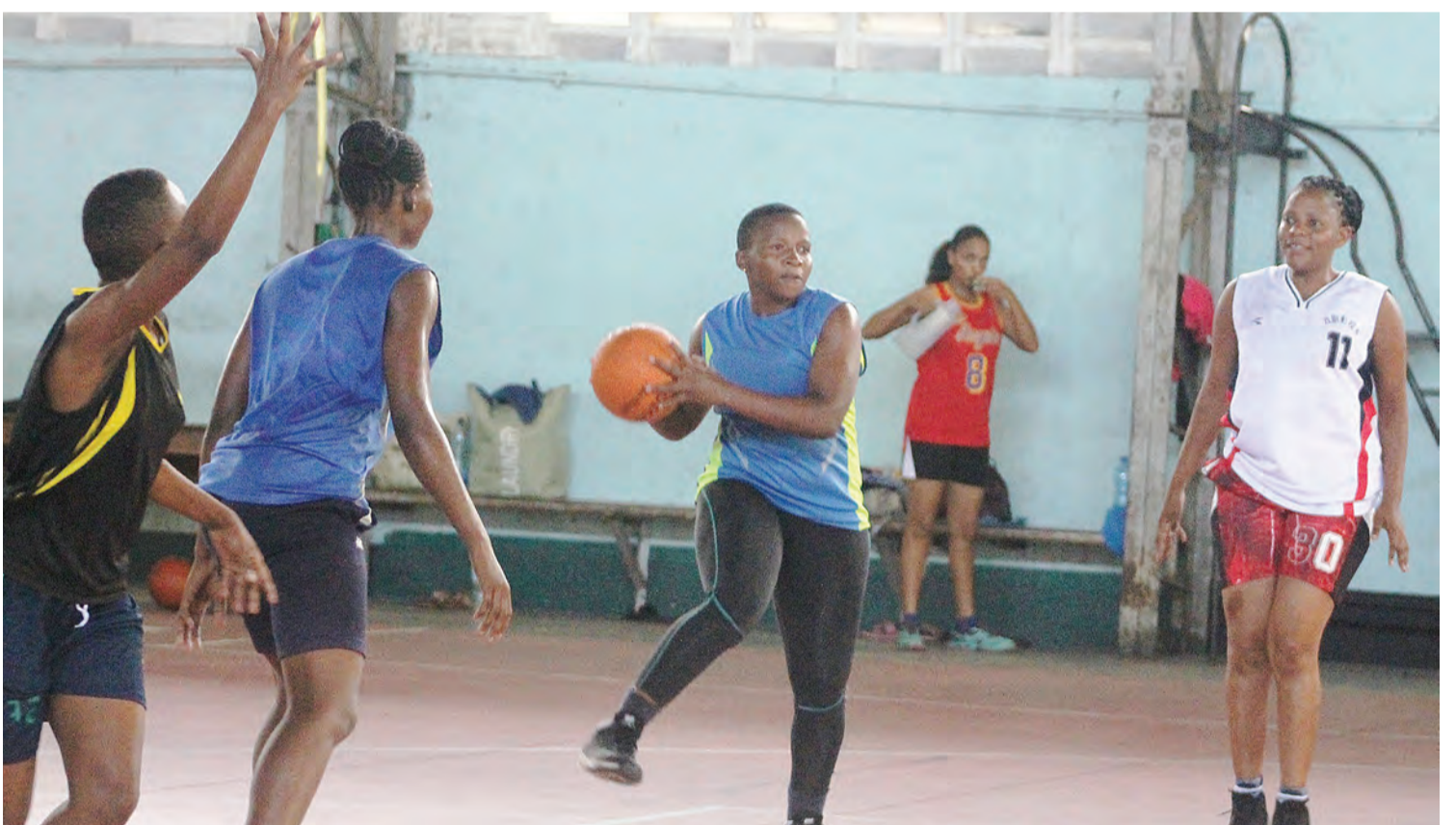
The JKT netball team participate in recent training in Dar es Salaam to shape up for domestic competitions.

It also means he takes up family issues candidly and sincerely as they come, as when one is balanced in the mind, such person will also be balanced in outlook, someone pursuing lusts is rarely a good family provider especially if his means are low as in this case. That view is more consummating.