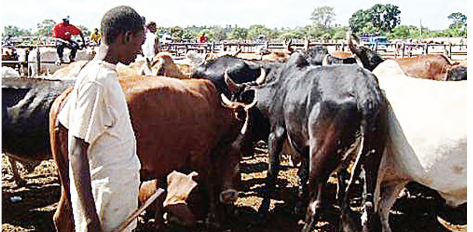
Cattle being sold at Pugu livestock auction market in Dar es Salaam.