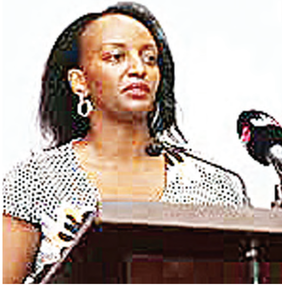
Rwanda's trade minister, Soraya Hakiyaremye.

traders from developing countries to export their products to the European Union. This is done in the form of reduced tariffs for their goods when entering the EU market.