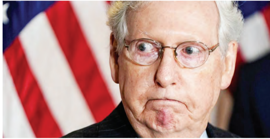
Senate Majority Leader Mitch McConnell

Trump's signing of the package staved off a U.S. government shutdown but he also pushed for the stimulus checks to be raised to $2,000,