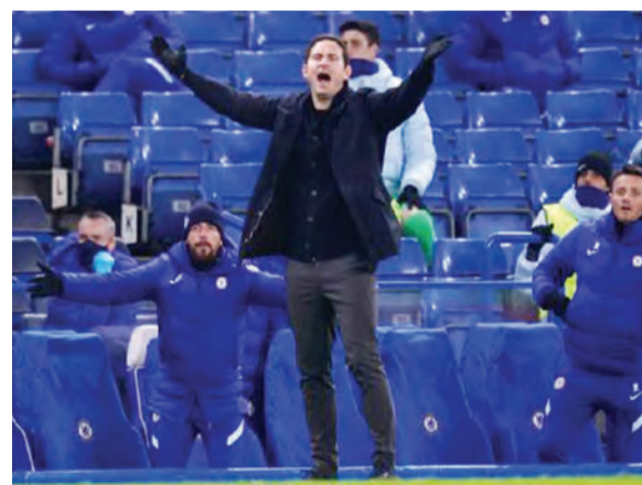
Lampard has yet to figure out the right formula for his expensive Chelsea side. Time's running out given the hectic fixture list and pressure to get results.

Take the always reliable Olivier Giroud, who delivered again for Chelsea in a moment of need. His clever header gave Chelsea the first-half