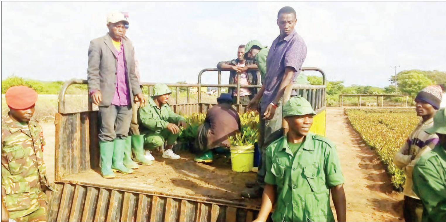
JKT officials collect cashew nuts seedlings for distribution to farmers in Manyoni and Singida districts yesterday.