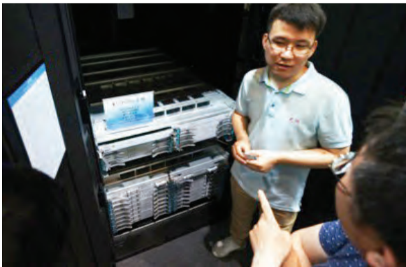
The motherboard of the Tianhe-3 supercomputer prototype is exhibited at the 2nd World Intelligence Congress.