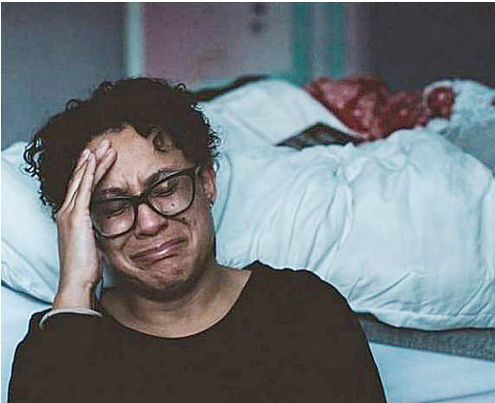
Miscarriage is the most common reason for losing a baby during pregnancy. It happens for up to 15% of women who knew they were pregnant. File photo

tried to induce labour using oxytocin but was unsuccessful. Her dead baby was eventually pulled out by hand in an assisted delivery.