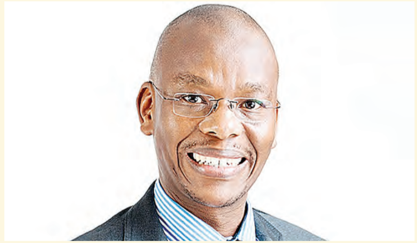
SA Competition commissioner, Tembinkosi Bonakele.

The Commission was also concerned that as a direct result of the proposed merger, Google will restrict access to health data collected by Fitbit. The Commission was concerned that, as a direct result of the proposed merger, Google will be able to use Fitbit's health data to enter the digital health market or other health services markets (for example the market for health insurance) and exclude other players and potential entrants in the market by restricting access to health Fitbit health data.