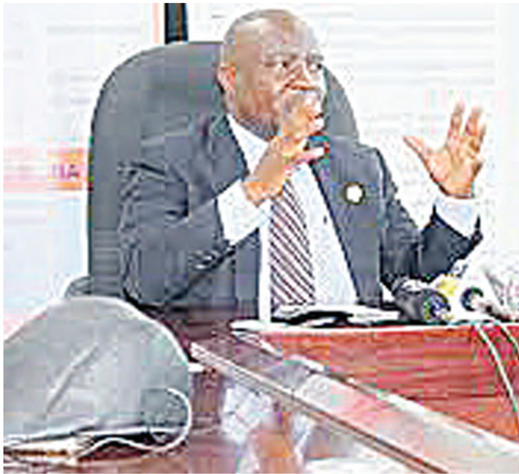
RSOP embraces comprehensive programming and organisational development towards supporting the government's efforts to enhance inclusive and competitive economic development... (File photo).

Its five-years plan is aligned with key national development frameworks, particularly, the Tanzania Development Vision 2025, the Ruling Party Manifesto of 2015 -2020 and the Second National Five-Year Development Plan (2016/17 - 2020/21) which