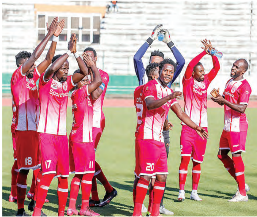
Simba SC.

He said Simba are looking forward to winning today's game so as to boost morale and confidence in the team ahead of a must win game