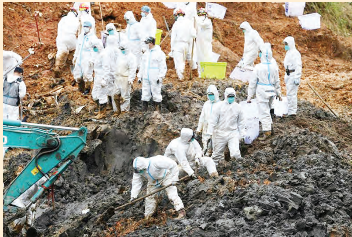
Rescuers conduct search and rescue work at a plane crash site in Tengxian county, South China's Guangxi Zhuang autonomous region, on Friday.