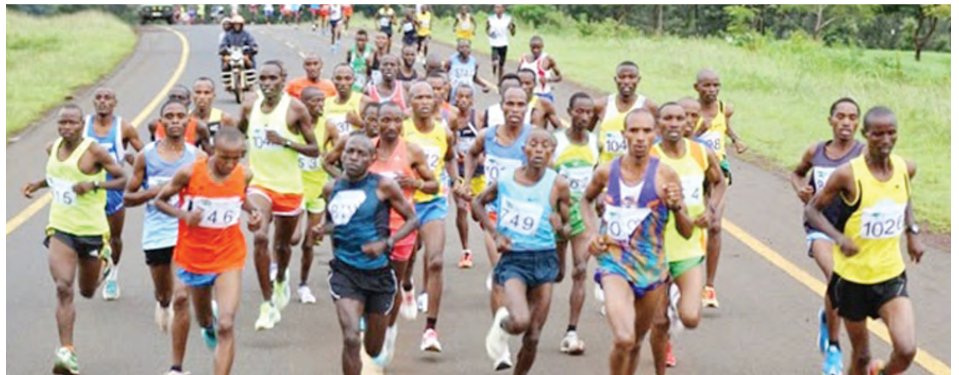
A section of runners battles it out in a past Ngorongoro Half Marathon, which took place in Arusha.

According to FIFA the number of requests for tickets of the 2022 World Cup Qatar showed superiority over the previous tournament of 2018, and 17 million requests for tickets were received during the first phase which lasted for only 20 days, while the total requests in the same stage in the last World Cup 2018, about 3.4 million.