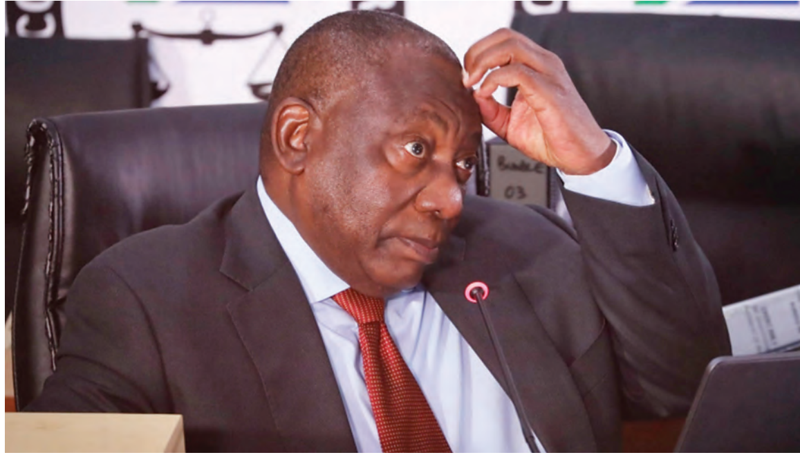
President Cyril Ramaphosa

"The outstanding question is who will lead with him in the party's top structures. That is where we need ethi-