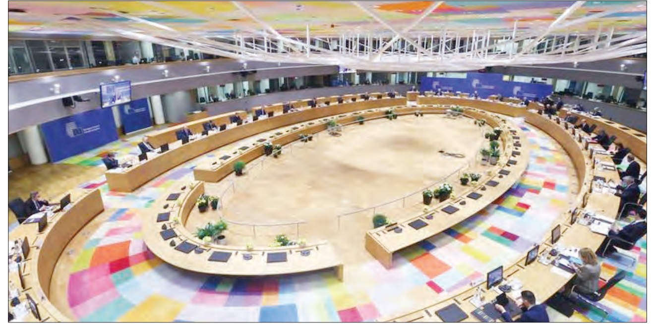
Leaders attend the European Council meeting in Brussels, Belgium, on Friday

"The European Union has so far adopted significant sanctions that are having a massive impact on Russia and Belarus, and remains ready to close loopholes and target actual and possible circumvention as well as to