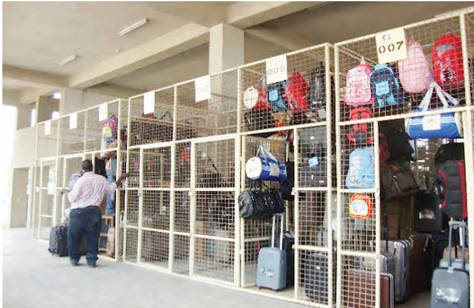
Can this building really offer a pleasant shopping experience? Originally designated to accommodate thousands of traders, the Machinga complex in Ilala, Dar es Salaam has been rejected by traders and customers alike.

The Kinondoni Municipal Council Director was quoted as saying that he was "unaware of the problems, and because of his