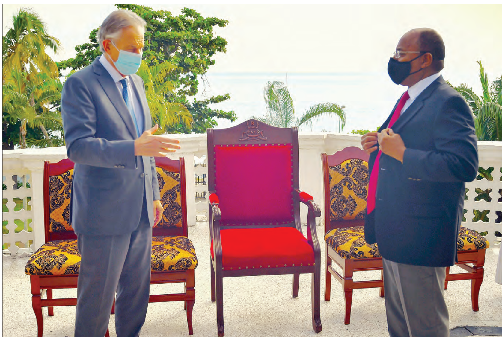
Zanzibar President Dr Hussein Ali Mwinyi has a quick word with former British Prime Minister Tony Blair at Zanzibar State House yesterday.