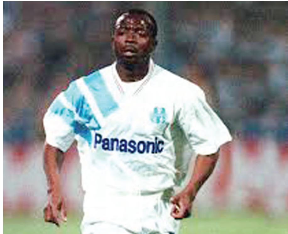
Abedi Ayew, known professionally as Abedi Pele.