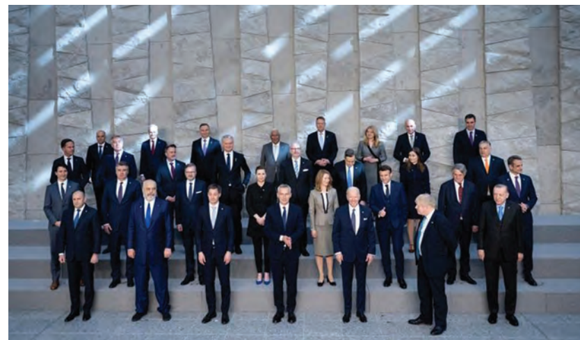
British Prime Minister Boris Johnson (second right) looks at US President Joe Biden (third right) while posing for a family photograph with NATO Secretary General Jens Stoltenberg (center), Turkey's President Recep Tayyip Erdogan (right) and other leaders as they pose for a family photograph ahead of an extraordinary summit at NATO Headquarters in Brussels on March 24, 2022.

In contrast with the Western European states, some countries adjacent to Russia such as Latvia and Estonia are calling for stricter sanctions against Russia as they claimed that energy sanc-