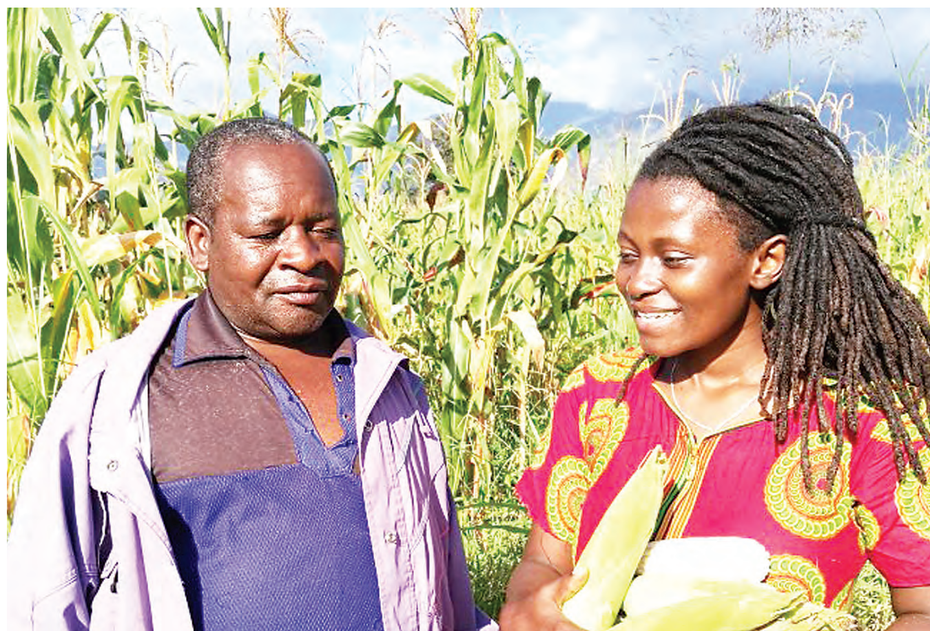
Farmers chat near their farm after harvesting maize. Food security stakeholders say community seed banks are key for protection of traditional seed varieties.

They argue that the initiative, if undertaken, will help regain, maintain and increase the control of community over seeds, strengthen and establish dynamic forms of cooperation among farmers and between farmers involved in the conservation and sustainable use of agricultural biodiversity.