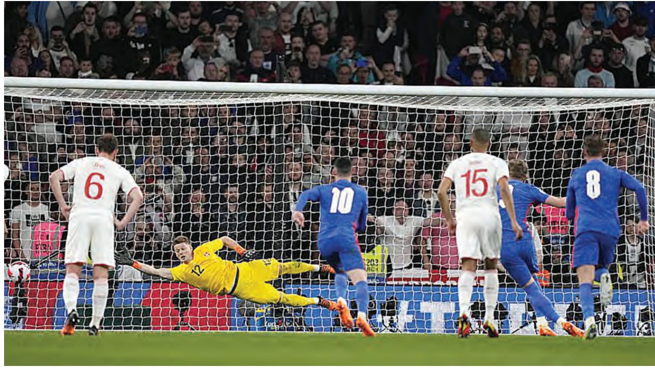
England's Harry Kane, second right, scores a goal from the penalty spot during an international soccer match between England and Switzerland at Wembley Stadium in London, Saturday, March 26, 2022.

Yet it was only when Southgate made four changes just after the hour mark -- introducing Jack Grealish, Raheem Sterling, Declan Rice and Tyrick Mitchell, another debutant -- that England discovered anything like the attacking fluidity expected of them.