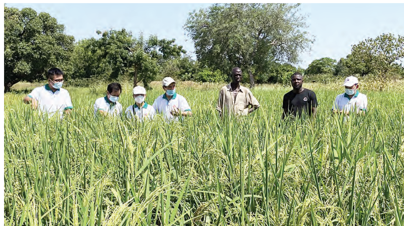
Chinese experts work in a paddy field in the demonstration area of Nariou village in Burkina Faso. File photo

All these factors have coalesced and translated into "poverty eradication with Chinese characteristics," said the expert, adding that "it is not inconceivable for South Africa to replicate the Chinese model of ending poverty in all its forms."