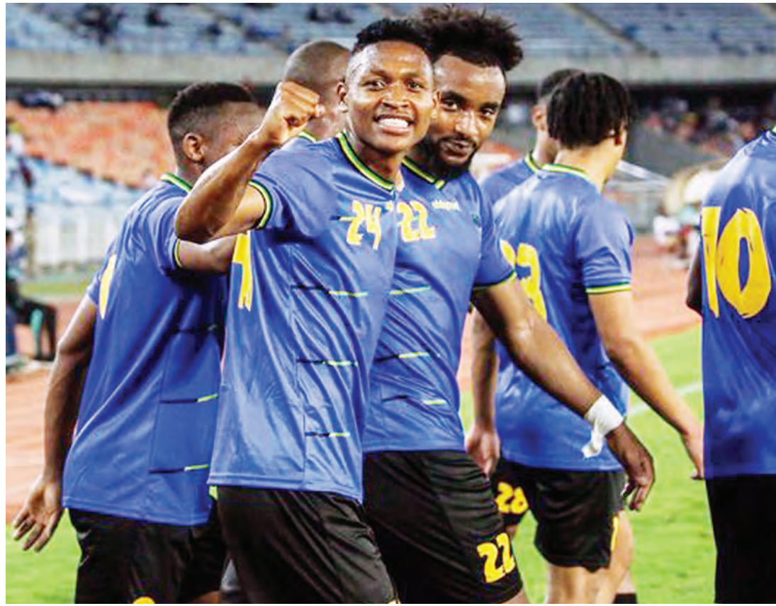
Tanzania's senior national soccer team 'Taifa Stars' players jubilate when one of the side's players netted a goal in an international friendly fixture against the Central African Republic held in Dar es Salaam last week.