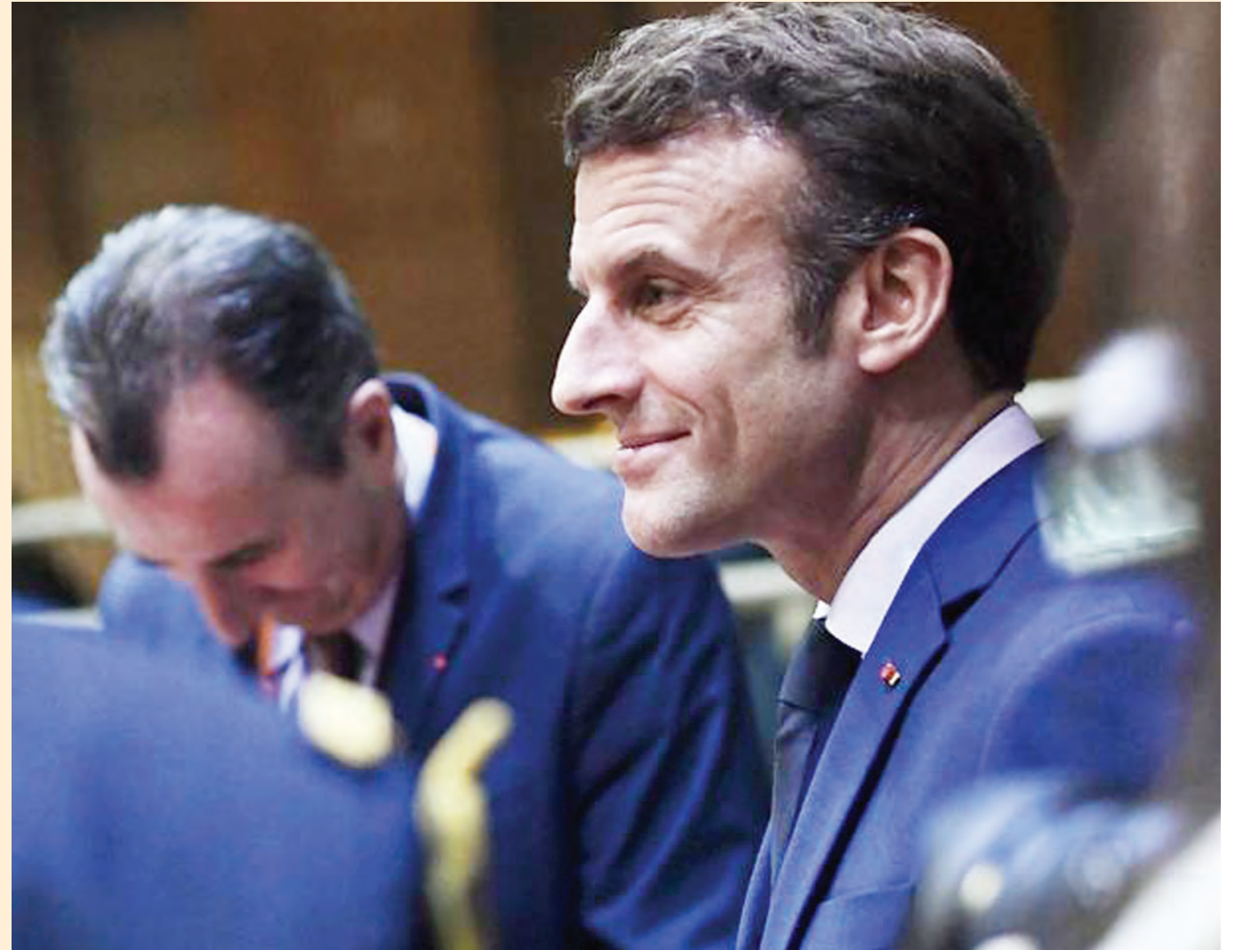
France's President Emmanuel Macron attends on the second day of a European Union summit at the EU Headquarters, in Brussels on Friday.

A campaign rally in the French Riviera city of Nice with current and former ministers but no Macron – he sent a three-minute pre-