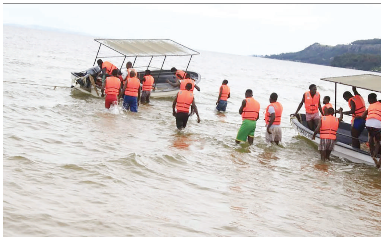
Fishermen from the Nyamkazi creek near Bukoba municipality and from Missenyi District pictured yesterday engaged in practical exercises meant to boost their capacity in various activities, including rescue services in the event of marine mishaps. The training was conducted under the oversight of the Prime Minister's Office (Disaster Unit) in implementation of Prime Minister Kassim Majaliwa's directive on the need to enhance fishermen's skills and overall competence.

Other strategies envisaged during his tenure of office include building a referral hospital, a garments factory and zonal cattle ranches, he added.