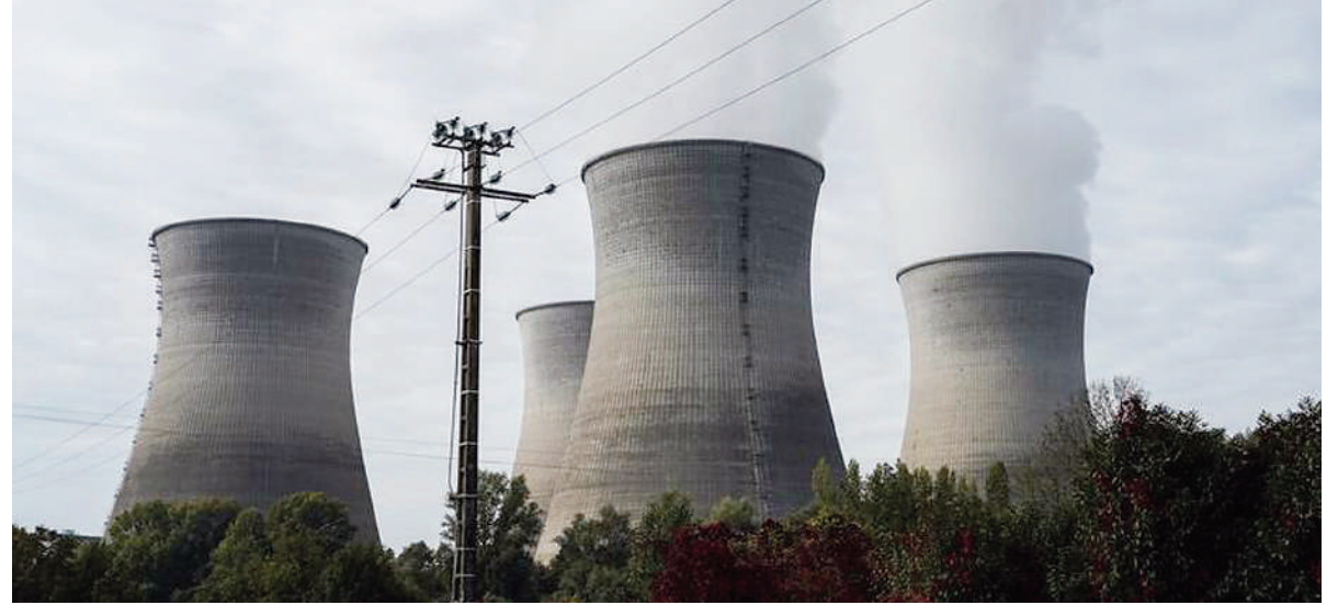
This photo shows the Bugey nuclear plant in Saint-Vulbas, around Lyon, central France on Oct 13, 2022.

It wants to hire 1,000 welders by 2030, double the number it employs today.