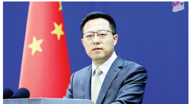
Zhao Lijian, spokesperson for China's Ministry of Foreign Affairs, attends a regular press conference in Beijing, China on Nov 9, 2022. File photo

The Canadian side needs to honor its words, show sincerity and goodwill, seek common ground while reserving differences, adopt reasonable and practical policies towards China, and deliver its commitments with concrete efforts," Zhao said.