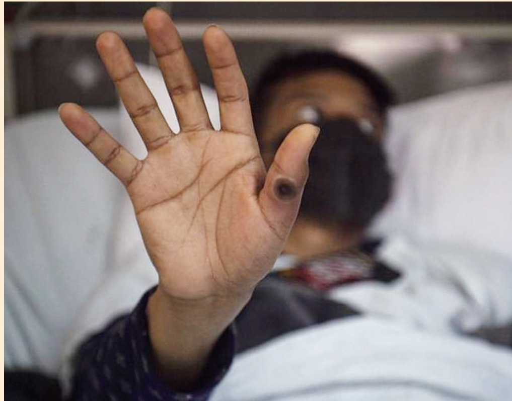
A patient shows his hand with a sore caused by an infection of the monkeypox virus, in the isolation area for monkeypox patients at the Arzobispo Loayza hospital, in Lima on Aug 16, 2022. Nearly 28,000 cases have been confirmed worldwide in the last three months and the first deaths are starting to be recorded.

Most cases reported in the past four weeks were from the Americas (92.3 percent) and Europe (5.8 percent). The number of weekly reported new cases globally decreased by 46.1 percent in the week of Nov. 21-27.