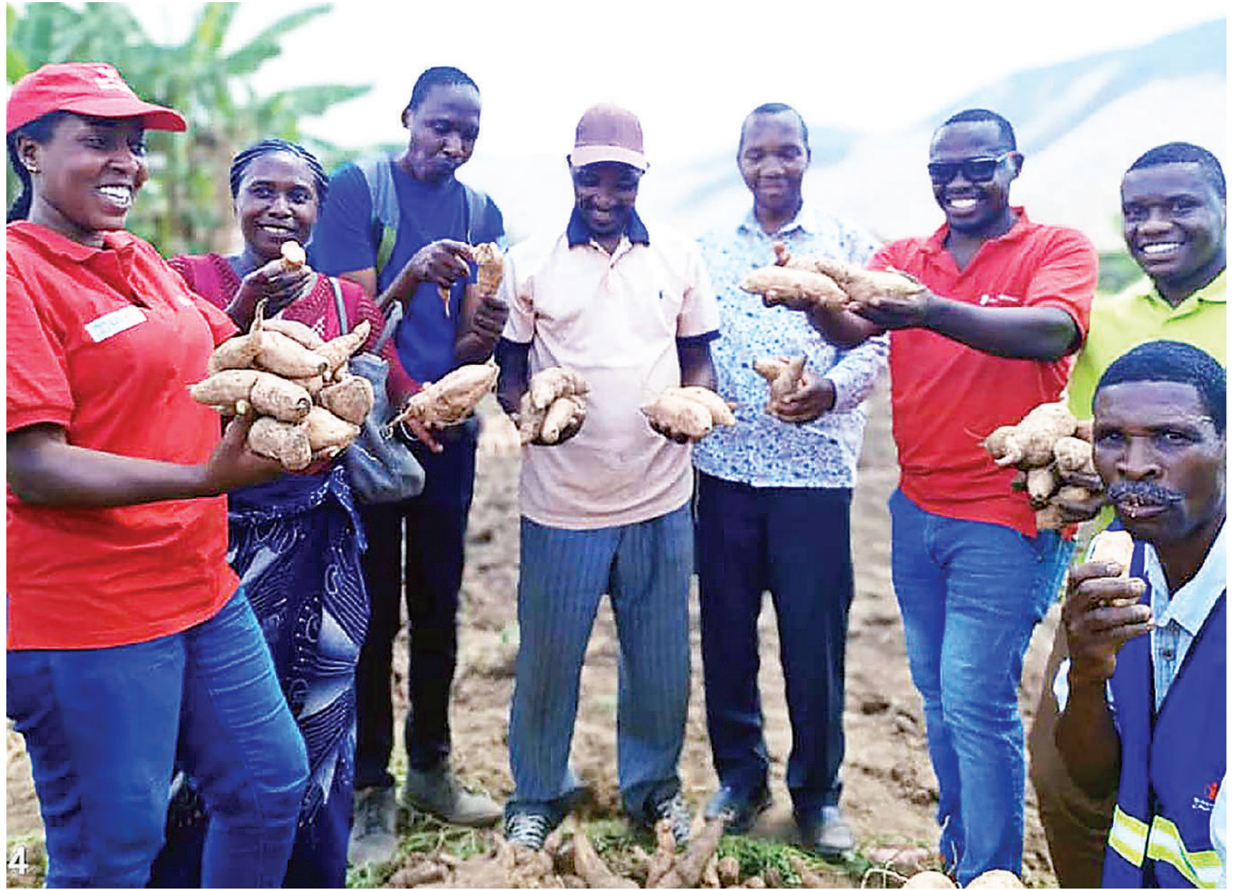
USAID/Lishe Endelevu team, farmer, agricultural officer and project beneficiaries holding harvested OFSP at Nyanza Village in Kilolo District.

al program manager, said that until now the nutrition project in Iringa has shown great results and response from the regional government to villages.