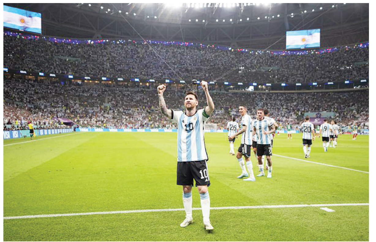
Argentina's Lionel Messi celebrates after scoring his side's opening goal during the World Cup group C soccer match between Argentina and Mexico, at the Lusail Stadium in Lusail, Qatar, Saturday, Nov. 26, 2022.

Concerns about Messi's health have dogged the seven-time world player of the year at the World Cup, starting from when he trained alone for two days before Argentina's opening game. He played the full 90 minutes against Saudi Ara-