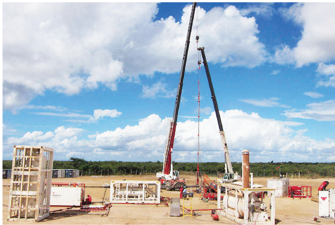
Ntorya gas condensed field, Ruvuma basin. File Photo

Under the agreement, the government signed on to back the development of more gas resources as