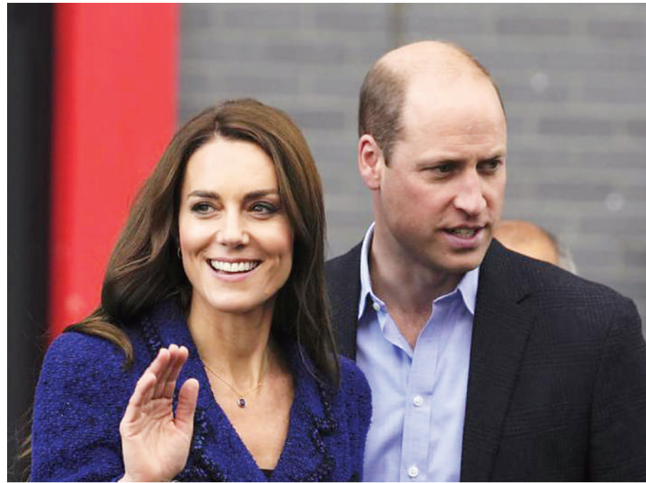
Britain's Catherine, Princess of Wales, and Prince William, Prince of Wales, leave the Copper Box Arena in the Queen Elizabeth Olympic Park after taking part in an event with Coach Core, in London, Oct 13, 2022.

This visit will be lower key: they will visit local environmental, educational and community projects in Boston, although the Earthshot ceremony itself will be a star-studded event with the likes of Grammy-winning singer Billie Eilish and Oscar-winning actor Rami