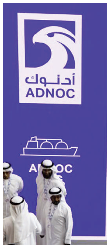
The moves are part of a push by the company and the UAE to raise output of hydrocarbons

Abu Dhabi's stock market, along with those in Dubai and Riyadh, has been a rare bright spot for IPOs this year. While most major markets, including Europe and the US, have seen deals slump, Persian Gulf economies benefited from oil's surge above $100 a barrel earlier this year.