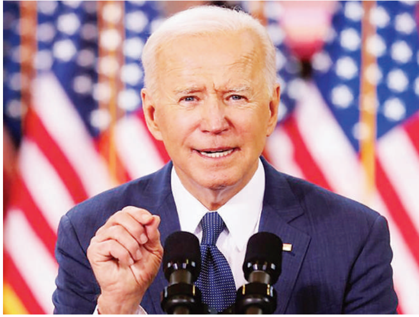
US President Joe Biden

lican on the Commerce Committee, praised Biden's call to Congress to act and said no one side was fully happy with the compromise contract deal "but the responsible thing to do is avoid the strike."