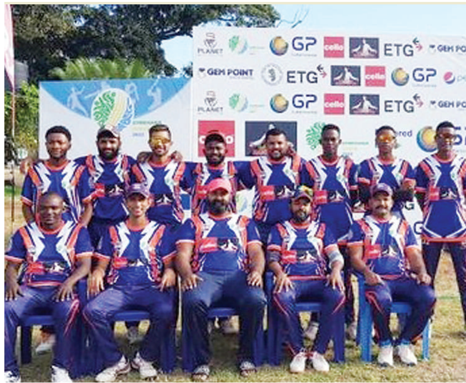
Caravans Cricket Club.