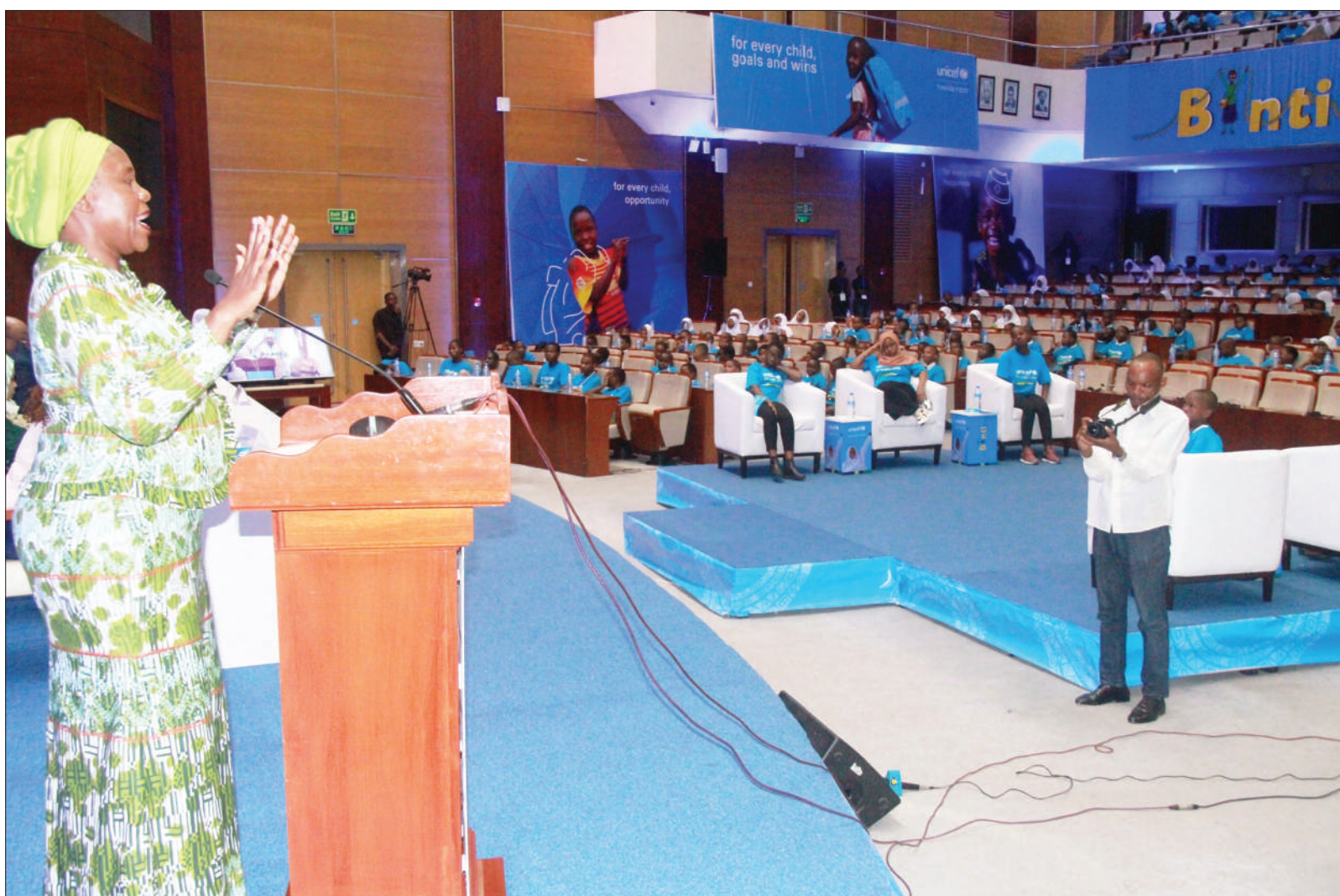
Dr Dorothy Gwajima, Minister for Community Development, Gender, Women and Special Groups, pictured in Dar es Salaam yesterday speaking at a World Children's Day event organised by UNICEF. The Day is celebrated internationally each November 20.

The scheme facilitates growth of free and fair trade with developing countries including Tanzania, boosting the economy and supporting jobs in those countries, as well as in ours