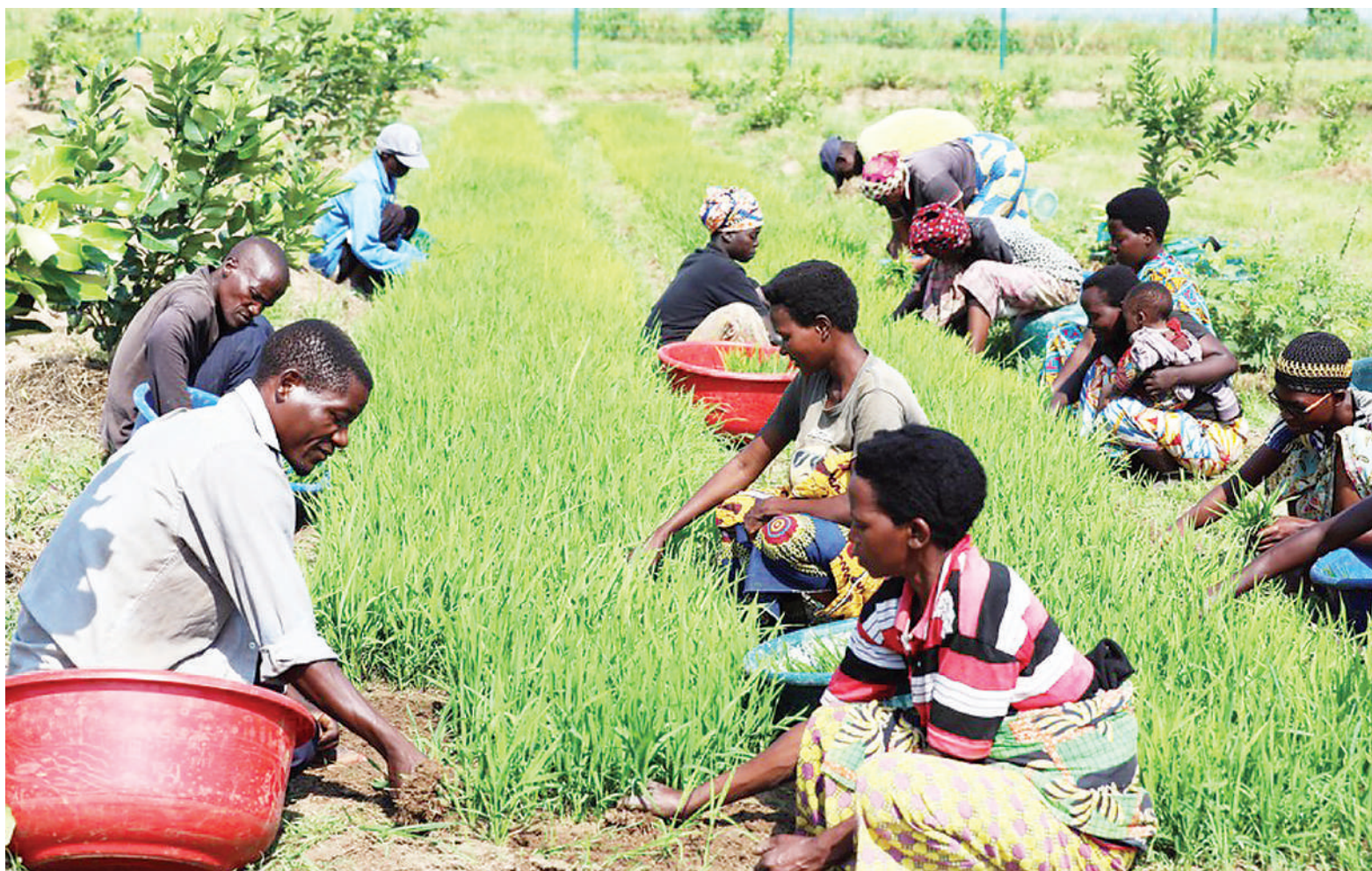
Farmers raise hybrid rice seedlings in Kihanga, Bubanza Province, Burundi, Oct. 29, 2022.

To address such a challenge, China has been implementing technical cooperation programs in Burundi since August 2009, sending a total of 45 ex-