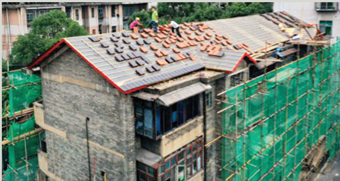
An old residential building in Shuangjiang township, Tongdao Dong autonomous county, Huaihua, central China's Hunan province is being renovated, Aug. 31, 2022.

Thanks to a pipeline renovation project launched in the community, waterlogging has never happened again.