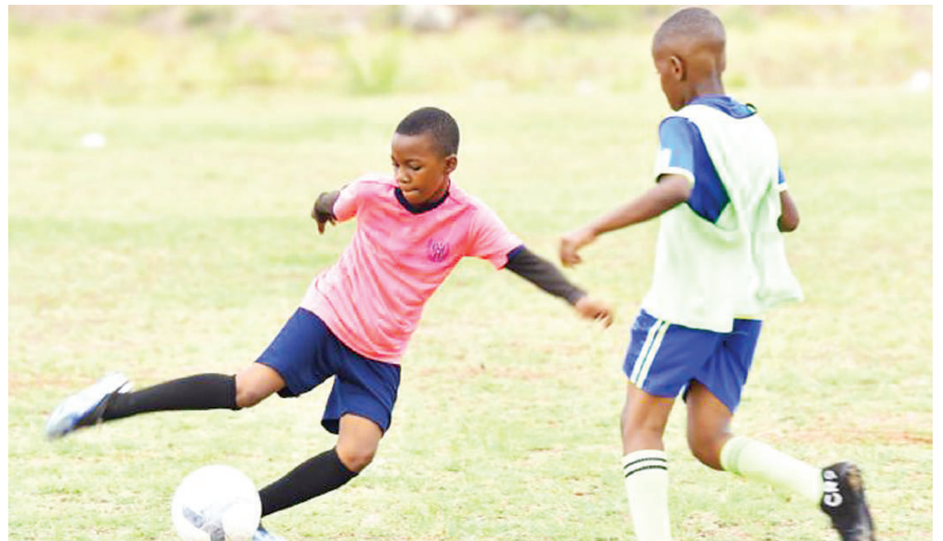
Some youngsters from Magnet Youth Sports Organization (MYSO) participate in a soccer duel that was part of events aiming to celebrate Thanksgiving Day organized by the center in Dar es Salaam last week.

"We are happy to be part of these Thanksgiving Day activities organized by the center... we are also happier that children from the institution have presented assorted items which include clothes to us, the items have come at a good time to us," she said.