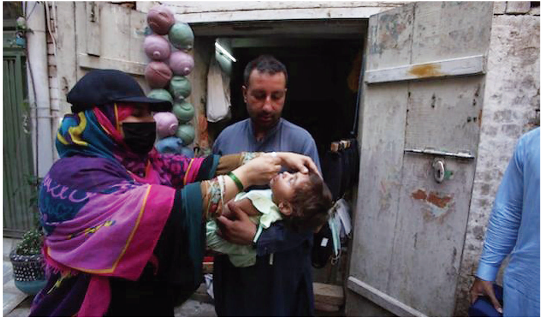
A young child receives vaccine drops in Pakistan, but the region has experienced an upsurge of cases because of vaccine refusal.

"In the last three months, three persons, including two policemen and one health worker,