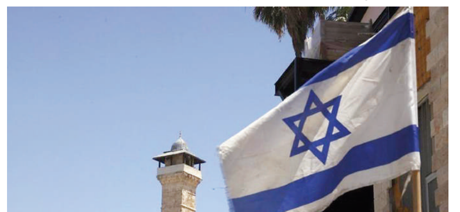
An Israeli flag flies in a street in front of the Ibrahimi Mosque or the Tomb of the patriarchs, in the West Bank town of Hebron, on May 26, 2022.