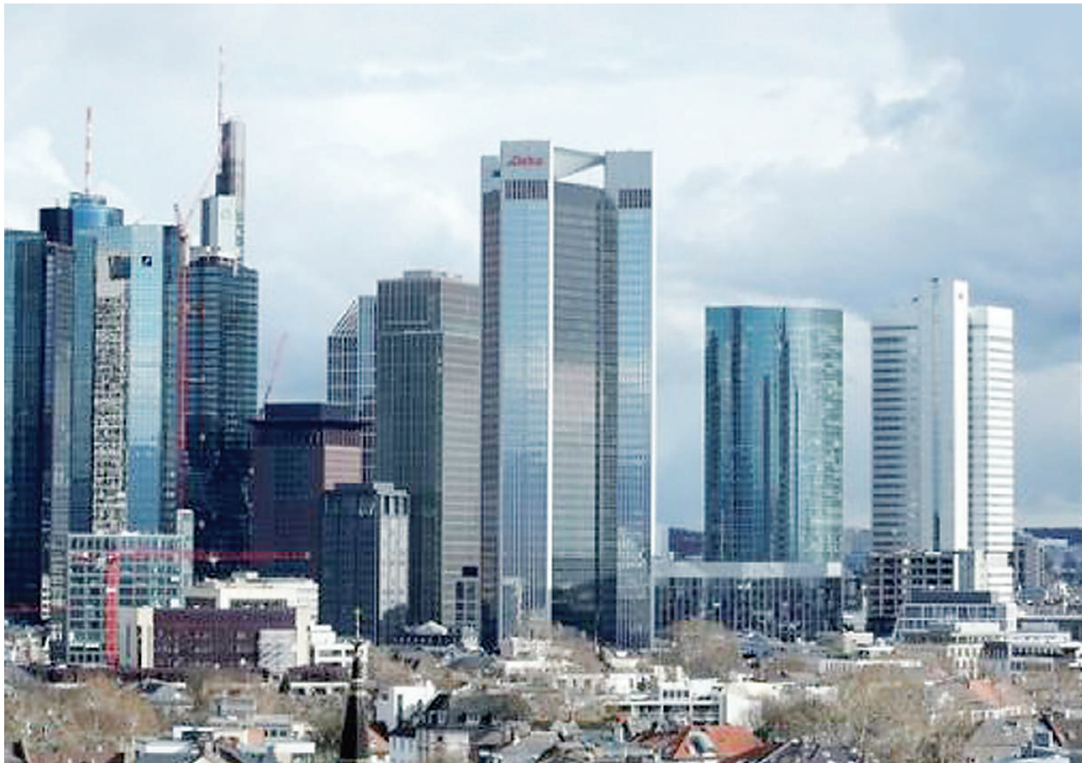
FILE PHOTO: The financial district with Germany's Deutsche Bank and Commerzbank is pictured in Frankfurt