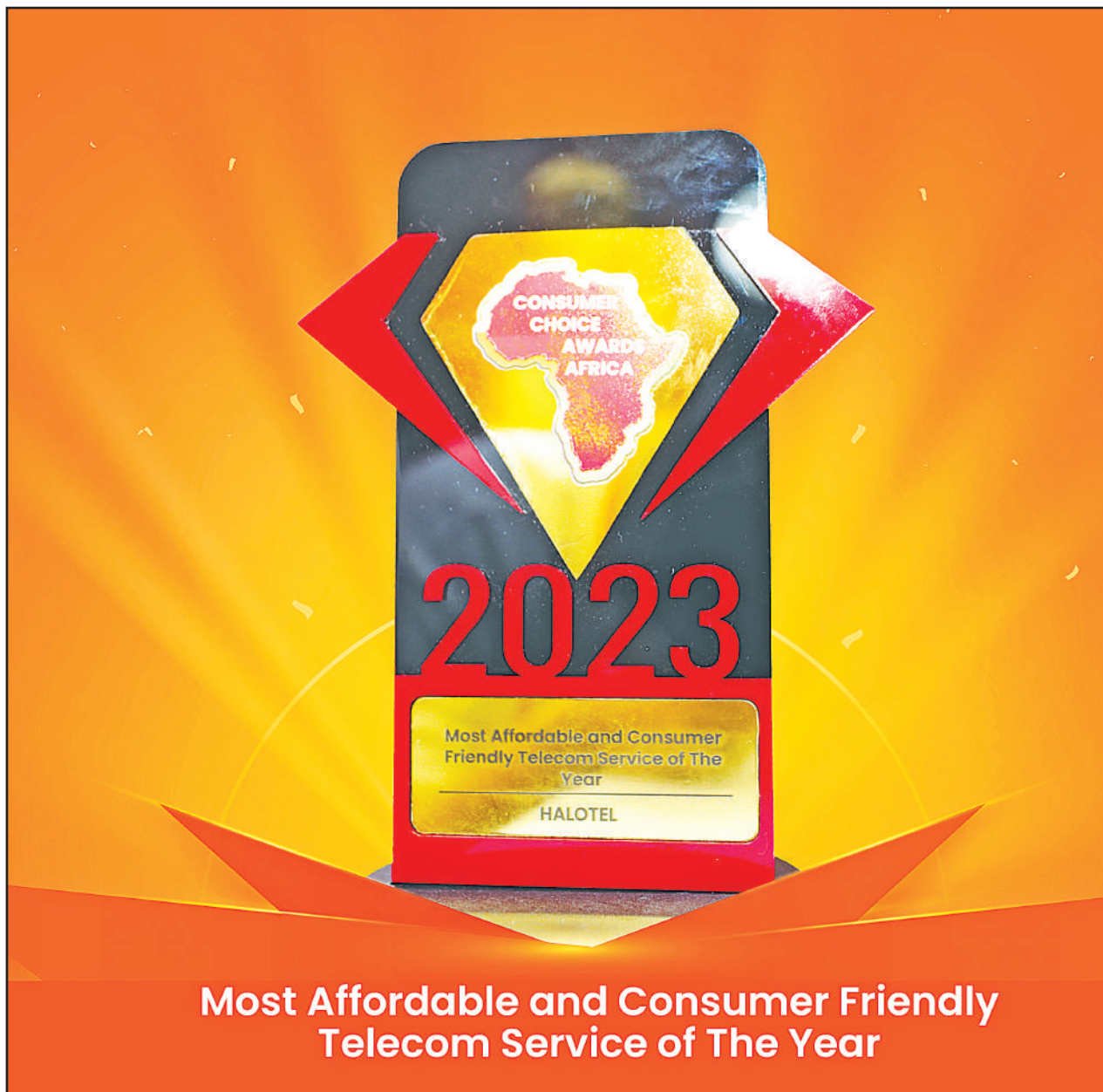
Most Affordable and Consumer Friendly Telecom Service of The Year

Halotel extends its heartfelt appreciation to the Consumer Choice Awards Africa for recognizing its contributions to the telecom industry. The company looks forward to continuing its journey of excellence and innovation, guided by the invaluable support of its customers.