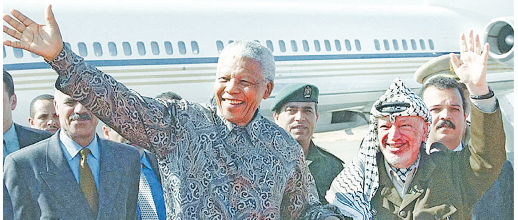
A few months after stepping down as president in 1999, Nelson Mandela visited Palestinian leader Yasser Arafat in Gaza