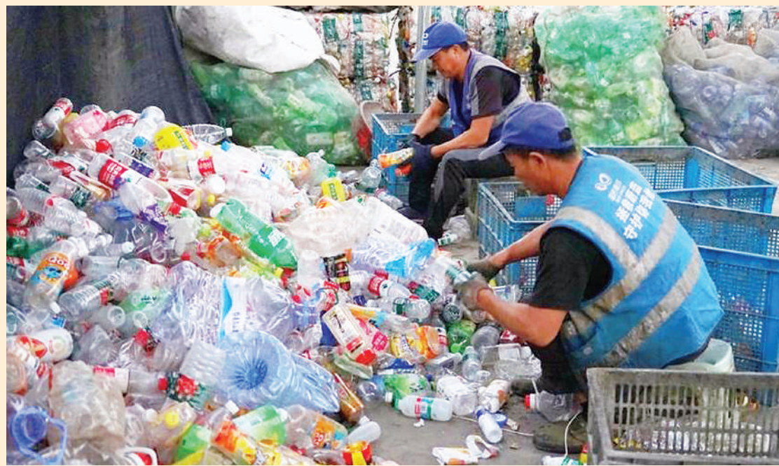
Zhang Jun, China's permanent representative to the United Nations Security Council at the UN headquarters in New York on Oct 16, 2023.

ments for product design and systems that can secure a safe and non-toxic circular economy, which prioritizes reuse and improvements in recycling.