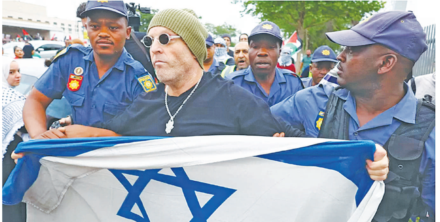
This pro-Israel demonstrator was removed by police at a protest in support of Palestinians

"I want to tell the president and I want to tell the ANC, you are not South Africa," he told an SA Zionist Federation rally for Israel.