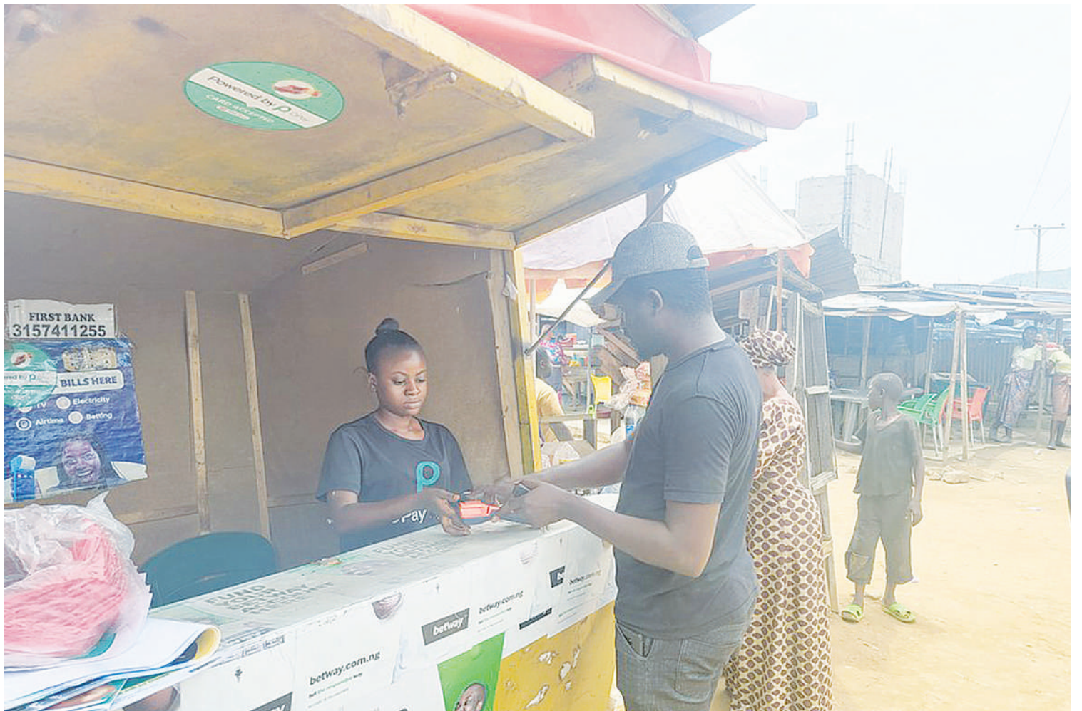
Photo taken on September 17 shows a man doing transaction at an offline agent of OPay Nigeria in a suburb of Abuja, Nigeria.

"With the youngest population in the world, the African continent is undergoing rapid urbanization and regional integration, which makes the digital economy in Africa promising. It is believed that with the help from China, Africa will accelerate the pace of digital transformation," said Costantinos Berhutesfa, a professor of public policy at Addis Ababa University