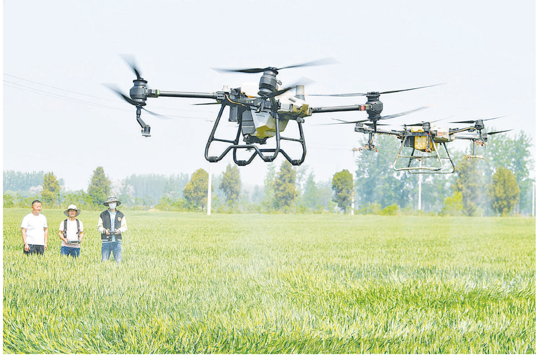
Farmers use farm-specific drones to help spray pesticide in Bozhou, Anhui province, on April 19, 2023.

Delivery drones have become increasingly widespread in recent years, helping increase the reach of e-commerce companies. Chinese e-commerce giant JD and courier and logistics company SF Holding have been exploring the application of drones to logistics,