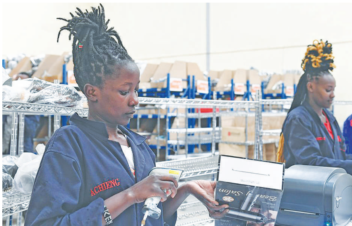
Staff members of Kilimall work at a warehouse in Mlolongo, Kenya, Nov. 10, 2023.