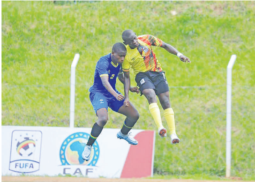
Tanzania and Uganda players vie for the ball during their CECAFA U15 Boys Championship semi-final match held at the FUFA Technical Centre in Njeru, Uganda yesterday. Uganda won 2-1.