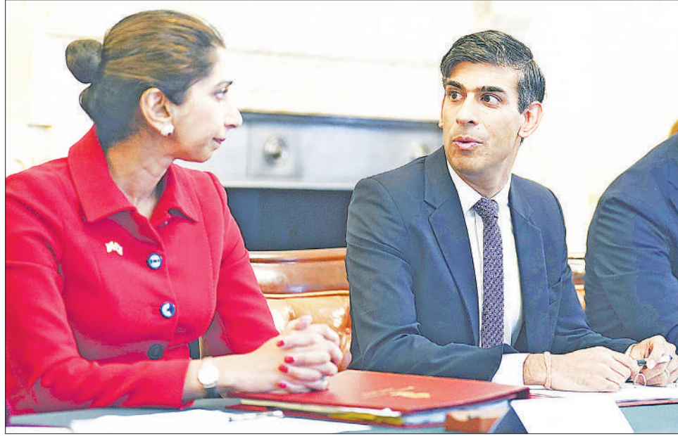
Britain's Home Secretary Suella Braverman listens to Britain's Prime Minister Rishi Sunak as he hosts a policing roundtable at 10 Downing Street, London, Oct 12, 2023. File photo

Under fire from opposition lawmakers and members of the governing Conservative Party to eject Braverman, Sunak seemed to have brought forward a long-planned reshuffle to bring in allies and remove ministers he felt were not performing.