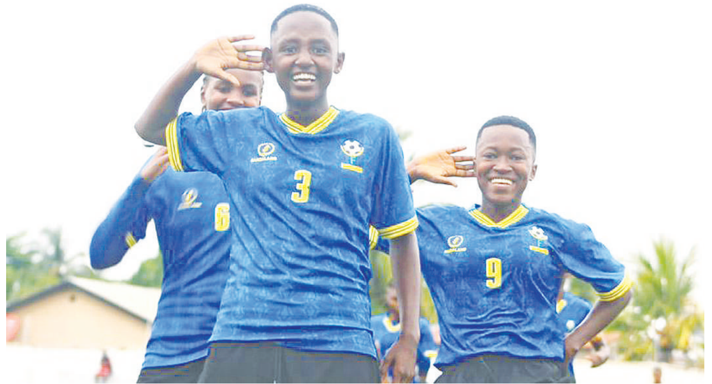
Tanzanite Queens' players celebrate their goal against Nigeria during their first leg of the third round of the 2024 FIFA Women's World Cup Qualifiers match held at Chamazi Stadium in Dar es Salaam on Sunday. The match ended in a one-all-draw.