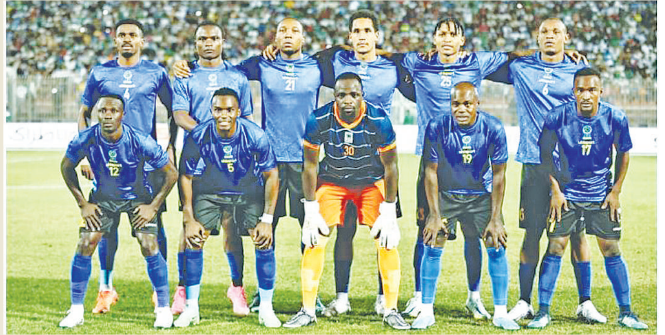
Taifa Stars squad.