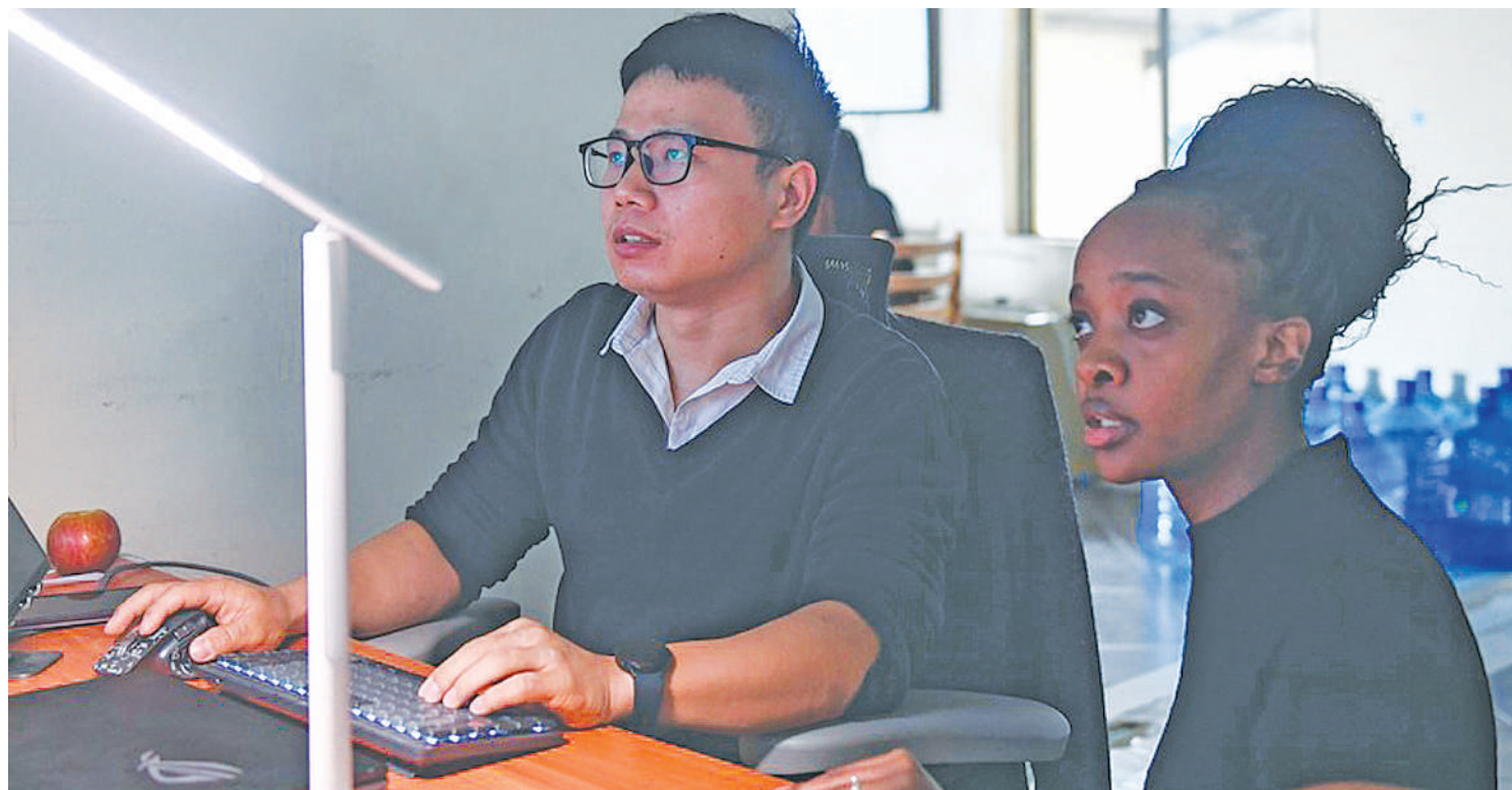
A Chinese staff member and a Kenyan staff member of Kilimall work at an office in Mlolongo, Kenya, Nov. 10, 2023.

Founded in 2014 and based in Nairobi, Kilimall is representative of Silk Road e-commerce and has become the top-ranked e-commerce app in the region. It has successfully built a digital bridge between China and Africa, creating close to 10,000 local jobs.