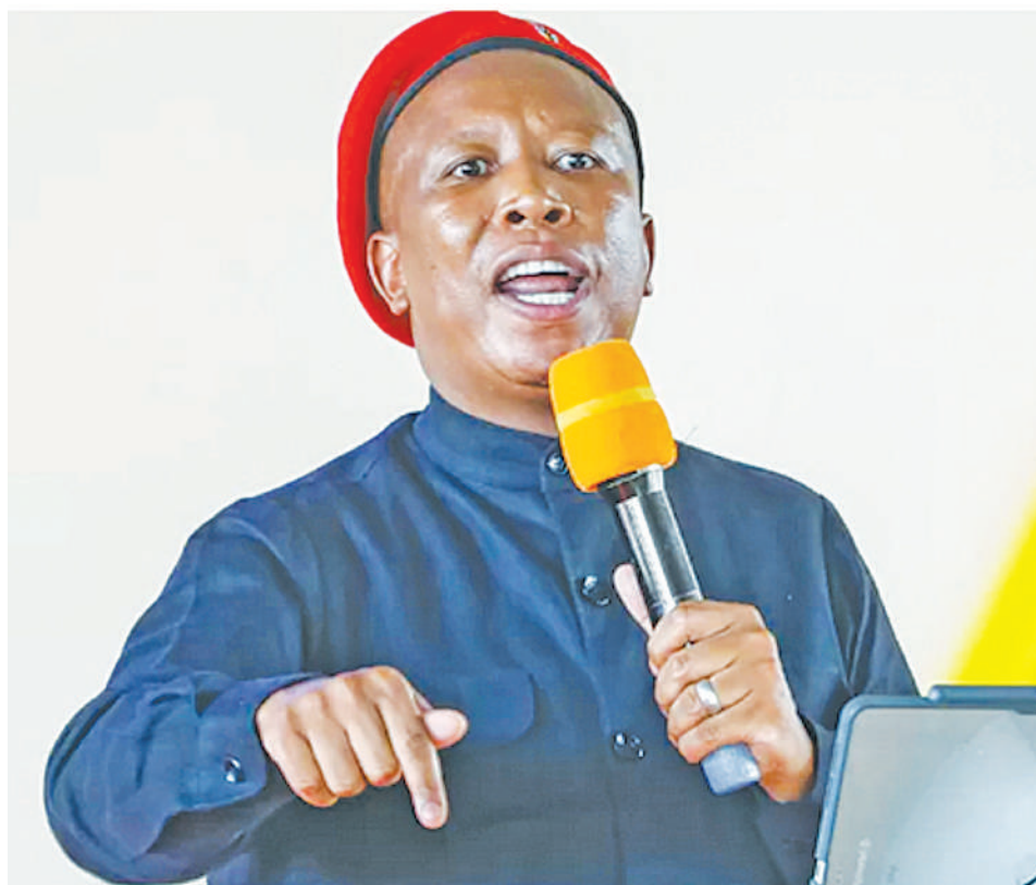
South African opposition leader Julius Malema

So, when Mr Malema landed in Kenya, he found an audience in waiting.