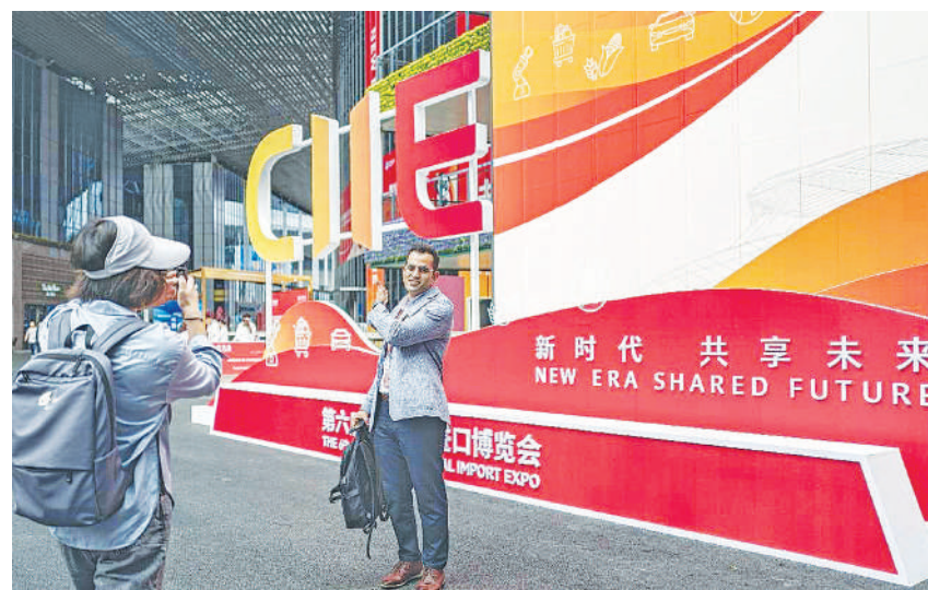
A foreign journalist covers the sixth China International Import Expo outside the National Exhibition and Convention Center (Shanghai), Nov. 4, 2023.

The pharmaceutical company also inked an agreement on the phase-two project of an inhaler production supply base in Qingdao, east China's Shandong province. It announced to launch a rare disease cooperation project in the Jinan