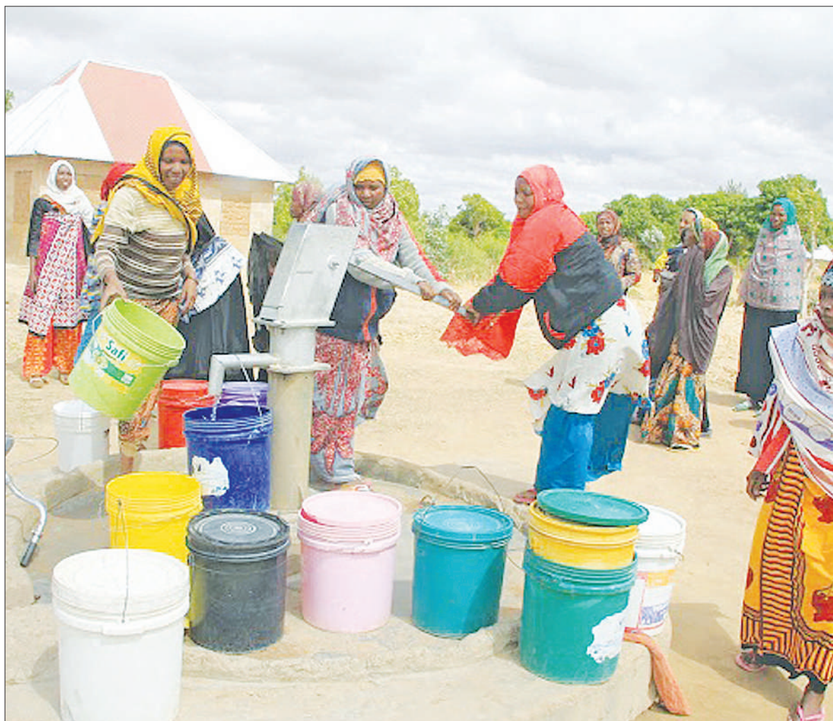
Residents of Singida municipality's Sanga suburb fetch water yesterday at one of 38 shallow wells rehabilitated by Empower Society Transform Lives under Mo Dewji Foundation sponsorship.

The increased cost resulted in the business incurring an additional 90 million rand charge, Shoprite added.