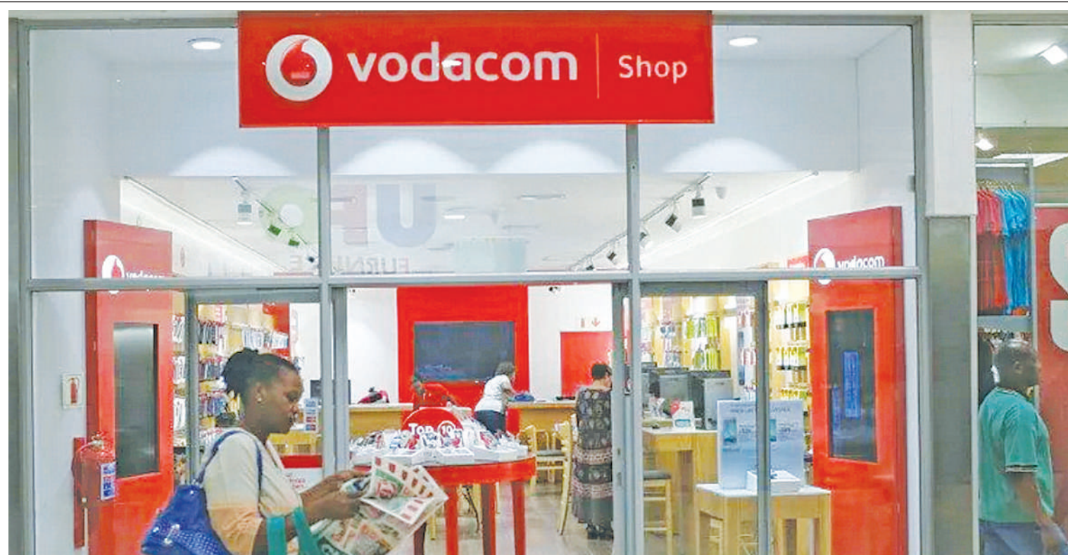
A shopper walks past a Vodacom shop in Johannesburg

He exuded optimism regarding the potential for digitized farming and ongoing partnerships with government institutions, fintech solution providers, and stakeholders across the agricultural value chain.