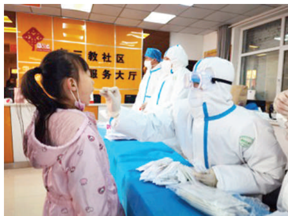
A girl receives COVID-19 nucleic acid test at a designated testing site in Shijiazhuang, north China's Hebei province, January, 6. (File photo)

The team of 30 departed for Gaocheng at 5:30 a.m. on Jan. 5. After arriving at Chenglizhuang village in the district, Wang put on protective gear and paired up with one of her colleagues, and then started to collect throat swab samples from door to door.