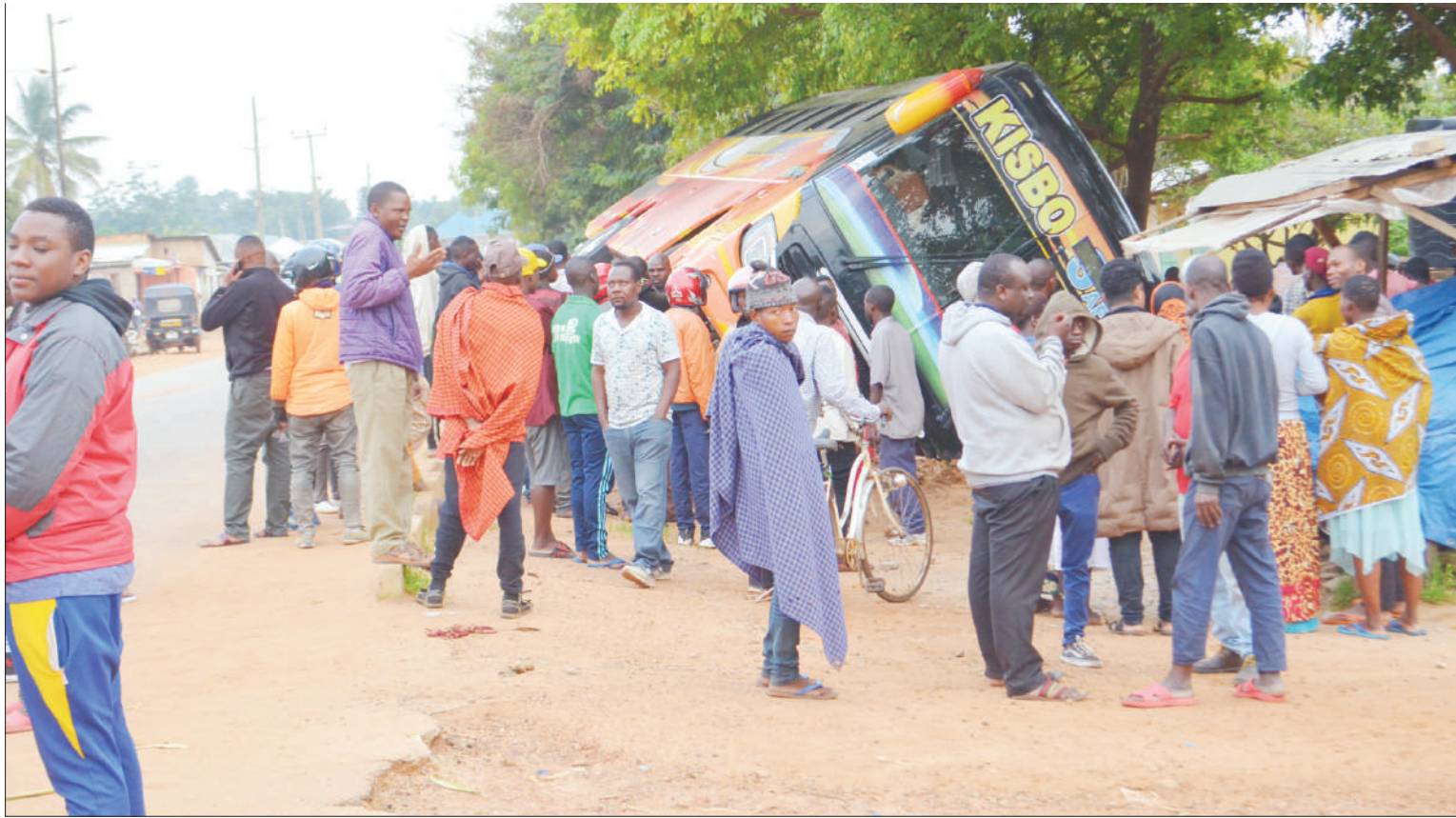
This Kisbo Safari bus, which was on its way from Kahama to Dar es Salaam yesterday, overturned near Isaka as the driver moved to spare the life of an old woman who was crossing the road.