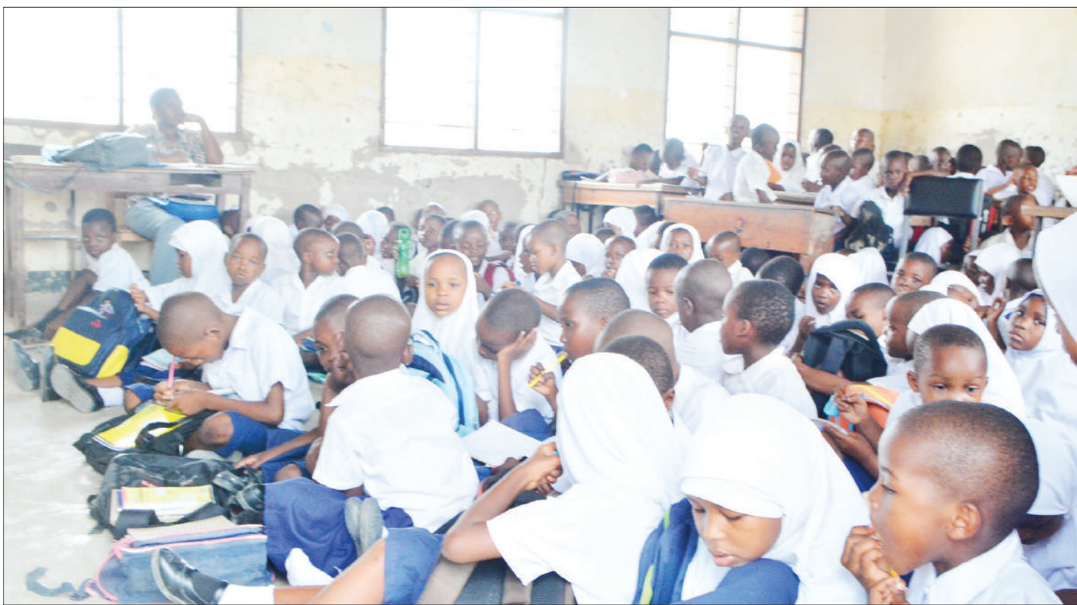
Pupils in class at Kingongo Primary School in Ubungo municipality, Dar es Salaam, yesterday while seated on the floor owing to a shortage of desks.

The event brought together stakeholders of the language, organized by BAKITA in collaboration with BAKIZA. Unlike in the past where it was commemorated differently on the Mainland and in the Isles, from this year day is marked jointly and next year it will be celebrated in Zanzibar.