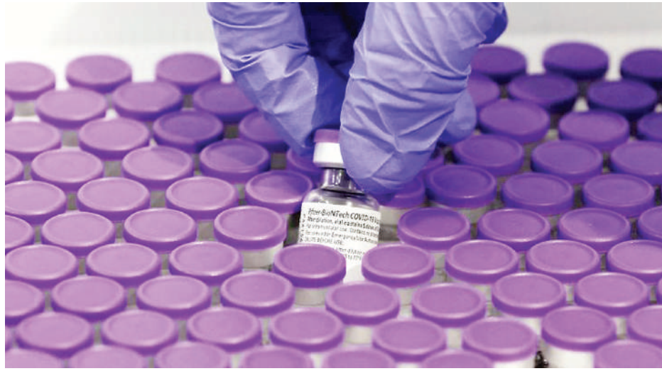
Healthcare worker prepares a dose of the Pfizer-BioNTech COVID-19 vaccine at a large vaccination centre open by the Tel Aviv-Yafo Municipality and Tel Aviv Sourasky Medical Center in the Israeli coastal city.

The EU official said the EU could give some vaccines to COVAX which would then distribute them to poor