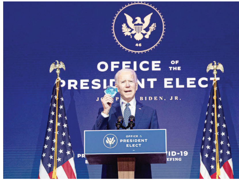
U.S. President-elect Joe Biden