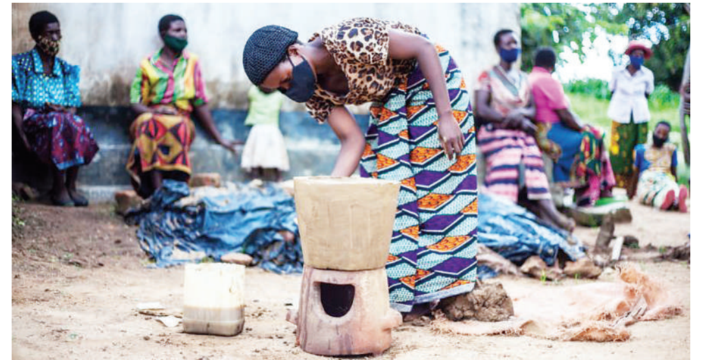
A woman molds an energy-efficient cookstove in Ntcheu, Malawi, on Jan. 15, 2021. As one way of conserving the environment in Malawi, people in communities are engaged in making fuel-efficient stoves made of clay that is used for domestic cooking and heating purposes. In return, people who produce stoves in communities are making good money out of sales.

The stove design is the product of over 15 years of research and development, mainly in Malawi, incorporating user feedback and local preferences. A mechanical mold known as the paddle mold is