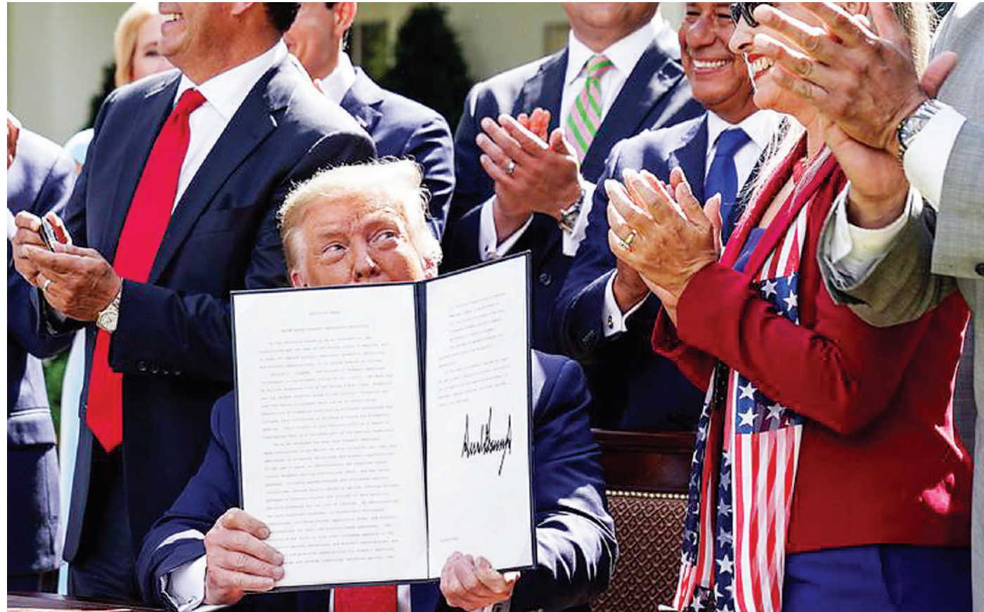
U.S. President Donald Trump shows signed executive orders for economic relief at his golf resort in Bedminster, New Jersey, U.S., August 8, 2020. File photo

Trump has upended some tenets of America's post-