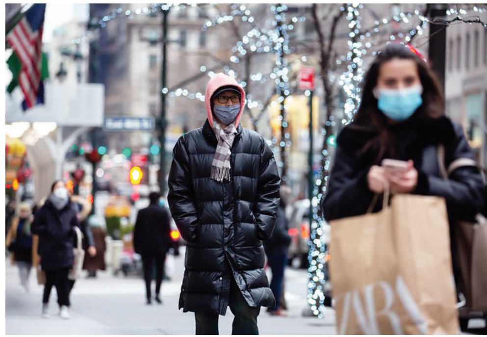
People wearing face masks walk along the Fifth Avenue in New York, the United States, Jan. 5, 2021.

Some middle class parents worry their kids will be teased at school for being too poor to afford such devices, so they cave and buy them. One simple solution, at least for adolescents, is to lift weights at the school gym - which is free - and de-