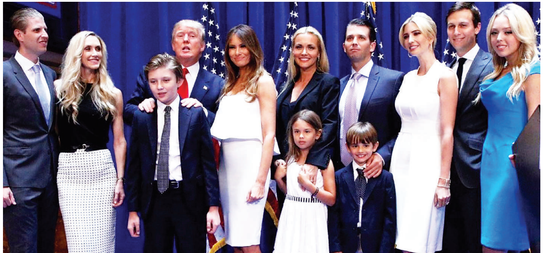
US President Donald Trump (fourth from left) and his extended family, who together could be worth more than US$4 billion.