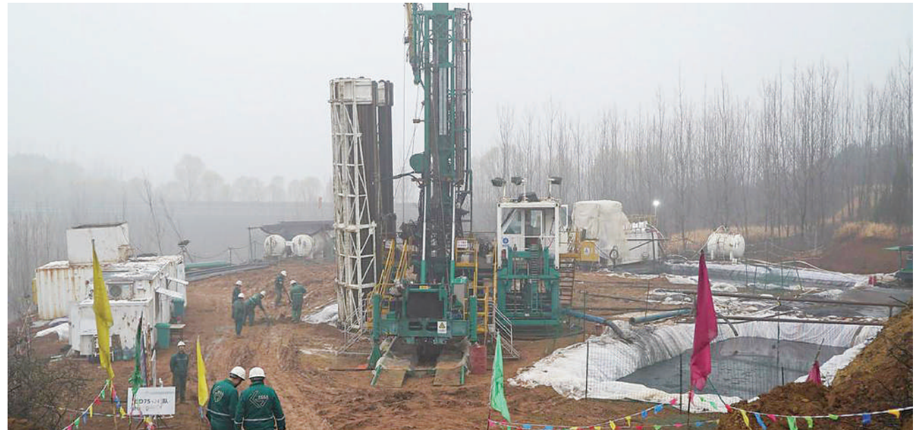
Greka workers seen at a coal-bed methane drilling site in Shanxi province, China.

Large-scale "leaks" of methane dropped in 2020 as a result of the pandemic, according to the