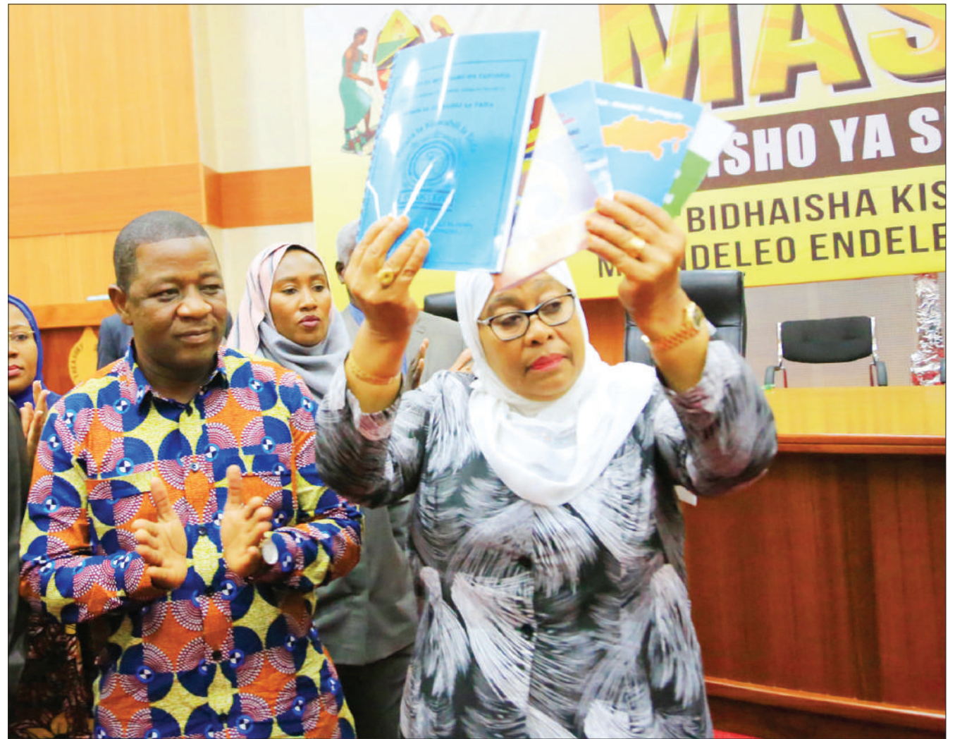
Vice President Samia Suluhu Hassan pictured in Dodoma city yesterday launching books endorsed for use in teaching Kiswahili internationally. The event was part of the commemoration of Kiswahili Day. Left is Information, Culture, Arts and Sports deputy minister Abdallah Ulega.