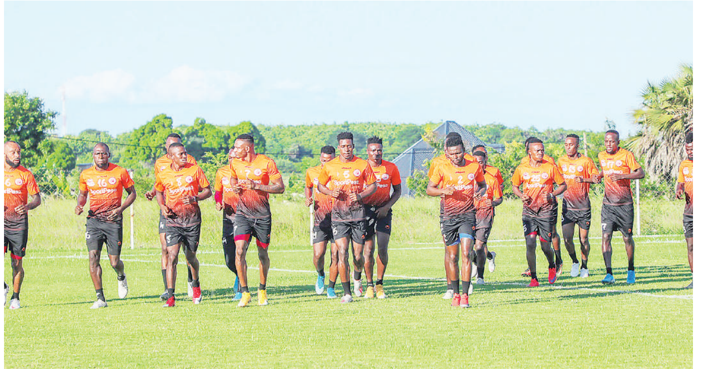
Simba SC players participate in training in Dar es Salaam recently to shape up for the Vodacom Premier League and CAF Champions League fixtures.