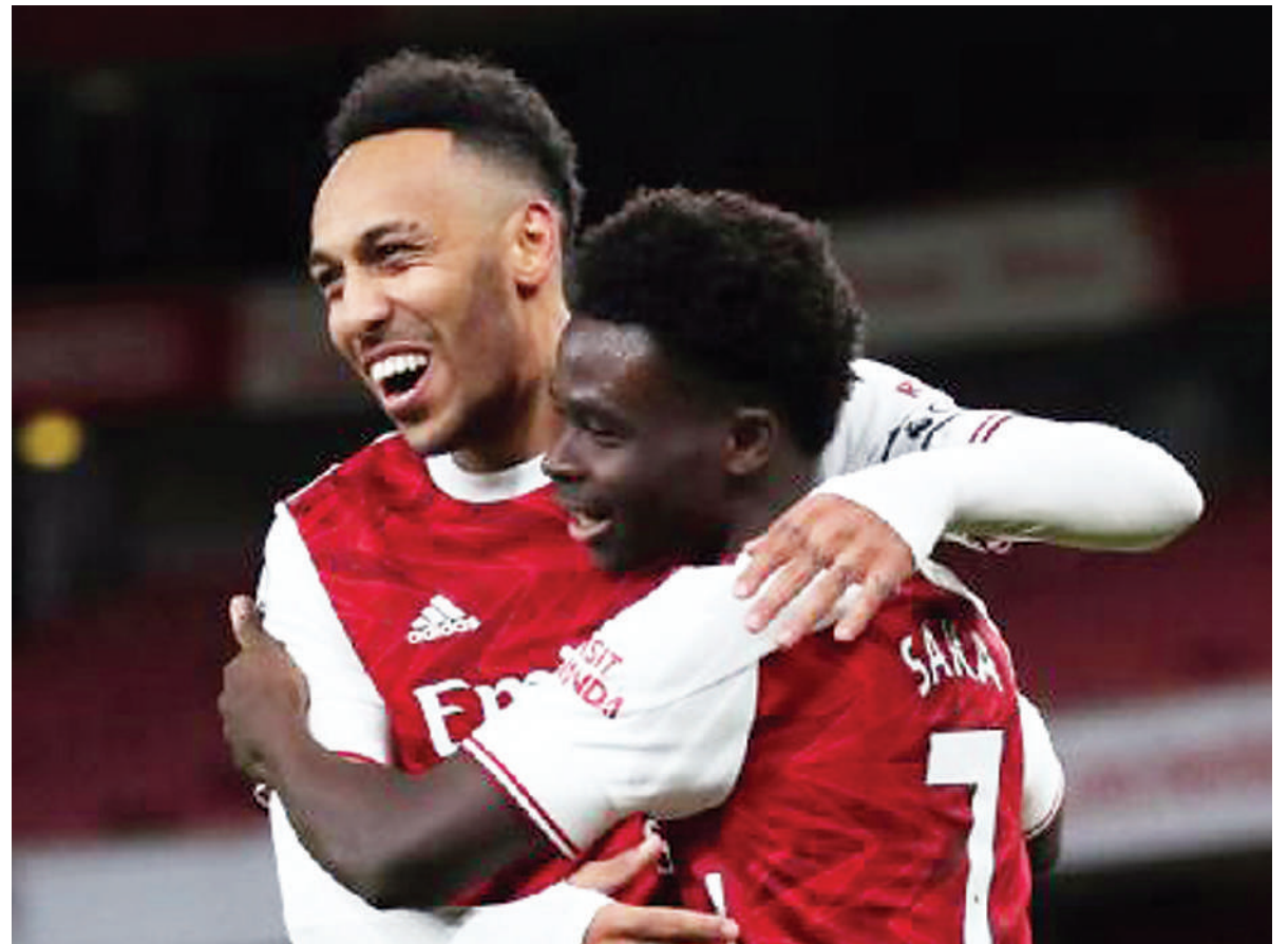
An in-form Pierre-Emerick Aubameyang remains one of the division's biggest dangers, a lesson Newcastle were harshly reminded of on Monday.

Thomas Partey, making his first start since Dec. 6 following a thigh injury, looked utterly unflustered throughout, misplacing just three of his 58 passes all evening. Sterner tests are to come for Arsenal's £45 million summer signing but there were encouraging signs given the midfielder's lack of action due to injury since arriving from Atletico Madrid.