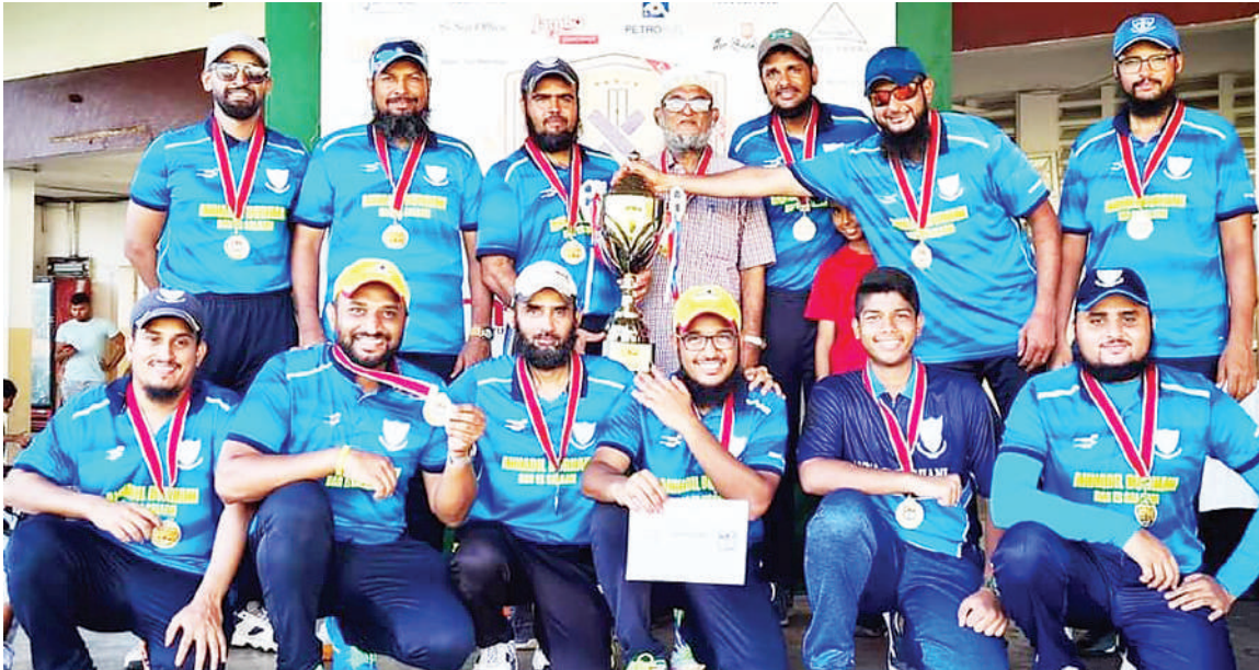
Annadil Burhani Cricket Club players in a group picture after clinching the 2020 Tanzania Cricket Association (TCA) Seifee Cup tournament's top honour with five-wicket victory over GP team in the final, which took place in Dar es Salaam recently.