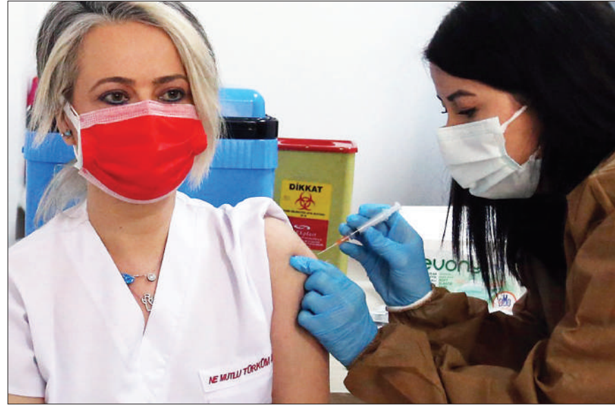
A medical worker receives a dose of China's Sinovac COVID-19 vaccine at the Sabiha Uzun Maternal Child Health Center in Ankara, Turkey on Jan. 15, 2021.

"As an ordinary person and the president of Serbia, I am convinced of the quality of the Chinese vaccine, which will be decided by our competent agency," Vucic