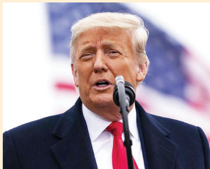
President Donald Trump

are also characterized by highly polarized views of his presidency. The Gallup poll released Monday shows that he gets positive ratings from 4 percent of Democrats, 30