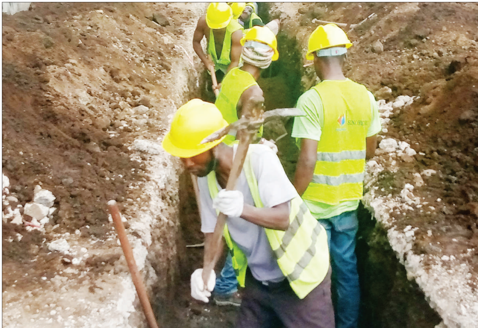
People engaged by China's Sinohydro Construction Company dig a sewage trench at a spot in the Esso section of Arusha city yesterday.

She said the project would work on sustaining natural vegetation in the areas.