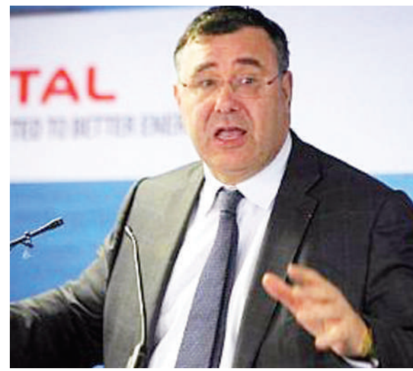
Total chairman and CEO Patrick Pouyanné.

the French oil company said at the time that "the revision of the security memorandum reflects the increase in activities during the construction phase and the mobilisation of a larger workforce.