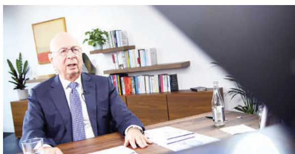
Klaus Schwab, founder and executive chairman of the World Economic Forum, during a virtual press conference to preview the Davos Agenda 2021.