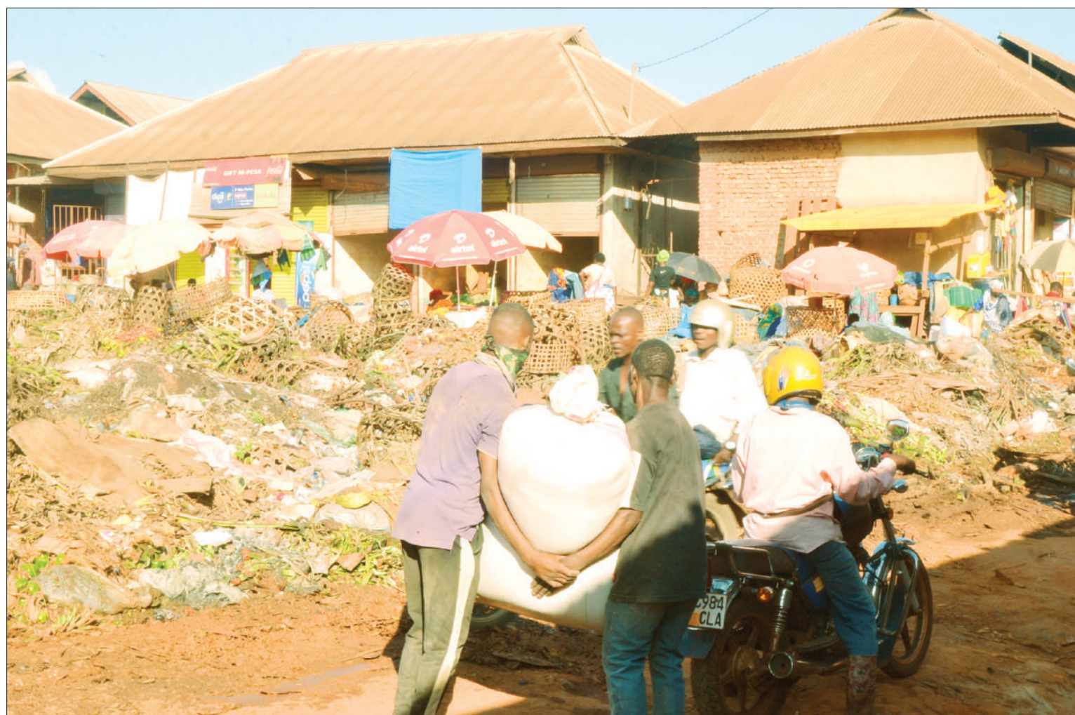
Garbage scattered all over Songea municipality's Manzese market at the weekend, with sources hinting that it had lain uncollected for several weeks now.

He said at that time the college offered only two fields, but now it has expanded and offers 12 fields from Diploma to Degree levels.