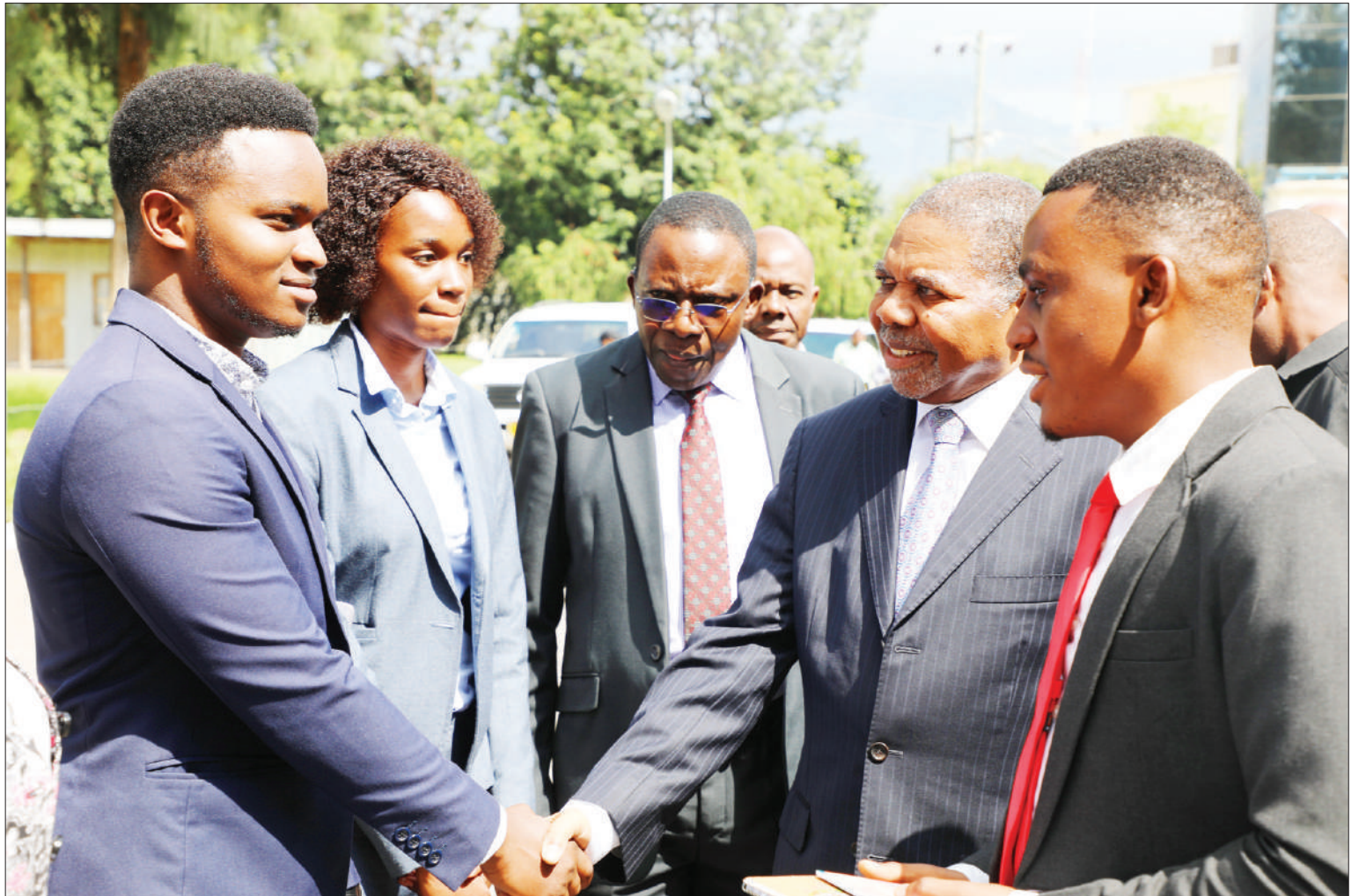
Mzumbe University chancellor Dr Ali Mohamed Shein (2nd-R) exchanges greetings with students' government leaders at the university's Mbeya Campus, where he was on Monday for a familiarisation and inspection tour.

I welcome Tembo Nickel Co. and I can assure you that our team represents significant capability and rich experience as we have been doing these activities for over 40 years ago