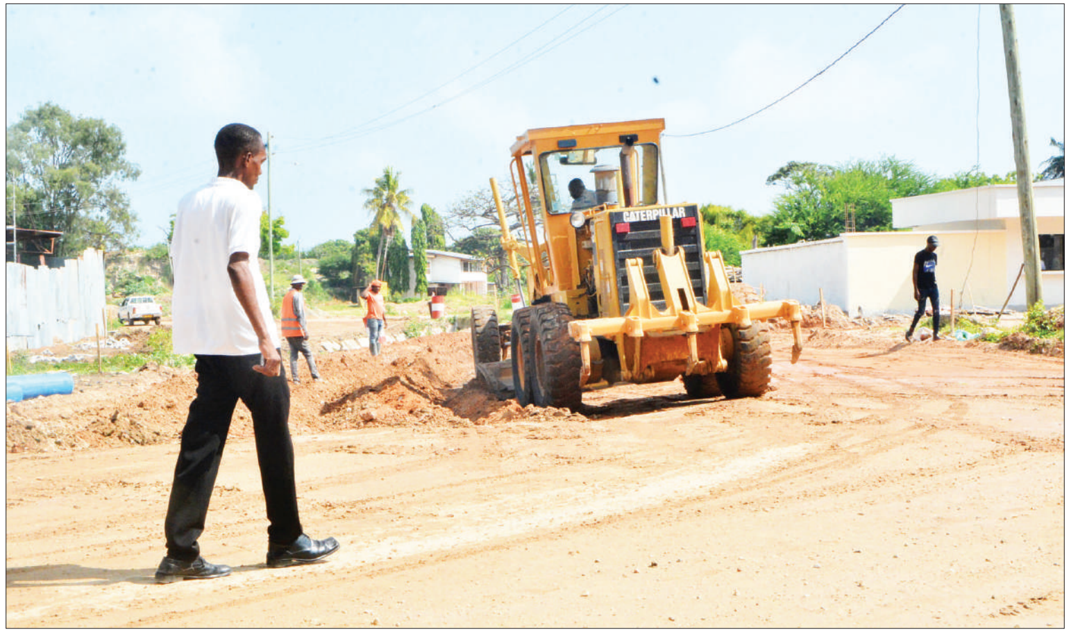
Construction of road along Kawe Beach in Dar es Salaam in progress yesterday, the aim being chiefly to ease traffic congestion.

For her part, village extension officer, Veronica Lugano, said the project improved maize production since farmers were not applying modern skills such as weeding on time, application of fertilisers, poor storage technology, and selection of best maize seeds.