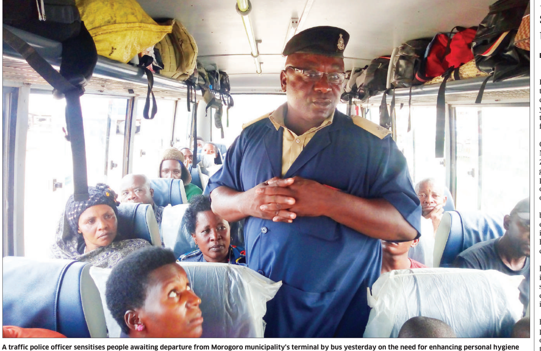
and taking other precautions to prevent the spread of the Covid-19 pandemic.

For many years, Tanzanians suffering from Kidney failure had to be referred abroad, especially to India for the procedure.