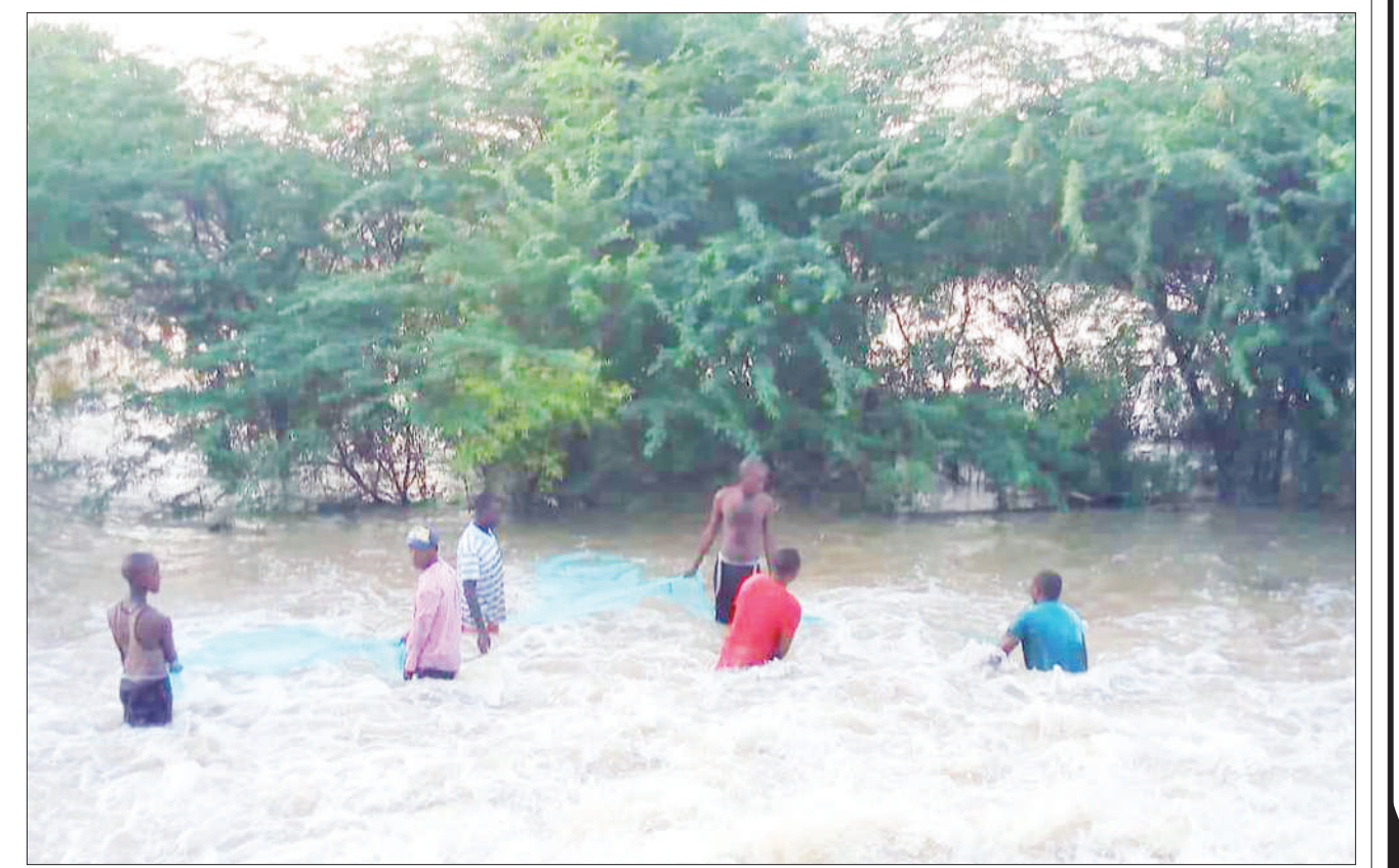
Residents of Mirerani township in Simanjiro District, Manyara Region, search for fish on the side of Kairo-Zaire road. The floodwaters are attributed to the overflowing of the nearby Lake Kidawash.

Issued by: Director General, Tanzania Communications Regulatory Authority (TCRA), March, 2020