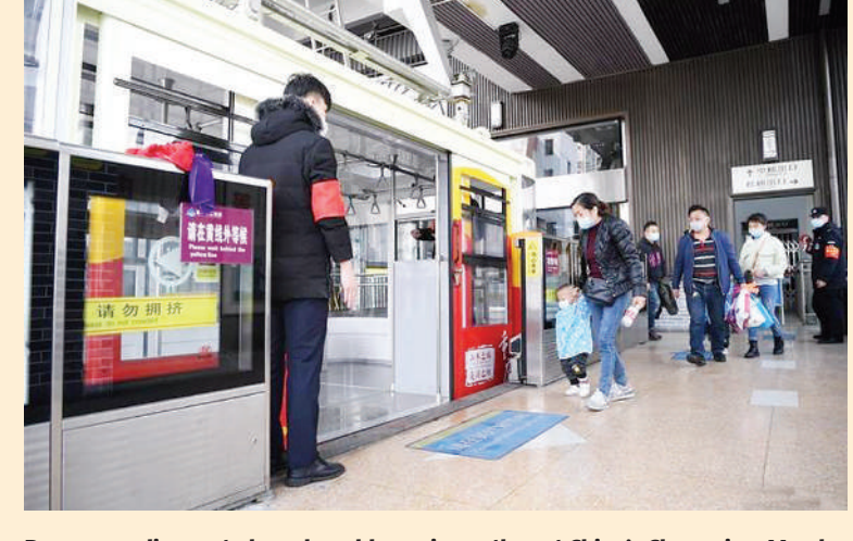
Passengers line up to board a cable car in southwest China's Chongqing, March 18, 2020.

The province also saw 795 patients discharged from hospital after recovery on Wednesday, reducing its caseload of hospitalized patients to 6,636, including