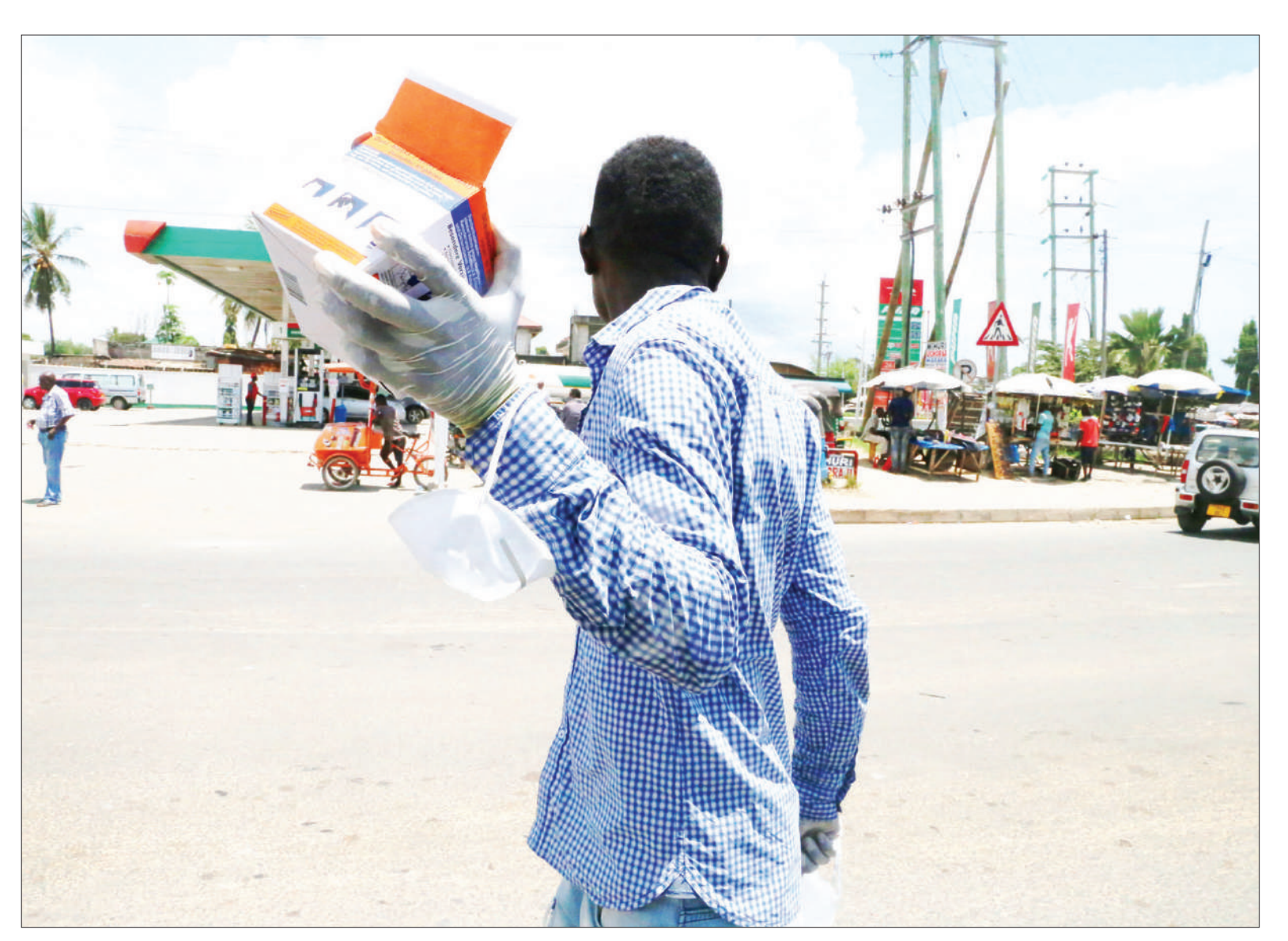
A small trader peddles masks and gloves along the Mwenge stretch of Dar es Salaam's Sam Nujoma Road yesterday, the protective gear having gained unprecedented popularity and attracted higher prices in recent days than previously owing to the global spread of the much-dreaded Covid-19 pandemic.

Cases double as three more infected people discovered