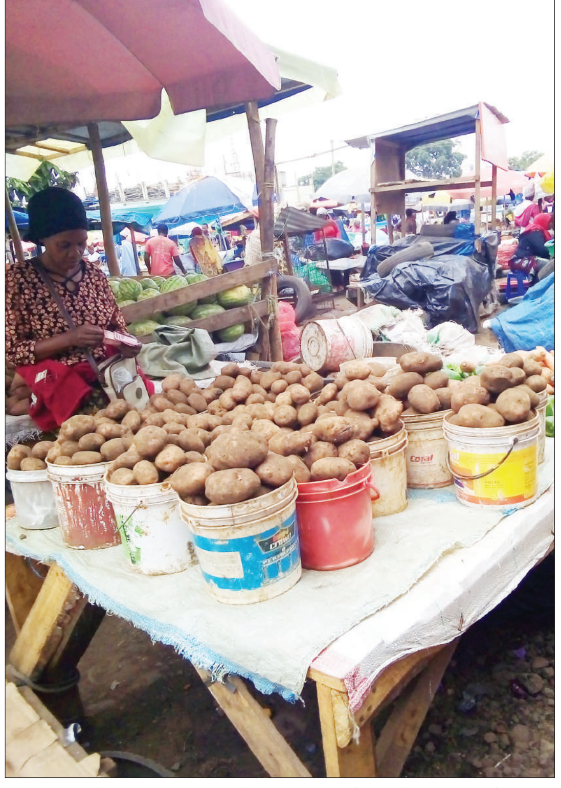
A small trader waits for customers for her Irish potatoes at her kiosk at Kilombero market in Arusha city yesterday. She said the price has recently risen sharply, with ongoing rains in the southern highlands regions having led a drop in supply.

We will keep the good work going through online platforms, social media and other media engagements to promote increased ambition for emissions cut and the demand for urgent accountable climate action to secure our futures