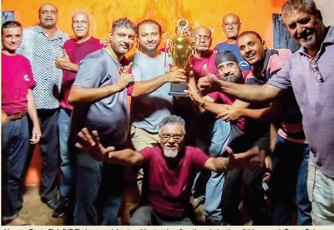
Upanga Darts Club (UDC) players celebrate with a trophy after the culmination of this season's Dar es Salaam regional championship, held in the city recently. The UDC lifted the silverware in the competition, which brought together 11 teams.