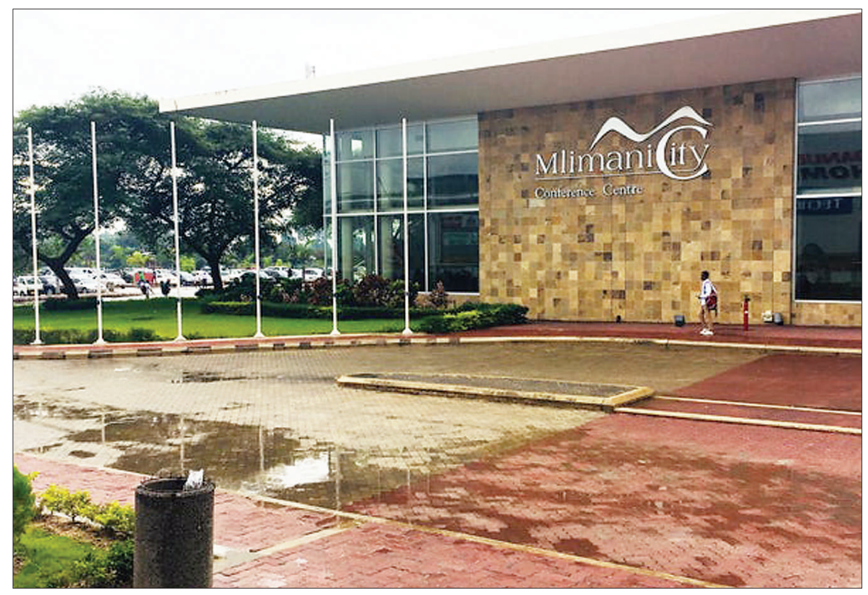
Dar es Salaam Mlimani City Conference Centre performed well last year and contributed to profit made by Turnstar Holdings Limited.

"The Botswana properties were well tenanted during the reporting half year, with vacancy rates being approximately