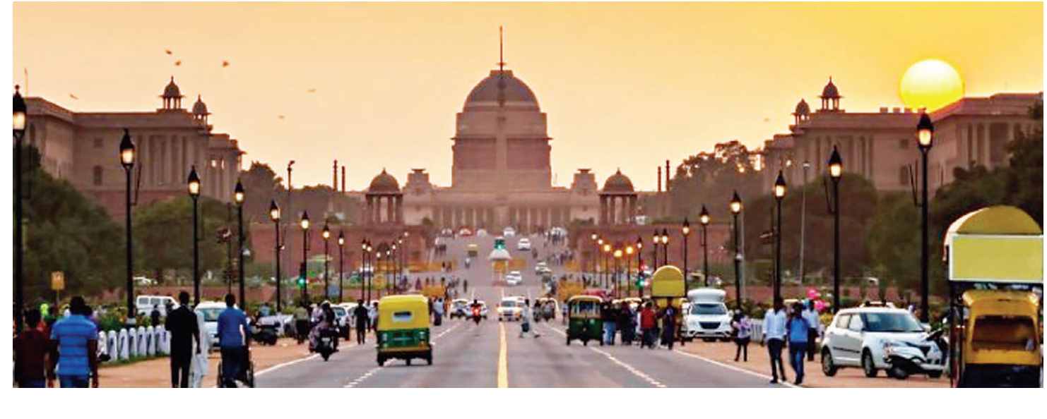
A main street in New Delhi, India

JLL's City Momentum Index 2020, which identifies the world's most dynamic cities from a real estate perspective, is led by two Indian cities: Hyderabad and Bengaluru. Another five Indian cities make the Top 20 - Chennai (5th), Delhi (6th), Pune (12th), Kolkata (16th) and Mumbai (20th).