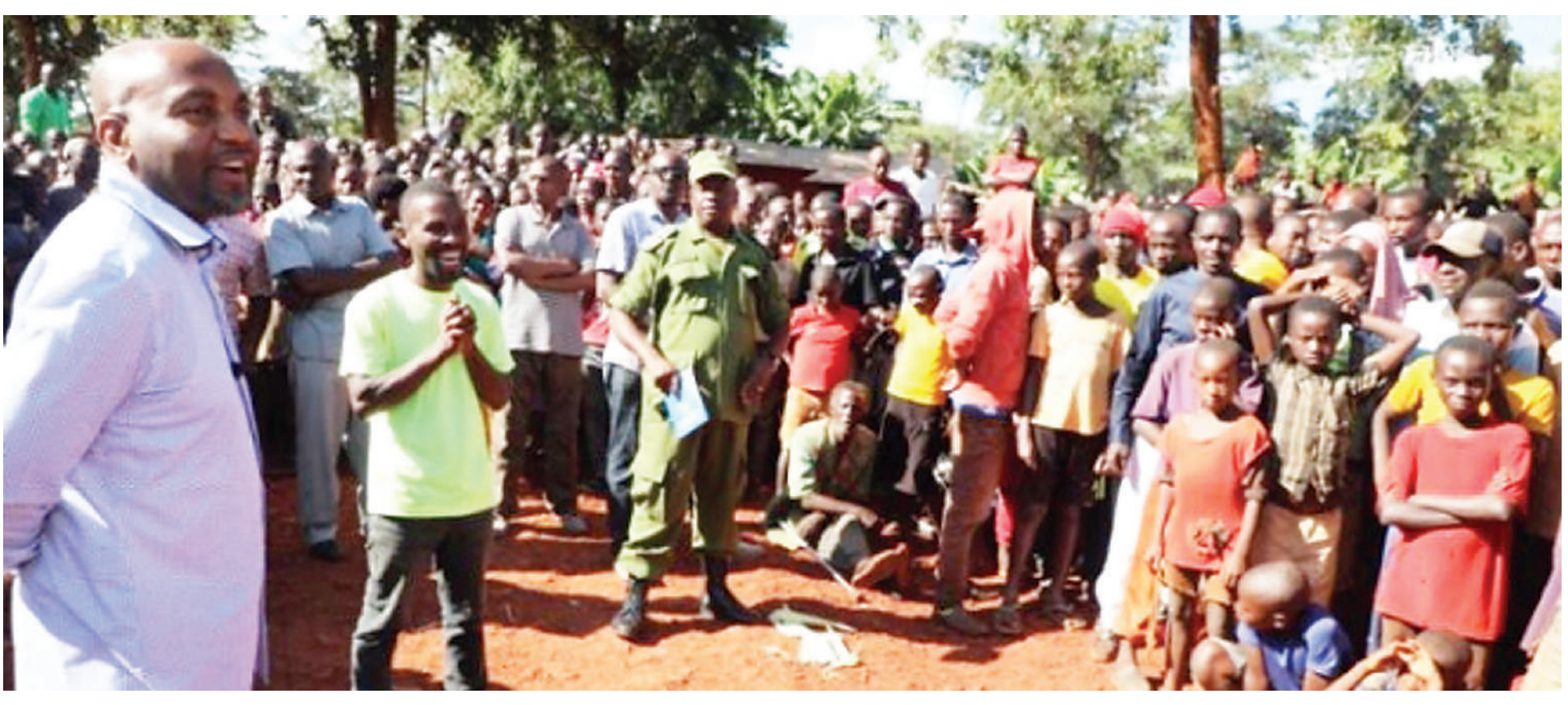
Home Affairs deputy minister Hamad Masauni addresses refugees at Nduta camp in Kibondo Dstrict. File Photo

The authority serves about 98 percent of the urban population with clean and safe water for average of 24 hours a day. The population served by the sewerage system is only 17 percent of the urban population.