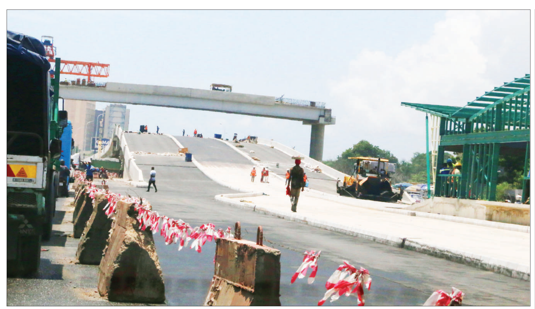
This is a section of the Ubungo interchange at the Morogoro Road/Mandela Road intersection in Dar es Salaam, as captured yesterday. The facility is still undergoing