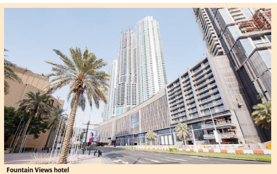
Emaar stops bookings at three Dubai hotels due to dip in demand

In October WeWork had announced plans to open new locations in the Sun Life Tower in Tsim Sha Tsui, in Hysan Place in Causeway Bay, with another location in the Octa Tower in Kwun Tong said to be "opening soon." Since that time, none of three centres has opened, although a centre managed by WeWork in the Quayside in Kwun Tong has begun operation, as has WeWork H Code in Central. In November, WeWork was reported to be seeking replacement tenants to take over six centres it had agreed to lease in Hong Kong.