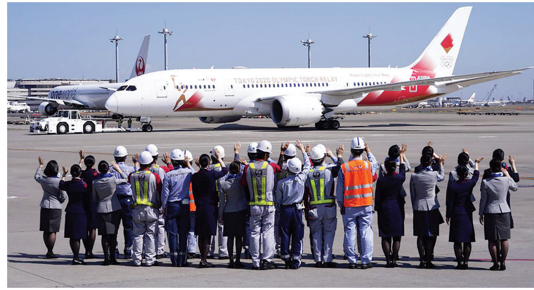
In this March 18, 2020, file photo, ground crews of Japanese airlines wave to the special "Tokyo 2020 Go" aircraft that will transport the Olympic Flame to Japan after the Torch Handover Ceremony in Greece, departs at Haneda International Airport in Tokyo. The Olympic flame from Greece is set to arrive in Japan even as the opening of the the Tokyo Games in four months is in doubt with more voices suggesting the games should to be postponed or canceled because of the worldwide virus pandemic.

THE Olympic flame from Greece is set to arrive in Japan even as the opening of the Tokyo Games in four months is in doubt with more voices suggesting the event should be postponed or canceled because of the coronavirus pandemic.