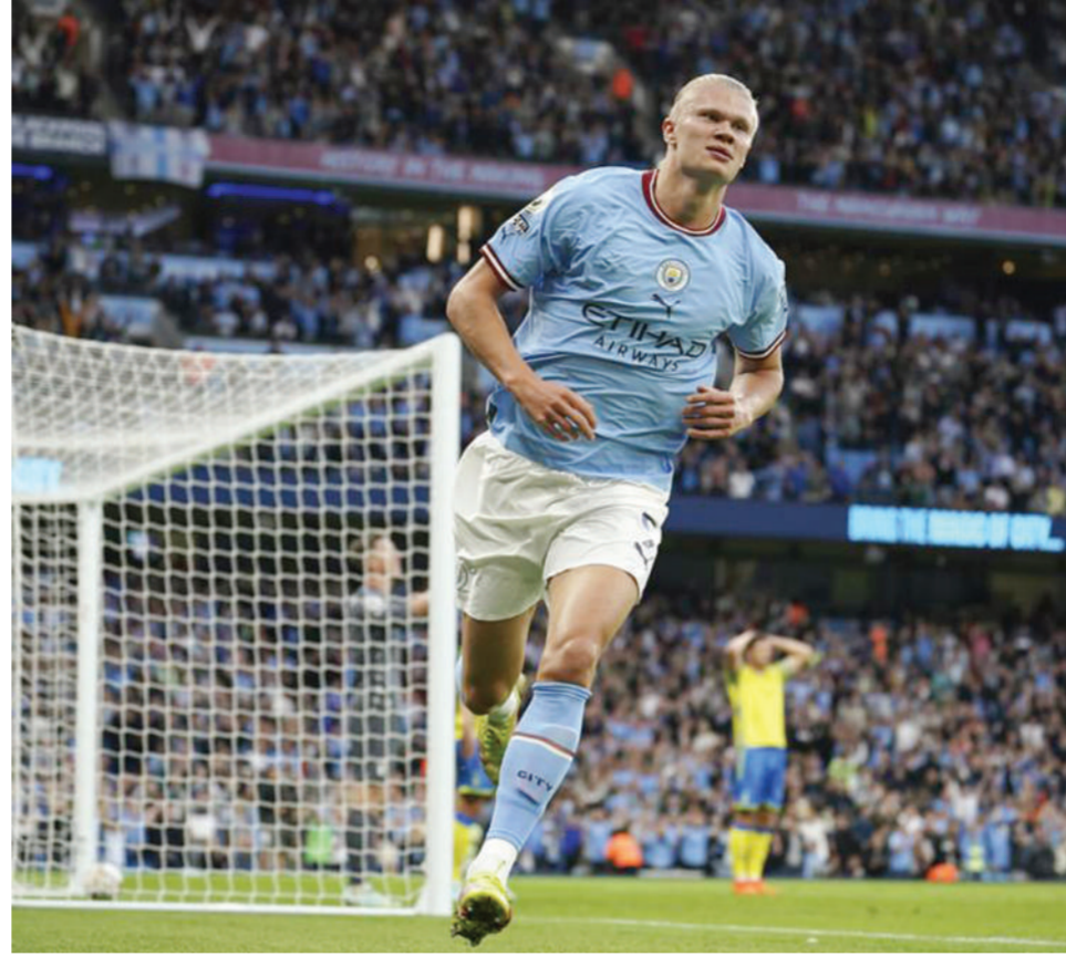
Manchester City's Erling Haaland celebrates after scoring his side's opening goal during the English Premier League soccer match between Manchester City and Nottingham Forest at Etihad Stadium in Manchester, England, Wednesday, Aug 31, 2022.

"What he has done in Norway, Austria and Germany he tries to do here," said Pep Guardiola after-