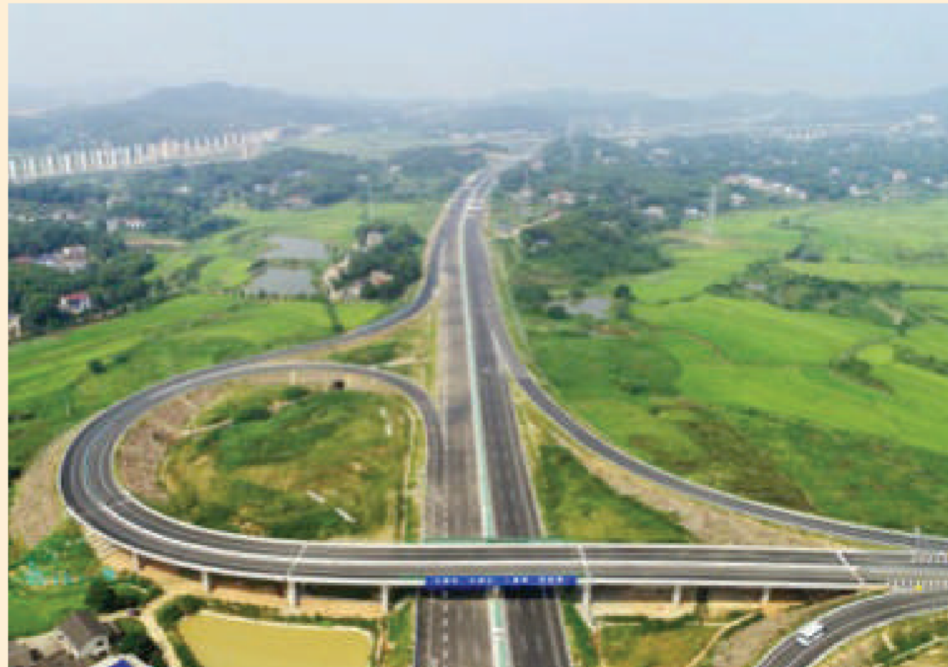
Visitors pose for pictures at the Universal Beijing Resort, April 22, 2022.

definition surveillance cameras, 15 sets of omnidirectional millimeter-wave radars and 33 sets of laser radars along the Beijing-Taipai Expressway. The traffic information collected by the equipment is transmitted to a smart traffic control platform, and then the platform processes the data it receives and gives precise evaluation of current traffic conditions.