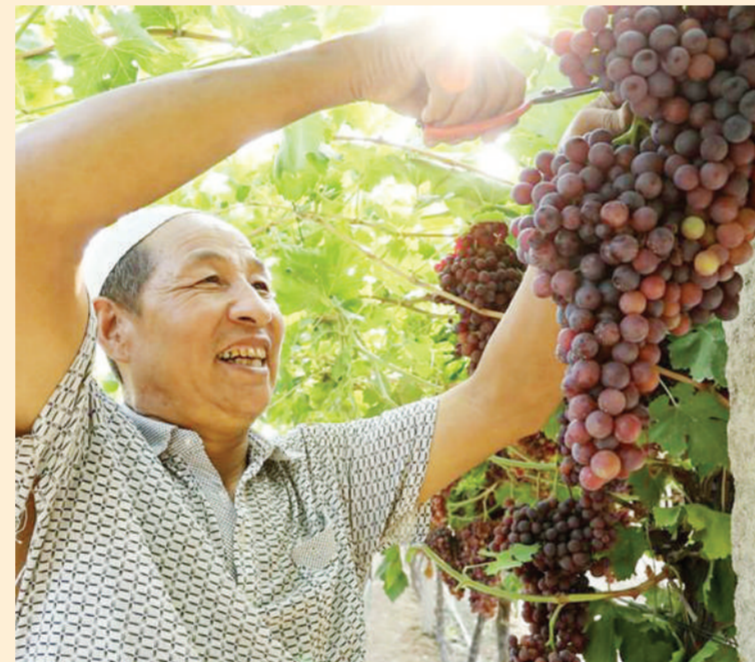
A farmer harvests grapes at a plantation in Shuanghe, Xinjiang, in September 2021. (File photo)

"The United States has always portrayed itself as a 'human rights judge' and 'human rights defender'. But the fact is the country has serious problems of enforced disappearances and a poor human