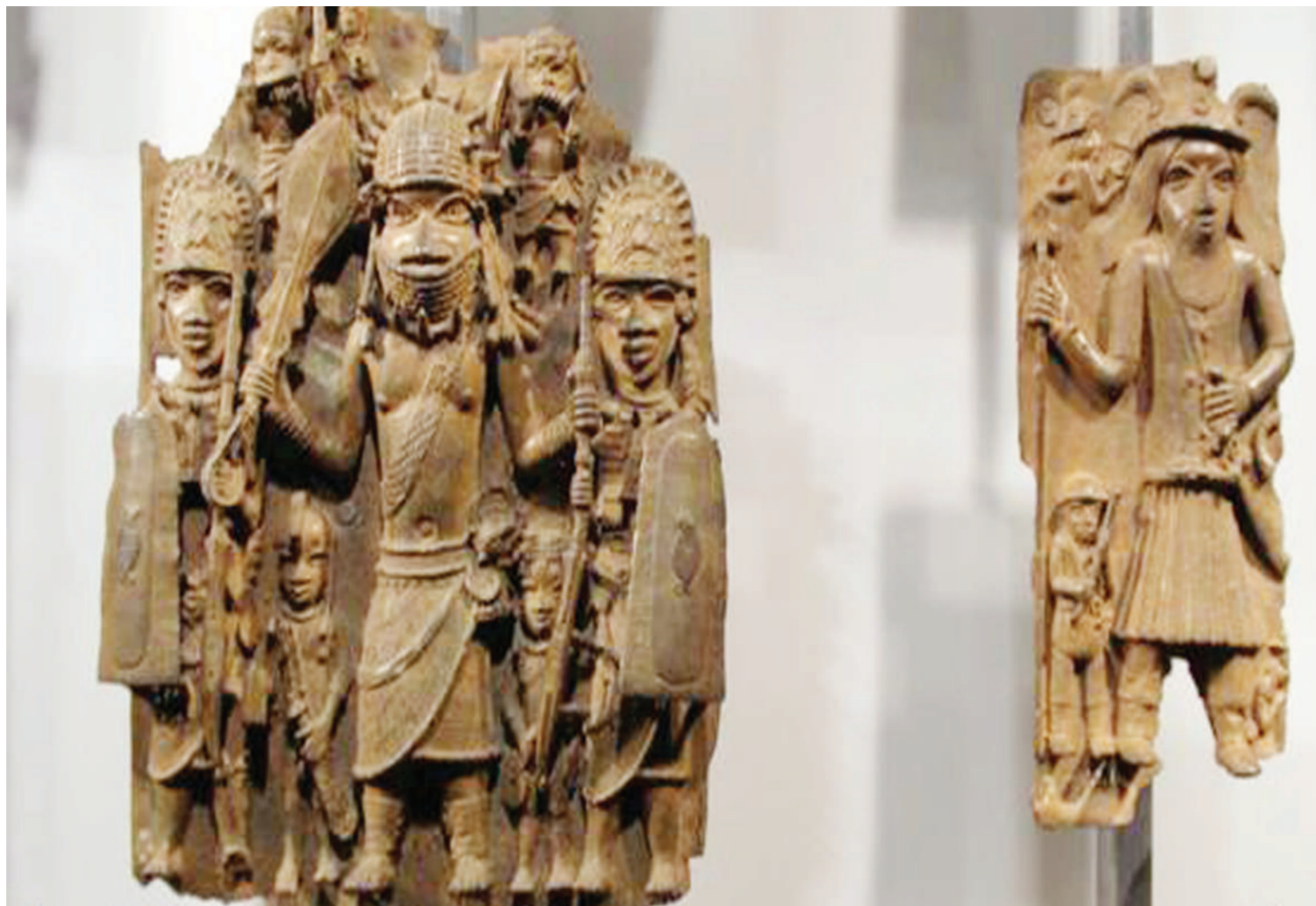
It is estimated that a whopping 90 per cent of all African art remains outside of the continent.

tiations with former colonial powers seeking to ensure that the stolen traditional artifacts, including preserved skulls of chiefs taken away more than a century ago are returned back in the country."