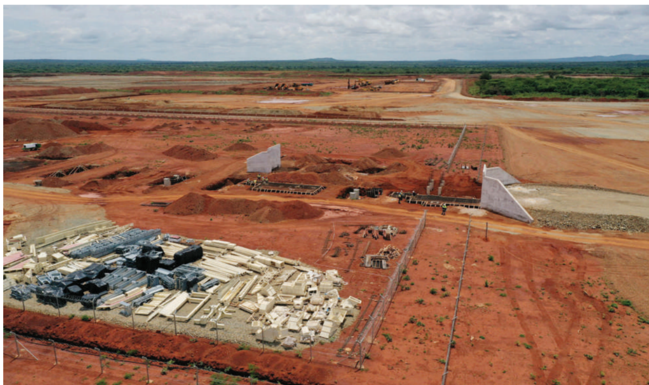
Singida Gold project's process plant site

tains 49 percent of all of the current mineral resources at Singida, it says. Shanta Mining Company Limited