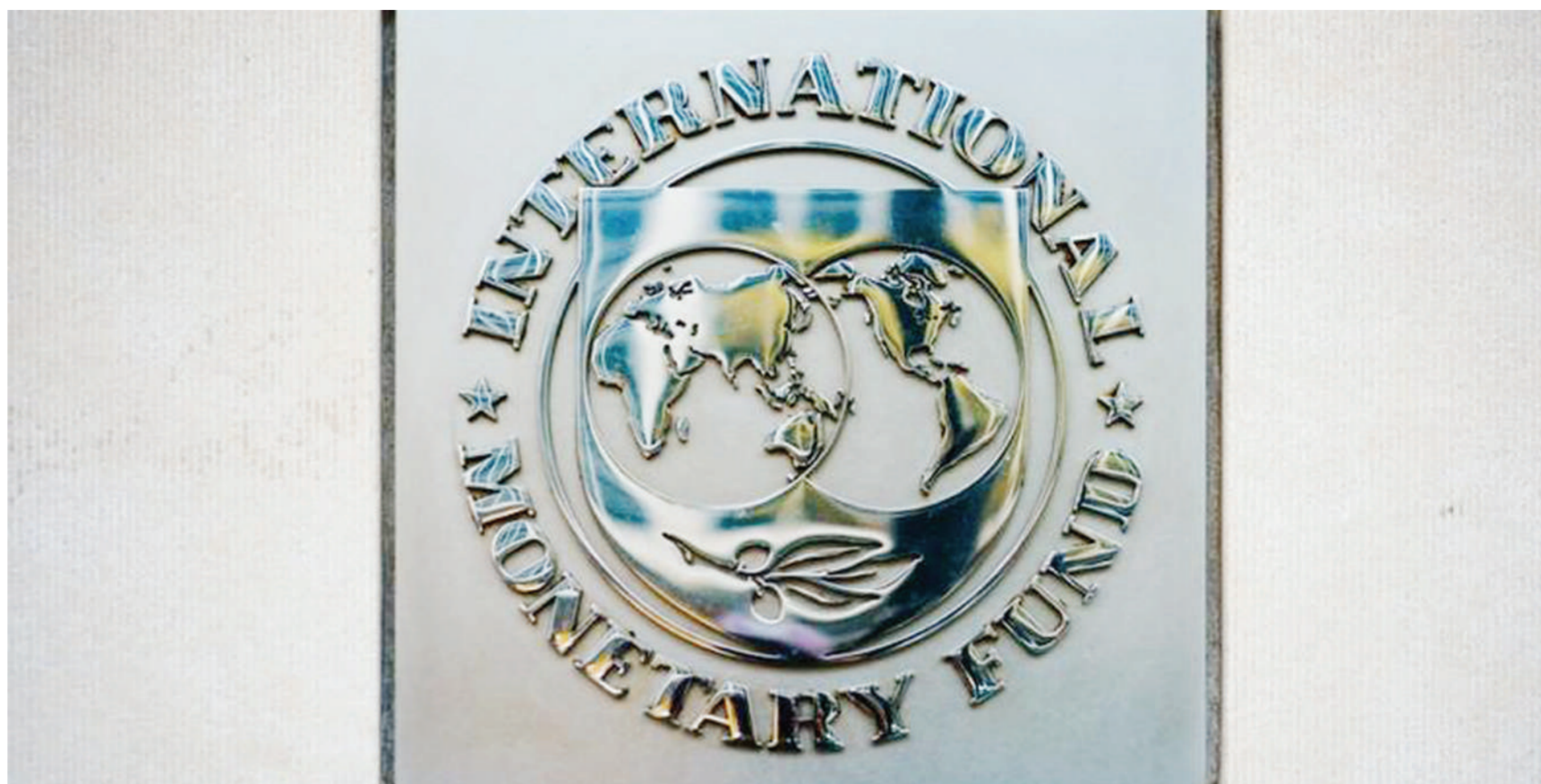
In this April 7, 2021 photo, the seal of the International Monetary Fund (IMF) is seen outside of a headquarters building in Washington.