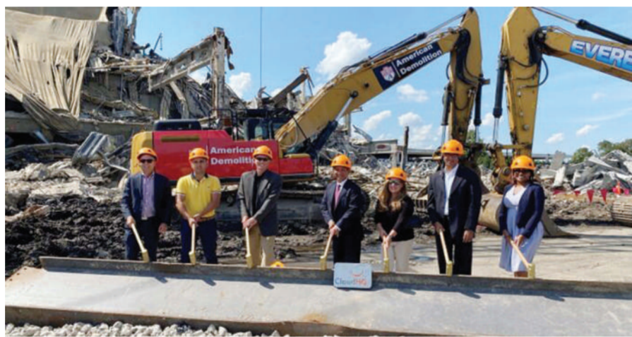
CloudHQ is building a $2.5 billion, 1.5 million sq. ft. data center campus - one of the largest such facilities in Illinois.

"ComEd is thrilled to support the launch of one of the largest data centers ever seen in our state, as part of our ongoing work to power growth