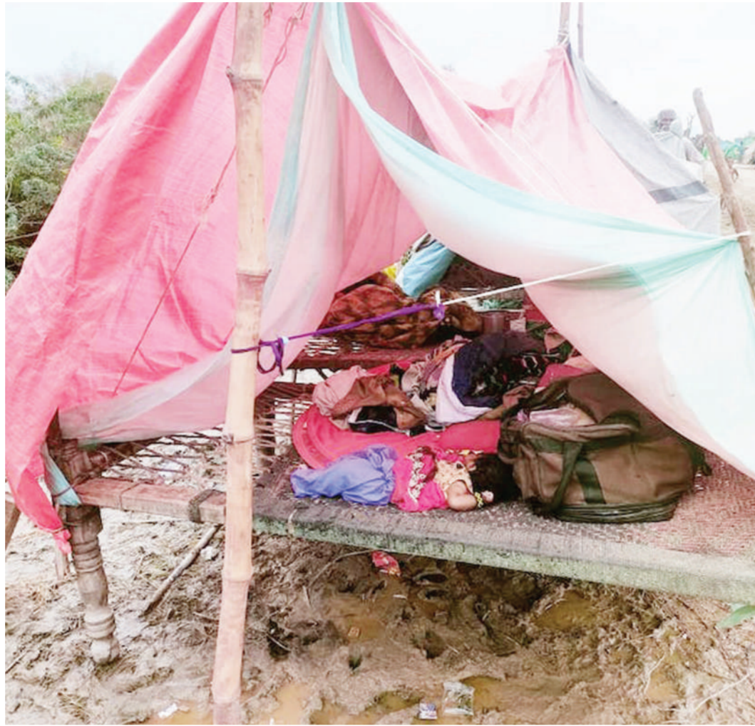
Filmy coverings make keeping dry in the incessant rain an impossible task.

"The water gushed into our home suddenly, and we rushed out just moments before the