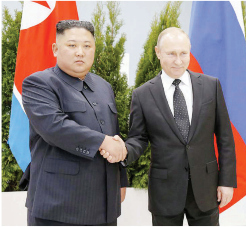
FILE - Russian President Vladimir Putin, right, and North Korea's leader Kim Jong Un shake hands during their meeting in Vladivostok, Russia, April 25, 2019. As the war in Ukraine stretches into its seventh month, North Korea is hinting at its interest in sending construction workers to help rebuild Russian-occupied territories in the country's east.

But they say it's highly likely North Korea will supply labor to Donbas when the fighting eases to boost its