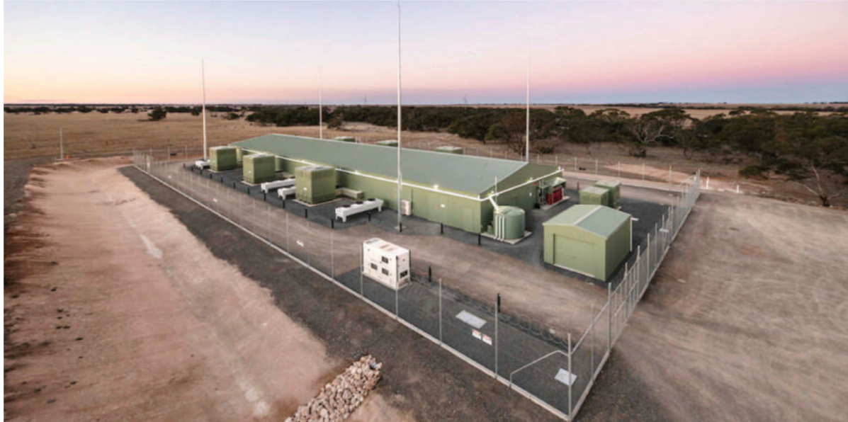
The first BESS in Australia with 'virtual synchronous machine' capabilities of delivering inertia to the grid