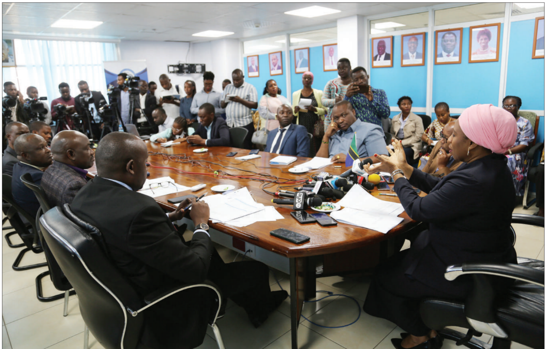
Health minister Umyy Mwalimu briefs journalists in Dodoma yesterday about the National Health Insurance Fund (NHIF) services and the challenges facing it.

The conference will help to set sustainable strategies including finding alternative ways to solve agro-sector and other problems arising from climate change effects, he added.