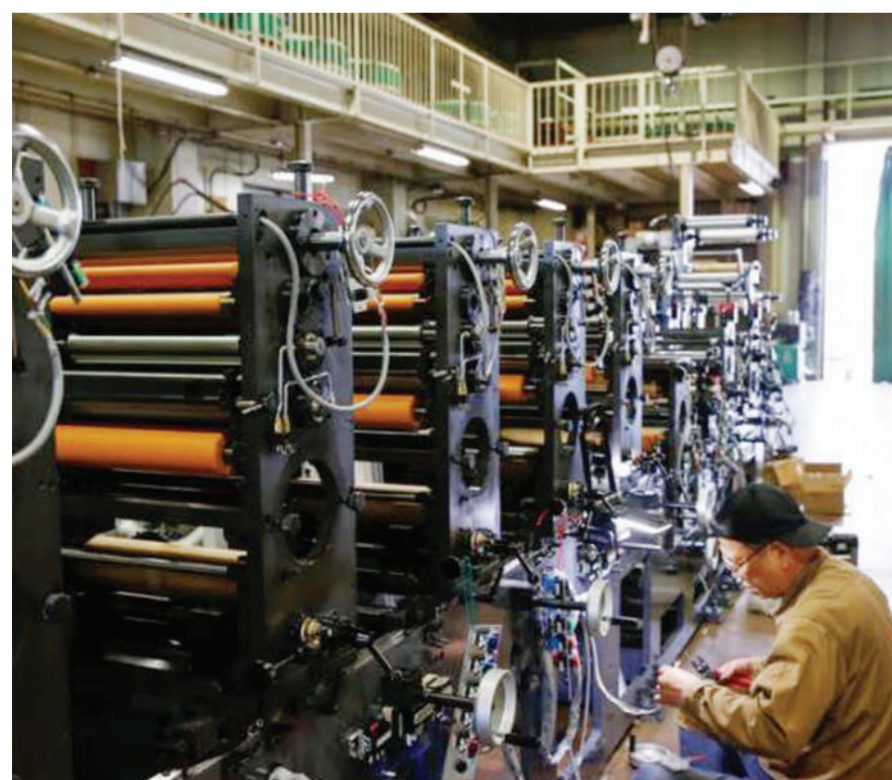
A worker checks machinery at a factory in Higashiosaka