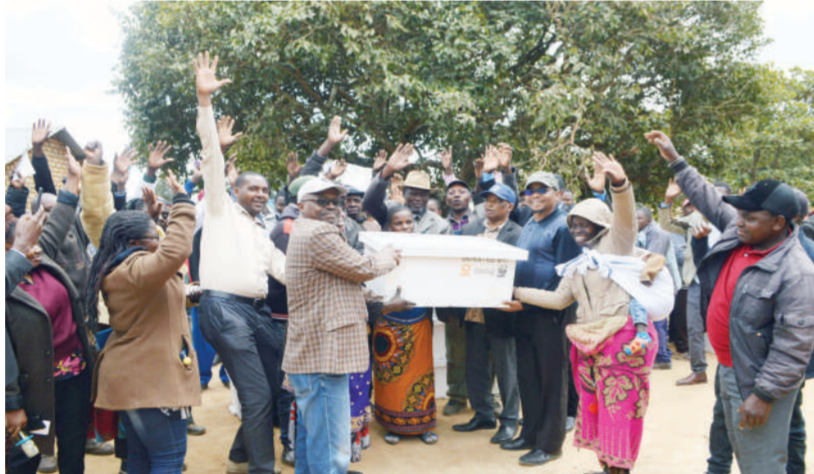
Citizens of Ugenza village in Iringa district, Iringa region celebrate one of the beehives donated by CARE-WWF Alliance in the village on Wednesday.

"Conservation and restoration should be people centered. Conservation is about people