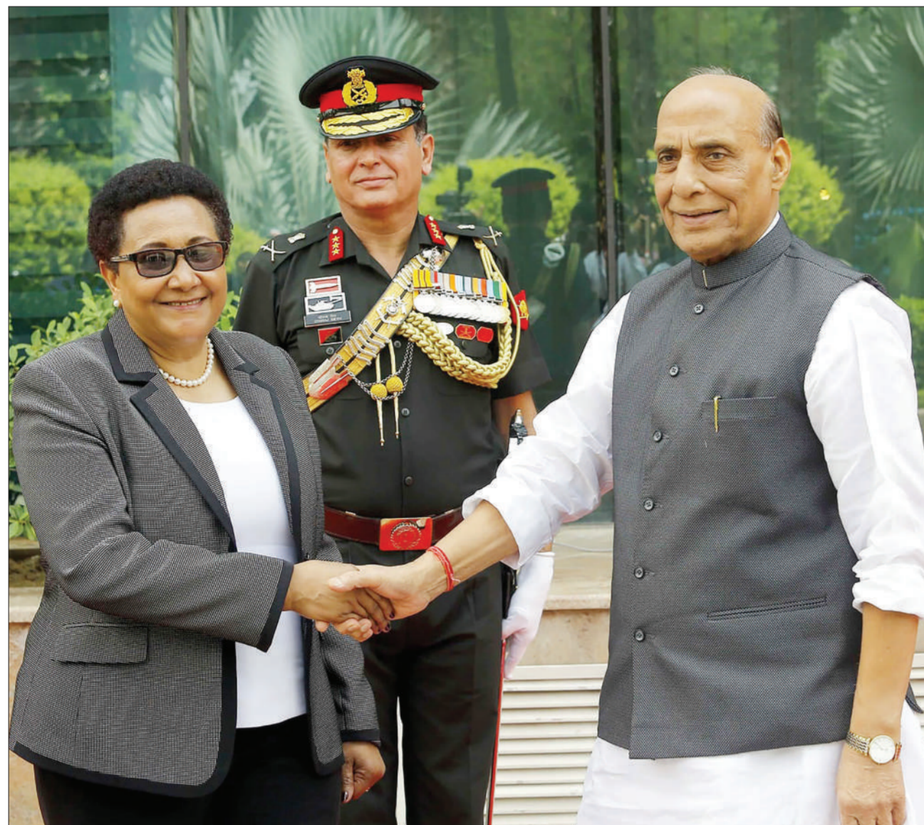
Defence and National Service minister Dr Stergomena Tax exchanges greetings with her counterpart Indian Defence minister Rajnath Singh in New Delhi India to discuss bilateral defence cooperation recently.