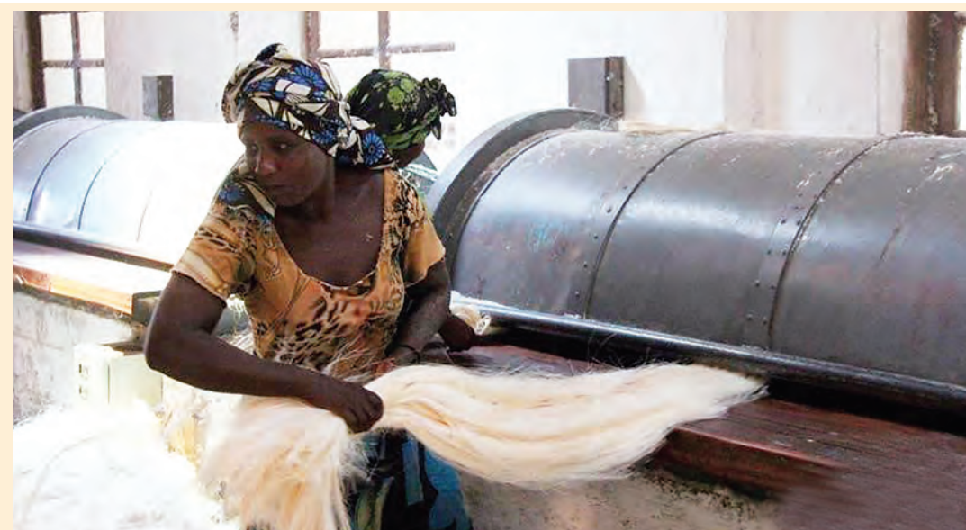
An employee of the Tanzanian branch of the China-Africa Agriculture Investment Co., Ltd. is polishing sisal fibers.

designed installed capacity of 30MW, is able to supply the entire town. Over the past 14 years, sisal waste biogas power generation facilities have been built in many places across Tanzania, accounting for three percent to five percent of the country's total power generation. Sisal is a raw material for making hard fibers, but only two percent to four percent of its constituents can be used for fiber making. Thanks to Chinese demonstration sisal projects, sisal waste has been fully exploited in Tanzania, which can both be transferred into combustible gas for power genera-