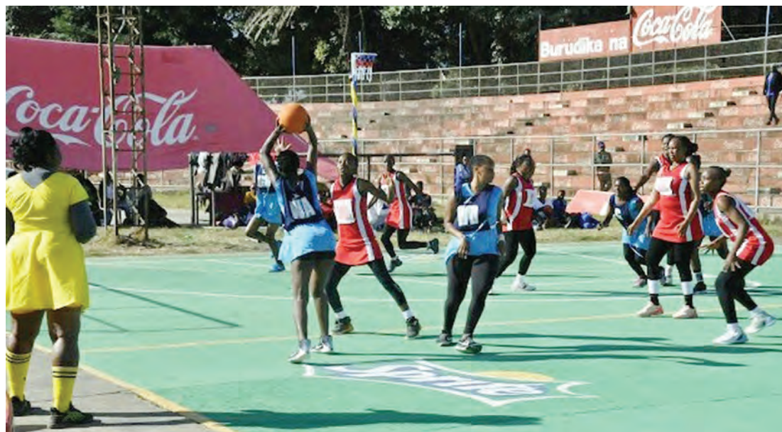
Netballers feature in one of the sports tournaments which were organized to vouch for the prevention and control of non-communicable diseases in Arusha recently.

The instructor asked Chaneta to make use of the coaches and umpires as they are still young and productive, saying they will be in