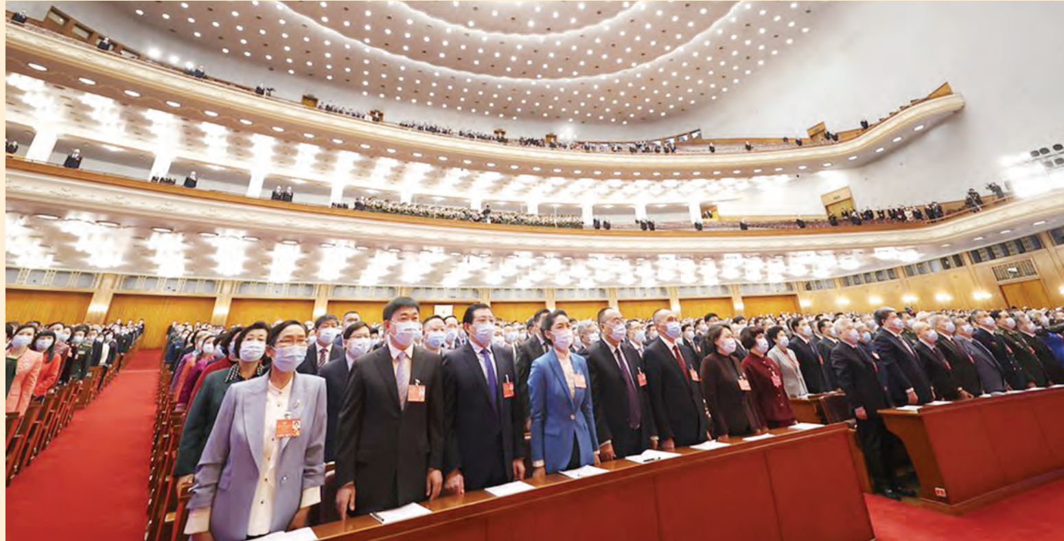
The fifth session of the 13th National Committee of the Chinese People's Political Consultative Conference (CPPCC) opens at the Great Hall of the People in Beijing, capital of China, on Friday.

The government work report, to be unveiled on Saturday, sits