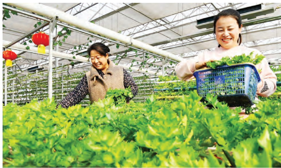
Local farmers pick vegetables at a planting base established by Guangping county, Handan city, north China's Hebei province, for the purpose of helping farmers increase income, Feb. 24, 2022.

Encouraging some people to embrace prosperity first, the country has invigorated its social and economic