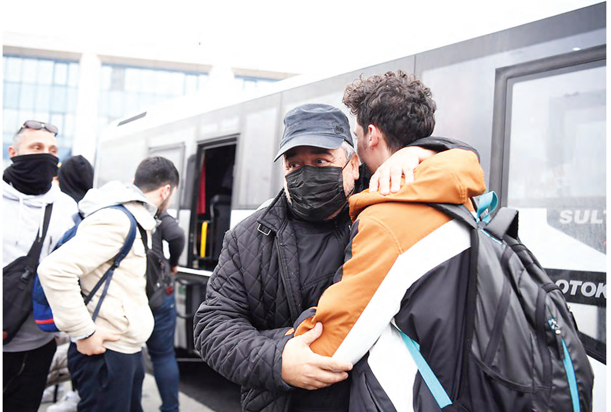
Turkish citizens evacuated from Ukraine arrive in Istanbul, Turkey, on Feb. 28, 2022.

Another challenge for the ailing Turkish economy comes from the United States. Following a January increase of 7.5 percent in