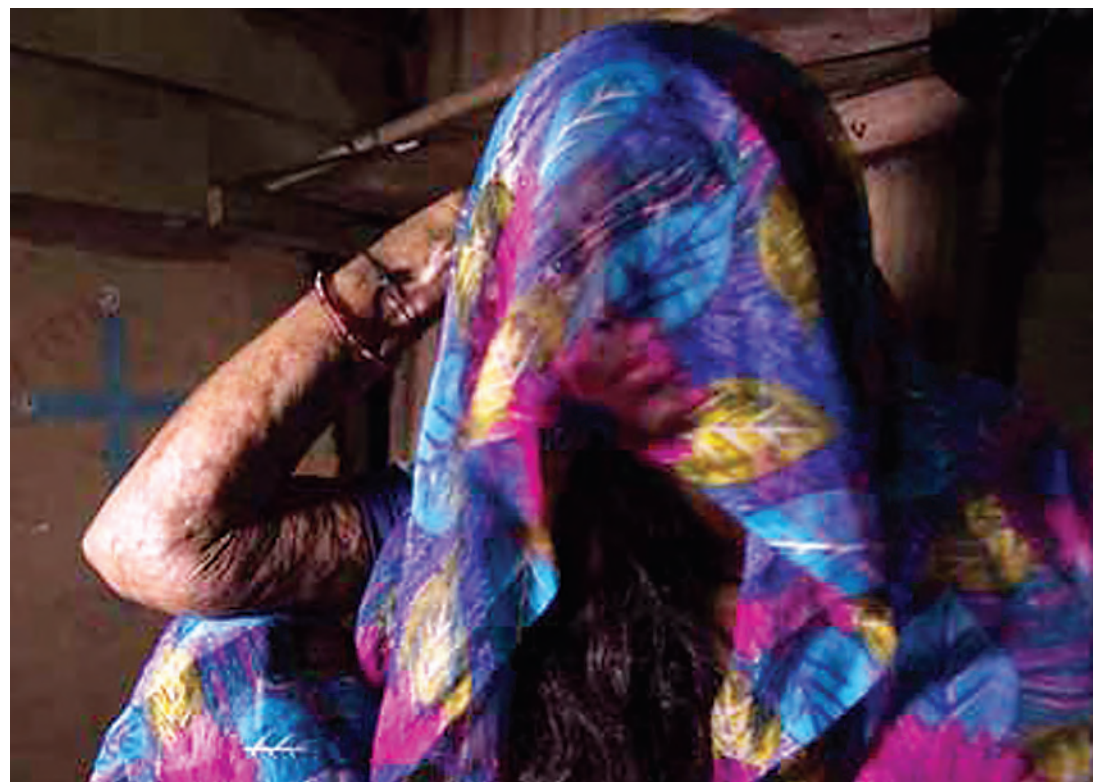
UN officials say that gender-based violence is a "shadow pandemic," hidden beneath COVID-19.