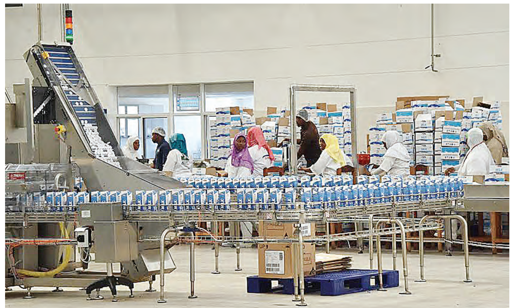
Azam milk processing factory in Zanzibar

The state environment ministry recently said that Tesla would have to meet further requirements and provide evidence before the plan could go into operation, according to the newspaper, which doesn't provide more details.