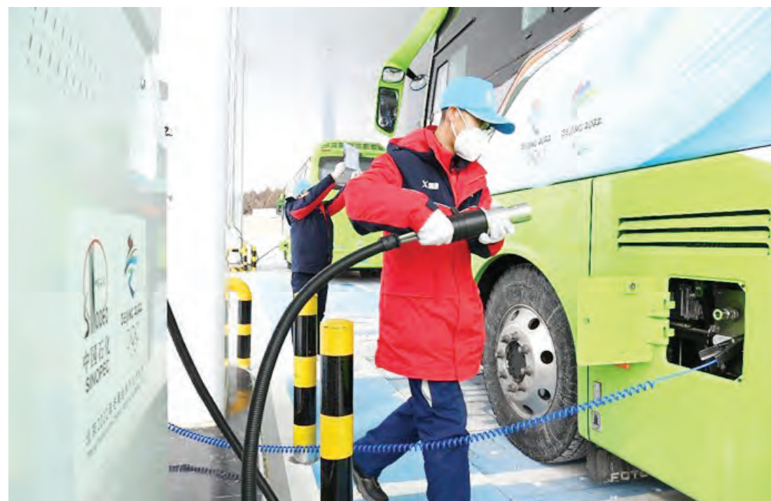
A hydrogen filling station attendant refuels a vehicle for the Beijing 2022 Winter Olympics in Yanqing district, Beijing, Jan. 31, 2022.

To supply natural gas and hydrogen energy for the hosting of a green Winter Olympics in Beijing, China's state-owned pipeline giant China Oil & Gas Piping Network Corporation (PipeChina) brought into operation four new pipelines at the end of last year, and other companies including China National Petroleum Corporation (CNPC) and China Petrochemical Corpora-