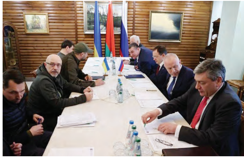
Photo taken on March 3, 2022 shows a view of the second round of talks between Russian and Ukrainian delegations at the Belovezhskaya Pushcha on the Belarus-Poland border.

Russian forces will fulfill all their assigned tasks and the operation in Ukraine is proceeding in accordance with the plan and schedule, Putin said at a meeting with women flight crews of Russian airlines.