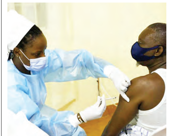
A medical worker injects a second dose of Astra Zeneca vaccine to a patient in a COVID-19 (coronavirus) vaccination center in Kigali, on May 27, 2021. File photo

Rwanda has witnessed a fall in COVID-19 infections since the beginning of 2022.