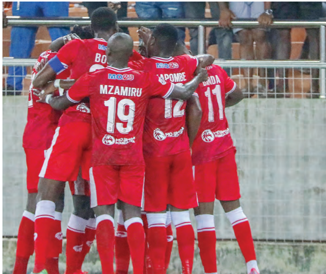
Simba SC's players jubilate shortly after posting a goal in this season's NBC Premier League fixture against Biashara United, which took place in Dar es Salaam last weekend. Simba SC won 3-0.