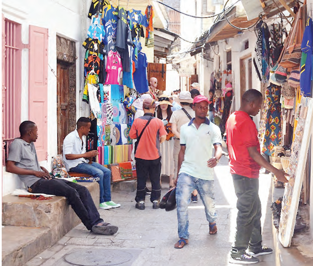
Many handcraft shops in Zanzibar's Stone Town streets and the Mainland sell the same items. Souvenir traders say profits are low as they compete for buyers.

At Mwenge—a hand craft village—customers pause and look, but sometimes move on quickly when surrounded by desperate traders all promoting their similar goods.