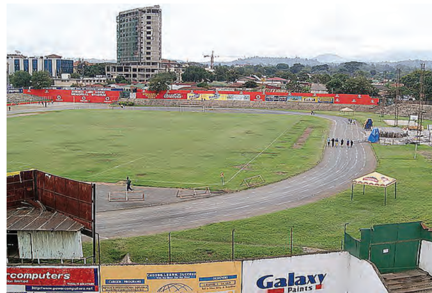
Sheikh Amri Abeid Stadium

"This stadium has a very popular name in and outside Tanzania but without regular adjustments and improvements it will lose all credentials, venue owners do