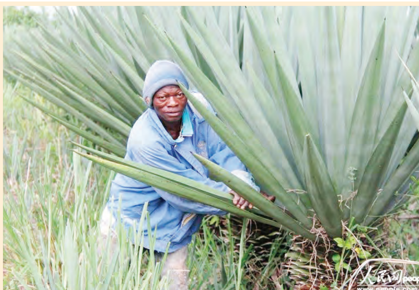
An employee of the Tanzanian branch of the China-Africa Agriculture Investment Co., Ltd. is cutting sisals on a sisal farm of the company.

"To revitalize the sisal industry is an opportunity for Tanzania's economic development. Local sisal association once said