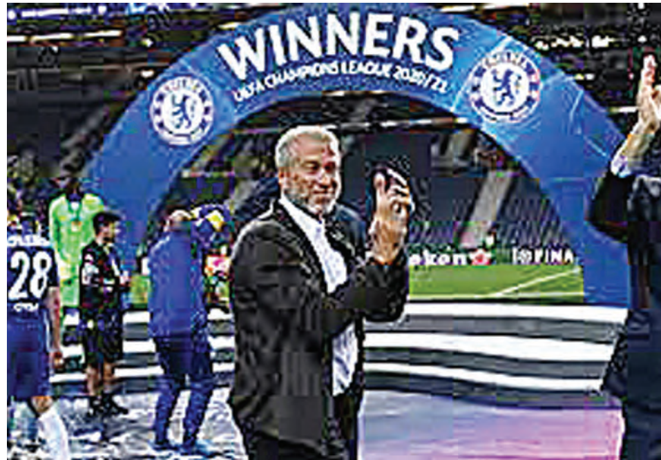
Roman Abramovich's sudden decision to sell Chelsea has led to a flurry of interested buyers.

The source of Abramovich's wealth came from dividends and sales of privatised assets acquired from the former Soviet Union. It is said some of these deals helped former Russian President Boris Yeltsin win re-election in 1996 before keeping his successor, Putin, in power. The integrity of those deals has often been questioned, no more so than when fellow oligarch Boris Berezovsky sued Abramovich in 2011 for £5bn over what he claimed he were ill-gotten gains over the sale of the oil firm they co-founded, Sibneft. Abramovich won that case in