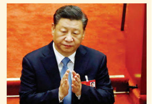
Chinese President Xi Jinping.

According to the WTTC, the global tourism sector started recovering in 2021 when its contribution to GDP climbed by 21.7 percent year on year to reach more than $5.8 trillion.