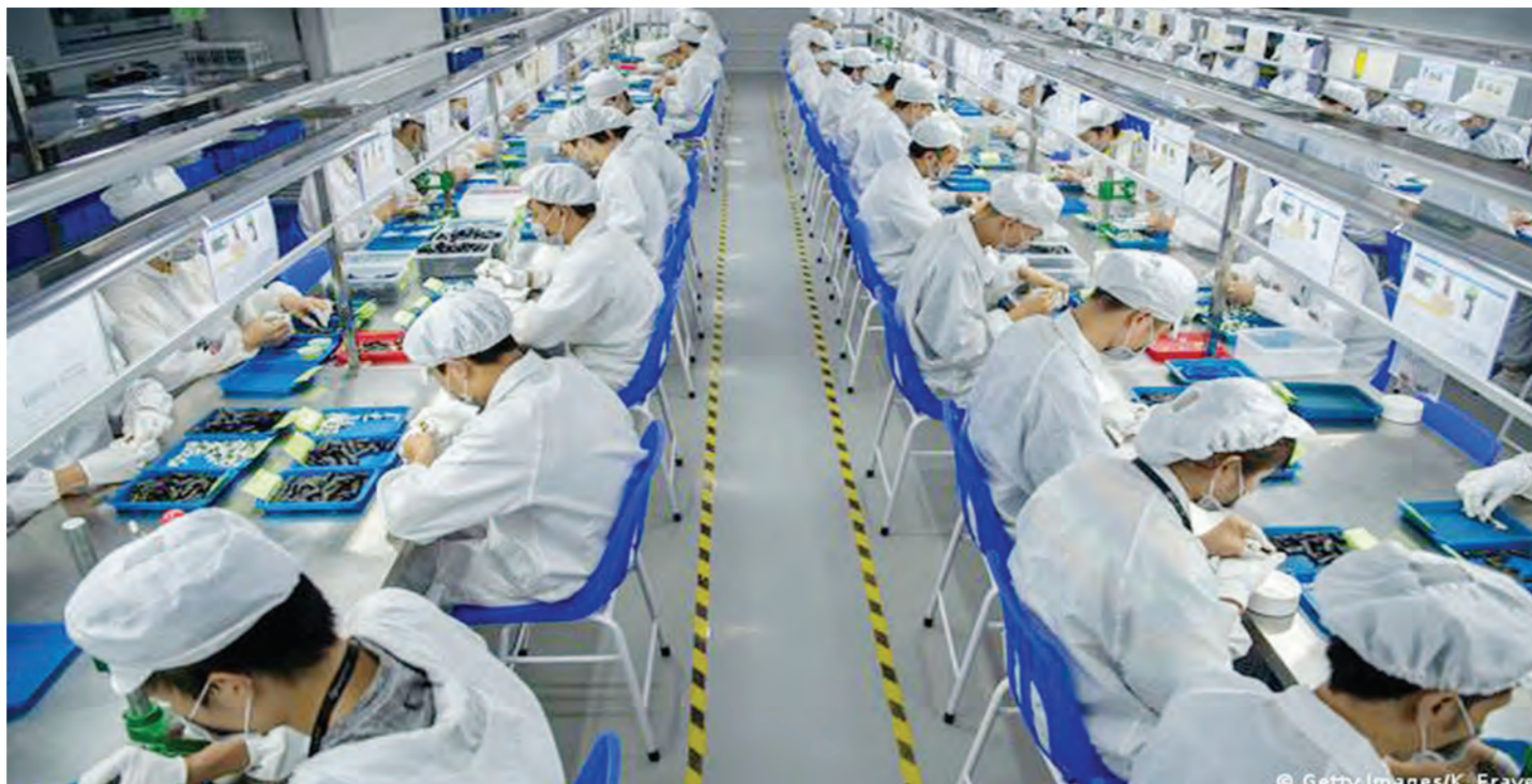
Busy workers at one of the China manufacturing firm

China has over two years of experience as well as a track record that speaks for itself in coordinating epidemic