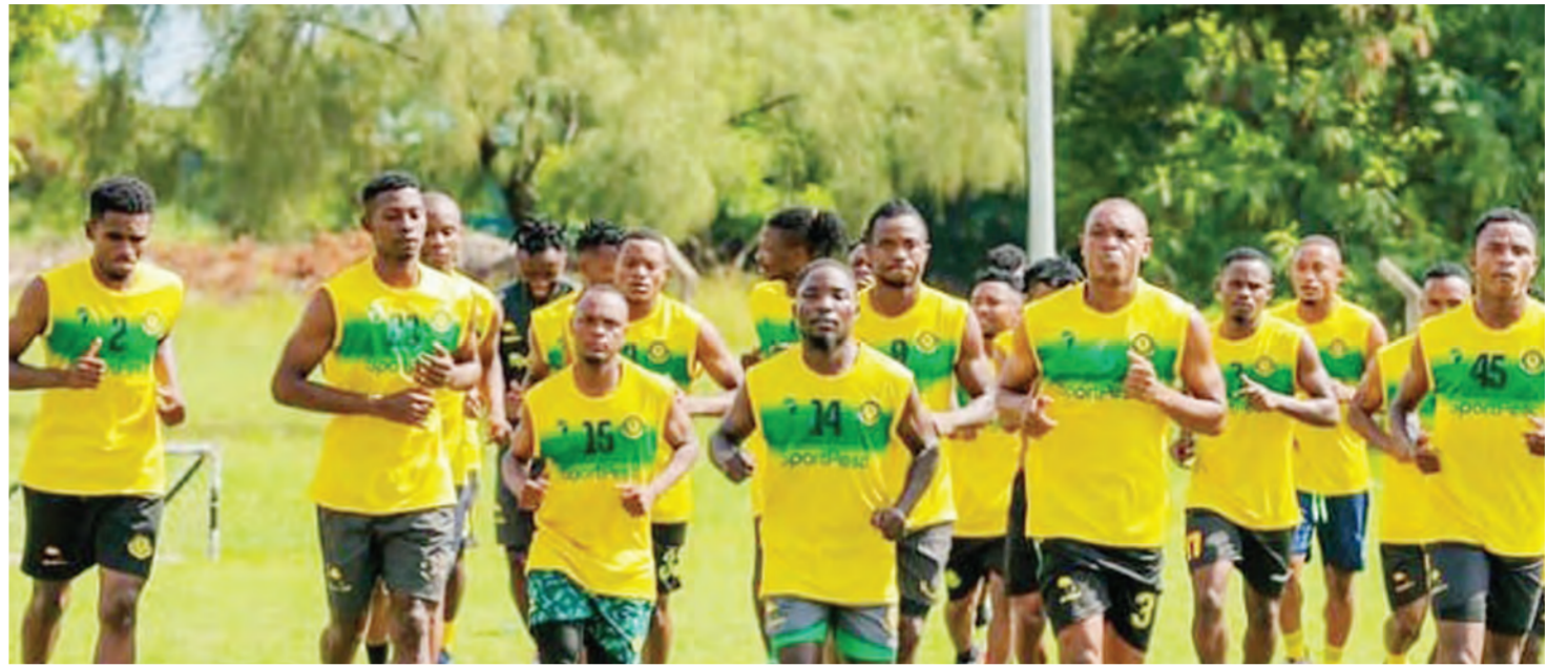
Yanga's players attend a training session in Dar es Salaam recently to shape up for this season's NBC Premier League fixtures.