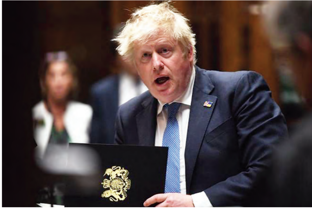
UK Parliament shows Britain's Prime Minister Boris Johnson

Speaking during the parliamentary debate, Labour leader Keir Starmer said Johnson had "stood at that dispatch box and point blank denied rule-breaking took place, when it did." He added that