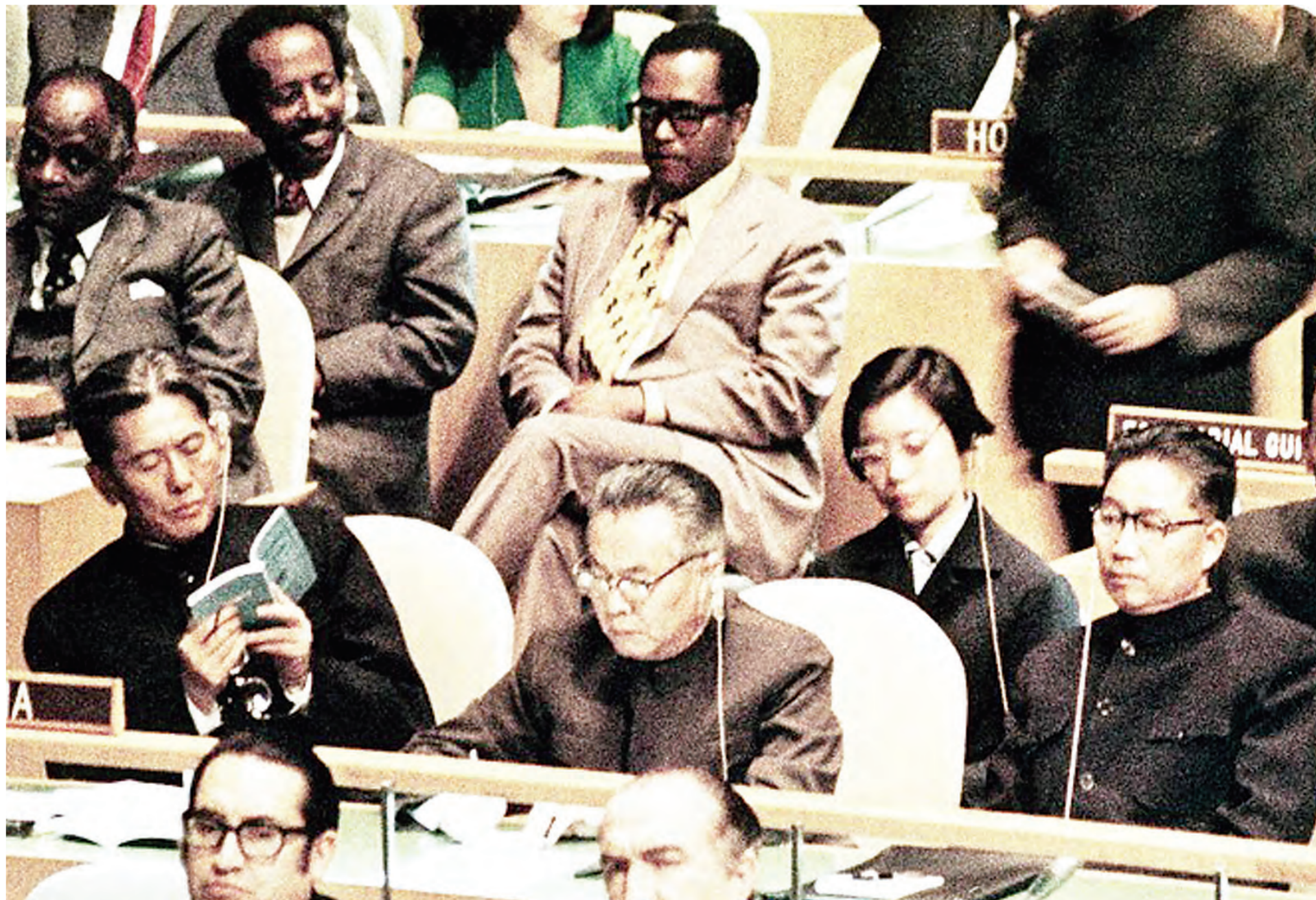
Chinese delegation attends the 26th Session of the United Nations General Assembly in New York, the U.S., Nov. 15, 1971. (File photo)

During the discussion on the Resolution, the so-called representation of Taiwan in the UN and its international status were denied outright. Min-