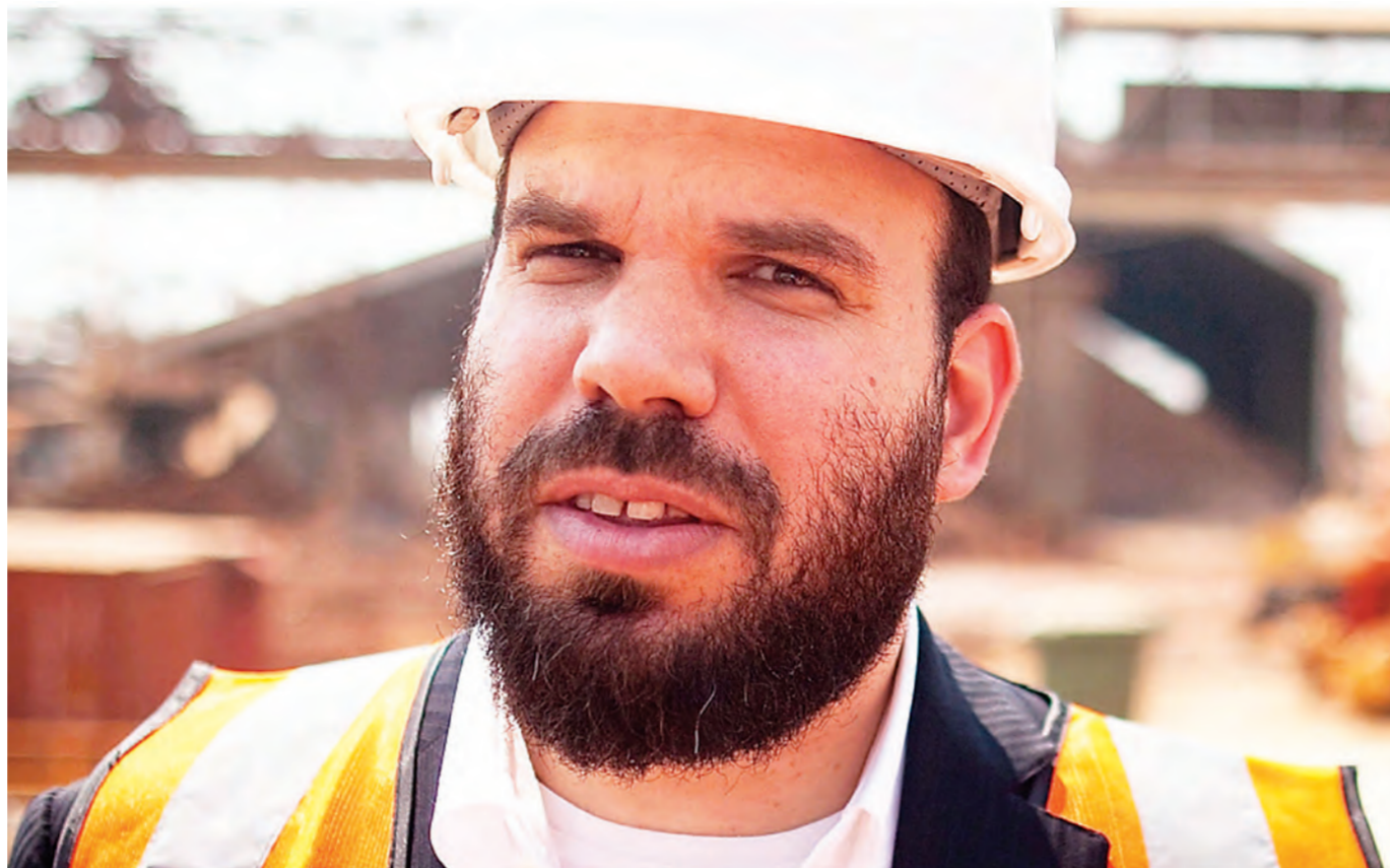
Israeli billionaire Dan Gertler

The deal seems to favour Gertler over the DRC.