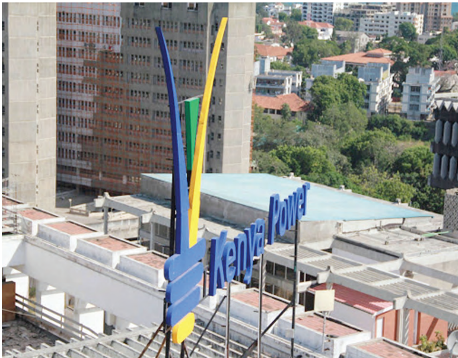
The Ministry of Energy had opted for negotiations over forcing the independent power producers to lower tariffs in the wake of opposition from the firms.

Meanwhile, junk dollar bonds are down for a second straight week in the worst such stretch since mid-March. That pares an initial bounce that the securities got from Beijing’s promises of support, as investor patience for more details wears thin.