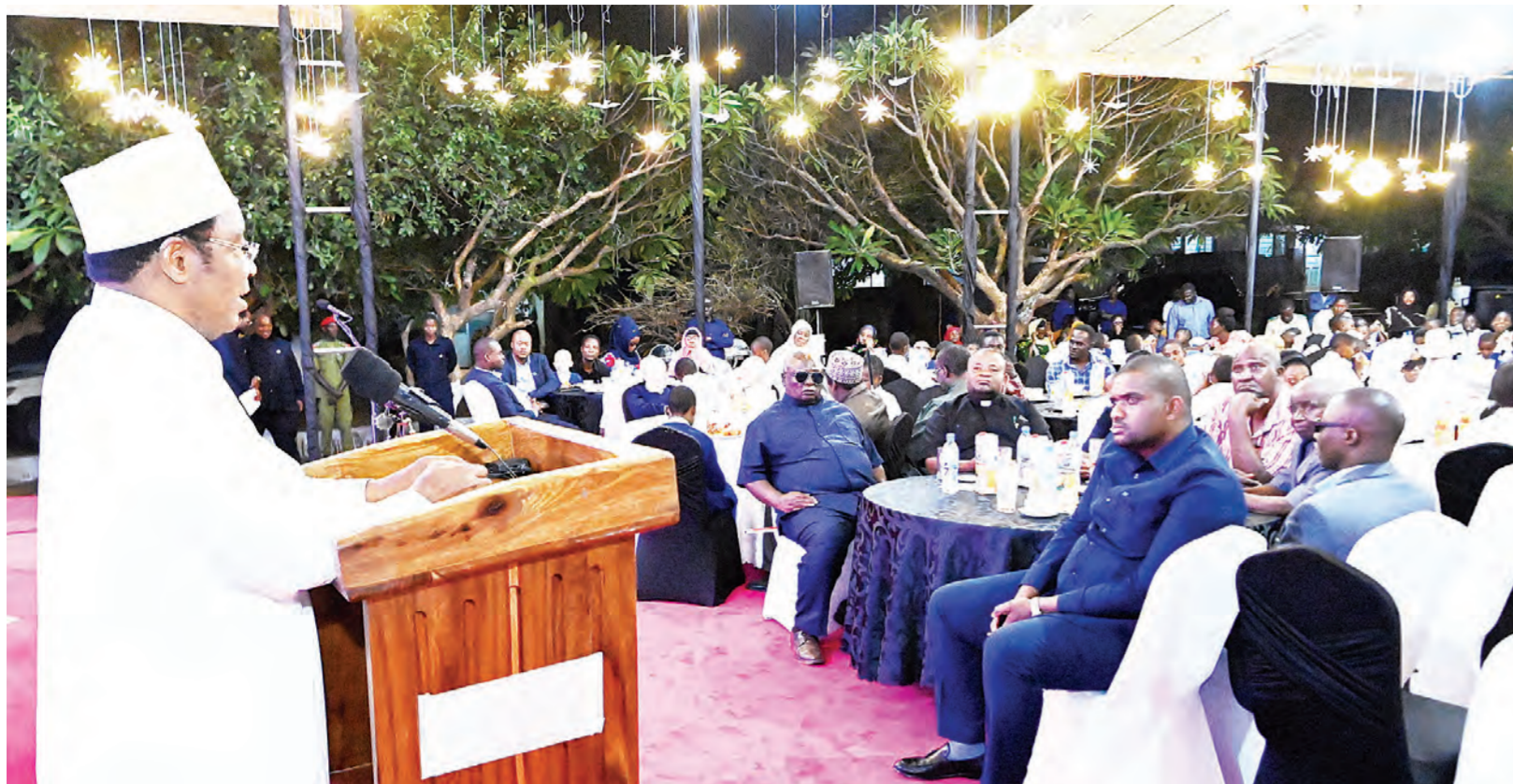
Prime Minister Kassim Majaliwa speaks at iftar hosted at Chamwino District's Buigiri centre of the Anglican Church's Diocese of Central Tanganyika on Thursday for children with special needs.