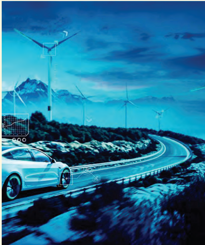
An electric vehicle.