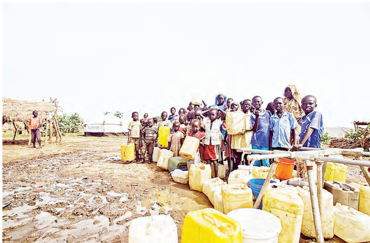
Although water is abundant in Tanzania and the rest of Sub-Saharan Africa, the shortage is caused mainly by economic scarcity which refers insufficient investment in infrastructure or technology to draw water from sources such as lakes, rivers and aquifers.

Of these four billion, 37 countries are affected in the entire population while 97 countries have over half the population affected. Most of the countries affected are in Asia, South America and Africa. India, China, Ethiopia, Bangladesh, Vietnam, Nigeria, Pakistan, Australia, Egypt and Sudan suffer the most from water crisis.