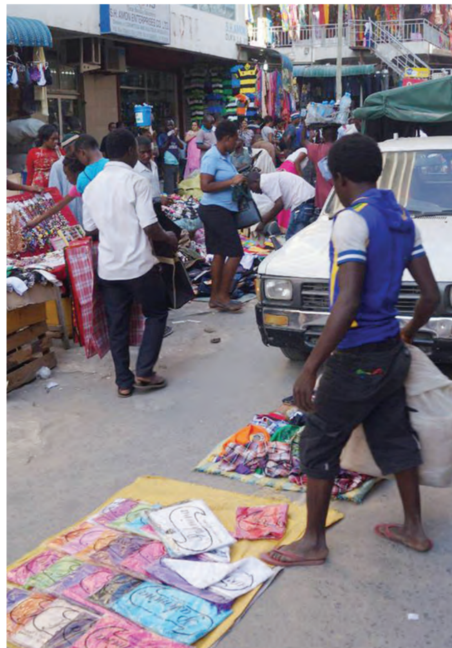
Young hawkers display their goods in the centre of the road in Dar es Salaam's Kariakoo market zone. Most of them have migrated from rural areas for greener pastures in urban cities

THE Centre for Good Governance and Development has advised youths to stop migrating to urban areas for doing petty businesses; instead, they should remain in rural areas while involving in different economic activities including farming, livestock keeping and commerce.