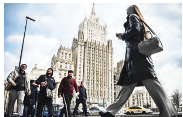
People walk past the Russian Foreign Ministry headquarters in Moscow on April 5, 2022. File photo

On Wednesday, Zelensky said his country stands ready for any format of prisoner exchange with Russia to free people from the besieged city of Mariupol.