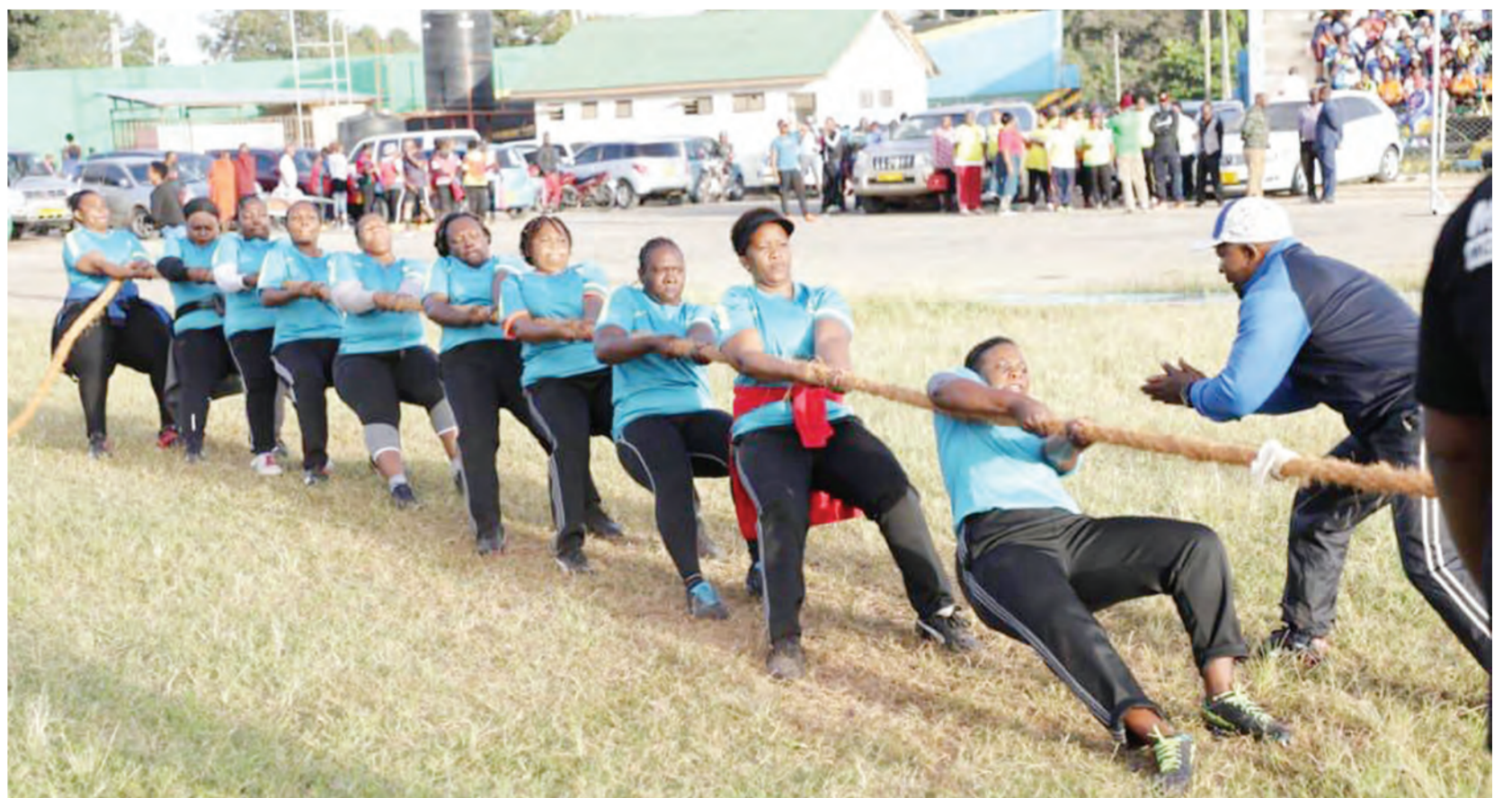
Tanzania Petroleum Development Corporation (TPDC) women's tug-of-war side, alias 'Queen Monsters', drag Ministry of Water's women squad (not pictured) during a game that ended with the former cruising to a 2-0 win.