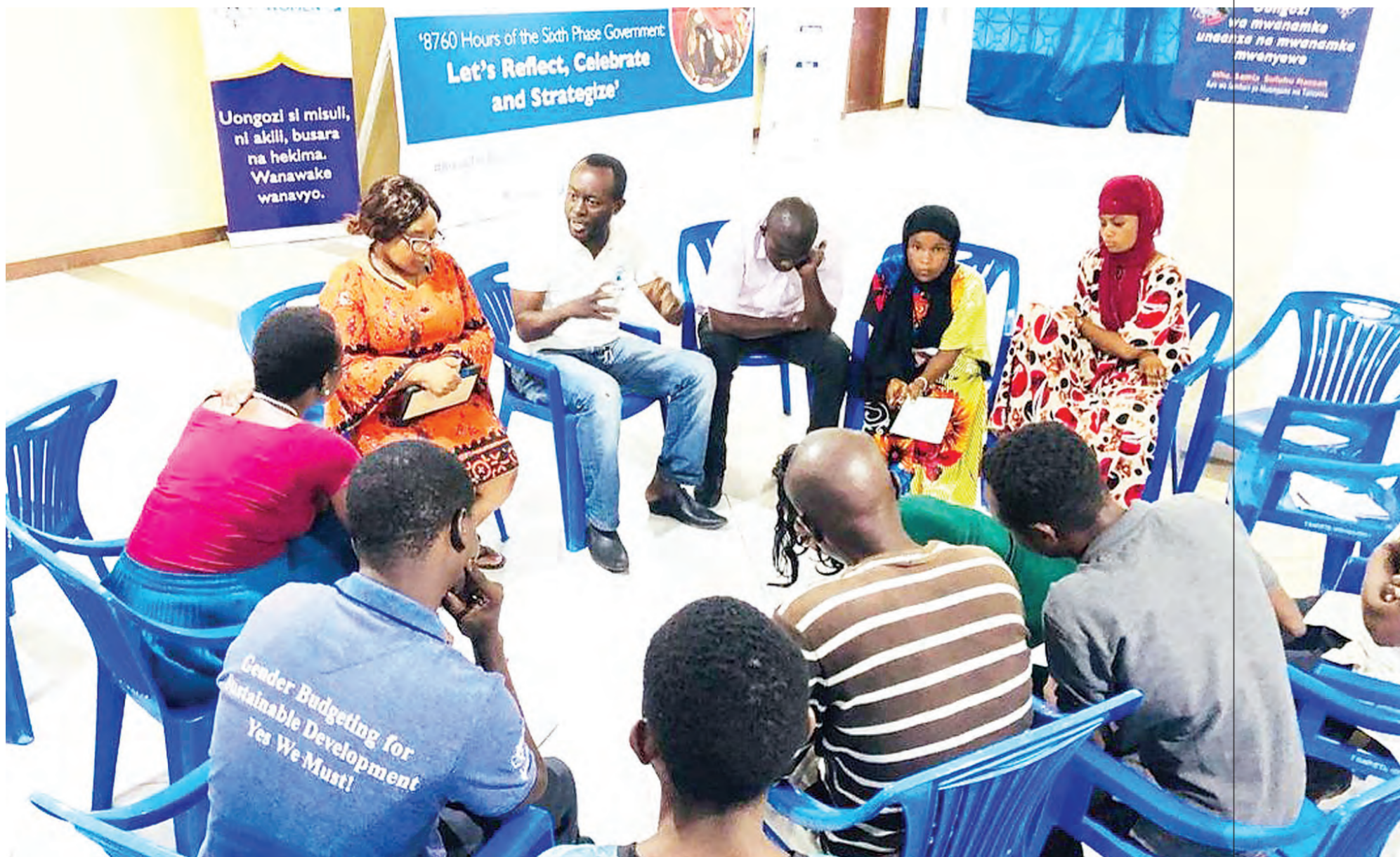
In progress on Wednesday is yet another weekly seminar organised by the Tanzania Gender Networking Programme (TGNP), the focus being on ways to boost healthcare for expectant women.

He added: "My audit found that there were rhino tourism guidelines and fees set for rhino tourism. However, until I completed my audit in November 2021, the special rhino tourism area was yet to be established due to a number of challenges."