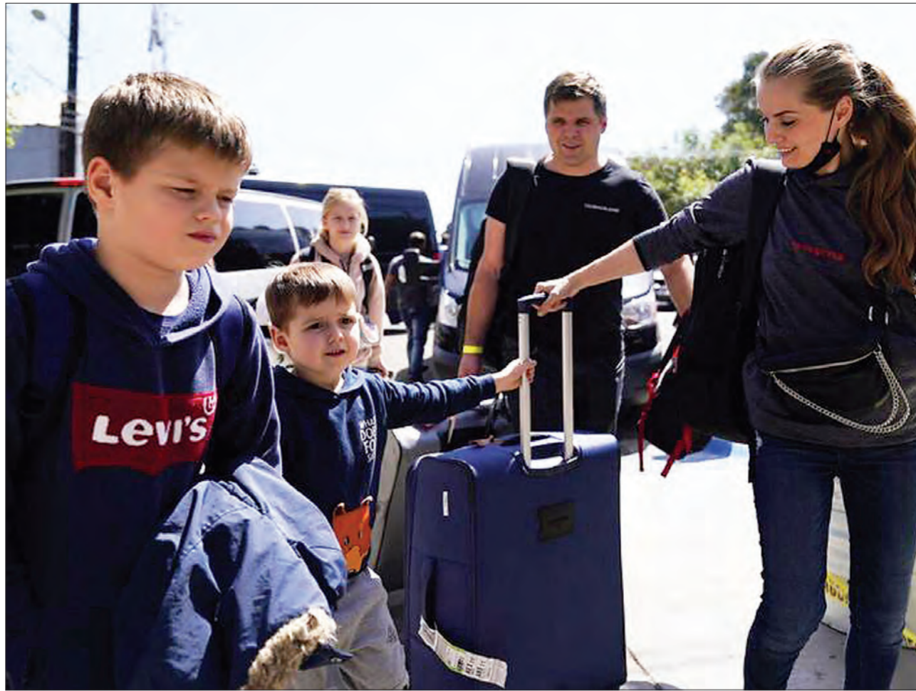
A group of Ukrainians arrive to a shelter, on Thursday in the border city of Tijuana, Mexico.