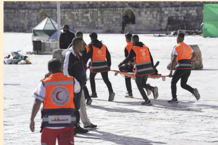
Palestinian medics evacuate a person wounded in clashes between protesters and Israeli police at the Al-Aqsa mosque compound, in Jerusalem's Old City, on Thursday.

Palestinians accuse Israel of not doing enough to enforce