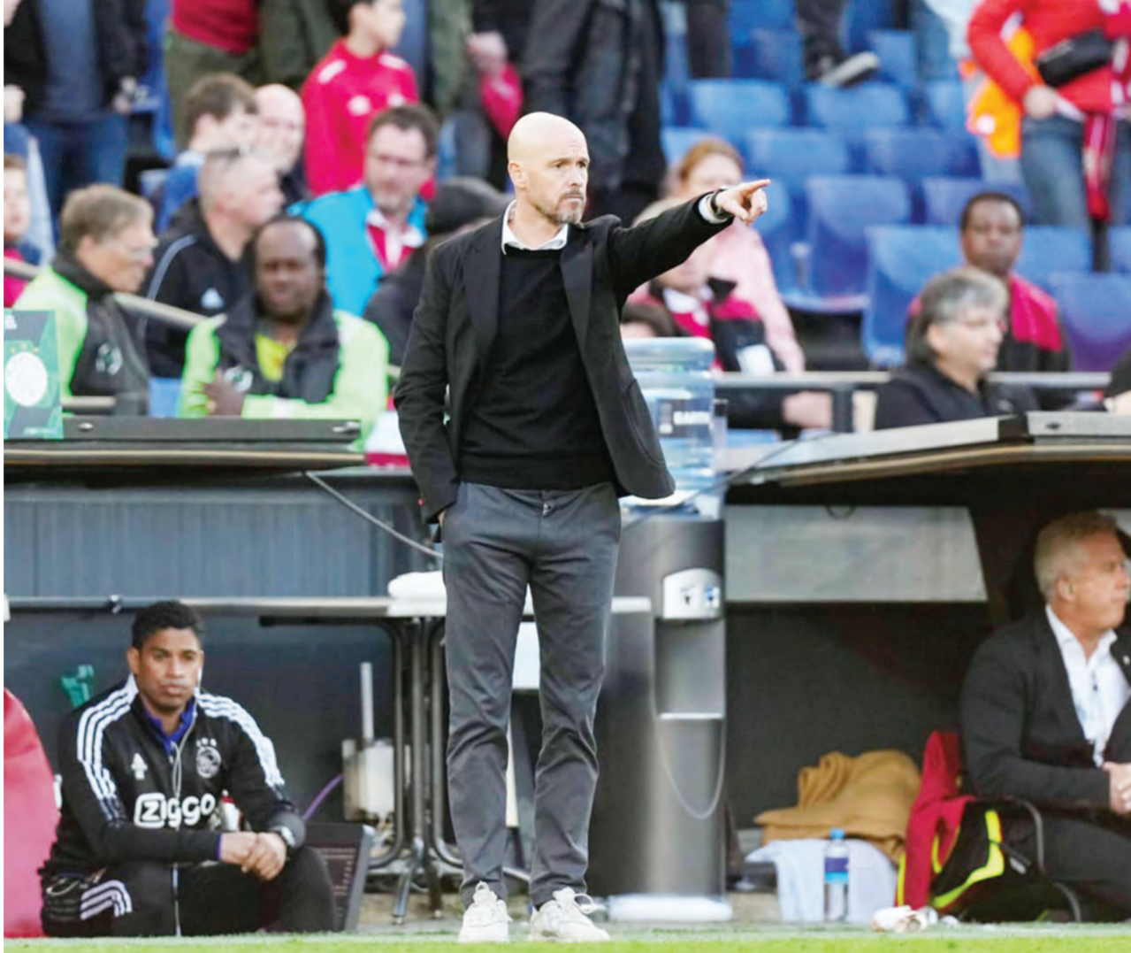
Erik ten Hag

Ten Hag's playing career was as a typical, run-of-the-mill Eredivisie central midfielder. He had three spells at FC Twente, while also playing for De Graafschap, RKC Waalwijk and Utrecht. He played alongside Hans Kraay Jr. at De Graafschap and the