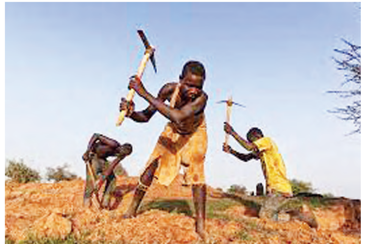
Farmers perennial conflict with miners over the latter superseding the former, headline a cocktail of reforms in a proposed mining bill to repeal provisions which give mining supremacy over other activities.

However, a modest number of farmers might have to move. They need to be able to stay near their old homes and have new homes built, and then they are able to benefit with the rest of their community from the new