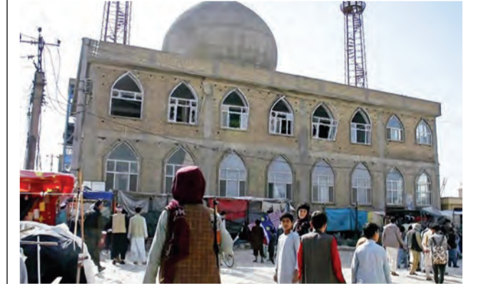
This frame grab image from video shows a Taliban fighter standing guard outside the site of a bomb explosion inside a mosque, in Mazar-e-Sharif, Afghanistan on Thursday.

Afghanistan's Taliban rulers say they have secured the country since taking power in August, but international officials and analysts say the risk of a resurgence in militancy remains and the Islamic State militant group has claimed several attacks.