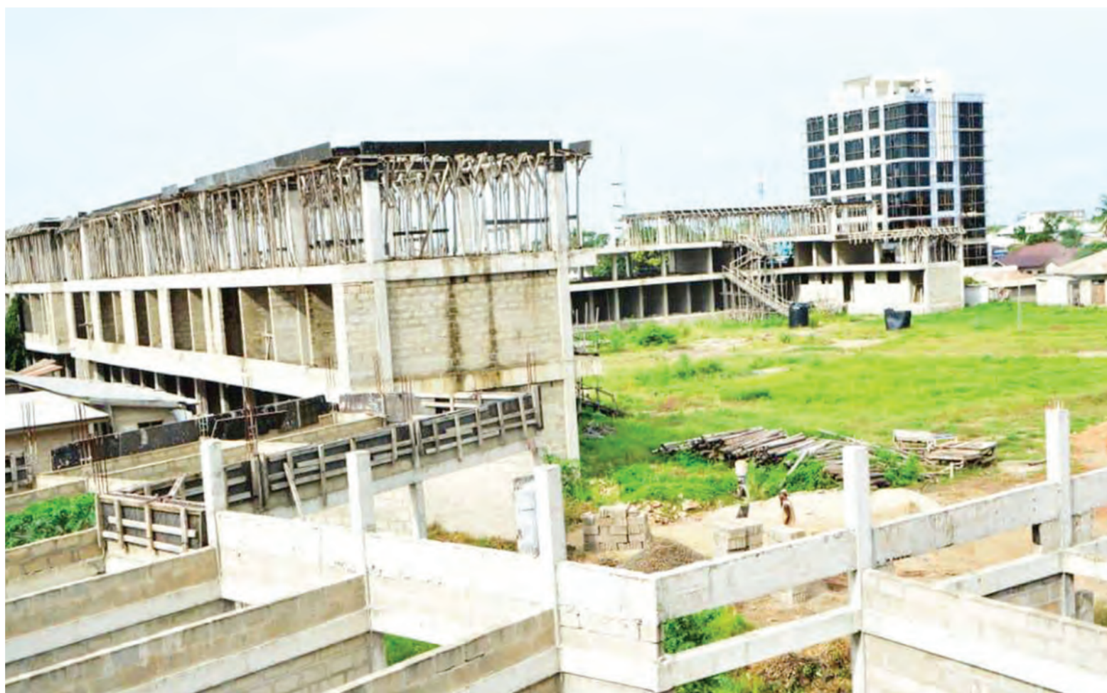
This is the current state of a section of what is meant to develop into a modern commuter bus stand at Mwenge in Dar es Salaam's Kinondoni Municipality but whose construction has stalled for quite some time now.

Kenyan peacekeepers are still serving in southern Somalia despite the country being subjected to periodic terrorist attacks for the campaign against the hardline Al Shabaab group linked with Al Qaeda.