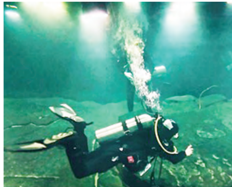
A diver carries out underwater tasks at the Baiheliang Underwater Museum located in the middle of the Yangtze River, southwest China's Chongqing municipality.

A huge container was built at tens of meters below the water surface to envelop the core part of the inscriptions on the ridge. To ensure the