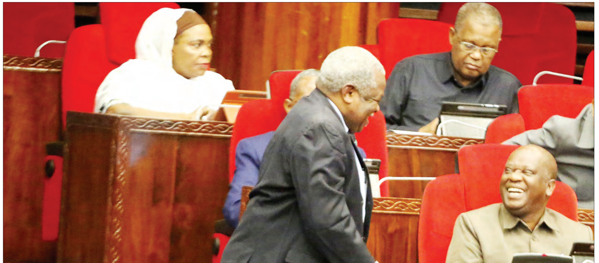
Capt (rtd) George Huruma Mkuchika (L), Minister of State in the President's Office (Special Duties), engages in a hearty exchange of greetings with Kongwa legislator and immediate past National Assembly Speaker Job Yustino Ndugai (R, foreground) during one of yesterday's sessions of the House's ongoing Budget meeting in Dodoma city.

"I urge the NHC to involve the government in finding a better way to resolve issues that are delaying the completion of the Kawe project," he added.