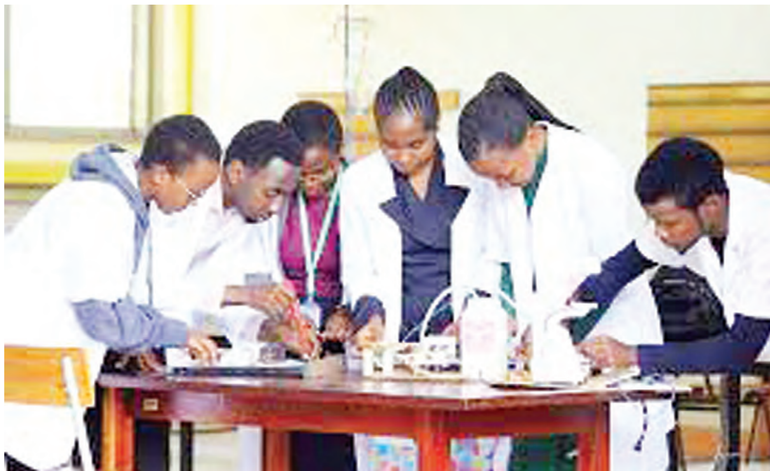
Some ATC students in laboratory

"Imagine organizing an entrepreneurship week for ATC students and receiving a plan to extend an existing business! This woman has a small business already and has requested the judges for a fund to expand her business even