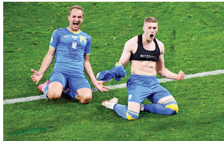
Ukraine's Artem Dovbyk (right) celebrates scoring the winner against Sweden in their last-16 match.

It had been a scorching, sunny day in Glasgow and as the two teams kicked off the obvious change was that Ukraine had game-planned for the Swedes. Andriy Shevchenko switched to a three-man back line after going 4-3-3 in the group games. The goal was to blunt the Swedes' young dynamos up front – Alexander Isak and Dejan Kulusevski – while, just as importantly, freeing Olek-