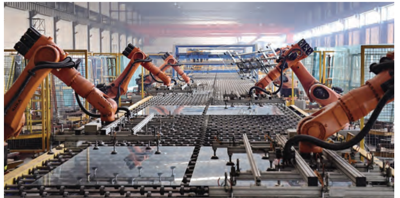
A number of technologically advanced automated float glass production lines built by an enterprise in Shahe, Hebei Province, known as the Glass City in China, based on technological transformation, innovation and introduction of intelligence.