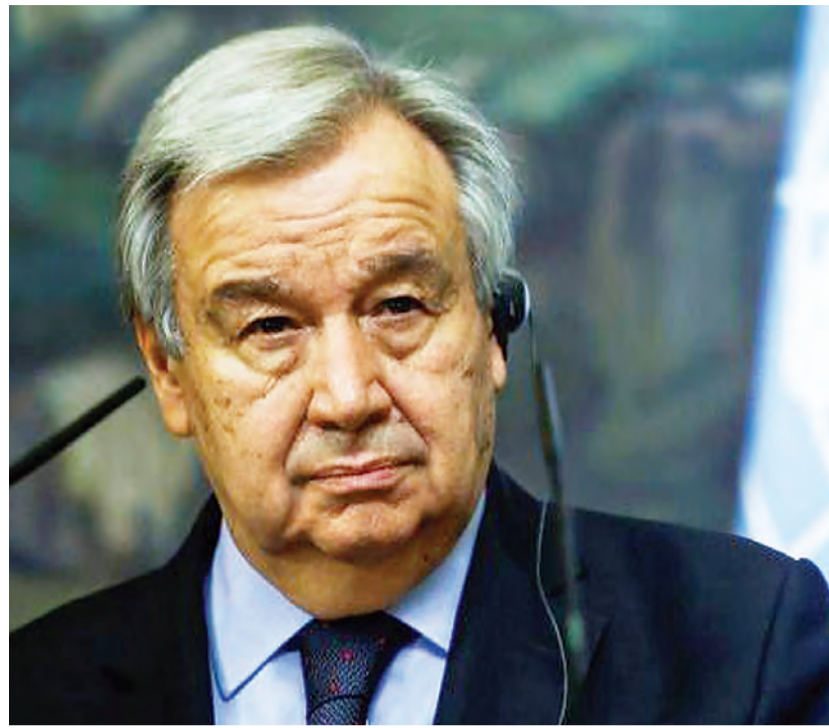
Former South African president Jacob Zuma

Guterres' appeal to Washington comes amid talks to revive the deal - known as the Joint Comprehensive Plan of Action - under which Iran accepted curbs on its nuclear programme in return for a lifting of many foreign sanctions against it.