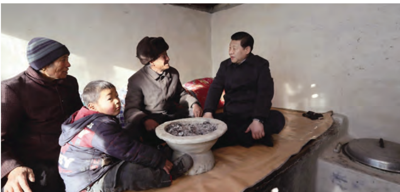
Xi Jinping visiting poverty-stricken people in Fuping County, Hebei Province. What is important about completing a moderately prosperous society in all respects is the term "in all respects."