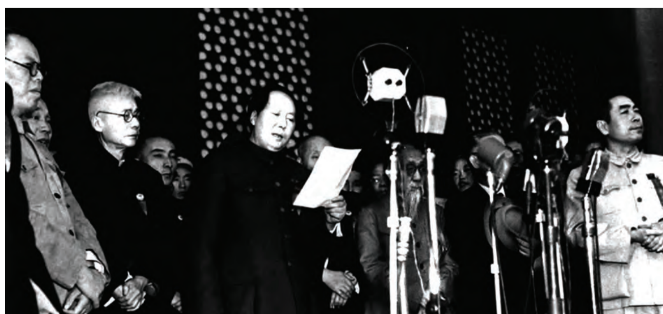
At 3 p.m. on October 1, 1949, the Founding Ceremony of the People's Republic of China was solemnly held in Tian'anmen Square, Beijing. Mao Zedong solemnly proclaimed, "The Central People's Government of the People's Republic of China has been established today."