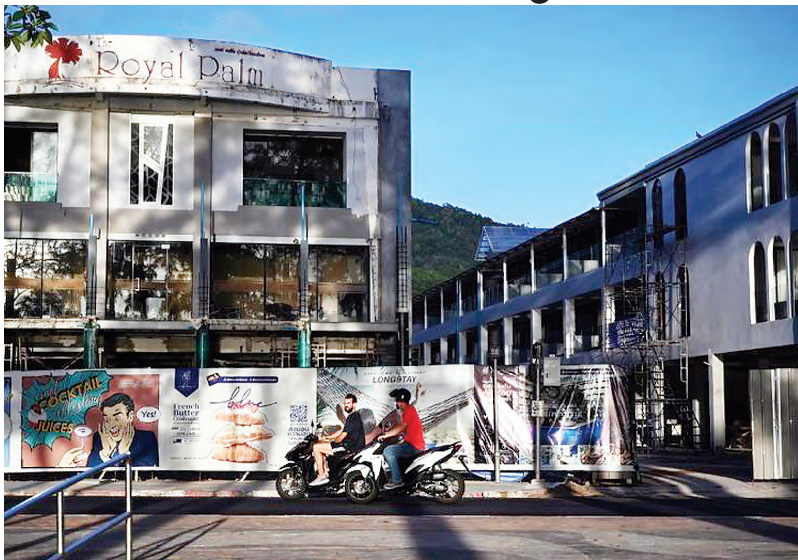
This photo taken on June 29, 2021 shows people riding past empty shophouses closed by the economic impact of the coronavirus, on Patong Beach in Phuket.

"In international tourism we are at levels of 30 years ago, so basically we are in the '80s ... Many livelihoods are really at threat," said Zoritsa Urošević, Geneva representative of the