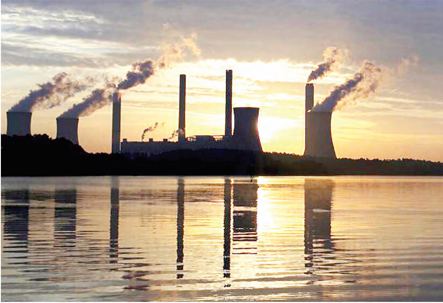
In this June, 3, 2017 photo, the sun sets behind Georgia Power's coal-fired Plant Scherer, one of the nation's top carbon dioxide emitters, in Juliette, Georgia.