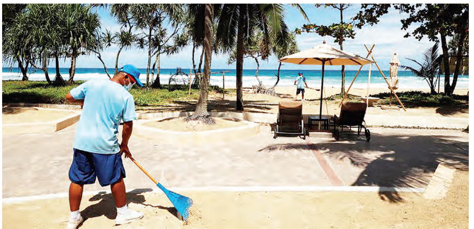
Phuket gets ready to open to overseas tourists

"Our spa couldn't reopen because it requires the cost of utilities, staff, and rent," she added.