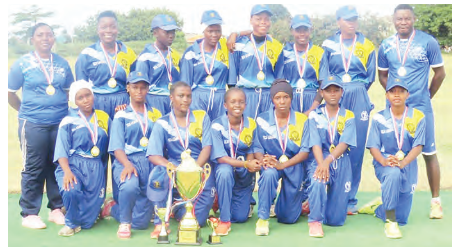
Tanga Women Combine's cricketers pictured with a trophy after completion of the 2021 National Women T20 Championship, which took place in Tanga from June 18-27. Tanga Women Combine lifted the tournament silverware, edging Dar Women Combine by five runs in the final.