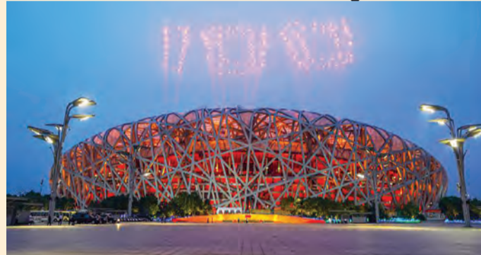
Fireworks are seen above the National Stadium in Beijing, capital of China, on the evening of June 28, 2021. An art performance titled "The Great Journey" was held in Beijing on Monday evening in celebration of the 100th anniversary of the founding of the Communist Party of China (CPC).

At its conception, the CPC established its original aspiration and mission - seeking happiness for the Chinese people and rejuvenation for the Chinese nation. A century on from its founding, the Party's leader-