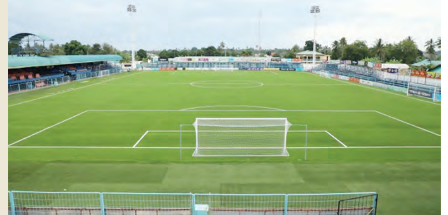
Azam Football Club's stadium, Azam Complex.

It is hard to see how sports and games can be lifted, or stakeholders make use of tax reductions across the board, for lo-