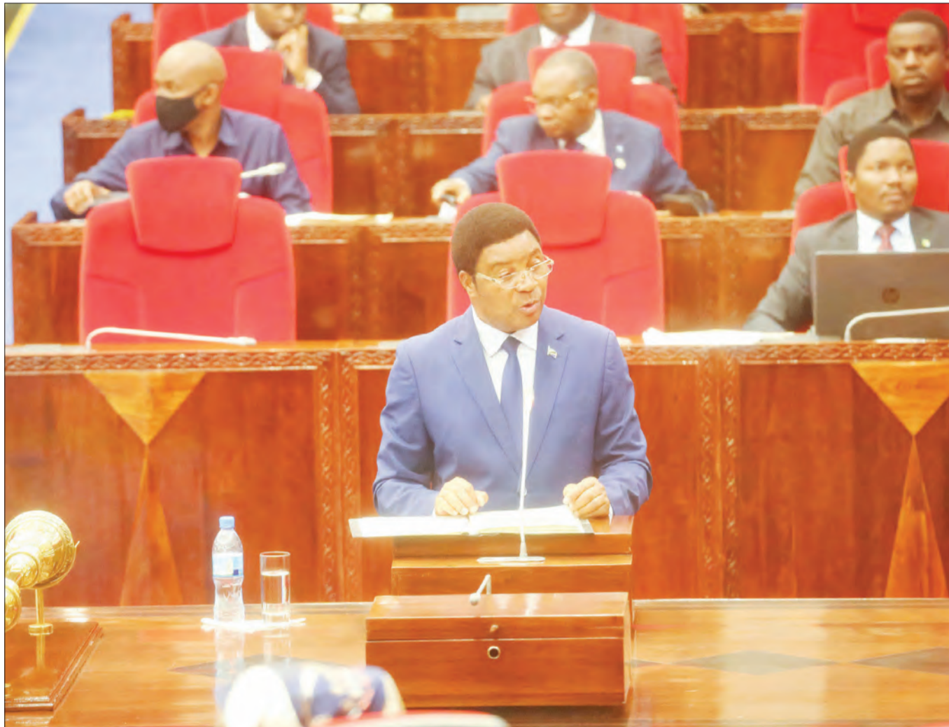
Prime Minister Kassim Majaliwa delivers speech to adjourn the National Assembly in Dodoma yesterday.