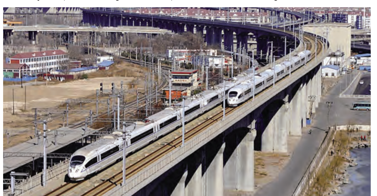
A high-speed railroad in operation on the viaduct of Tianjin North Railway Station. In 2008, China's high-speed railroads at world-class level for which China owns complete independent intellectual property rights were opened for operation.