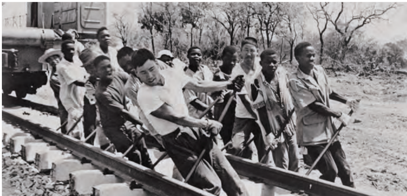
Builders from China, Tanzania and Zambia participating in the construction of the railroad together. In July 1976, the full line of the Tanzania-Zambia Railway, jointly built by China, Tanzania and Zambia, was officially opened to traffic. The 1,860.5-kilometer-long railway was one of the largest foreign aid package projects of China and has become a monument of China-Africa friendship.

Mizengo Peter Pinda Former Prime Minister of the United Republic of Tanzania; Vice-Chairman of the Tanzania China Friendship Promotion Association; Member of the Central Committee of the Chama cha Mapinduzi (CCM) Party; 29 June, 2021