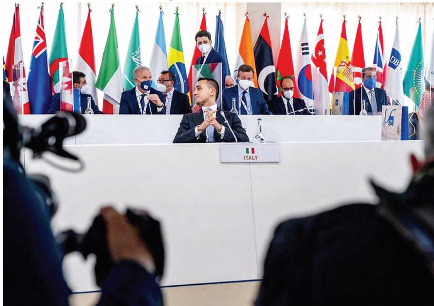
Italy's Foreign Minister Luigi Di Maio (front, center) sits down to begin a G20 foreign ministers meeting in Matera, Italy, on Monday.