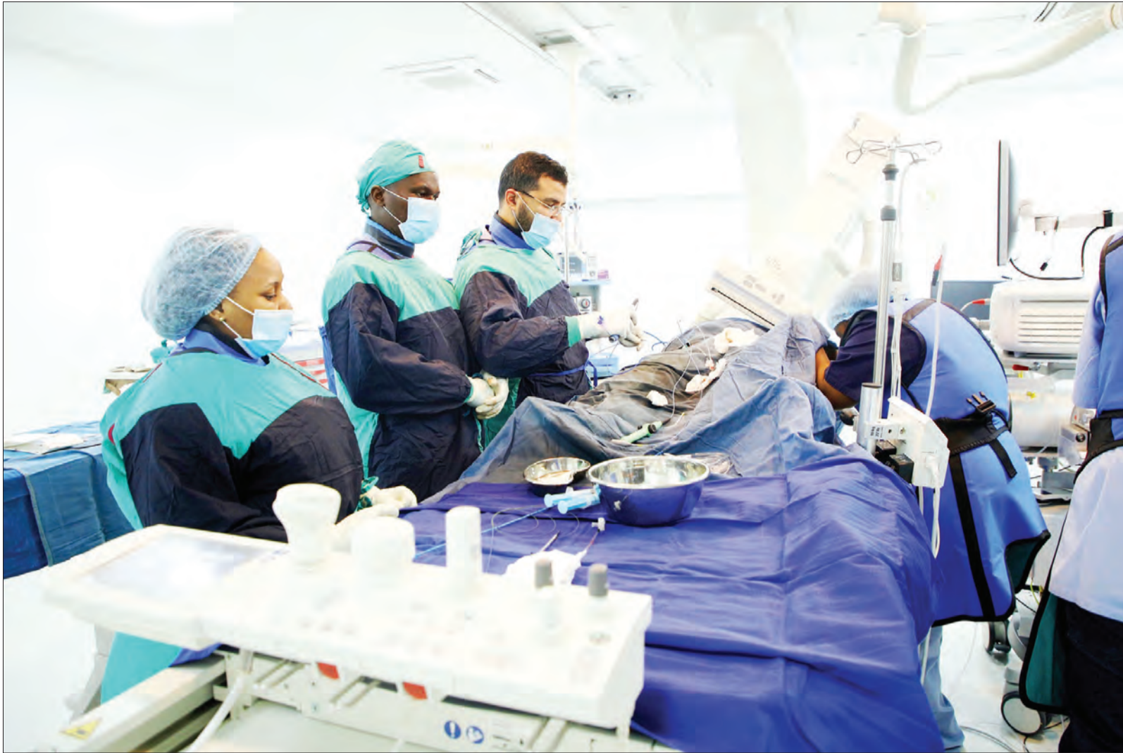
Jakaya Kikwete Cardiac Institute surgeons in collaboration with their colleagues from Shifa Hospital of Egypt attend to tachycardia patient at a three day special camp held at JKCI in Dar es Salaam recently.