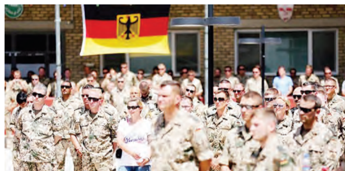
Soldiers of the German armed forces Bundeswehr listen to a speech of the visiting German Chancellor at the Bundeswehr base in Mazar-i-Sharif, Afghanistan.

Over the last years, Germany had the second largest contingent of troops after the United States in Afghanistan,