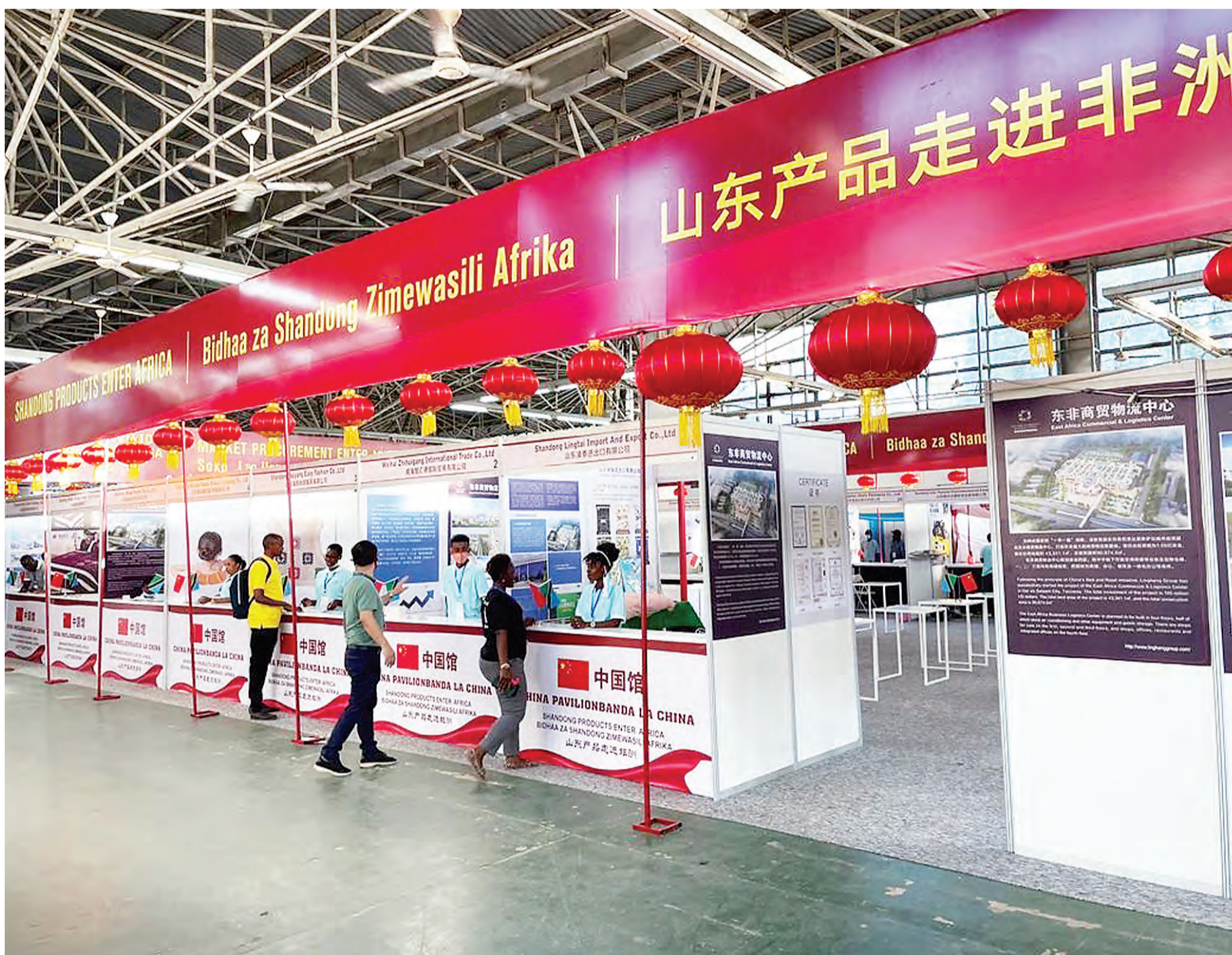
Chinese exhibitors displaying their merchandise under one roof at the ongoing 45th DITF being held in Dar es Salaam since Monday.

According to the official data from Tanzania Trade Development Authority, China has brought the largest number of exhibitors at the 45th DITF. Out of the 54 international exhibitors, China has 32 which accounts for almost 60 percent.