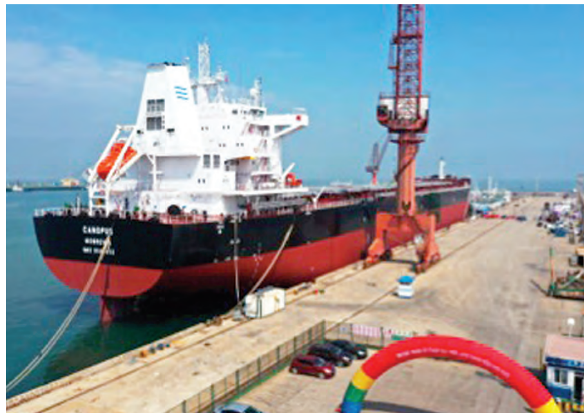
A cargo ship built by Penglai Zhongbai Jinglu Ship Industry Co., Ltd. is delivered to Lavinia Corp from Greece, April 26, 2021. (File photo)

CHINA has become a powerhouse of water transport with international influence and is embracing a new journey of water transport construction, Vice-Minister of Transport Zhao Chongjiu told a press conference on June 24.