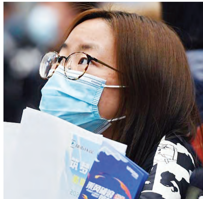
A graduating student searches for job opportunities at a job matching fair at Tsinghua University in Beijing, China, March 16, 2021.

He said that government services offering job information and helping incubate companies have also been enhanced.