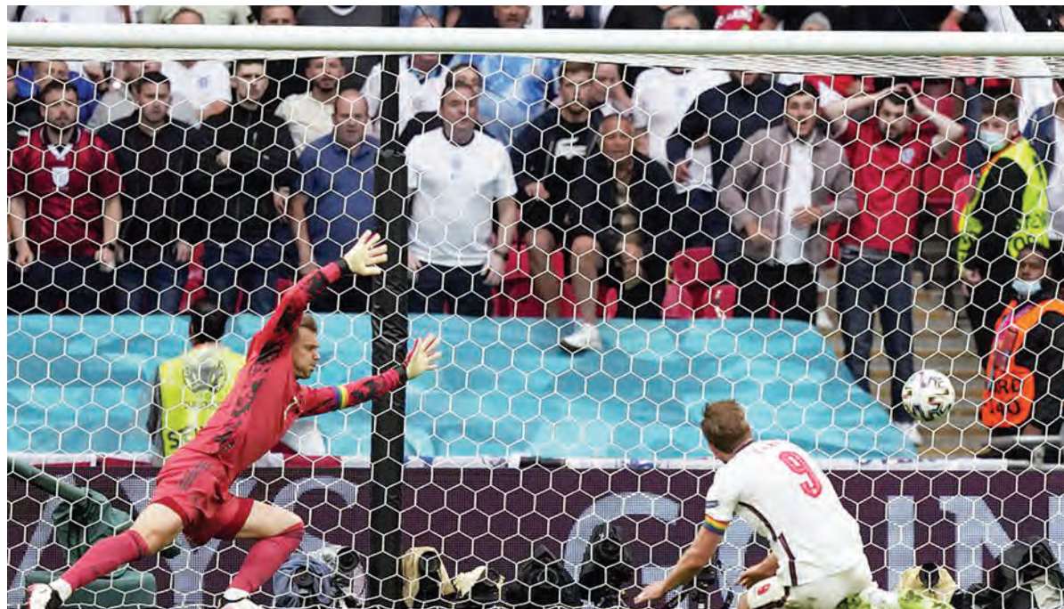
England's Harry Kane, right, scores his side's second goal during the Euro 2020 soccer championship round of 16 match between England and Germany at Wembley stadium in London, Tuesday, June 29, 2021.

Not that it came easily. Just like in England's two group wins, Raheem Sterling was on the scoresheet, breaking the tense deadlock in the 75th minute. But this time Harry Kane finally scored his first goal at Euro 2020, easing the pressure on the 2018 World Cup Golden Boot winner's shoulders. "With all the expectation and pressure, we delivered," Kane said. "It's a moment none of us will