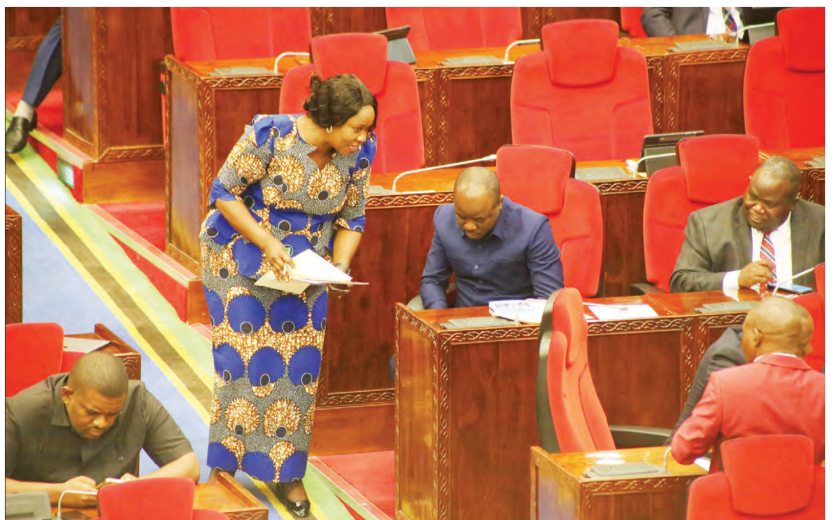
Water minister Jumaa Aweso (R) in discussion with Natural Resources and Tourism deputy minister Mary Masanja in the National Assembly in Dodoma yesterday.

Women must have access to finance, production networks and markets to be extremely involved in cross-border trade which will innovate and develop their skills in trade and participate in e-commerce