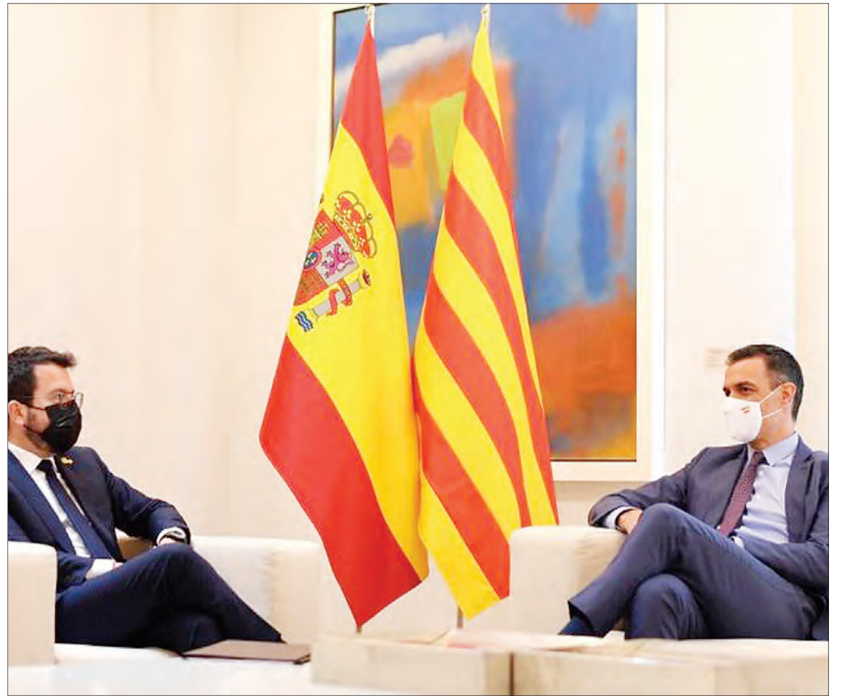
Spain's Prime Minister Pedro Sanchez (left) meets with Catalan regional president Pere Aragonés at the Moncloa Palace in Madrid on June 29, 2021.

A court spokesperson said the document was not pub-