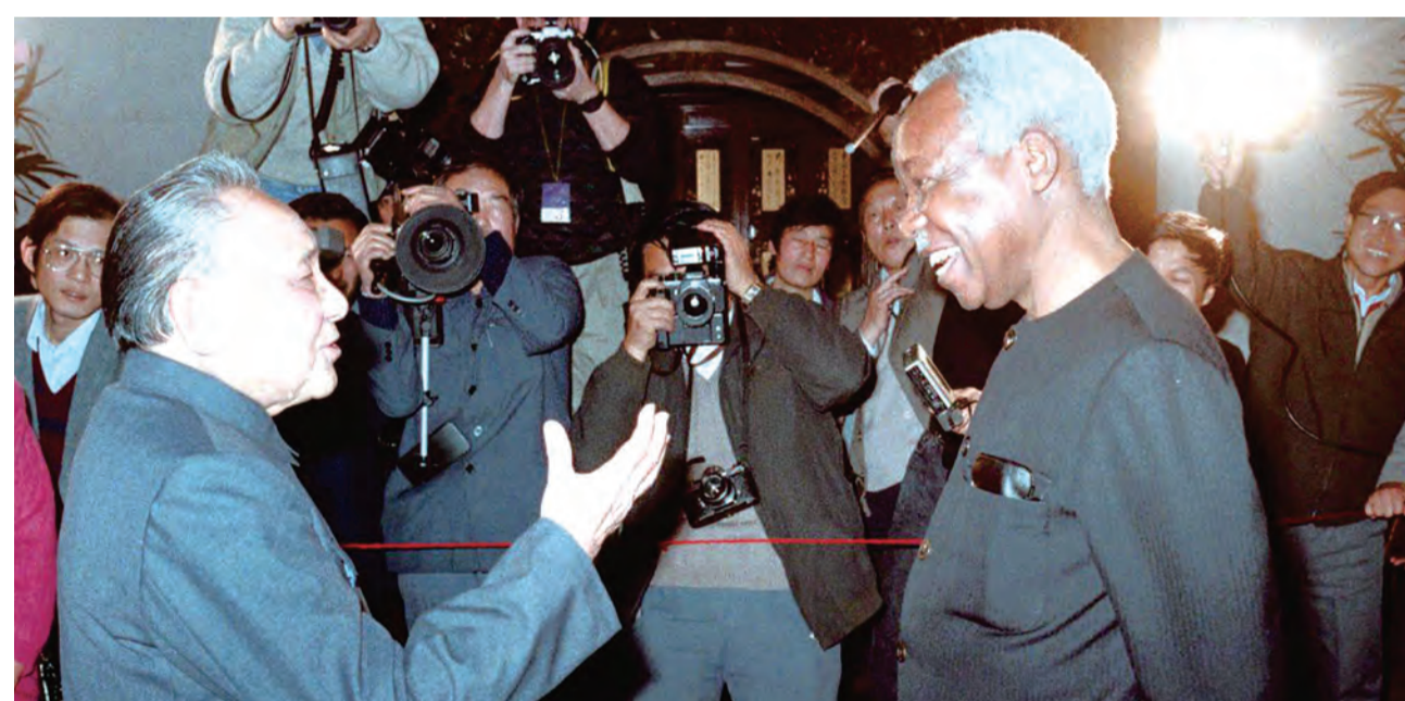
Chinese leader Deng Xiaoping talked to Tanzanian first President Mwalimu Julius Kambarege Nyerere in Beijing on November 23, 1989.