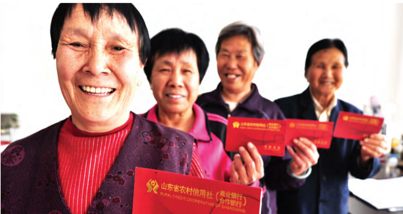
Senior citizens in Zouping County, Shandong Province, receiving their basic pensions. China continues to deepen social security reform in accordance with the policy of achieving universal coverage, guaranteeing basic needs, and providing multilevel and sustainable social security. It has gradually established the world's largest, multilevel social security system covering both urban and rural residents.