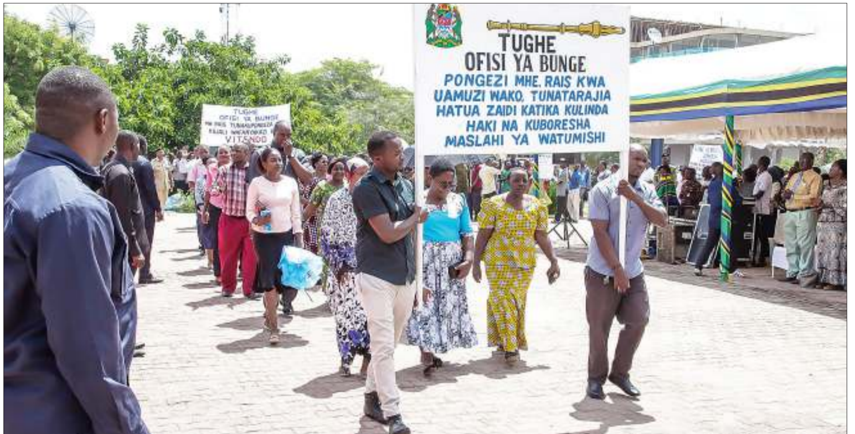
Employees carry placards bearing various messages during past May Day celebrations in Tanzania. File photo

According to the explanation, excessive monetary liquidity (easy credit, large disposable incomes) potentially occurs while fractional reserve banks