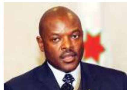
abuses amid the political turmoil. ICC judges authorized an investigation into allegations of state-sponsored crimes including murder, rape and torture - a

The government has long been angered by UN reports describing alleged