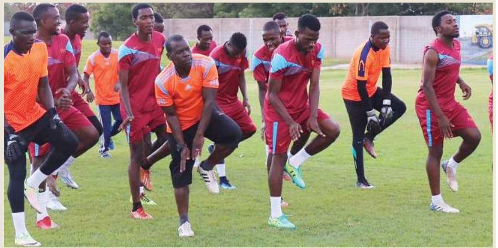
Lipuli FC players attend training session in Iringa recently to shape up the ongoing Mainland Premier League.