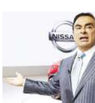
Nissan Motor Co Chief Executive Ghosn, speaks at the 44th Tokyo Motor Show in Tokyo last year.

The car industry veteran, who oversaw the Nissan-Renault-Mitsubishi alliance that produces about 11 million cars annually, was arrested for understating his earnings and misusing Nissan funds to purchase properties in four cities outside Japan. Mr Ghosn has denied any claims of wrongdoing. In his first court appearance in January, the former chief executive said he was a target and victim of corporate politics.