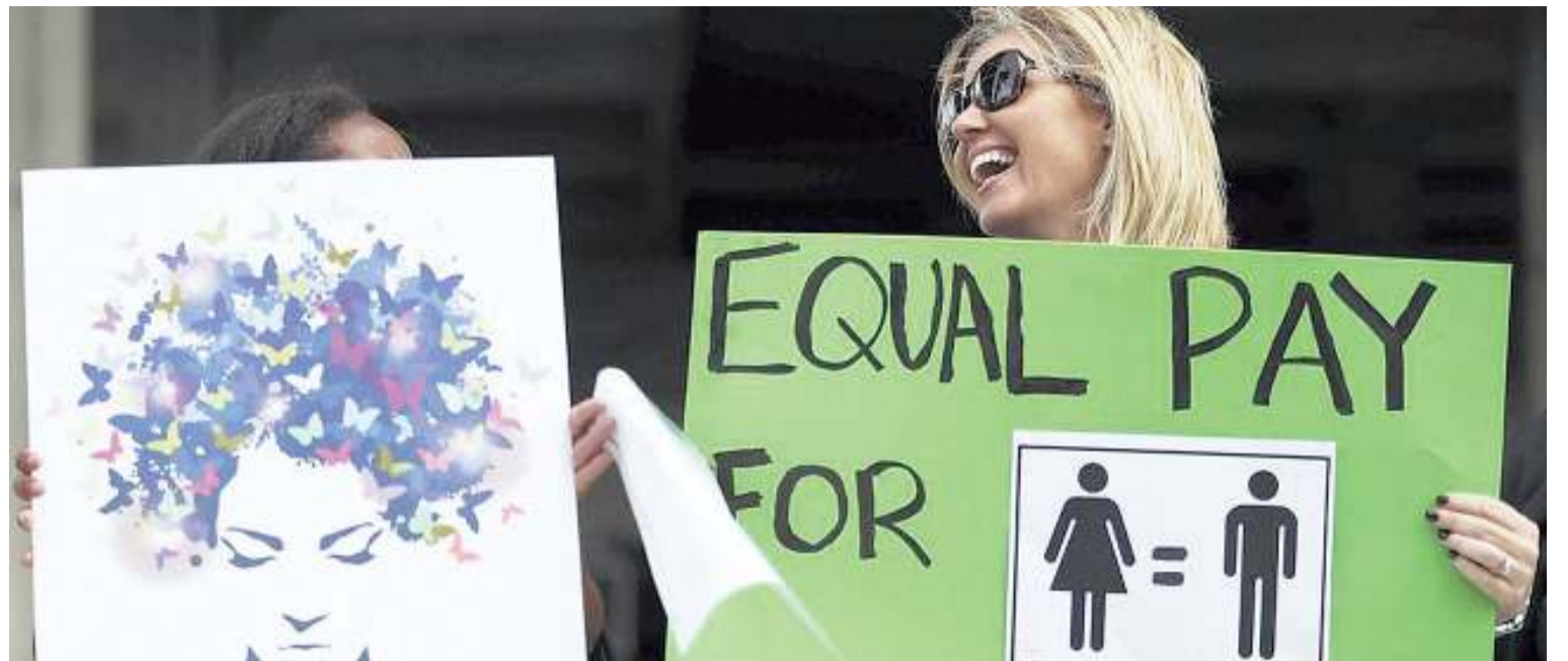
More work needs to be done to grow the female labour force worldwide, a PwC report said.

The report said that China and India are mak-