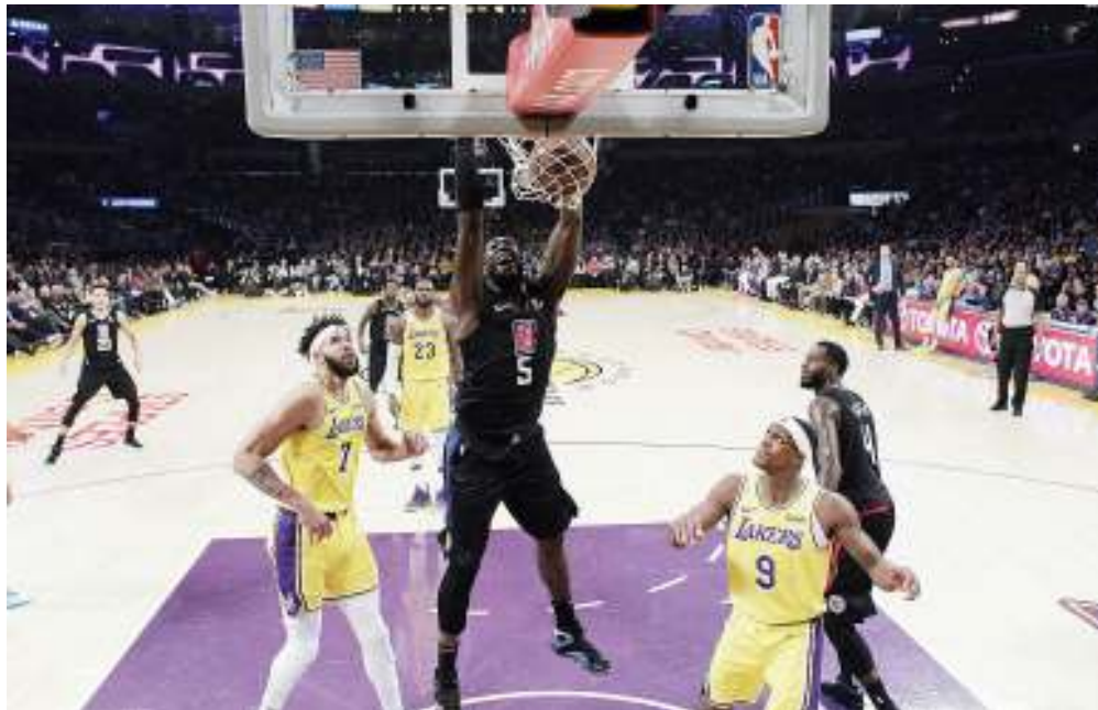
Los Angeles Clippers' Montrezl Harrell (5) dunks between Los Angeles Lakers' JaVale McGee (7) and Rajon Rondo (9) during the first half of an NBA basketball game, Monday, March 4, 2019, in Los Angeles.