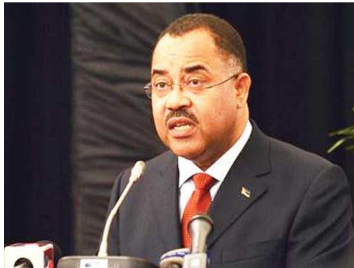
Mozambique's ex-finance minister, Manuel Chang sits in a South African court.

"Financial institutions should therefore ensure that all cards issued in the market are EMV compliant by 31 March 2019," notes the central bank.