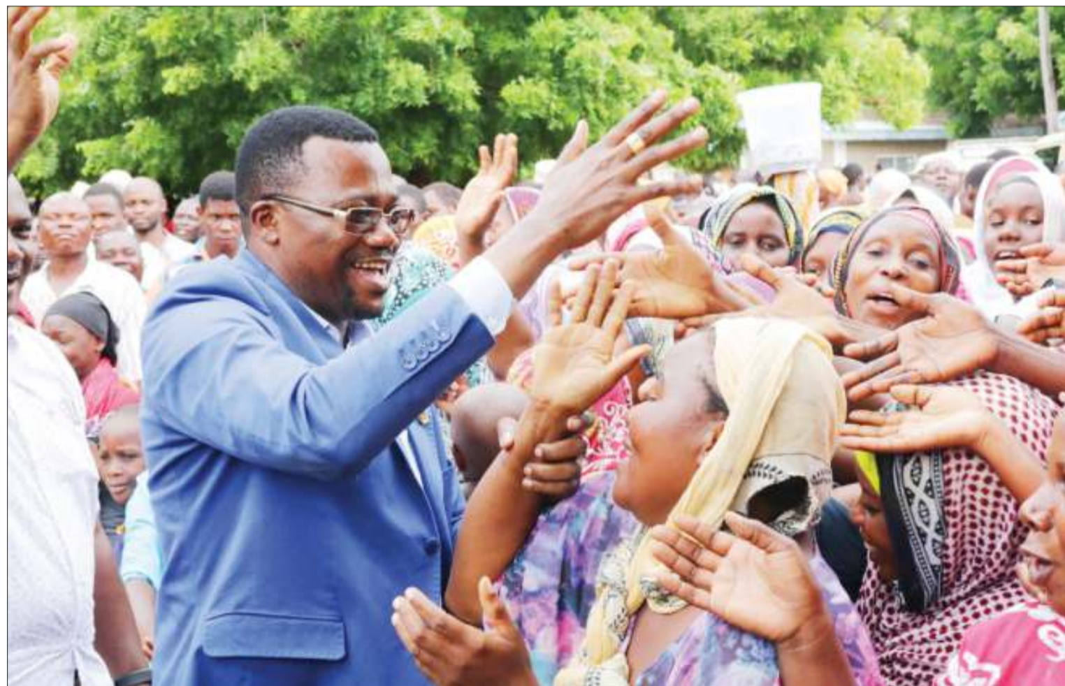
Livestock and Fisheries minister Luhaga Mpina greets residents of Kilwa Kivinje in Lindi Region at the weekend shortly after listening to fishermen. He then announced the establishment of an extended zone for the defence of fisheries resources along the Indian Ocean coastline.