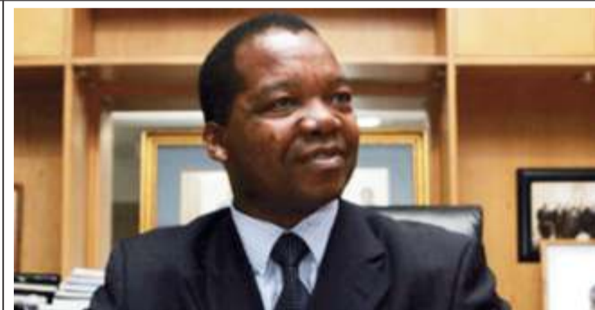
Central Bank Governor John Mangudya

Three former Credit Suisse workers have been arrested in the UK on warrants from the US, while Mozambique's ex-finance minister, Manuel Chang, was arrested in South Africa as part of the same case.