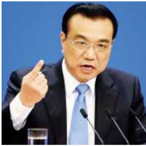
(pictured) admitted that China faced severe challenges caused by the growing

Speaking at the opening meeting of the second annual session of the 13th National People's Congress, Premier Li Keqiang