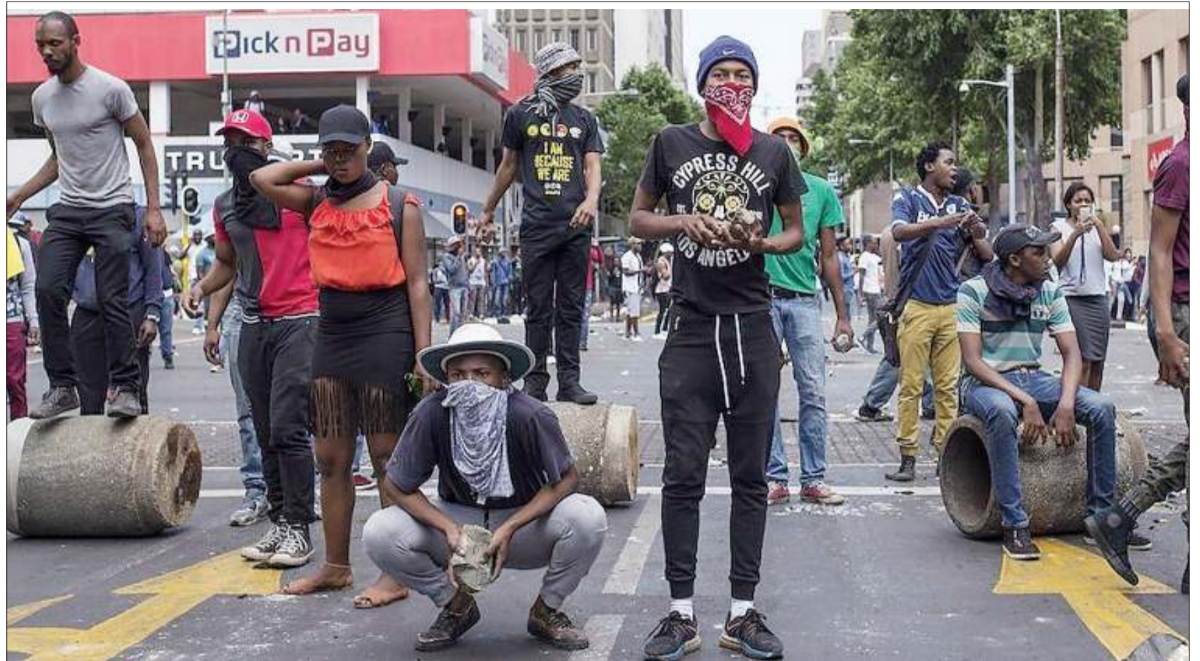
Vigilantism is both a symptom and cause of a society where violence has become normalised.

The cases that usually make it into the media are those in which suspects are killed. Death normally happens through beatings or stoning, but the most notorious method is apartheid-style 'necklacing', where a car tyre is placed around the suspect and set alight.