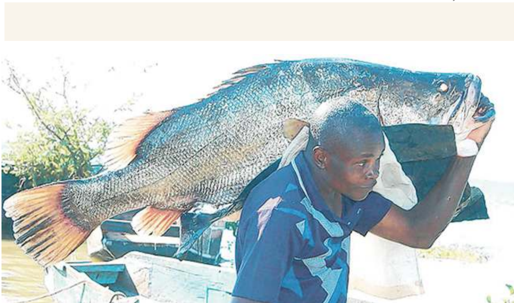
Artisanal fishermen carrying a giant Nile perch on the Mwanza city shores of Lake Victoria. File photo.

The LVFO report further noted that Uganda's Nile Perch production dropped from 513,133 tonnes in 2014 to 393,353 tonnes while Kenya production reduced from 1,230,247 tonnes to 851,461 tonnes. The survey did not involve Sato which was also badly affected.