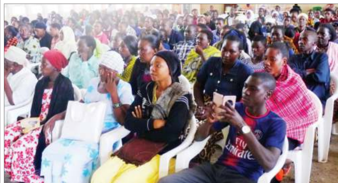
Entrepreneurs follow a presentation at a business development seminar in Shinyanga municipality yesterday.