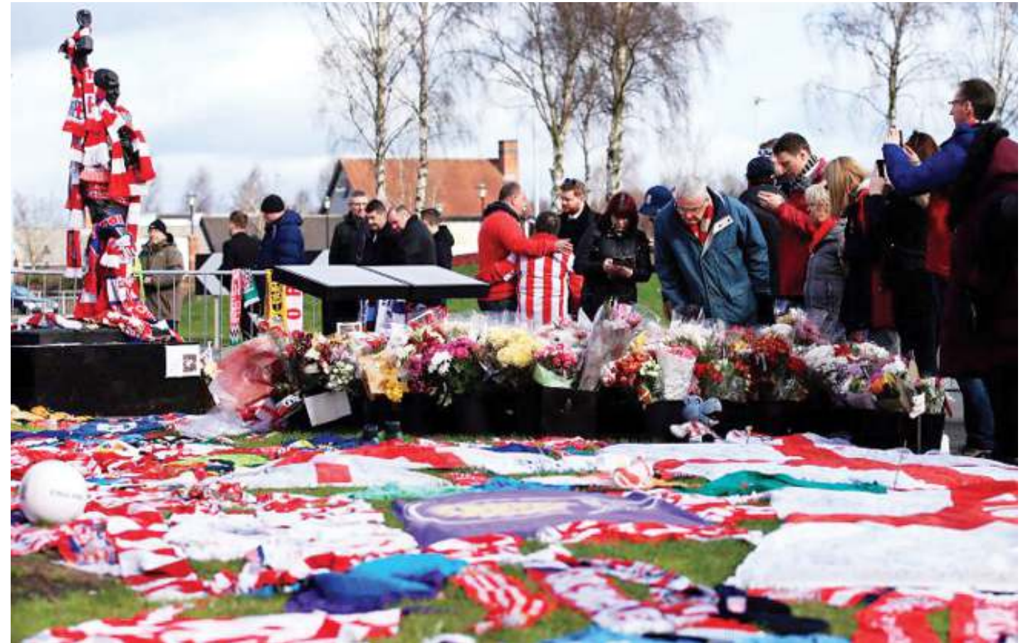
People look at the statue of former England World Cup winning goalkeeper Gordon Banks surrounded with tributes outside the stadium at Stoke-upon-Trent, Britain on March 4.