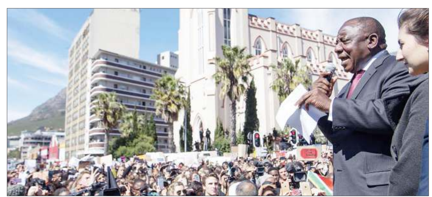
People gather during a gender-based violence demonstration outside Parliament, following the rape and murder of a UCT student. Cape Town on Thursday. South African President Cyril Ramaphosa skipped the World Economic Forum to address thousands of Capetonians most dressed in black, where he said laws were to be changed with regards to violence and rape.

Later, police opened water cannon on the protesters and used stun grenades against them; in Johannesburg, where looters and arsonists targeted migrant traders, there was no such