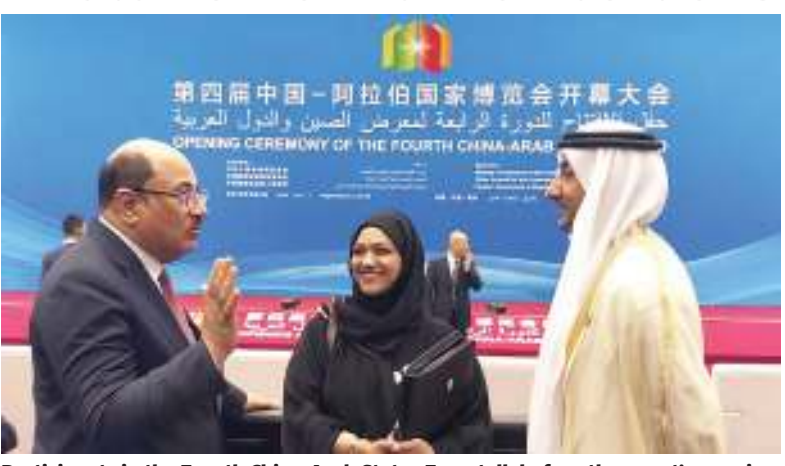
Participants in the Fourth China-Arab States Expo talk before the event's opening ceremony in Yinchuan, the Ningxia Hui autonomous region, on Thursday.

ing of the China-Arab States Coopera- nology, modern agriculture, lotion Forum held in Beijing in July last year, the two sides agreed to establish a future-oriented strategic partnership of comprehensive cooperation and common development.