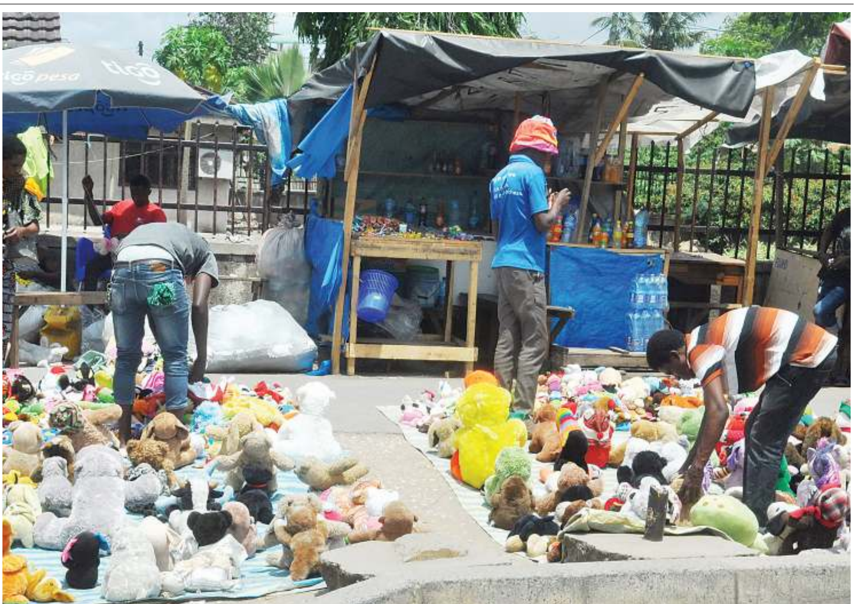
Toys put up for sale at a makeshift open-air 'market' along the Ilala Boma stretch of Dar es Salaam's Uhuru Street, as found yesterday.

2007: "Our economy is a hundred times better, than the average African economy. Outside South Africa, what country is [as good as] Zimbabwe? ... What is lacking now are goods on the shelves - that is all."