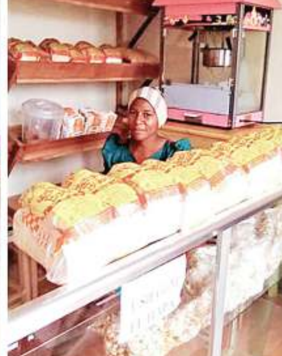
A combo photo of Kigoma women entrepreneurs who have benefited from UN Women funded Energy 4 Impact Project.

ing, hair cutting/beauty salons, stationery/photocopying, phone charging/repairs, etc), trading (shops, kiosks, etc) and crop growing.