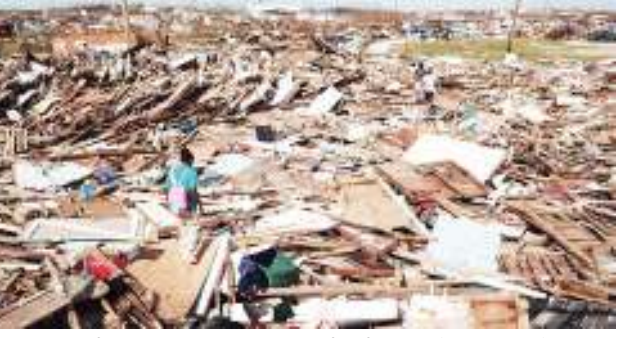
The extensive damage and destruction in the aftermath of Hurricane Dorian is seen in The Mudd, Great Abaco, Bahamas, on Thursday.

American Airlines said it flew a Boeing 737 from Miami to Nassau to drop off 14,000 pounds of relief supplies. The airline is also giving frequent-flyer points to customers who donate at least US$25 to the Red Cross.