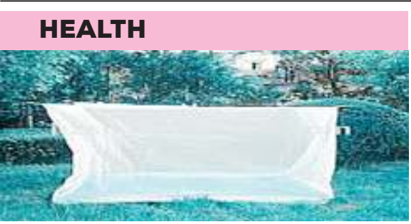
INSECTICIDE-TREATED NETS PROJECT COMES TO AN END PAGE 4