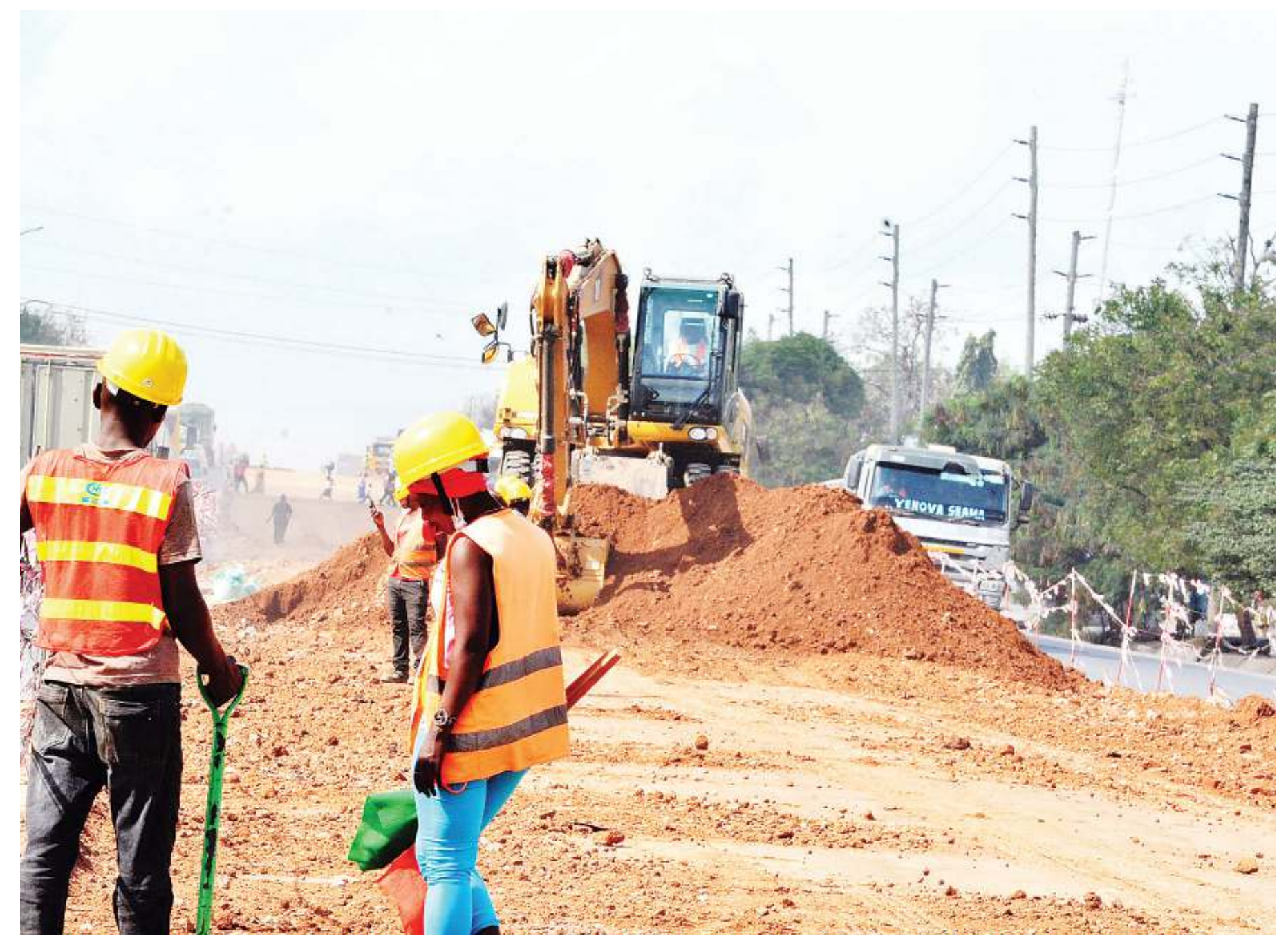
Implementation of the Dar es Salaam rapid transit bus infrastructural project has begun in earnest along the city's Kilwa Road, as found at Mabagala Kizuiani yesterday.

The system of agriculture industry in Tanzania promotes the reliance on agrochemicals, both synthetic fertilisers and pesticides. Agriculture, which includes horticulture, continues to play a predominant role in Tanzanian economy since it contributes about over 45 per cent of the Gross Domestic Product (GDP), generates about 60 per cent of the total export earnings and employs about 80 per cent of the labour force.