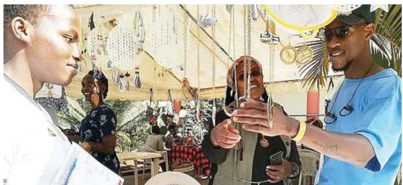
A 'Maasai' market in Nairobi