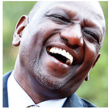
Kenyan president-elect William Ruto

As a consequence of the tribal make-up of Kenyan society, Ruto particularly drew attention to his home-ground in the Rift Valley as an area of potential electoral malfeasance, while others expressed concerns about the potential for violence, especially in the highly