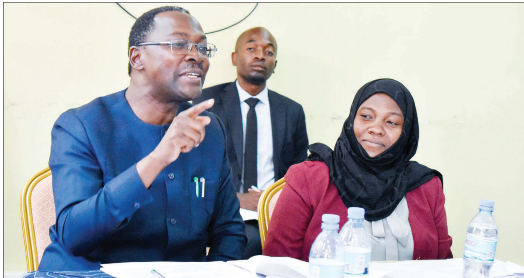
George Simbachawene (L), Minister of State in the Prime Minister's Office (Policy, Parliament and Coordination), contributes to parliamentary committee debate on a proposed bill on disaster management in Dodoma city yesterday.