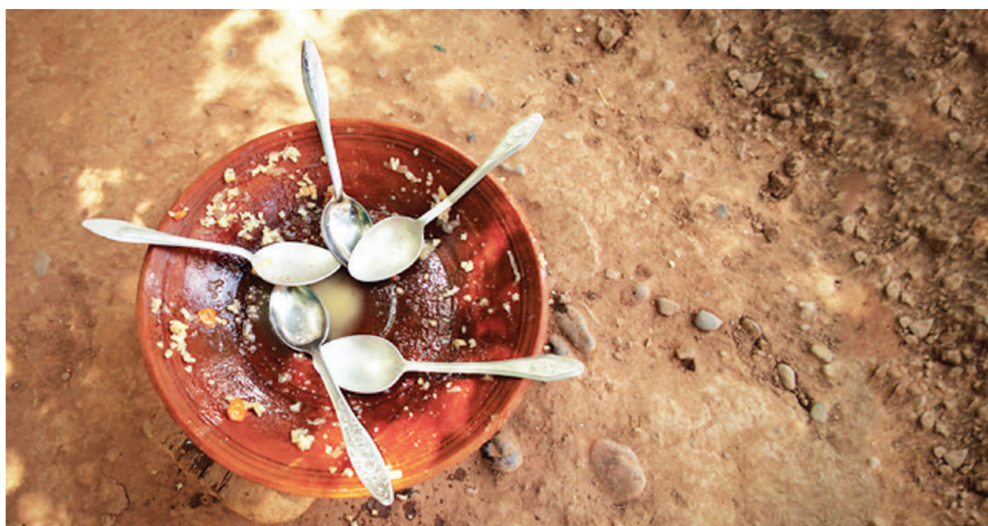
Africa's investment needs to trigger and sustain agro-food transformation range from $40 billion and $77 billion every year.

Further, it presents the investment gap required to trigger and/or sustain Africa's agrifood transformation reflecting on the requisite human, institutional and systemic capacities and capabilities that are required to achieve