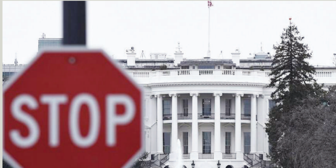
File photo shows the White House and a stop sign in Washington DC, the United States.

The reports showed that the United States used 41 specialized cyber weapons to launch cyber theft operations for over 1,000 times against Northwestern Polytechnical University