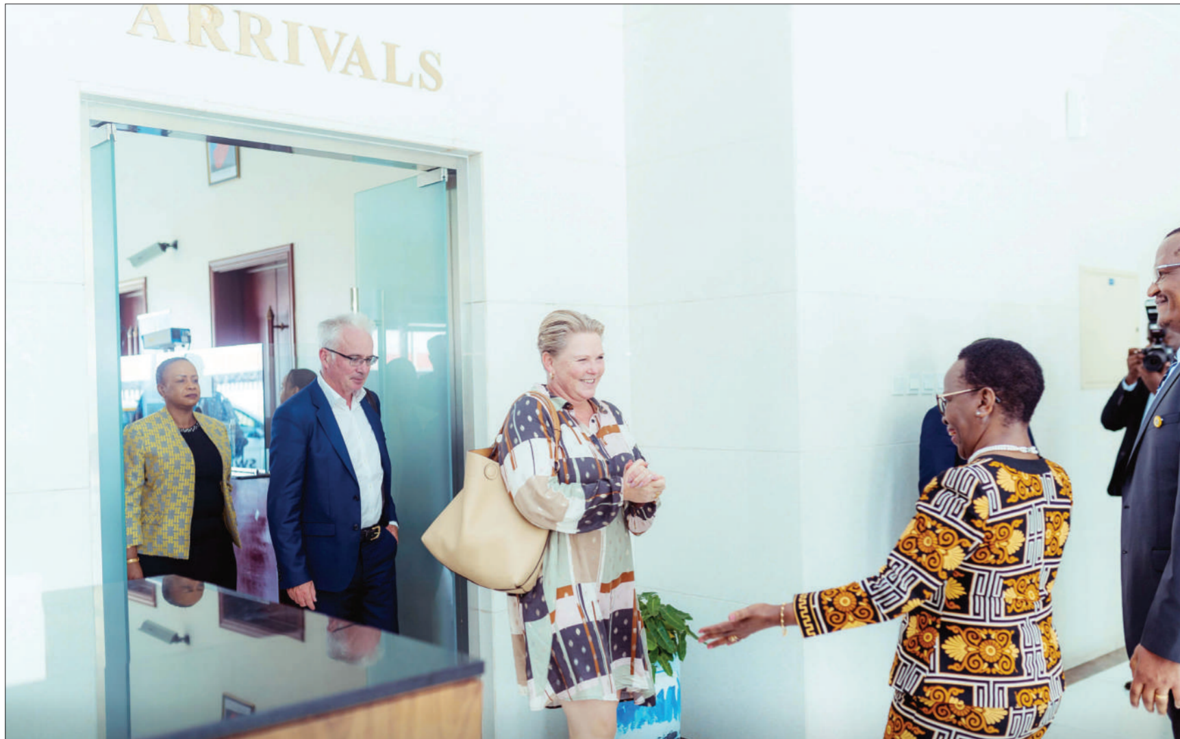
Foreign Affairs and East African Cooperation minister Liberata Mulamula (2nd-R) pictured at Julius Nyerere International Airport yesterday moving to welcome Anne Beathe Tvinnereim, Norway's Minister for International Development overseeing international development efforts in Nordic countries, who had just jetted into Dar es Salaam.