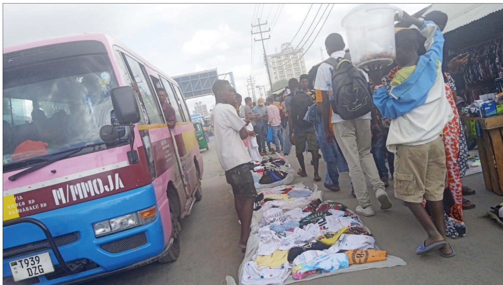
Small traders in business along a street pavement at Karume area in Dar es Salaam yesterday, in part seriously inconveniencing pedestrians. This is only months since they were ordered to relocate to alternative areas earmarked for them.