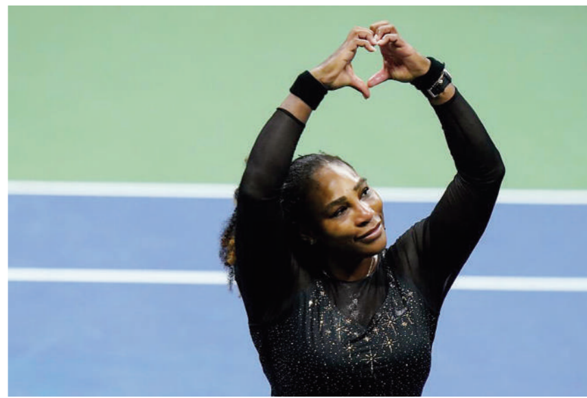
Serena Williams, of the United States, motions a heart to fans after losing to Ajla Tomljanovic, of Australia, during the third round of the U.S. Open tennis championships, Friday, Sept. 2, 2022, in New York.

"Bro," Tiafoe said, "I was going crazy."