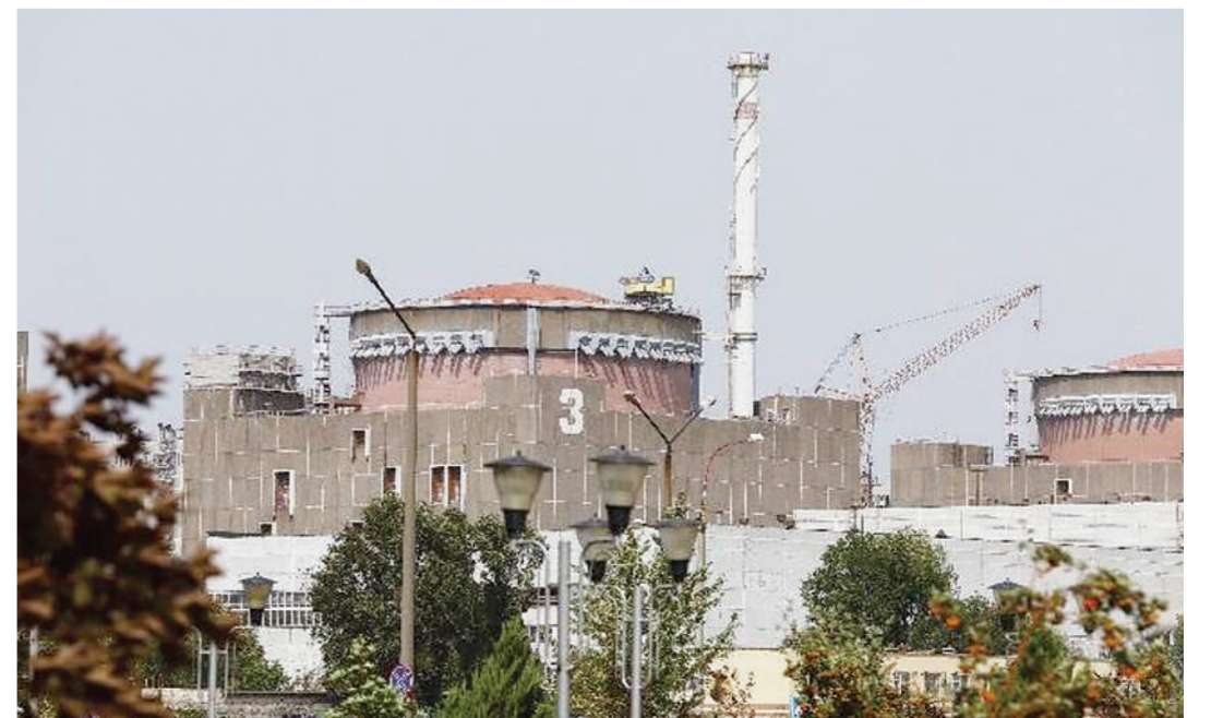
Photo taken on Aug 22, 2022 shows the Zaporizhzhia nuclear power plant.

In recent weeks, the site of the plant has been attacked by shelling, sparking international concerns about its safety. Ukraine and Russia have accused each other over the strikes.