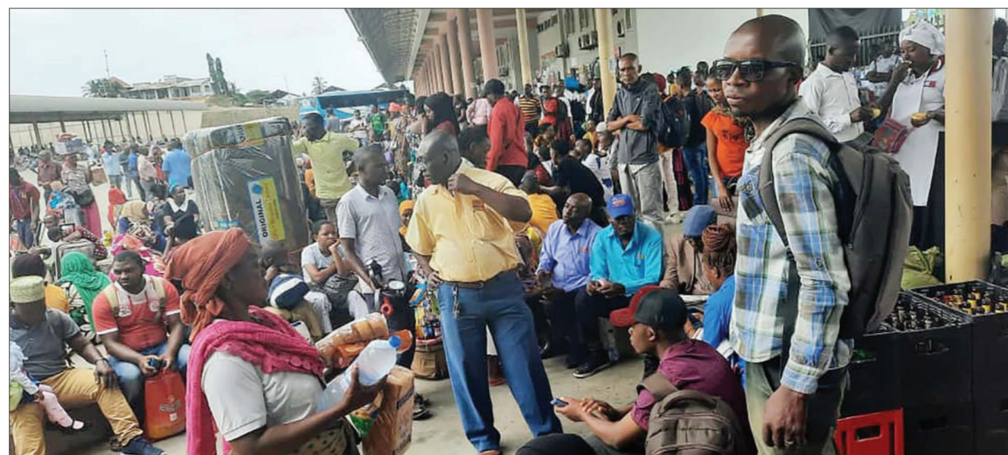
People intending to travel to various upcountry stations and beyond by bus lie stranded yesterday at Dar es Salaam's Magufuli International Bus Stand. Sources said the countrywide reopening of schools had led to most buses being hired to transport students back to school, and hence the crisis witnessed at the terminal in the last several days.