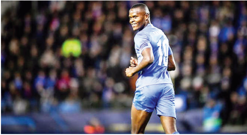
Tanzania's senior national football team 'Taifa Stars' skipper, Mbwana Samatta.