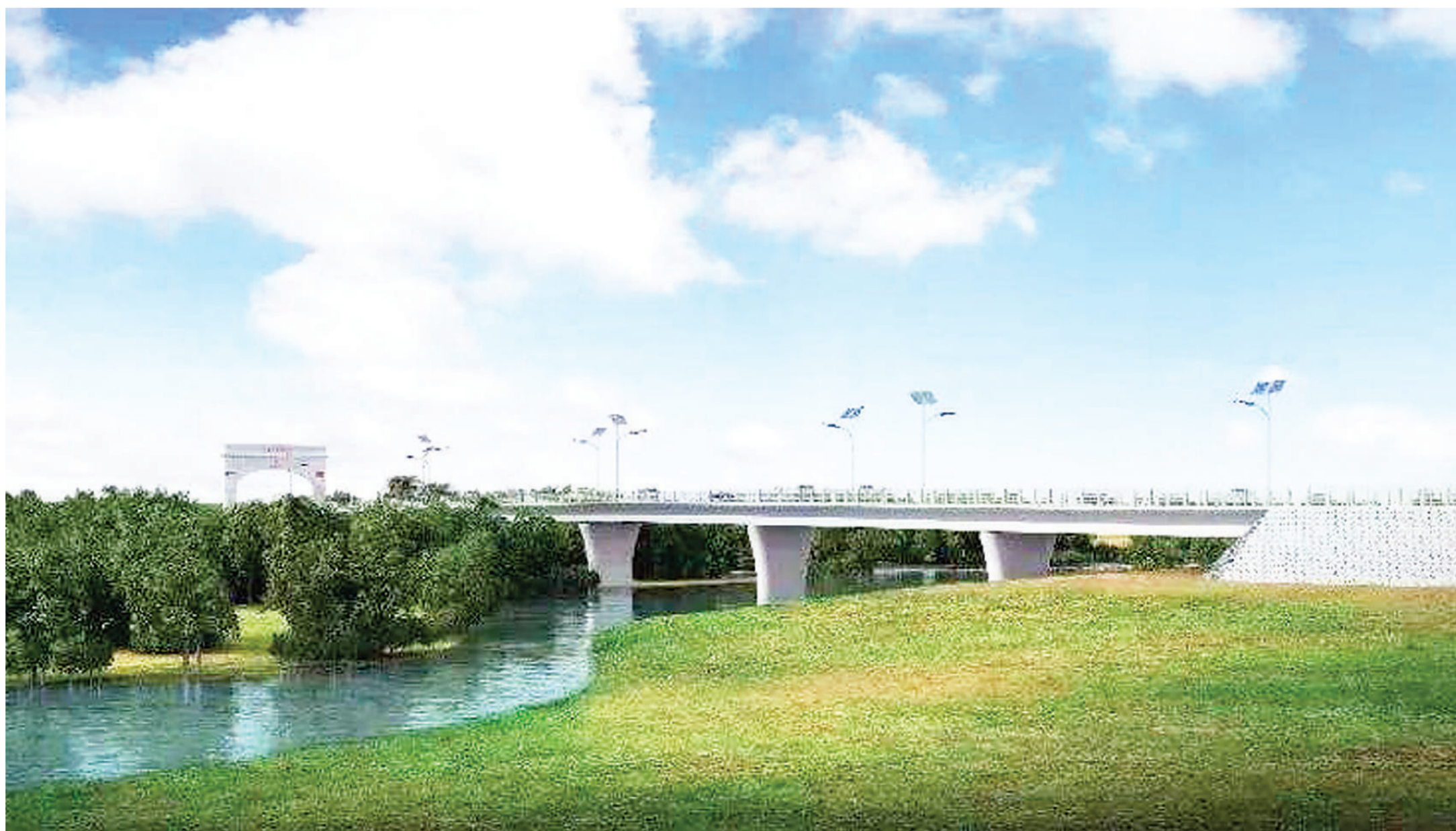
A 3D image of the Jur River bridge in South Sudan.

The construction of the bridge has created hundreds of jobs for the local community. "What I loved the most in the past was coming to the river to