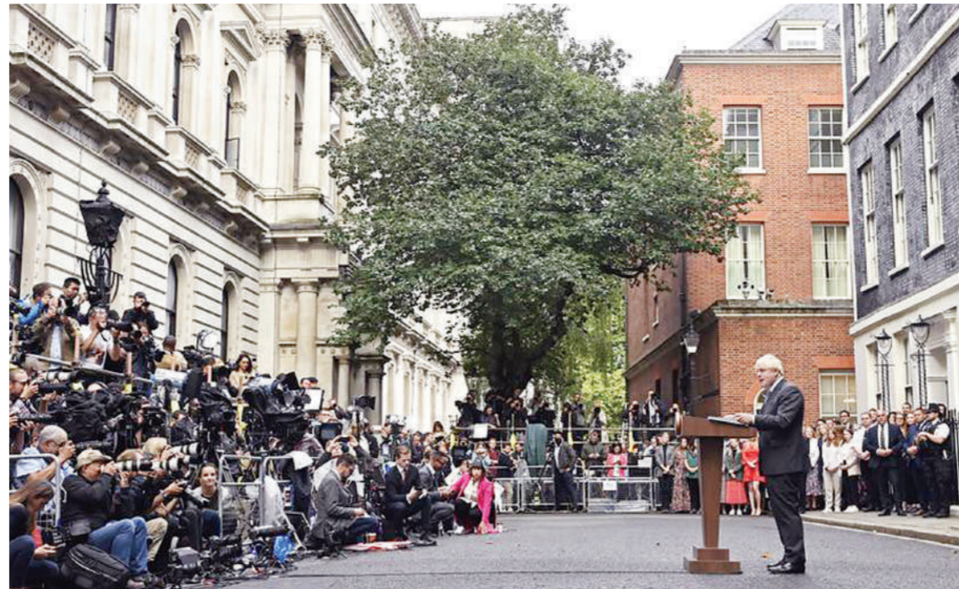
Outgoing British Prime Minister Boris Johnson speaks outside Downing Street in London yesterday, before heading to Balmoral in Scotland, where he will announce his resignation to Britain's Queen Elizabeth II.

Those closest to him say his resignation will allow him to no longer be