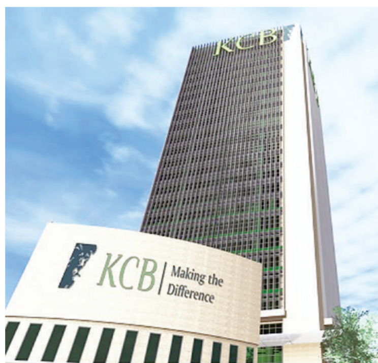
KCB Group Plc share price increased by 5.13 percent to 820/- on Monday close from 780/- recorded on Friday last week.

It was disclosed on Monday that KCB Group raised its stake in its Rwandan subsidiary by an additional 10.8 percent to 87.5 percent af-