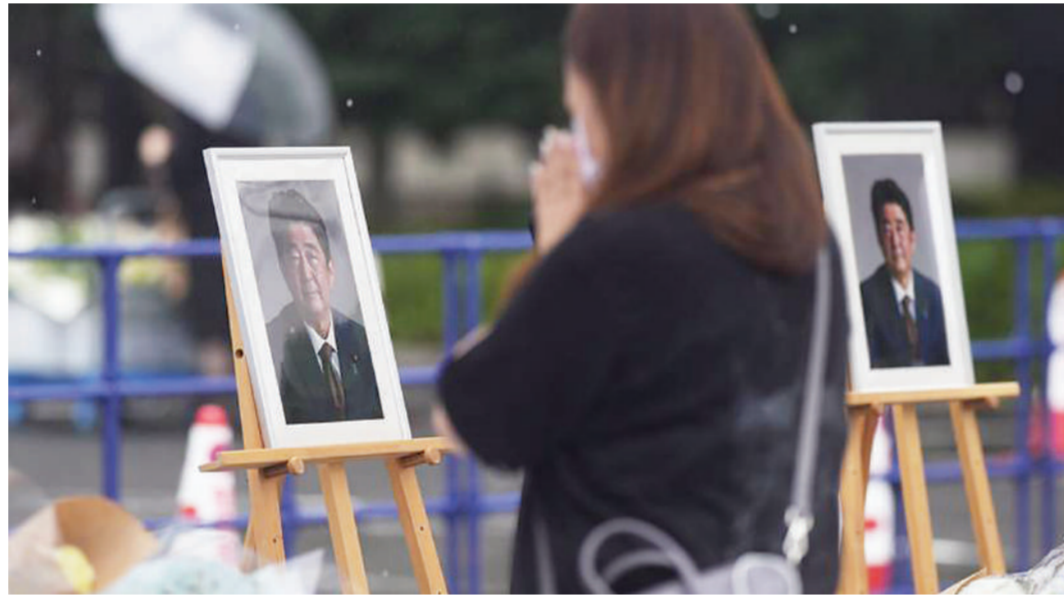
A woman prays after offering a bouquet of flowers at the memorial area set up for former Japanese Prime Minister Shinzo Abe, shown in pictures, at the ruling Liberal Democratic Party's headquarters in Tokyo on July 14, 2022. File photo

Opposition to a taxpayer-funded service for Abe, Japan's