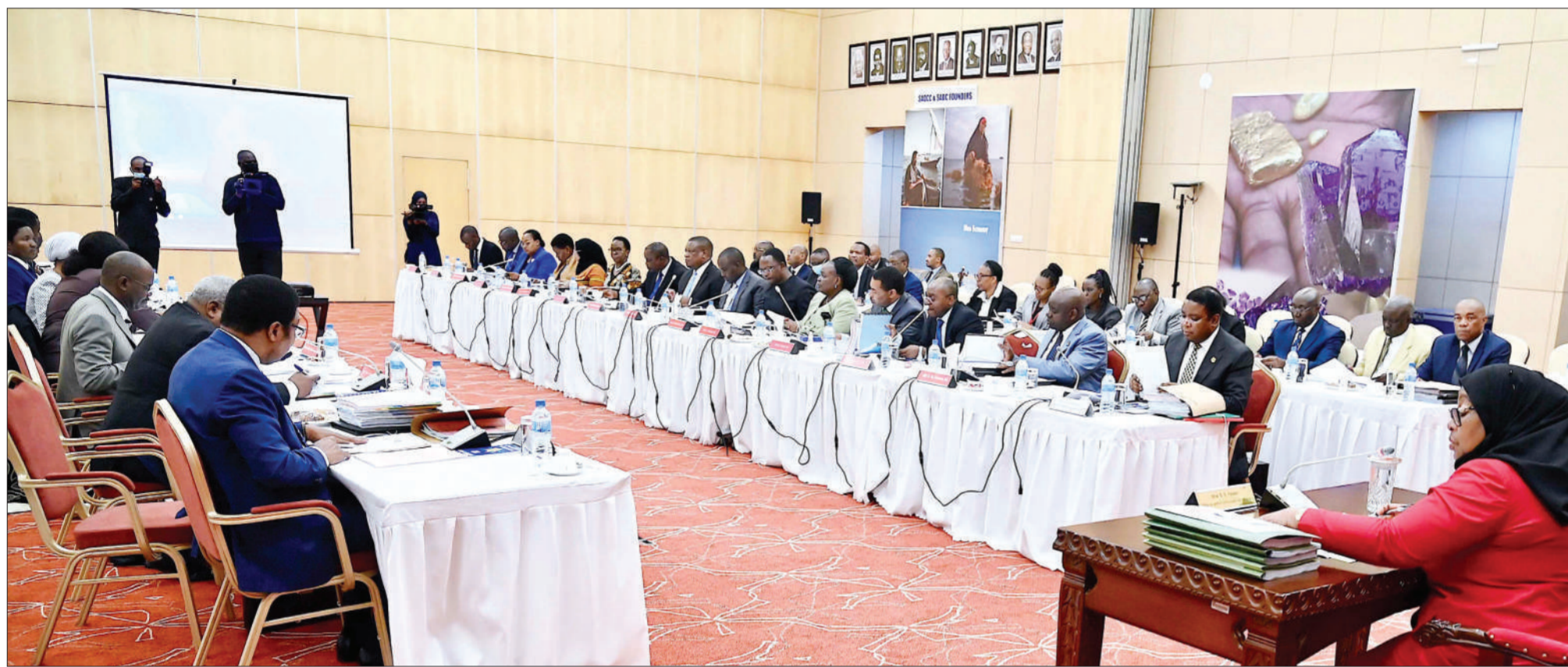
President Samia Suluhu Hassan chairs a Cabinet meeting in Dar es Salaam yesterday.