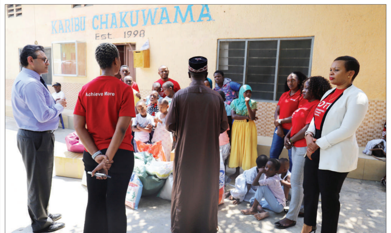
Diamond Trust Bank staff pictured yesterday presenting foodstuffs and an assortment of other items to Chakuwama Orphanage of Sinza Mori, Dar es Salaam, in commemorating UN designated International Day of Charity (Sept 5). The marking of the Day is meant to increase and enhance social responsibility across the world, chiefly by increasing support for charitable causes and bringing everyone together in solidarity.

This is the second time INCM has visited TCRA in 2022 with the aim of gaining expertise and making significant changes to the way it oversees Mozambique's telecom services, including enhancing the quality of services across that country's various provinces.