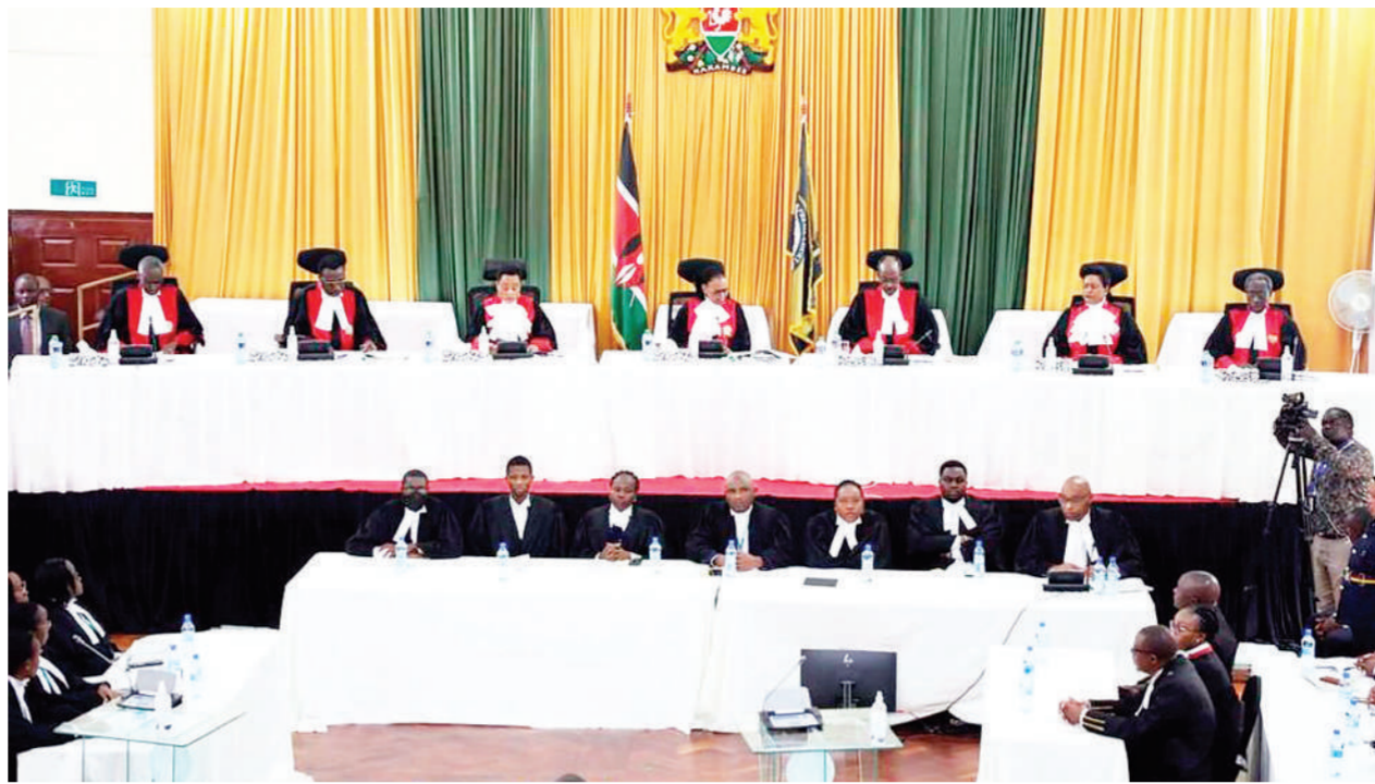
Supreme Courts judges at the Court premises in Nairobi on Monday, September 5, 2022, when giving verdict on the Presidential election Petition.

The judges of the top court said they were not persuaded that the technology deployed by Independent Electoral and Boundaries Commission (IEBC) failed the standard of Article 86(a) of the constitution on integrity, verifi-