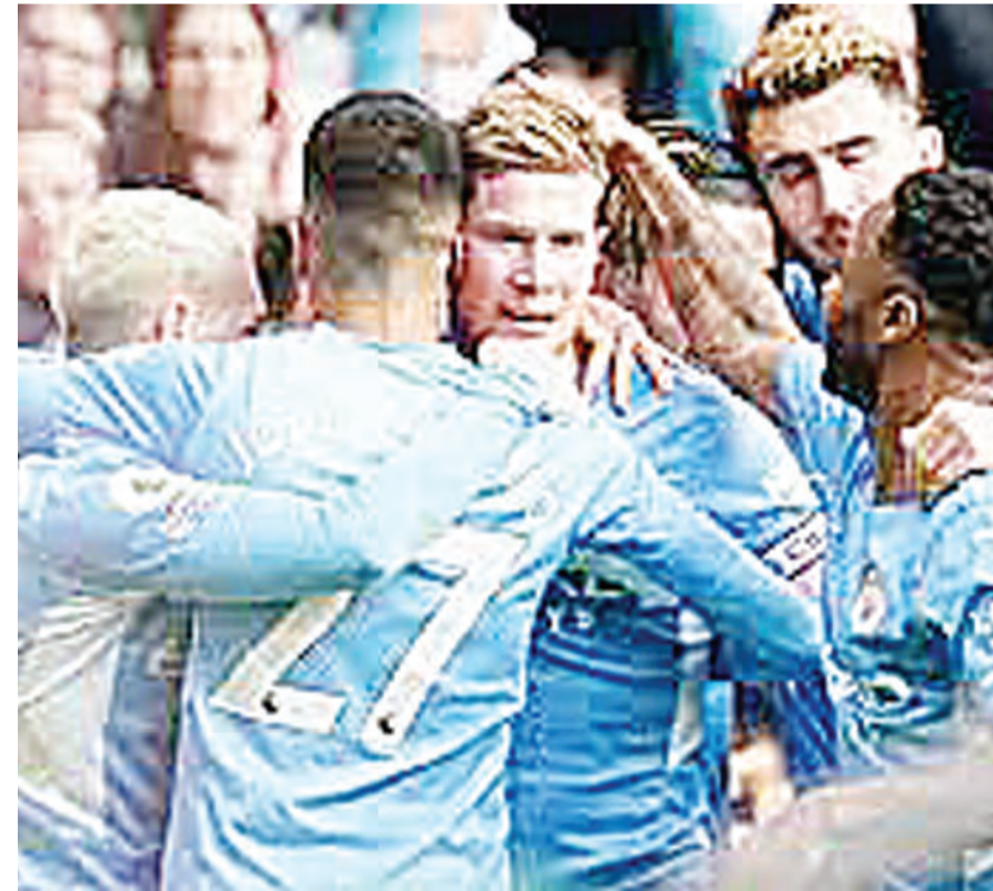
Kevin De Bruyne's worth to Manchester City's ceaseless success cannot be calculated.

Lukaku is similar to Grealish in that he has fallen well short of expectations at Stamford Bridge, managing just five Premier League goals so far after hav-