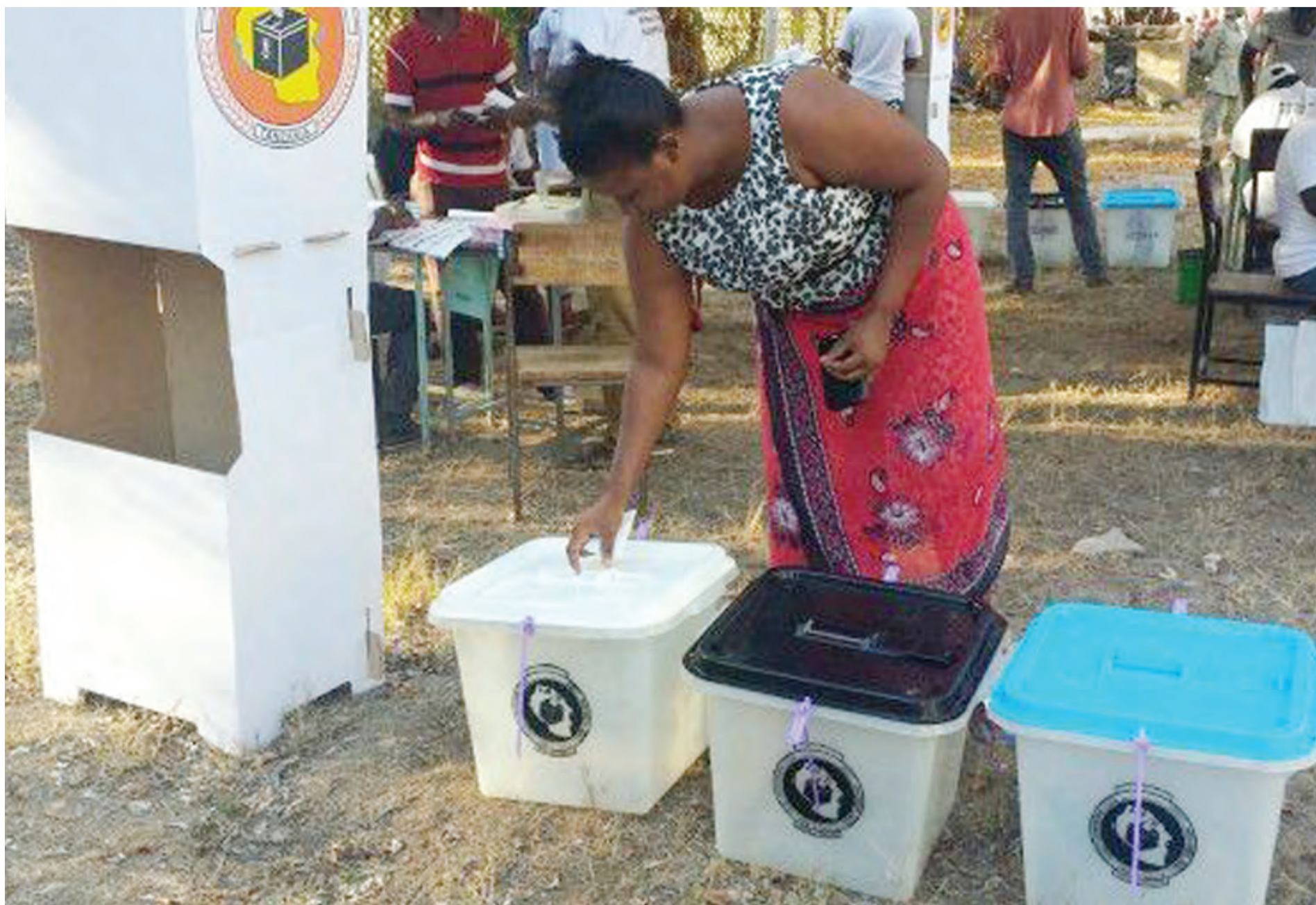
A woman casts her vote to elect President, Member of Parliament and Councillor at one of the general elections in Tanzania. File Photo

.....during my absence, there'd been major changes, with several ministries divided, disbanded or created, and confusingly, a Minister of State in the Prime Minister's Office said....."There are now departments in the former ministries which will deal with