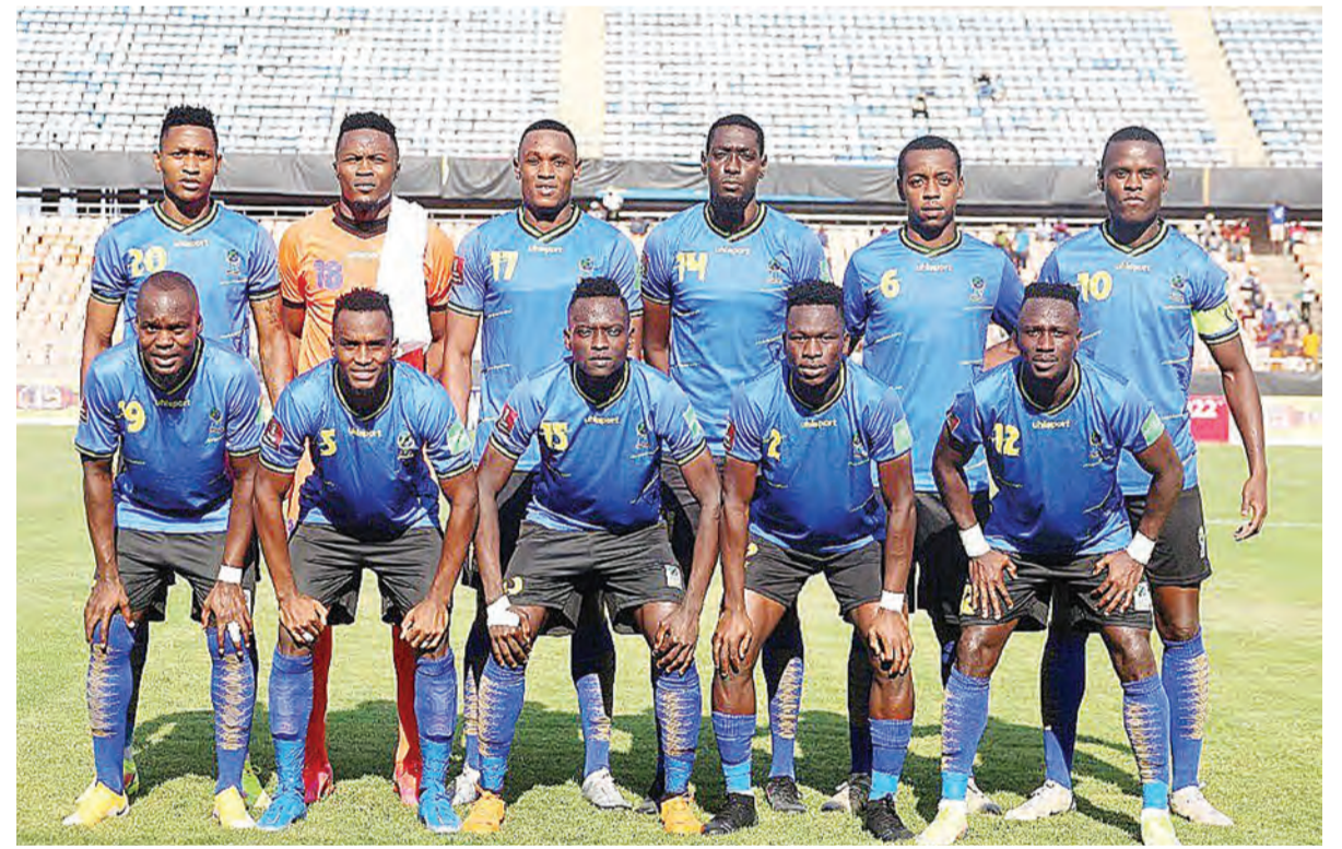
Tanzania's senior national football team 'Taifa Stars' players pose for a photo before playing a recent friendly at Benjamin Mkapa Stadium in Dar es Salaam.

The CAF will play a draw and schedule the next AFCON qualifiers to