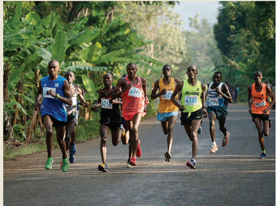
Athletes take part in a recent Kilimanjaro Premium Lager Marathon which took place in Moshi.

"International runners were paying $80 to register but as