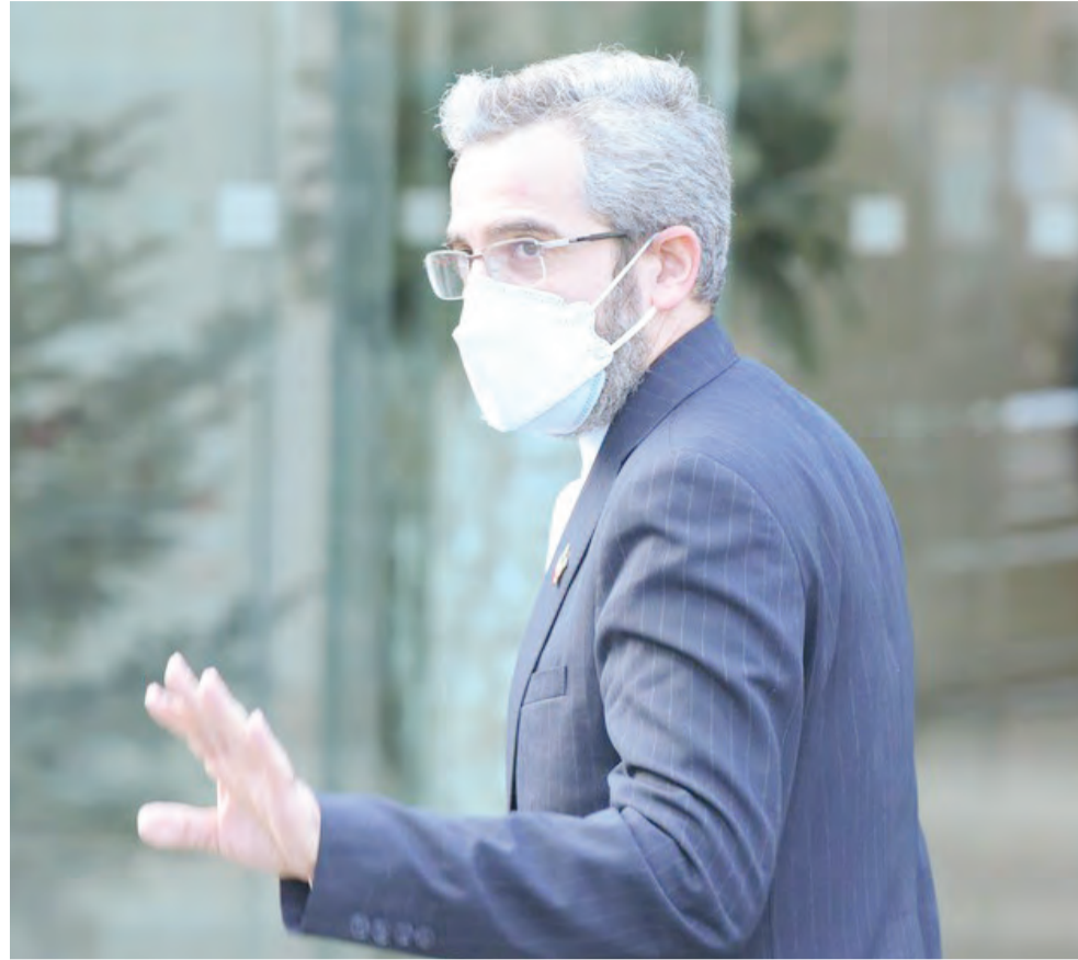
Iran's chief nuclear negotiator in the Vienna talks Ali Bagheri Kani

Also, Mikhail Ulyanov, head of Russia's delegation to the nuclear negotiations, tweeted on Thursday that the diplomats in Vienna primarily