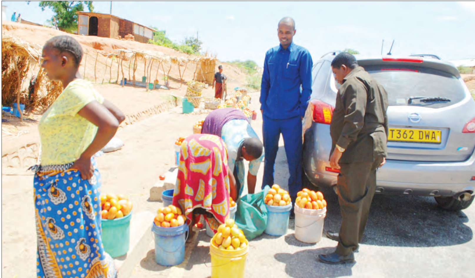
Tomatoes on sale yesterday at a popular roadside Msembeta village spot along the Dodoma-Singida highway – in Bahi District, Dodoma Region.