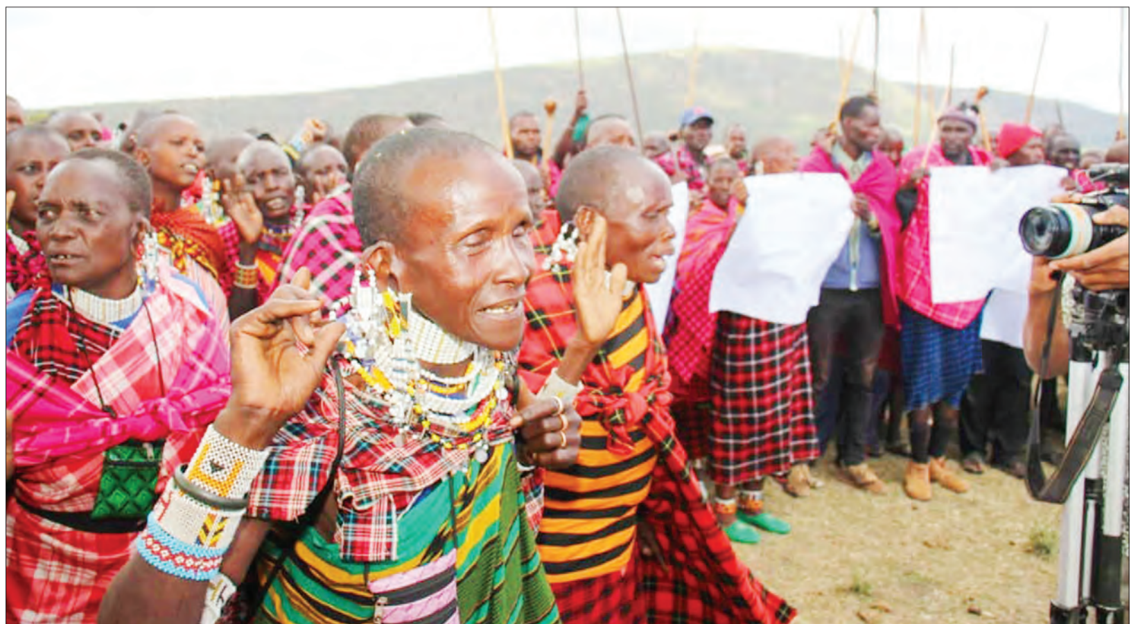
Visibly distressed residents of Ololosokwan village in Ngorongoro District attend a meeting at Olorieni village in Loliondo District addressed by their tribal leaders, popularly known as Laigwanan. They had taken exception to reports that some 1,500 square kilometres of the area they currently occupy would be put under alternative uses.

He said before the bridge's construction, they used to cross the river in canoes, and many people drowned doing so.