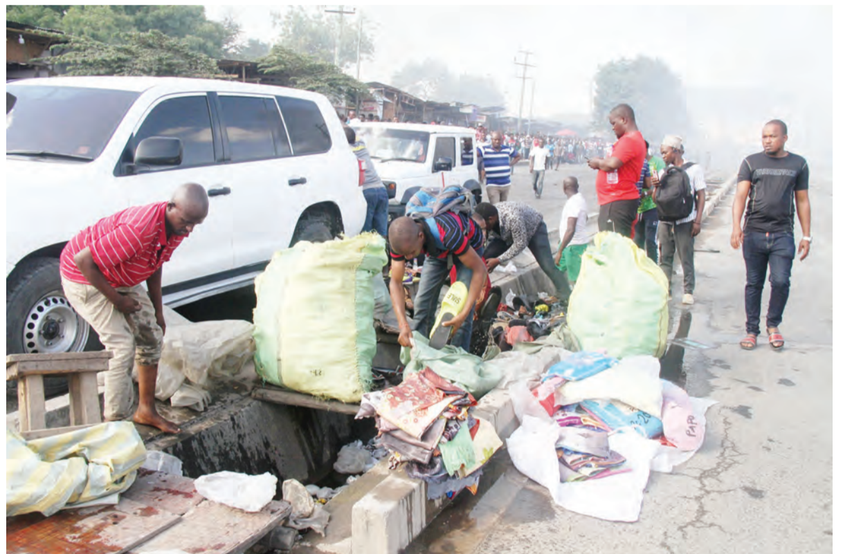
Shoe dealers tidy up and assemble wares salvaged from the inferno while contemplating what to do next.