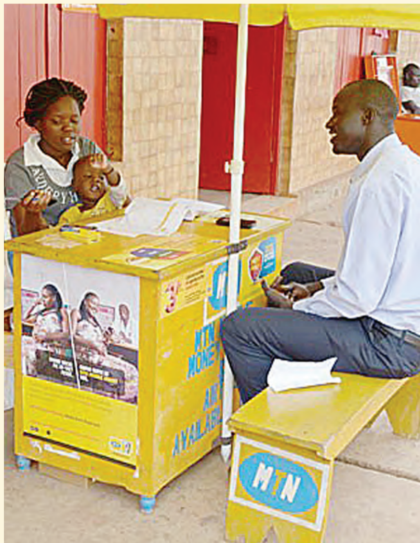
An agent of MTN Uganda attends to a customer in Kampala.

Most of the people in Africa who couldn't get loans from traditional banks because they didn't have a banking history now have access to credit through these new and easy-to-use digital lending services. There are some exceptions, though. Most of the new digital lenders charge high-interest rates, which is often because they work in a risky environment. Users will benefit from lower prices as the legislative framework changes to formalise the industry, while service providers will be protected from financial loss.