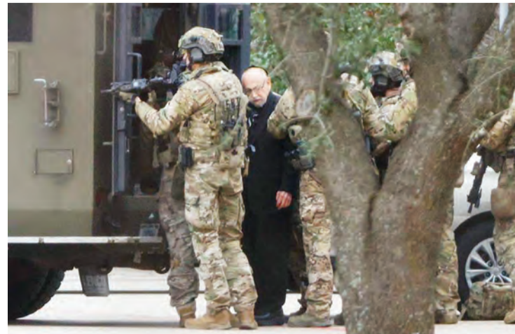
Shortly after 5 pm, local time, authorities escort a hostage out of the Congregation Beth Israel synagogue in Colleyville, Texas, on Saturday. Police said the man was not hurt and would be reunited with his family.

Before the livestream was ended, the man could be heard ranting and talking about religion and his sister, the Fort Worth Star-Telegram reported. The man could be heard