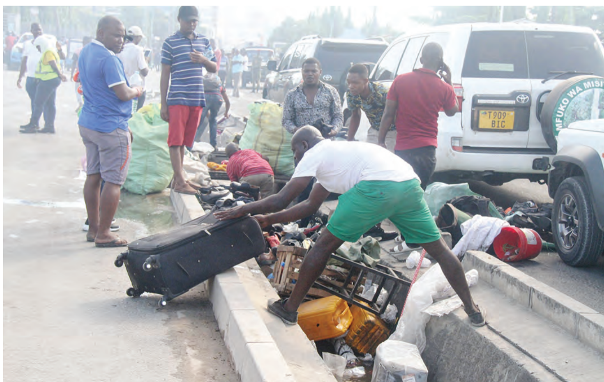
Down but doubtless not out - as small traders displaced by the fire prepare for the days ahead of them.