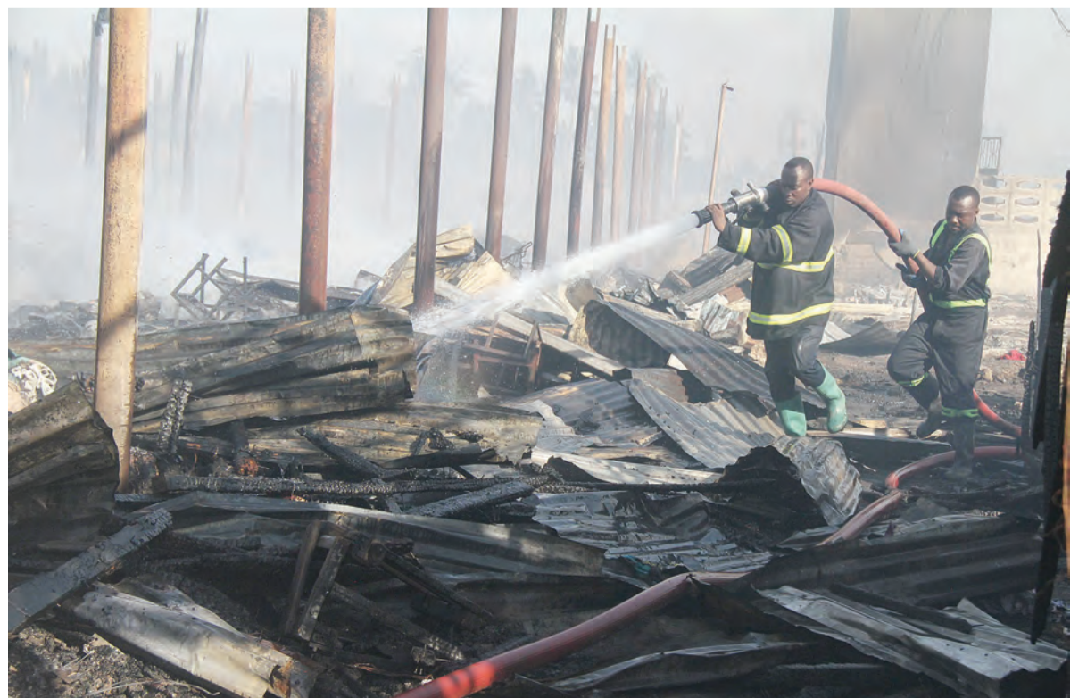
Members of the Fire and Rescue Force in last-minute efforts to douse the fire - but with the harm already done.