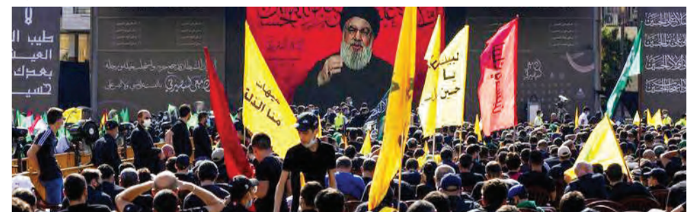
Hezbollah supporters listen to their leader Sayyed Hassan Nasrallah as he speaks via a video link during Ashoura, the Shiite Muslim commemoration marking the death of Imam Hussein, the grandson of the Prophet Muhammad, at the Battle of Karbala in present-day Iraq in the 7th century, in southern Beirut, Lebanon. File photo

An IMF spokesperson told Reuters that virtual talks would be held with Lebanese authorities in the last week of January.