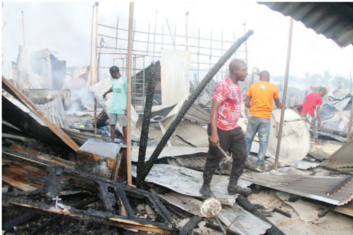
Small traders in a frantic search for 'bits and pieces' to pick up from the debris for later use.