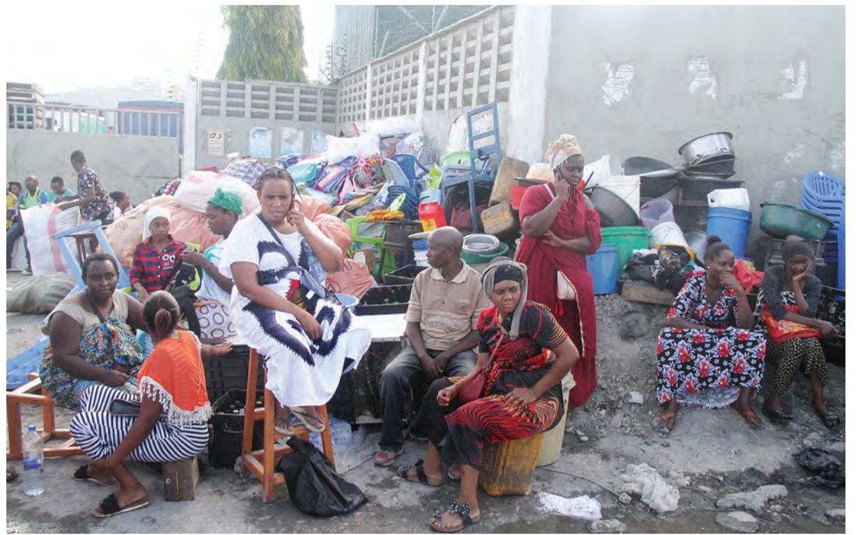
Some of the traders who have been conducting business at the market visibly distressed, as they ponder the next move.