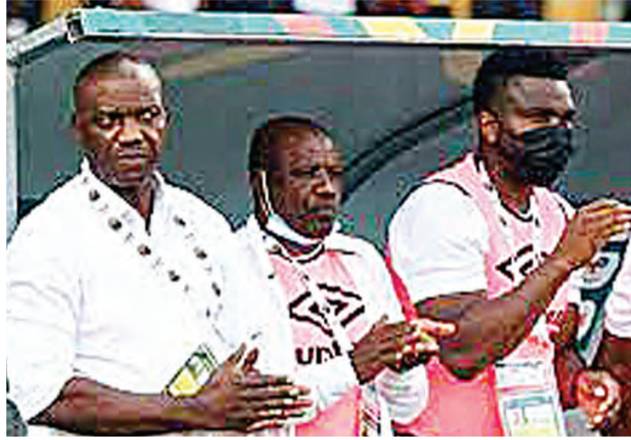
The Super Eagles are playing with freedom and flair under Augustine Eguavoen -- a style that has not always been the case for the interim boss.

Once again, as it was in the opening game against Egypt, what would have been most pleasing of all was less