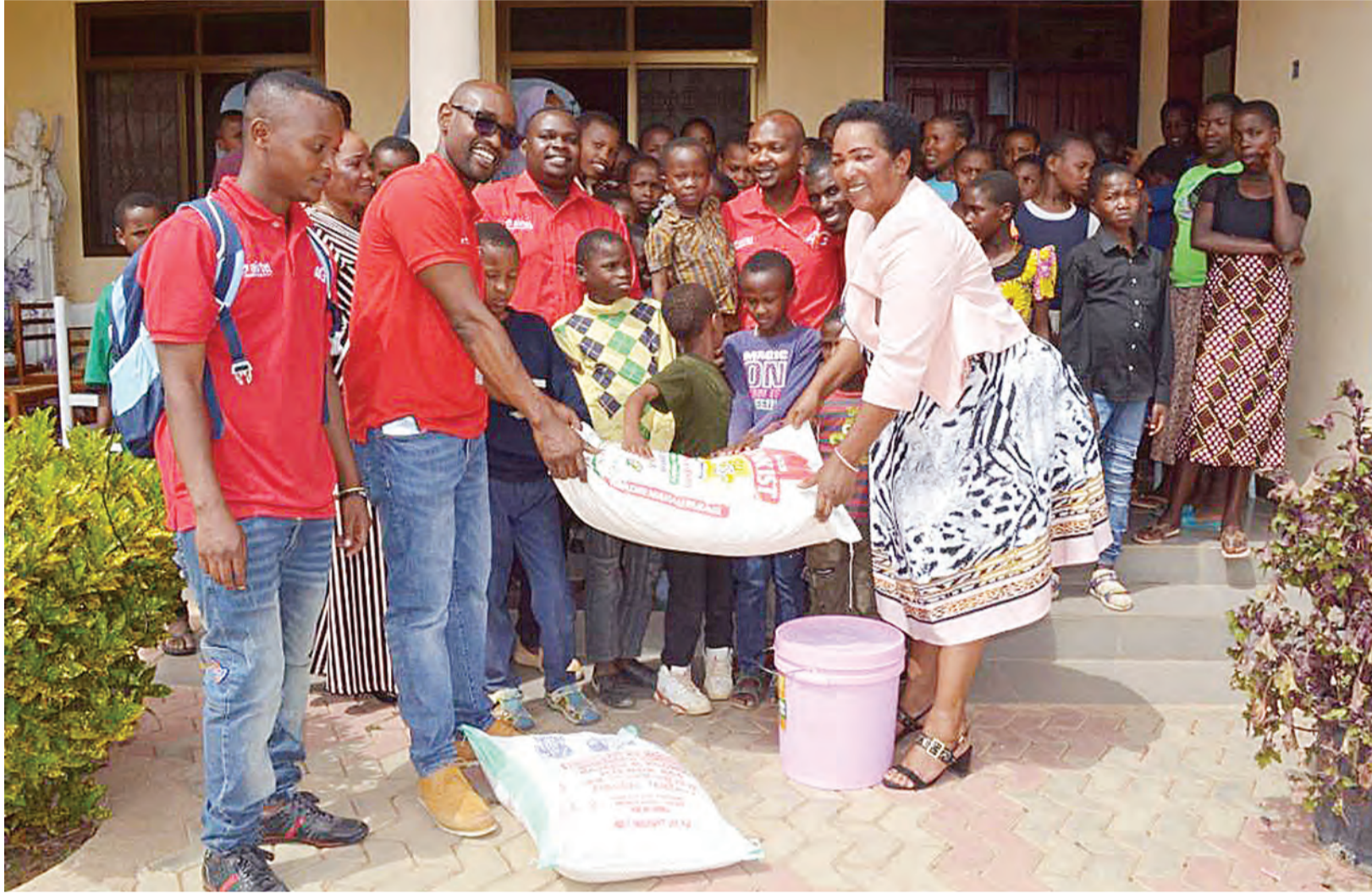
An Airtel Tanzania official presents a bag of maize flour as part of food items donated to Ititi Orphanage in Singida municipal to an official of the orphanage (R).

"By donating these food stuffs to orphanages, we are actually showing our appreciation to Tanzanians for their trust in us by continuing to use our services and products," said Fwankiye adding that Airtel will continue to show care and love for groups