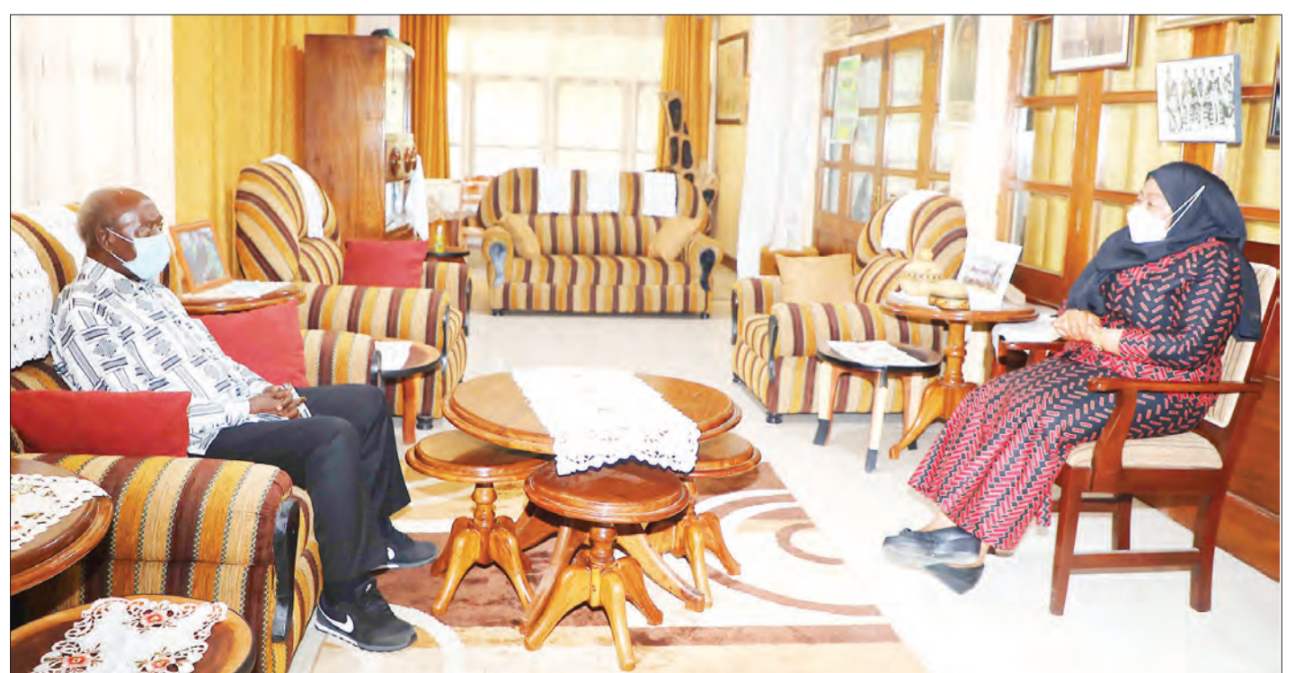
President Samia Suluhu Hassan has an audience with former Prime Minister John Malecela at his Kilimani residence in Dodoma city yesterday.