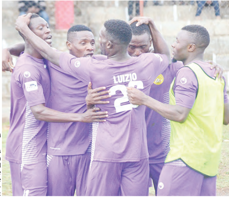
Mbeya City FC's footballers celebrate when one of the outfit's attackers netted a goal in an NBC Premier League clash played in Mbeya.