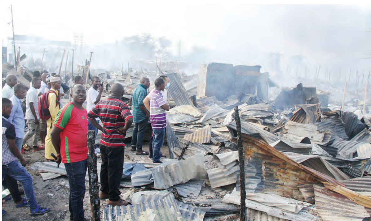
Members of the public join the small traders whose stalls have been reduced to ashes in looking on in shock and disbelief at the massive destruction caused by the fire.