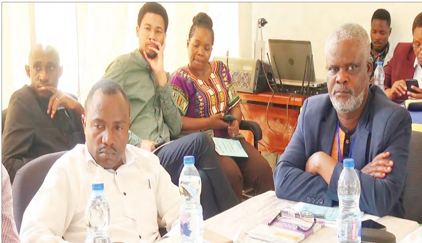
A two-day international conference on education co-organised by the Iringa-based Mkwawa University College of Education and the Tanzania Education Network in progress at the college last week.