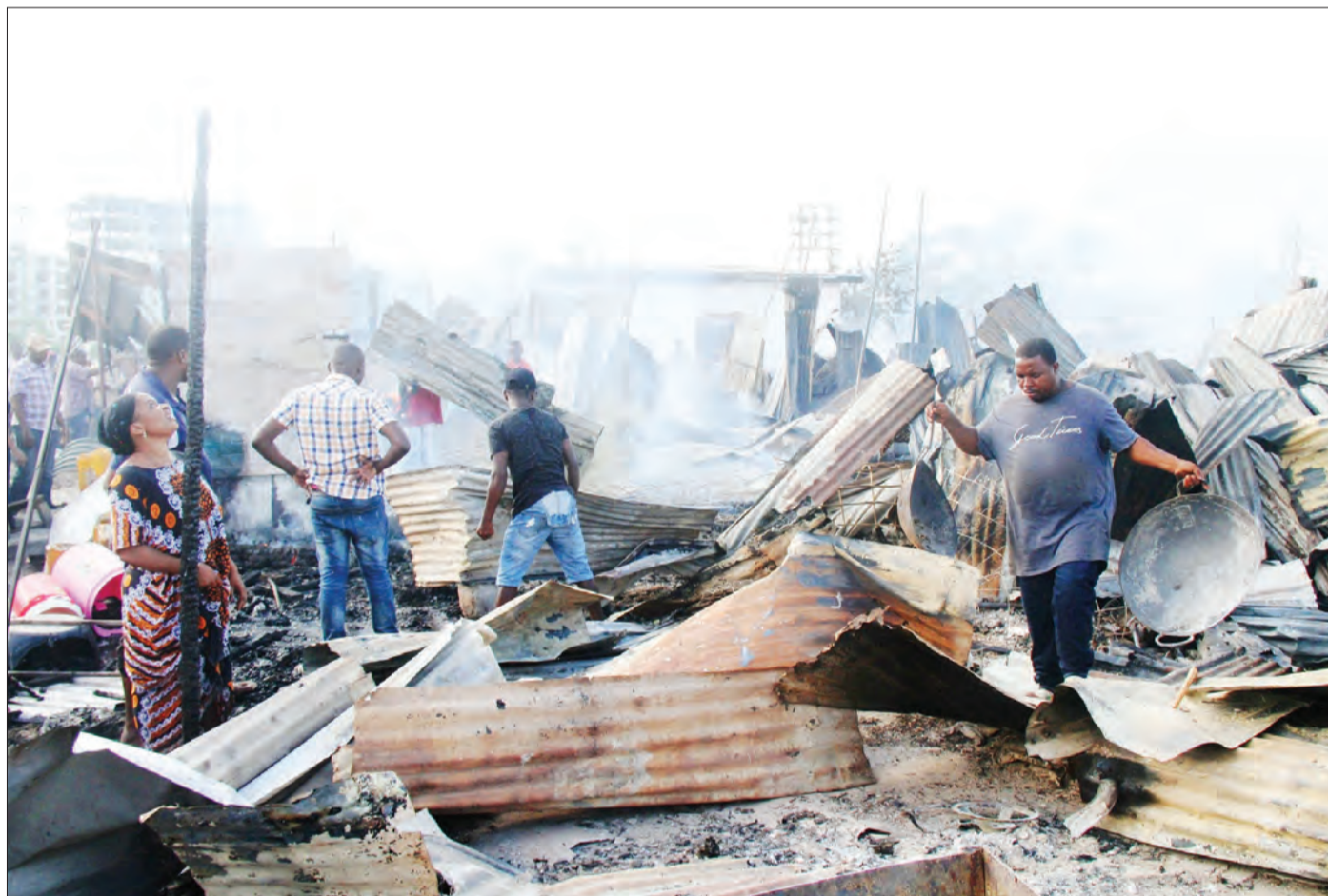
This is where Dar es Salaam's hugely popular Ilala Mchikichini open market stood until it was gutted by an inferno in the small hours of yesterday. More photos on Page 11.