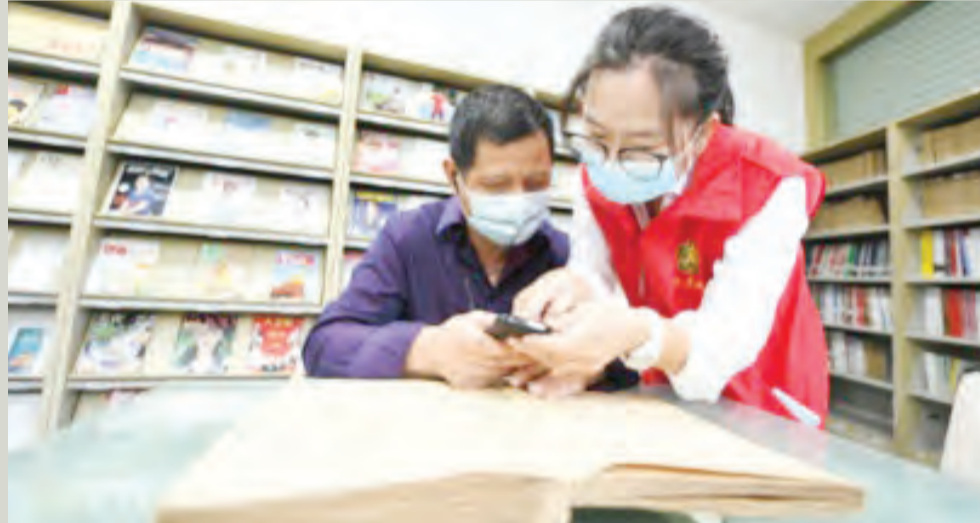
A volunteer helps a man with visual impairments read with a text-to-speech device at a library in Wuyi county, Jinhua city, east China's Zhejiang province, Oct. 13, 2021. File photo

The size of China's intelligent voice market hit 21.7 billion yuan ($3.4 billion) in 2020, an increase of 31 percent from the previous year, and is projected to rise 44 percent year on year to 28.5 billion yuan in 2021, effectively driving industrial digitalization, pointed out a white paper on the development of China's intelligent voice industry (2020-2021) released on Dec. 18, 2021.