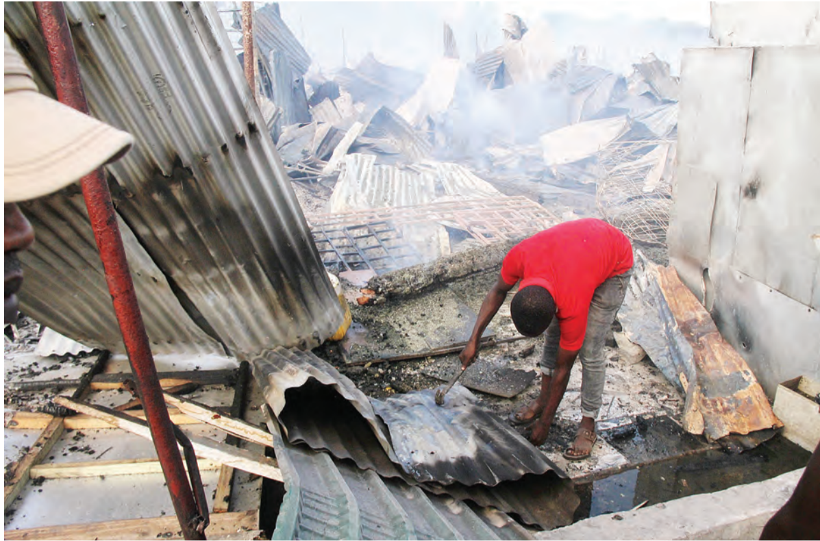
One of the scores of small traders who have been conducting business at Mchikichini market in Dar es Salaam's Ilala District moves to salvage whatever little he could from the debris of what used to be the stall he operated from. A fire gutted the small hours of yesterday, with details on the incident scanty indeed.