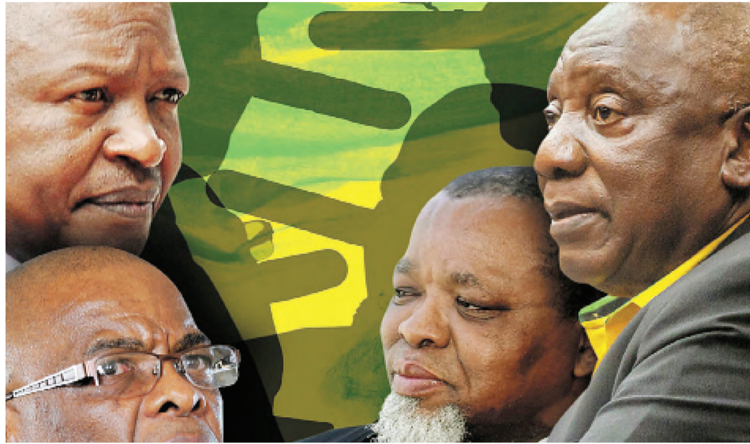
South African President Cyril Ramaphosa (right) and ANC top cadres.

deliberations not just over the judicial appointments, but also over appointments for at least two other "independent institutions": the South African Human Rights Commission and the Commission for the Promotion and Protection of the Rights of Cultural, Religious and Linguistic Communities. These are both Chapter 9 bodies, whose independence is enshrined in the Constitution.