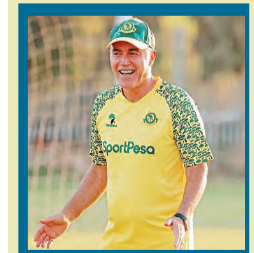
Gamondi calls for Yanga fans' support, vows to down Ihefu SC