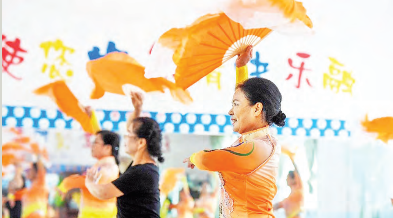
Senior citizens attend a dancing class offered by an "elderly college" in Shangtang township, Fengcheng, east China's Jiangxi province.

"Through engaging in sports, watching games, and going on deep travels, my life after retirement is