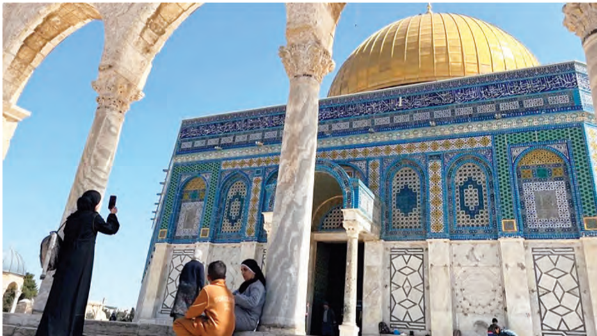
The site is often a flashpoint during flare-ups in the Israel-Palestinian conflict

Since Israel captured East Jerusalem, including this part of the Old City, from Jordan in the 1967 Middle East War and occupied and annexed it, the site has become a prominent symbol of the wider Palestinian struggle.