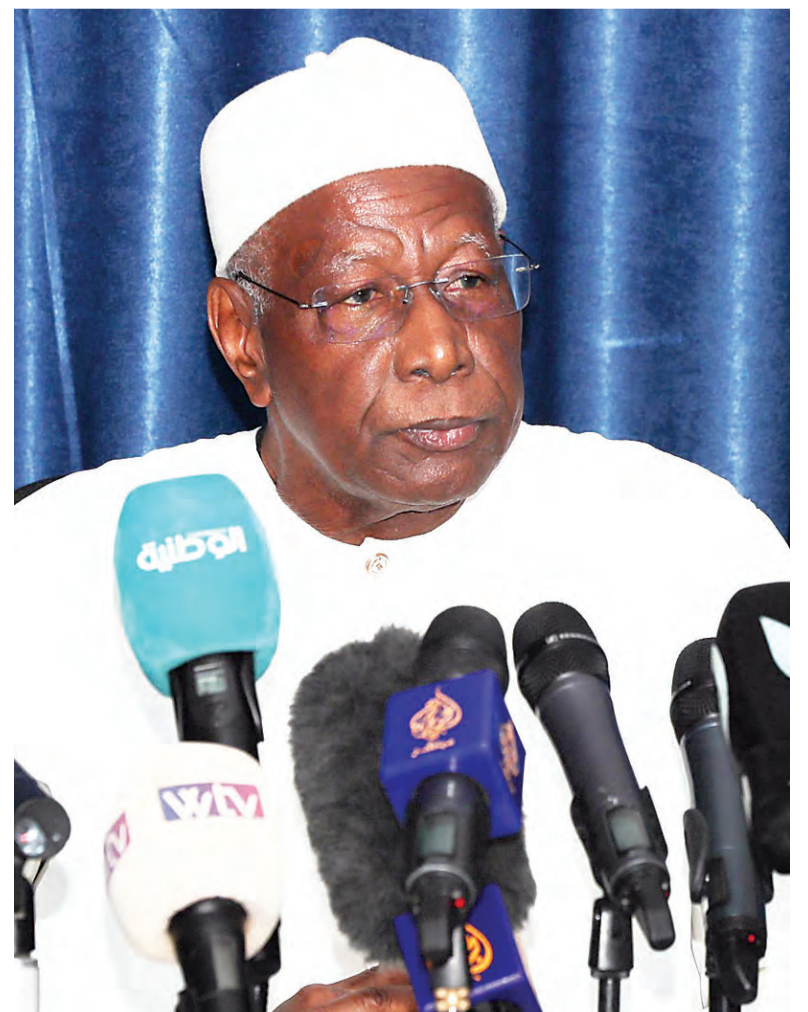
Special Representative of the UN Secretary-General for Libya Abdulaye Bathily speaks in a press conference in Tripoli on March 11, 2023.