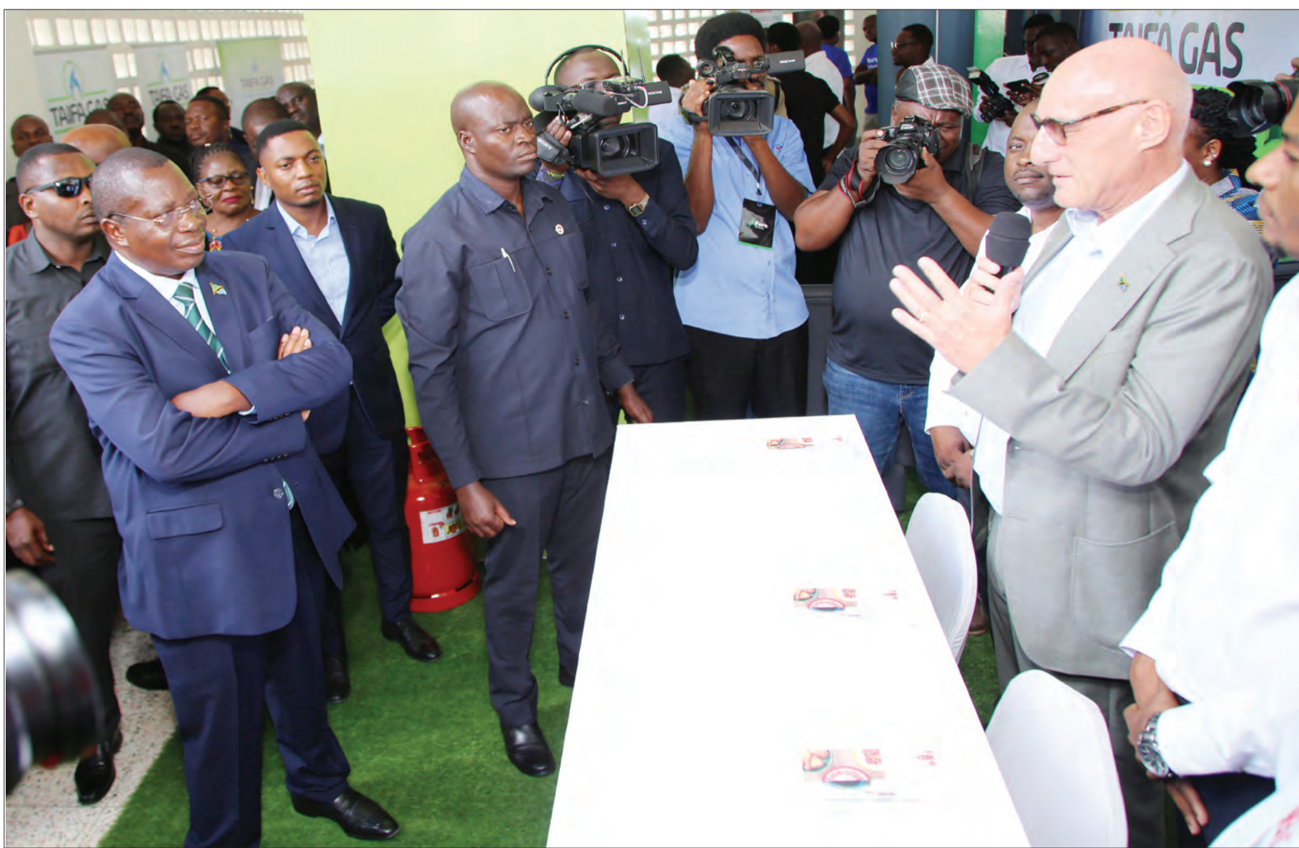
Vice President Dr Philip Mpango (L) is briefed at one of the pavilions at an exhibition held in Dodoma city at the weekend in tandem with a meeting organised by the Energy ministry, the focus being on the economic empowerment of women.

Once empowered, youth and women would become productive members of the society, significantly contributing to the country's economy, food security and nutrition in enhancing resilience of entire families and communities, she added.