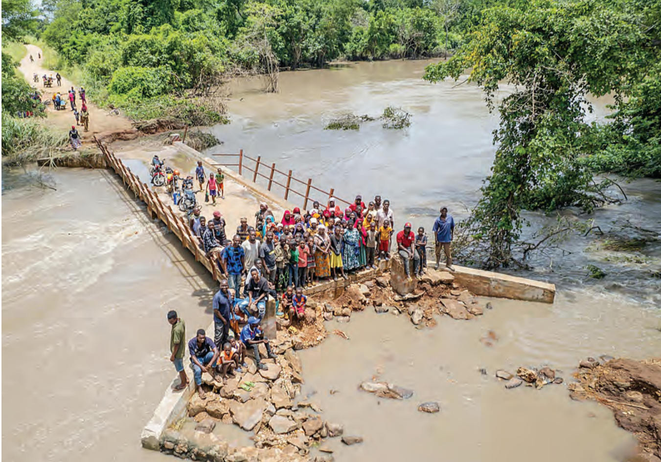
DEAD END... All manner of emotions and expressions discernible even by just taking a quick look at these residents of Kibutuka ward in Liwale District gathered at the weekend at a hanging bridge linking the district to Nachingwea District - both in Lindi Region - but badly damaged by ongoing heavy rains and rendered impassable.