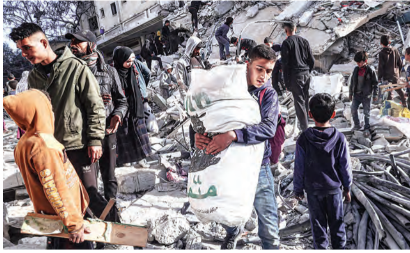
A Palestinian youth walks away with some items salvaged from the rubble of a residential building hit in an overnight Israeli air strike in Rafah in the southern Gaza Strip on Saturday, amid continuing battles between Israel and the Palestinian militant group Hamas.

raeli aircraft targeted a house with two missiles, destroying the house and causing damage to neighboring homes. The Israeli airstrike killed 13 people, including children, and several others were injured to varying degrees and were all transported to hospitals, medical sources said.