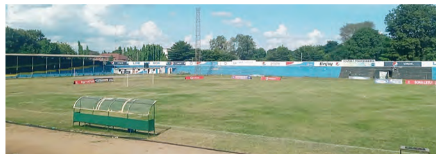
Morogoro's Jamhuri Stadium.

hard-fought 2-1 victory over Coastal Union at Mkwakwani Stadium in Tanga on Saturday evening.