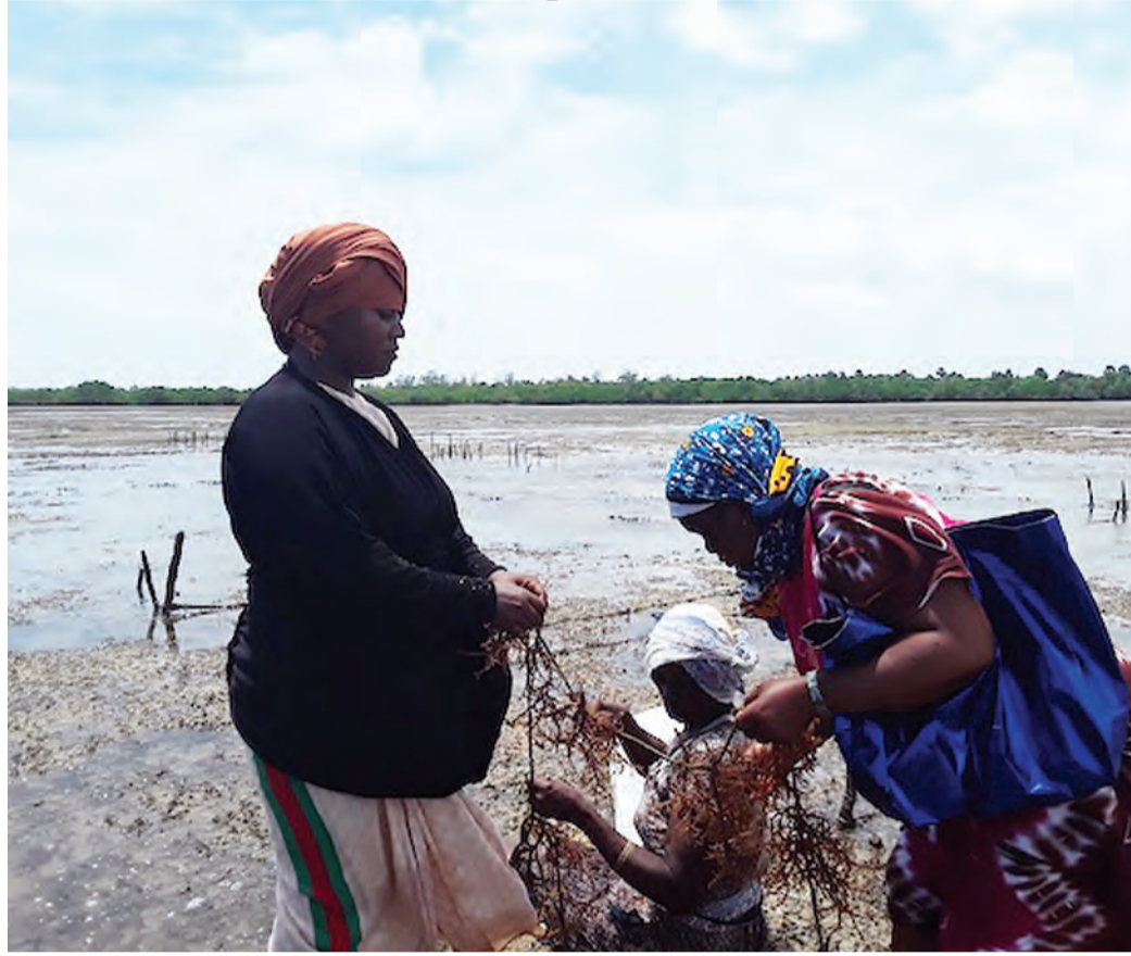
Women at work at the seaweed farm.

To avert coastal climate hazards and secure mangrove-related benefits for present and future generations, the community undertook mangrove conservation and restoration activities in earnest.