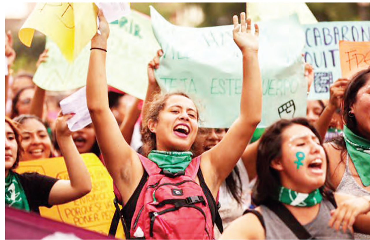
Women's demonstrations to demand respect for their rights are held in Latin American cities on Mar. 8, International Women's Day, calling on governments in the region to invest in promoting gender equality. The photo shows a march in Lima on Mar. 8, 2023.

Three out of 10 girls and women live in poverty and one out of 10 in extreme poverty, with higher rates among indig-