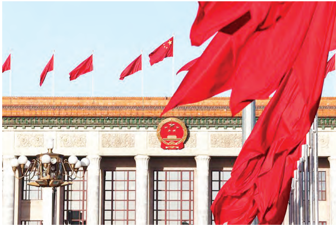
This photo taken on March 8, 2024 shows the Great Hall of the People ahead of the second plenary meeting of the second session of the 14th National People's Congress (NPC) in Beijing, capital of China.

tion" took place at the Great Hall of the People. For the first time, a session of the NPC Standing Committee made special inquiries regarding three reports on the same topic from the State Council, the Supreme People's Court (SPC) and the Supreme People's Procuratorate (SPP).