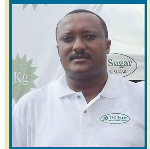
TPC Sugar determined to make the most of Kilimanjaro Marathon