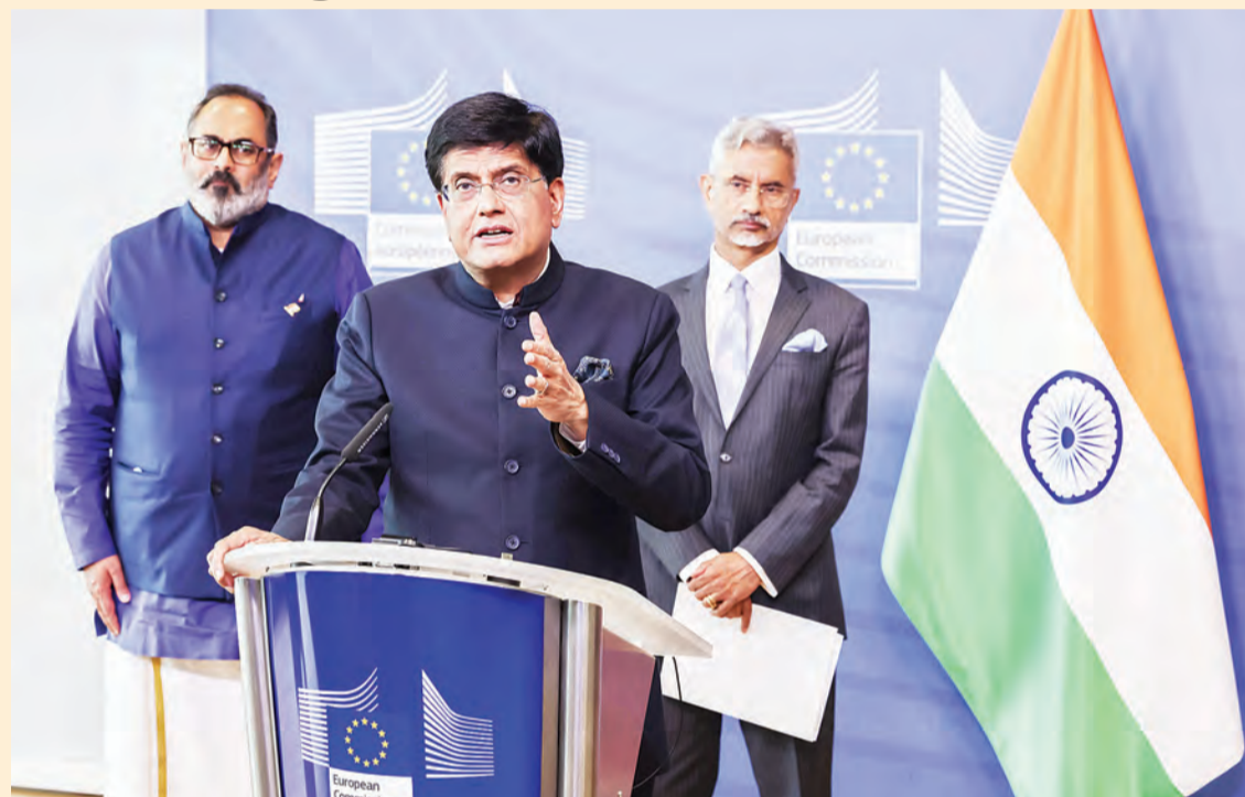
India's Commerce and Industry Minister Piyush Goyal (C), India's Minister for External Affairs S. Jaishankar (right), and India's Minister for State and Skill Development Rajeesh Chandrasekhar (left), address the media during a press conference on the EU-India Trade and Technology Council at EU headquarters in Brussels, Belgium, May 16, 2023.

The agreement "brings Swiss investments and innovation to India, and can potentially turn India into an innovation hub for the world. Switzerland has been