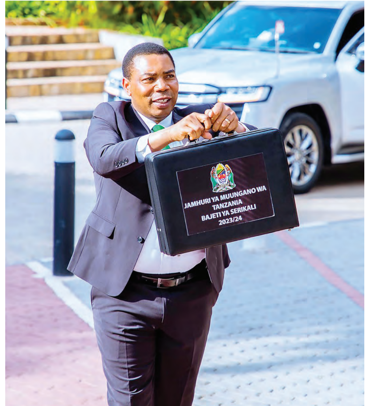
Finance minister Dr Mwigulu Nchemba

the outstanding government bonds also increased by 3trn/- over the last one year ending March 2024 to 20.67trn/- from 17.2trn/- recorded in March 2023.