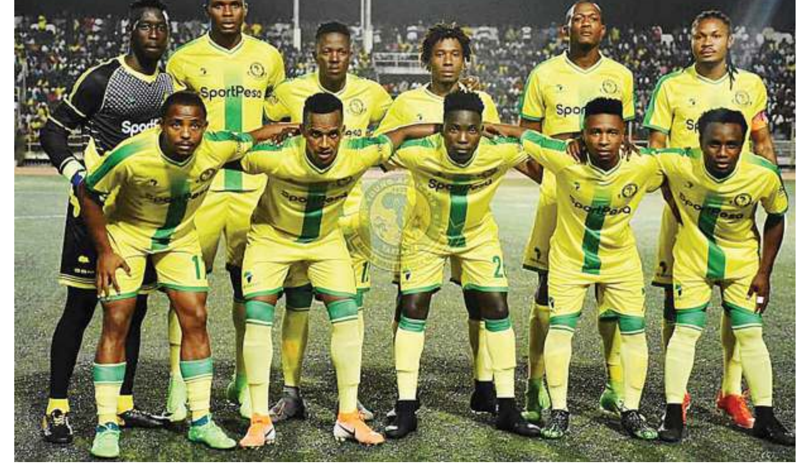
Yanga players in a group photo prior to the squad's friendly encounter with Zanzibar Premier League outfit, Mlandege, in the Isles recently.