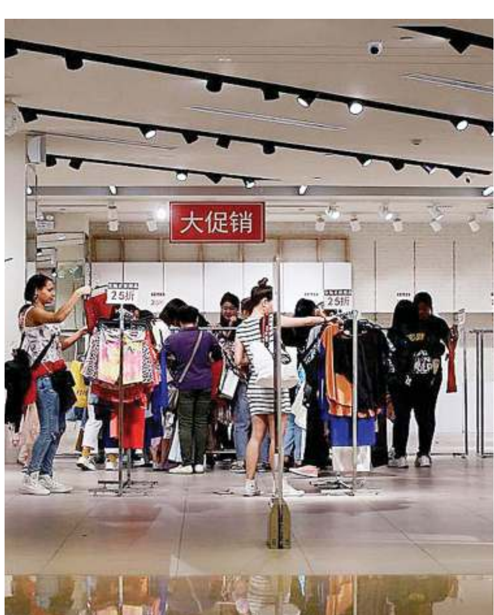
Low-price fashion chain Forever 21, a one-time hot destination for teen shoppers that became a victim of its own rapid expansion and changing consumer tastes, has filed for bankruptcy.

Founded in 1984, the recountries. Last week, it said it would exit Japan, closing all 14 stores there at the end rapidly over to e-commerce of October. Kirkland & Ellis was serving as the company's legal adviser, Alvarez & Marsal advised on restructuring and Lazard acted as