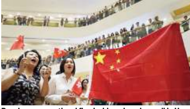
People wave a national flag inside a shopping mall in Hong

A dispatch by the International Journalists' Network (IJNet), a project of the Washington-based International Centre for Journal-