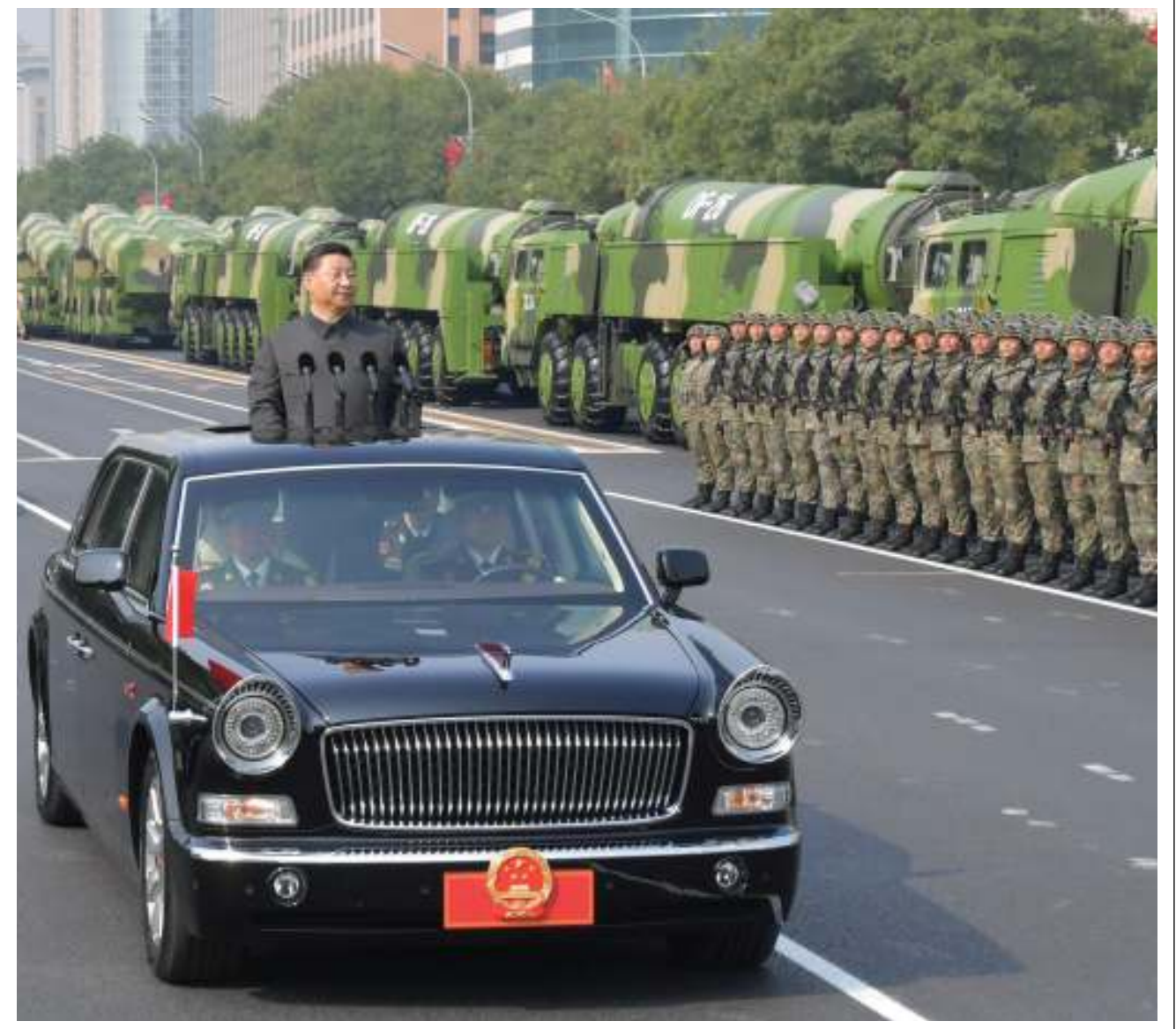
Chinese President Xi Jinping, also general secretary of the Communist Party of China (CPC) Central Committee and chairman of the Central Military Commission, reviews the armed forces during the celebrations for the 70th anniversary of the founding of the People's Republic of China in Beijing yesterday.

China has dispatched over 40,000 personnel to 24 UN peacekeeping operations since 1990, with 13 Chinese peacekeepers sacrificing their lives in the frontline of operations.