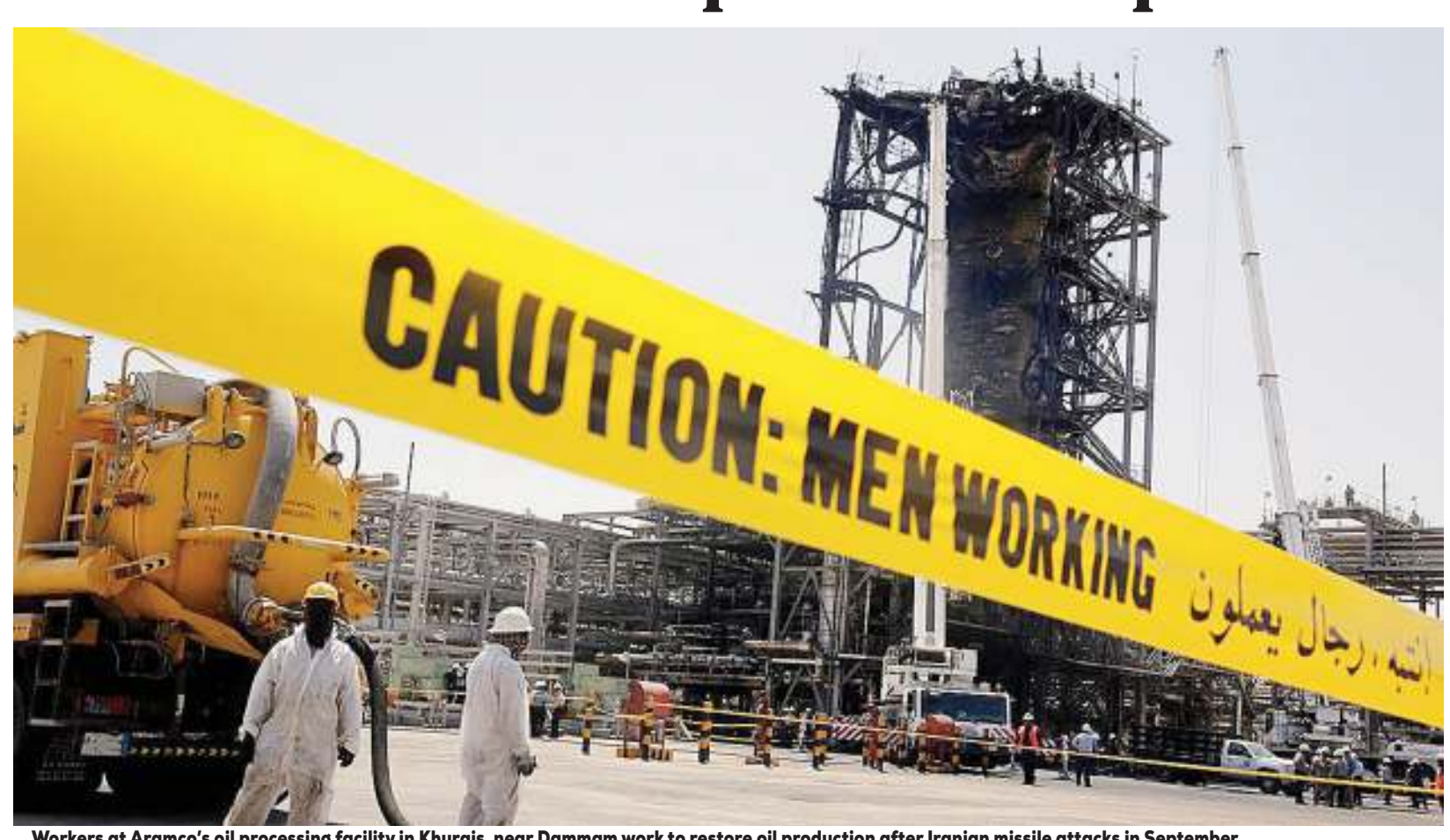
Workers at Aramco's oil processing facility in Khurais, near Dammam work to restore oil production after Iranian missile attacks in September.

Aramco restored production pre-attack levels following the strikes last month on its facilities, which cut off half of its supply and caused oil prices to spike, according to the chief executive of the company's trading unit.