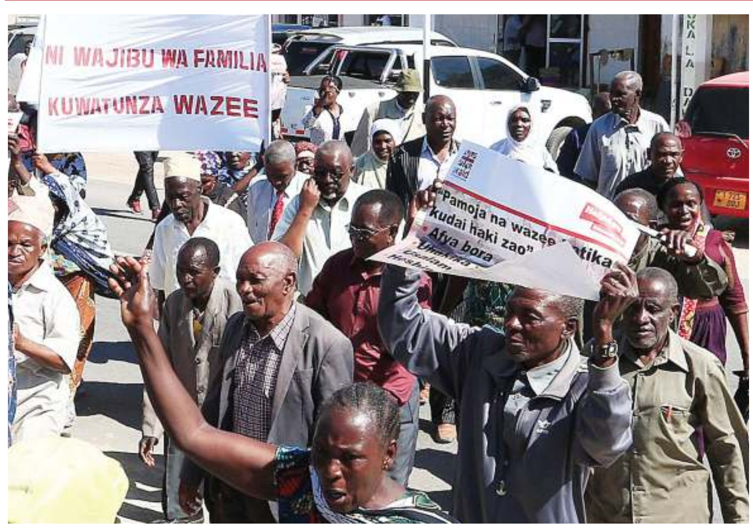
Senior citizens march to mark UN International Day of Older Persons in Dodoma city yesterday. This year's theme - "The Journey to Age Equality" - focuses on pathways of coping with existing and preventing future old-age inequality.