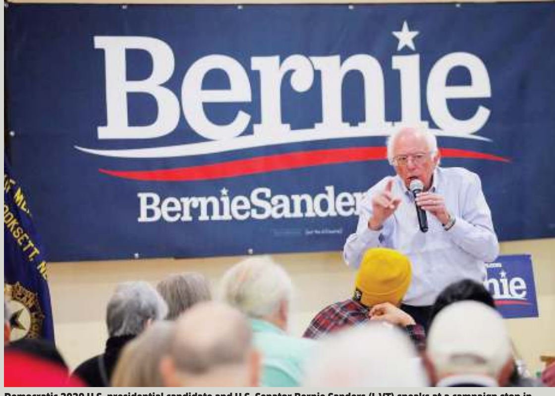
Democratic 2020 U.S. presidential candidate and U.S. Senator Bernie Sanders (I-VT) speaks at a campaign stop in Hooksett, New Hampshire, U.S., September 30, 2019.

Fundraising numbers are closely watched to assess candidates' viability and whether