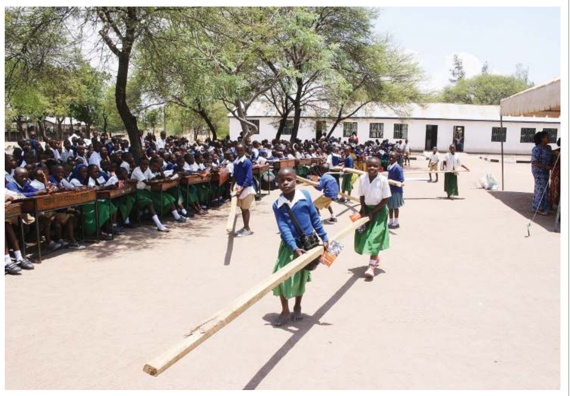
Pupils from Isandula Primary School in Magu District pictured on Monday carrying timber NMB Bank donated alongside desks and various other items worth 25m/- in total for

Its enormous carved doors are believed to be the largest in East Africa. Inside, the National Museum of History and Culture has exhibits on Swahili civilisation and