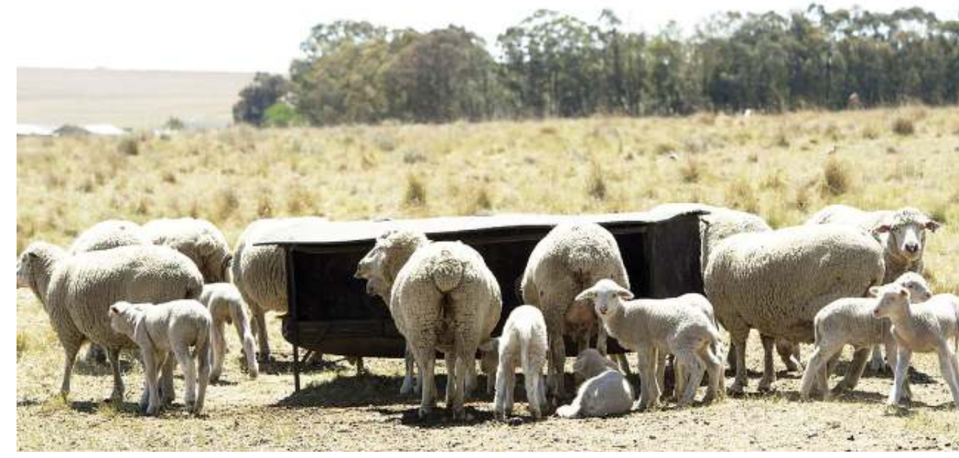
Black farmers in the Eastern Cape are running commercial entities - exporting some of their produce - and have created jobs for

Similar to what we hear from agribusinesses in other provinces, land reform and water policies are at the centre of discussions. The Co-op and the Eastern Cape farming community at large are engaged in these debates and are hoping for positive outcomes that would ensure the sustainability and growth of the agricultural and agribusiness sectors.