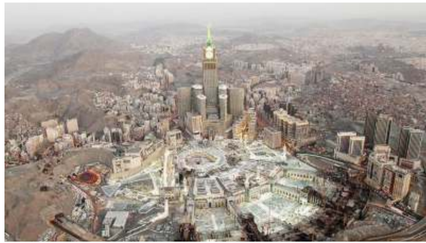
The European Commission added Saudi Arabia, Panama, Nigeria and other jurisdictions to a blacklist of nations seen as posing a threat because of lax controls on terrorism financing and money laundering, the EU executive said on Wednesday.