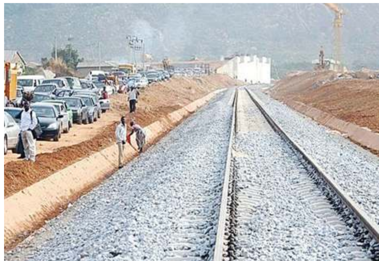
Construction work of the multi-trillion shillings Standard Gauge Railways going on in Dar es Salaam.

Owning a home is a dream that can be made a reality with a small amount of planning and discipline. With the right bank financing, home loans empower individuals to take a step forward and towards making their life more secure and comfortable.