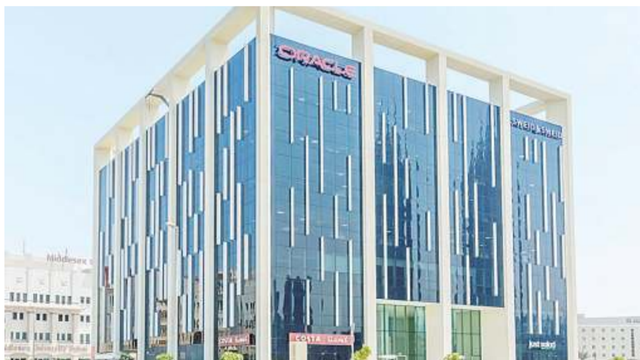
ENBD REIT bought Oracle-branded property The Edge for $76.2m in 2017.

"Our mandate is within the UAE. There is the ability to look at the wider Middle East region but that will be a small percentage of the portfolio," he said. "Saudi Arabia obviously offers an attractive market. But I don't see that happening in the next couple of years."