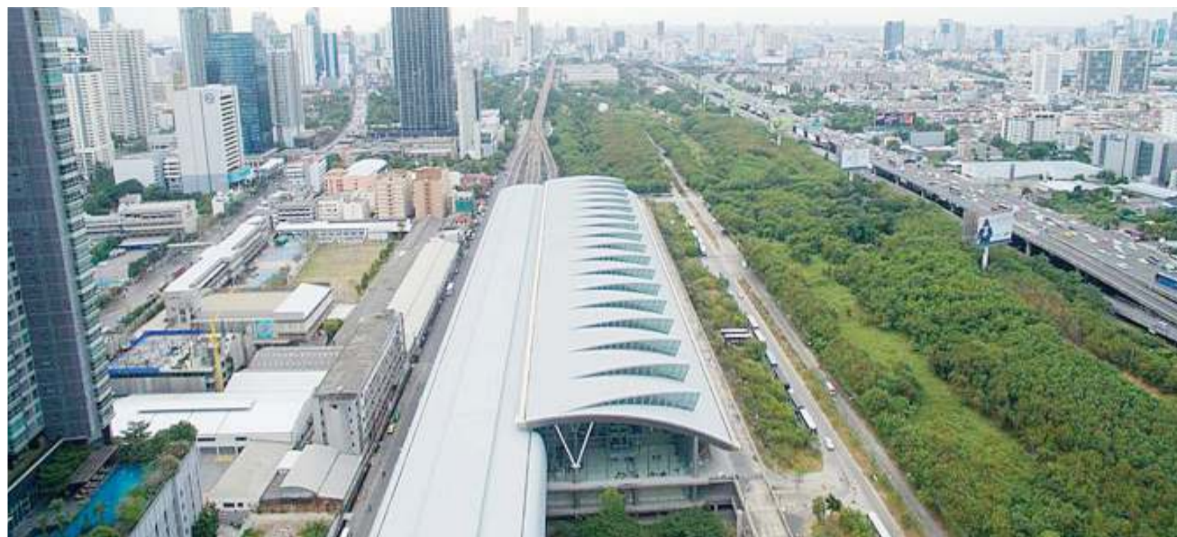
The Makkasan area in Bangkok is a battleground between developers and those wanting green space.

Singapore has been reclaiming land for decades, but that is increasingly unsustainable due to rising sea levels and other impacts of climate change, according to Reuters. So the city is going underground. It has already moved some infrastructure and utilities below ground, including train lines,