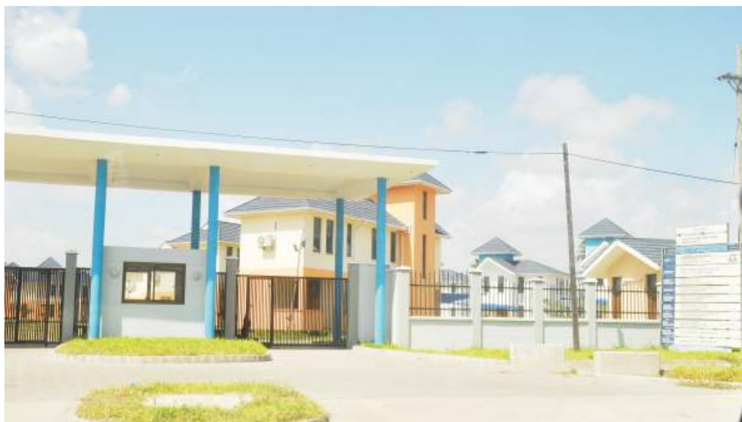
Main entrance to the Mikocheni Tanesco colourful single storey flats.

The controversial deal which allowed Mara Capital to relocate all police officers at the Oyster-bay barracks, demolish the single unit residential houses with