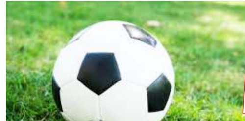
SIMBA AND YANGA READY FOR DERBY PAGE 20