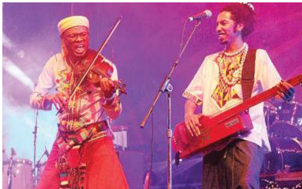
Moroccan band, Bob Maghrib, performs at the 2017 edition of Sauti za Busara festival in Zanzibar.