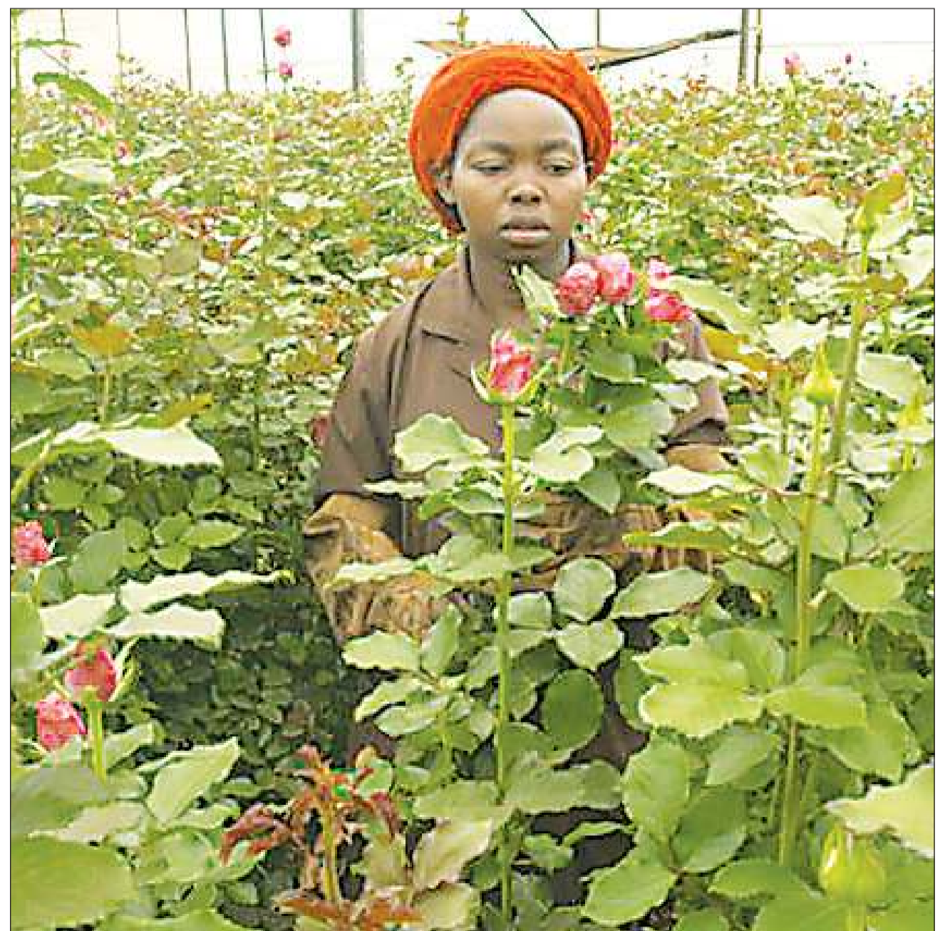
Several flower farm workers told Al Jazeera they earned little more than $100 a month