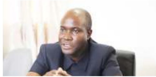
MOI CONDUCTS HIP AND SPINAL SURGERIES PAGE 4