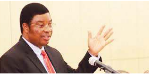
GOVT WORKING ON RESEARCH FINDINGS PAGE 3