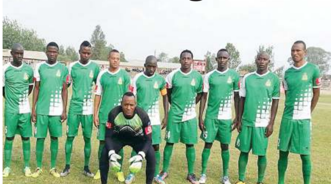
Prisons' players in a group picture before taking part in a recent match in the ongoing Mainland Premier League.