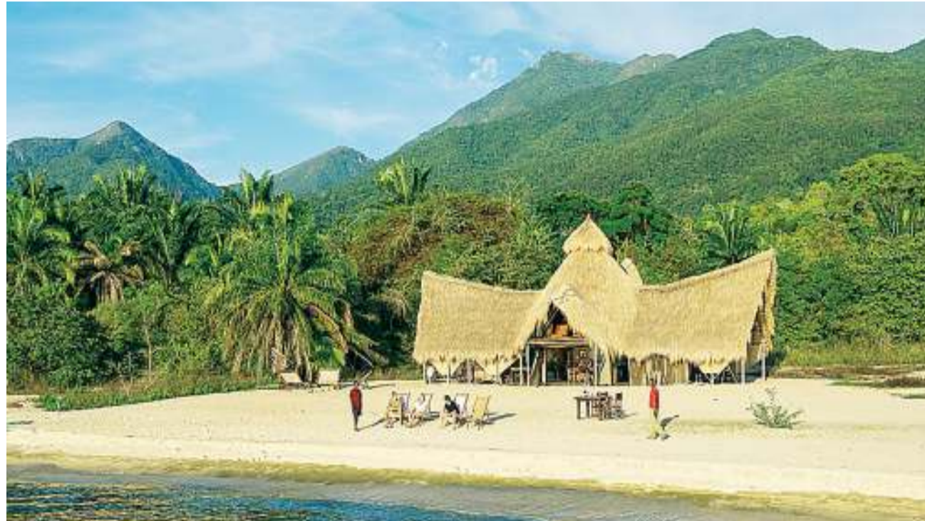
Greystoke Mahale Lodge on the shore of Lake Tanganyika. File photo.

Our approach depends on compensating communities for enforcing land-use plans that include the provision for setting aside natural habitat for protection under village by-laws. The forests harbour large carbon stocks, and when they are destroyed for shifting agriculture, charcoal production or timber extraction, carbon dioxide is released, thereby contributing to global climate change, which affects rural communities in Tanzania and