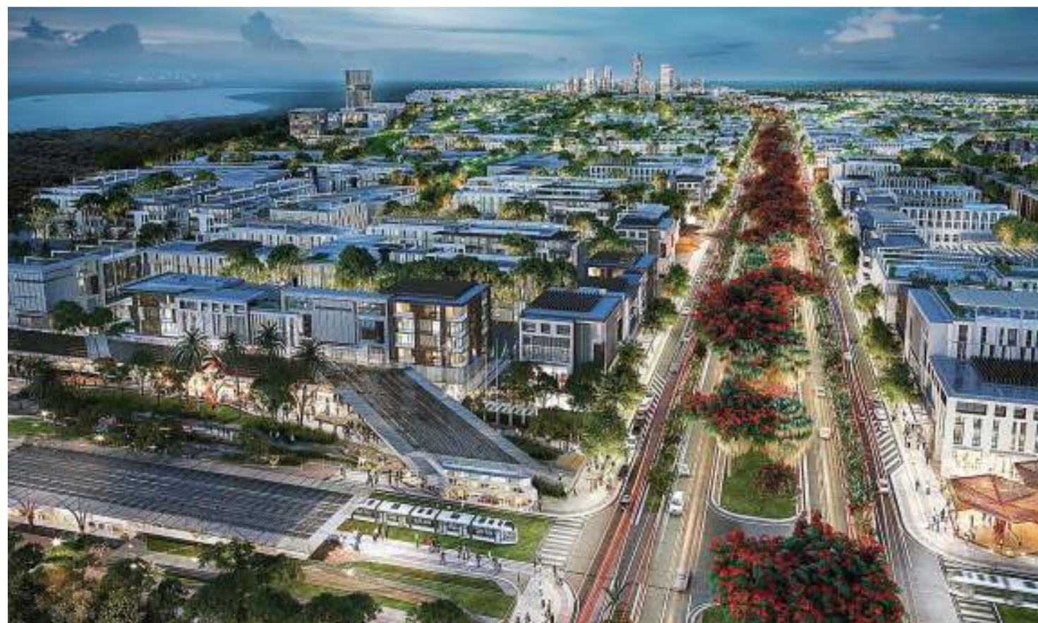
An illustration of Alárò City in Lagos, Nigeria.

"This is indeed a very auspicious day. I am really delighted to join with our partners, the Lagos State government, to break ground on the historic new city for Lagos, in the north west quadrant of the Lekki free zone in Epe."