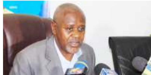
CHALLENGES FACING RURAL CUSTOMERS PAGE 6