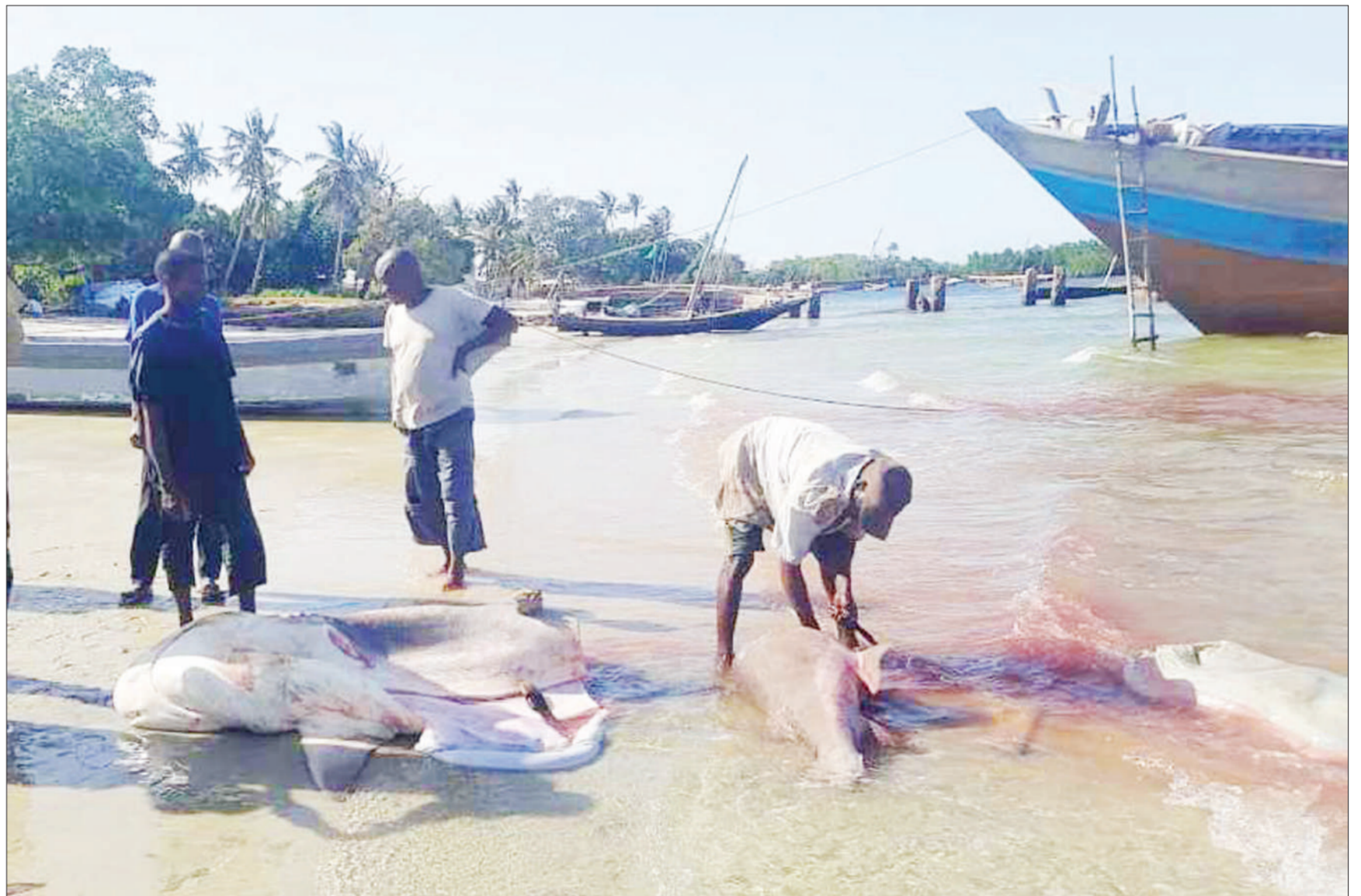
Moa ward fishermen in Mkinga district, Tanga region; look at a 174 kg sharks, caught in the Indian Ocean yesterday. The fish is said to be the largest ever caught by fishermen in the district.

"If (the next pandemic) happens, we want to make sure we do a better job of controlling that pandemic through easy access to vaccines, easy access to diagnostics, as well as treatments," he said.