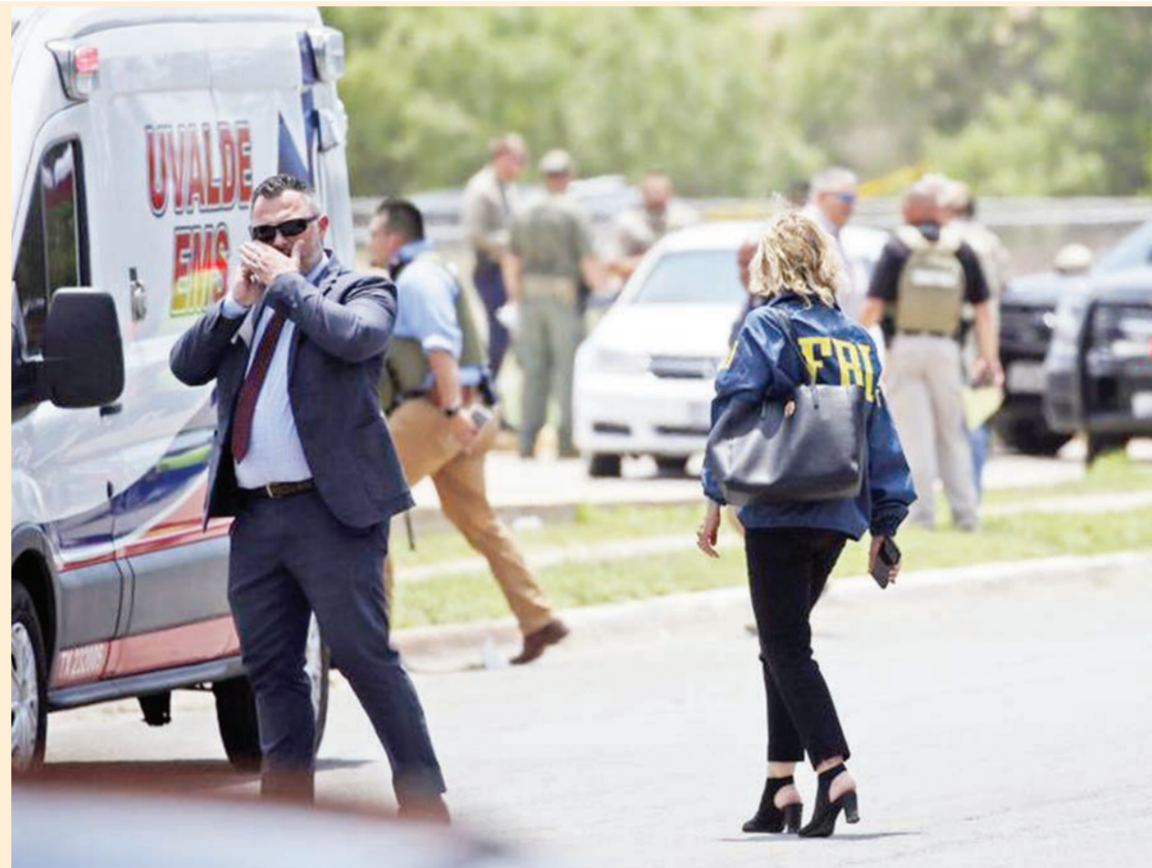
Law enforcement personnel, including the FBI, gather near Robb Elementary School following a shooting, May 24, 2022, in Uvalde, Texas.

Ten days earlier an avowed white supremacist shot 13 people at a supermarket in a mostly Black neighborhood of Buffalo, New York, re-igniting a national