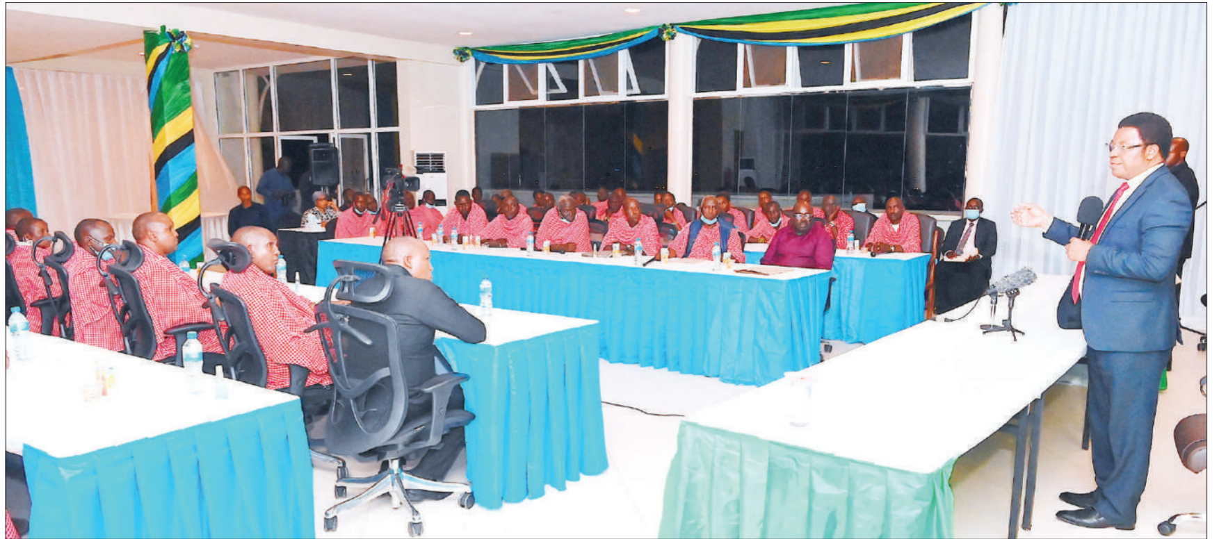
Prime Minister Kassim Majaliwa talks to councilors, village chairpersons who included Ngorongoro MP Emmanuel Shangay, youth and women representatives when he received suggestions from the people of Ngorongoro, Loliondo and Sale divisions in Ngorongoro District on how to maintain the Ngorongoro Conservation Area at the Prime Minister's Office in Dodoma on Wednesday.

The government minimized the use of ICDS following a crackdown in 2016 to track tax evasion networks. All cargo and especially vehicles are stored at the Tanzania Ports Authority (TPA) storage facility at the port.