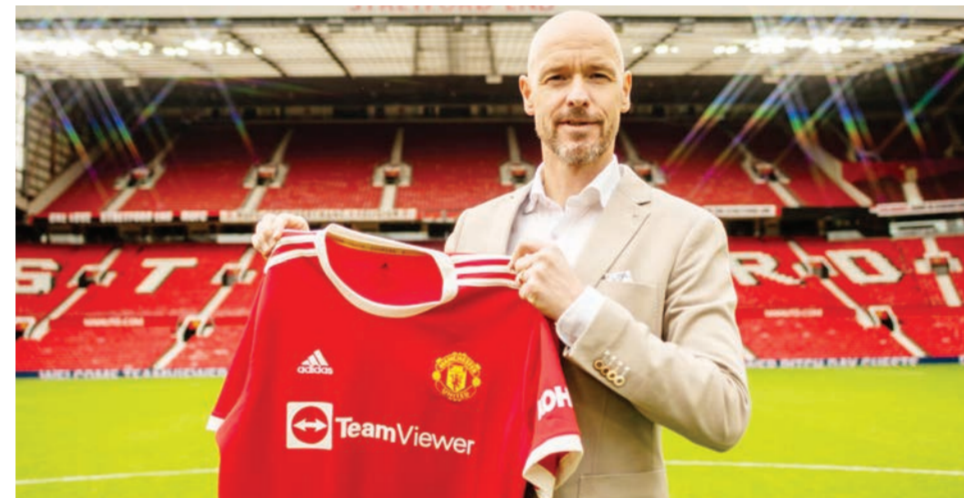
Erik ten Hag

ished fourth in his first season but was sacked after his second despite winning the FA Cup, having finished only fifth in the league. Mourinho, appointed in 2016, finished sixth in his first season but made it to the Champions League courtesy of lifting the Europa League trophy. Second in 2018, he kept his job but was sacked the following December with his team adrift in the race for the top four. Solskjaer finished third and then second in his two full seasons but, like Mourinho, was sacked before Christmas in his third year, in part, because the prospect of Champions League football was drifting away.