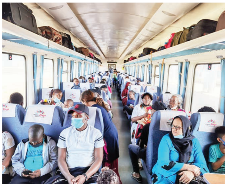
Passengers are seen on the train to Mombasa at Nairobi station of Mombasa-Nairobi Standard Gauge Railway (SGR) in Nairobi. File photo

As the providers of commercial agricultural services continue to diversify and their scope of services continues to expand, they will play more important roles and bring tangible benefits to more farmers across the country.