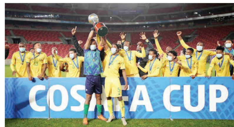
South Africa's national football squad jubilates after lifting the 2021 COSAFA Senior Challenge Cup tournament's title in the showpiece that was played in Gqeberha, Eastern Cape.