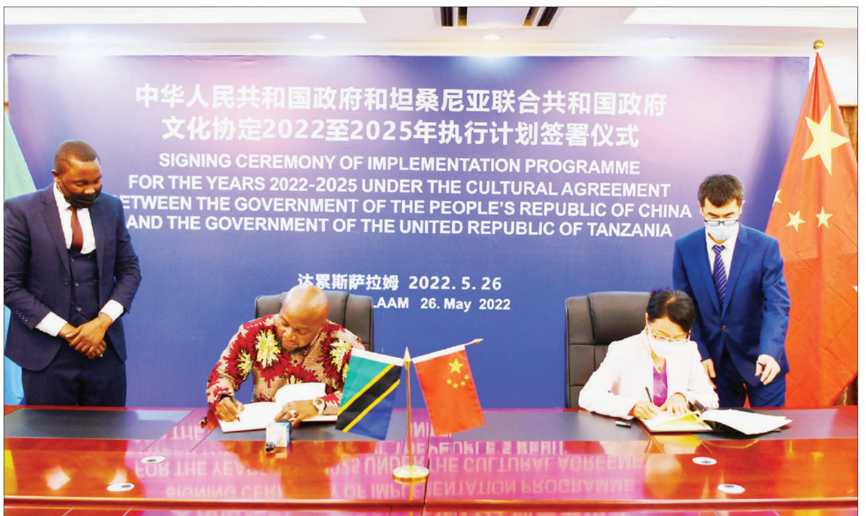
Chinese ambassador to Tanzania Chen Mingjian and minister of Culture, Arts and Sports, Mohamed Mchengerwa sign the Implementation Programme for 2022-2025 under the cultural agreement between the government of the People's Republic of China and the government of the United Republic of Tanzania in Dar es Salaam yesterday.

The premier commended President Samia Suluhu Hassan for allocating funds to strategic areas in the 2022/23 financial year such as the health and education sectors.