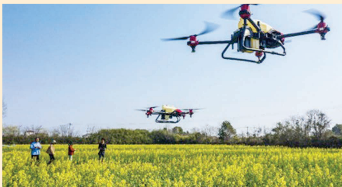
A team of "farmland nannies", people who are hired to tend and manage farmlands for others, carry out disease and pest prevention and control operations in an oilseed rape field of a major grain grower in Zhandian village, Leqiao township, Lujiang county, Hefei city, east China's Anhui province, March 11, 2022. File photo

"Hiring 'nannies' for crops ensures timely spring farming,