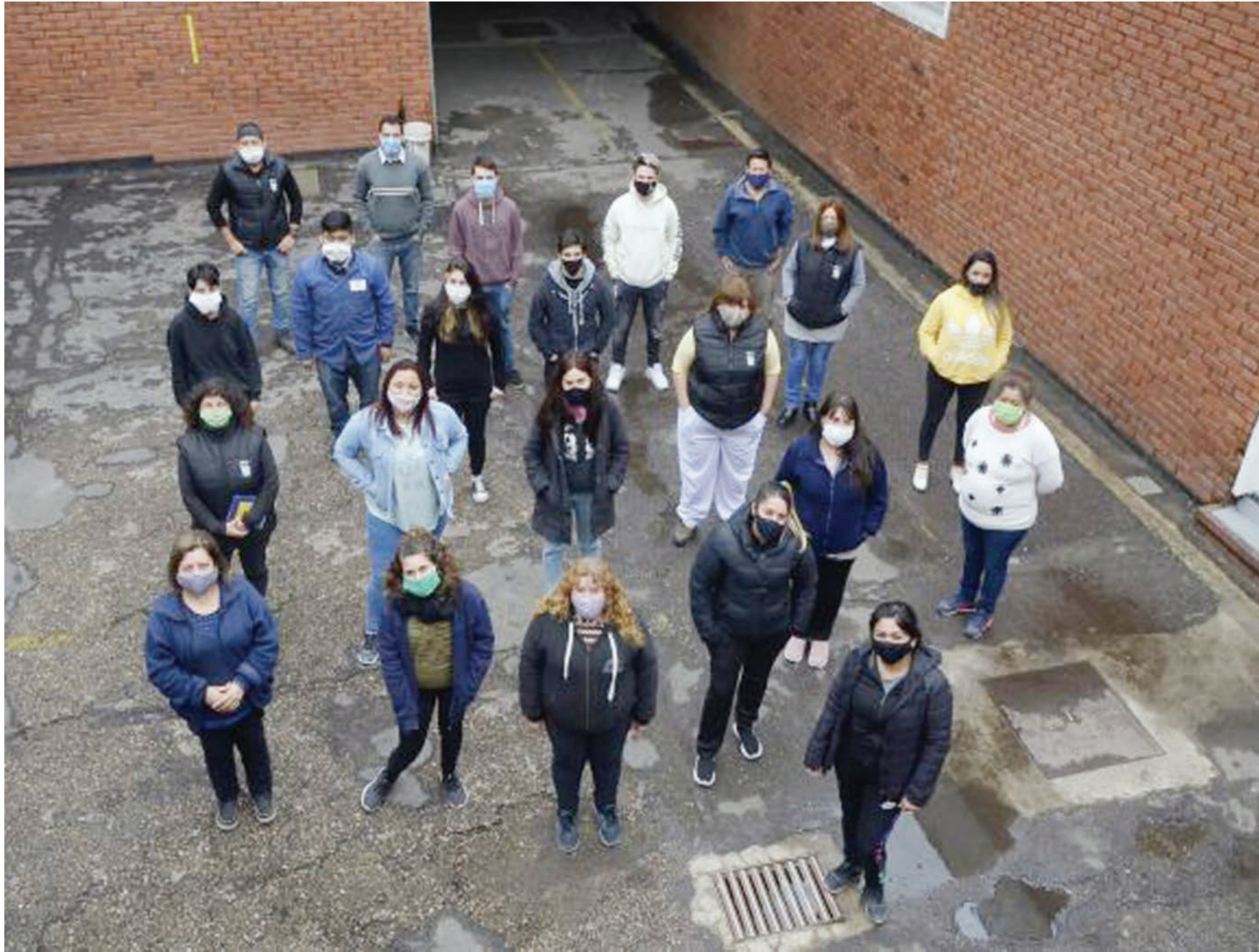
A group of Farmacoop workers stand in the courtyard of their plant in Buenos Aires. Members of the Argentine cooperative proudly say that theirs is the first laboratory in the world to be recovered by its workers.

out of work, poverty had reached 60 percent and one of the difficulties was that companies were collapsing, the owners disappeared and the people working in those companies wanted to continue producing,” he said.