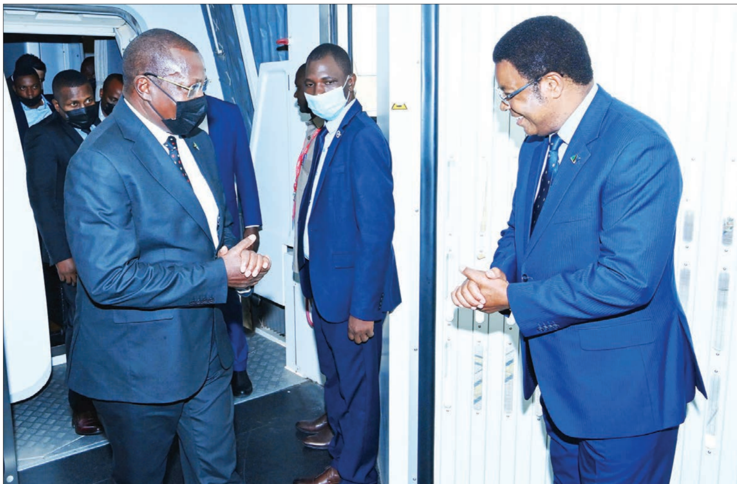
Vice President Dr Philip Mpango exchanges greetings with Prime Minister Kassim Majaliwa just after landing at the Julius Nyerere International Airport in Dar es Salaam yesterday from Davos in Switzerland, where the VP represented President Samia Suluhu Hassan at the World Economic Forum high level gathering.