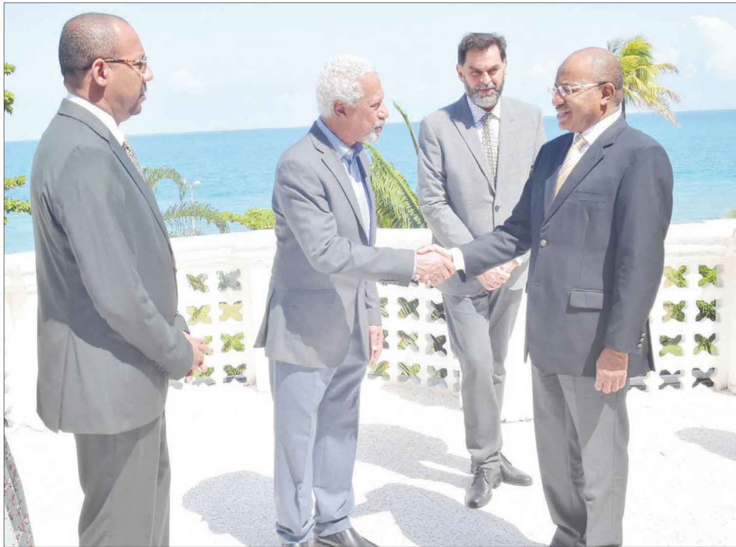
Zanzibar President Dr Hussein Ali Mwinyi bids farewell to his laureate guest, winner of the Nobel Prize for Literature (2021) Prof. Abdulrazak Gurnah after a courtesy call at the Zanzibar State House yesterday.

SCHOOLGIRLS GET 1,878 SANITARY TOWELS PAGE 7