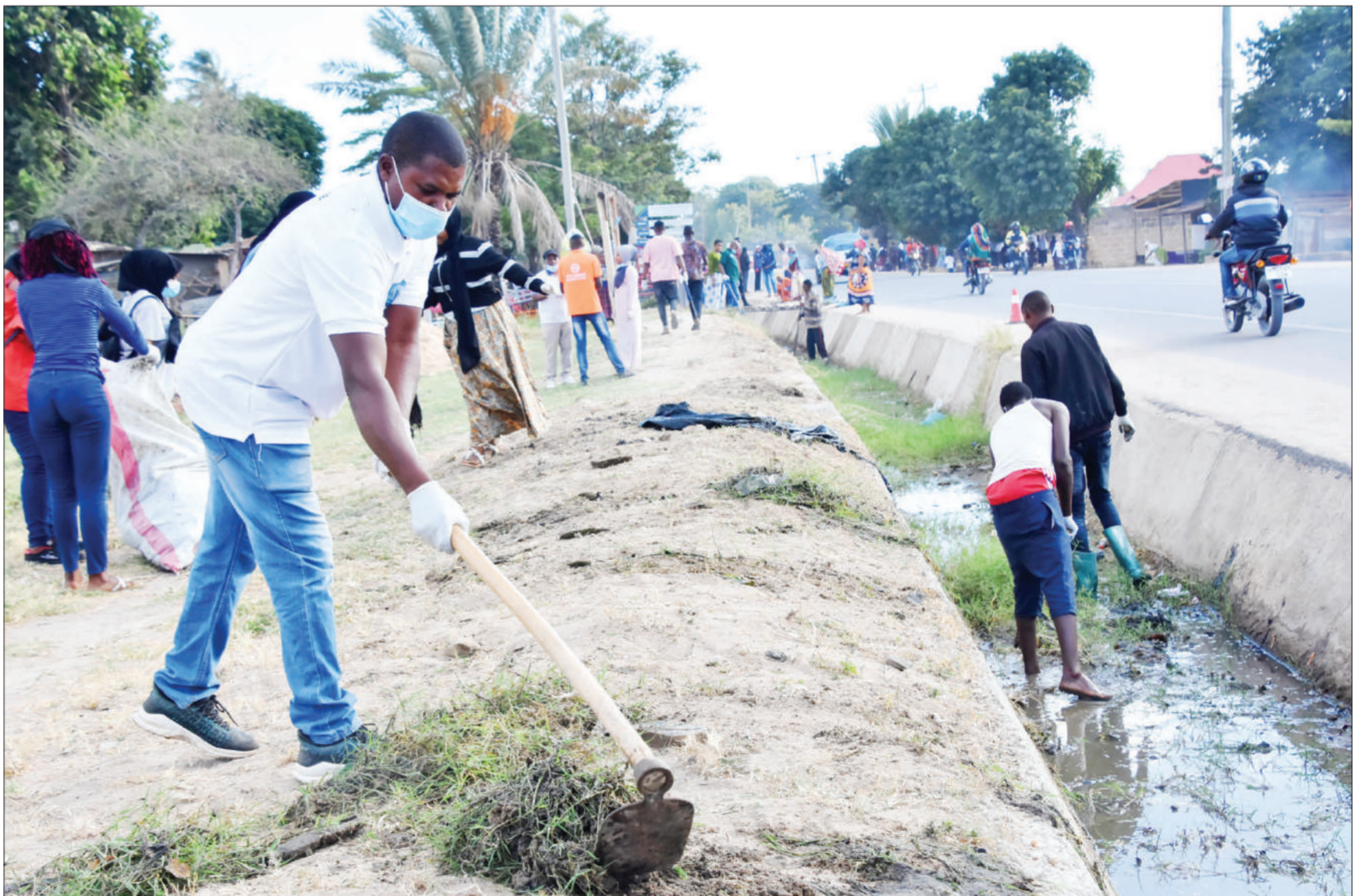
Maili Mbili residents at Mnadani ward in Dodoma region keep environment clean and safe along Dodoma-Arusha highway on Tuesday.