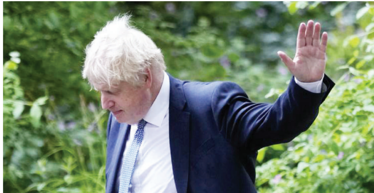
British Prime Minister Boris Johnson waves as he walks down the Downing Street after a press conference in London, on Tuesday. An official report into lockdown-breaching UK government parties says blame for a "culture" of rule-breaking in Prime Minister Boris Johnson's office must rest with those at the top.