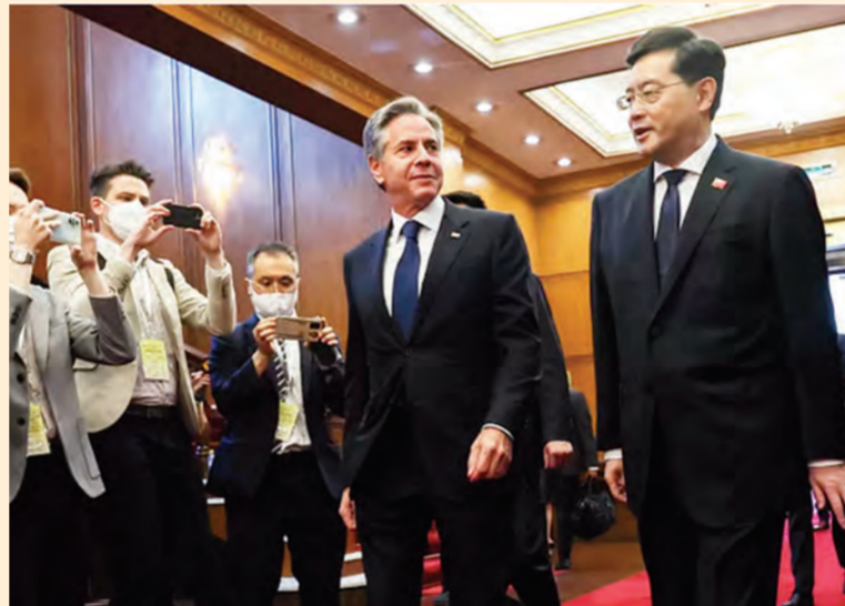
Anthony Blinken (L), who arrived in Beijing yesterday, is the highest-ranking member of President Joe Biden's administration to visit China

"I'm hoping that over the next several months I'll be meeting with Xi again, and talking about legitimate differences we have but also how ... to get along,"