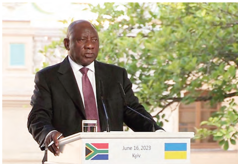
'The road to peace is not an easy one,' said President Cyril Ramaphosa in Ukraine

THE war in Ukraine must end, South Africa's President Cyril Ramaphosa has told Russia's leader Vladimir Putin.