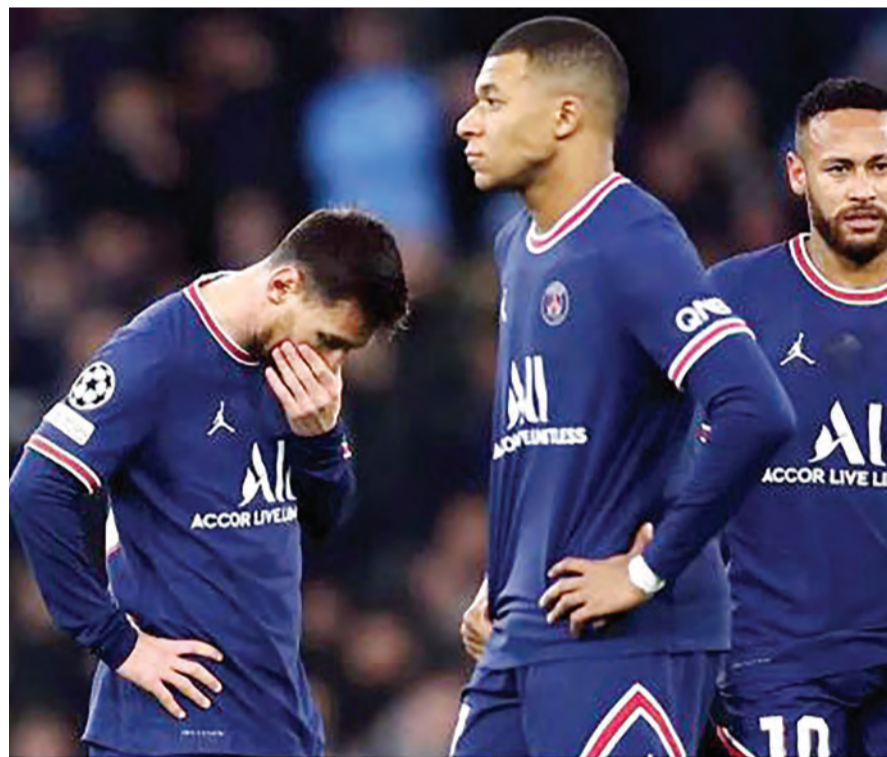
Kylian Mbappé, Lionel Messi and Neymar were unable to guide PSG to Champions League glory.

"What influence does the President have? On my career today, in 2023, none. He wants me to