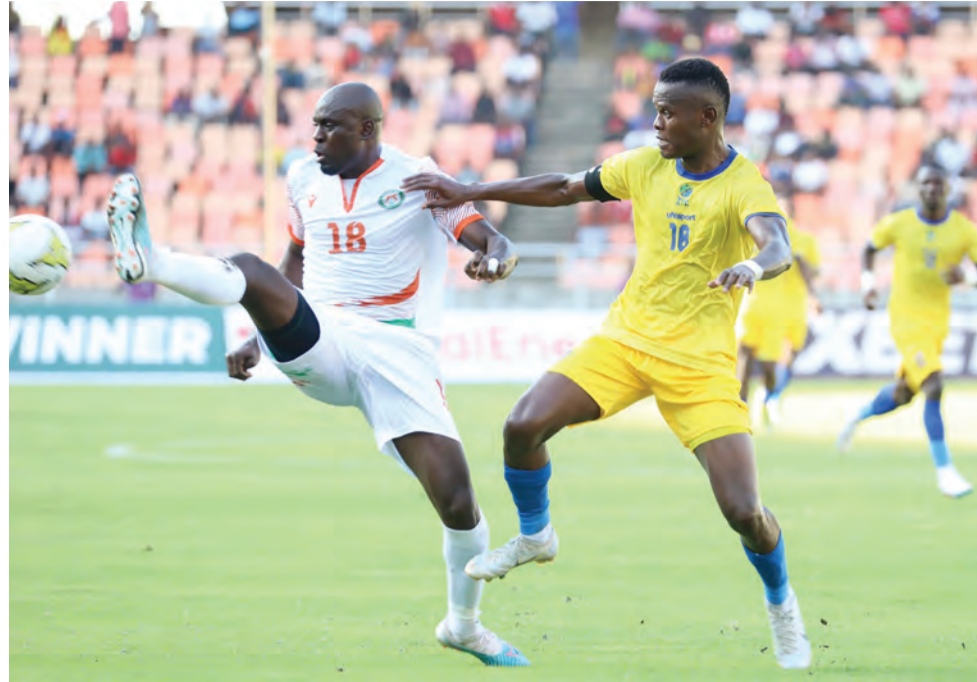
Taifa Stars skipper, Mbwana Samatta (R), battles for possession with Niger's central defender, Ousmane Diabaté, when they locked horns in a 2023 Africa Cup of Nations Qualifiers tie at Benjamin Mkapa Stadium in Dar es Salaam yesterday. Taifa Stars commanded a 1-0 victory.