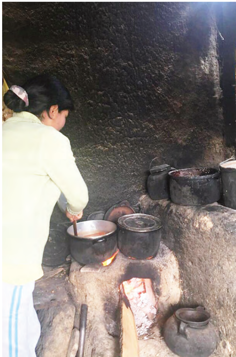
A typical, unhealthy house in rural Peru where cooking is done using firewood in a closed room without a chimney, which causes smoke to spread throughout the house and damages the health of the families.

door, are growing in number,” she said. She also created a space for a gas cylinder stove and a dining room that she uses when there are guests and she needs more cooking power than just the woodstove, to prepare the food in less time.