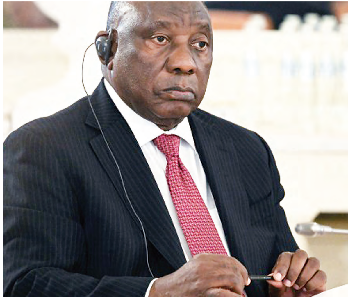
A handout photo made available by Photo host Agency RIA Novosti shows South African President Cyril Ramaphosa listening to Russian president during a meeting with a delegation of African leaders and senior officials on the sidelines of the St. Petersburg International Economic Forum in Russia on 17 June 2023.

"We undertook this mission because, as Africans, unfortunately we have managed many conflicts and it is through dialogue and negotiation we can resolve these problems. Our experience we would like to share with you in order to find a positive settlement to this crisis.