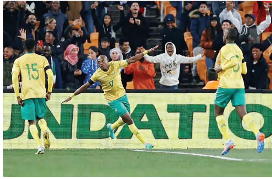
Zakhele Lepasa (C) celebrates scoring for South Africa against Morocco in an Africa Cup of Nations qualifier in Johannesburg on Saturday.

Hakim Ziyech halved the deficit on the hour, but an equaliser eluded Morocco, who last De-