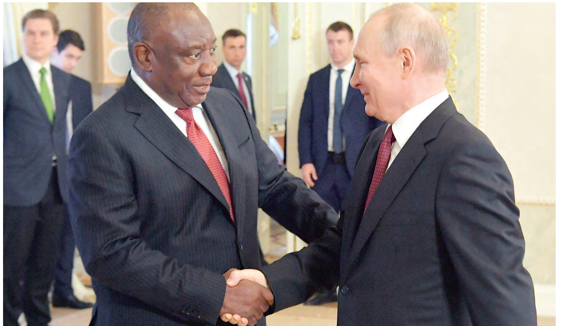
A handout photo made available by Photo host Agency RIA Novosti shows Russian President Vladimir Putin (R) shaking hands with South African President Cyril Ramaphosa (L) during a meeting with a delegation of African leaders and senior officials on the sidelines of the St. Petersburg International Economic Forum in Russia on 17 June 2023.