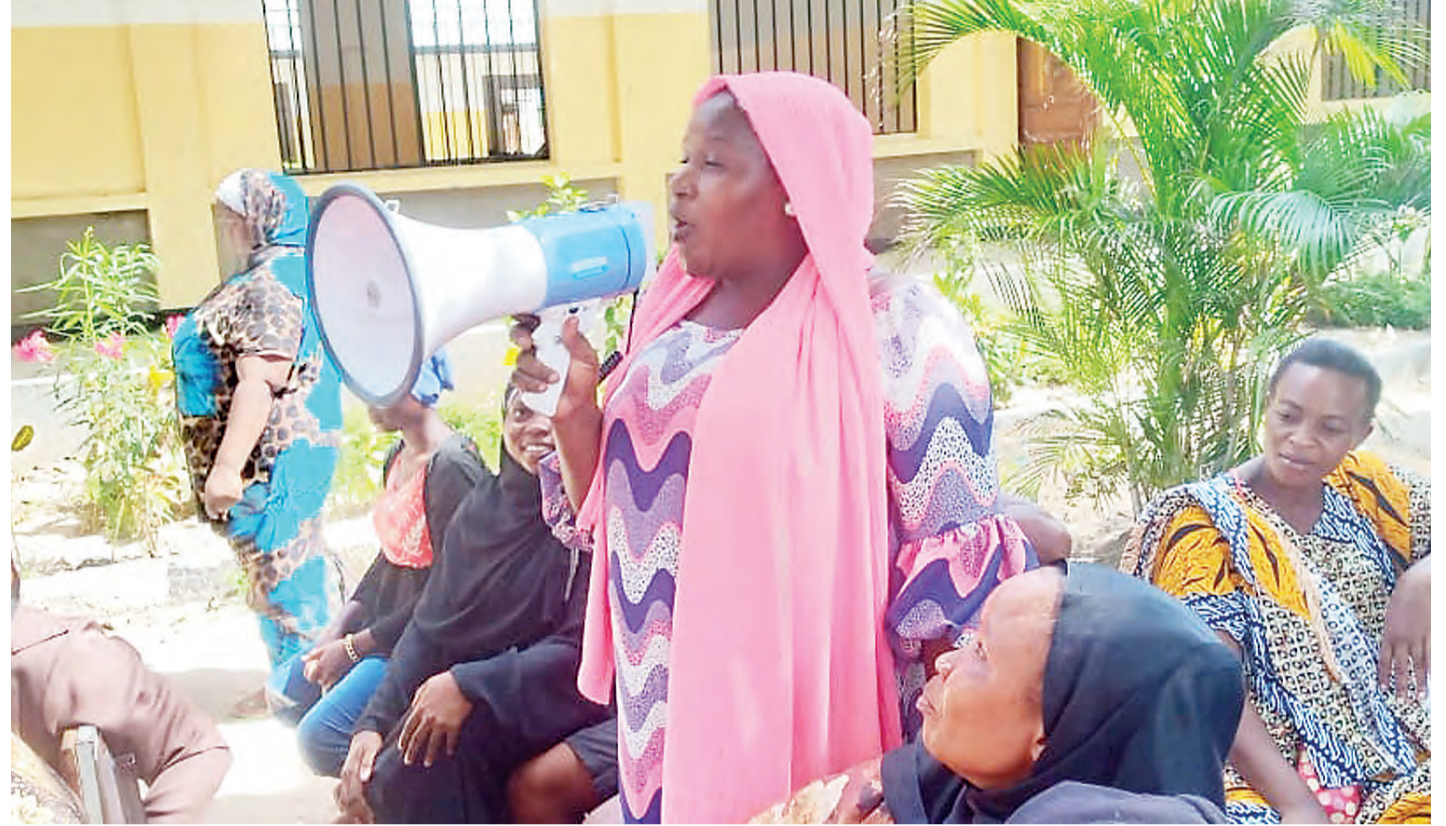
The mother of one of the students of Dar es Salaam's Urafiki Secondary School airs her views in the city at the weekend at a meeting sexual corruption, sexual violence and under-age marriages organised by a CSO called Tanzania Gender Equality Organisation.