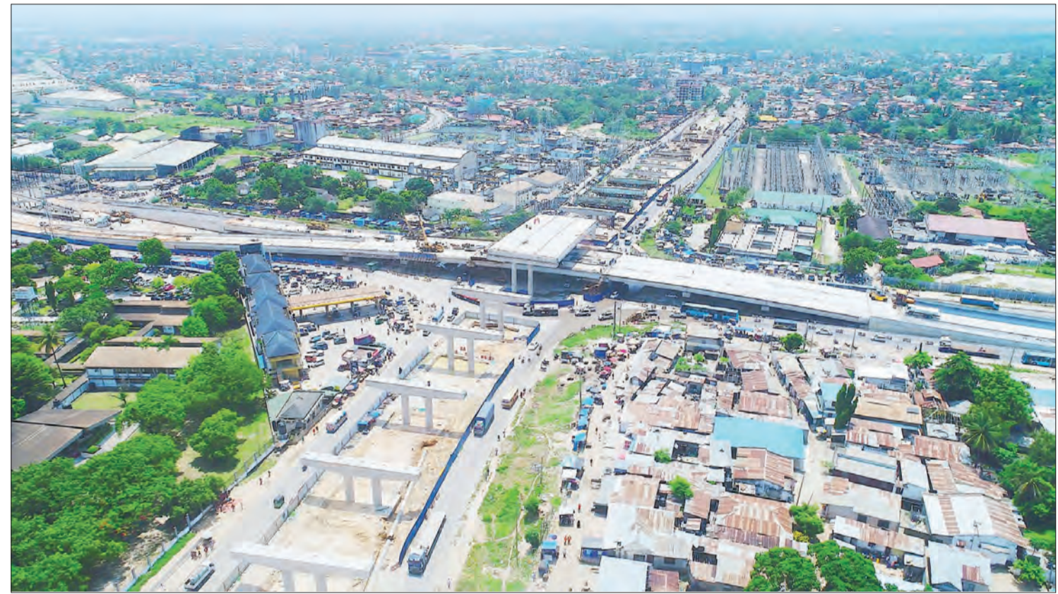
Ubungu interchange construction that is going on has now reached 65 per cent of the whole project as seen from above, pictured in Dar es Salaam yesterday. The interchange will reduce congestion at the Ubungu junction of Mandela and Sam Nujoma roads.