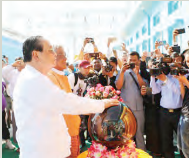
Myanmar's Union Minister for Electricity and Energy U Win Khaing inaugurates the 230KV Naba-Shwebo-Ohntaw Power Transmission Line and Substation Project undertaken by the State Grid Corporation of China at the completion ceremony of the project.

U Win Khaing believes that as an important part of the BRI,