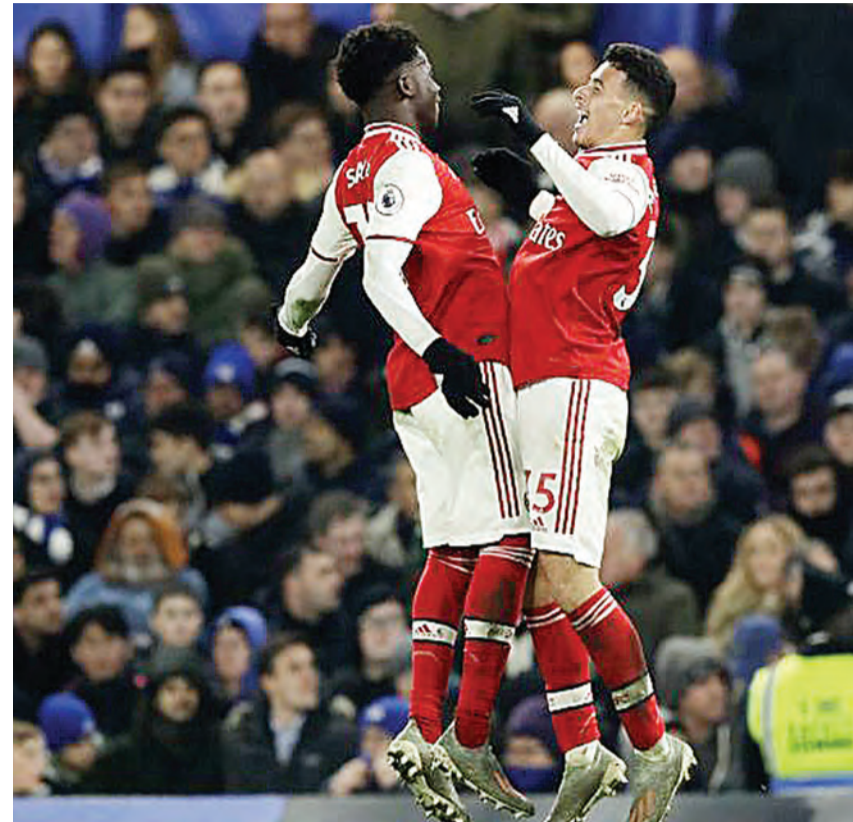
Arsenal's Gabriel Martinelli, right, celebrates with Arsenal's Bukayo Saka after scoring his side's opening goal during the English Premier League soccer match between Chelsea and Arsenal at Stamford Bridge Stadium in London, Tuesday, Jan. 21, 2020.