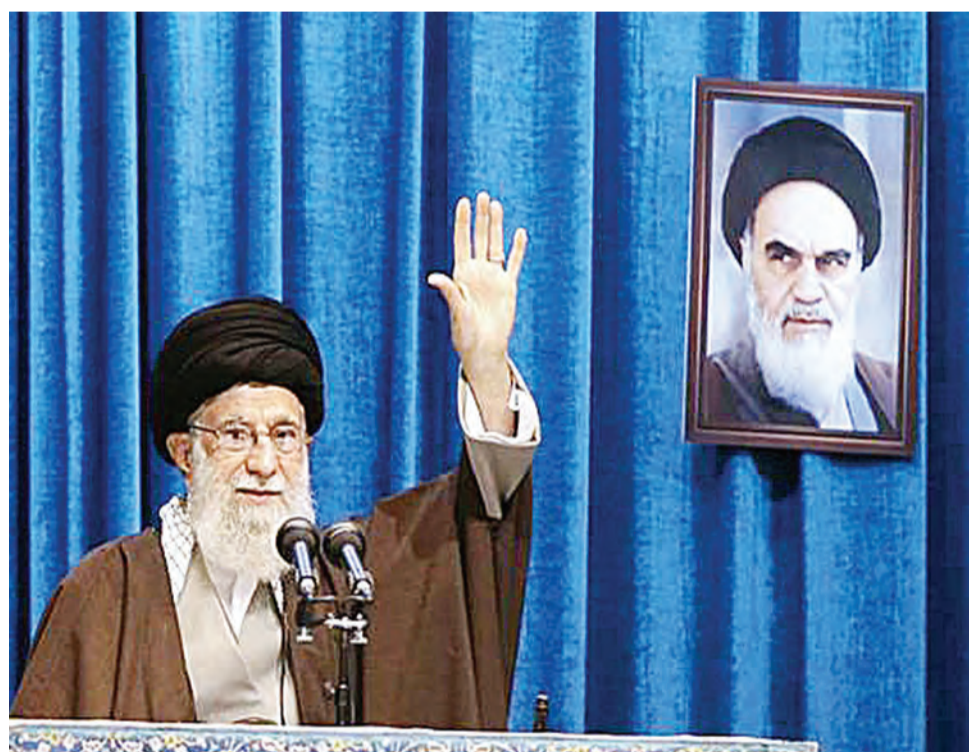
Supreme Leader Ali Khamenei delivered a sermon during Friday prayers at Imam Khomeini Grand Mosque in Tehran on January 17, 2020. File photo

On January 17, Iranian Supreme Leader Ali Khamenei outlined the way forward for Iran. In a rare speech during Friday prayers in Tehran, he called the Quds Force, "the fighters without border", declared that the European Union should not be trusted "because of their track record and their support for Saddam during the Iran-Iraq War", and called on Iranians to put their collective efforts