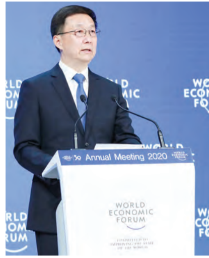
Chinese Vice Premier Han Zheng

He said the global community should "keep to the goal of safeguarding peace, promoting development, upholding equity and justice, and pursuing mutual benefit and win-win outcomes," calling for joint efforts "to tackle global challenges such as pov-