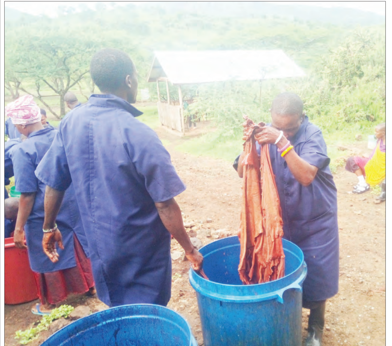
Maasai livestock keepers in Longido district, Arusha region have been trained on traditional processing of hides into leather by Oikos East Africa experts yesterday.

In developing countries, an estimated 90 per cent of children, teens, and adults who require a wheelchair are unable to acquire one.