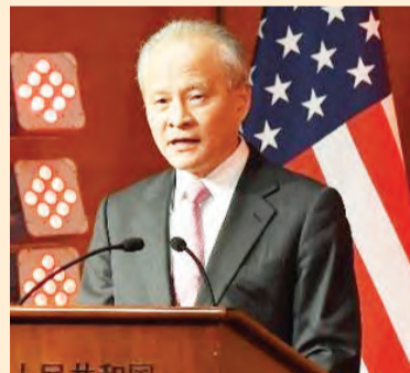
as the two sides respect each other's dignity, sovereignty, and core interests," he said.

"There is no difficulty that cannot be overcome as long