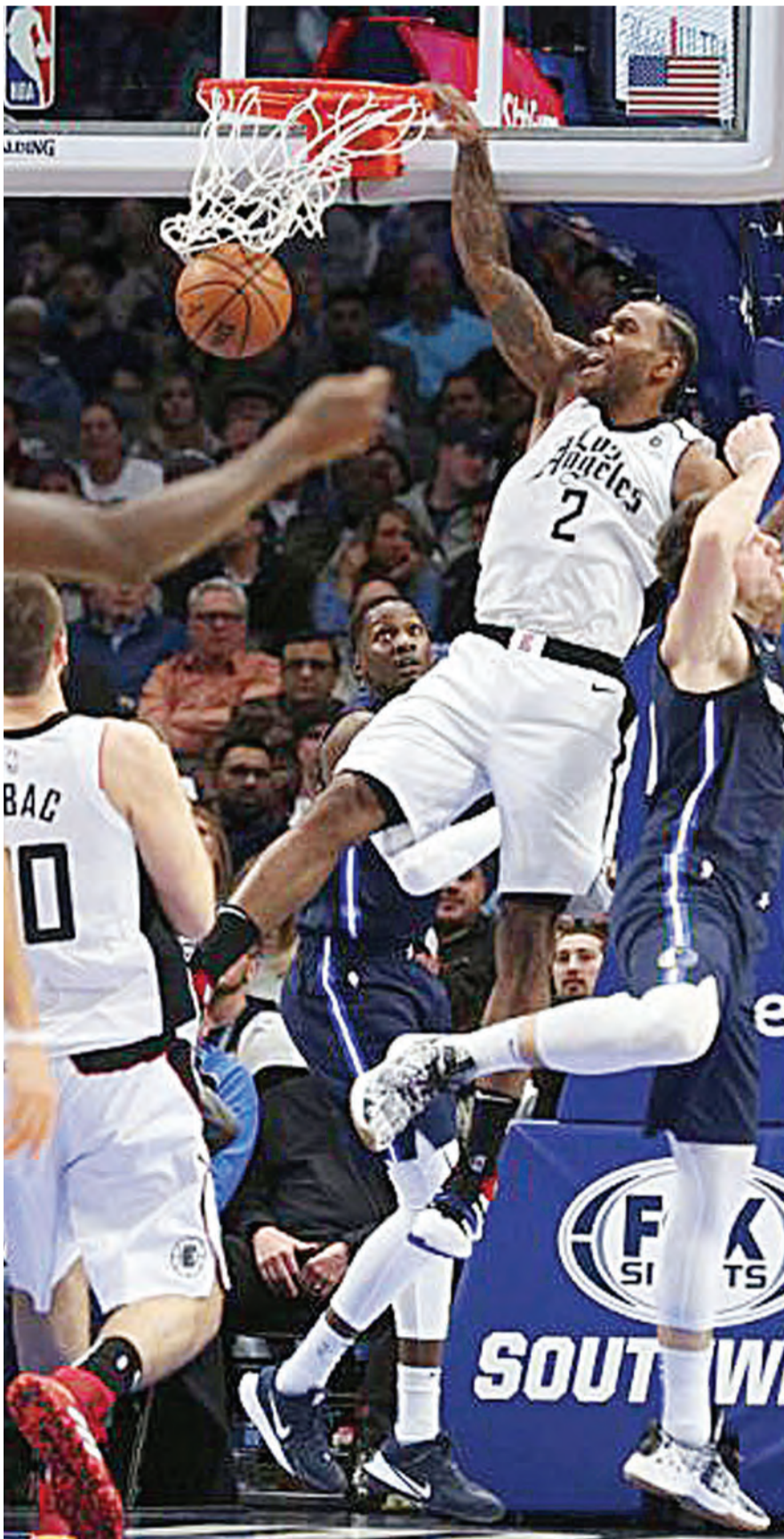
Los Angeles Clippers forward Kawhi Leonard (2) dunks the ball over Dallas Mavericks forward Luka Doncic (77) in during the first half of an NBA basketball game Tuesday, Jan. 21, 2020 in Dallas.

THE Dallas Mavericks brought back one big man but lost another Tuesday night, and in the end, they couldn't rein in the reigning Finals MVP.