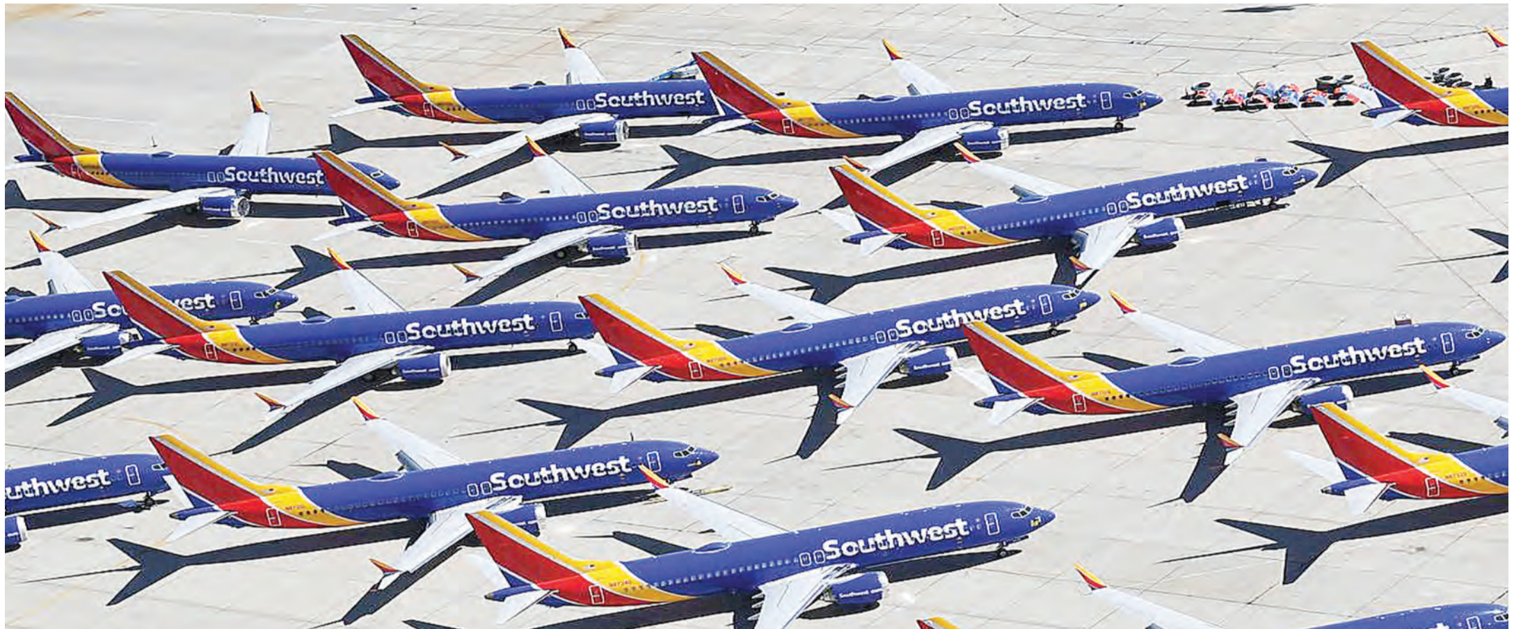
Boeing says 737 Max jets not likely to fly until summer

gested the fixes were almost ready to be submitted to regulators and approval was imminent. But in December, FAA Administrator Stephen Dickson pushed back against Boeing's then-CEO Dennis Muilenburg for suggest-