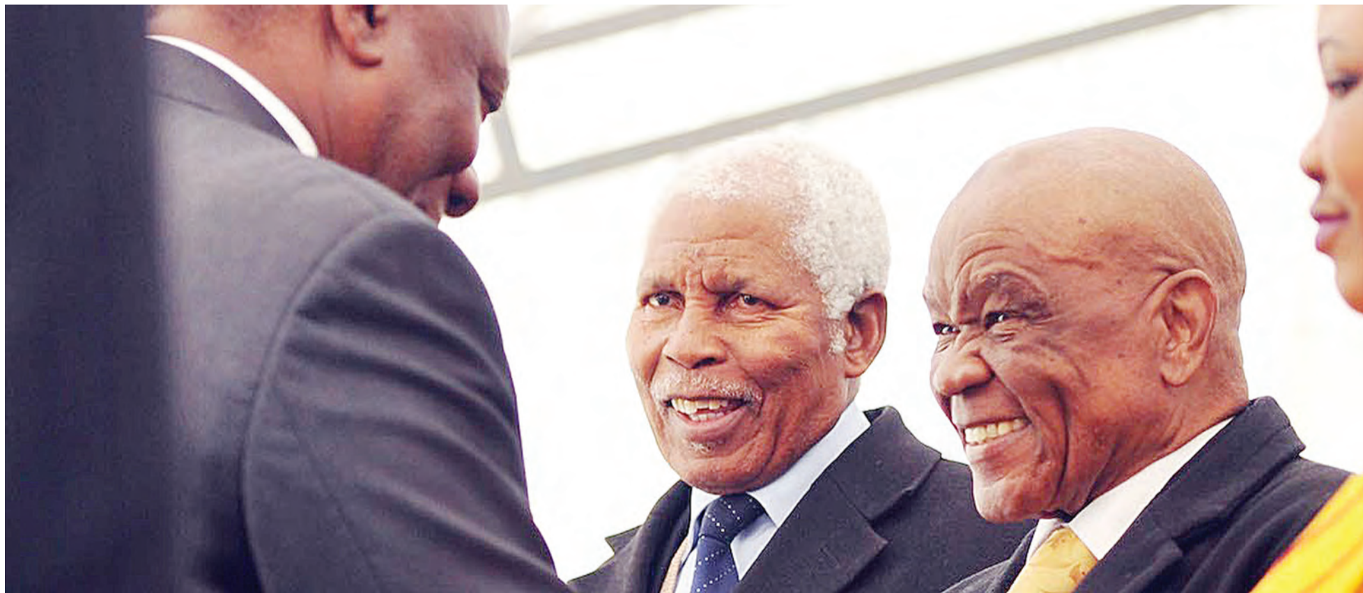
Would scrapping its borders with South Africa really solve Lesotho's dire political problems?

Earlier this month South Africa's finance minister Tito Mboweni threw the cat among the pigeons by suggesting that Lesotho's borders be scrapped and the country be made part of a