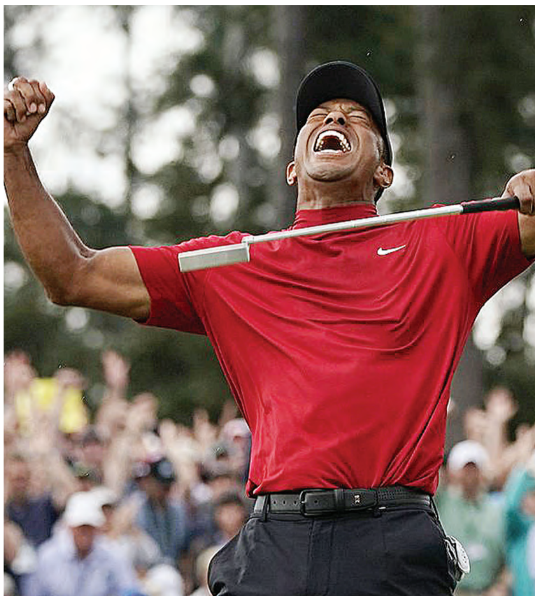
In this April 14, 2019 file photo, Tiger Woods reacts as he wins the Masters golf tournament in Augusta, Ga. Woods' victory at the Masters might not have been the most important sports story of 2019. It was certainly one of the most uplifting. Voters chose Woods' dramatic comeback at Augusta National as The Associated Press sports story of the year.