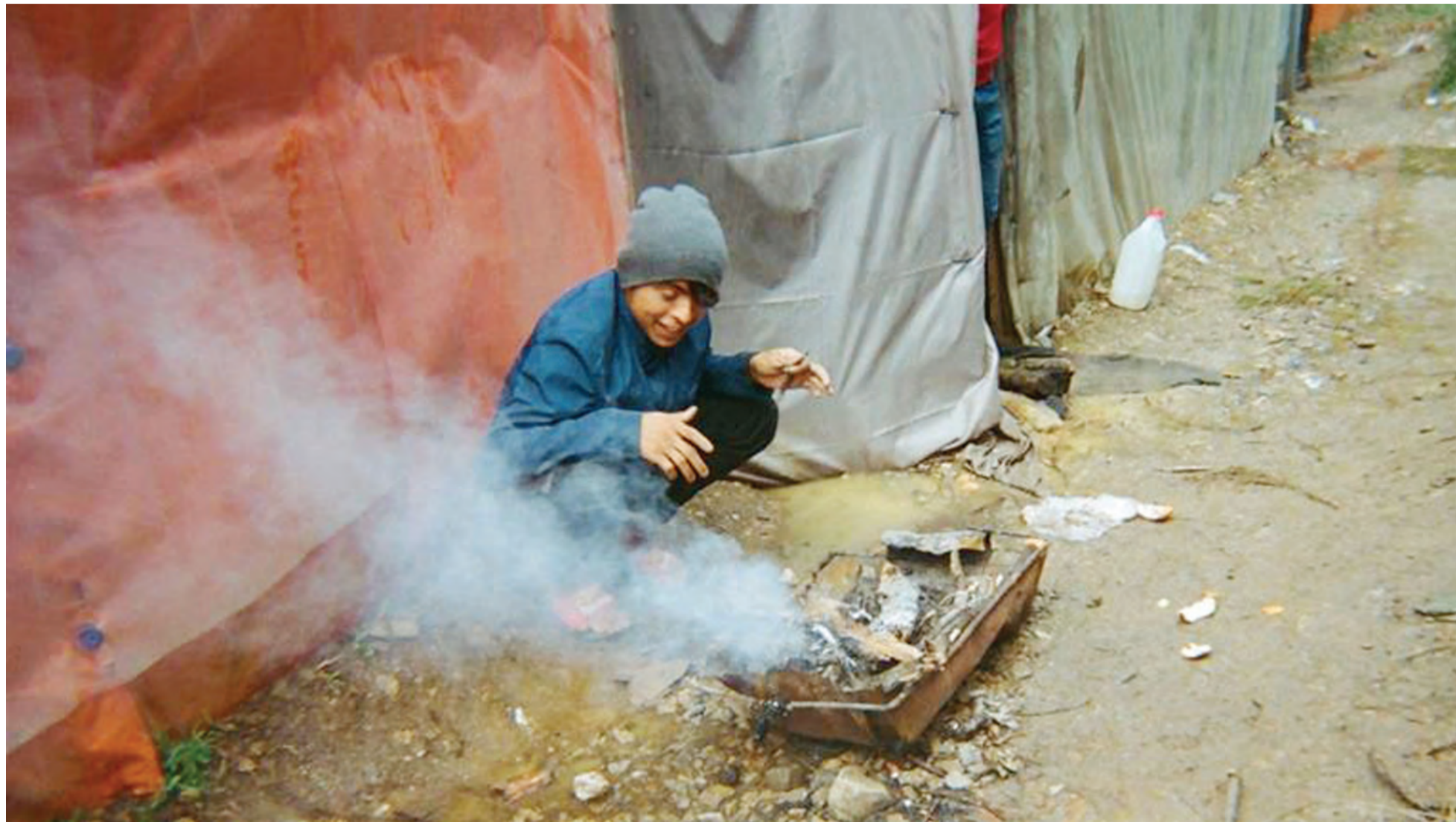
Children do what they can to make food at a refugee camp known as the 'jungle' in Samos. File photo

children will remain our priority after Brexit," they said.