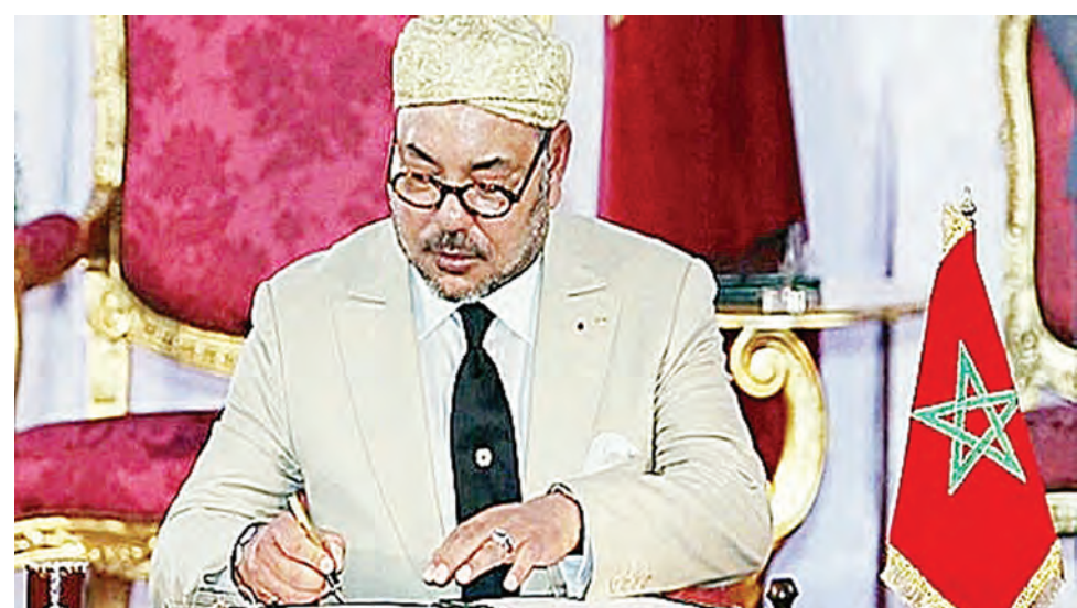
King Mohammed VI of Morocco.