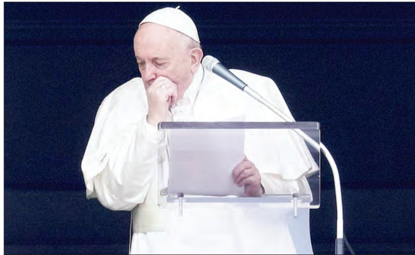
Pope Francis coughs during the Angelus noon prayer he recited from the window of his studio overlooking St. Peter's Square, at the Vatican, on Sunday.

to spread," European Commission President Ursula von der Leyen said at a press conference in Brussels.