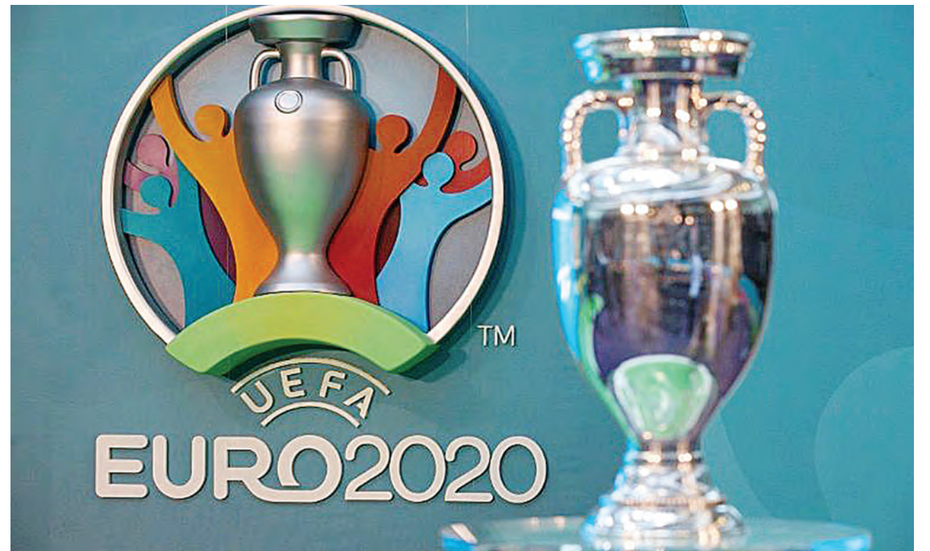
This Wednesday marks 100 days to go until the start of Euro 2020

"UEFA is in touch with the relevant international and local authorities