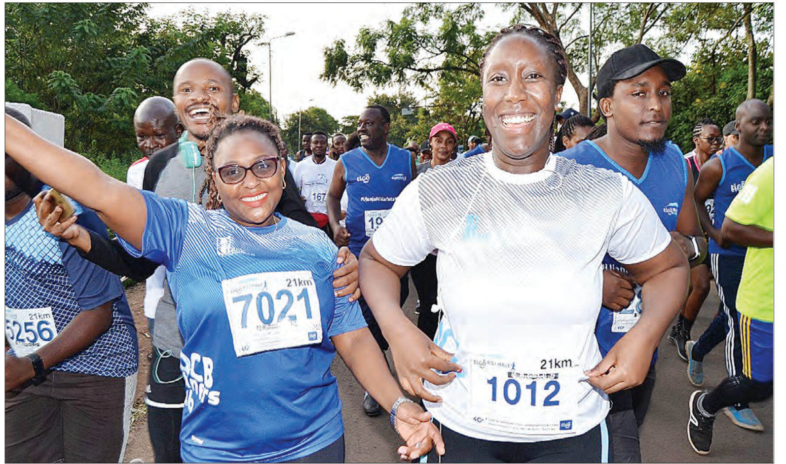
Some runners from DCB Commercial Bank Plc celebrate as they compete in the 21km event of this year's Kilimanjaro Marathon, which took place in Moshi last weekend.