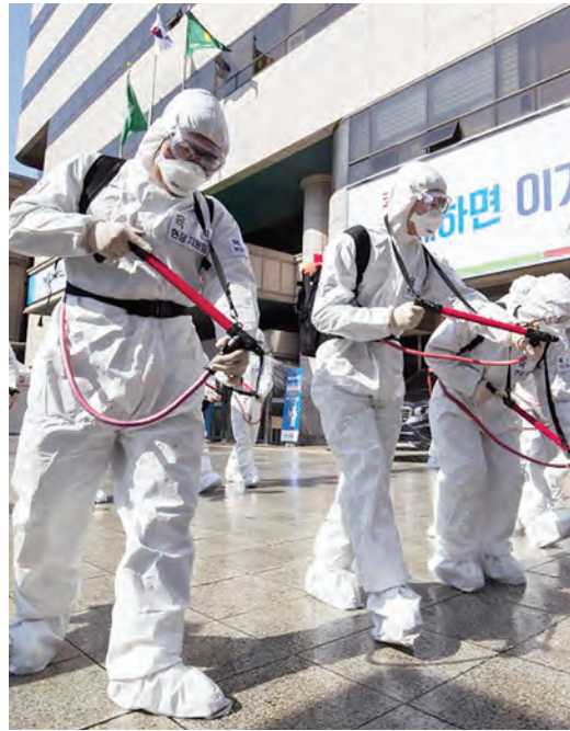
South Korean army soldiers wearing protective suits spray disinfectant in Daegu, South Korea, on Monday.

As of Monday, the number of confirmed cases in Japan has risen to more than 960, with over 700 of them stem-