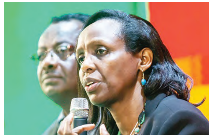
Dr Agnes Kalibata (R) addresses the media ahead of the opening of the AGRF conference in 2019

Additionally, we are not eating well. About 2 billion people are obese or have food related diseases. Fruits and vegetables account for only 11 per cent of global food production, despite recommendations that they should make up around half of