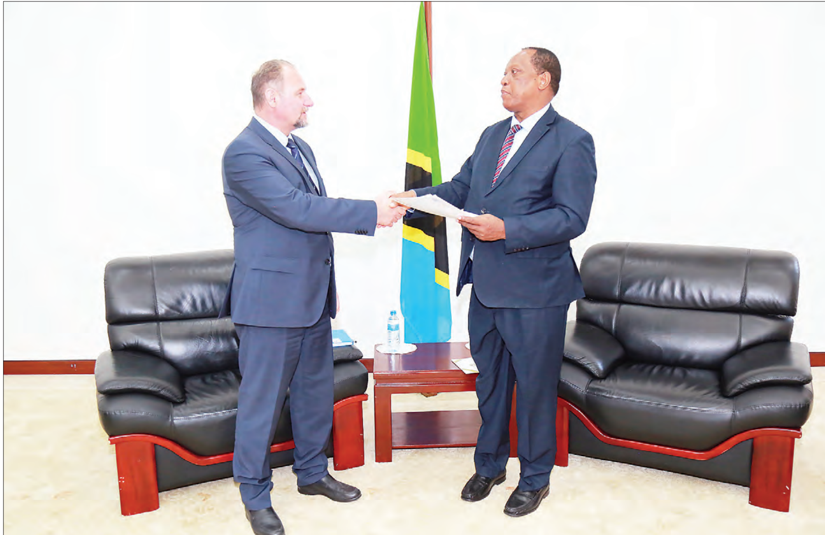
Zlatan Milišić (L), the newly arrived UN Resident Coordinator in Tanzania, presents his credentials to Foreign Affairs and East African Cooperation minister Prof Palamagamba Kabudi in Dar es Salaam yesterday..