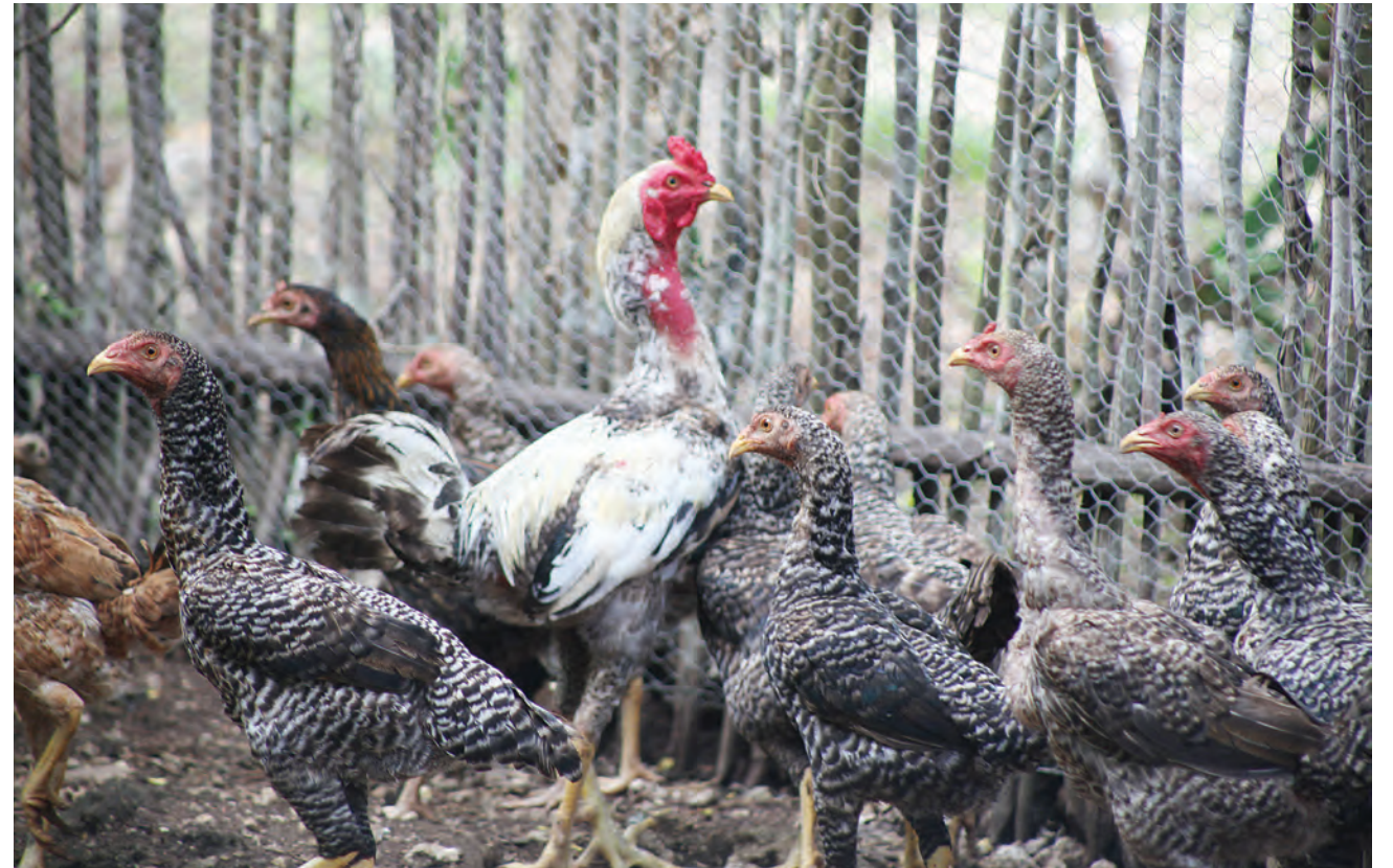
High selling 'Kuchi' chickens as found at the PPIZ farm in Unguja, where they are commercially raised for sale to tourist hotels.

According to him, about 170 'Kuchi' birds which hens and roosters are currently being raised at PPIZ organic farm that where fruits and vegetables