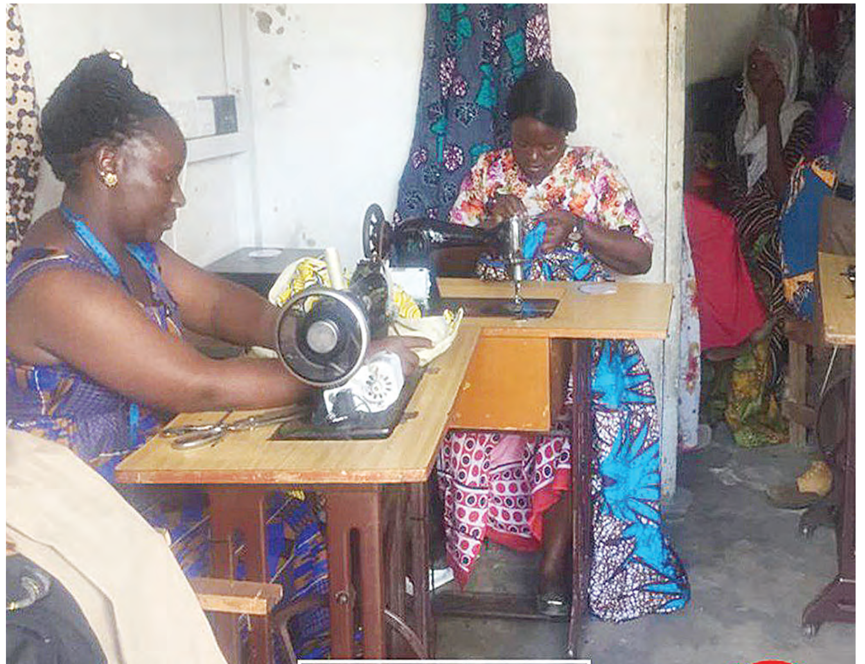
Women tailors go about their work at night in Coast Region, thanks to the Solar Mtaji Programme. File photo.

We have been selling the eggs and meat to seven tourist hotels here in Unguja," she added noting that prices for between 7,000/- and 15,000/-