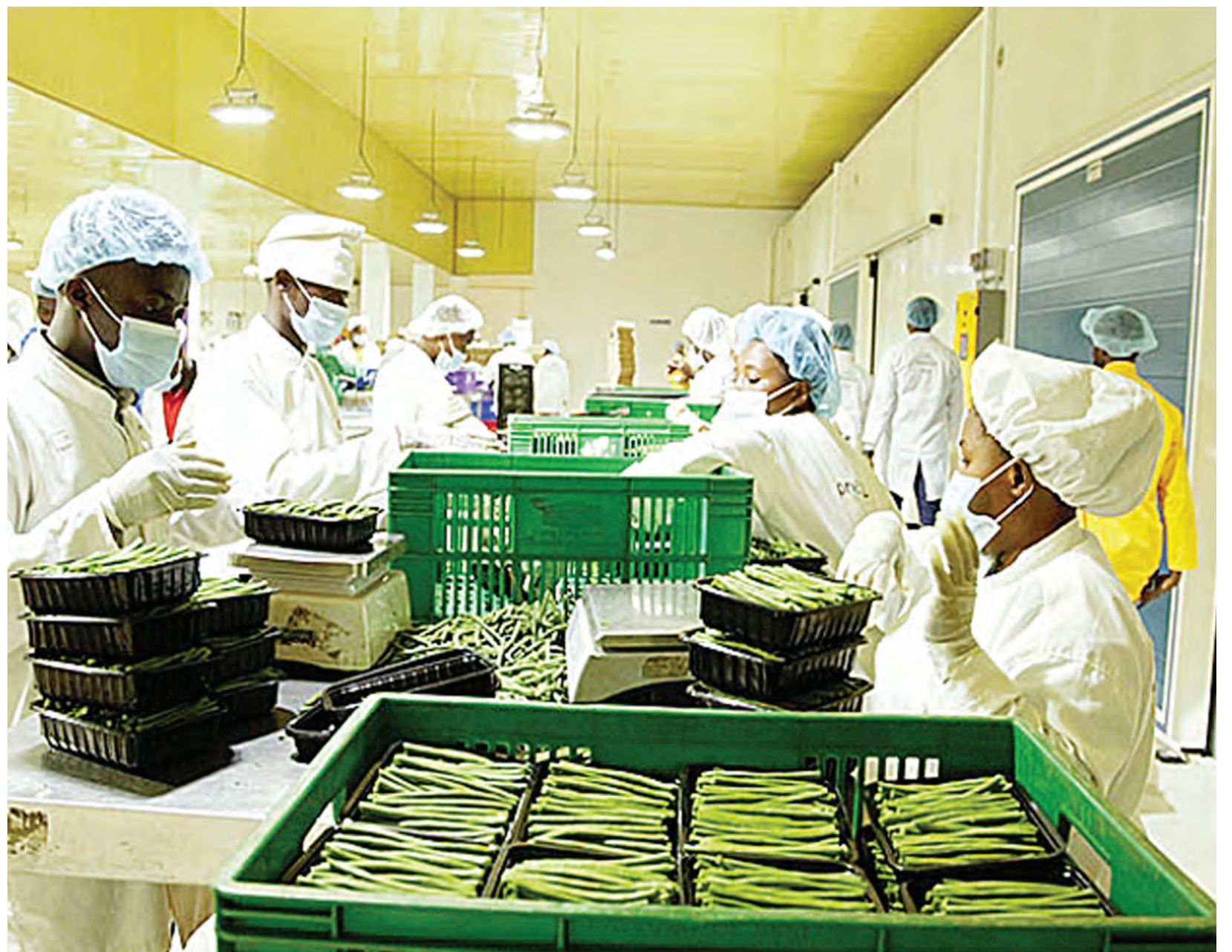
Workers engage in sorting, grading and packing French beans at the horticulture packing house at National Agricultural Export Development Board.

"We started when we were three exporters, but now we are 30 exporters. We used to export 10 tonnes per week, but we are now exporting up to 100 tonnes," he said. Kabera said that exports still have some challenges they are facing.