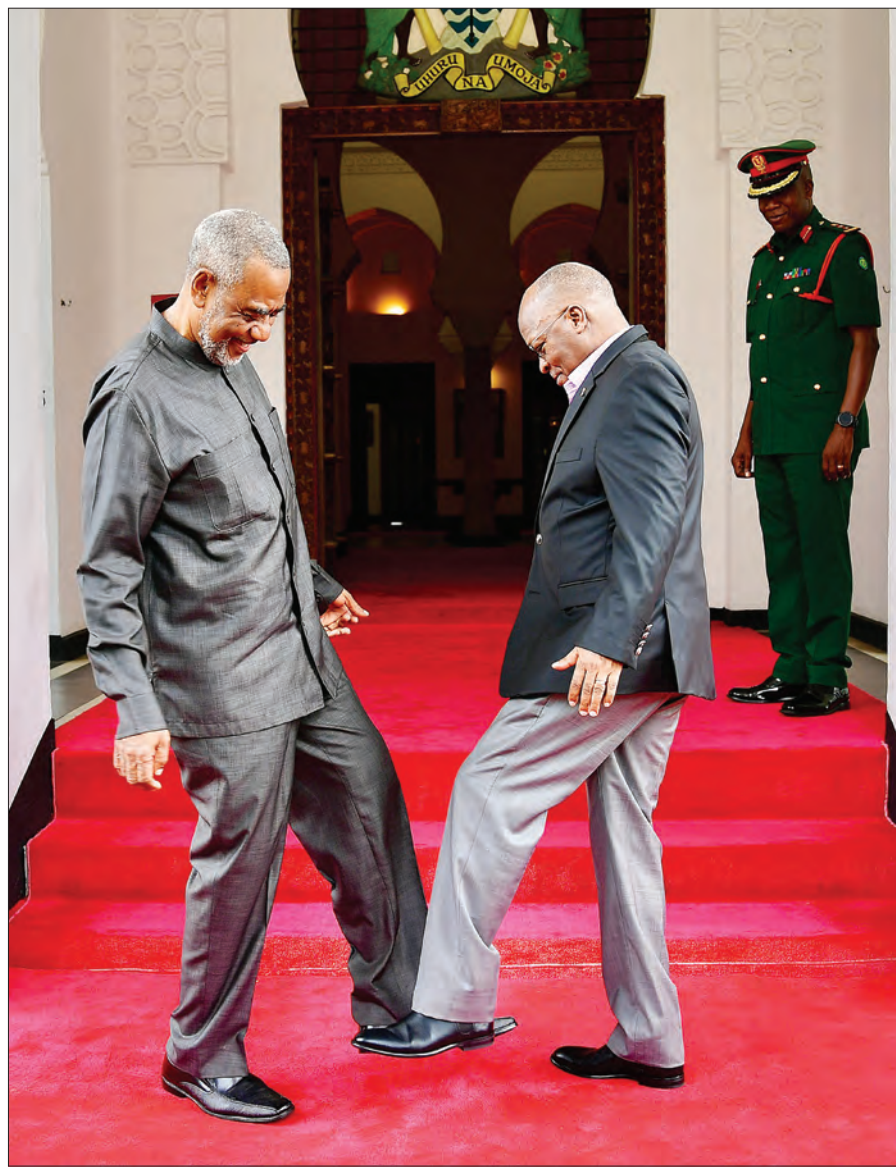
TAKING NO CHANCES... President John Magufuli welcomes the Chief Advisor of the opposition Alliance for Change and Transparency (ACT-Wazalendo), Maalim Seif Shariff Hamad (L), to State House in Dar es Salaam yesterday - in unique style, considering the global threat of coronavirus. The president also similarly hosted NCCR-Mageuzi national chairman James Mbatia and his Civic United Front counterpart, Prof Ibrahim Lipumba.