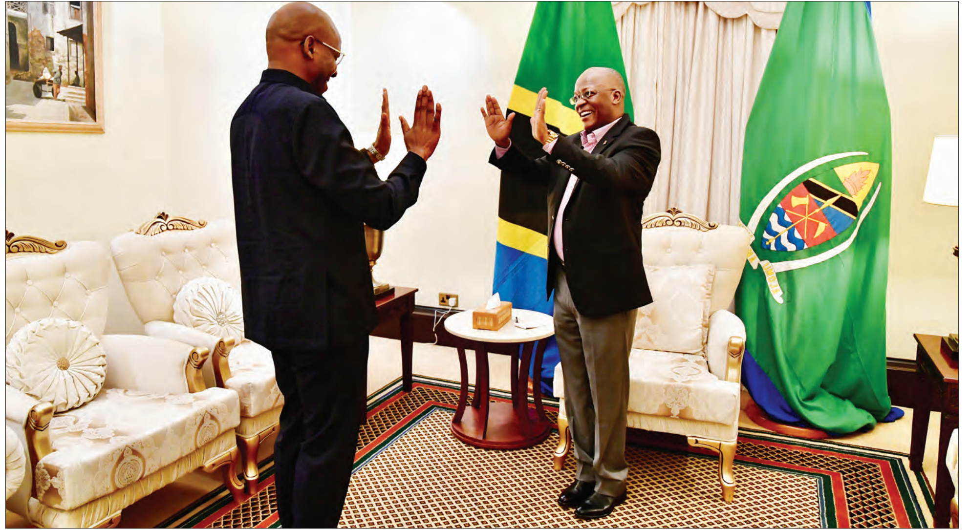
President John Magufuli and NCCR-Mageuzi national chairman James Mbatia (L) pictured at State House in Dar es Salaam yesterday exchanging greetings in style, chiefly as a precaution in the wake of coronavirus outbreaks in various parts of the world.

Indigenous forests are absolutely essential in treating various human ailments, through the use of their barks, roots and leaves. This cushions treatment costs for the poor particularly those in the rural areas, he added.