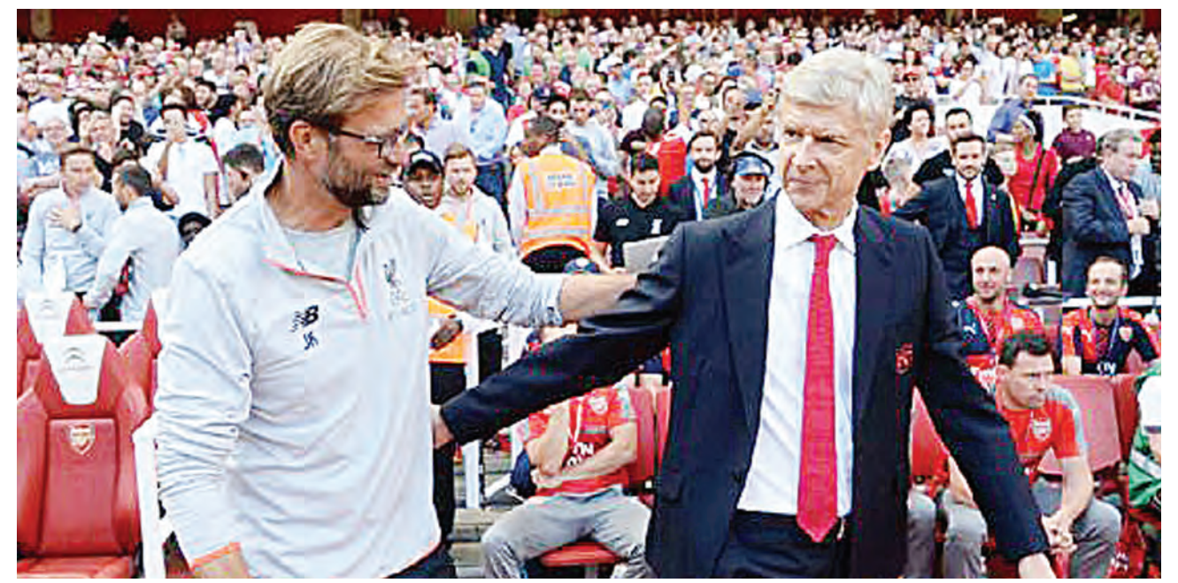
Liverpool boss Jurgen Klopp will surely win the Premier League, but he wasn't able to match Arsene Wenger's achievement with Arsenal.

Already this season, Liverpool have won 13 league games by a single goal,