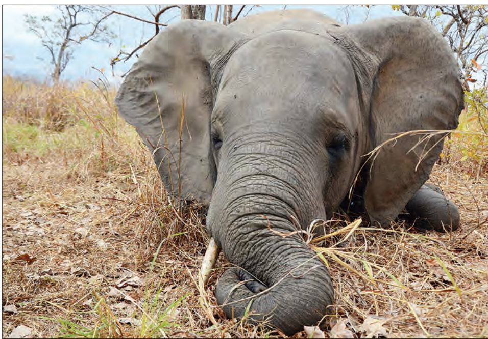
During the poaching crisis Mozambique lost almost 10,000 elephants - including this one from the Niassa National Reserve - in just five years. A combined effort of law enforcement and park management has helped bring poaching in the reserve down to nothing today. File photo

Following this arrest, and based on information gained from interrogations, a further six ivory traffickers operating on the eastern side of the Niassa Reserve were arrested and convicted in court in the province of Cabo Delgado