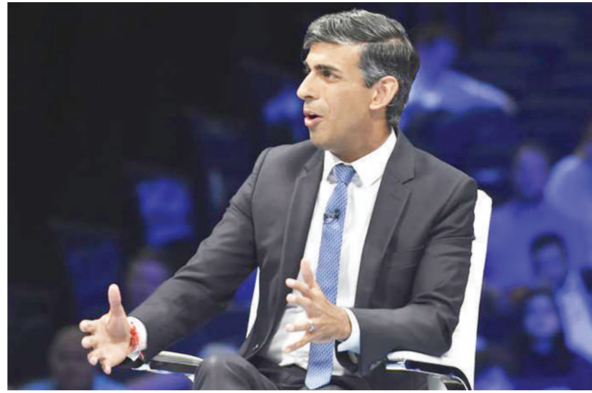
Rishi Sunak addresses Conservative Party members during the Conservative leadership election hustings at the NEC, Birmingham, England on Tuesday.

Asked why opinion polls showed that the pub-