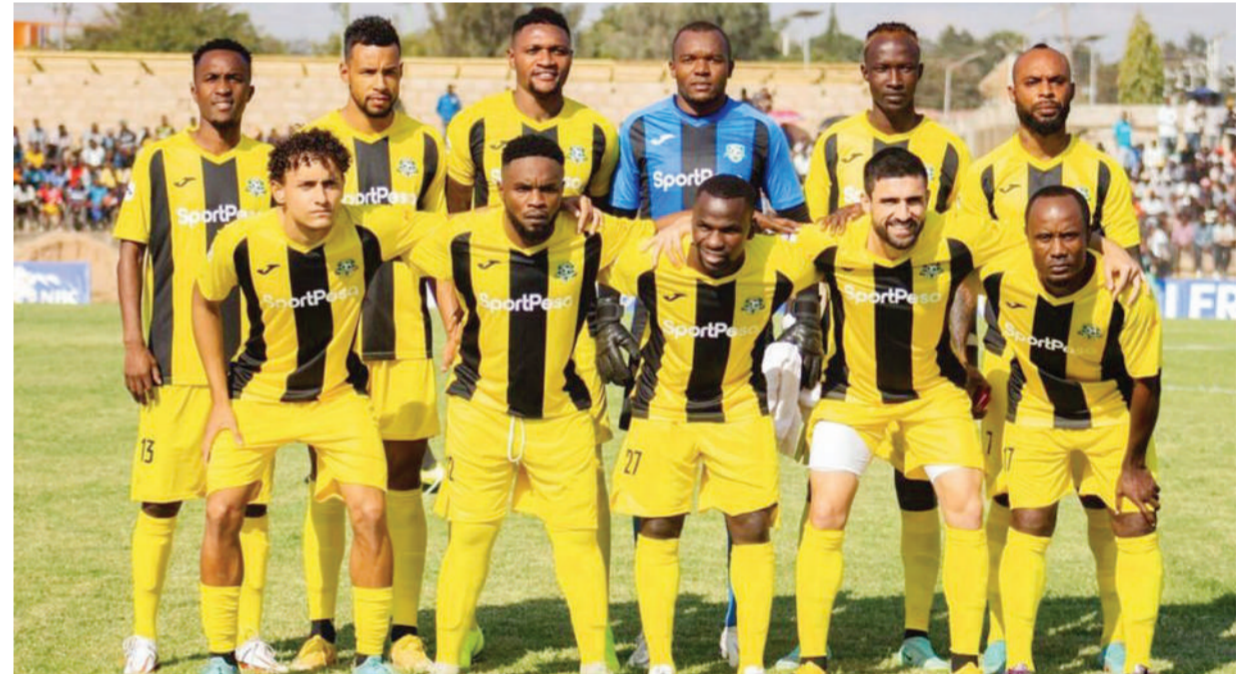
Singida Big Stars Football Club

He stated: "We have our goals and we need to do well, we know the potential of our team, we know how many opportunities we can achieve from the technical bench but the