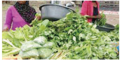
TANZANIA IS A SLEEPING VEGETABLE GIANT PAGE 3