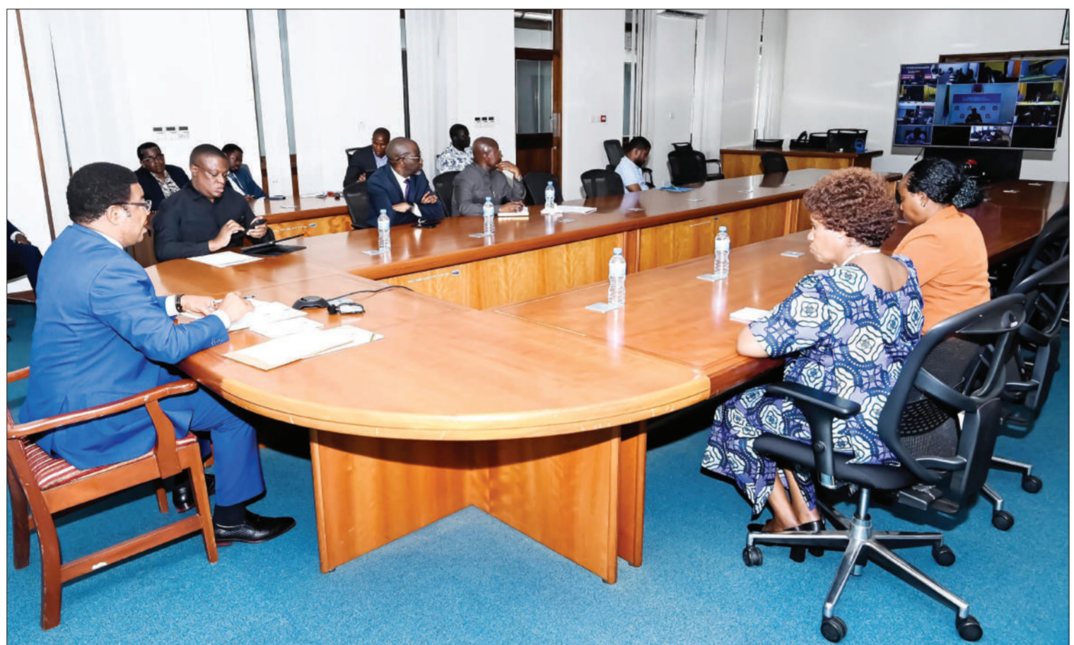
Prime Minister Kassim Majaliwa pictured in Dar es Salaam yesterday leading virtual talks with regional commissioners and regional census committee officials on the implementation of the on-going national Population and Housing Census. Right is Census commissioner Anne Makinda.

HIGH levels of readiness for voluntary compliance with taxation are stifled by feelings that the rates are often too high, a new survey has indicated.