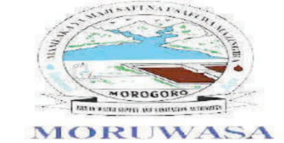
WATER RESERVOIR HAS STANDARDS PAGE 6