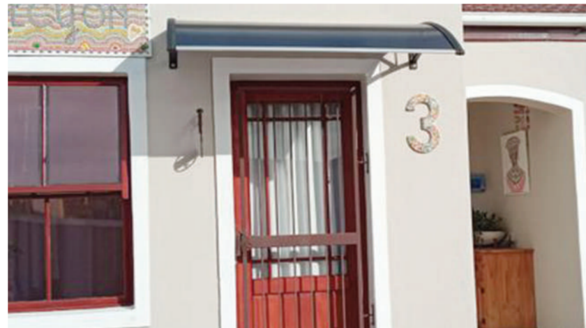
Over the second quarter, the group tracked rental growth of 2.5%, 2.6% and 2.7% in April, May and June, respectively.

rents increased by 2.6% in the second quarter of the year while the average cost of rent increased by R193, reaching R7,971 per month. According to PayProp, this shows a clear upward trend.