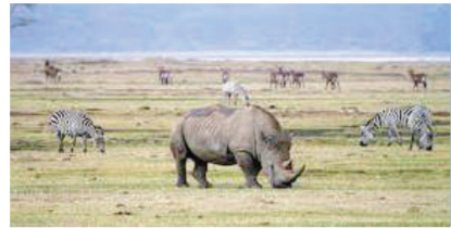
CHURCH SENDS 600 PRIESTS IN NCAA PAGE 3