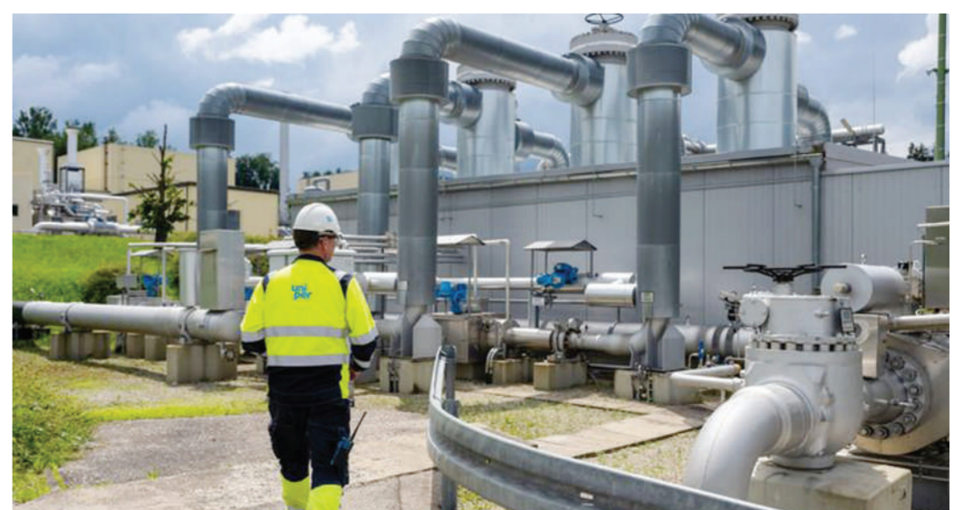
In this file photo taken on June 10, 2022 an employee of Uniper Energy Storage walks through the above-ground facilities of a natural gas storage facility at the Uniper Energy Storage facility in Bierwang, southern Germany.

Russia accounted for a bit more than a third of Germany's gas supplies before the supply reductions started. In addition to prioritizing storage, authorities also are trying to encourage energy saving.