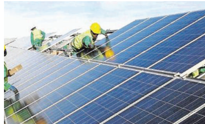
The 40MW Kesses solar generation project to be built near Eldoret in Kenya, one of the projects financed by the Emerging Africa Infrastructure Fund (EAIF)

International Rating Agency Moody's confirmed that the main factors underpinning the EAIF's A2 rating are: a strong capital position that re-