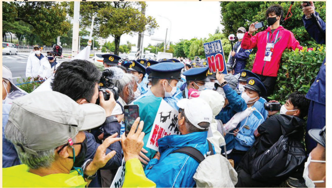
Police officers hold back protesters who demand the reduction of the U.S. base-hosting burdens and even a total withdrawal of the U.S. forces in Okinawa, Japan, May 15, 2022. File photo

What the heat map exposed is just the tip of a horrific iceberg.