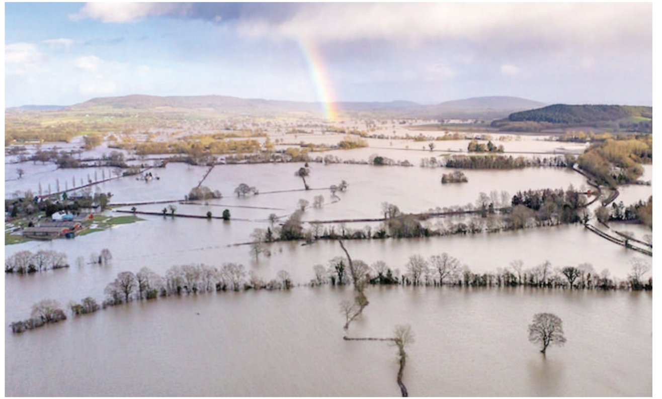
Come rain or shine: The Wye Valley, Herefordshire, under water after Storm Dennis in February 2020. The Met Office's annual UK climate report shows a trend towards weather extremes. File photo

Extreme heat could put Britain's power grid under mounting pressure as well. By the end of the century, air conditioning could increase Britain's electricity consumption by up to 15 percent during the summer, said an official report. Increasingly frequent heatwaves may eventually make summer just as stressful for the power grid as winter, said Kathryn