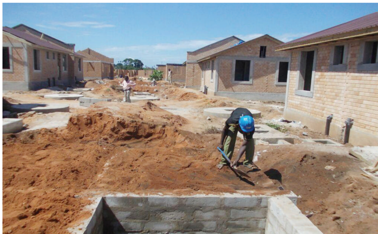
A Housing project in Tanzania

"Insecure security and little information about borrower capacity and willingness to pay undermines trust and encourages investors to look elsewhere," the analysis reads in part. "Risk is expensive."