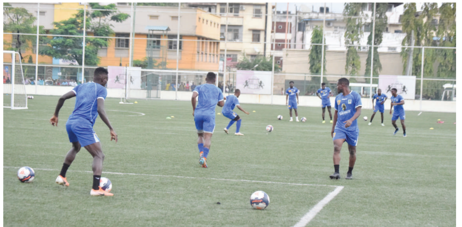
Taifa Stars' players take part in the squad's training session in Dar es Salaam recently to shape up for African Nations Championship (CHAN) qualifiers' tie against Uganda's Cranes that will take place in the city on Sunday.