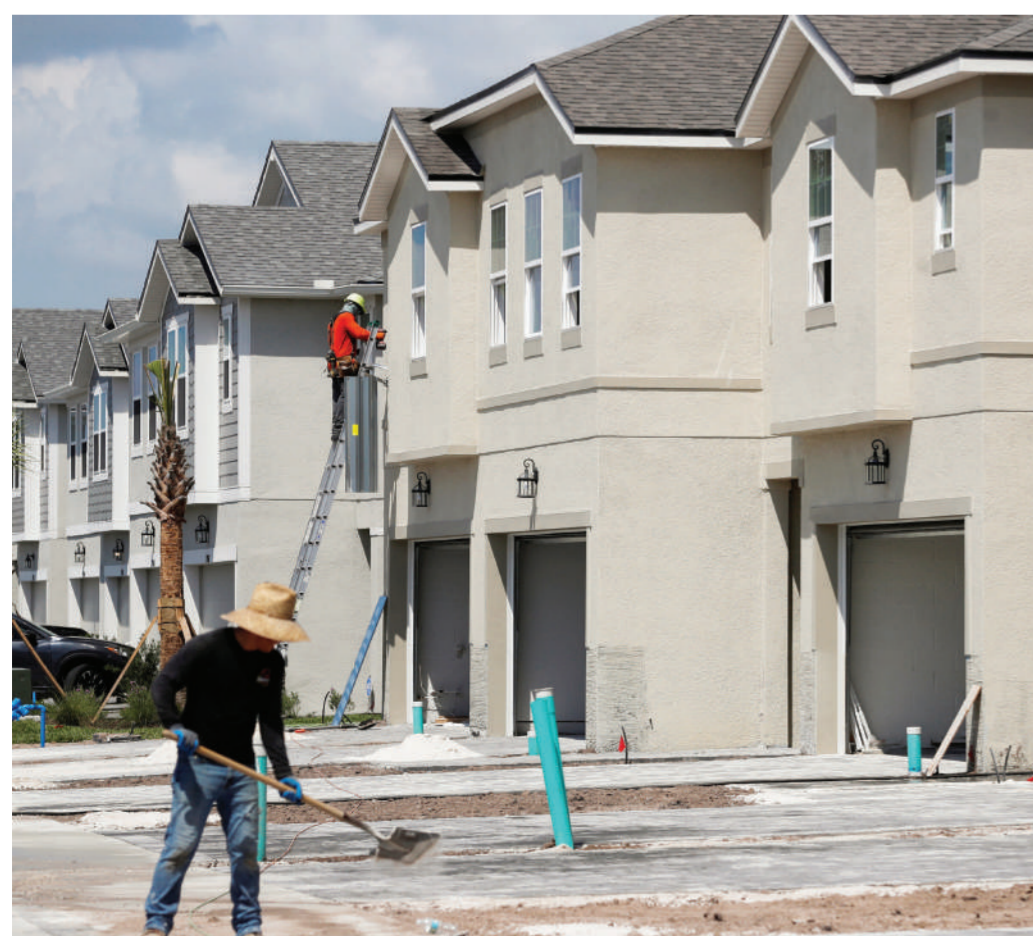
Still, affordability remains challenged, even as higher rates slow activity in the market.

Marking the most significant increase across all nine provinces, the Northern Cape now has an average rent of R8,626. According to PayProp, this is up R715 from the year before. The province is the second most expensive to rent a house or apartment in South Africa.