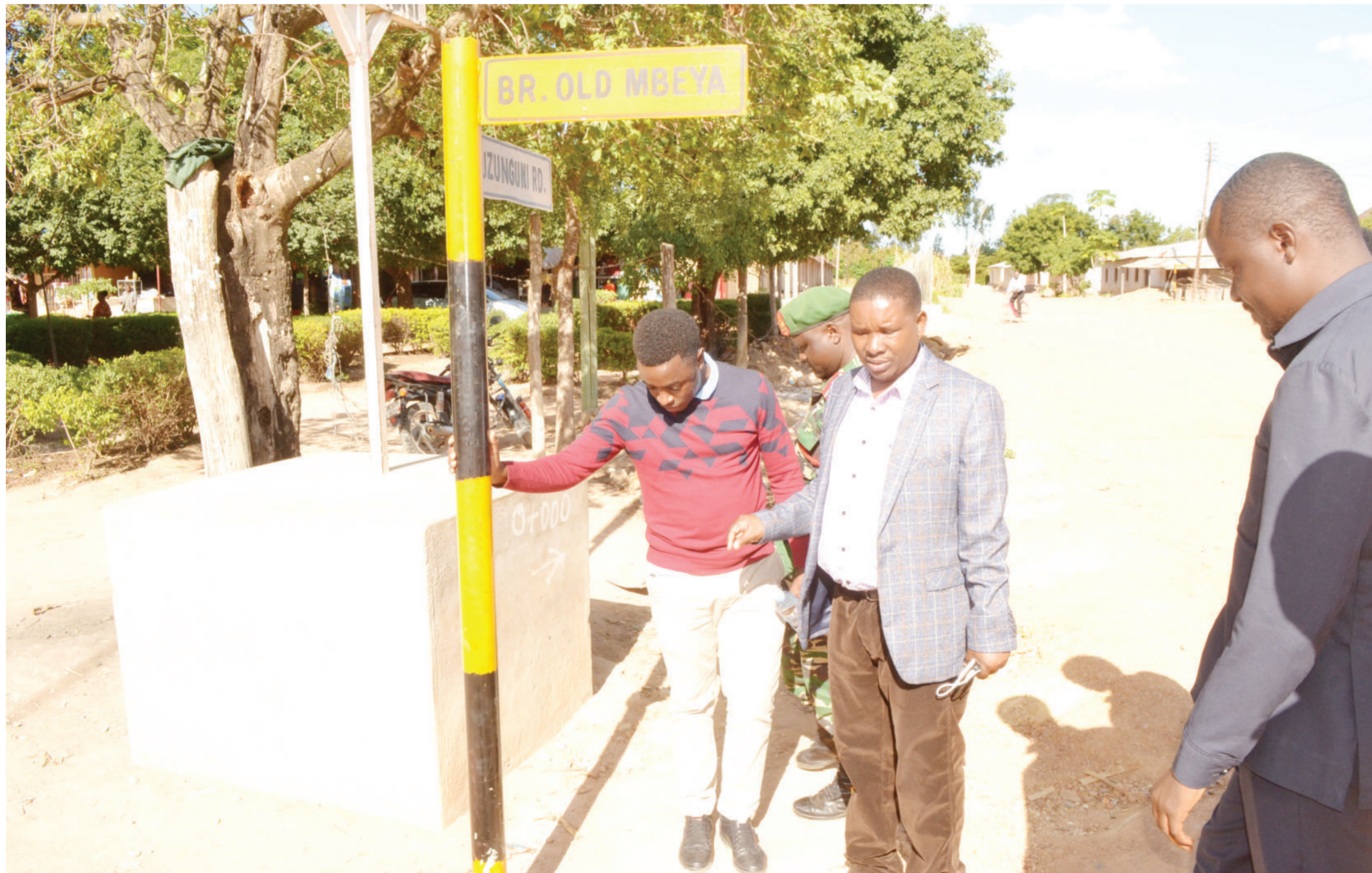
One of the residential addresses in Manyoni District, Singida Region

The Court is composed of 11 Judges, nationals of Member States of the African Union elected in their individual capacity and it meets four times a year in Ordinary Sessions and may hold Extra-Ordinary Sessions.