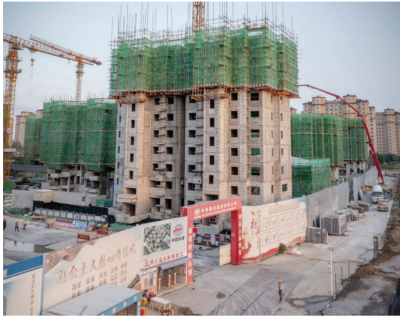
A bond of the same size from Shanghai-based Shimao maturing in just over a year is priced just below $0.10 on the dollar, indicating a potential $268mn loss.

"With the industry headwinds and negative news, it's very