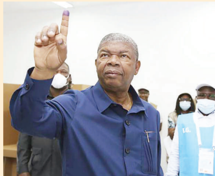
Angola President Joao Lourenco shows his marked finger during the voting process at a polling station in Luanda, Angola, on Wednesday.

"In the end, we will all win, democracy wins and Angola wins,"