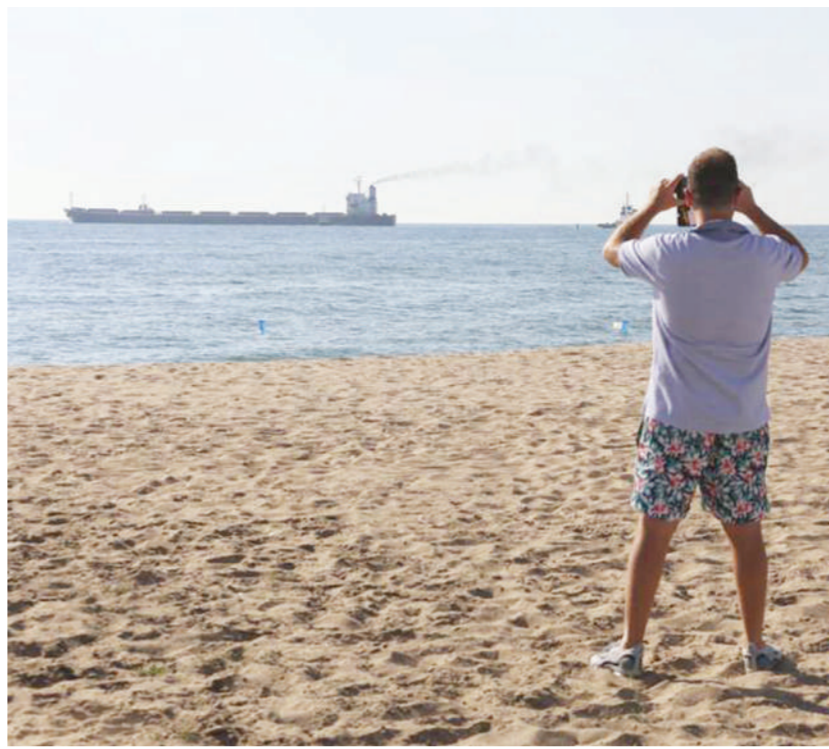
In this file photo taken on Aug 7, 2022, a man takes a picture as the Glory bulk carrier makes its way from the port in Odesa, Ukraine. According to Ukraine's Ministry of Infrastructure, the ship under the Marshall Islands' flag is carrying 66 thousand tons of Ukrainian corn.

Ukraine has some 20 million tons of grain left over from last year's crop, while this year's wheat harvest is also estimated at 20 million