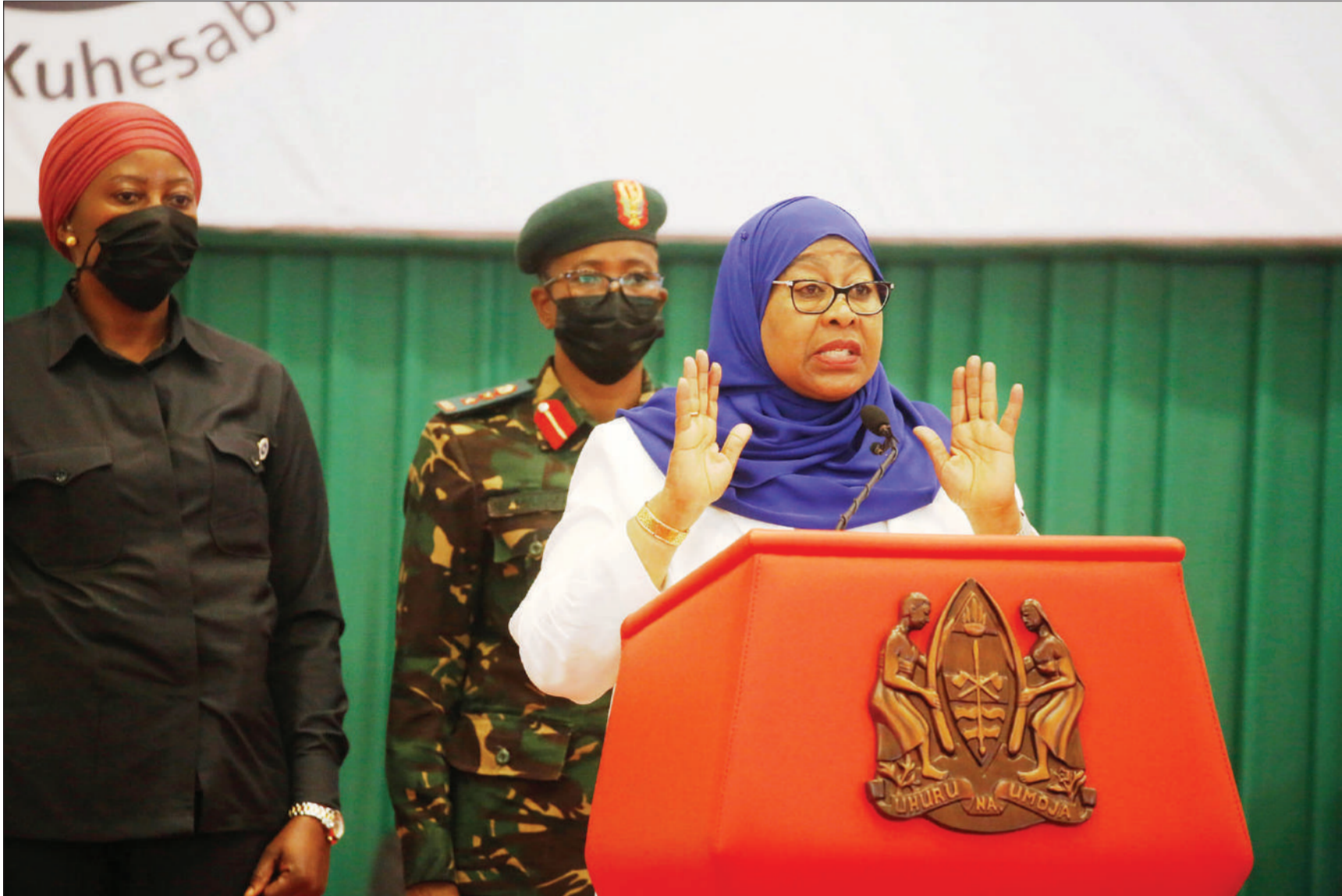
President Samia Suluhu Hassan delivers an address in Dodoma city yesterday during the signing of an agreement involving the construction of Chanika-Homboza road in Coast Region.