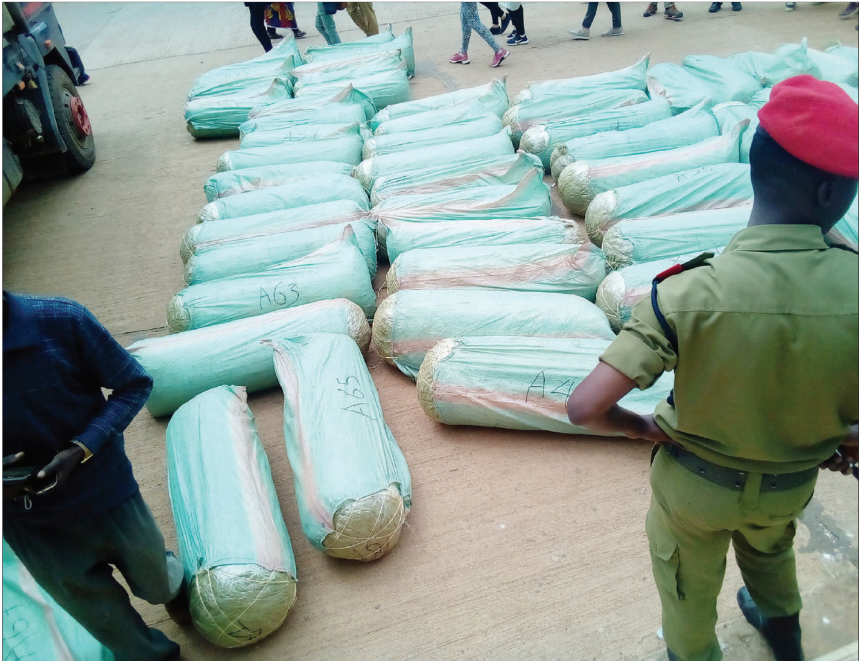
An officer with the Tarime-Rorya special police zone pictured at the weekend guards 68 sacks of bhang said to have been impounded while being transported to Dar es Salaam.

We want to promote tourism. In Makangale Konde there is a beautiful forest. It is earning us foreign currency, improving our national economy. Those are the things we want all us in Pemba