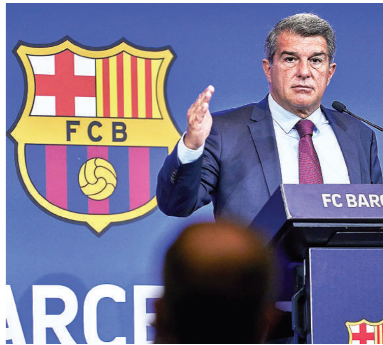
Laporta is playing the part of politician at Barcelona because they're less of a club and more of a government in how they function.

In continental competition, it was worse. Barcelona finished third in a relatively easy Champions League group, behind Bayern Munich and Benfica. Then, after dropping down to the Europa League -- a tournament they expected to win -- they beat Napoli and Galatasaray before losing to eventual champions Eintracht Frankfurt in the quarterfinals.