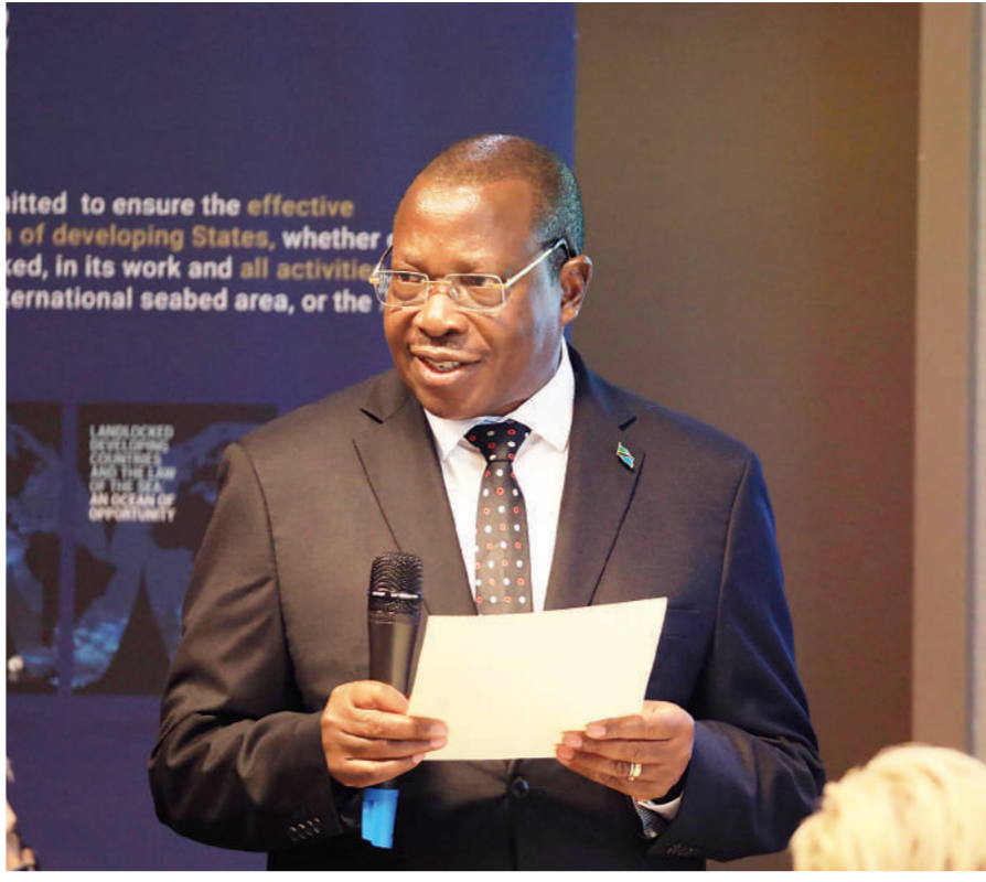
Vice-President, Philip Mpango.