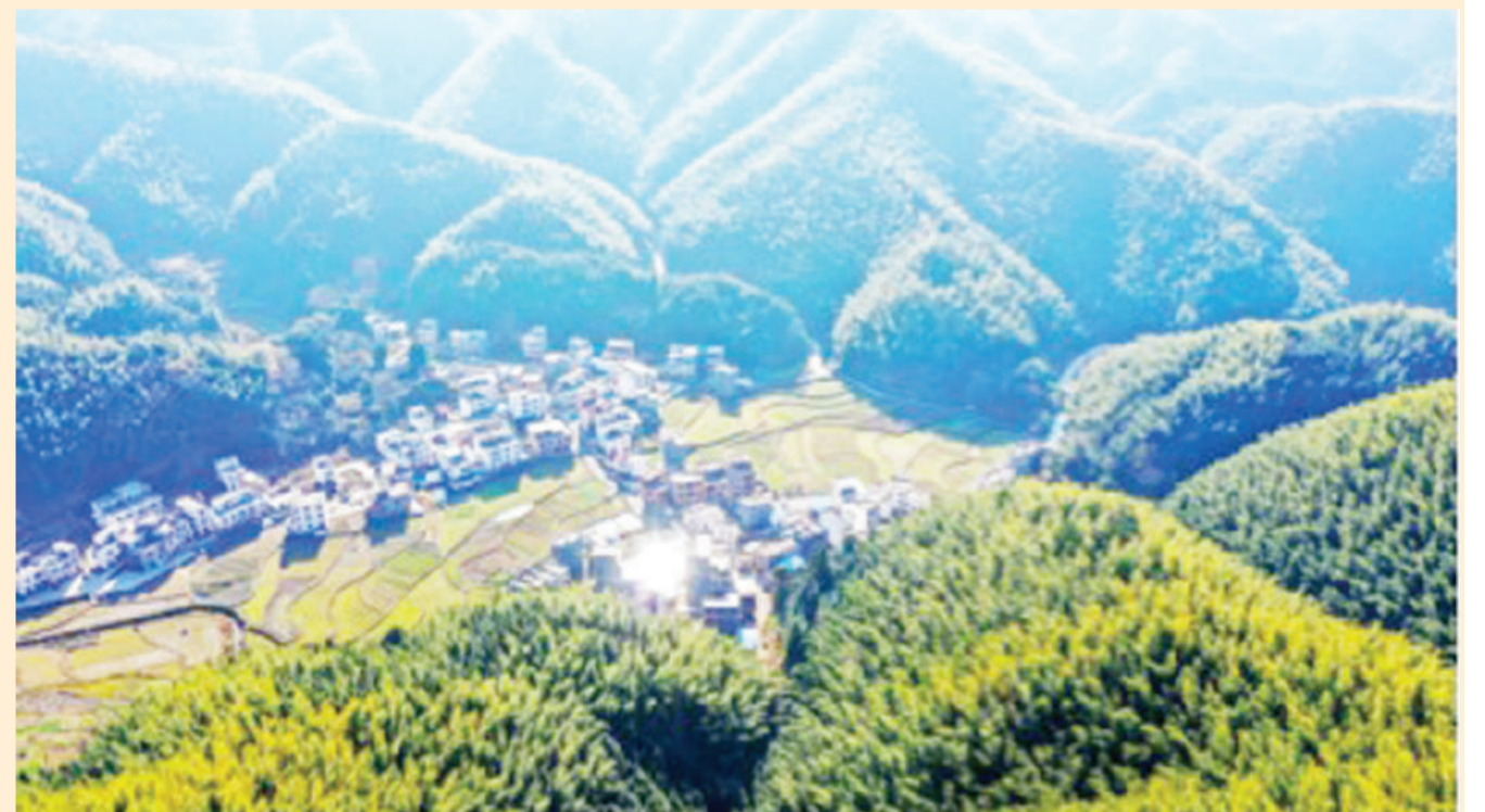
Photo shows a bamboo forest in Qianmaping village, Jinling township, Xintian county, Yongzhou, central China's Hunan province. Hunan province has launched a "forest chief" scheme to develop rural tourism and promote rural vitalization with ecological resources. File photo

Last December, he found some pines withering on a patrol mission and immediately reported it to relevant township authorities via a management app. The local forestry department launched quick check-ups