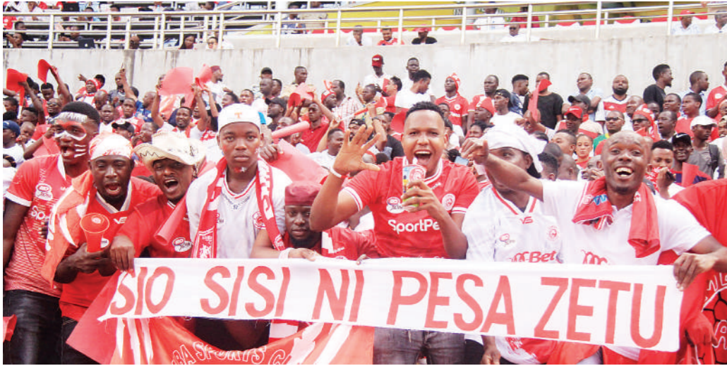
Some Simba SC supporters cheer at 'Simba Day', an event hosted by the club to open the new season, which took place at Benjamin Mkapa Stadium in Dar es Salaam last week. Simba SC locked horns with Ethiopia's St. George in a friendly tie which took place at the stadium later in the day, with the hosts cruising to a 2-0 victory.