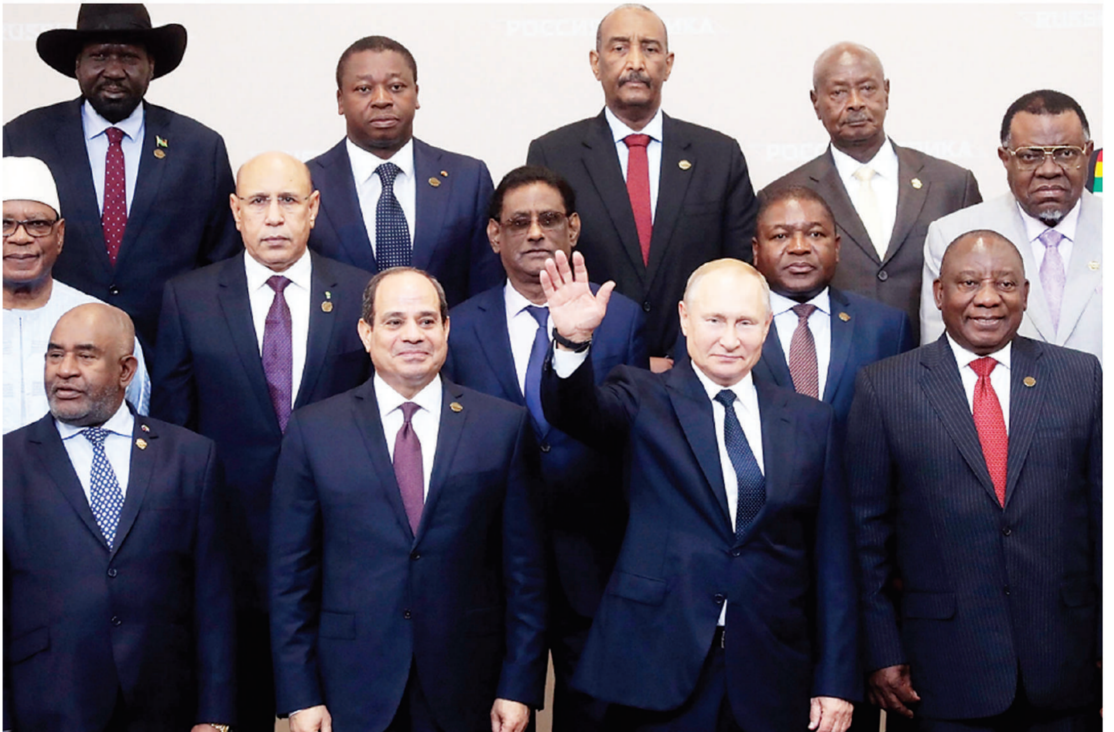
Russian President Vladimir Putin waves during a photo session with heads of countries taking part in the 2019 Russia-Africa Summit at the Sirius Park of Science and Art in Sochi, Russia, 24 October 2019. File photo

stance, point to a self-centredness on both sides. The West wants its African partners to share its condemnation of Russia. African states meanwhile cling to their monopoly on victimhood and historical resentment of Western domination in world affairs.