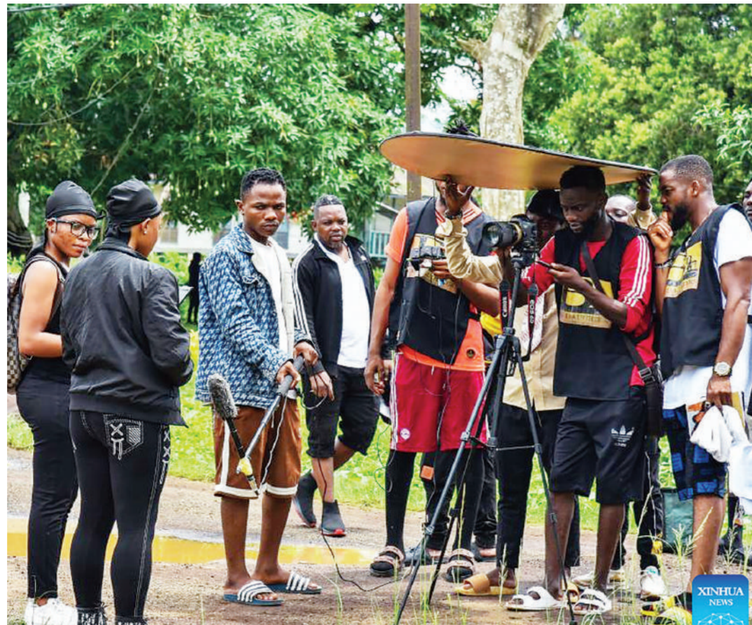
File photo taken on May 26, 2022 shows the scene of film shooting of Boss Daughters in the Southwest region, Cameroon.

The Central African nation has seen considerable growth in its film production with over 300 movies produced