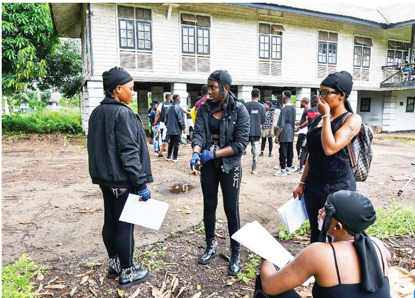
File photo taken on May 26, 2022 shows the scene of film shooting of Boss Daughters in the Southwest region, Cameroon.