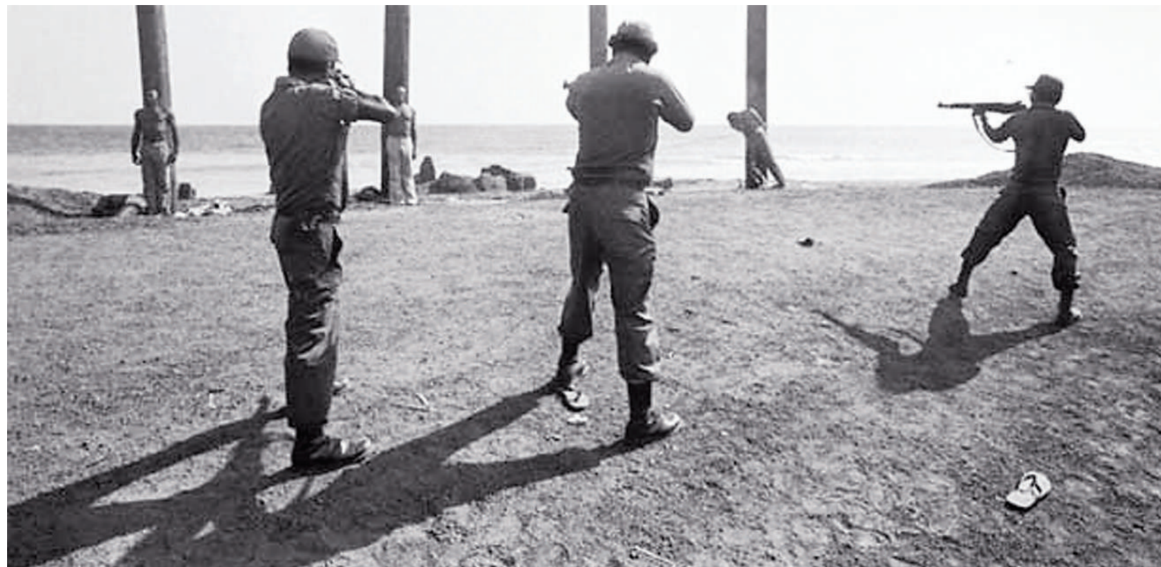
A Liberian execution squad fires a volley of shots, killing cabinet ministers of Liberia. April 1980. File photo

Sri Lankan President Gotabaya Rajapaksa, who was ousted from power by an angry mob last month, and whose government—and extended family—were accused of large-scale corruption and maladministration, is probably a potential candidate for Saudi asylum, after his stops in the Maldives, Singapore and Thailand. As he travels round Asia, Rajapaksa has been contemptu-