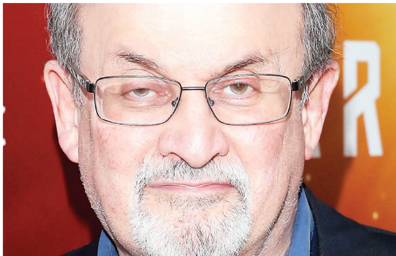
Salman Rushdie attends the National Geographic Channel "MARS" Premiere NYC on October 26, 2016 in New York City. File photo

The author fell to the floor when the man attacked him, and was then surrounded by a small group of people who held up his legs, seemingly to send more blood to his upper body, as the attacker was restrained, according to a witness attending the lecture who asked not to be named.