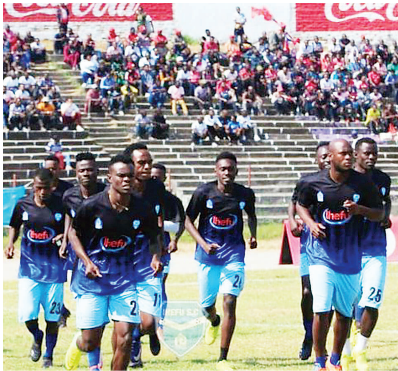
Ihefu SC footballers warm up ahead of the club's participation in a past Premier League match in Mbeya