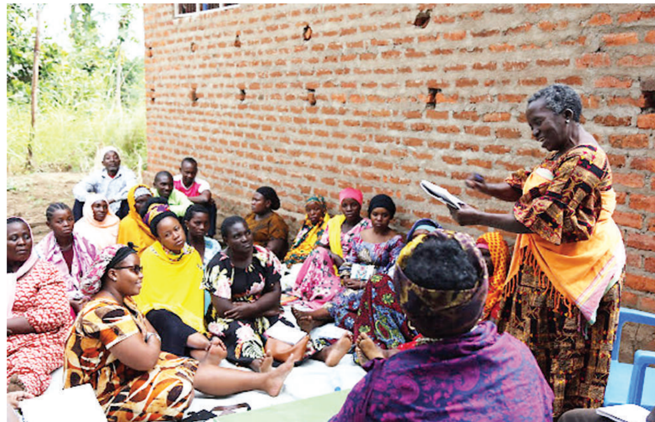
TGNP board member drills Morogoro women on importance of economic empowerment.

She said that in order to strengthen the economic status of these KCs, TGNP has undertaken a number of activities such as training these women how to make value addition to products they