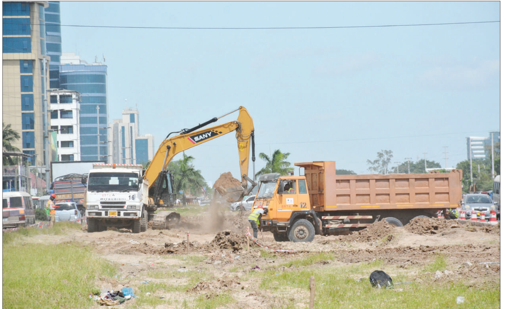
Preparatory work on the Sam Nujoma Road stretch of Dar es Salaam's rapid transit road project has begun, as witnessed yesterday.

...Until April 2024, only 616 villages had communication services and communication towers built