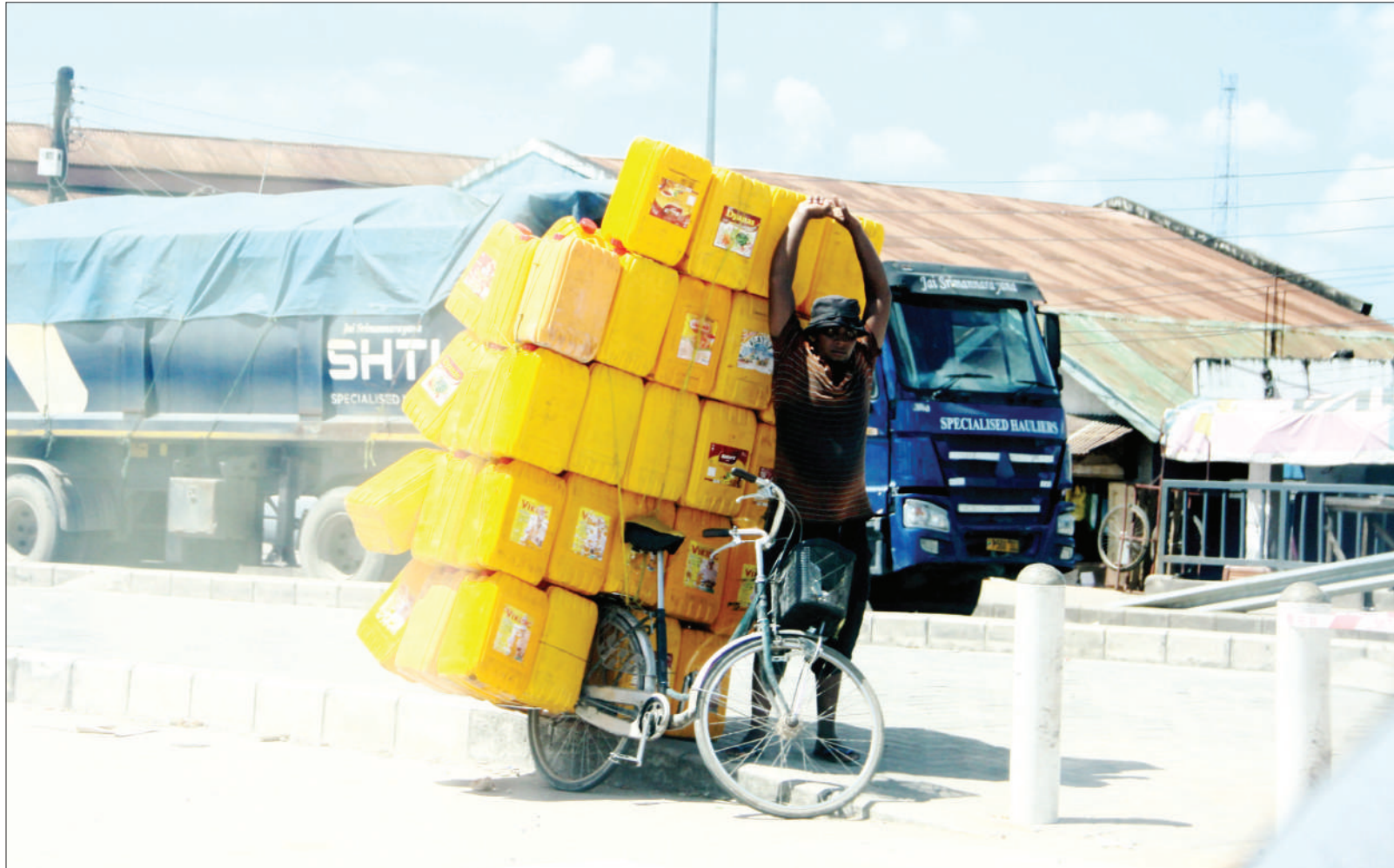
This bicyclist was found waiting to cross a Magomeni Mapipa section of Dar es Salaam's busy Morogoro Road at the weekend. However, he would not be drawn into saying where he was taking the dozens of empty 20-litre plastic containers.