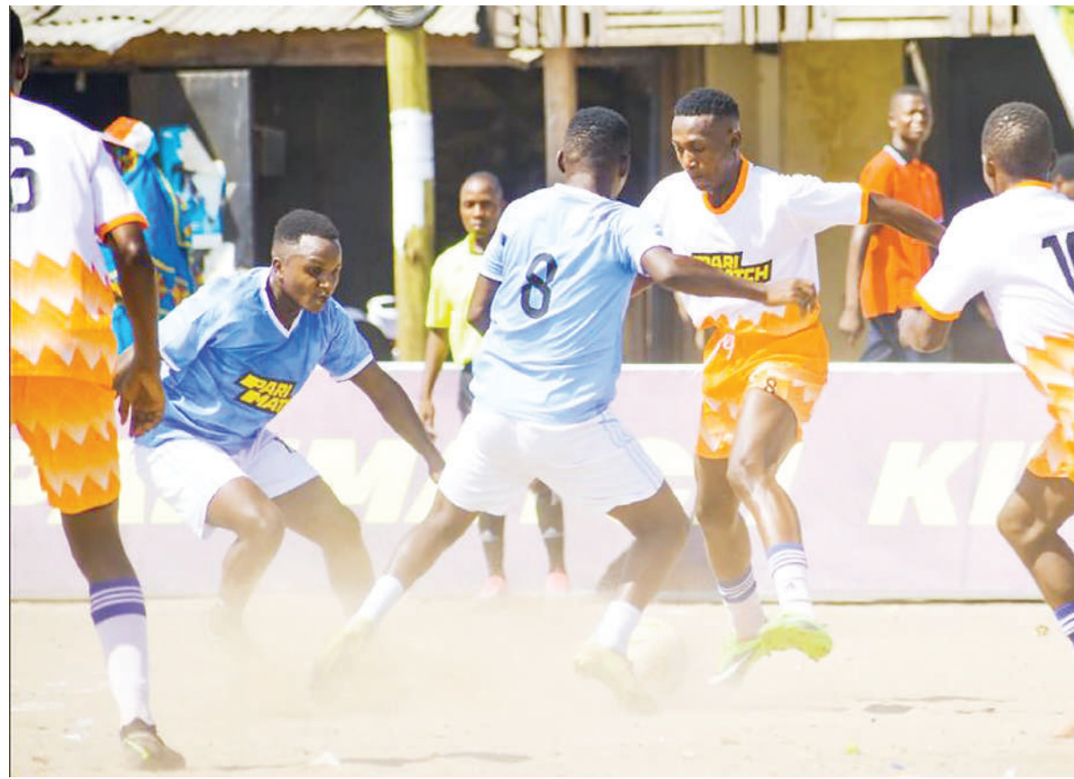
Players of Faru Dume and Karume United competing in the opening match of the Parimatch Kitaa Cup 2024 at Zakhim Stadium, Mbagala in Dar es Salaam over the weekend.

"All participating teams have been provided with jerseys and footballs for the tournament, and the morale