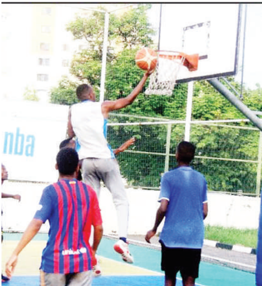
Vijana basketball players during a training session at the Jakaya Kikwete grounds in Dar es Salaam recently.