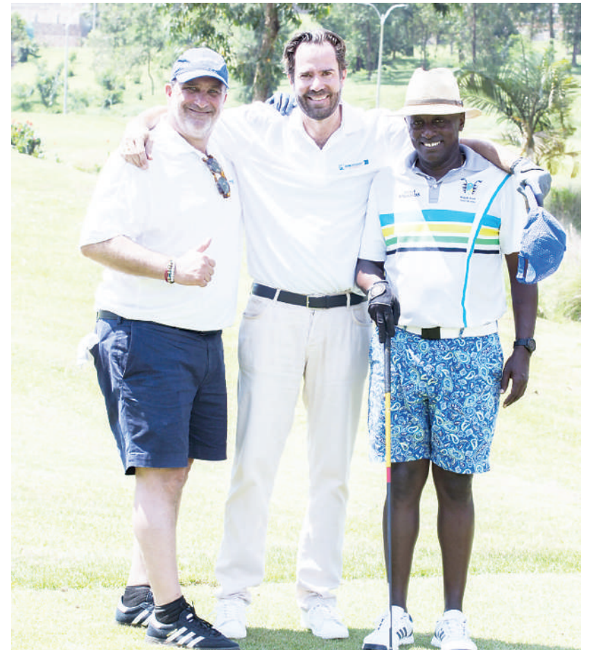
The Golf tournament for CEOs, attracted around 80 delegates from the Africa CEO Forum.