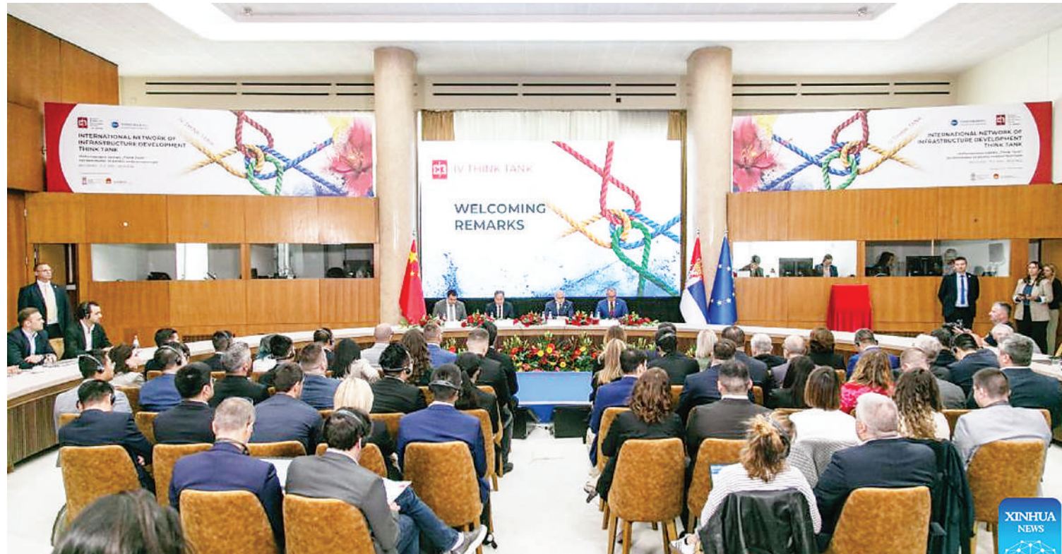
This photo taken on May 17, 2024 shows a scene at the fourth forum co-organized by the Belgrade think tank "Belt and Road" Institute and the Center for Sustainable Development of Beijing Jiaotong University in Belgrade, Serbia. Serbia is actively participating in the development of the "Belt and Road" Initiative, Prime Minister Milos Vucevic said on Thursday, emphasizing the ironclad friendship between Serbia and China.

"We adhere to the principle of consultation, joint construction, and sharing. We have built roads and railways in Serbia, aiding the local government in fulfilling its duties and promoting Serbia's economic and social development," he said.