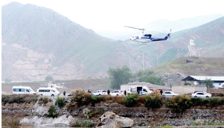
A helicopter carrying Iran's President Ebrahim Raisi takes off, near the Iran-Azerbaijan border on Sunday.

The dispatch is among the ministry's efforts to put the Global Security Initiative into action and fulfill China's responsibilities as a major country, the official said. Xinhua