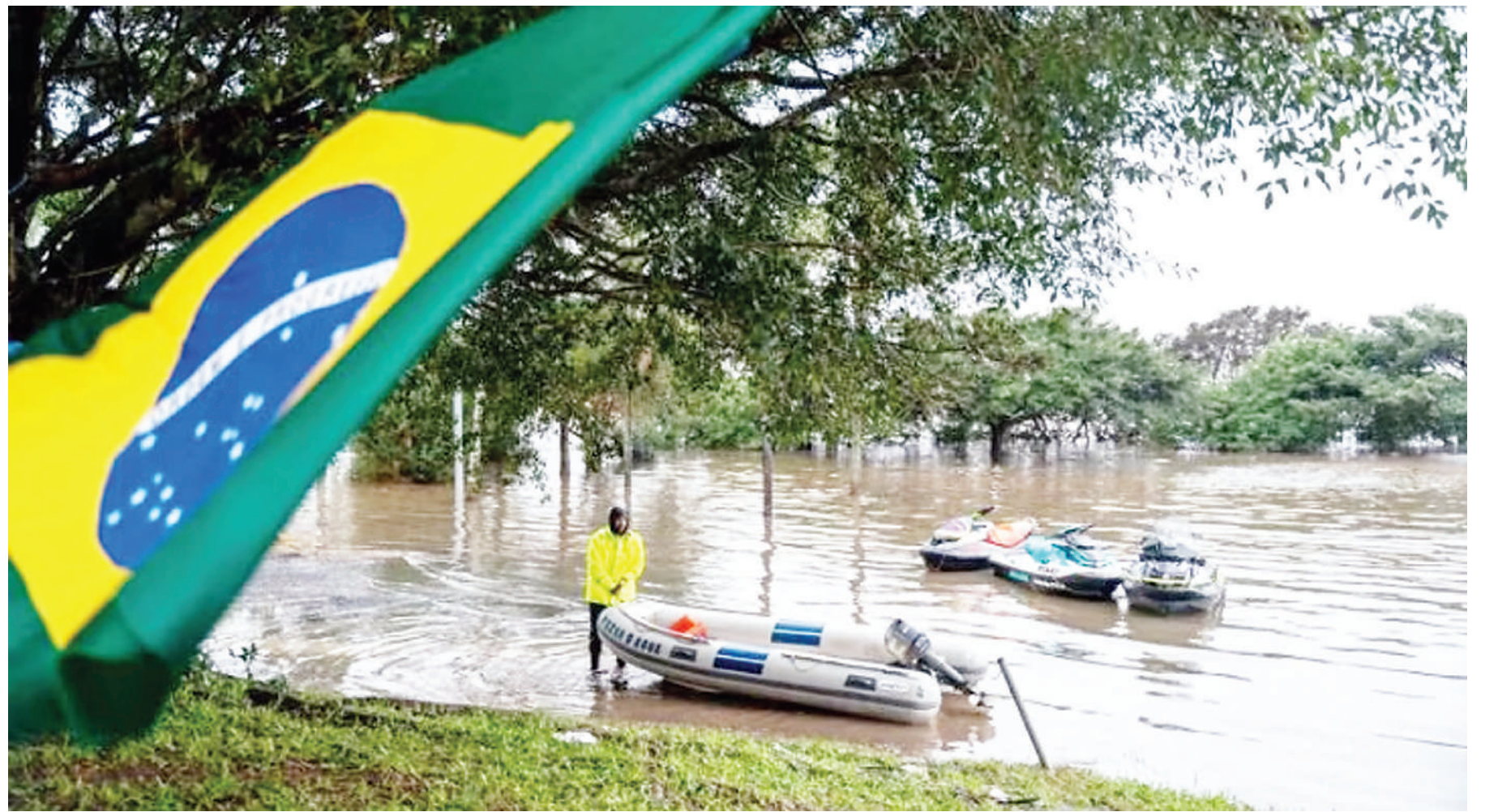
Volunteers from around the country are joining the rescue and aid effort