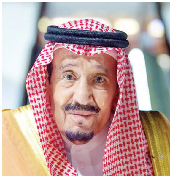
Saudi King Salman bin Abdulaziz