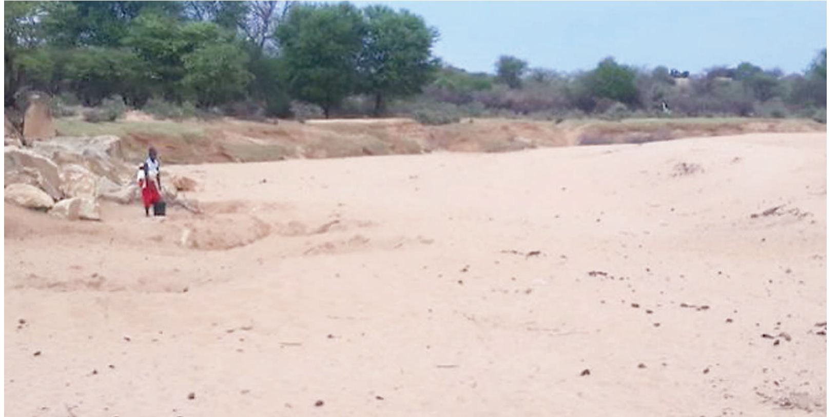
Dry conditions and extreme heat are changing natural wildlife habitat and behaviour.

"As ecosystems change, people and wildlife roam farther in search