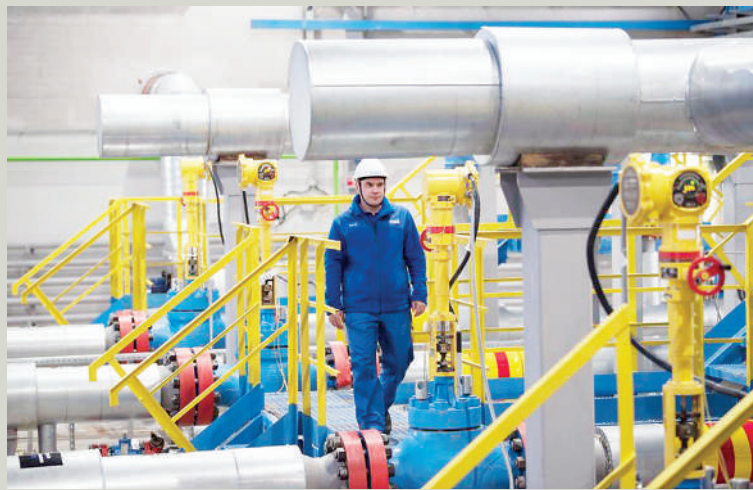
A staff member patrols to check equipment at Kovvykta gas condensate field in Irkutsk, Russia, Dec. 18, 2022.

banned imports of Russian coal and seaborne crude oil, the European Commission isn't proposing an outright ban on imports of Russian liquefied natural gas, which countries including Belgium, France and Spain still purchase in large quantities, as Politico reported.