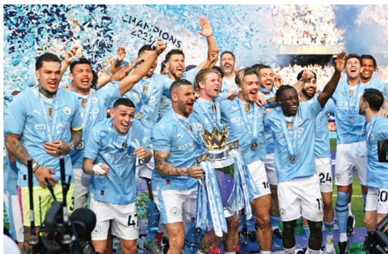
Manchester City won a historic fourth successive Premier League title on Sunday.

Liverpool's domination in the 1970s and 1980s included 10 league titles in 15 seasons and four European Cups.