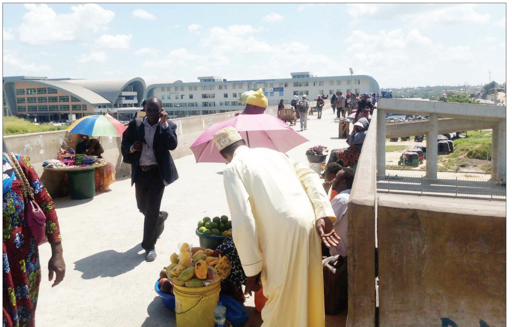
It remained business as usual for small traders on the pedestrian bridge at the Mbezi Luis section of Dar es Salaam's Morogoro Road until yesterday, with most complaining that they were yet to find a suitable alternative site for their activities.

We congratulate President Samia Suluhu Hassan for the great work she is doing by continuing to implement energy projects, the construction speed of this project has increased from 55 percent last year to 93.7 percent this year