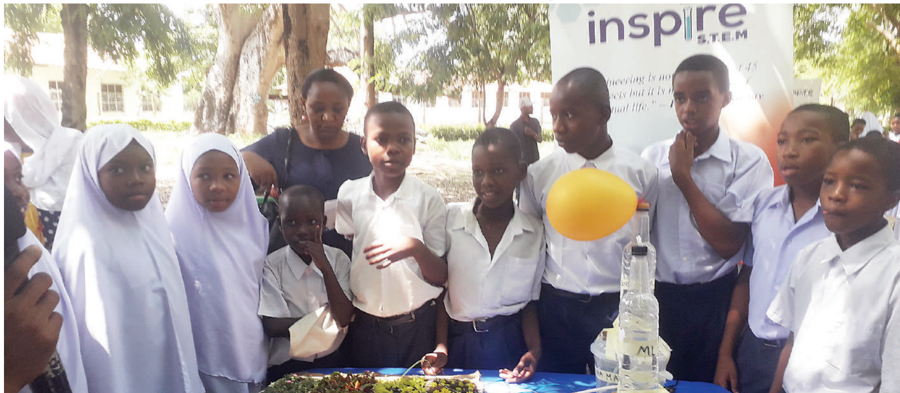
Pupils from four primary schools in Tanga Region demonstrate how to apply agro-tech in farming without affecting the environment.

The Building a Better Tomorrow - Youth Agribusiness (BBT-YIA) initiative also aims to promote Tanzanian youth engagement in agribusiness for sustainable and