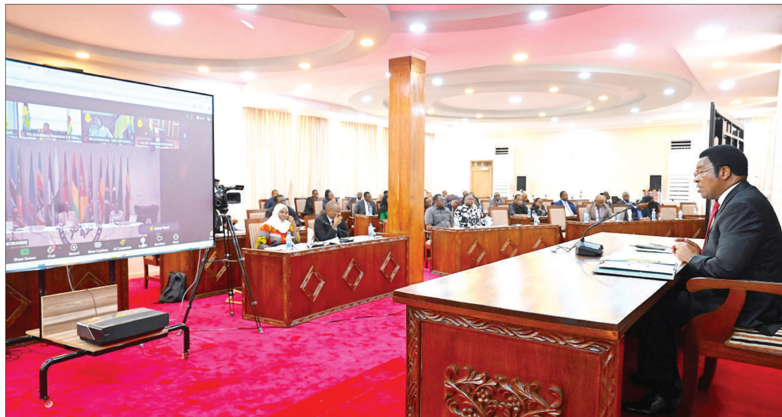
Prime Minister Kassim Majaliwa represents President Samia Suluhu Hassan at a virtual summit of Southern African Development Community (SADC) Heads of State from Dodoma city yesterday.

In addition, he asked the Ministry of Natural Resources and Tourism in collaboration with stakeholders in the sector to come up with