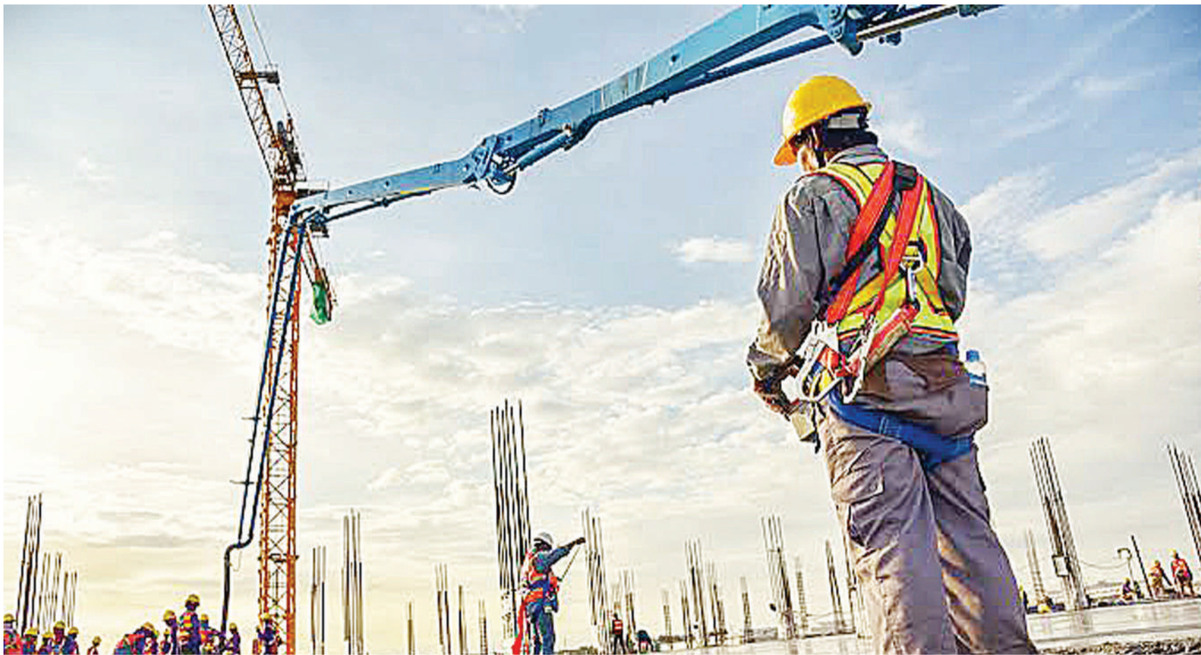
Contractors at the site where the Creative Arts Senior School is being built. File photo.

The power plant upon completion, is expected to supply power to Botswana and Eswatini, as well as to Mozambique and South Africa. Mozambique would become hub, selling gas on to island countries such as Madagascar and Mauritius.