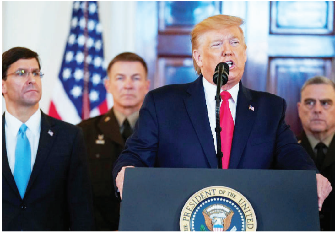
U.S. President Donald Trump delivers a statement about Iran flanked by U.S. Defense Secretary Mark Esper, Army Chief of Staff General James McConville and Chairman of the Joint Chiefs of Staff Army General Mark Milley in the Grand Foyer at the White House in Washington, U.S., on Wednesday.

Operators of coal and power plants could gain leverage in government negotiations if Merkel's coalition fails to plug the generation gap caused by onshore wind's faltering expansion.