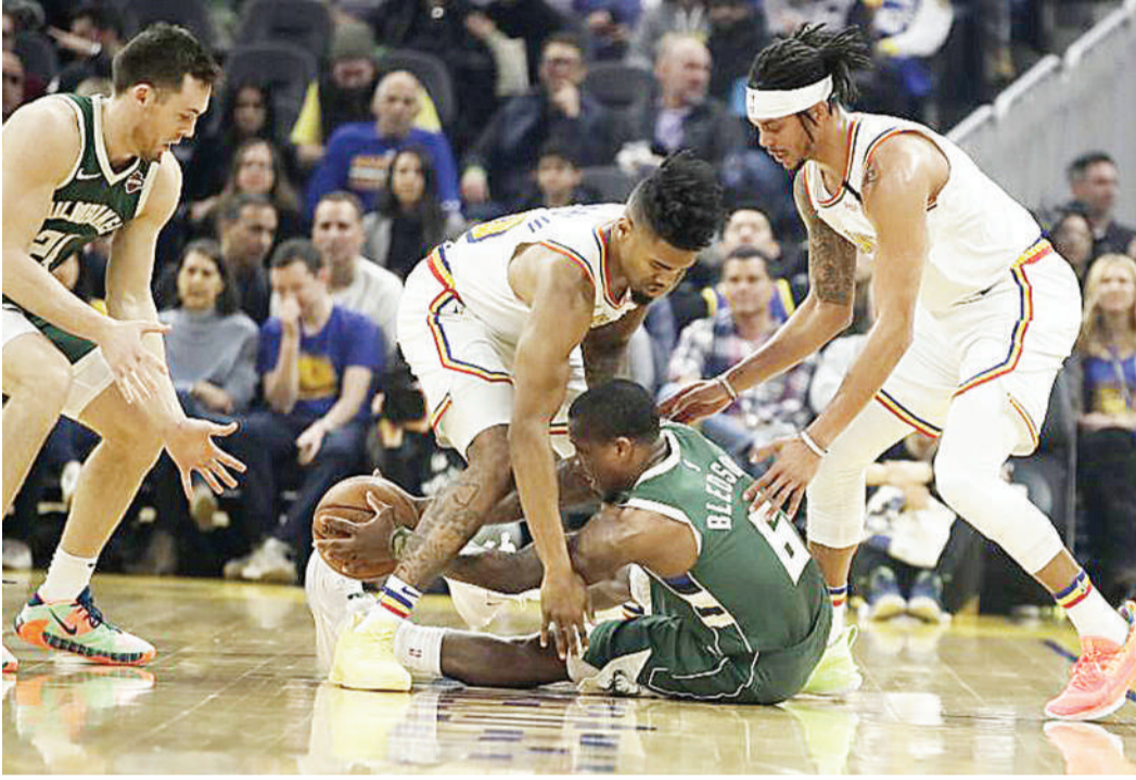
Milwaukee Bucks' Eric Bledsoe (6) passes the ball between the legs of Golden State Warriors' Glenn Robinson III to teammate Pat Connaughton, left, during the first half of an NBA basketball game Wednesday, Jan. 8, 2020, in San Francisco. At right is Warriors' Damion Lee.