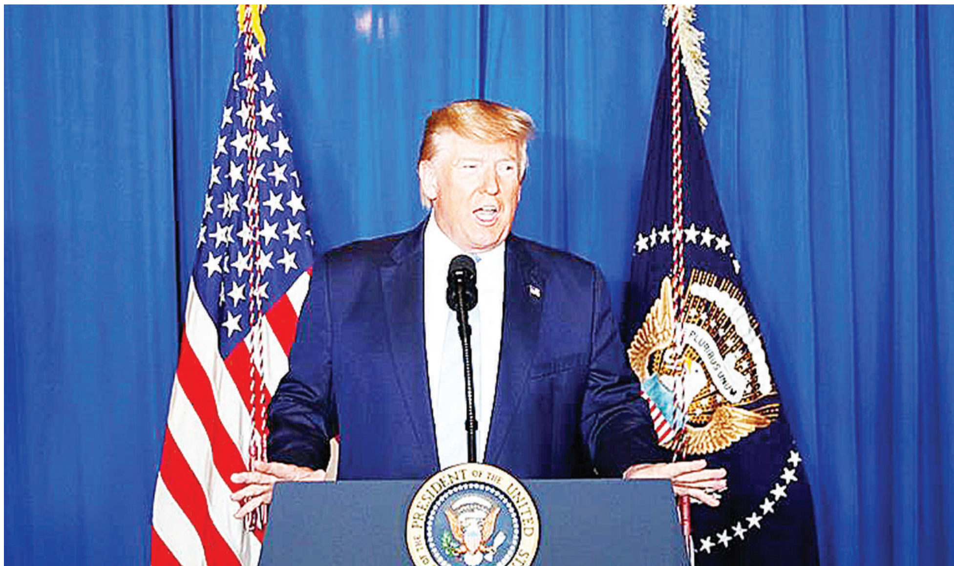
Trump comments at a press conference following the US military killing of Iranian General Qassem Soleimani in Baghdad, Iraq. File photo

the authority to direct military action is divided between Congress and the president.