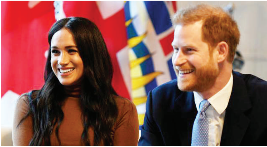
Britain's Prince Harry and his wife Meghan, Duchess of Sussex, leave Canada House in London, Britain on Tuesday.