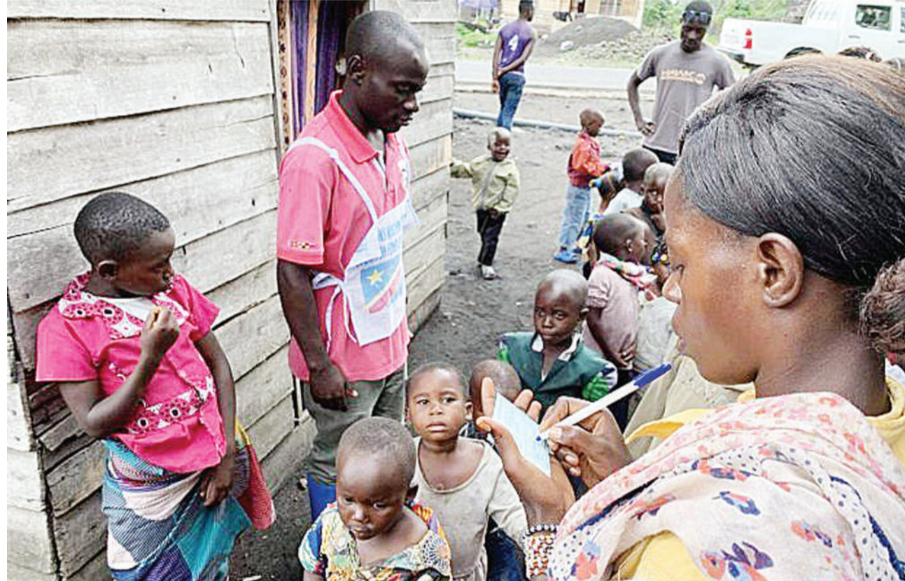
The WHO says more is needed to be done to curb a deadly outbreak of measles in the Democratic Republic of the Congo.

Twenty-five per cent of the reported measles cases in the country are in chil-