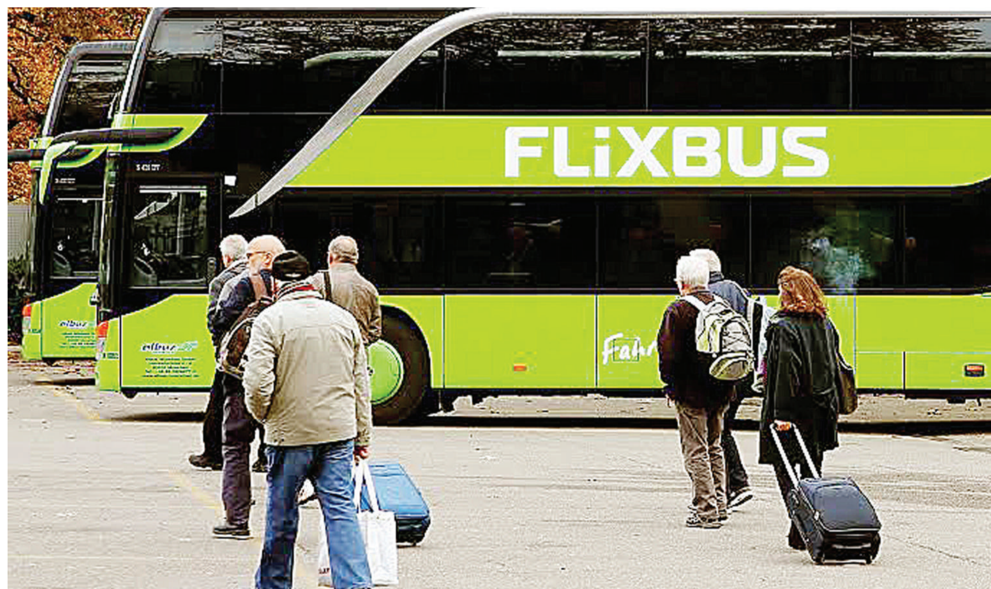
Passengers walk in front of a FlixBus intercity bus at the Carparkplatz Sihlquai bus station in Zurich, Switzerland.

In August, the Supreme Court overturned an appeals court ruling that had given Lee a suspended jail term, raising the possibility of a tougher sentence and potential return to jail.