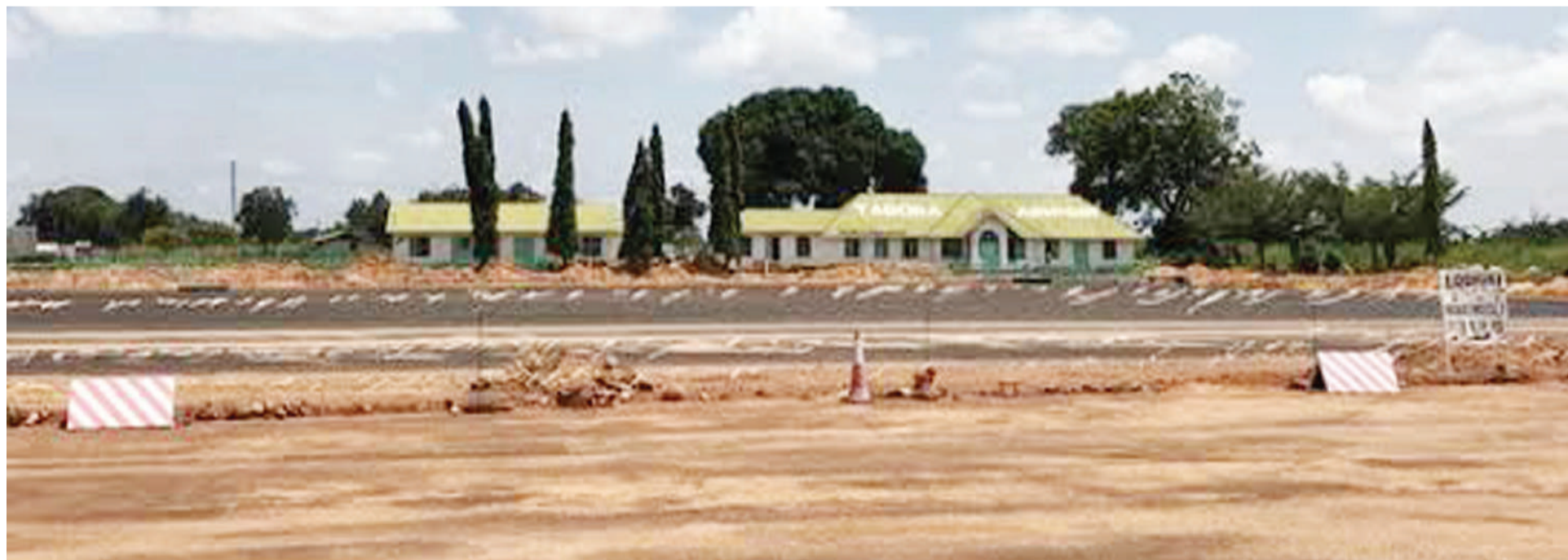
A vicinity of Tabora Airport. File photo.