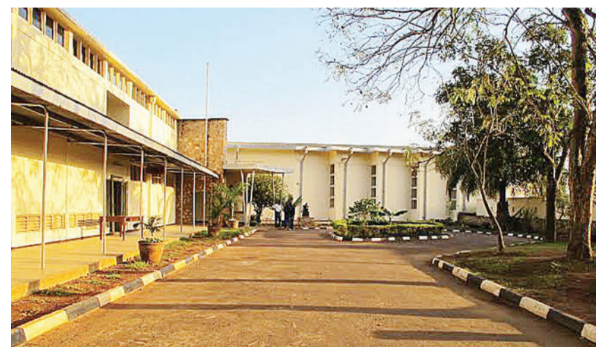
Uganda National Museum. File photo.

In the past, it funded the Getty Leadership Institute for "current and future museum leaders", which is now at Claremont Graduate University.