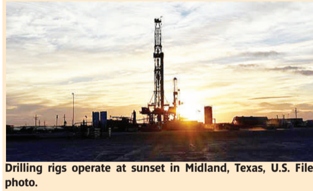
Drilling rigs operate at sunset in Midland, Texas, U.S. File photo.

Gas production rose about 10% in 2019 to a record 92.05 billion cubic feet per day (bcfd), according to the U.S. Energy Information Administration.