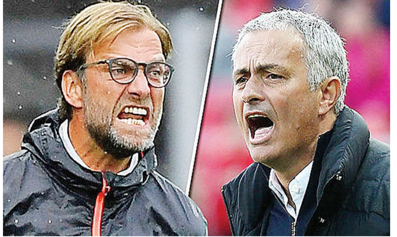
Jurgen Klopp -

The match could still be an awkward trip for the visiting Reds who beat Tottenham in last year's Champions League final and have a near-perfect record of 58 points out of 60 this season to sit 13 points clear at the top.