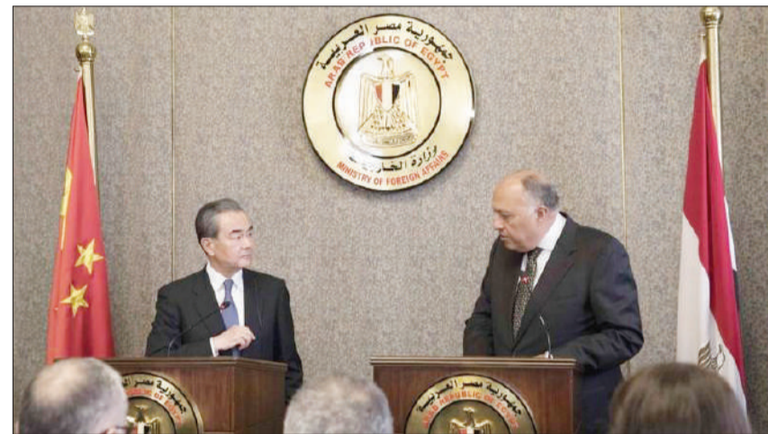
Chinese State Councilor and Foreign Minister Wang Yi (left) and Egypt's Foreign Minister Sameh Shoukry attend a joint press conference in Cairo, Egypt, on Wednesday.

The Chinese measures "are totally legal, as they are widely recognized as preventive counter-terrorism steps," Wang said.