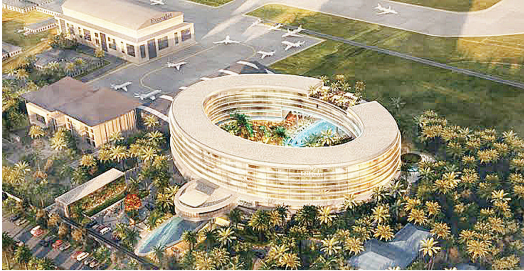
Hilton Lagos Airport Hotel. File photo

The hotel will also feature a spa and fitness centre. Set over several levels, the property takes advantage of the differences in height and uses external decks, atria and sunken lobbies to create a variety of spaces that