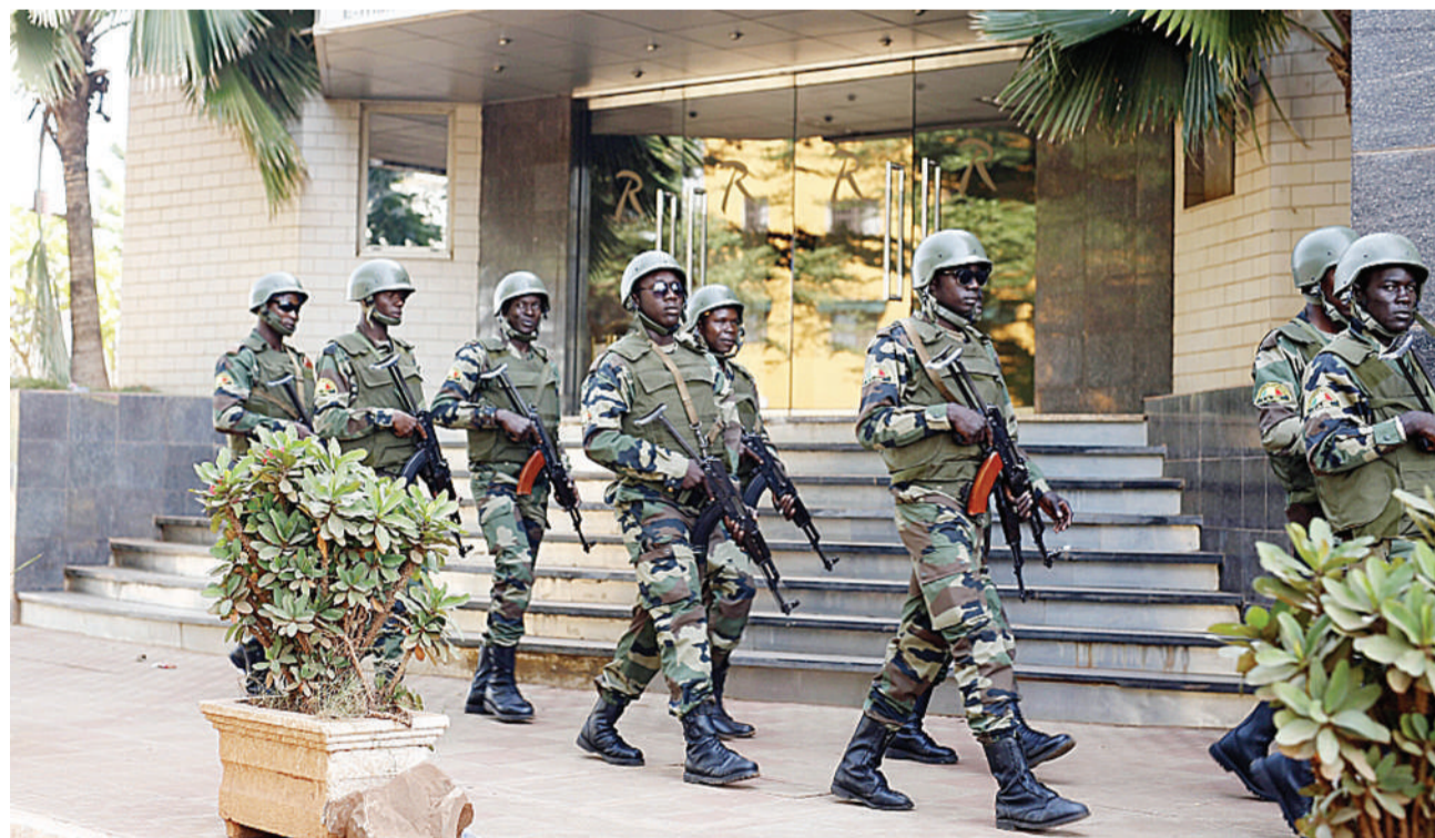
Attacks increased five-fold in Burkina Faso, Mali and Niger since 2016 with more than 4,000 deaths reported in 2019. File photo

Residents and a military source told the Reuters news agency that about 20 soldiers were killed and nearly 1,000 people made homeless on Tuesday