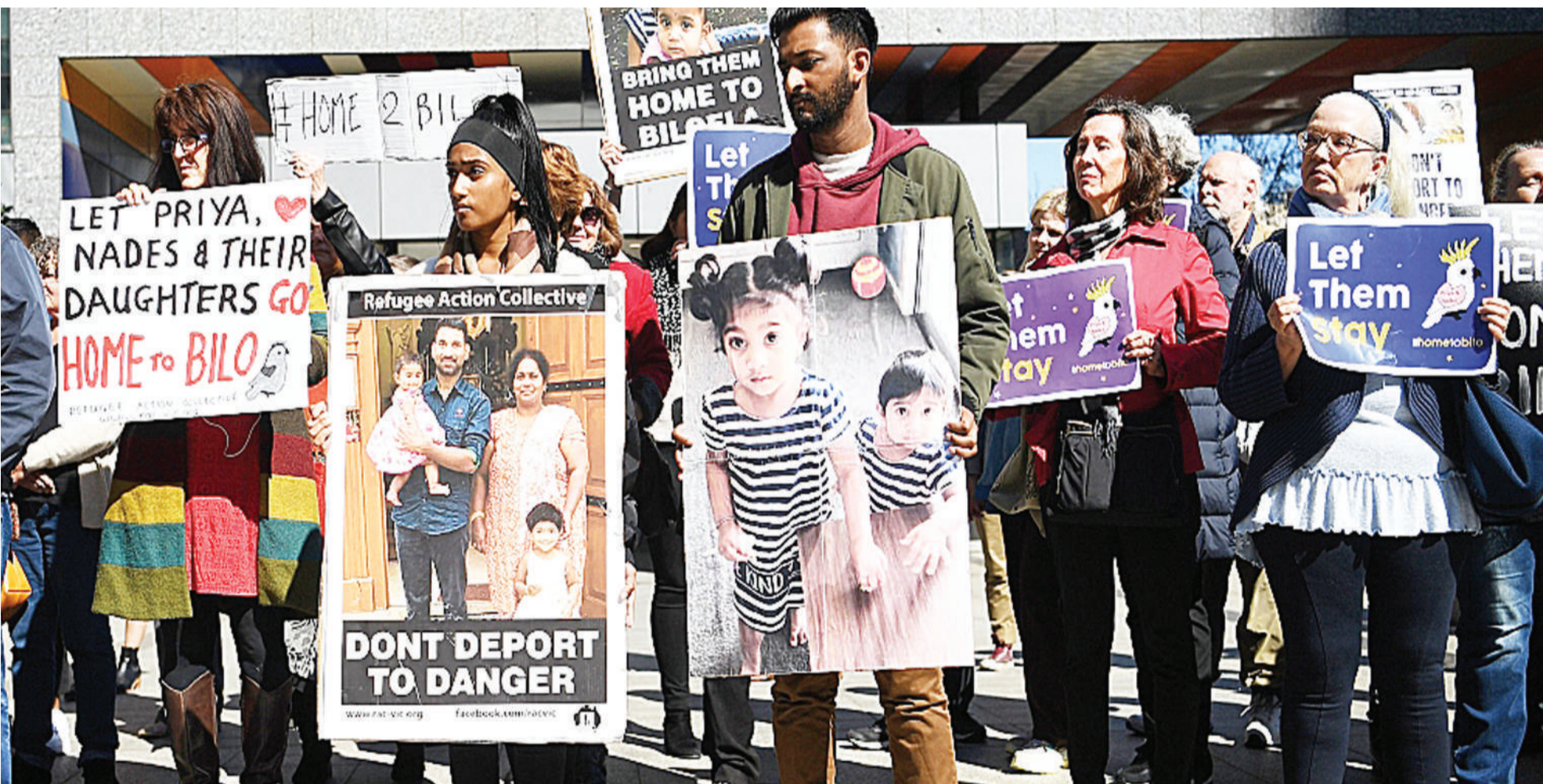
Demonstrators rally in Melbourne in support of a Tamil family, who were sent to the remote Australian territory of Christmas Island. There are more than 7,000 men, women and children in migrant detention centres across the country. File photo

weeks on the streets, train-hopping from country to country.