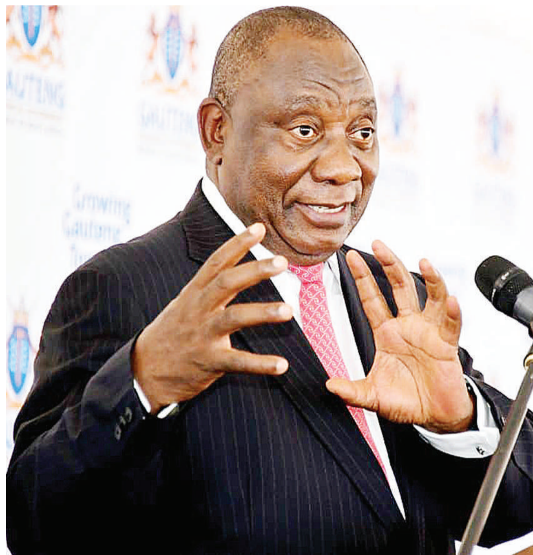
South African President Cyril Ramaphosa. FILE PHOTO

and corruption even in the private sector will have to face the music. This is how we restore the moral fibre of our country, something the fightback people don't want by hook or by crook. And so, there's talk of retaliation against the president of the country at the National General Council (NGC) of the ANC to be held in June 2020. To beat CR into a political pulp and begin to plant a seed that says he is not fit for the highest office in the land. That he has not adhered to the Nasrec Conference resolutions and that therefore he supposedly serves the interests of white monopoly capital. Off with his head, will become the