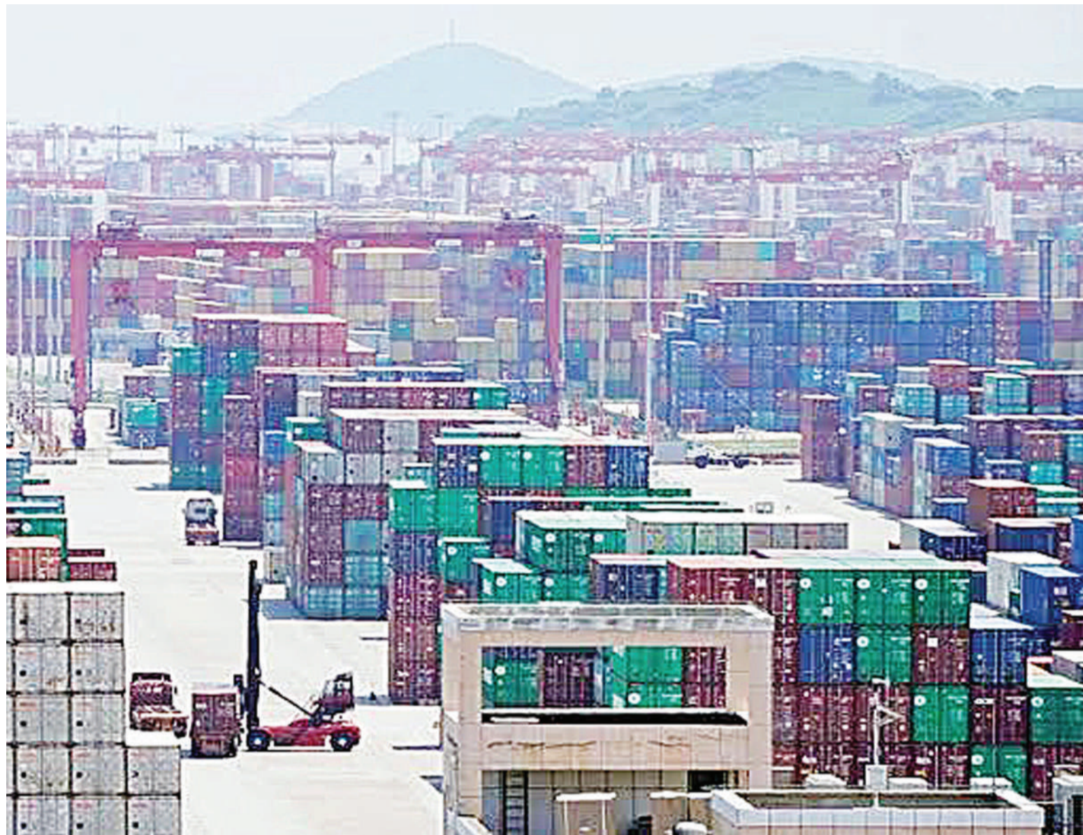
Containers are seen at the Yangshan Deep Water Port in Shanghai, China. File photo.