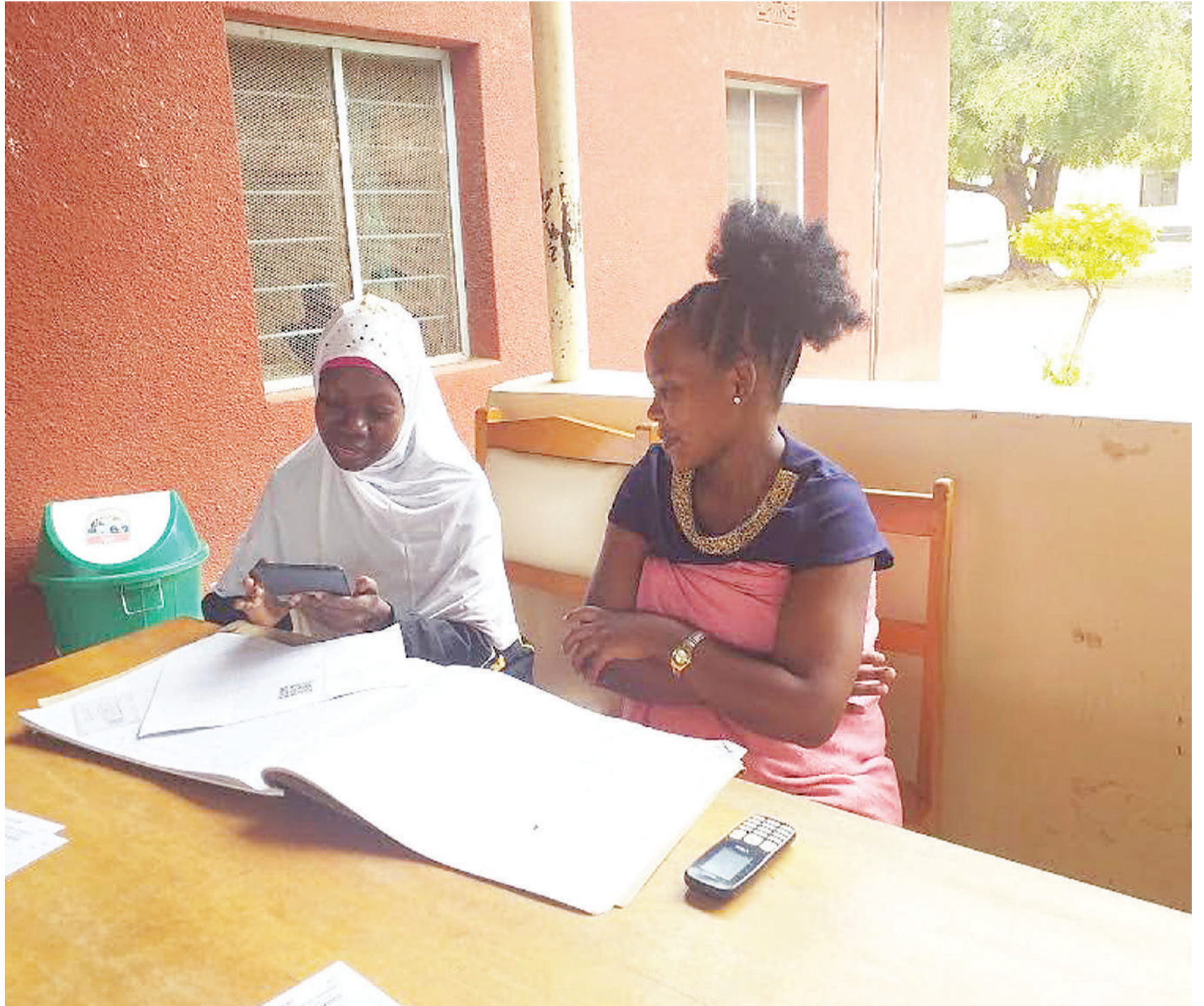
A resident of Airport in Arusha Region is attended to by a Nurse Incharge at Magugu Health Centre in Babati Rural, Manyara Region.

Moreover, the project has enabled the facility to procure oxygen concentrators, delivery sets and caesarean sets to improve healthcare services all the time.