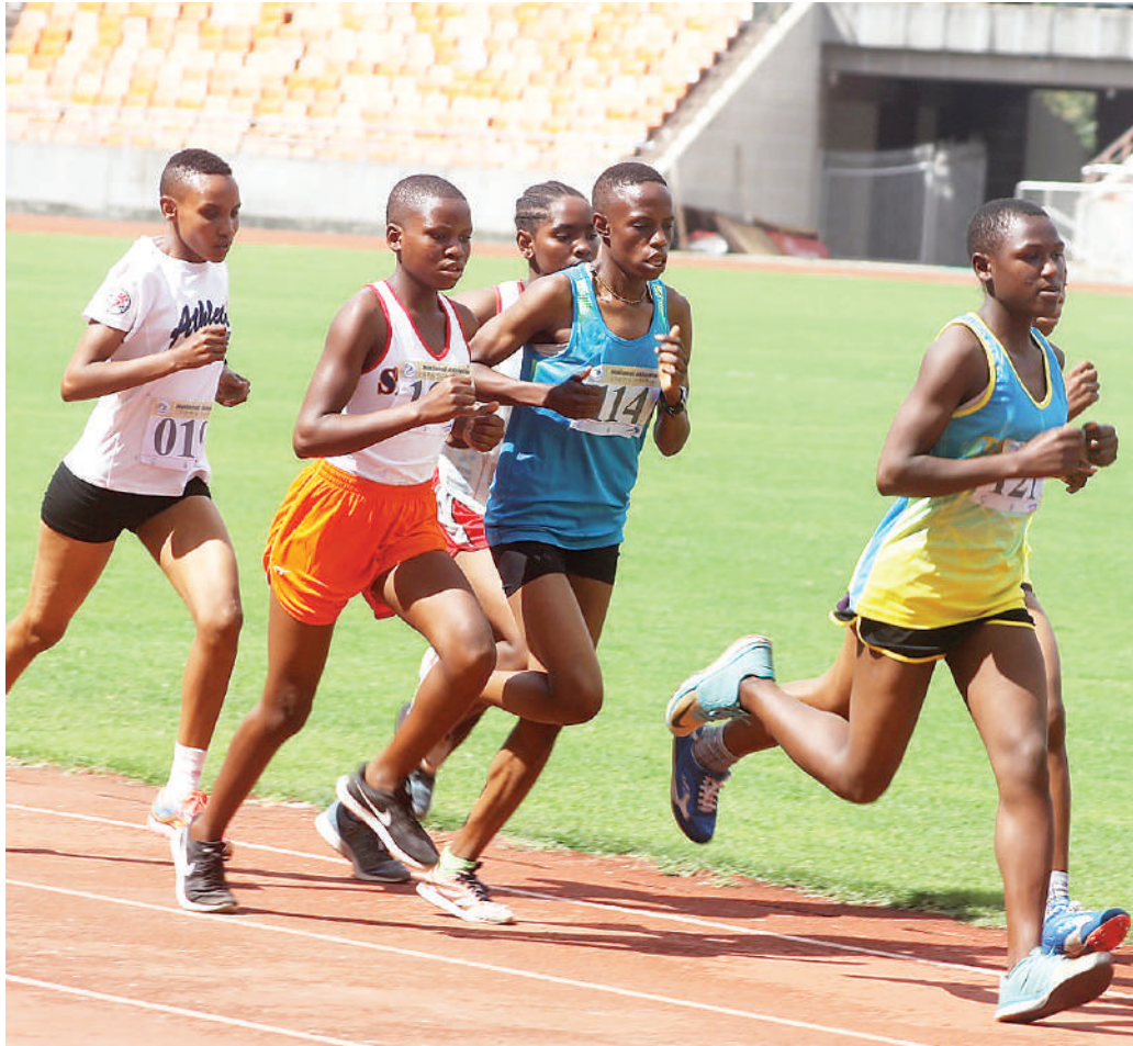
Female athletes take part in women's 1500m race final of the 2020 National Championships, which took place at Benjamin Mkapa Stadium in Dar es Salaam recently.