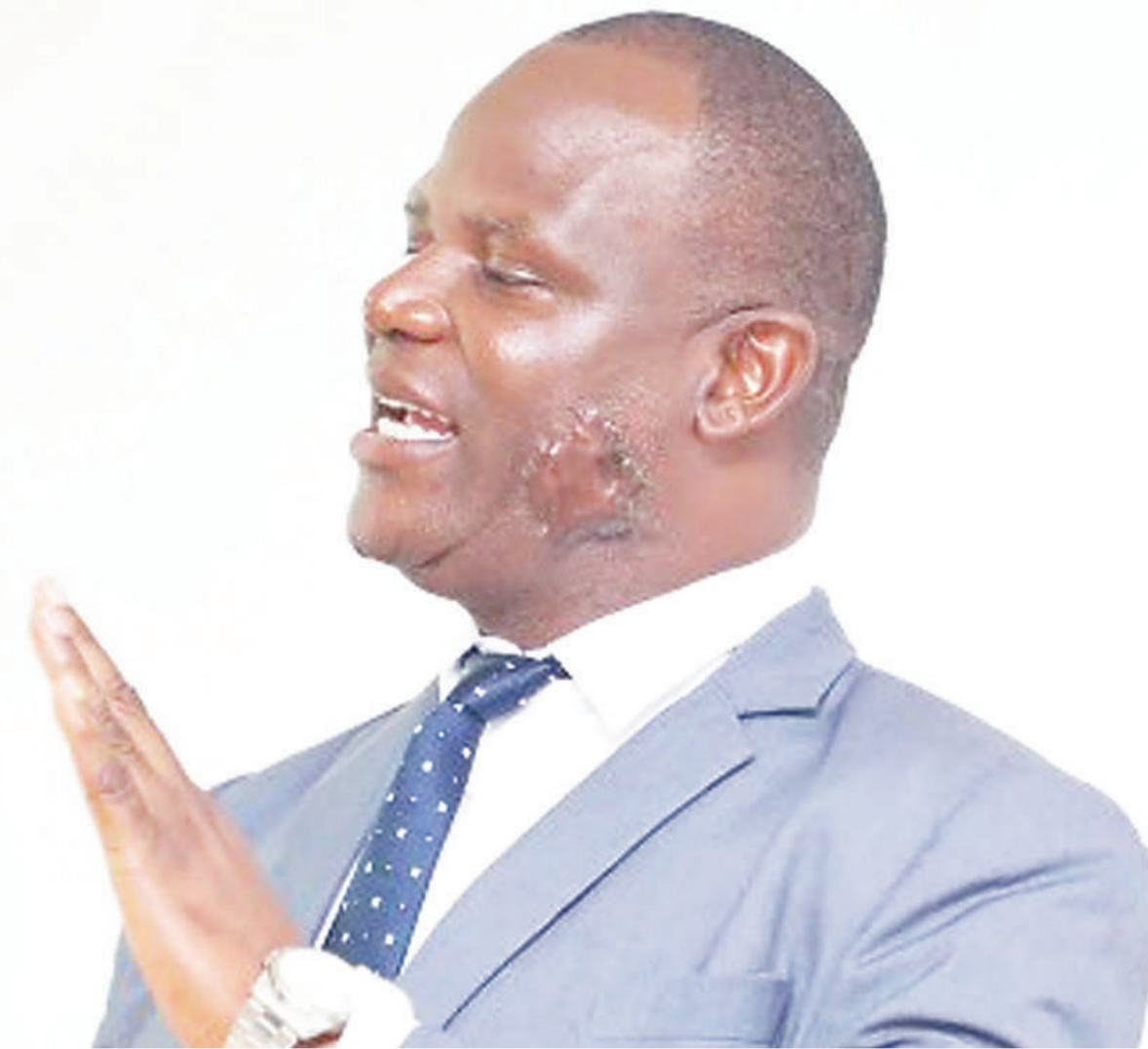
Agriculture minister Japhet Hasunga speaks at a past event