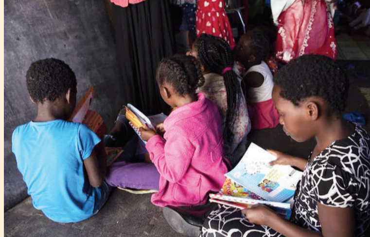
Children who are part of a group of about 630 refugees originally from Democratic Republic of Congo, Rwanda, Burundi, and Bangladesh, and other countries attend a makeshift school in a tent in Bellville, Cape Town, yesterday.

UNICEF's call to safely re-open schools follows scientific evidence which shows children are not super-spreaders of COVID-19, and are the least affected by the virus in the region, with a mere 2.5 percent of COVID-19 cases attributed to children of school-going ages between five to 18 years.