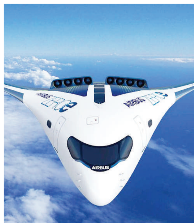
ZEROe is an Airbus concept aircraft. In the turboprop configuration, two hybrid hydrogen turboprop engines provide thrust. The liquid hydrogen storage and distribution system is located behind the rear pressure bulkhead.