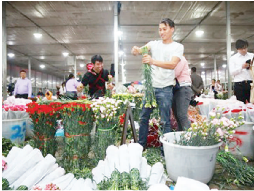
Florists pack fresh cut flowers at the Dounan Flower Market, Kunming, capital of southwest China's Yunnan province. File photo