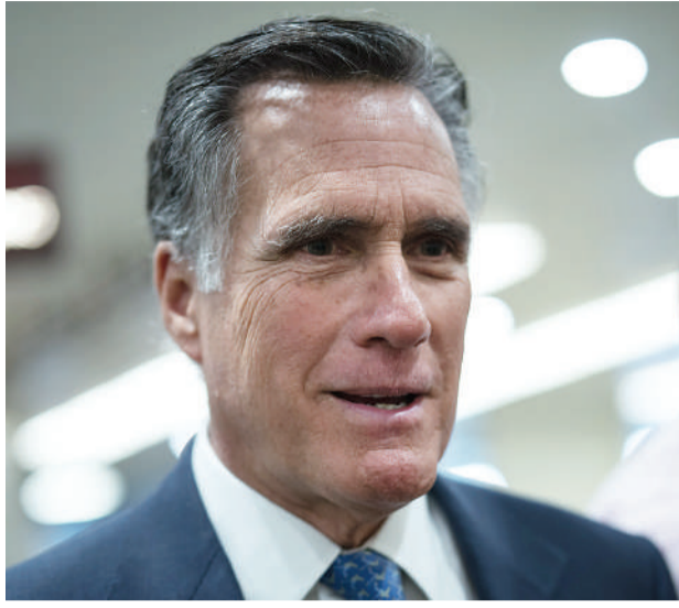
Republican Senator Mitt Romney

Democrats accuse Republican lawmakers of hypocrisy, pointing out that they refused to even consider Democratic President Barack