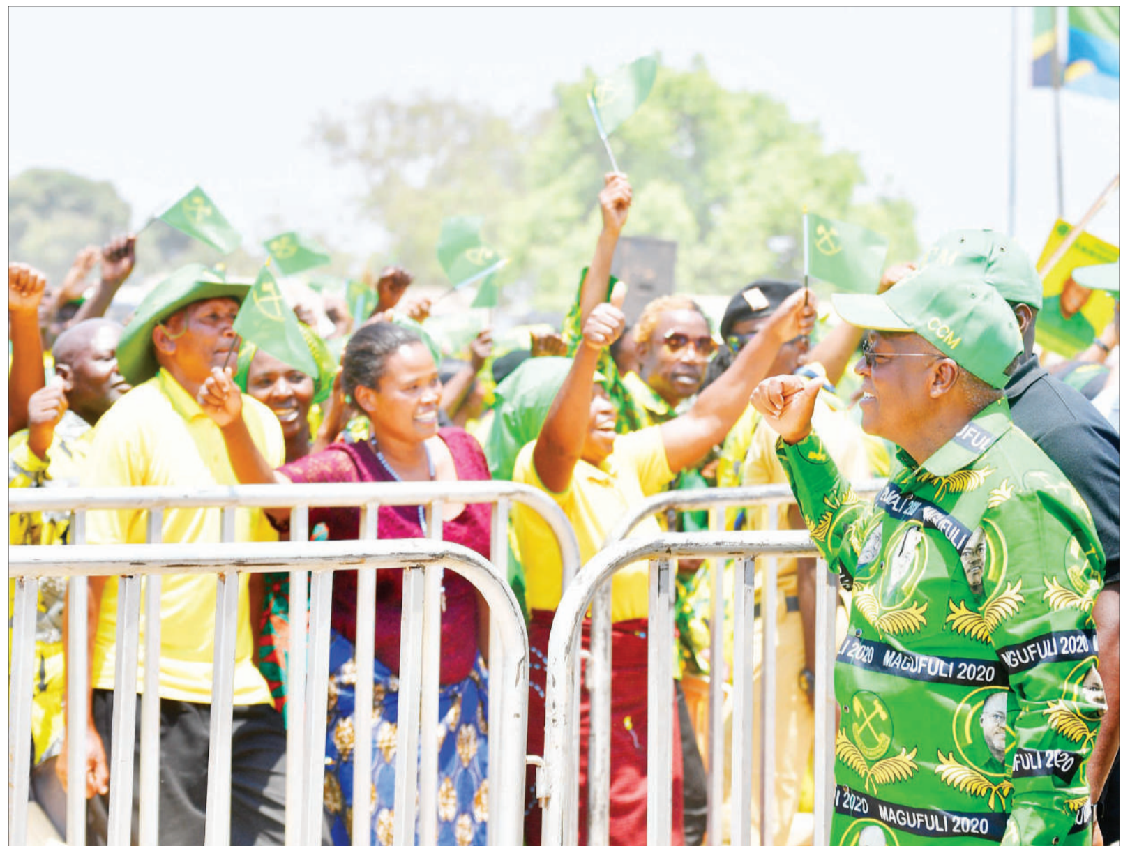
Dr John Magufuli, CCM's candidate for the Tanzanian Presidency in the forthcoming General Election, waves to Itigi residents shortly after addressing a campaign rally in Manyoni District, Singida Region, yesterday.

When completed, the pipeline will have the capacity to transport 216,000 barrels of crude oil per day and in the next 25 years, Tanzania will earn 7.5tr/-, project documents show.