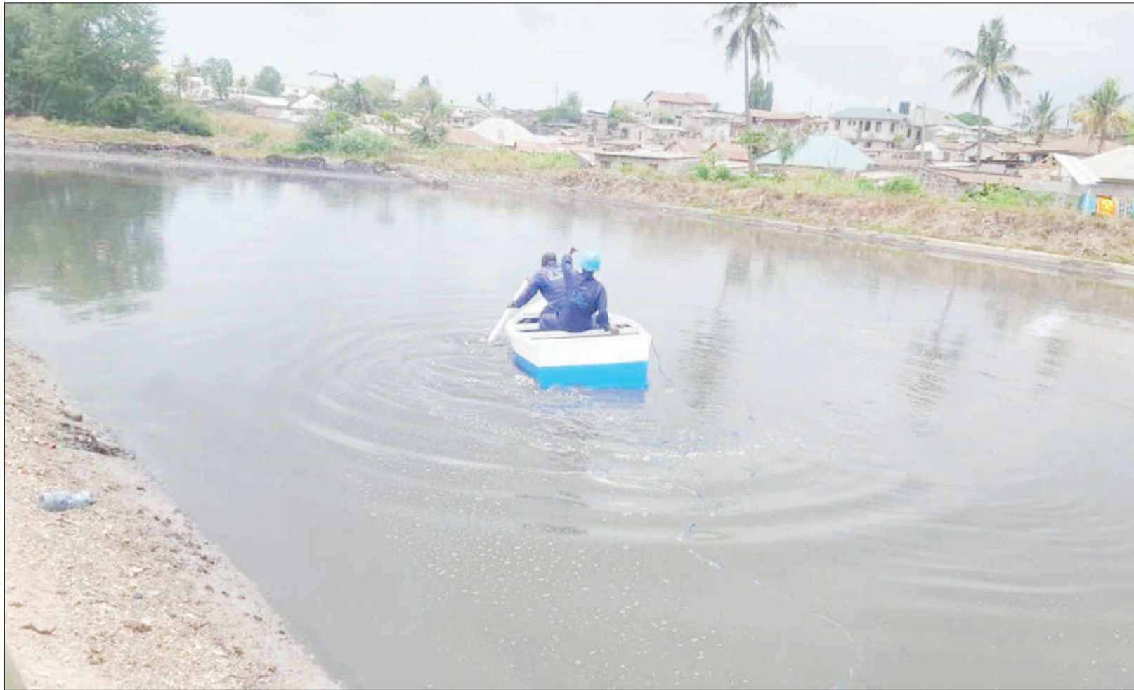
Dar es Salaam Water and Sanitation workers deploy a boat yesterday in the course of removing solid waste accumulated in sewers at Vingunguti in Dar es Salaam.