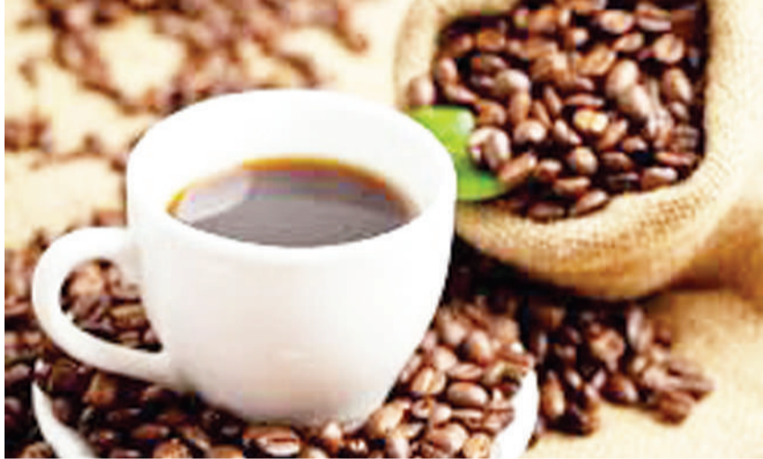
A cup of organic coffee.

He said that organic coffee costs more compared to regular coffee which is attractive to farmers but the costs of certification, additional labour power needed and the extra work that goes into maintaining