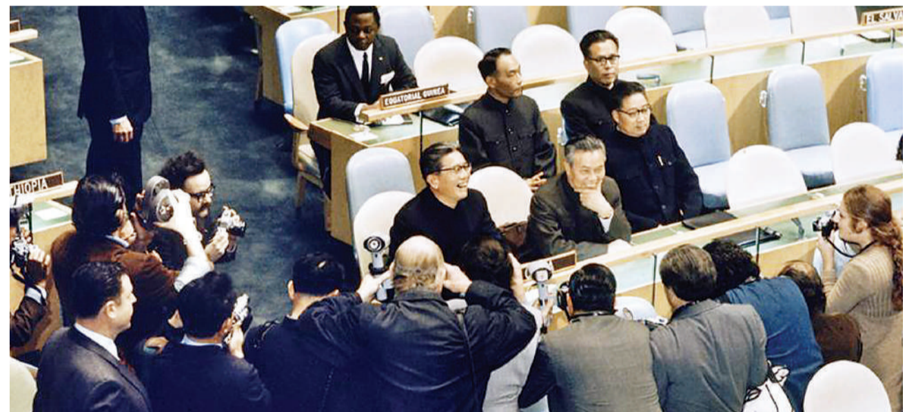
Photographers take pictures of the delegation of the People's Republic of China when the delegation attended the 26th UN General Assembly on Nov 15, 1971. File photo

Additionally, such UN specialized agencies as, among others, the World Health Organization (WHO), the UN Food and Agriculture Organization, the UN Educational, Scientific and Cultural Organization, the International Monetary Fund and the International Atomic Energy