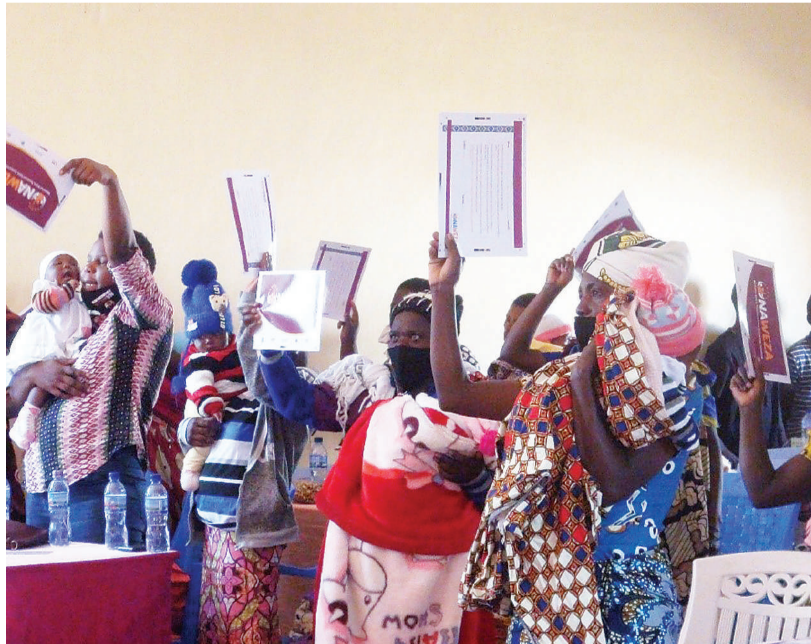
Mothers who attend USAID Tulonge Afya meeting earlier this week in Wanging'ombe District Njombe Region, wave their certificates of participation.

He urged mothers to seek and receive prompt and appropriate care at first sign of new-born and childhood illness especially for fatal diseases such as malaria which kill thousands annually. "You also need to seek and receive prompt and appropriate health care at government facilities with qualified personnel," he noted.