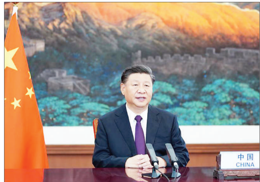
Chinese President Xi Jinping addresses a high-level meeting to commemorate the 75th anniversary of the United Nations via video on Monday.

"There must be no practice of exceptionalism or double standards. Nor should international law be distorted and used as a pretext to undermine other countries' legitimate rights and interests or world peace and stability," Xi said.