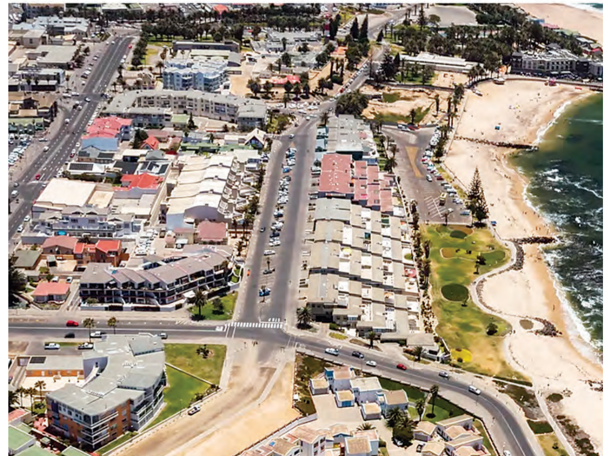
Namibia is home to the largest desalination plant in Southern Africa.

After the first part of the Harambee Prosperity Plan (HPP), launched in 2016 and lasting till 2020,