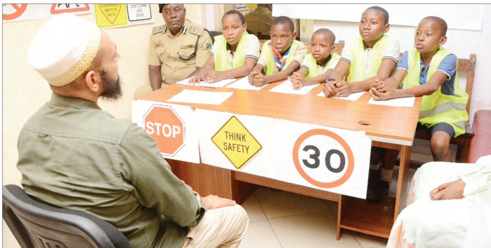
Traffic Police Commander Wilbrood Mutafungwa seated in Dar es Salaam at the weekend alongside pupils of the city's Olympio Primary School pupils as a driver (back to camera) held by police for not stopping at a zebra crossing near the school defends himself. But stop: It is not really a scene related to proceedings of an actual court case - only a representation of a children's moot court programme aimed at enhancing road safety awareness.

DISTRICT commissioners and district executive directors have until the end of next month to deliver on the construction of health centres, dispensaries and hospitals, the government has cautioned.