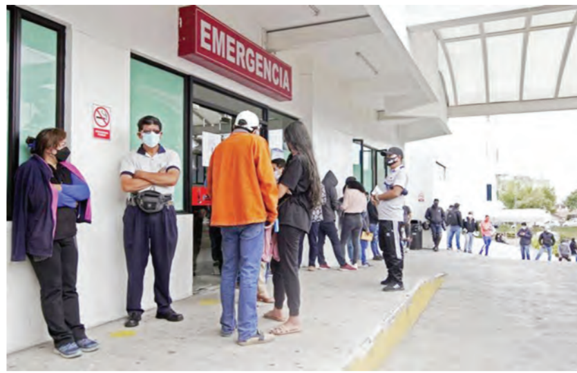
People showing possible symptoms of the novel coronavirus disease COVID-19 queue at the IESS San Francisco General Hospital in Quito, on Jan 17, 2022. File photo

Canada's chief public health officer on Friday called for more people to get a booster to make the public health system more resilient as the country began to lift COVID-19 restriction meas-