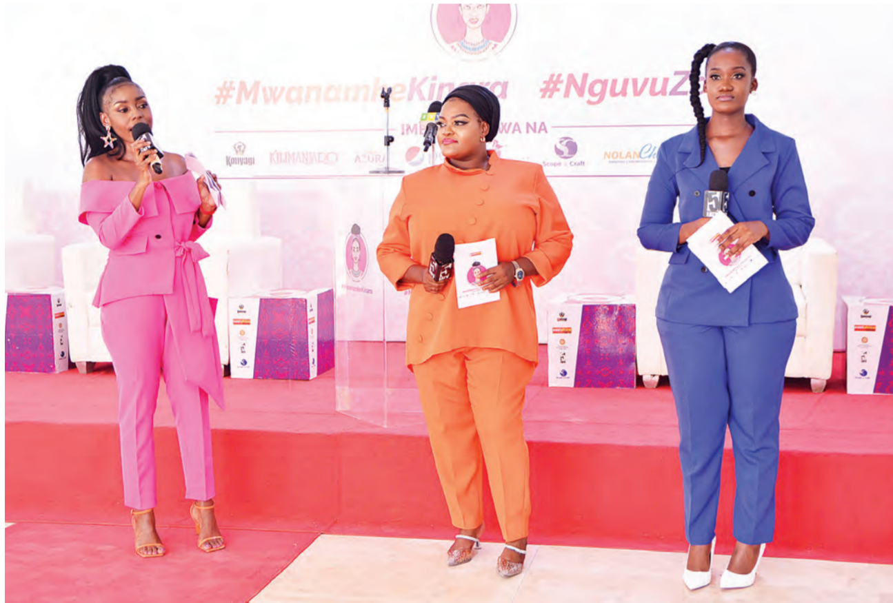
Presenters of EATV's 'Mama Mia' programme in action.