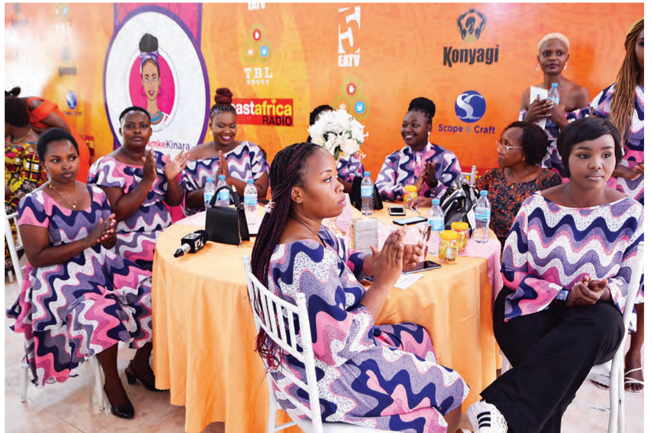
The audience follows address by the deputy minister, who graced the event as chief guest.