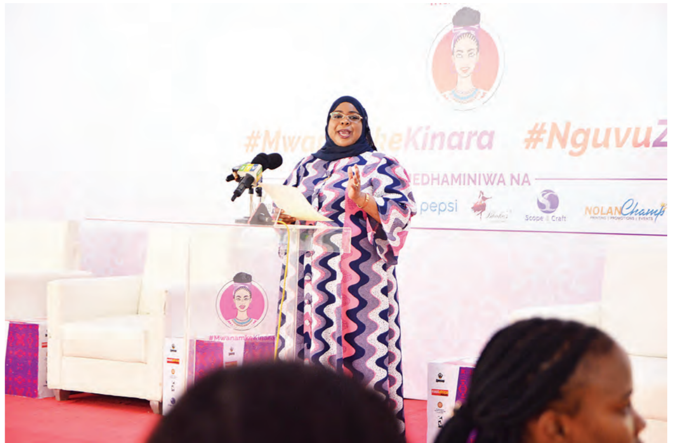
The deputy minister speaks at the event.