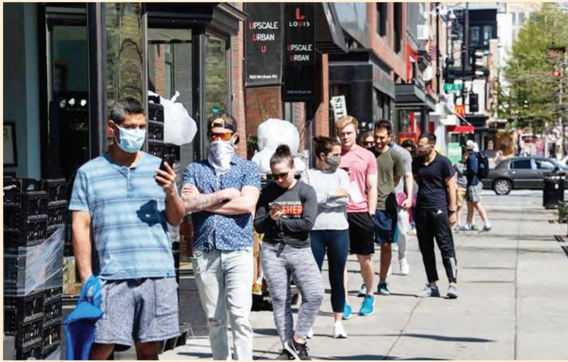
People stand in line to enter a grocery store in Washington, the United States, April 8, 2020.

The US accusation of the so-called "ethnic genocide" and "human rights violations" in China's Xinjiang is an outright lie of the