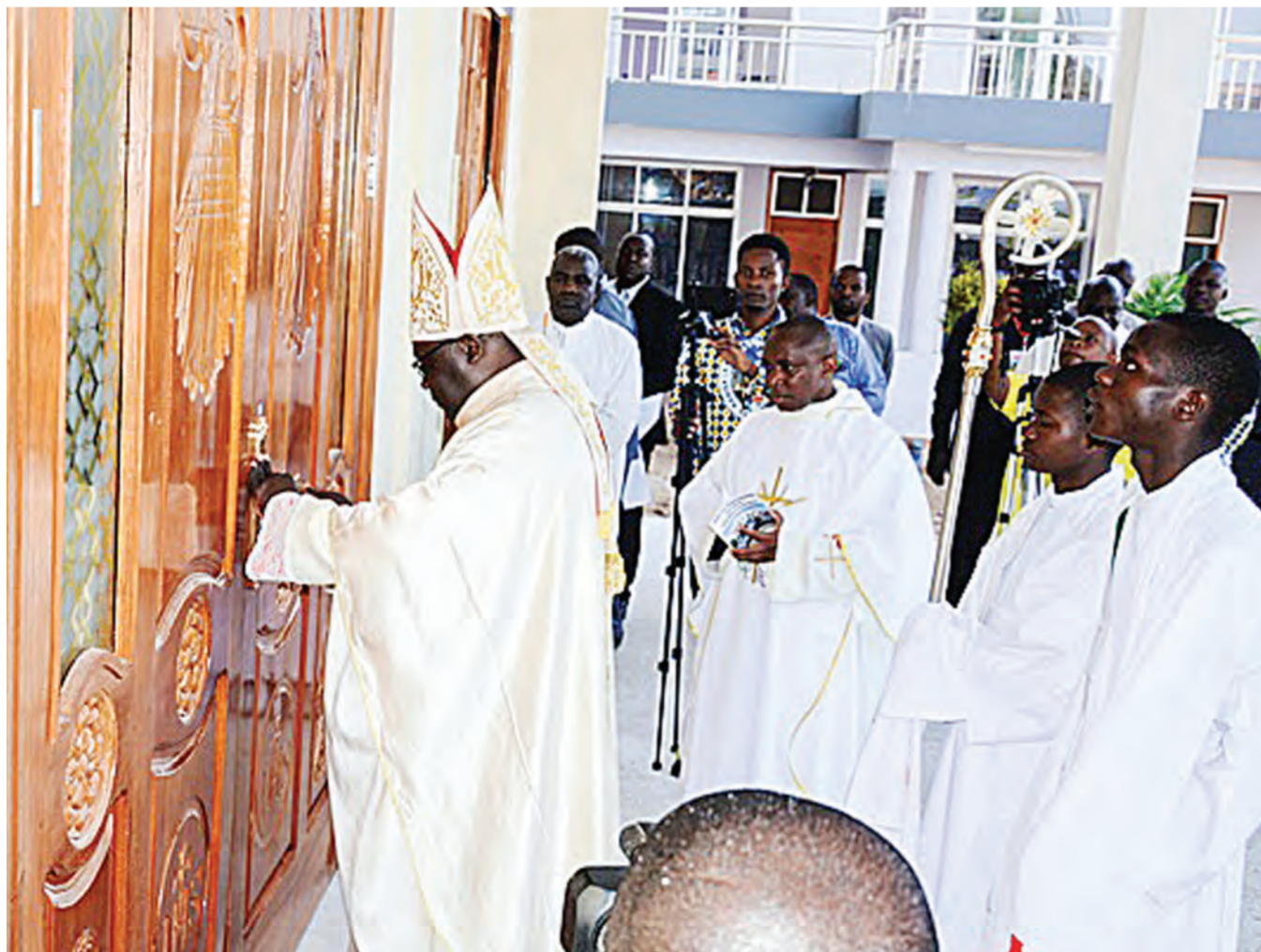
Bishop Flavian Kassala of Catholic Diocese of Geita moves to launch Bikira Maria wa Fatima church in Geita at the weekend.

To meet this demand, around 6,200 MW of new generation capacity will be added to the national grid, with 71.5 per cent based on hydropower and renewable energy sources, he added.