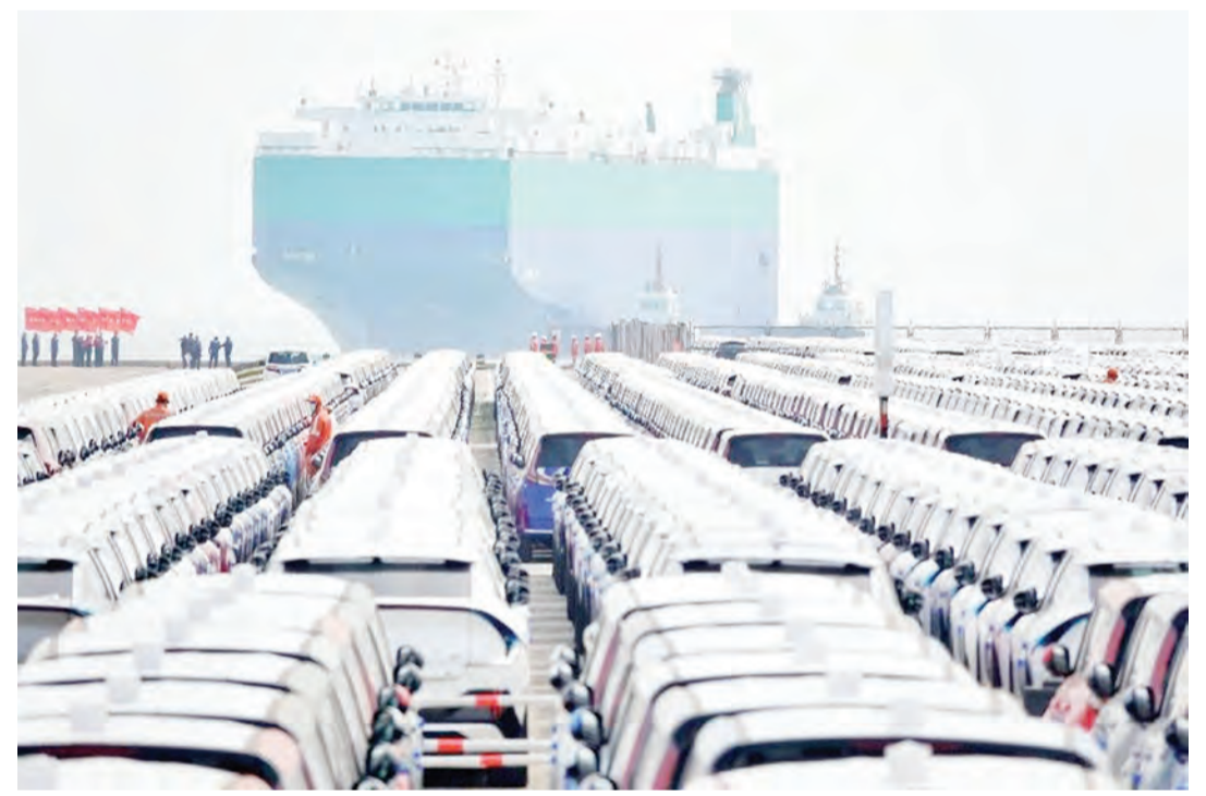
Vehicles are about to be loaded onto a ship for exportation at the Yantai Port, east China's Shandong province, May 9, 2023.

The year 2023 marks the 10th anniversary of the Belt and Road Initiative (BRI). Over the past decade, the BRI has become the most popular international public good