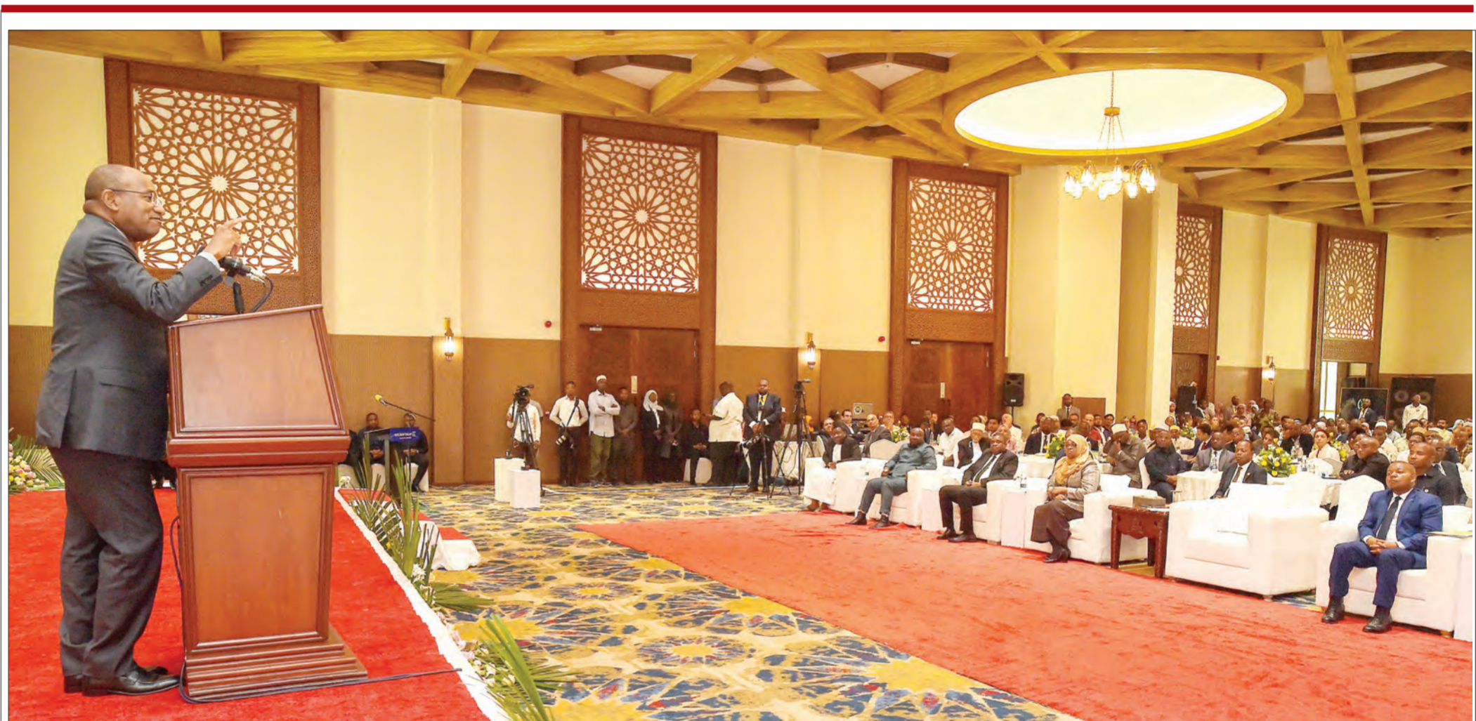
Zanzibar President Dr Hussein Ali Mwinyi speaks at an event to initiate the 'month of gratitude and happiness to taxpayers of Zanzibar 2023' at a State House event yesterday.