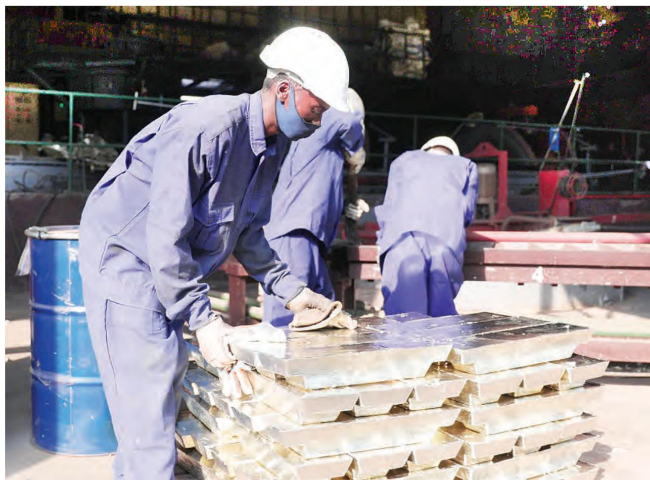
Workers at LuNa Smelter mining factory, the sole producer and exporter of tin in both Eastern and Central Africa in Gasabo district in Kigali.

Wolfram generated 129,407 kilogrammes worth $1.7 million (approx. Rwf2.1 billion) in January, 211,449 kilogrammes worth $2.9 million (approx. Rwf3.6 billion) in February, and 231,844 kilogrammes