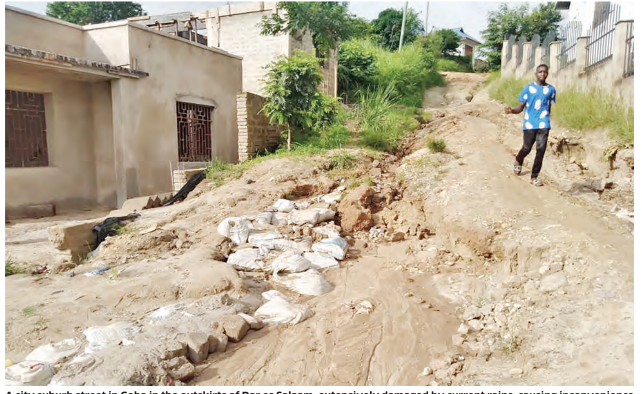
A city suburb street in Goba in the outskirts of Dar es Salaam, extensively damaged by current rains, causing inconvenience to residents as captured yesterday.