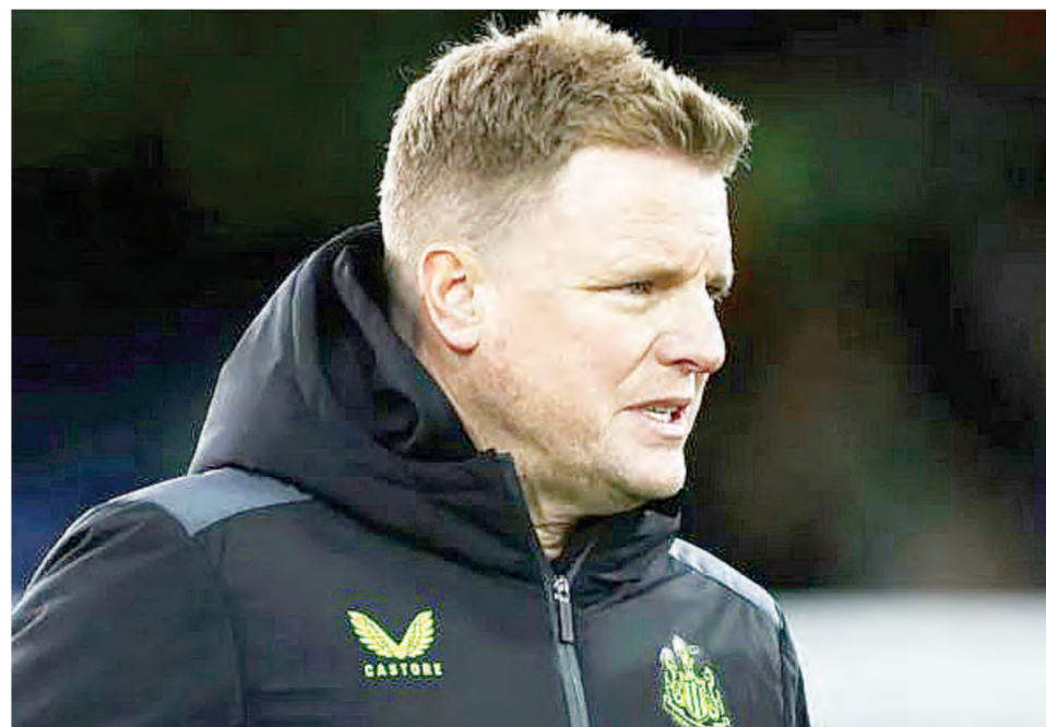
Newcastle boss Eddie Howe is under pressure after a run of poor results.

Guardiola hailed the "mentality we have in our bones" after his side's comeback sent an ominous