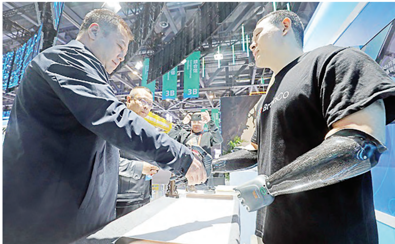
A man shakes a bionic hand at the second Global Digital Trade Expo in Hangzhou, East China's Zhejiang province.

Gongshu, and Lin'an were honored as the most livable urban areas. This marks the 17th year that Hangzhou has received the honorary title.