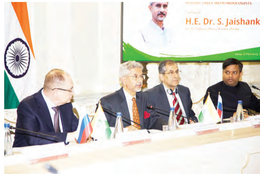
External Affairs Minister S Jaishankar interacts with the indologists during his visit to the St. Petersburg State University, in Saint Petersburg on Thursday.