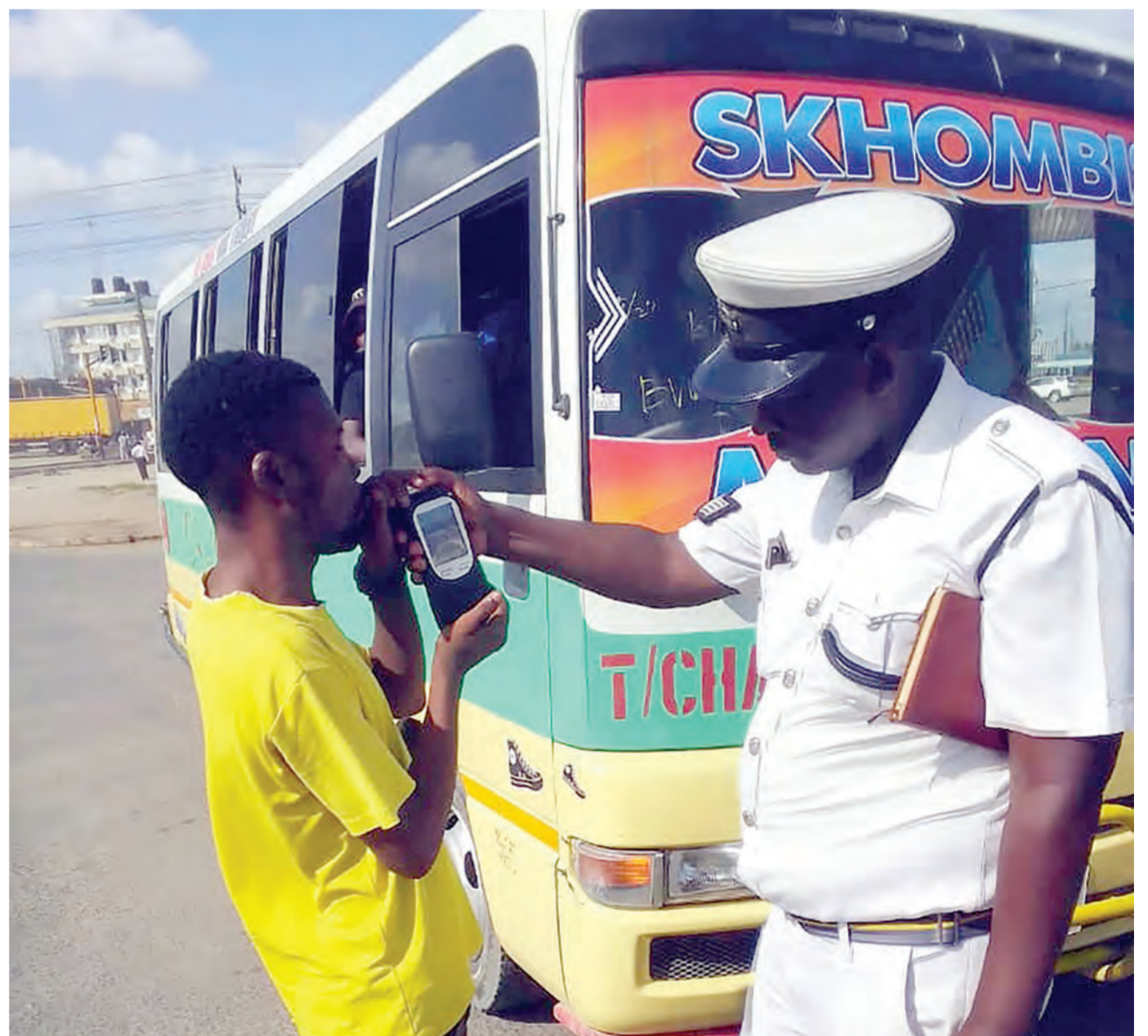
A traffic police officer takes breath to test intoxication level of a commuter bus driver at Banana Ukonga in Dar es Salaam on Thursday.