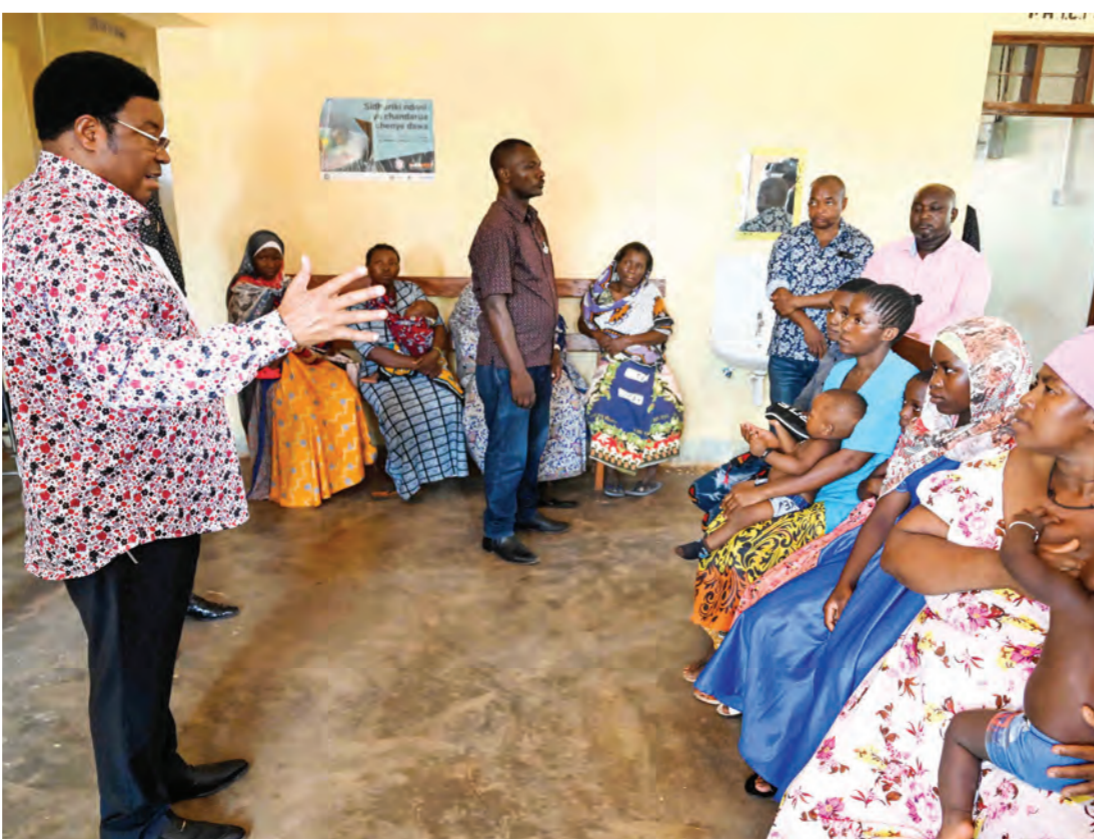
Prime Minister Kassim Majaliwa, in his capacity as Ruangwa MP, speaks to people who came to get treatment at Chinongwe dispensary Ruangwa, Lindi Region, yesterday.