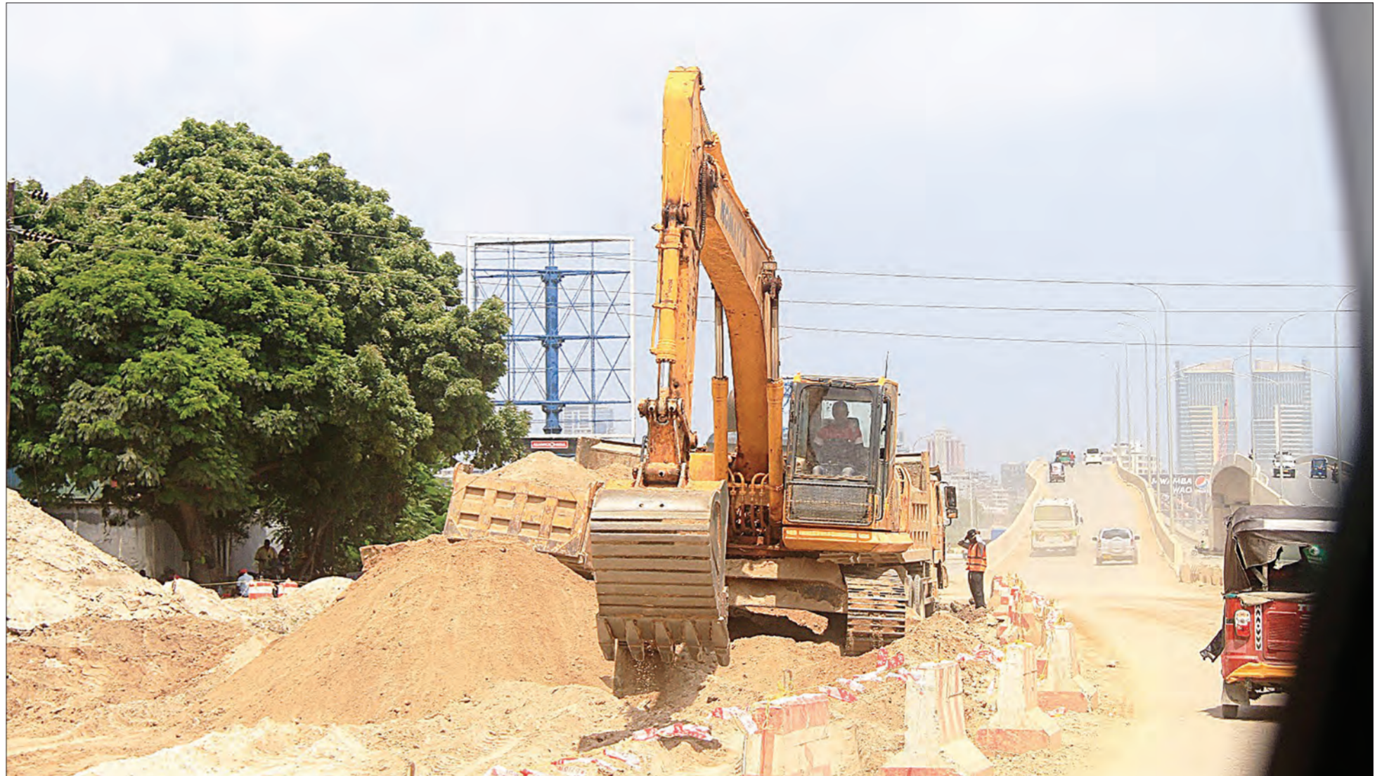
A caterpillar picks rubble at Gerezani - Gongo la Mboto DART construction site along Nyerere Road yesterday.

It is possible that the newly installed digital systems have led to increased revenue and economic growth here in Zanzibar