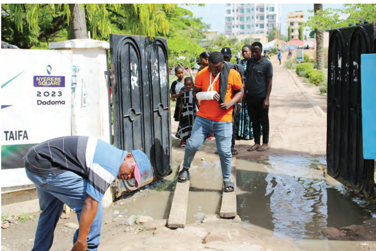
Dodoma residents queuing to enter Mwalimu Nyerere Square amid pools of rain water at the entrance causing inconvenience to passers-by as captured yesterday.