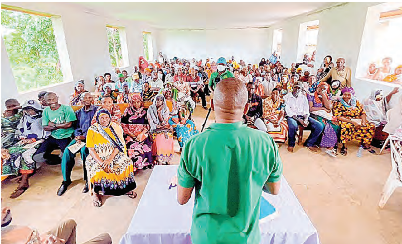
Hamisi Mwinjuma, the Muheza MP doubling up as the Culture, Arts and Sports deputy minister speaks at a public meeting recently.