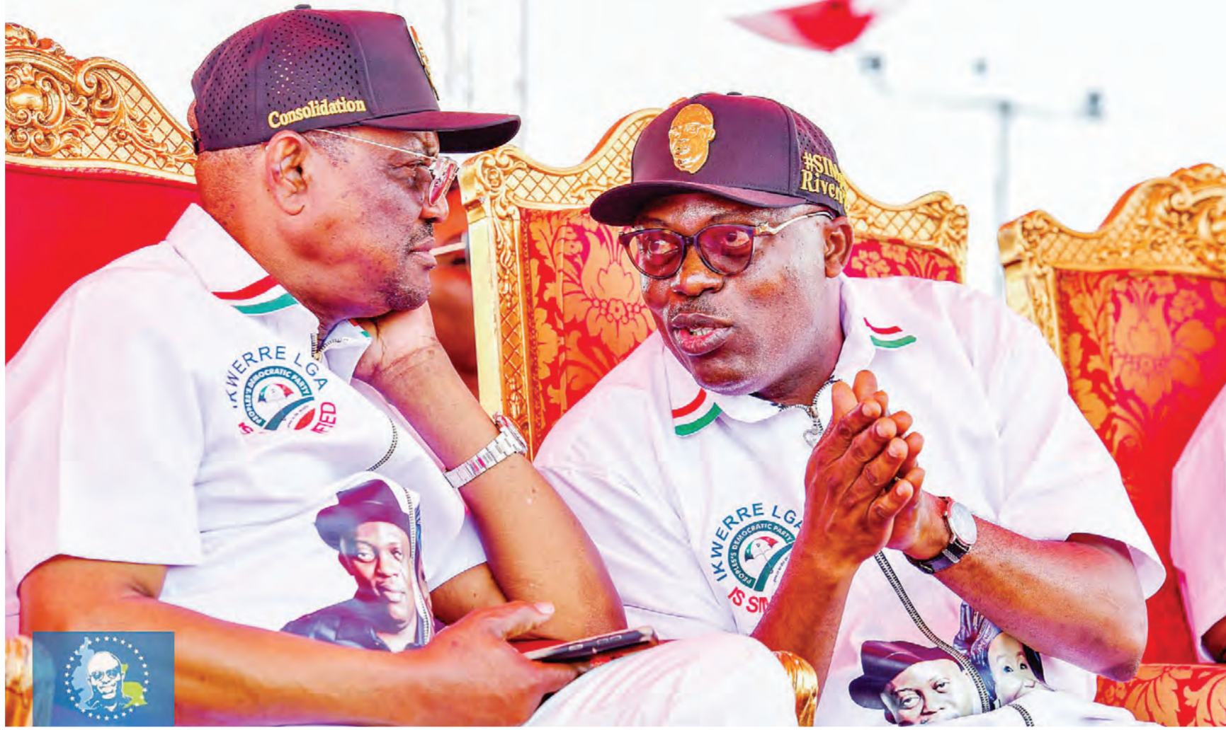
Siminalayi Fubara (right)

Another seeming trait in the DNA of Rivers politics is that all the governors of the State since 1999 (apart from Celestine Omehia who had a brief rule from 29 May 2007 to 25 October 2007) nursed the ambition of being president of the country and