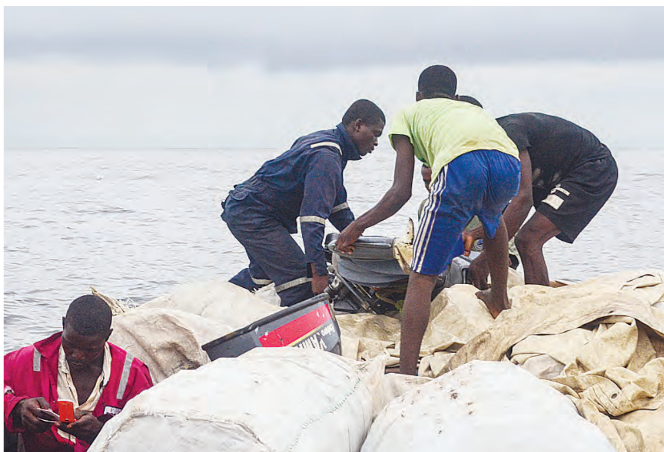
Changing the engine offshore

Meanwhile, ANIESA has scheduled a press conference for Tuesday, in Luanda Province, with the aim of providing more information and clarifications.