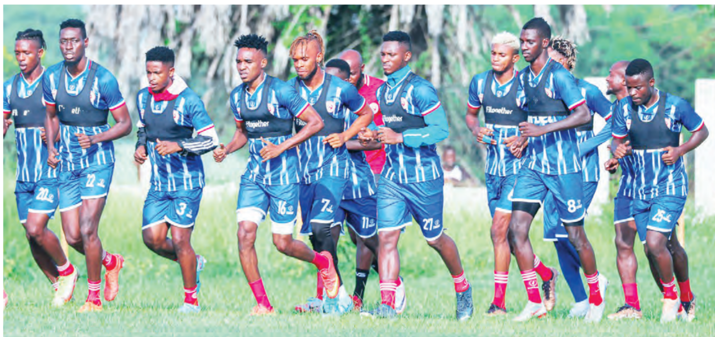
Simba SC players are pictured participating in training at Mo Simba Arena, Bunju in Dar es Salaam recently in preparation for the 2024 Mapinduzi Cup tournament, which got underway in Zanzibar on Wednesday.