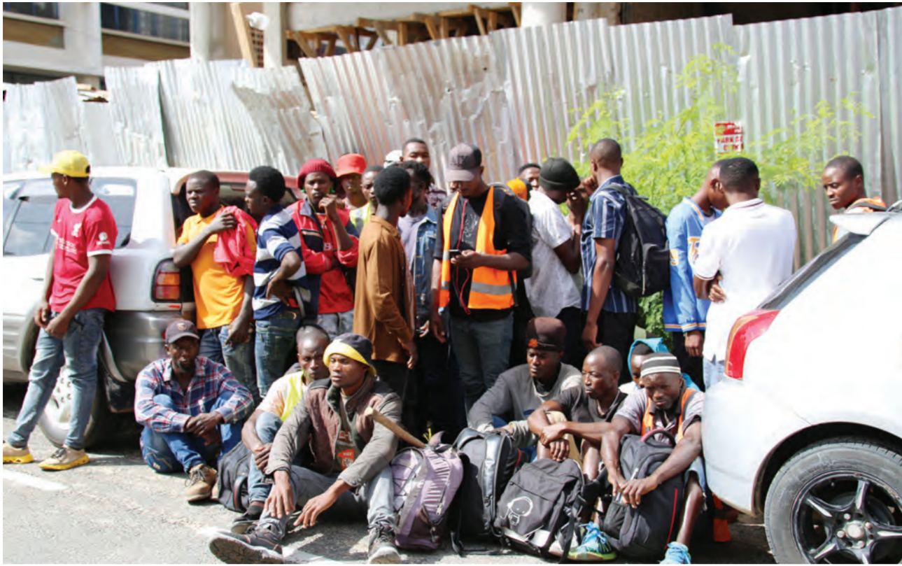
Judex Contractor Ltd casual workers seated outside the Regional Commissioner's office in Dodoma appeal to the government to urge their employer to pay them overdue claims totalling 39m/-after digging ditches stretching 25 km for the Haneti Village water project, Chamwino District. The project is contracted to the company.