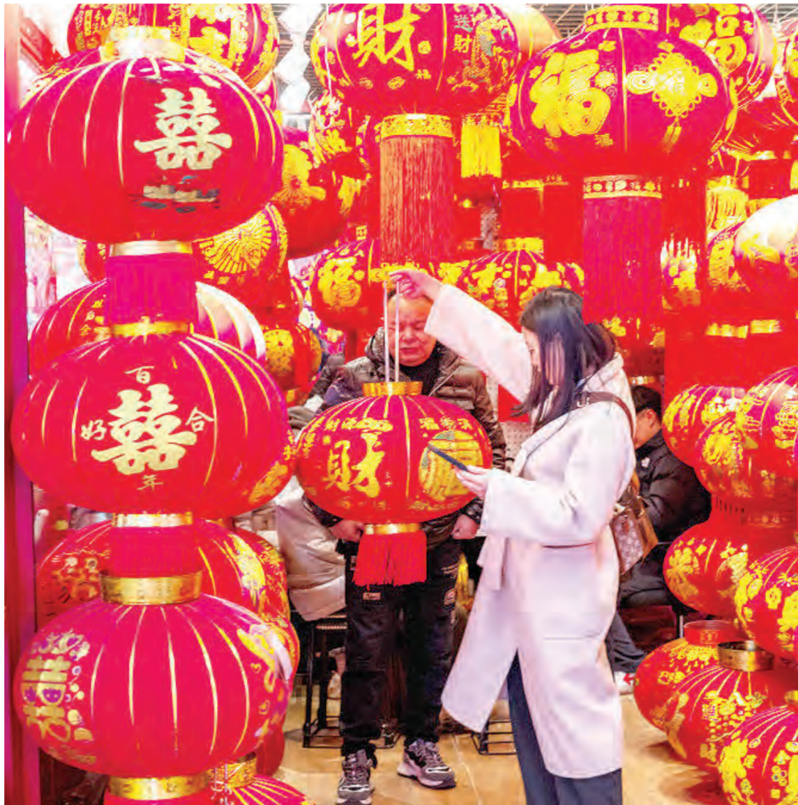
A woman buys lanterns at the Yiwu International Trade Market in Yiwu, East China's Zhejiang province.

The northbound capital, the value that overseas investors buy into the A-share market via the stock connect program linking the Shanghai, Shenzhen and Hong Kong bourses, reported a net purchase of 13.5 billion yuan ($1.9 billion), the highest daily