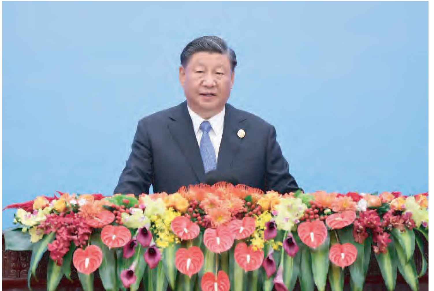
Chinese President Xi Jinping attends the opening ceremony of the third Belt and Road Forum for International Cooperation and delivers a keynote speech at the Great Hall of the People in Beijing, capital of China, Oct. 18, 2023.

As a new year begins, everything takes on a new look. The upcoming year will mark the Year of the Dragon in the Chinese lunar calendar. Dragon represents a symbol deeply rooted in China's national spirit. As people would say, "With the dragon in the air and the tiger on the move, the nation's prosperity is assured". May China and Tanzania enjoy greater prosperity and our people a better life. May the ties between the two nations move steadily forward. To all our friends, I wish your career prosper, your families be filled with happiness, and have a joyous New Year.