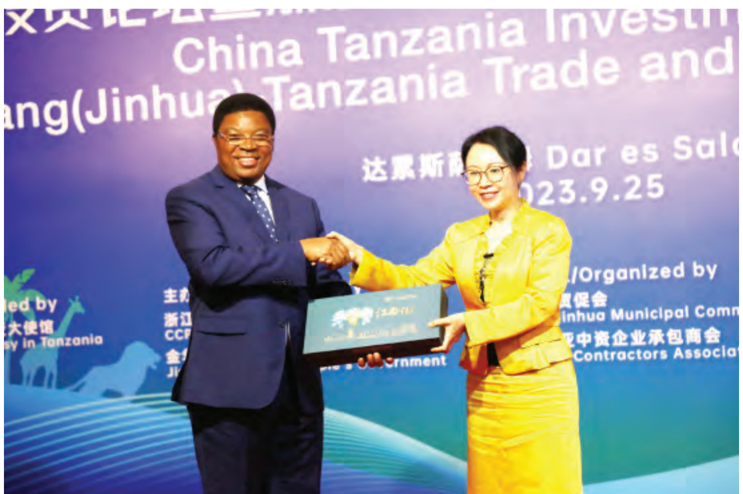
In September 2023, the China-Tanzania Investment Forum was successfully held. Tanzanian Prime Minister H.E. Kassim Majaliwa and Chinese Ambassador to Tanzania Chen Mingjian attended the event.