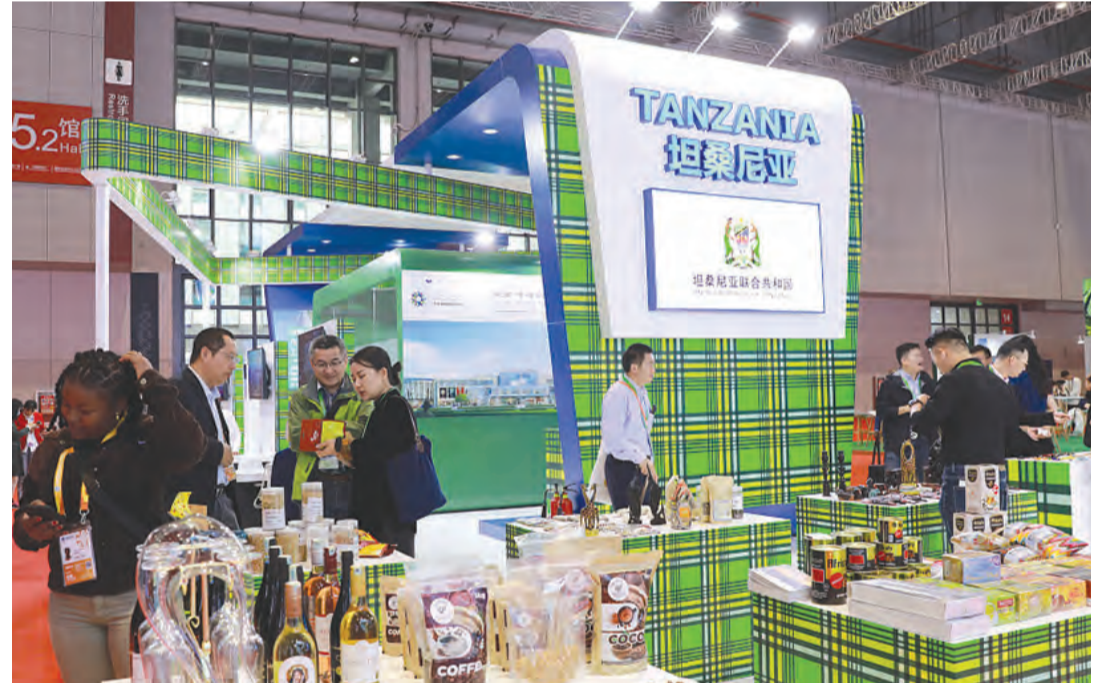
The Sixth China International Import Expo was held in Shanghai, China, from Nov. 5 to 10. The photo shows that Tanzanian products were on display at the Expo.