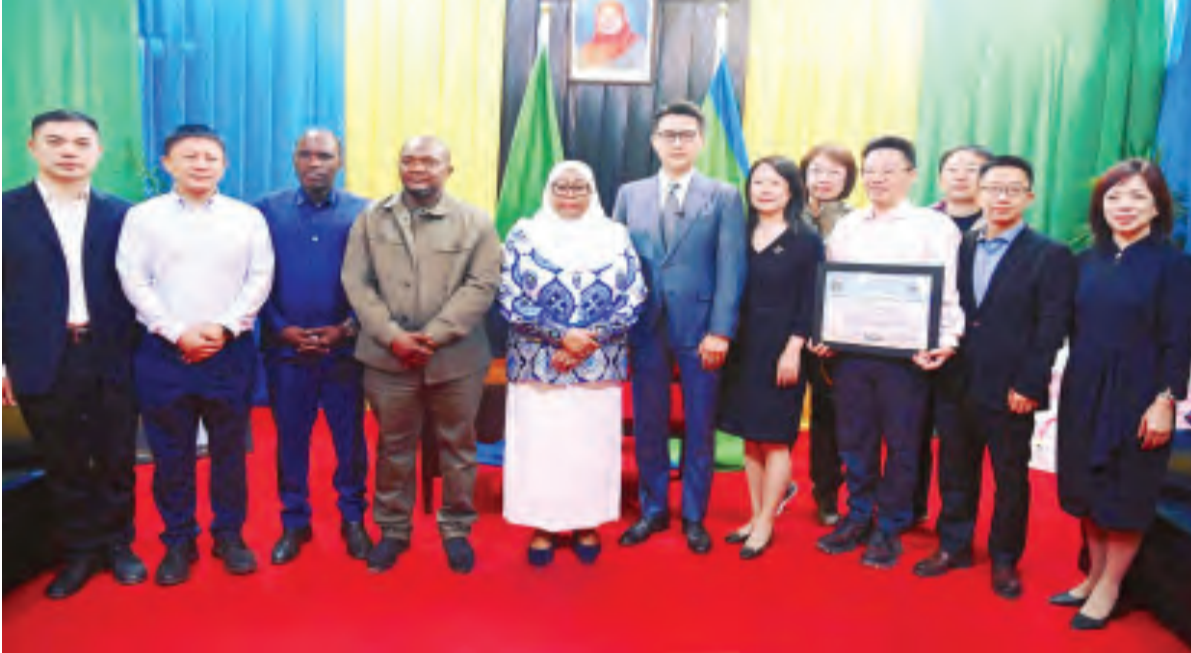
The year 2023 marks the 60th anniversary of China dispatching medical teams abroad and the 10th anniversary of the Belt and Road initiative. H.E. President Samia Suluhu Hassan presents the crew of TV drama, Welcome to Milele, the Special Contribution to Promoting Chinese-Tanzanian Friendship Award.