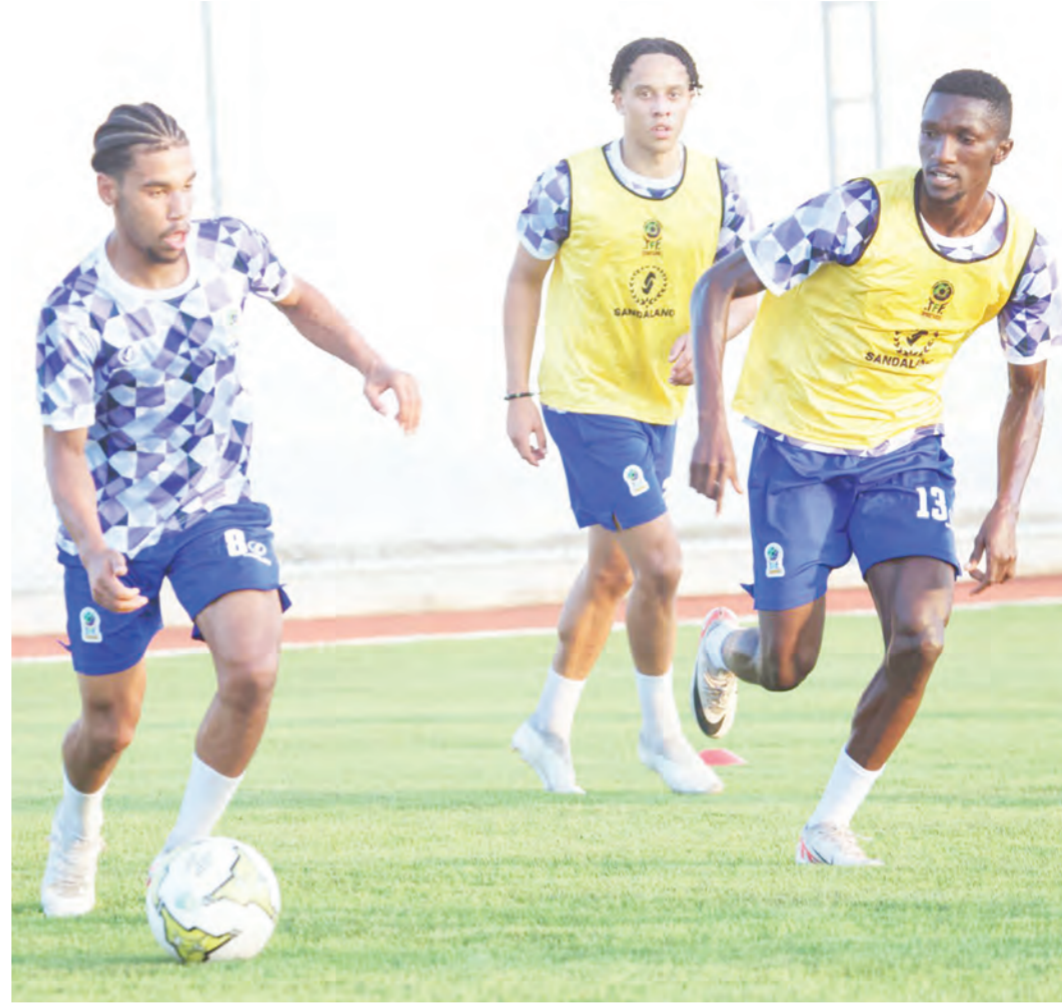
Some of Tanzania's senior national soccer team players are pictured participating in intensive training at New Amaan Complex in Zanzibar recently, shaping up for the 2023 AFCON campaign slated for this month in Ivory Coast.

the African Cup of Nations competition although The Guardian understands the Belgo-Algerian tactician already has his ideal squad.