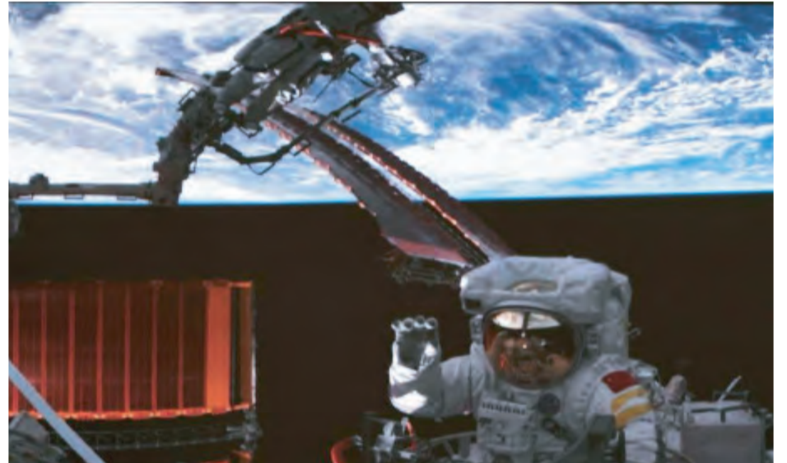
This screen image captured at Beijing Aerospace Control Center on July 20, 2023 shows Shenzhou-16 astronaut Zhu Yangzhu waving after exiting the Wentian lab module.