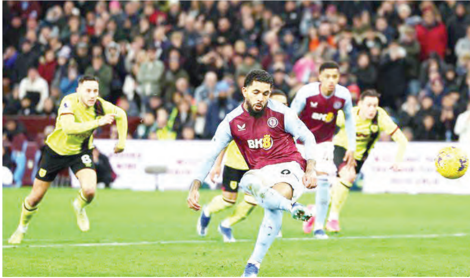
Aston Villa's Douglas Luiz keeps his cool to slot home a late penalty and secure the win against Burnley on Saturday (Dec 30).