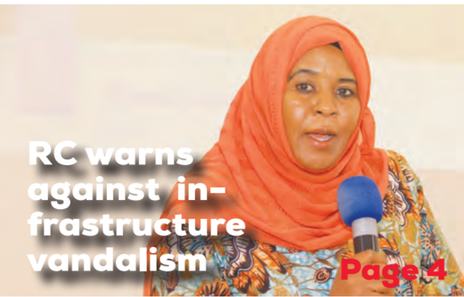
RC warns against infrastructure vandalism