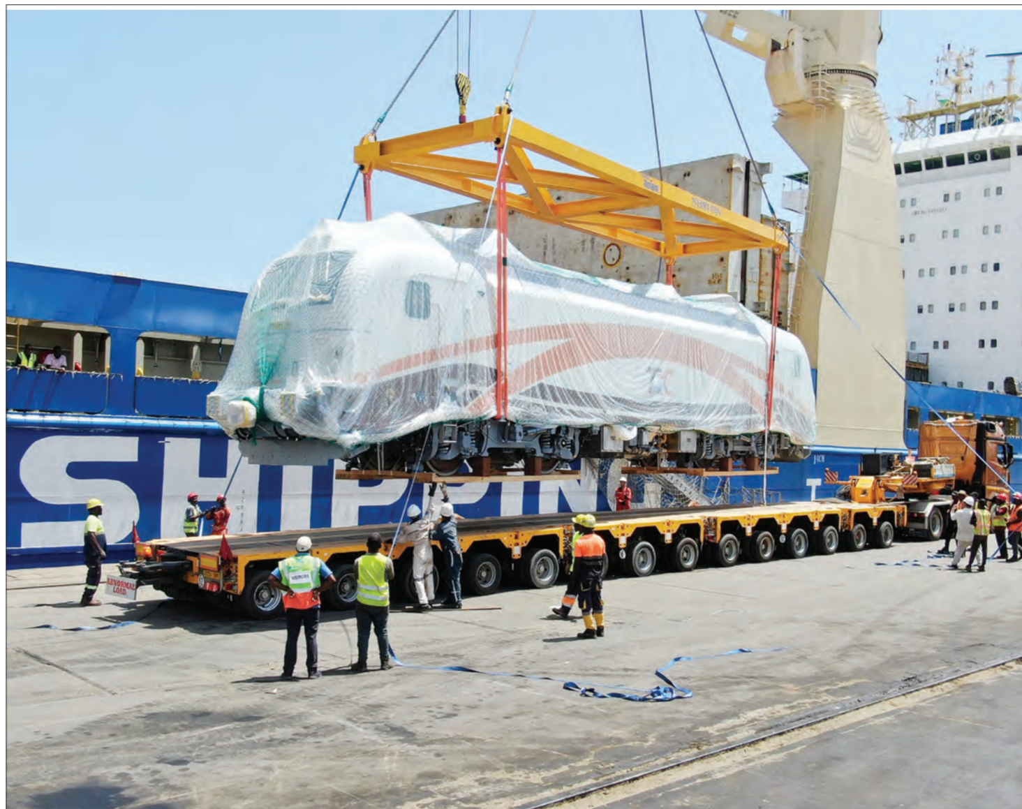
One of three just-arrived Standard Gauge Railway (SGR) electric locomotives assembled in South Korea for the Tanzania Railways Corporation is offloaded at the Dar es Salaam Port at the weekend.

This is driven by demand from its burgeoning health-conscious middle-class, making the butter fruit in China's imported fruit market, she added