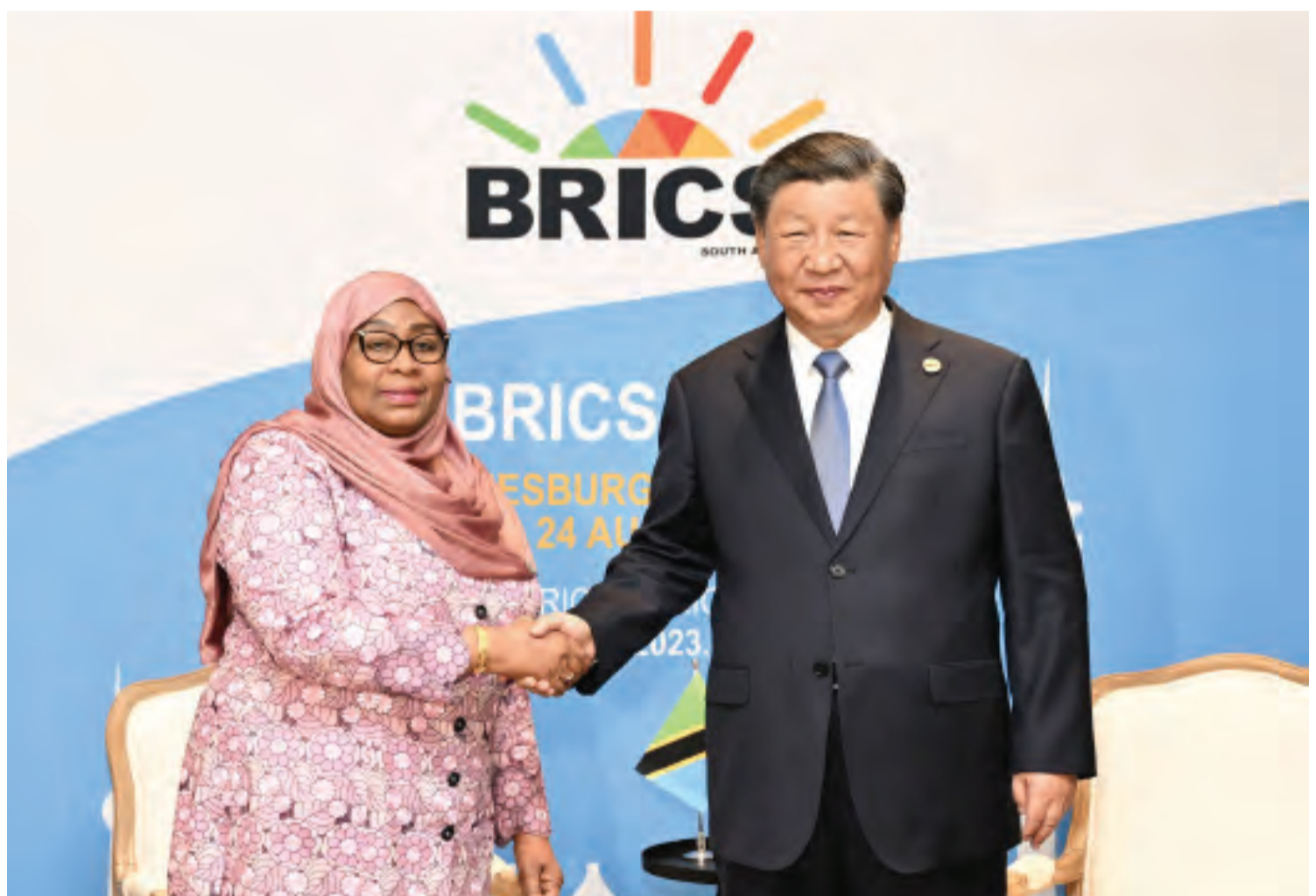
Chinese President Xi Jinping meets with Tanzanian President Samia Suluhu Hassan on the sidelines of the 15th BRICS Summit, Johannesburg, South Africa, August 24, 2023.