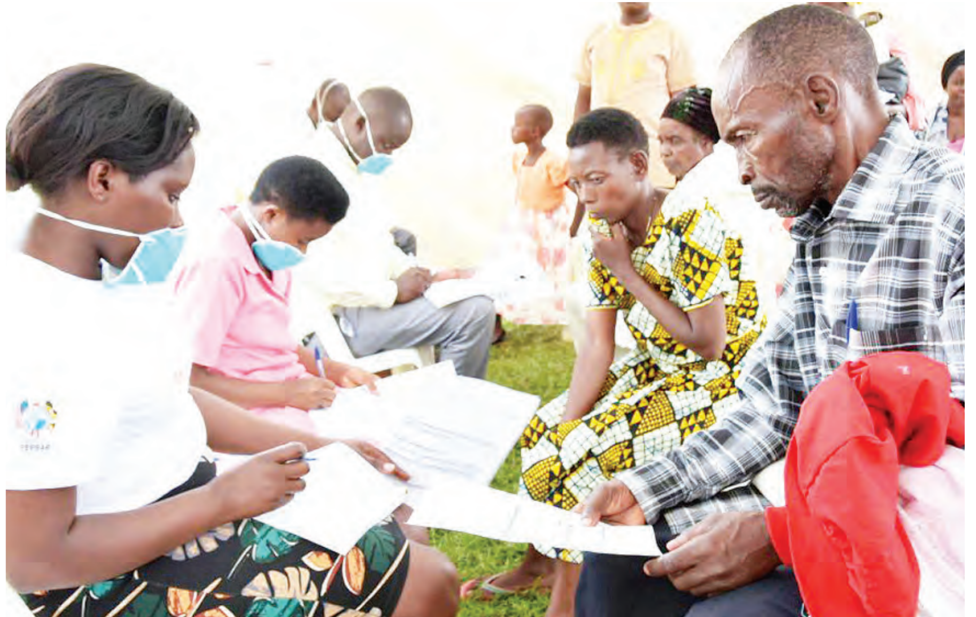
Health workers receive members of the public for TB screening in Ntungamo, Uganda, during commemoration of World Tuberculosis Day.