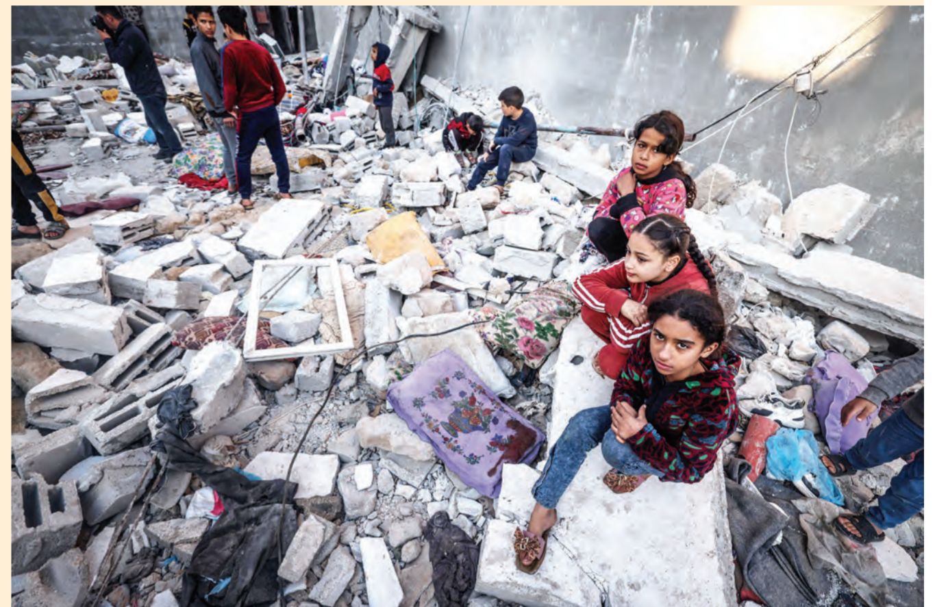
People inspect the damage following Israeli bombardment in Rafah on the southern Gaza Strip on Dec 29, 2023, amid the ongoing battles between Israel and Hamas.

In response to these concerning developments, he urged all parties involved to exercise maximum restraint and take ur-