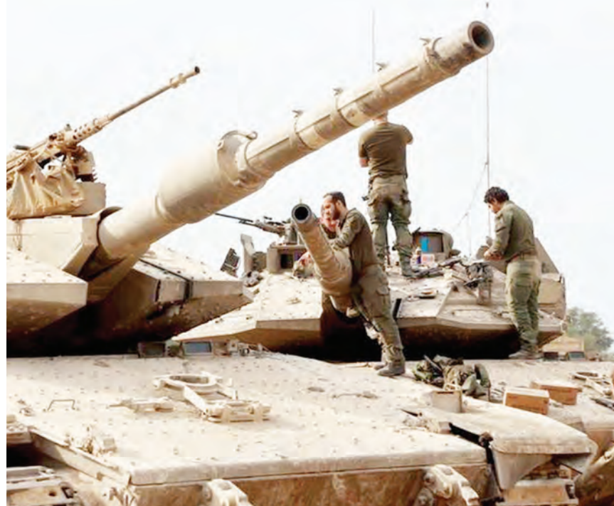
Israeli armed forces and tanks are seen in Israel's border with Gaza on Thursday.

According to statistics, more than 3,200 professionals from Hong Kong and Macao are currently working in the GBA mainland cities in various sectors such as law, healthcare, and urban planning, and over 3,500