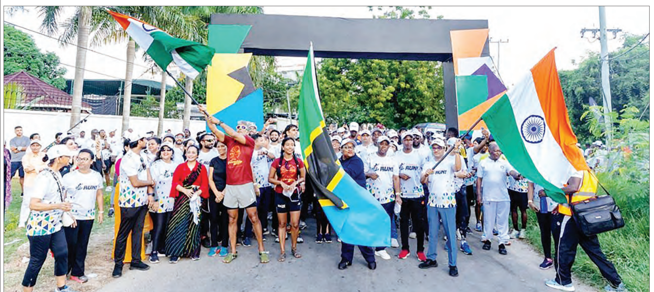
Constitutional and Legal Affairs minister Dr Pindi Chana (C, holding Tanzania's national flag), India's High Commissioner to Tanzania, Binaya Srikanta Pradhan (R, waving India's national flag), and visiting Indian Fitness icon Milind Soman (L, in maroon T-shirt, also waving flag) grace the flagging off of the India-Tanzania Friendship Run in Dar es Salaam on Saturday. The 120-km race - from Dar es Salaam to Bagamoyo and back - was expected to draw 4,000 participants and climax yesterday, with Culture, Arts and Sports minister Dr Damas Ndumbaro and the Indian High Commissioner as chief guests.