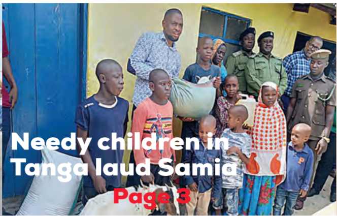
Needy children in Tanga laud Samia