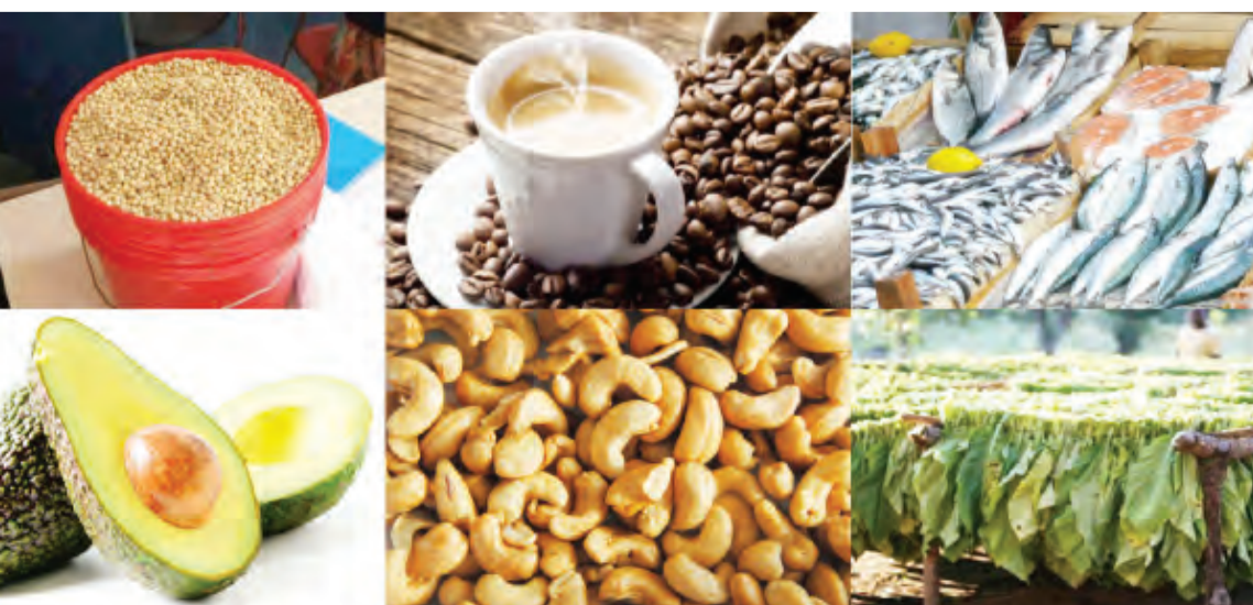
More and more Tanzanian products are exported to China. From January to November 2023, the trade volume between China and Tanzania was US$7.958 billion, a year-on-year increase of 6.8%.