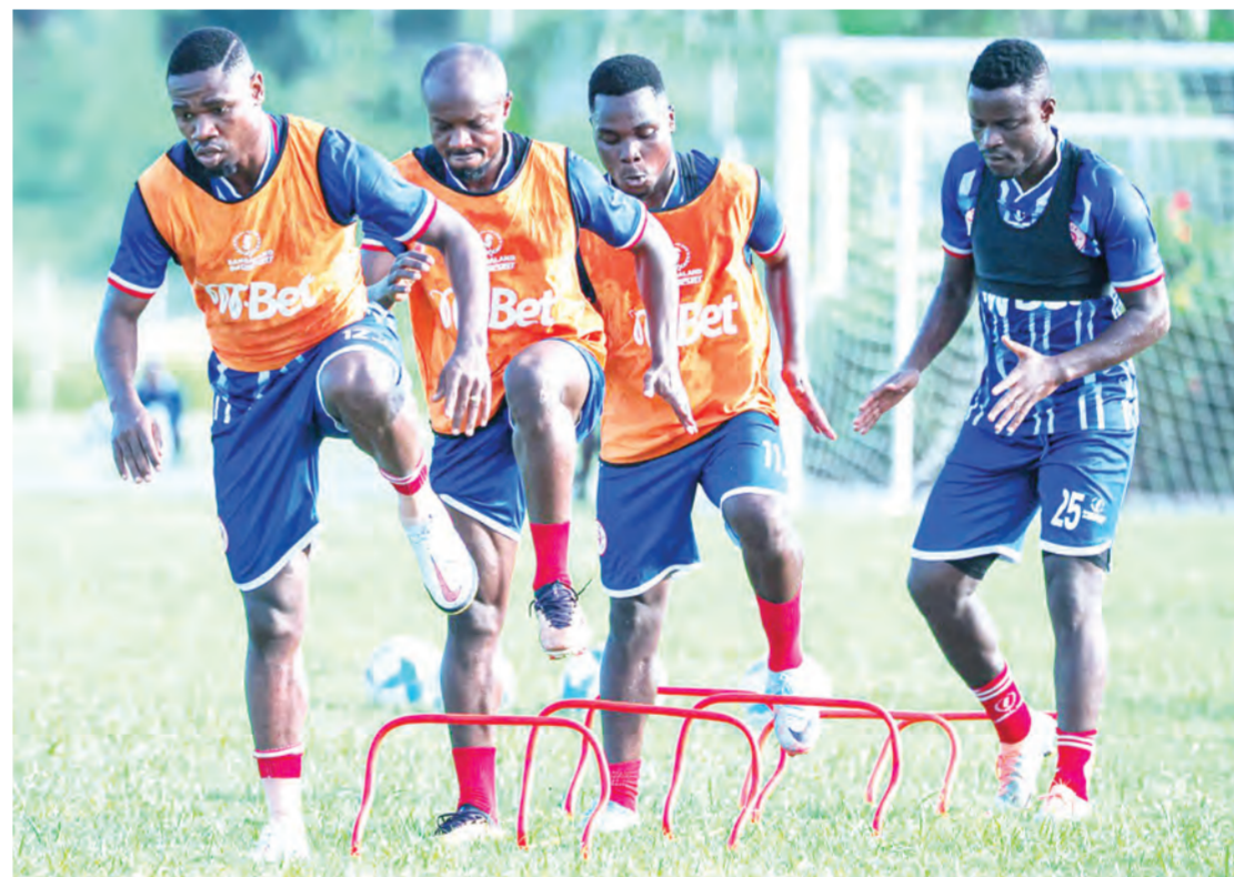
Simba SC players are pictured participating in training at Mo Simba Arena, Bunju in Dar es Salaam recently in preparation for various tournaments including the 2024 Mapinduzi Cup and the 2023/24 NBC Premier League.

The official noted: "The New Amaan Complex has undergone a remarkable transforma-