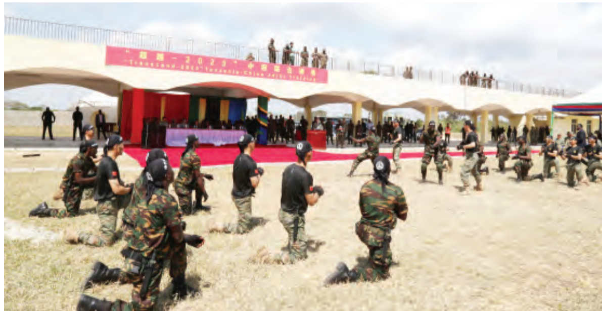
Chinese and Tanzanian Marine Corps held "Transcend-2023" Joint Training in September. This pictures shows the closing ceremony held on 17 September., 2023.