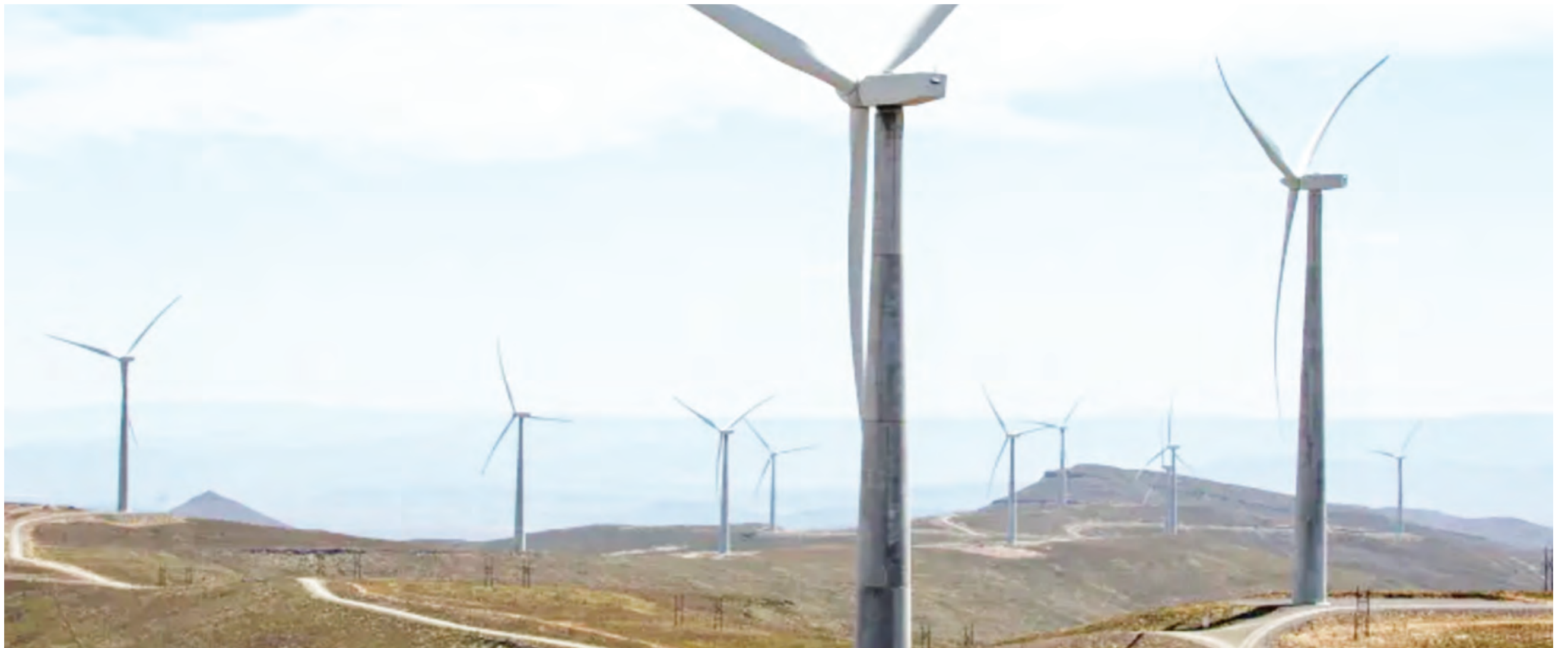
A wind farm on the Western Cape and Northern Cape border near Matjiesfontein