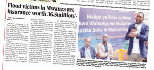
Flood victims in Mwanza get insurance worth 36.5million