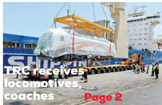
TRC receives locomotives, coaches

ISSN 0856 - 5434 ISSUE No. 9048 • PRICE: Tsh 1,000, Kenya sh100 TANZANIA MONDAY 1 JANUARY, 2024