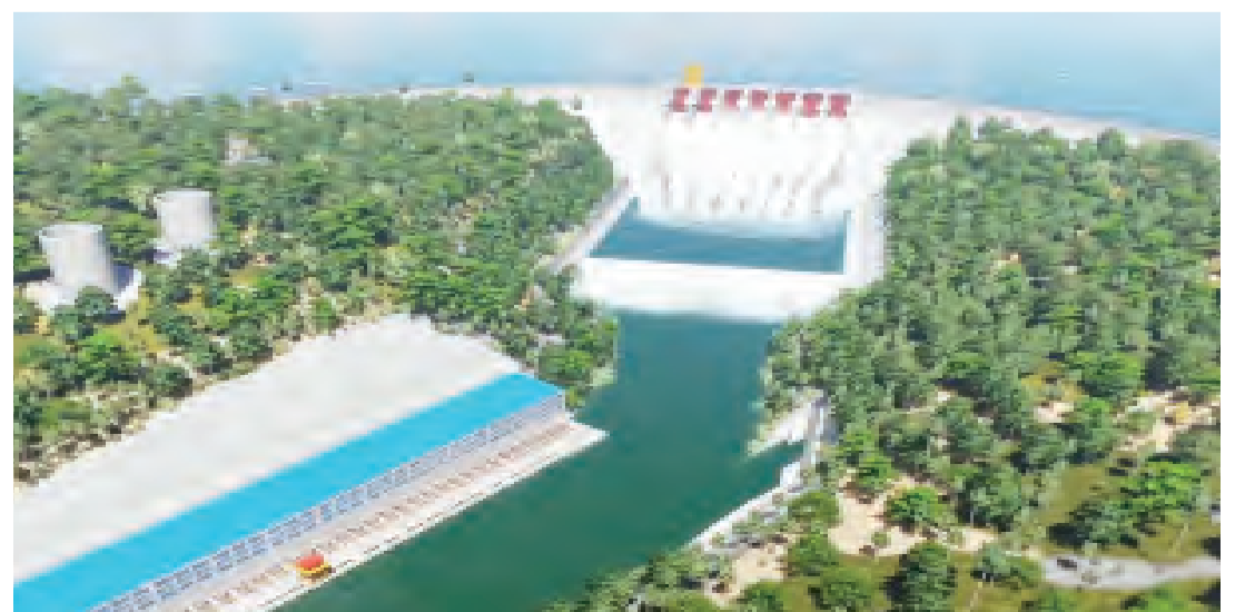
The 2115 MW Julius Nyerere Hydropower Plant, being implemented by Sinohydro, is expected to start generation in 2024.