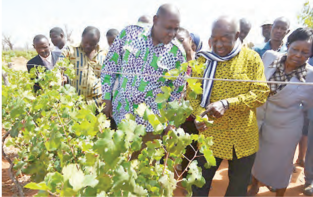
Former Prime Minister, John Malecela inspects grapes at the Dodoma-based Chinangali II grape farm.

"Tanzania, especially Dodoma, has been endowed with a most favourable climate for the cultivation of grapes more than any part in the world but it is unfortunate that the country has yet to tap and benefit from the rarely found prestigious