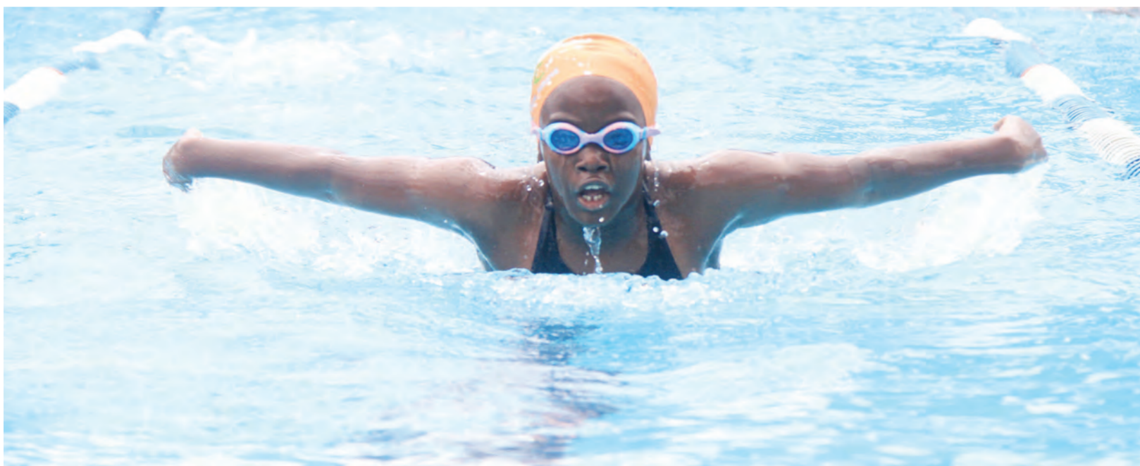
Dar es Salaam junior swimmer showcases her virtuosity at a training held at the Dar es Salaam Gymkhana Club (DGC) swimming pool recently.