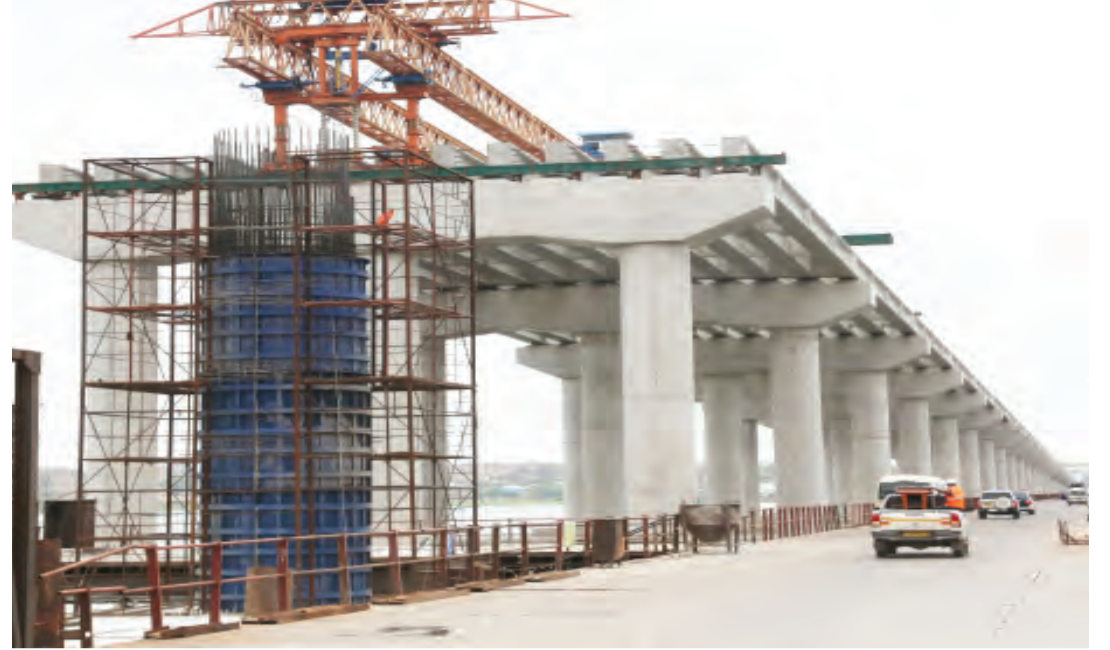
The construction of the Kigongo-Busisi Bridge, also known as J.P. Magufuli Bridge, is undertaken by two Chinese companies, CCECC and China Railway 15th Bureau Group. The photo taken on Sept. 9, 2023 shows the project is in good progress.