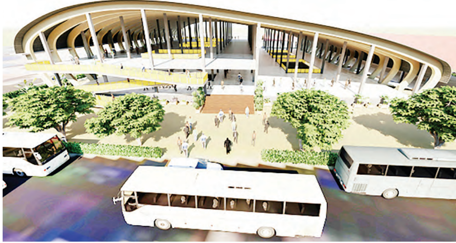
An artist's impression of the planned Ilala market in Dar es Salaam (front view).

In Tanzanian context, the government is striving under the project called Tanzania Cities Transforming Infrastructure and Competitive Services (TACTICS) that aims to strengthen urban management performance and deliver improved basic infrastructure and services in targeted areas.