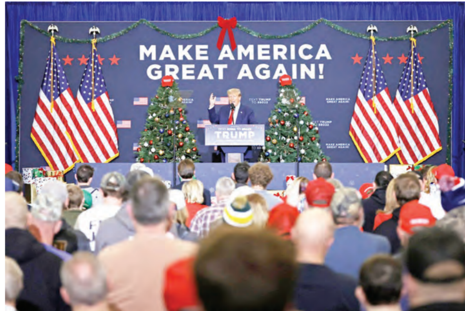
Former US president Donald Trump speaks during a campaign event in Waterloo, Iowa, on Dec 19, 2023.

Trump's legal team also disputes that he engaged in insurrection, arguing that Trump was exercising his First Amendment right to free speech on Jan 6.