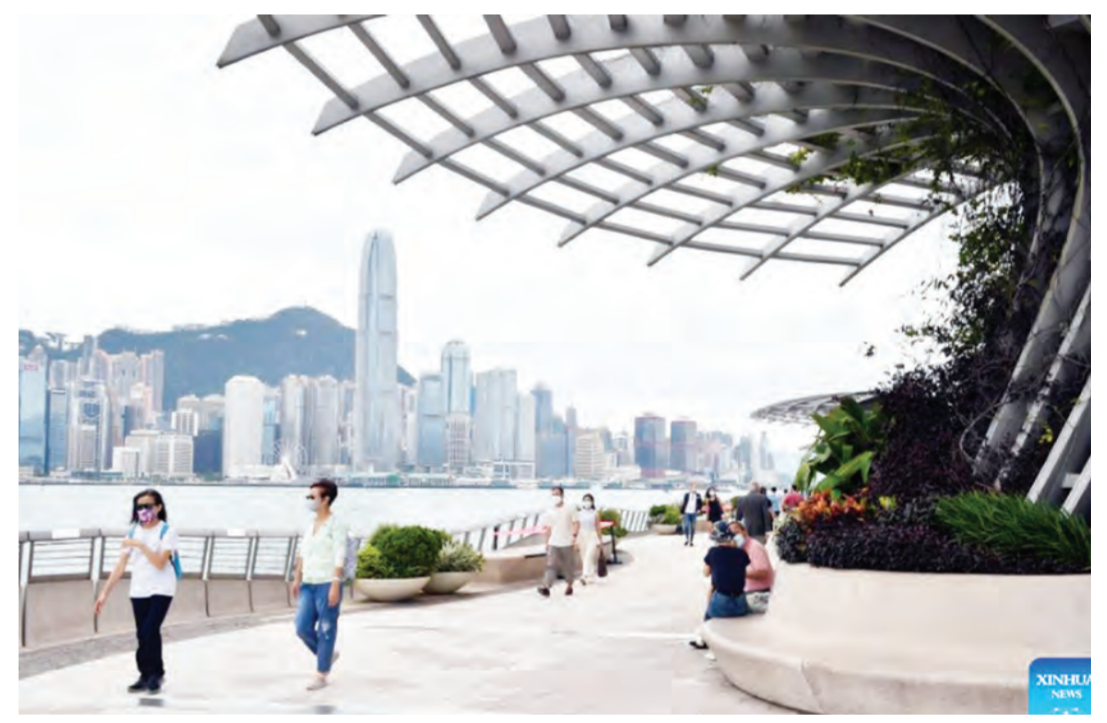
People visit the Avenue of Stars by the Victoria Harbor in Hong Kong, south China, May 18, 2022. This year marks the 25th anniversary of Hong Kong's return to the motherland.