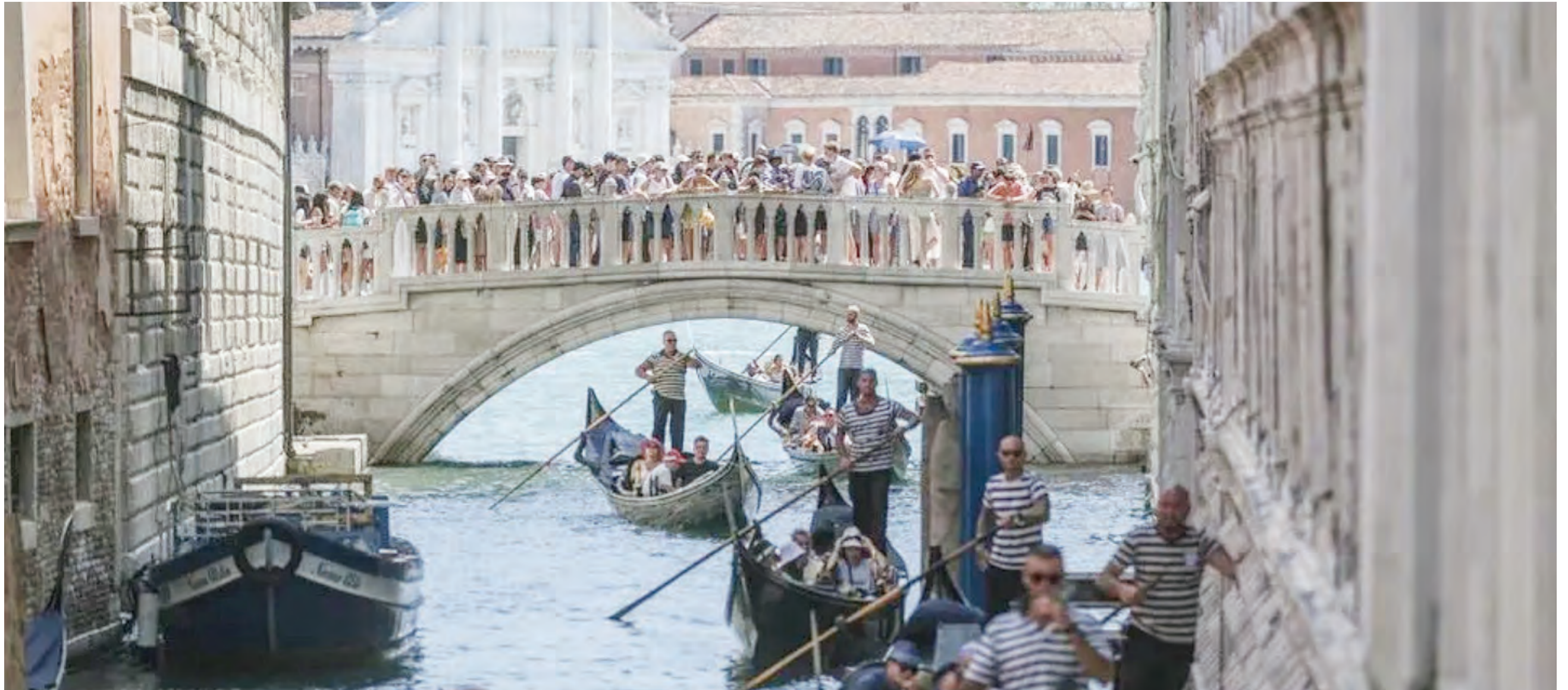
The historical city hosted some 13 million tourists in 2019, before the Covid pandemic