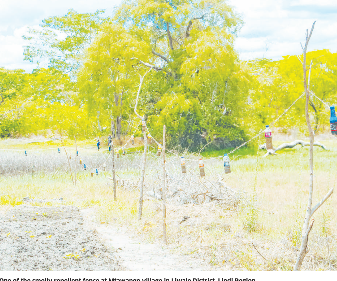
One of the smelly repellent fence at Mtawango village in Liwale District, Lindi Region.

"We have successfully trained villagers on alternative methods for resolving HWC. In Liwale, we have trained over 1,000 villagers on how to make smelly repellent which is used to scare away elephants," she