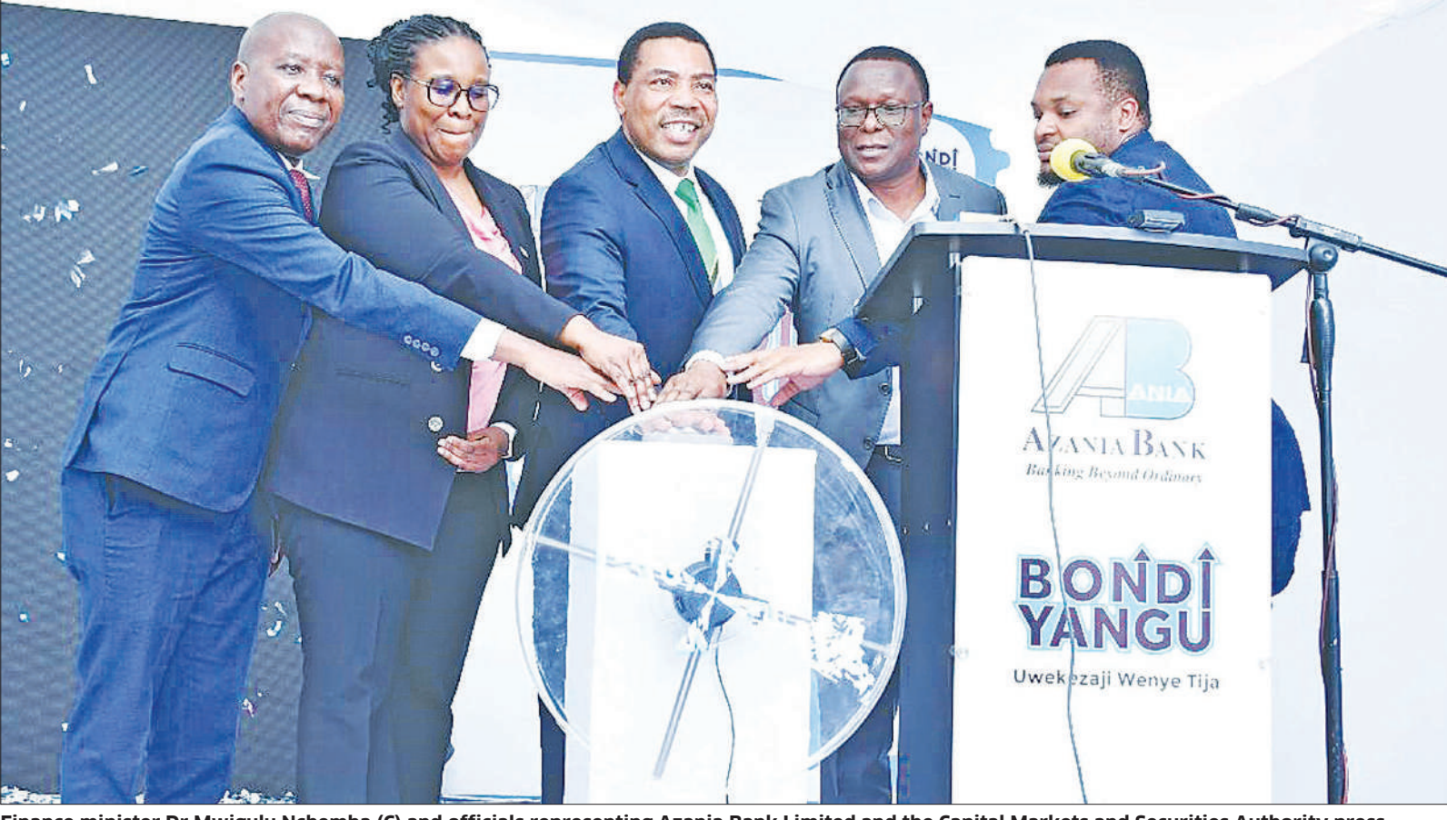
Finance minister Dr Mwigulu Nchemba (C) and officials representing Azania Bank Limited and the Capital Markets and Securities Authority press a button in Dodoma city yesterday to signal the launch of a 30bn/- medium-term note programme bond issued by the bank. Photo

"There are many families living in the buildings. Evicting them for investment purposes is a serious matter that should not be taken lightly. An impulsive decision could damage the social fabric"