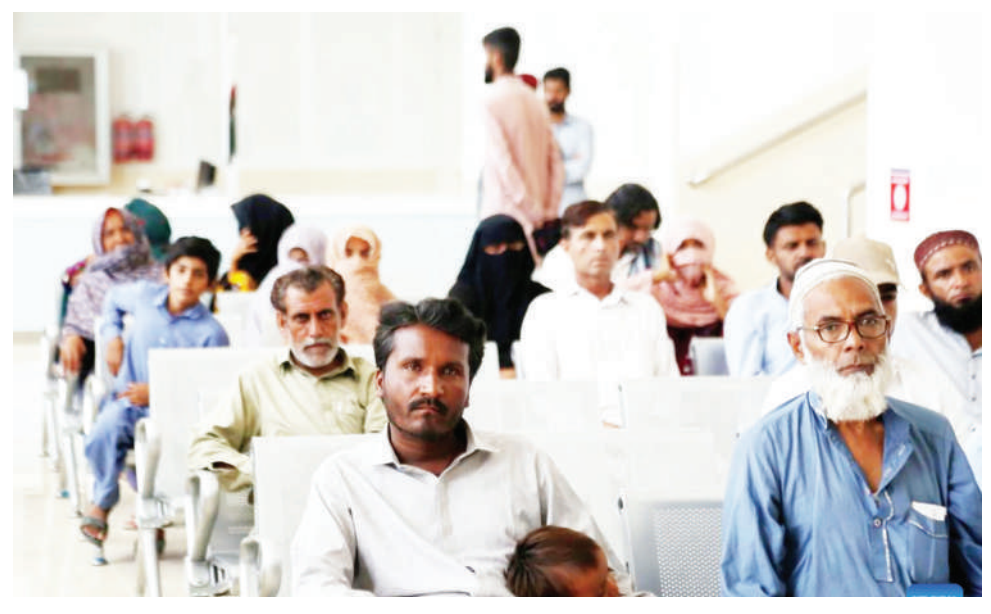
Patients wait for their turns at the Pak-China Friendship Hospital in the Gwadar district of Pakistan's southwestern Balochistan province on Sept. 16, 2024.