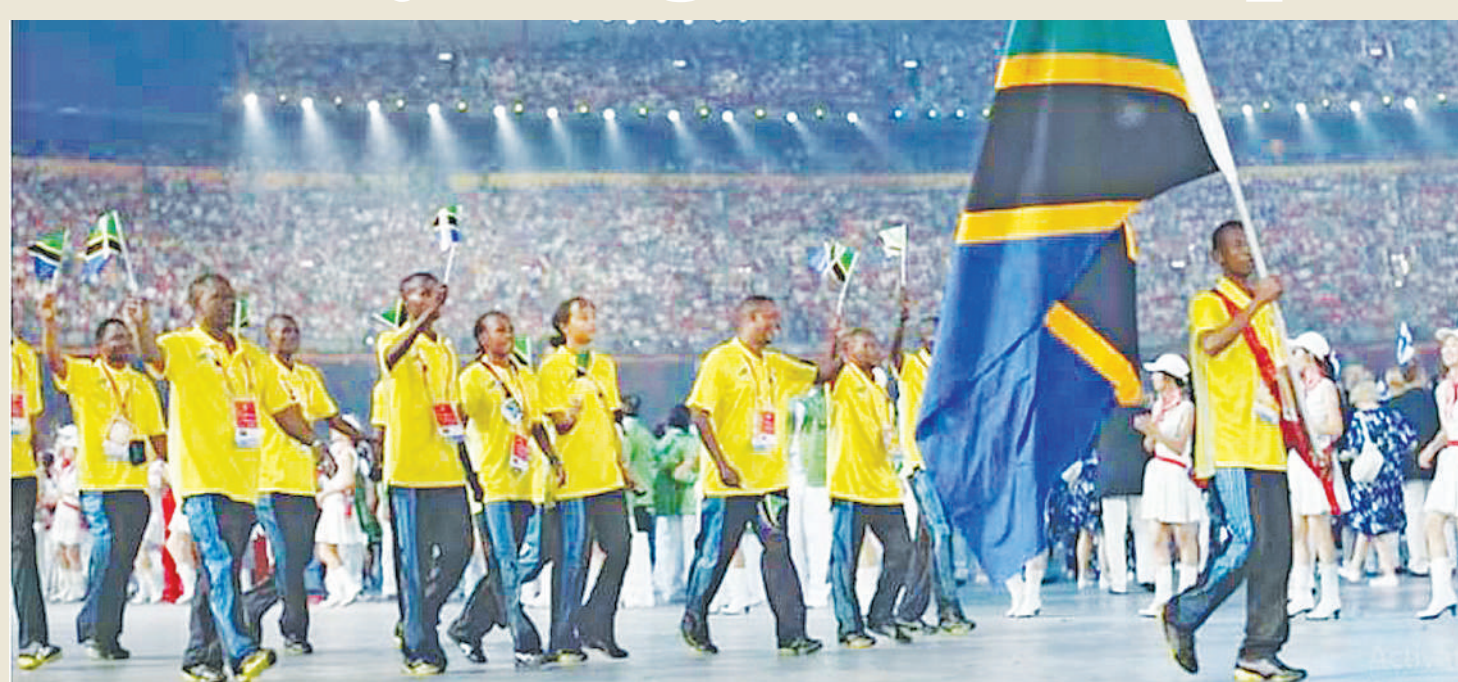
Tanzania representatives during the Paris 2024 Olympic.