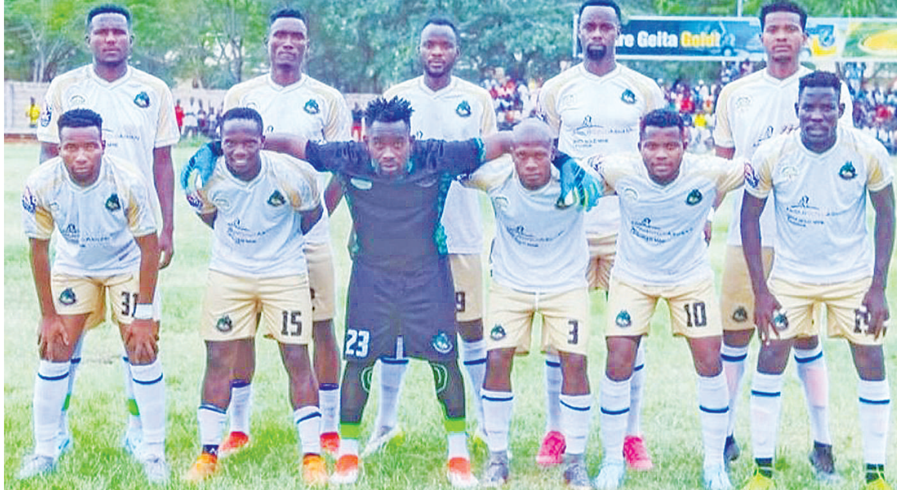
Geita Gold FC squad.

the division with ten goals in total (1.4 goals per game).