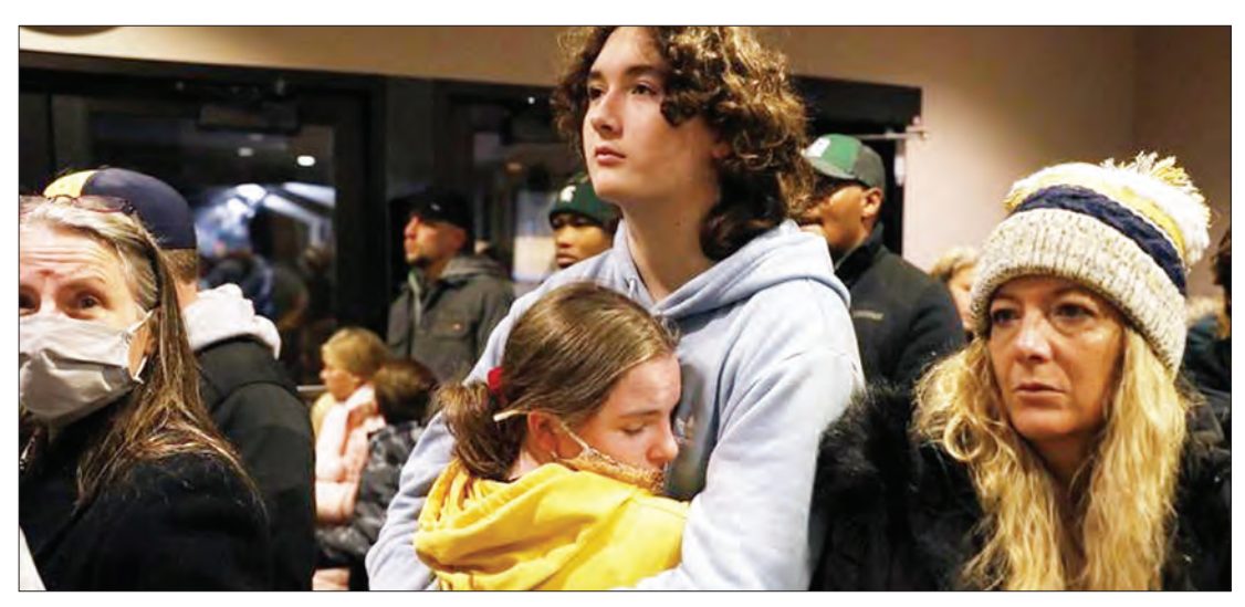
People hug during a vigil after a shooting at Oxford High School at Lake Pointe Community Church in Lake Orion, Michigan on Tuesday.

ing the violence remained unclear, but police believe the boy carried the weapon into the school in a backpack, the sheriff said.