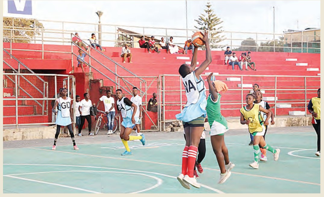
Netballers feature in one of the sports tournaments which were organized to vouch for the prevention and control of non-communicable diseases in Arusha.

"So far South Africa, Malawi and Uganda are three Africa topranked netball teams which will compete in the Commonwealth