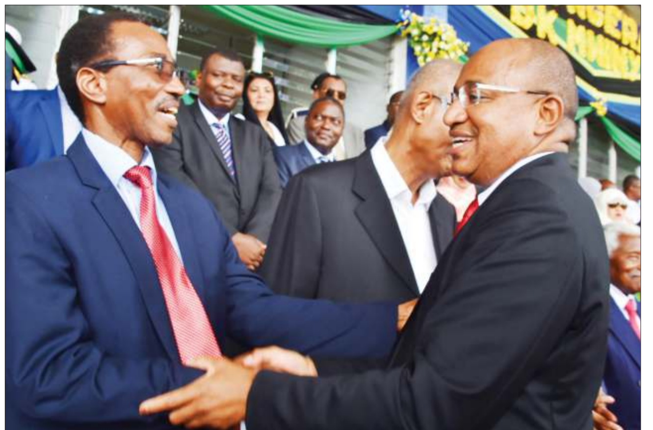
The newly installed Zanzibar President exchanges greetings with former Zanzibar Chief Minister Shamsi Vuai Nahodha.