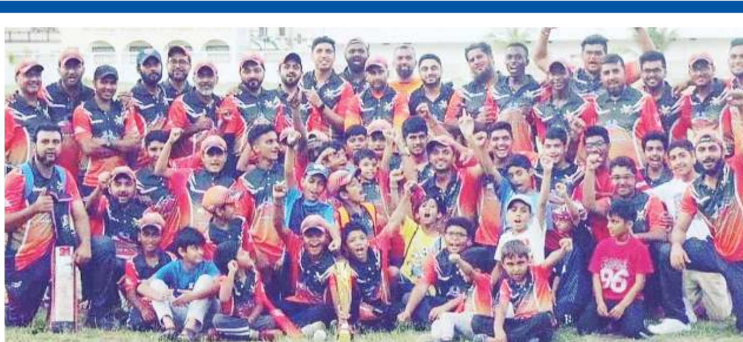
Lions Cricket Club's players in group picture with their families shortly after completion of the 2020 Kazim Nasser Memorial League (KNML)'s Division B final against Patel Brotherhood outfit, which took place in Dar es Salaam last weekend. Lions Cricket Club notched one-wicket victory over Patel Brotherhood to win the silverware.