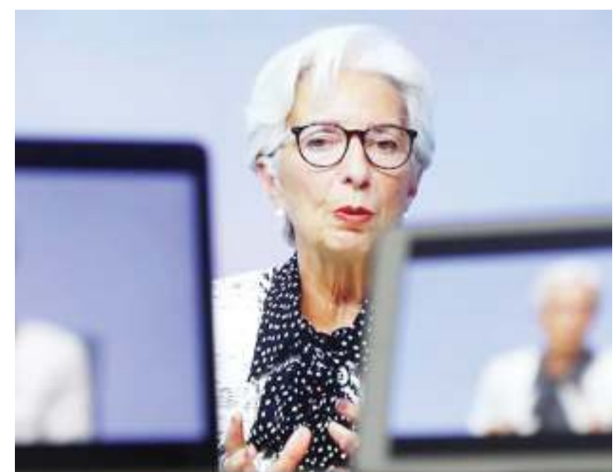
Christine Lagarde during a live stream video of the central bank's virtual rate decision news conference on October 29.