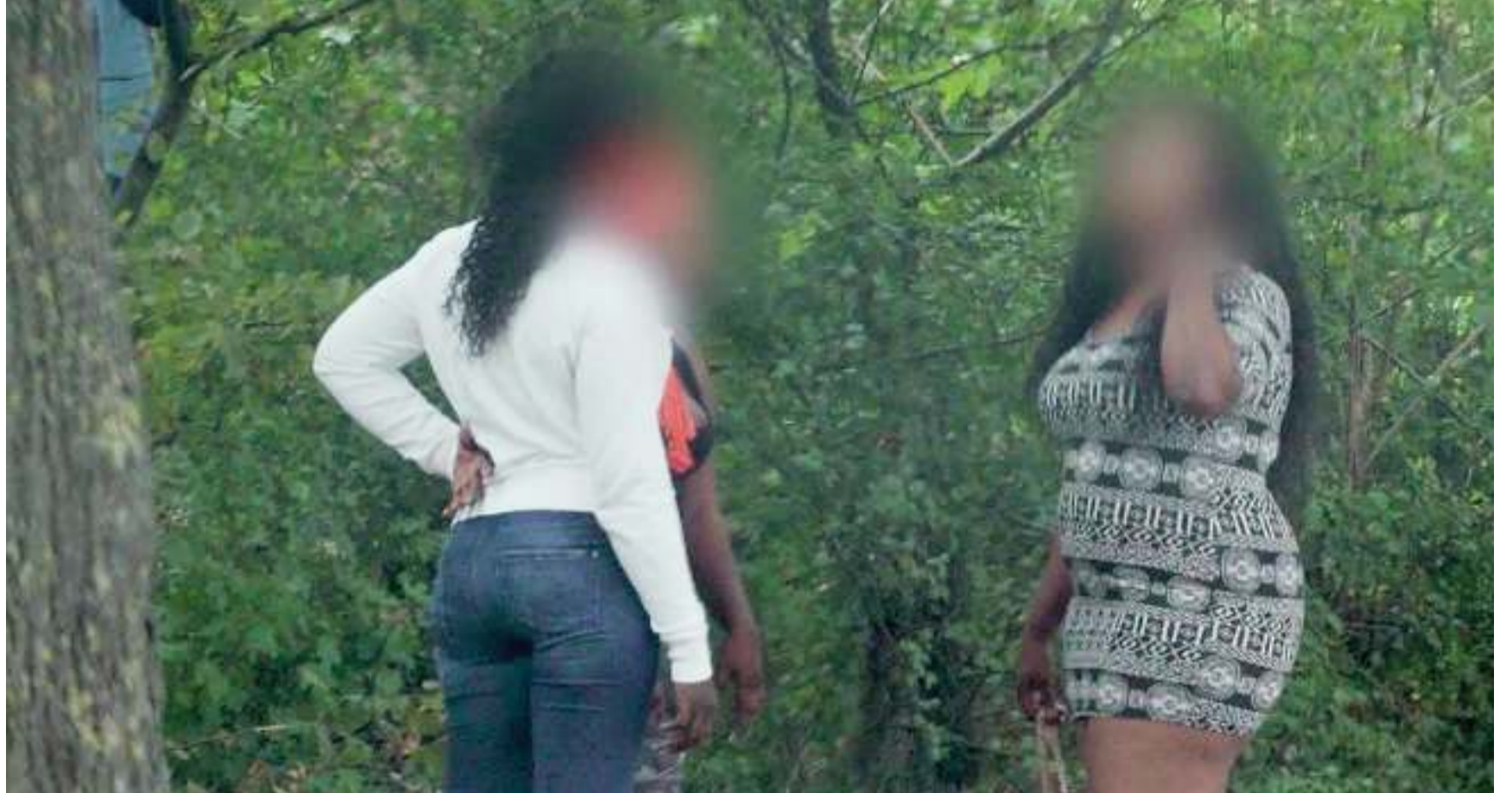
If girls are empowered with skills – self-respect and control, freedom of expression, morals and good manners they can't easily succumb to sexual business, drugs and alcoholism. FILE PHOTO.

By building up a culture of freedom of expression and discussions of vari-