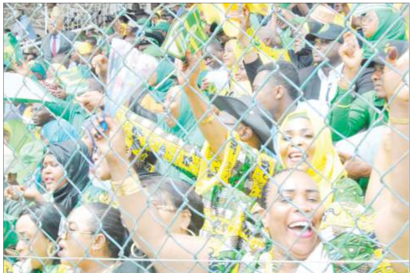
Zanzibar residents in jubilant mood at Dr Hussein Mwinyi's swearing-in ceremony.