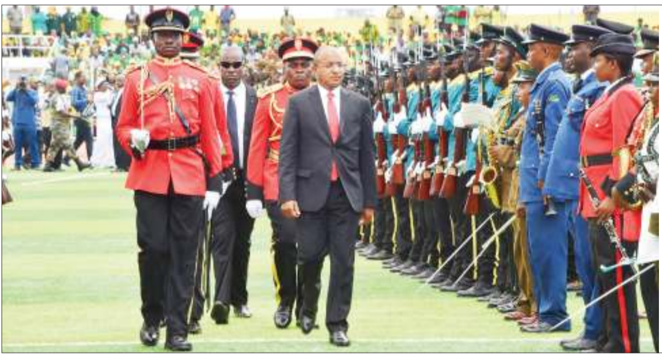
The newly installed Zanzibar President inspects a parade members of the armed forces mounted for him by at Amani Stadium.