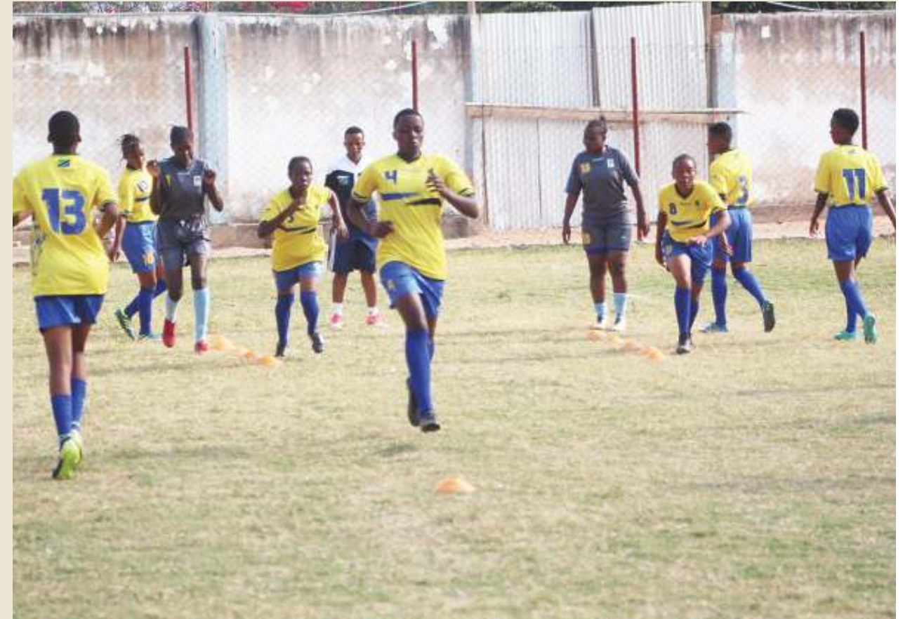
Tanzania's national women football team 'Twiga Stars' players participate in training in Dar es Salaam recently to prepare for this year's Council of Southern Africa Football Associations (COSAFA) Women's Championship, which takes place South Africa this week.

Still maintaining the thrust of this commentary, which is about the 'People's Game', it is now an opportune moment for us all to ponder on the Mother of all derbies to wit: the anticipated gladiatorial duel between Simba SC versus Yanga, which is