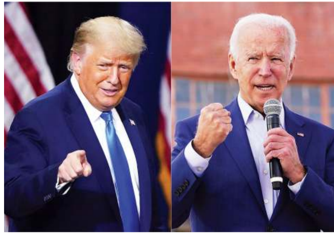
US President Donald Trump (L) and Democratic former Vice President Joe Biden

Hedge funds have been shaving off some risks, according to Oct. 21 research by Lyxor Asset Management, with U.S. long/short equity strategies "cautiously positioning" on a Demo-