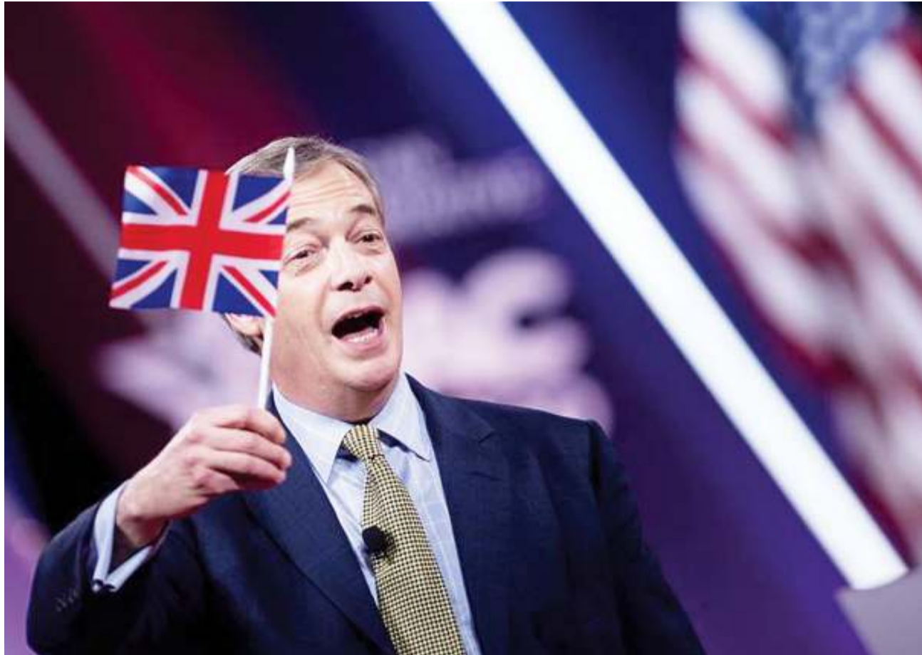
leader of the Brexit Party Nigel Farage

The perceived electoral threat to the Conservatives from the United Kingdom Independence Party which Farage formerly led was one of the main reasons then-prime minister David Cameron decided in 2013 to promote the Brexit referendum.