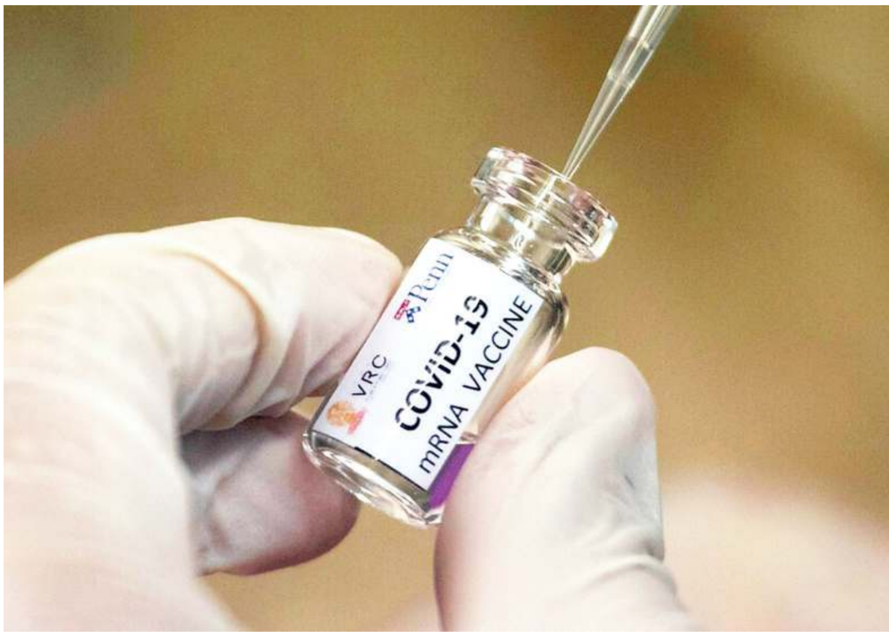
tion programme against COVID-19?

So what must be done to get on track for a successful African vaccina-