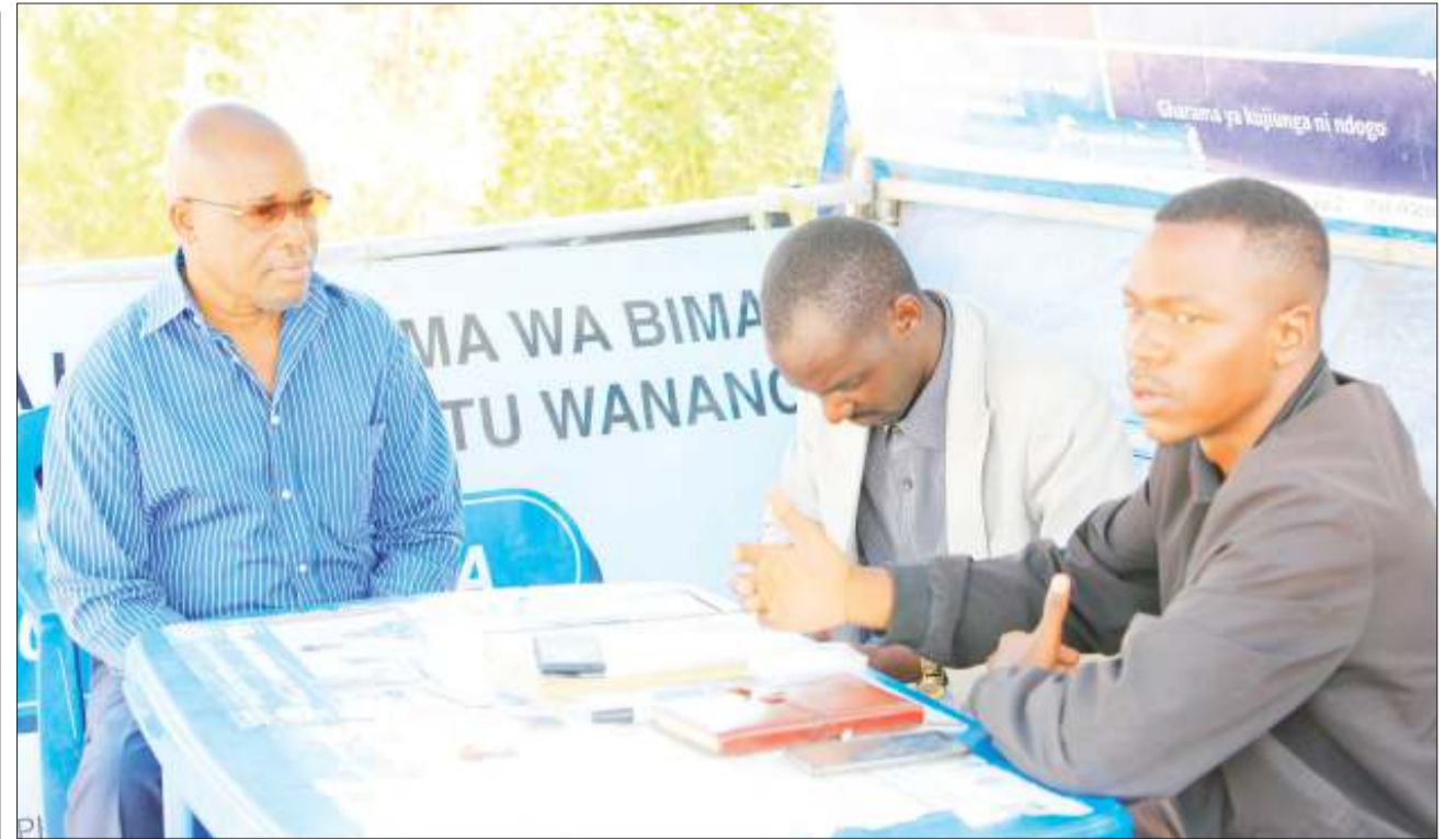
An official with the Community Health Insurance Fund (R) briefs visitors in Dodoma yesterday on the insurance scheme, which is meant to make healthcare more affordable and available to rural areas and the informal sector across Tanzania.

Due to volumes of calls, we are unable to respond to calls related to this Job advert, please raise all your enquiries via email addresses above.