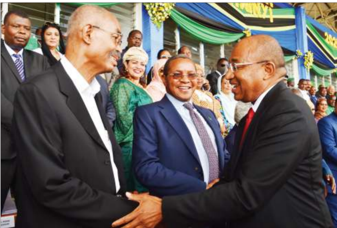
Former Zanzibar President Amani Abeid Karume congratulates President Dr Hussein Mwinyi, as former Tanzanian President Jakaya Kikwete looks on.