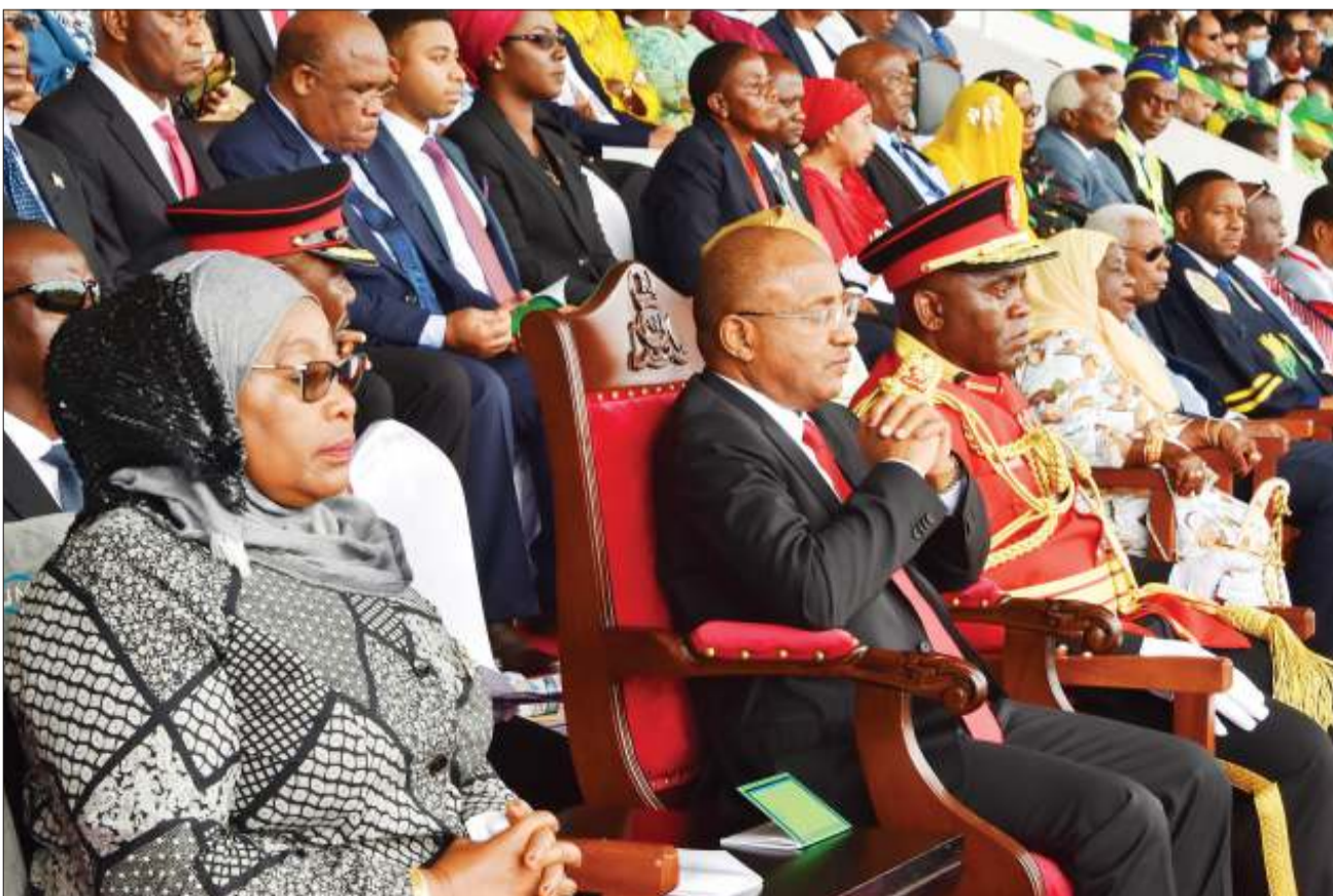
President Dr Hussein Mwinyi and Tanzanian Vice President-elect Samia Suluhu Hassan follow events at Amaan Stadium after the swearing-in ceremony.