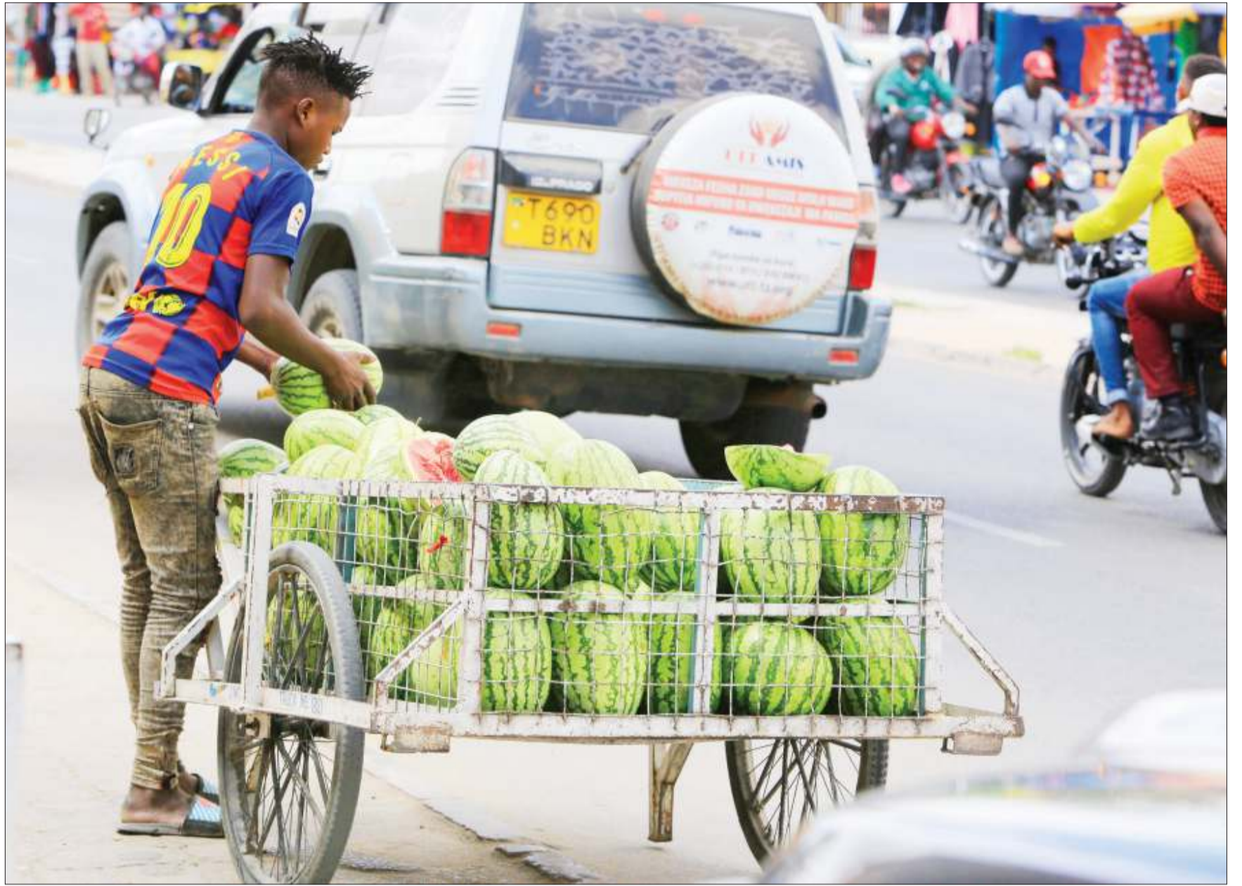
It's watermelons for sale in Dodoma city, coming in especially handy in quenching thirst during the current hot weather.