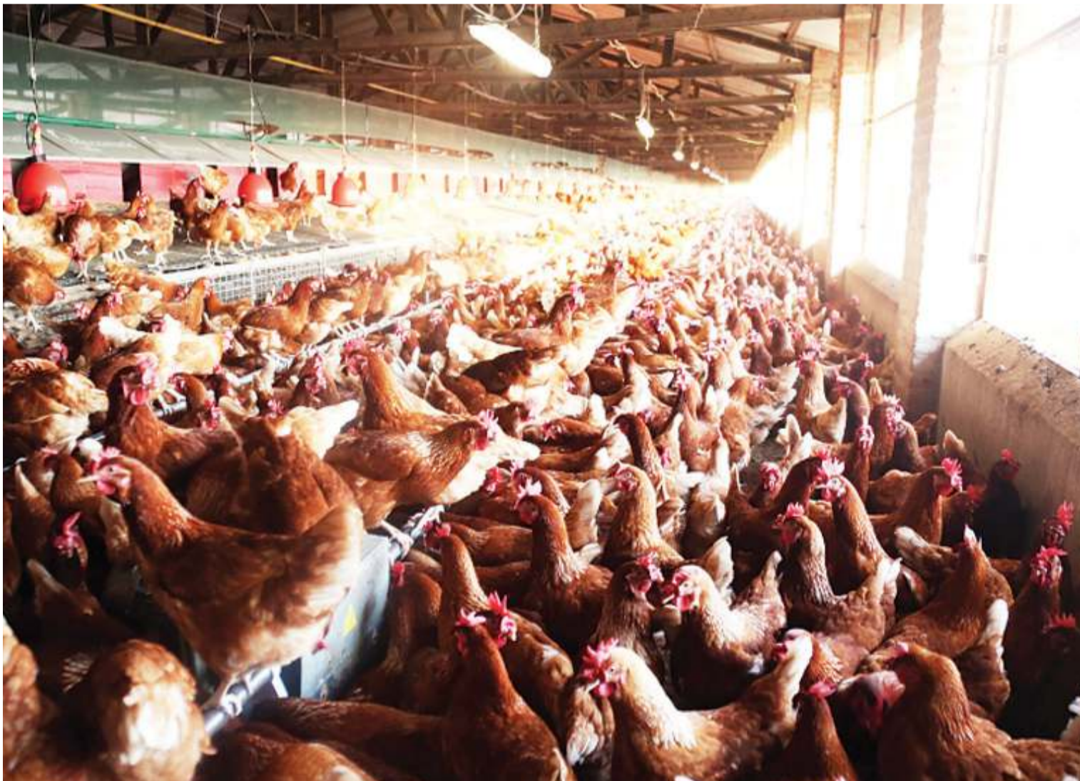
A poultry farm in Bugesera District.