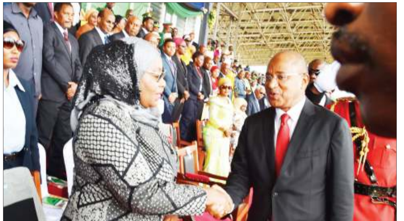
Vice President-elect Samia Suluhu Hassan congratulates the newly installed Zanzibar President.