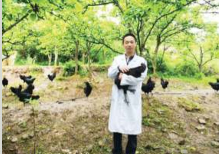
Photo shows free-range chickens raised by poor residents under a poverty alleviation project of JD.com.

These young people Wang mentioned are staff members of JD Fresh, the fresh food arm of JD.com.