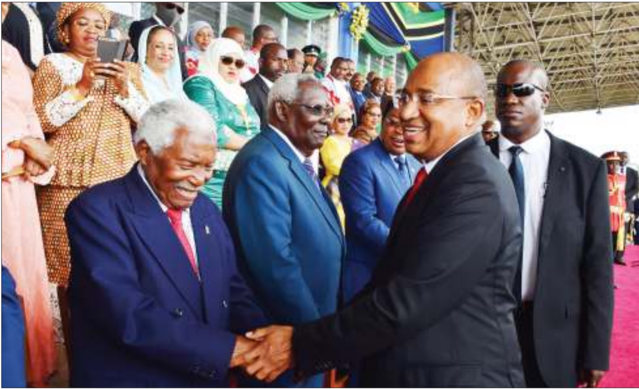
FATHER FETES SON: Former President Alhaj Ali Hassan Mwinyi congratulates Dr Hussein Mwinyi at Amaan Stadium in Zanzibar yesterday shortly after the son, until recently Tanzania's Defence and National Service minister, was sworn in as Zanzibar President