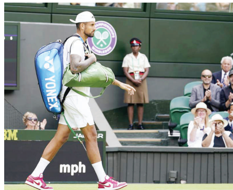
Australia's Nick Kyrgios walks on court wearing red shoes for his fourth round men's singles match against Brandon Nakashima of the United States on day eight of the Wimbledon tennis championships in London, Monday, July 4, 2022. After winning his match, Kyrgios traded in his all-white grass-court shoes for a red-and-white pair of sneakers, and replaced his white hat with a red one, before being interviewed on Centre Court. Big deal? Not to Kyrgios. To a reporter who peppered him with questions about it, though, sure seemed to be. That's because the All England Club has a rather strict policy about all-white attire while on match courts during the tournament -- something that some players think was better suited to the 1880s than the 2020s, while others appreciate as part of the charm of the oldest Grand Slam event in tennis.