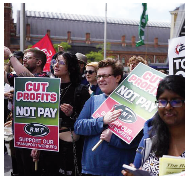
People hold placards as they attend a RMT union train strike rally outside King's Cross railway station, in London, June 25, 2022. File photo