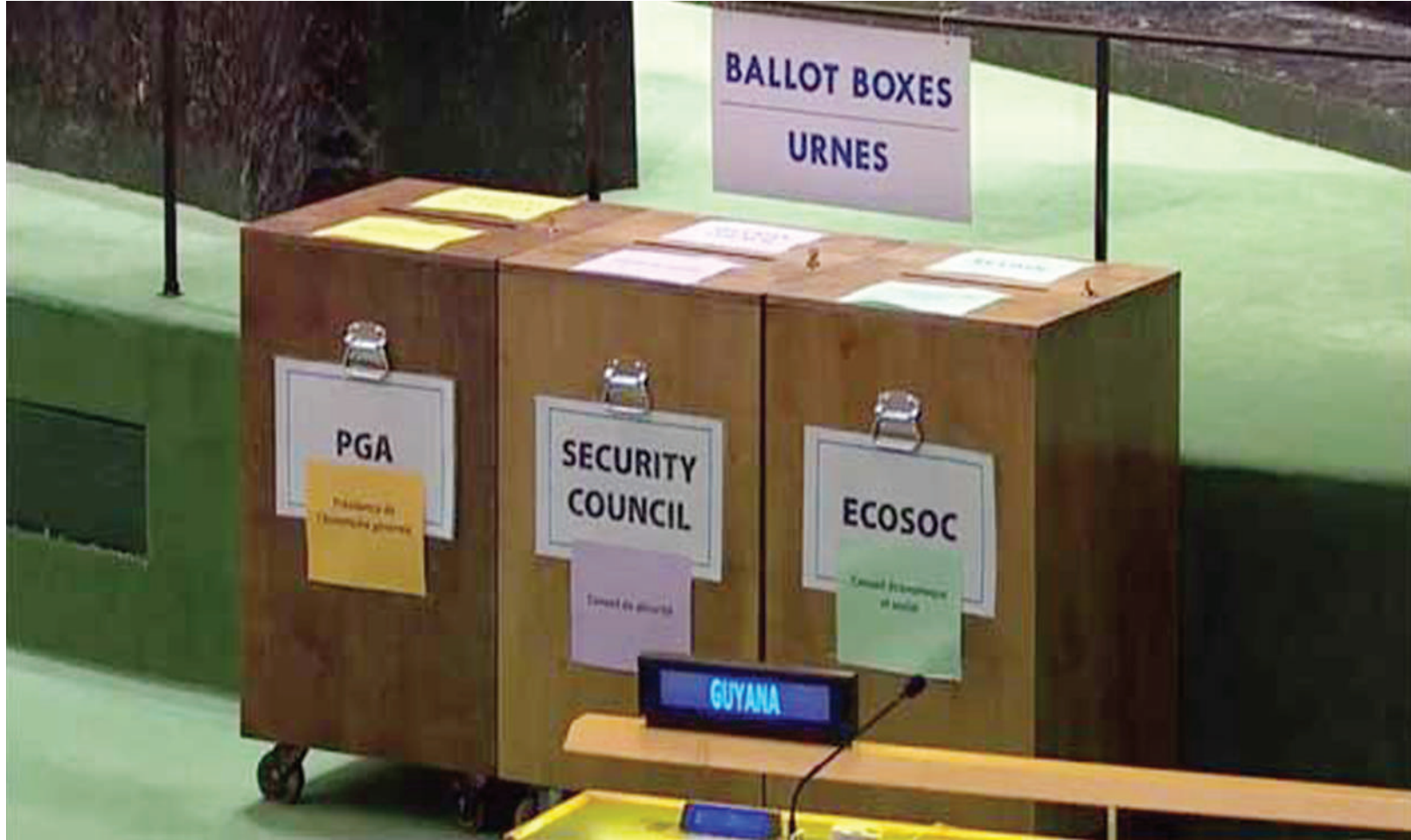
When the UN votes by secret ballot...

told IPS that PGAs are some of the strongest advocates of gender empowerment—while in office.