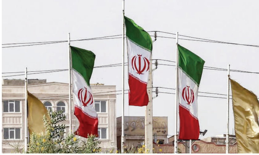
The flags of Iran flutter during a sandstorm in the south of the capital Tehran

For instance, the sanctions have prompted international healthcare companies, in fear of the US punitive mea-