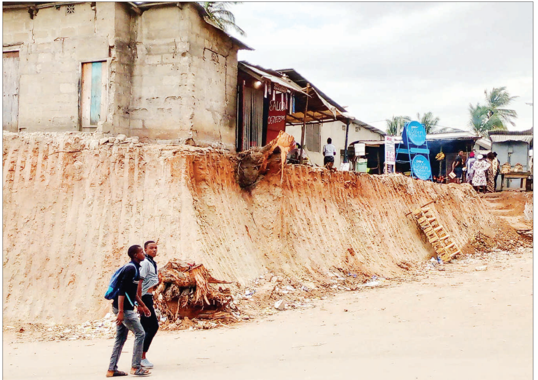
Houses risk collapse, with the soil making them steady, scooped away in the course of the on-going expansion of the Kimara-Korogwe stretch of Dar Salaam's Morogoro Road in Dar es Salaam as captured yesterday, as captured yesterday by Correspondent Sabato Kasika.

Kwala dry port project which costs about 80bn/- involves construction of a 15 kilometer road from Ruvu and the development of 5 hectare land, construction of a 1.3 kilometer railway part and a fence.