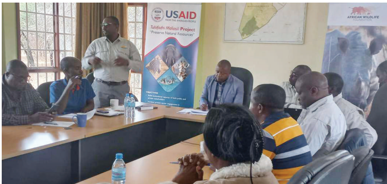
Stakeholders of the US Agency for International Development (USAID)-funded 'Tuhifadhi Maliasili' project in a group photo shortly after inaugurating the initiative on Tuesday at the African Wildlife Foundation (AWF) premises in Makuyuni Ward in a Monduli District, Arusha Region. The project is aimed at improving lives of people around the Manyara Ranch is being by the US agency at the tune of 229m/-.