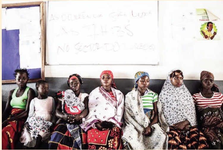
Mozambican women and expecting mothers await to receive medical care at the Murrupelane Maternity ward on July 5, 2018 in Nacala, Nampula province, Mozambique. The United Nations Population Fund is supporting Mozambique's effort and commitment to improve the reproductive health and general well being of its citizens.

"When nearly a third of all women in developing countries are becoming mothers during adolescence, it is clear the world is failing adolescent girls," said UNFPA Executive Director Natalia Kanem. "The repeat pregnancies we see