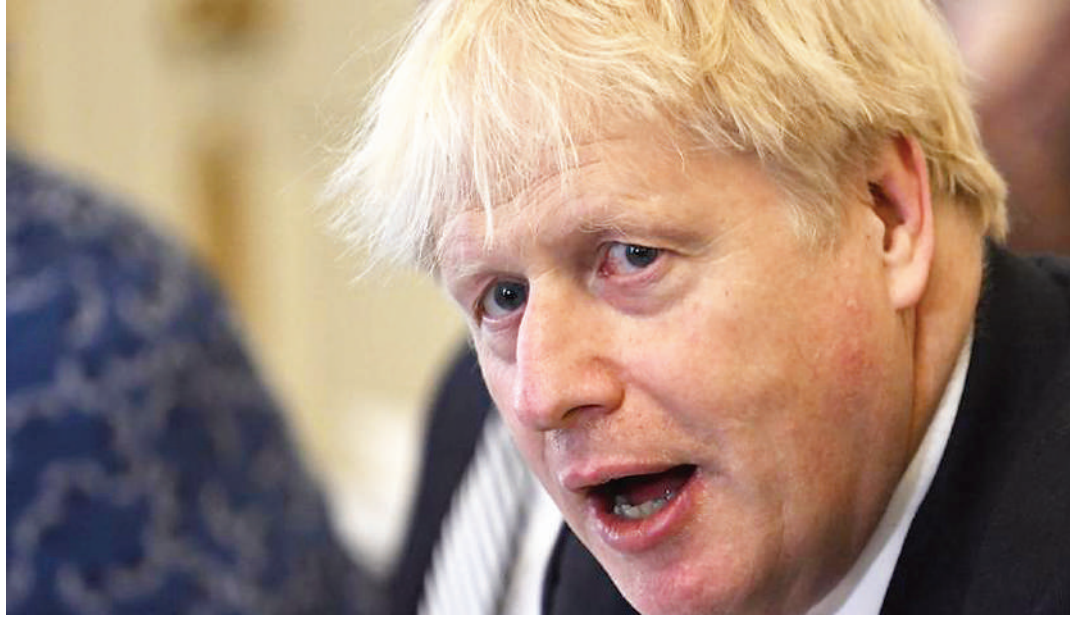
Britain's Prime Minister Boris Johnson speaks at a cabinet meeting, in Downing Street, London on Monday.

The latest scandal saw Johnson apologising for appointing a lawmaker to a role involved in offering pastoral care and handling party discipline, even after being briefed that the politician had been the subject of complaints