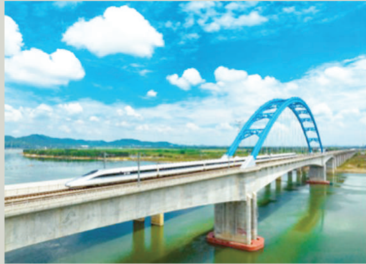
A high-speed train runs on a super large bridge along the Zhengzhou-Chongqing High-speed Railway in Xiangyang, central China's Hubei province, June 20, 2022. File photo

High-speed Railway was put into operation, some high-quality projects of high-end equipment manufacturing and modern services had already been started along the route.