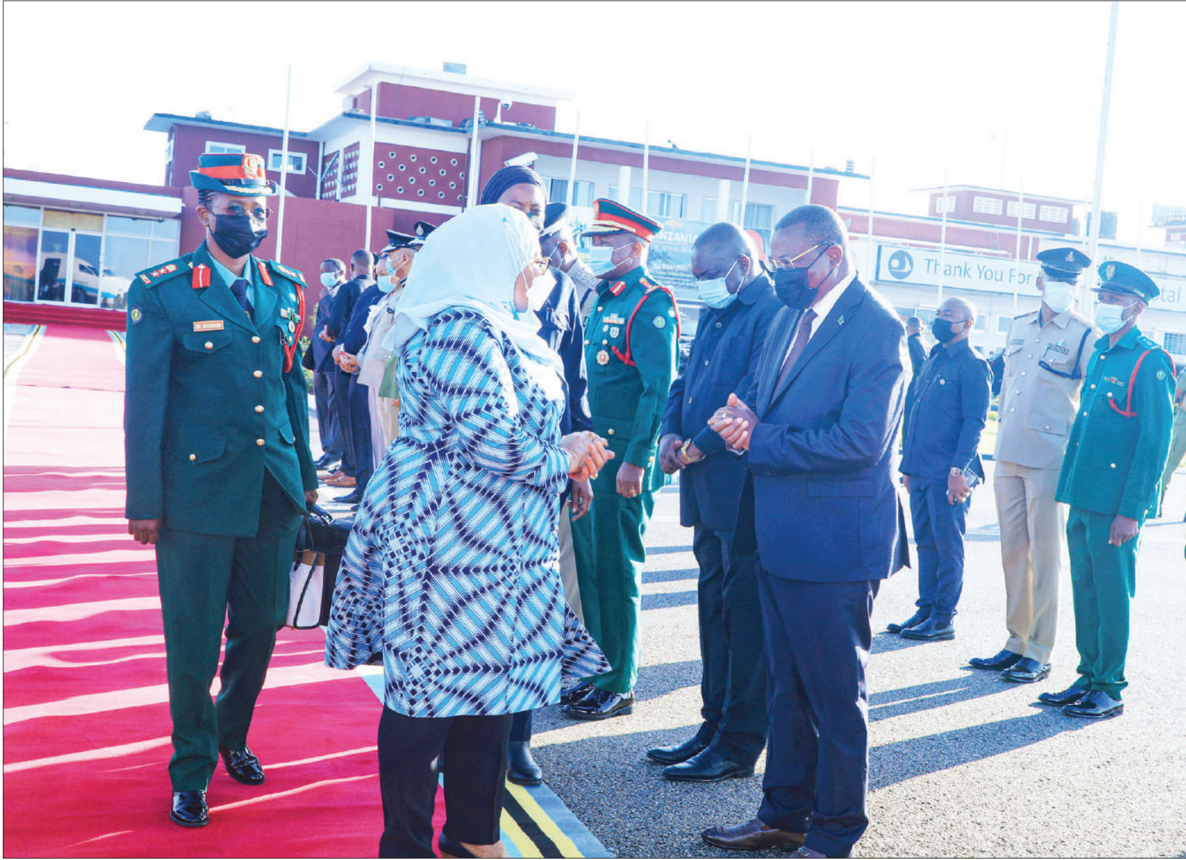
President Samia Suluhu Hassan bids Vice President Dr Philip Mpango farewell at Dar Salaam's Julius Nyerere International Airport shortly before jetting off for Dakar, Senegal, to attend the International Development Association (IDA) Heads of State Summit for Africa. A member of World Bank Group based in Washington, DC, IDA is an international financial institution which offers concessional loans and grants to the world's poorest developing countries.