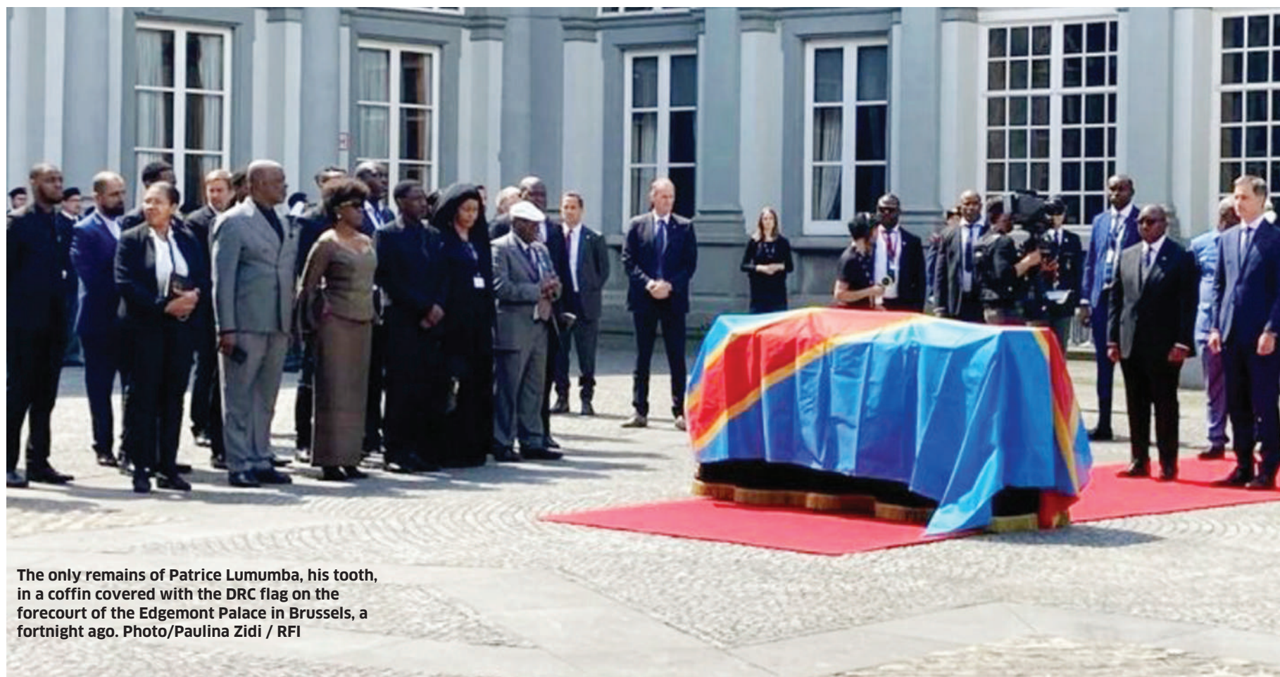
The only remains of Patrice Lumumba, his tooth, in a coffin covered with the DRC flag on the forecourt of the Edgemont Palace in Brussels, a fortnight ago.