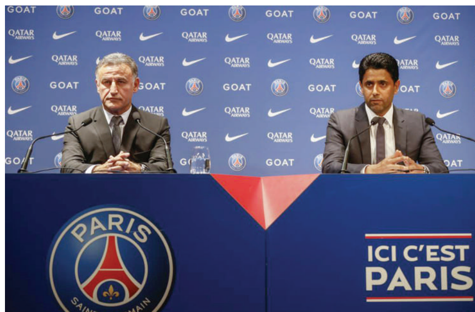
PSG president Nasser al-Khelaifi, right, and Christophe Galtier attend a press conference at the Parc des Princes stadium, Tuesday, July 5, 2022 in Paris. Christophe Galtier became Paris Saint-Germain's seventh coach in 11 years under the club's ambitious Qatari-backed ownership, with Mauricio Pochettino becoming the fourth straight coach to be fired during that time.

"You have to find a balance in the side, but I have a very precise idea about what I'm expecting