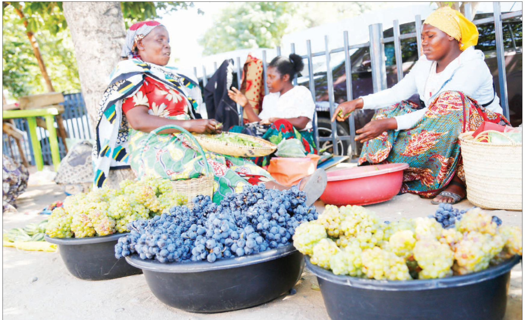
Grape sellers wait for elusive customers along Mji Mpya Street in Dodoma city yesterday - at the going price of between 1,000/- and twice as much per bunch.