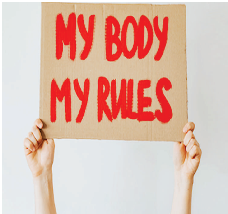
Women's rights groups have questioned the legal provision requiring doctors to collect records on all pregnancies, saying it could be used to monitor abortions.

Rights groups and opposition MPs say that in light of the tightened abortion legislation, they are worried that the pregnancy data could be used in an unprecedented state surveillance campaign