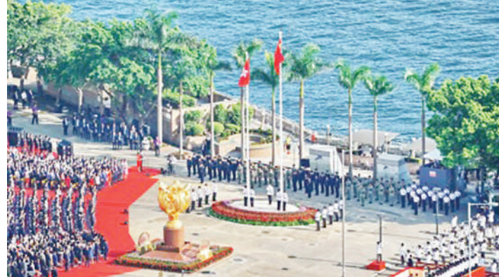
A flag-raising ceremony is held at the Golden Bauhinia Square in south China's Hong Kong Special Administrative Region on July 1, 2017 to mark the 20th anniversary of Hong Kong's return to the motherland. File photo

of the airport reflect the booming economy of Hong Kong since its return to the motherland.