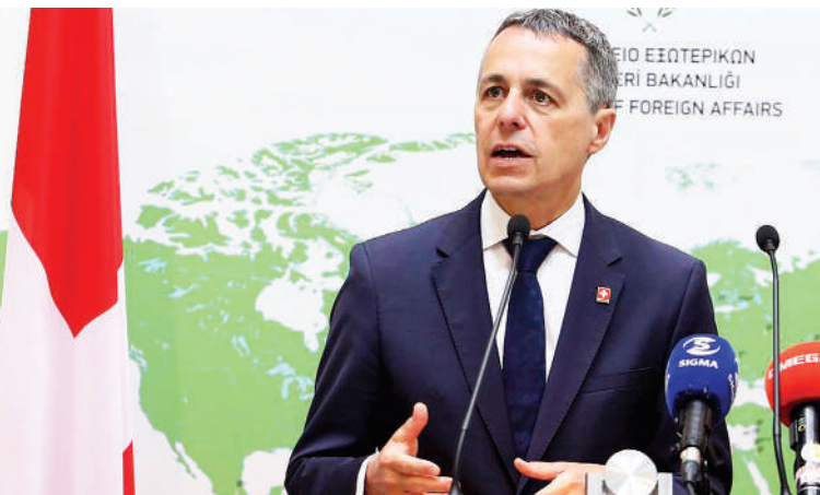
Swiss President Ignazio Cassis

"The right of ownership, the right of property is a fundamen-