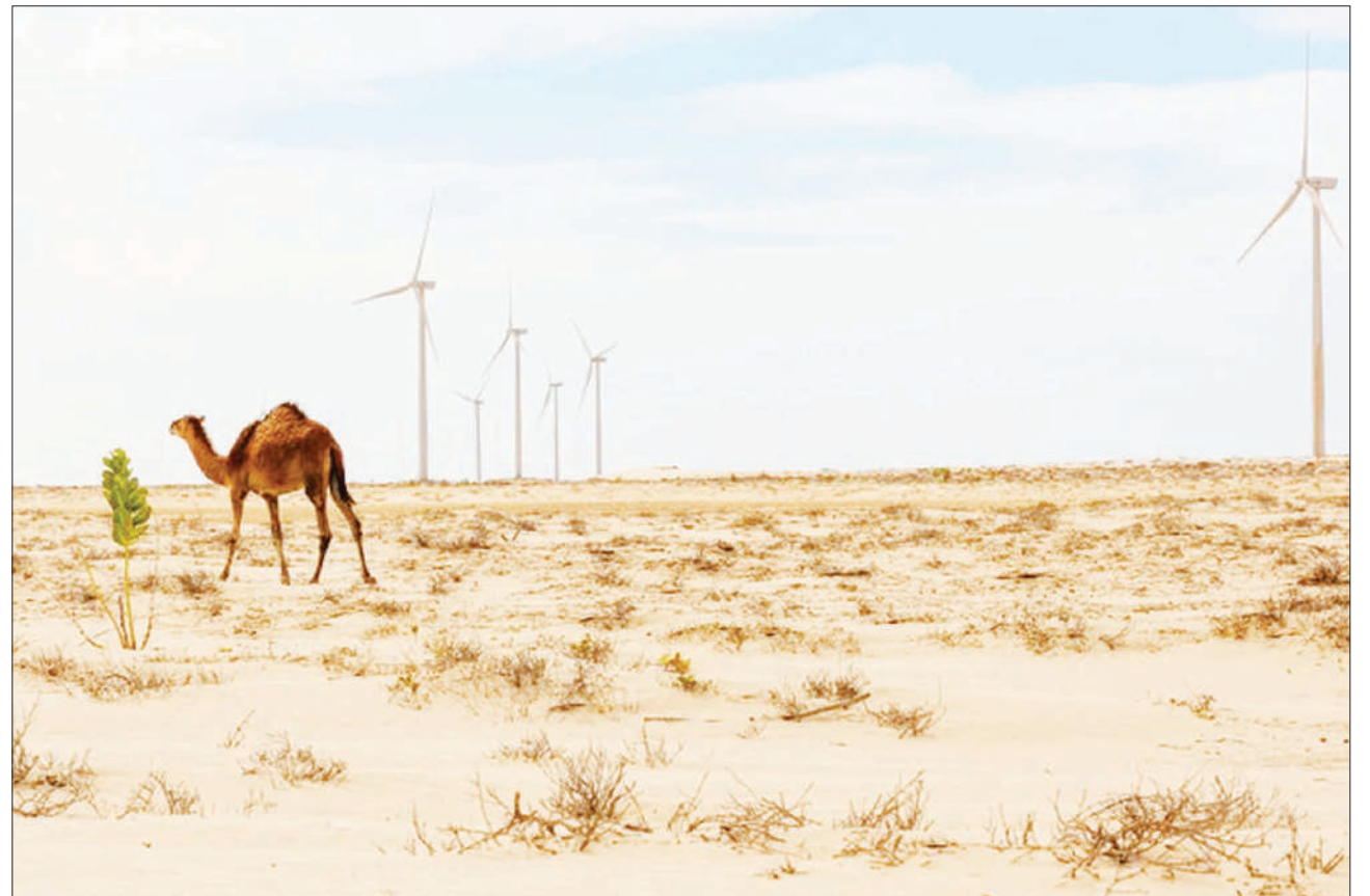
A wind farm on the outskirts of Nouakchott, the capital of Mauritania, is aimed at giving more people access to renewable energy sources.