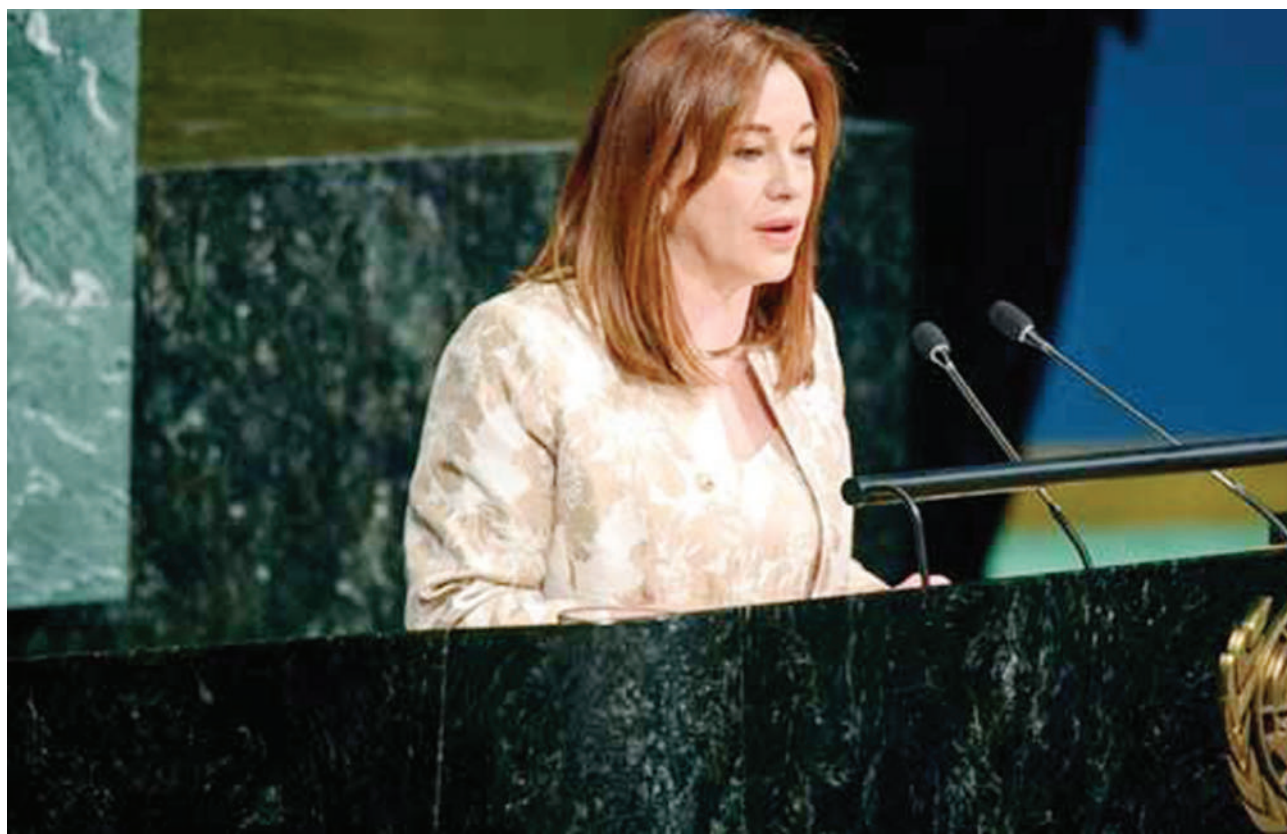
Foreign Minister Maria Fernanda Espinosa Garcés of Ecuador, who was elected President of the 73rd Session of the General Assembly in 2018—only the fourth time a woman candidate was elected.

"We want to support gender balance, and we will look at the candidates who are presented to us and review them accordingly," she declared.