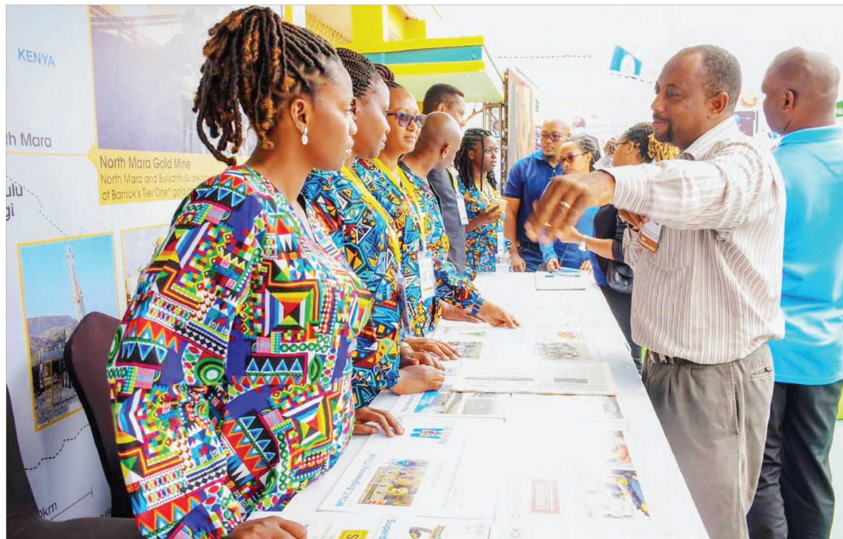
Barrick workers listen to Dar es Salaam resident (R) who visited the company's pavilion at the on-going 46th edition of the Dar es Salaam International Trade Fair yesterday.