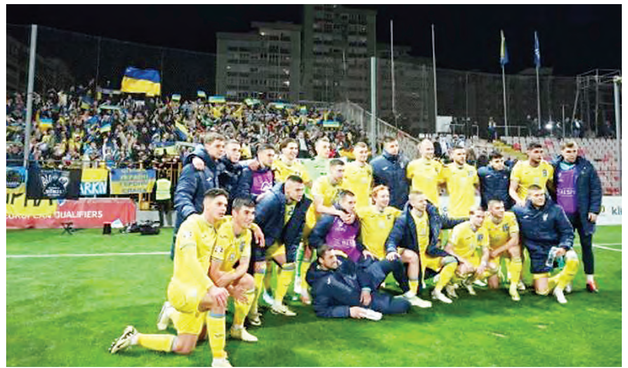
'Bring happiness': Ukraine are closing on a place at Euro 2024.

Iceland have not reached a major tournament since the 2018 World Cup but have continued to punch above their weight, beating Israel