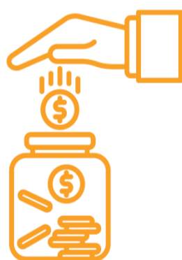
297.1% Momentous increase in the value of Collective Investment Schemes