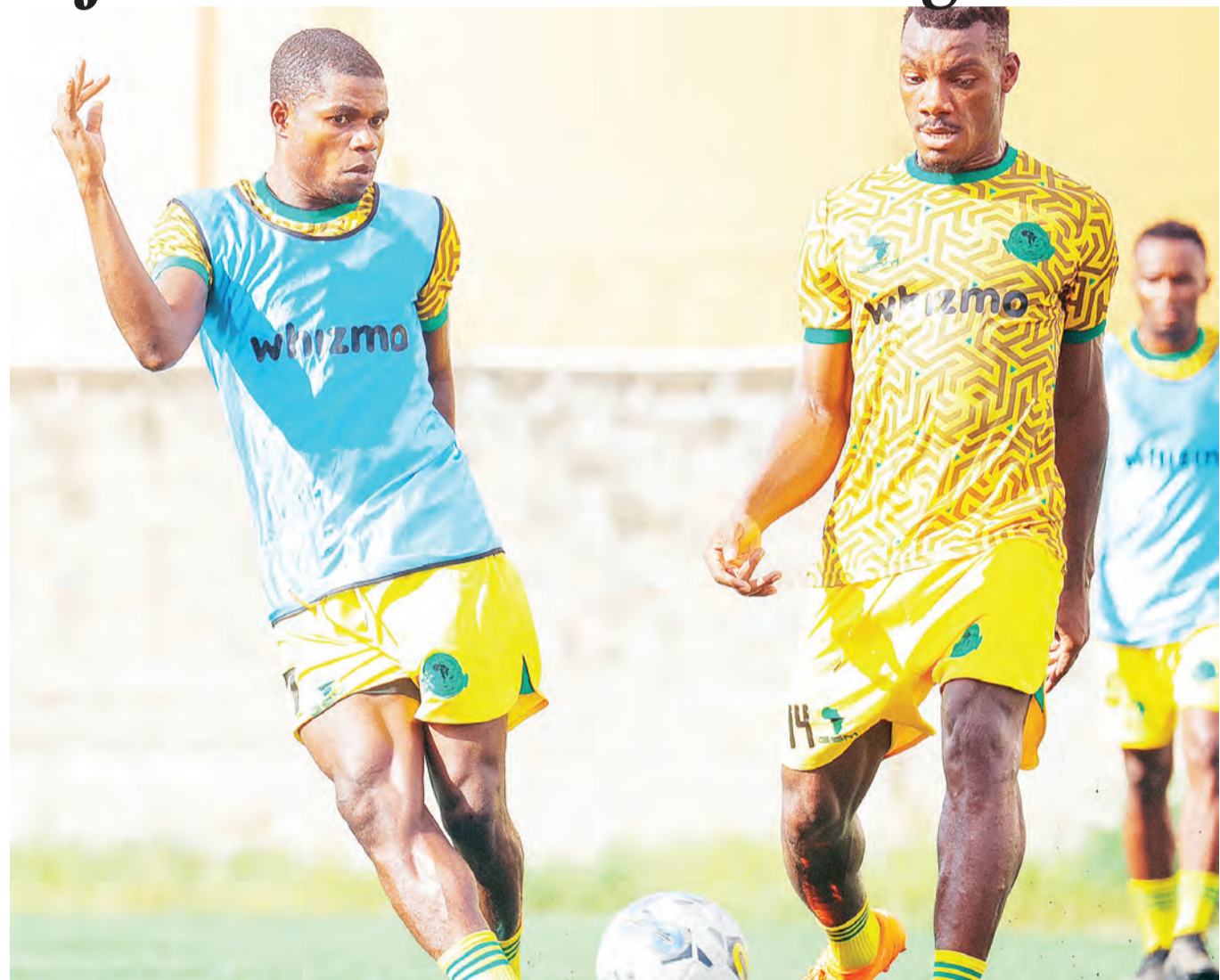
Tanzania's Yanga footballers participate in their club's training in Dar es Salaam recently in preparation for the 2023/24 NBC Premier League and 2023/24 CAF Champions League.