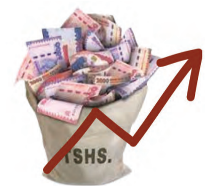
Value of Investments in Capital markets up by 20.6%