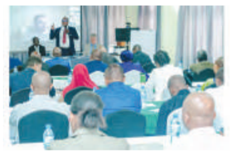
CPA, Nicodemus Mkama, CEO of CMSA addressing capital markets stakeholders during stakeholders' consultation meeting.

Implementation of the Securities Industry Certification Courses has increased the number of licensed market intermediaries by 27.8 percent to 184 during the period ended 29th February 2024 from 144 during the period ended 29th February 2021. The increase in the number of market intermediaries serves to increase public access to financial services which is one of the key pillars enshrined in the Third National Financial Inclusion Framework.