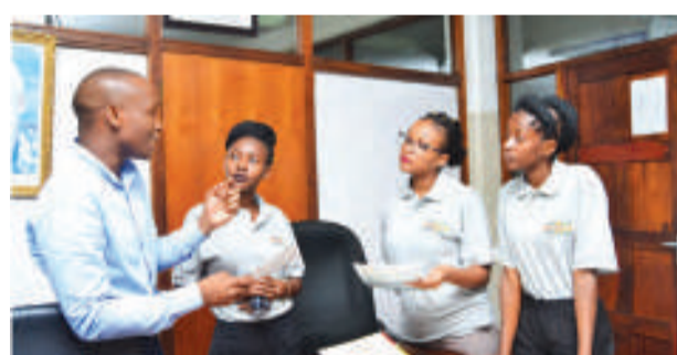
Winners of the CMUHLIC attentively listening to an official from UTT AMIS during one week study visit which is part of award to top 12 winners of the challenge organised to orient them on practical aspects of the capital markets.