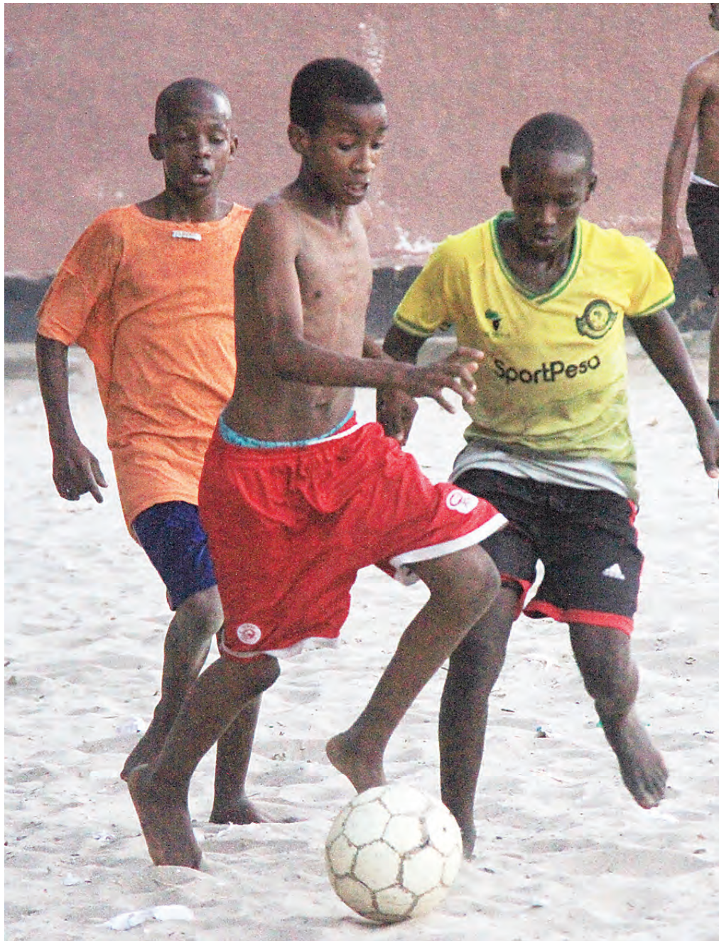
Dar es Salaam youths play soccer at Kivule Primary School's ground recently.