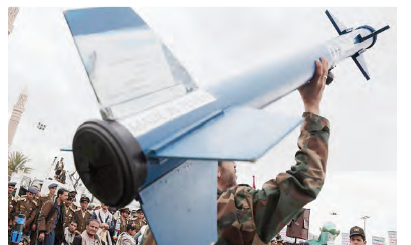
A protestor holds a model of a Houthi missile during a protest against Israel's continued war on the Gaza Strip and the U.S.-led airstrikes and sanctions against the Houthi group in Sanaa, Yemen, Feb. 16, 2024.

US and Japan plan to strengthen security pact inked over 60 years ago