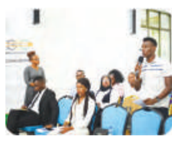
CMSA Senior Official receiving feedback from one of capital market stakeholder during stakeholders' consultation meeting.