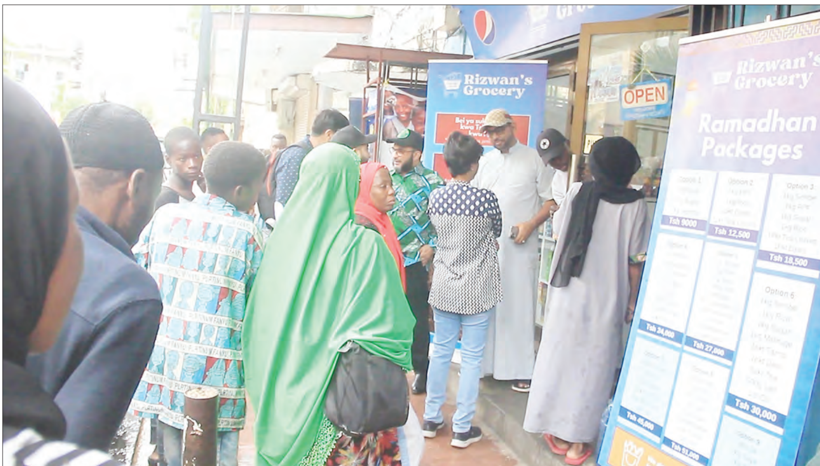
Dar es Salaam residents pictured at a shop in the city's central business district yesterday waiting to buy sugar selling at 2,600/- per kilogramme relative to an arbitrarily set 3,000/- or higher at most points across the country.

PASADA has been closely working with organizations such as Stop TB-Partnership hosted by United Nations Office for Project Services (UNOPS), Tanzania Health Promotion Support (THPS) so as to fairly contribute to pastoral activities.