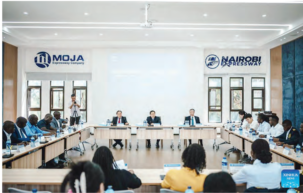
Participants attend the China alumni symposium on the Belt and Road Initiative (BRI) in Nairobi, Kenya, March 24, 2024.