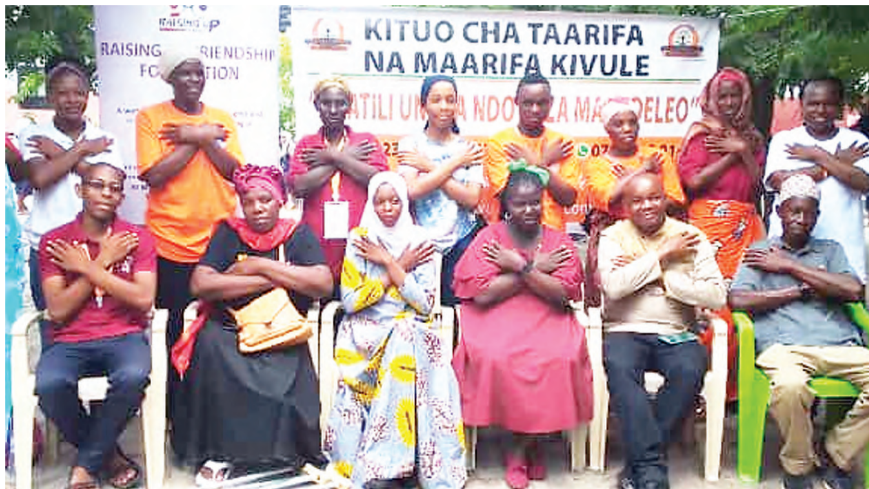
Members of TGNP's Kivule knowledge centre.