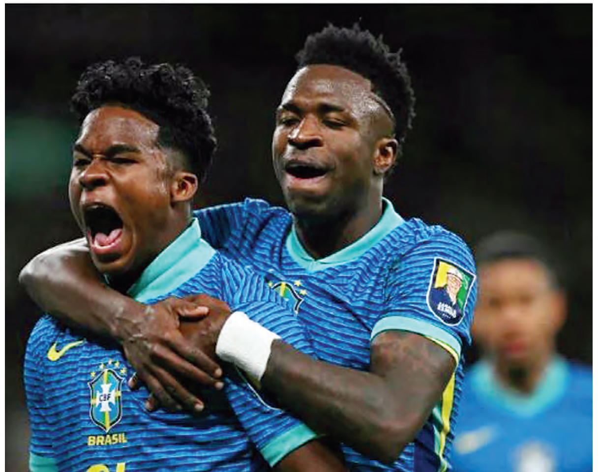
A star is born: Endrick (L) celebrates with Vinicius Junior after scoring against England.

Ronaldo made his debut for Brazil in 1994 and became the country's third youngest ever goalscorer when he netted against Iceland aged 17 years, seven months and 12 days.