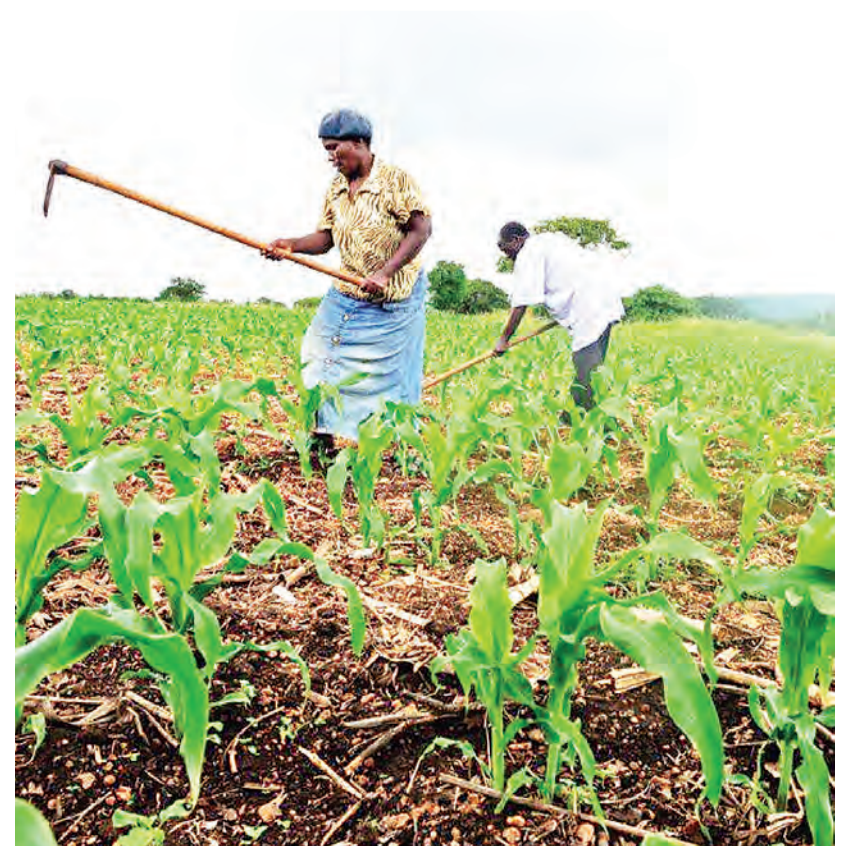
Farmers working in their field. File Photo

He also said according to research, in one acre, a farmer is required to plant at least three to four packets of two kilograms each and at the end of it, a farmer may harvest up to 1,500 kilogrammes.