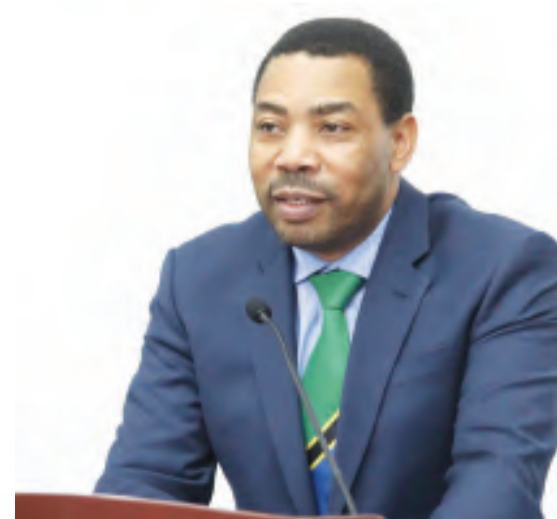
Tanzania's Finance Minister Dr. Mwuigulu Nchemba champions Sustainable Capital Markets in SADC via the Committee of SADC Stock Exchanges (COSSE)

Similarly, issuance of the first Gender Bond in Sub-Saharan Africa dubbed "NMB Jasiri Bond" raising TZS 74.2 billion to finance small and medium-sized enterprises owned and operated by women, as well as those owned by men but producing goods and services that has direct impact to women has been witnessed in the Tanzanian capital markets. This bond was part of the Medium Term Note (MTN) program worth TZS 200 billion and attained a success rate of 297%. The bond is listed on the Dar es Salaam Stock Exchange (DSE) and cross listed on the Luxembourg Stock Exchange (LuxSE). This underscores the President's aspirations in empowering women and promoting gender equality in the country.