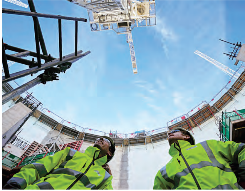
Employees look up at the construction site of Hinkley Point C nuclear power station in Somerset, England, Oct 11, 2022.

tion of our nuclear enterprise, which will keep us safe, keep our energy secure, and keep our bills down for good."