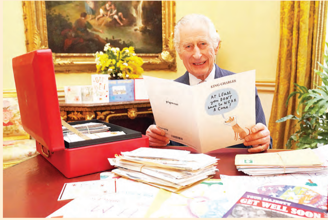
Britain's King Charles III poses for a photograph as he reads cards and messages, sent by well-wishers following his cancer diagnosis, in the 18th Century Room of the Belgian Suite in Buckingham Palace in central London on Feb 21, 2024.

Charles underwent a corrective procedure for an enlarged prostate in January. Buckingham Palace then