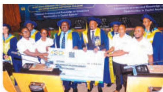
The Guest of Honor Hon. Deputy Minister for Finance Hamad Chande presenting prize to winners of the CMUHLIC during Award Giving Ceremony held in October 2024.

Capital Markets Universities and Higher Learning Institutions Challenge (CMUHLIC) is a competition for students in universities and higher learning institutions whose objective is to enhance financial inclusion and literacy by testing knowledge and understanding on issues related to capital markets. The Challenge has attracted over 88,871 participants during the period ending 29th February 2024, recording an increase of 82.6 percent compared to the participation of 48,662 recorded during the period ending 29th February 2021. Positive outcomes of the challenge include creation of over 10,000 actual investors in shares of companies listed on the DSE; development of the Young Investors Forum with more than 6,000 members, whose objective is to provide financial literacy and experiences for the youth in subscription and trading of shares. This is part of President Samia's commitment to youth empowerment on financial matters.