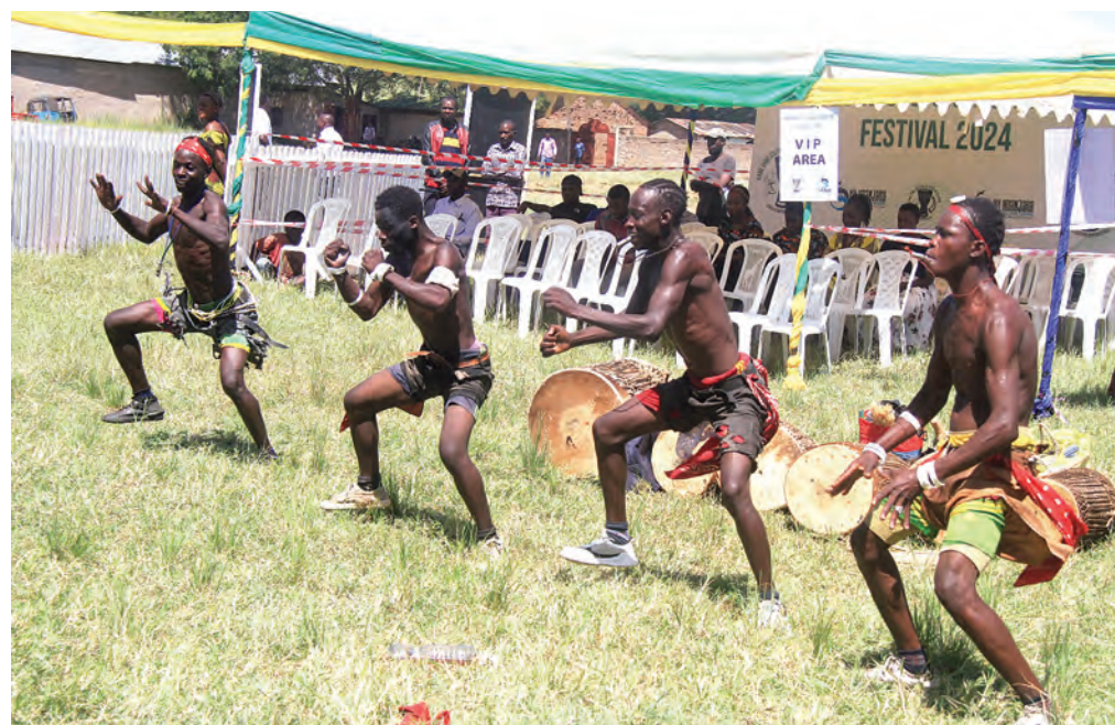
Sukuma youths are pictured performing a dance during the launch of this year's Lake Zone Cultural and Tourism Festival- organized by Kilimanjaro One Travel and Tours firm- at the CCM ground in Bariadi District, Simiyu recently.

The FIFA boss emphasized its focus on enhancing competitiveness and promoting the sport, rather than offering trophies or prize money.