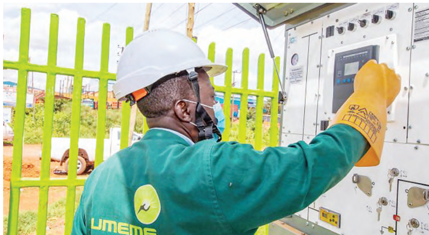
A technician from Umeme firm hard at work. File Photo