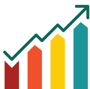
Trading turnover on the exchange up by 87.7%