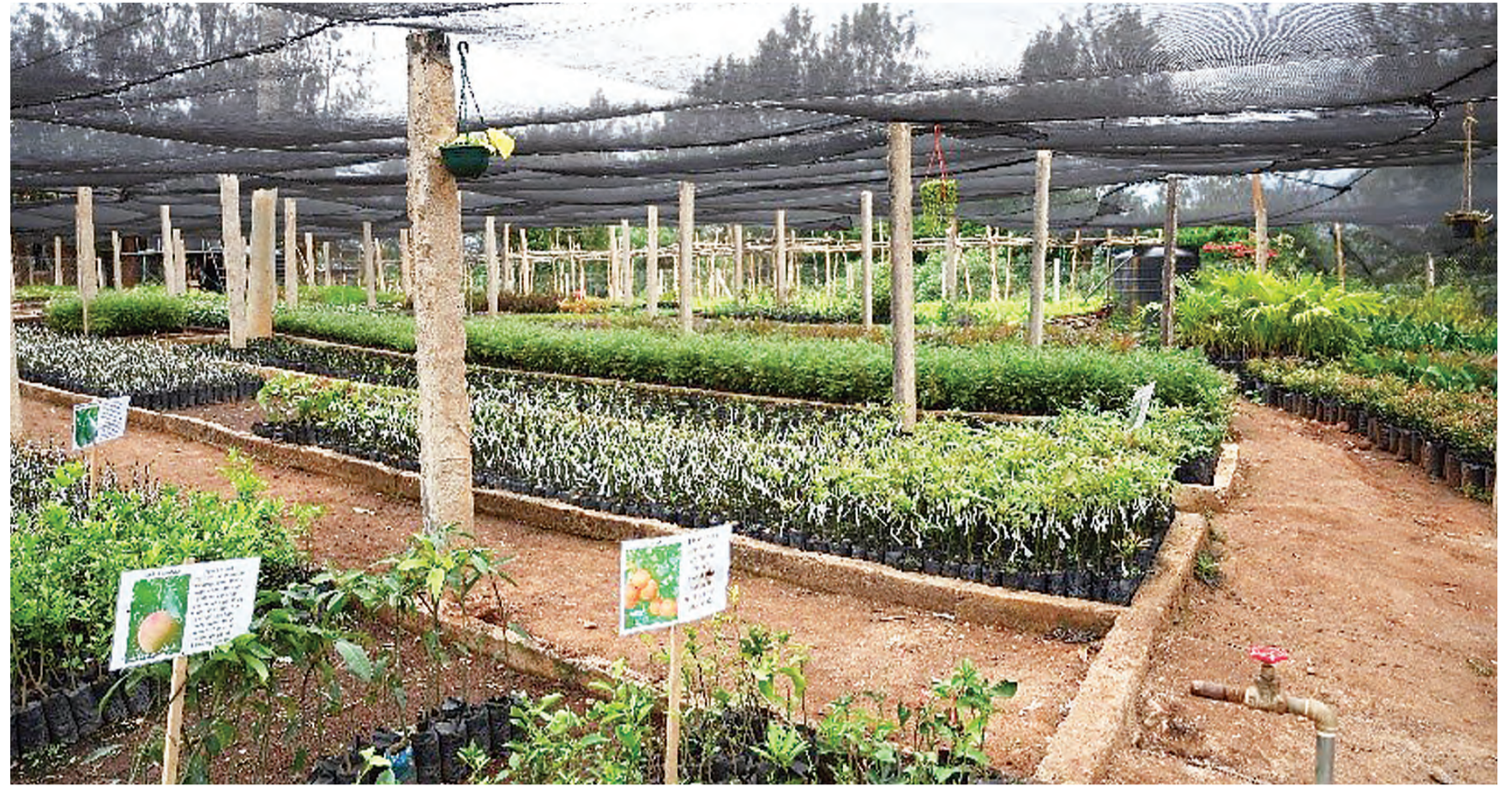
A snapshot of the vast nursery housing fruit, indigenous and ornamental trees.

Climate change-related impacts such as prolonged droughts and low rainfall motivated the government to ensure more trees were grown and integrated with appropriate soil and water conservation measures, especially in