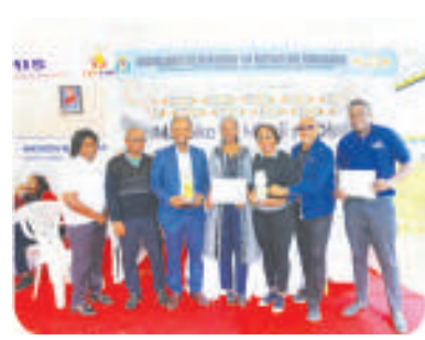
CMSA Senior Officials with their trophy received during the Financial Services Week which was held in Arusha November 2023