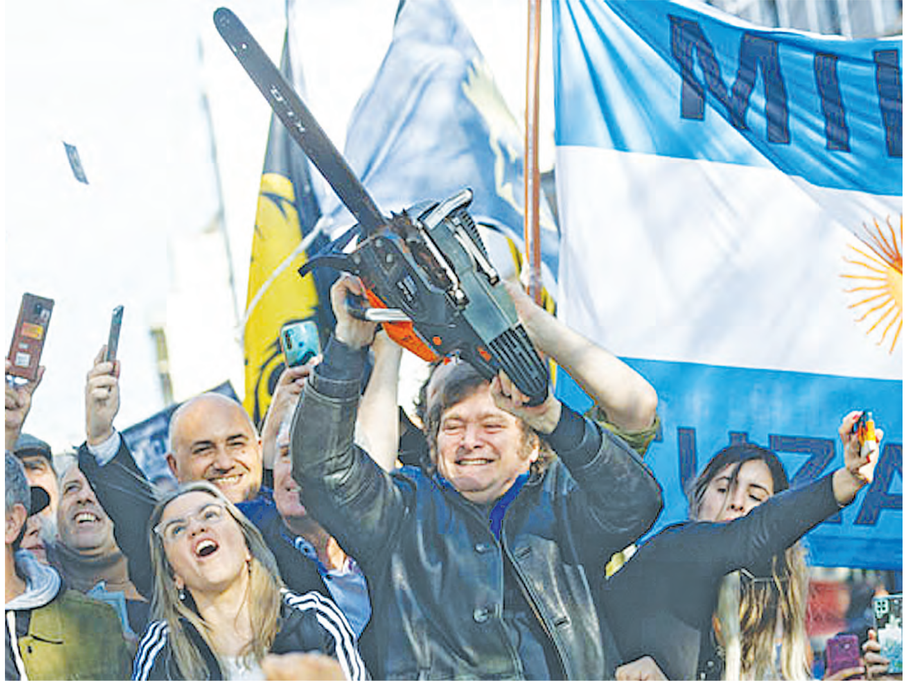
In the run-up to primary elections in August, the two mainstream coalitions - the centre-left incumbent Union for the Homeland (UP) and the centre-right opposition Together for Change (JxC) - displayed a notable lack of leadership and indulged in internal squabbles that showed very little empathy for people's daily struggles.

While many of his followers concede that his ideas may be a little crazy, they appear to be willing to take the risk of embracing the unknown on the basis that the really crazy plan would be to allow those long in control to retain their power and expect things to turn out differently. Milei has capitalised on the despair, hopelessness and accumulated anger so many rightfully feel.