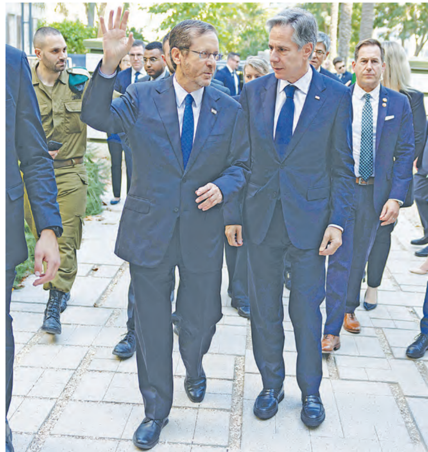
US Secretary of State Antony Blinken meets Israeli President Isaac Herzog, on Friday.

Russia did not start the war with Ukraine, for which the Kiev regime is responsible, it is putting an end to it, and this is a conceptual truth "which we all have to convey both in our country, to all our friends, and around the world."