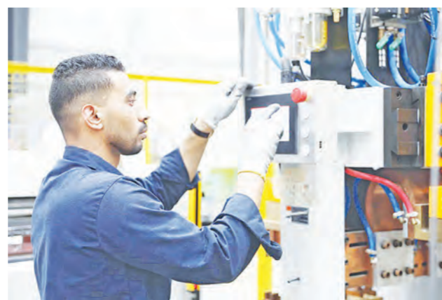
A local worker operates equipment in China-Egypt TEDA Suez Economic and Trade Cooperation Zone in Egypt.

He emphasized that China attaches great importance to strengthening clean energy cooperation with Africa and has become one of the main partners of Africa in clean energy develop-