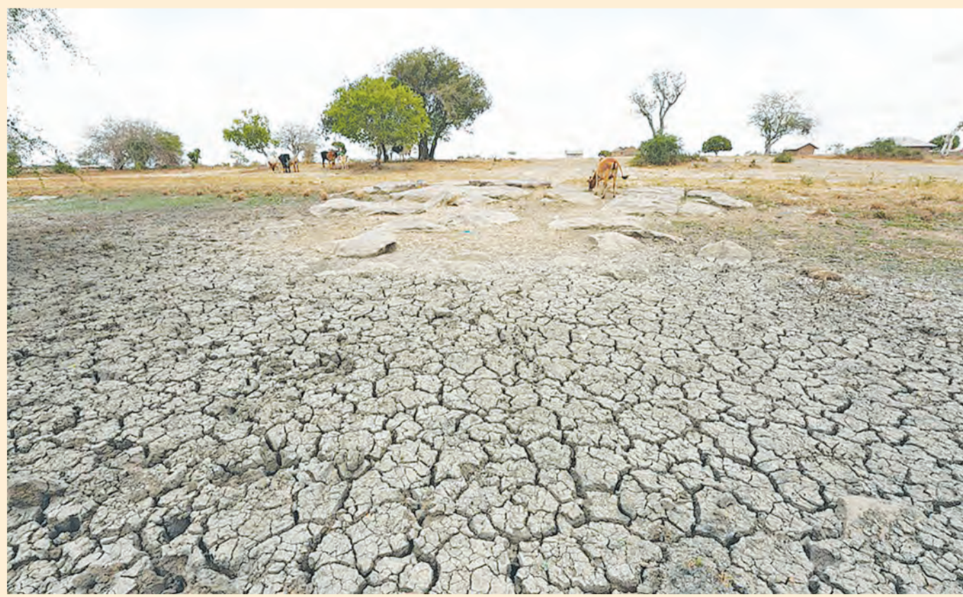
Livestock are seen drought-hit field in Kidemu sub-location in Kilifi County, Kenya.

According to the UNECA, climate change-related constraints underscore Africa's crucial need to develop innovative growth models capable of preserving and enhancing the well-being of their populations while adapting to climate change and contributing to its slowdown.