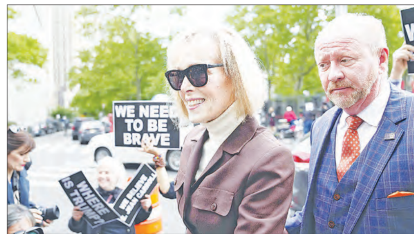
E. Jean Carroll arrives at Manhattan federal court, May 9, 2023, in New York.

Jurors will also be transported together to and from the courthouse and be looked after by US marshals during breaks in the trial.