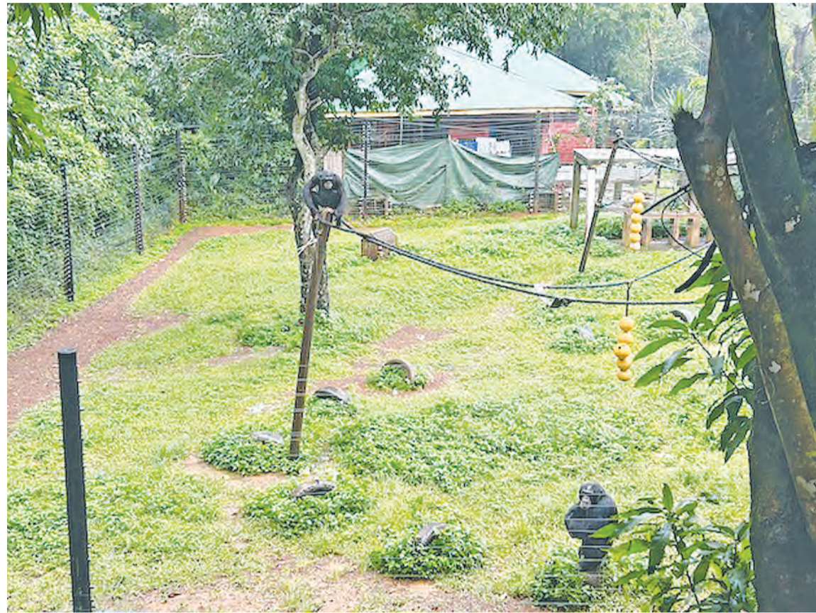
Tacugama Chimpanzee Sanctuary - a conservation center dedicated to rescuing, rehabilitating, and protecting Sierra Leone's national chimpanzee.

Since then, the conservation of biodiversity, especially the natural habitats of wildlife, has gained attention in the region to prevent any quick transmission of a zoonotic pathogen from animals to humans. But almost all the major forests and