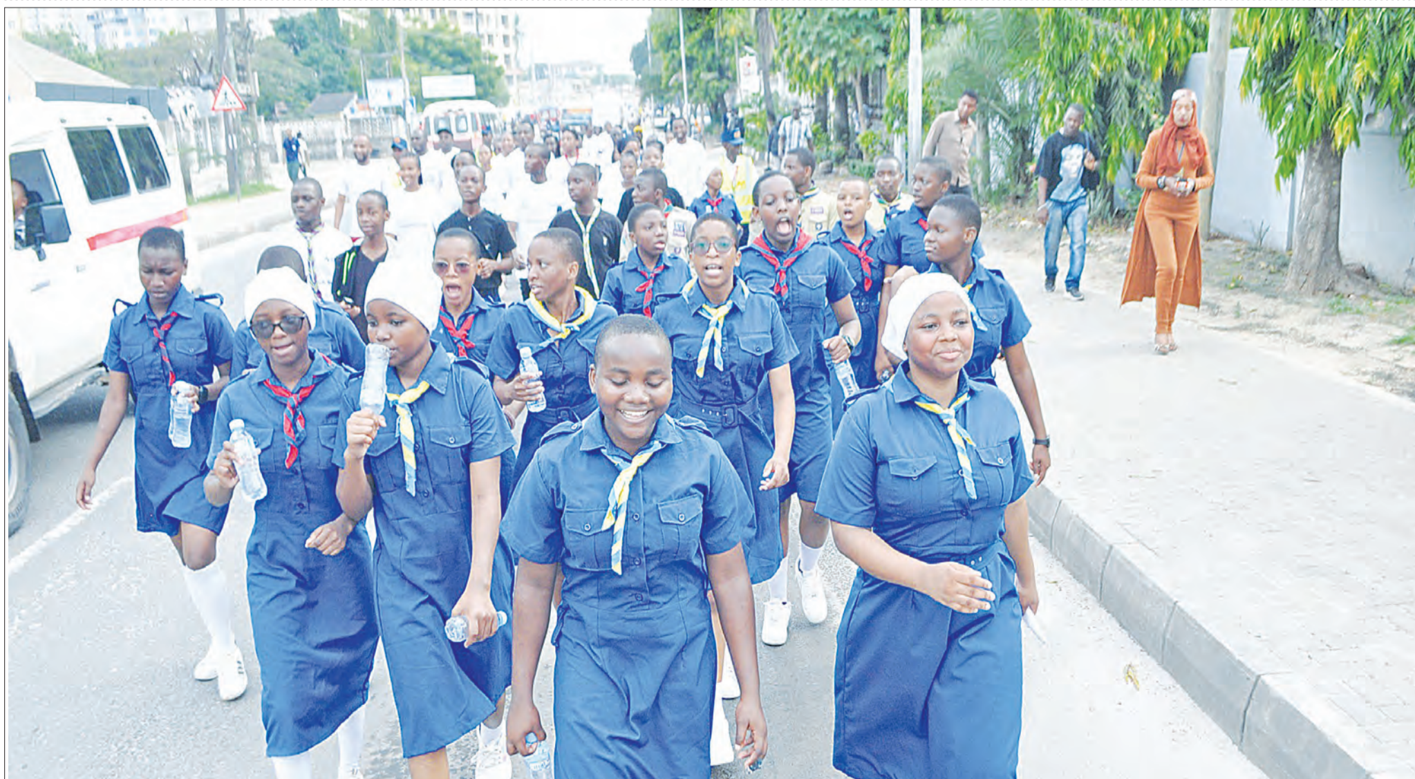
Students of Dar es Salaam's Zanaki Secondary School and members of Hasiku Women's Association in an International Accounting Day (November 10) charity walk held in the city at the weekend, primarily with a view to raising funds for the purchase and supply of books to various schools.

The meeting was expected to emphasise the importance of political will among the member states in contributing troops and military equipment for the SADC Peacekeeping Mission in the DRC (SAMIDRC).