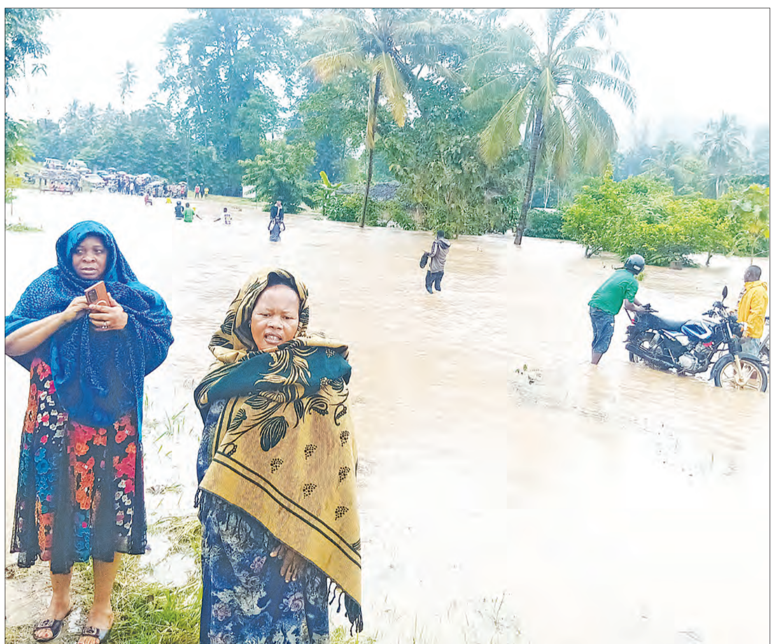
ROAD UNDER WATER: Msangazi River flooded yesterday following three straight days of pounding rains in most of Tanzania's coastal zone, rendering a section of the strategic road between Muheza town and Amani division in Tanga Region closed to vehicular traffic.