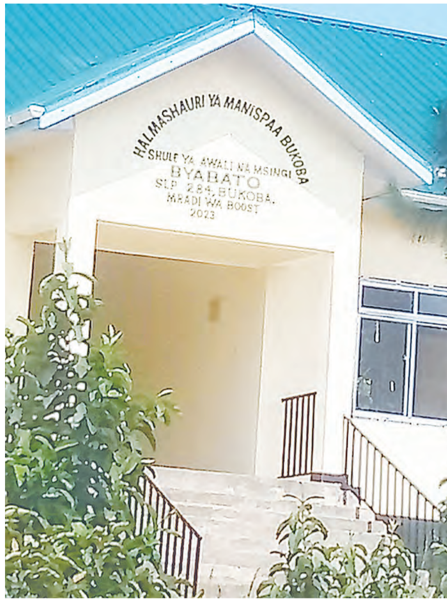
Byabato Pre and Primary School in Bukoba Municipality. Residents are divided over the choice of its name in what points to politics.

Residents here are divided over the name with some for and others against as the latter say it gives political