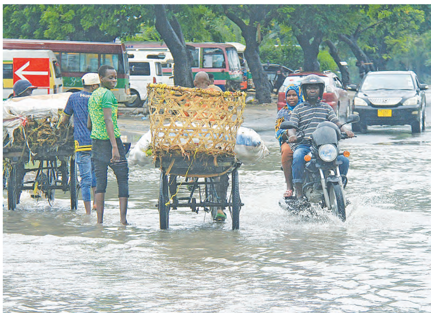
A section of Makuti Road in Temeke municipality, Dar es Salaam, under stagnant rainwater yesterday and therefore all but closed to vehicular traffic. This followed three consecutive days of heavy rains in the city.

He also said another advantage to study abroad is academic flexibility because a student can study the first and second year in one country and finish college in another country.