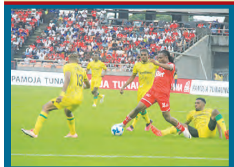
YANGA TROUNCE SIMBA SC IN THRILLING DAR DERBY