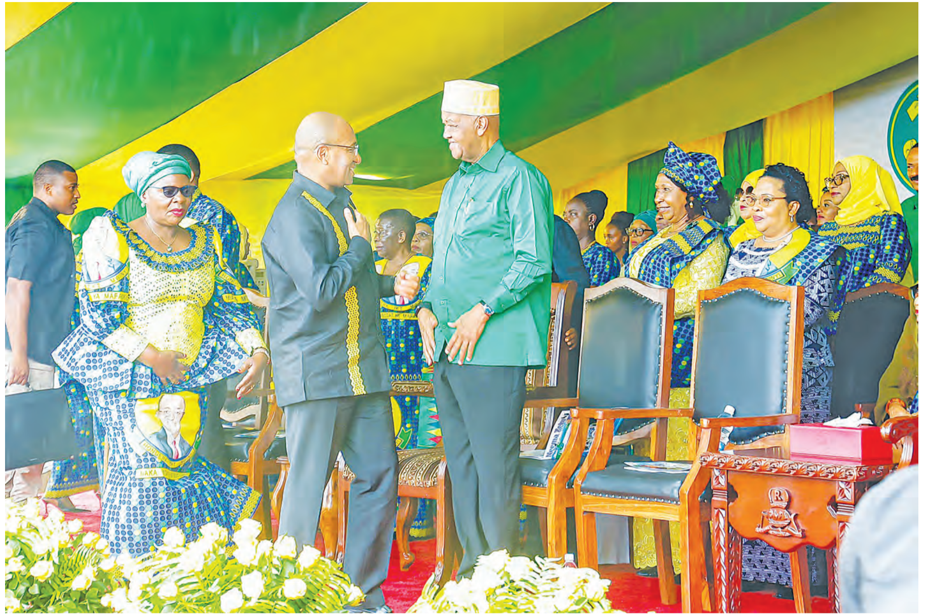
CCM Vice Chairman (Mainland) Abdulrahman Kinana (in cap) and Zanzibar President Dr Hussein Ali Mwinyi pictured in Zanzibar on Saturday during celebrations to mark the third anniversary of Dr Mwinyi's presidency.

Over the years the recommendation has been carried forward by faith partners to various authorities and decision makers, bringing the development partner to express unqualified approval of the government's policy shift to make it possible that all Tanzanians are able to access health services.