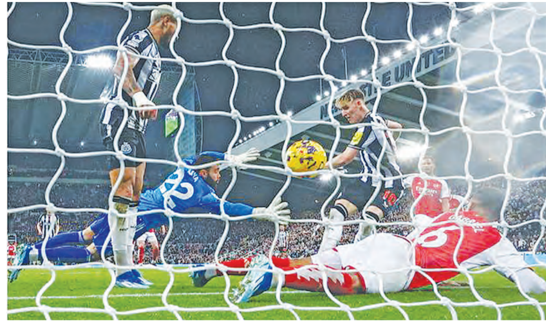
Anthony Gordon scores Newcastle's winner against Arsenal.

Arsenal manager Mikel Arteta was furious after an