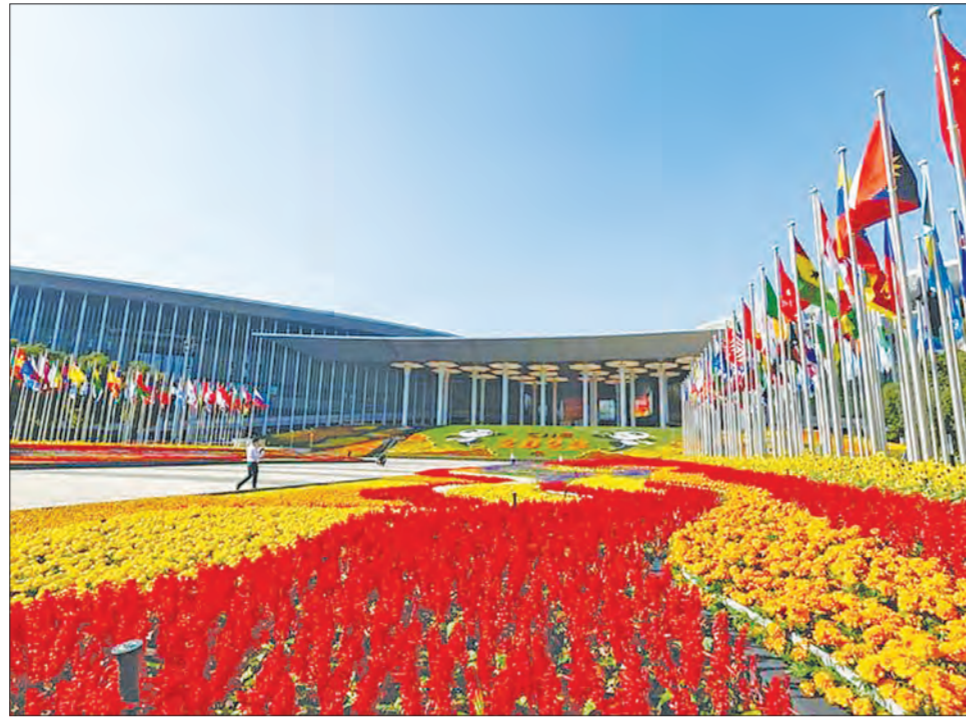
This photo taken on Oct 31, 2023 shows the south square of the National Exhibition and Convention Center (Shanghai), the main venue for the 6th China International Import Expo, in East China's Shanghai.

He pledged that China will firmly advance high-standard opening-up and continue to make economic globalization more open, inclusive, balanced and beneficial to all.