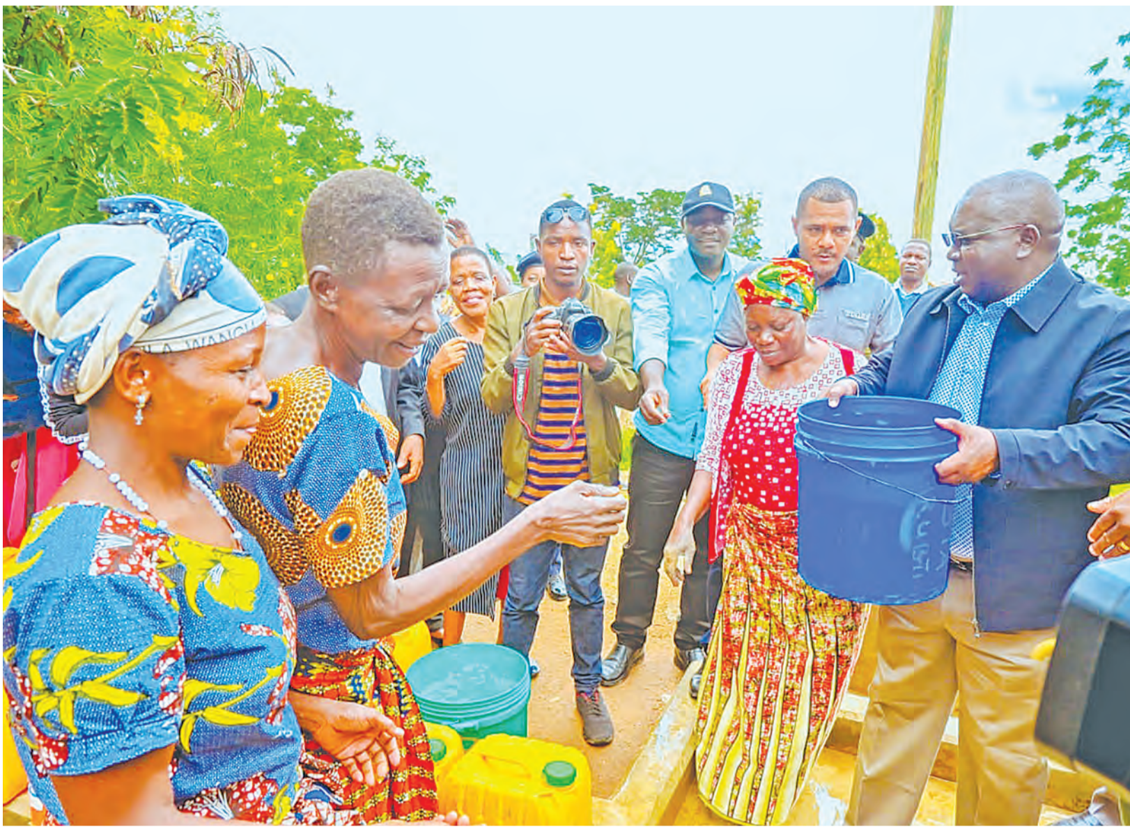
Mwanza regional commissioner Amos Makalla (R) moves to assist a resident of Chabula ward in Magu District at the weekend in carrying a bucket of water during the inauguration of the 1.7bn/- Bugando-Chabula water project expected to serve more than 12,500 residents of four villages in two wards.