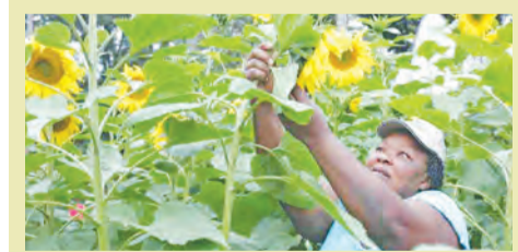
Sunflower farmers want irrigation