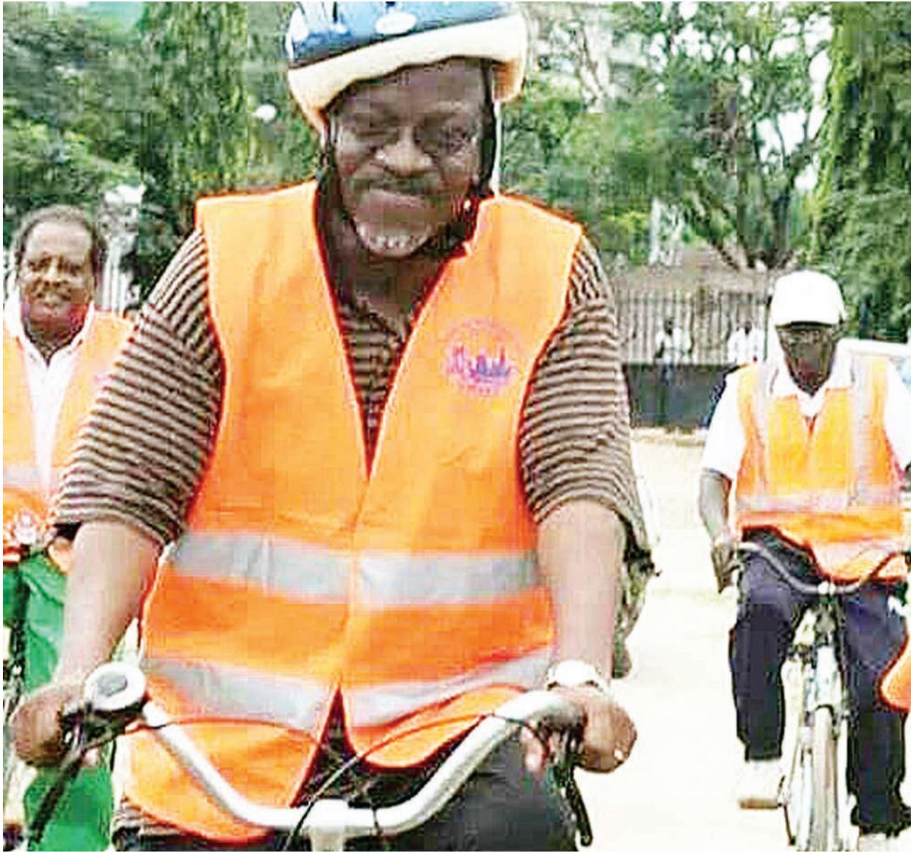
On the right track...Bravo the bike! President John Magufuli surprised onlookers when he walked out of the State House to collect rubbish off the streets, after cancelling Independence Day celebrations in December 2015. After the clean up exercise, the President rode a bicycle to the State House, to highlight the fuel issue used by the presidential motorcade.

exercise. But the worst example I've seen occurred a decade ago when driving to Bagamoyo with a friend, we suddenly heard extremely loud horns blaring, as frightened drivers in front of us pulled aside in panic.