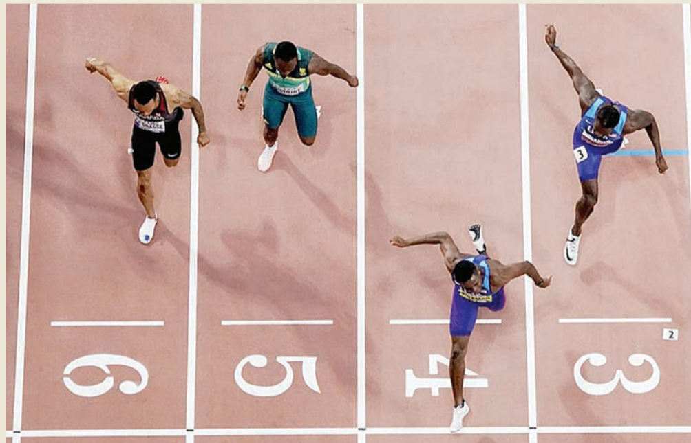
Christian Coleman, of the United States, crosses the finish line to win the men's 100 meter final ahead of silver medalist Justin Gatlin, also of the United States, during the World Athletics Championships in Doha, Qatar, Saturday, Sept. 28, 2019.

Coleman, on the other hand, never trailed – the legs on his muscle-bound, 5-9 frame pumping like pistons from start to finish.