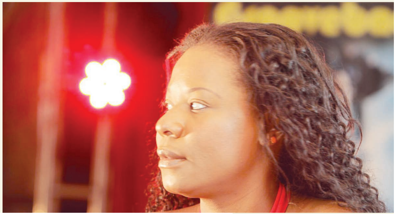
Judith Wambura, popularly known as Lady Jaydee.