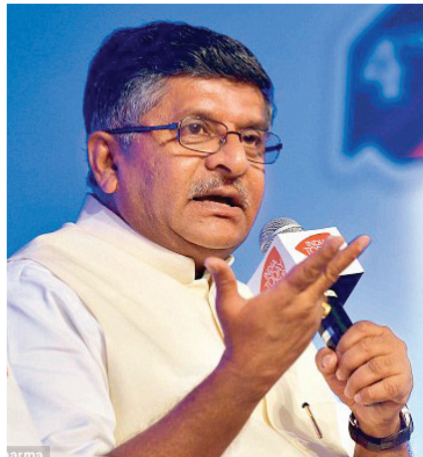
India's Communications minister Ravi Prasad.