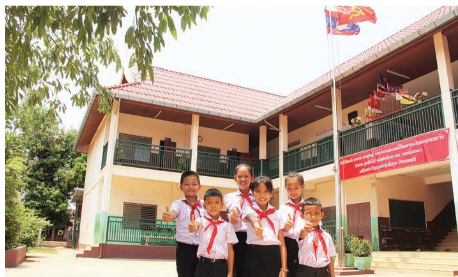
Lao elementary students pose for pictures in front of the China-Laos Friendship Non-Government Primary School aided by China.

China has been helping recipient countries boost their economy, reduce poverty, improve people's wellbeing and make huge contributions to facilitating South-South Cooperation and building a community with a shared future for mankind. By doing so, China has further built its image as a responsible major country.