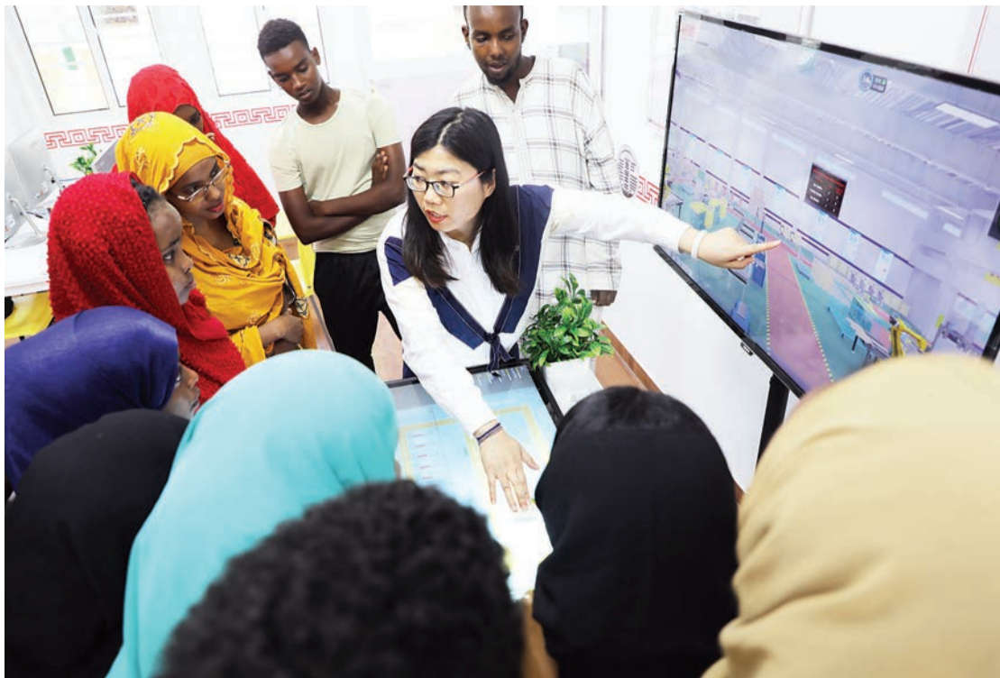
Chinese personnel teach local trainees how to simulate enterprise operation on computers at a Luban Workshop in Djibouti. The Luban Workshop, inaugurated in March, 2019, marks the first one of this kind in Africa.

70 years on, the world witnessed a great country rise from the east.