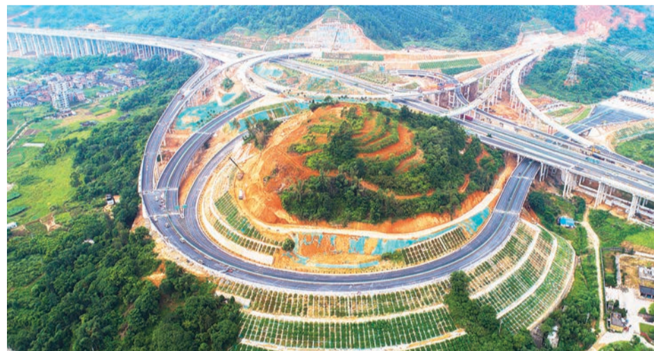
The photo shows an interchange of the Liudu section along the Ningde-Gujian expressway, Fujian province.

In Djibouti, the coastal and inland area are now connected by modern electrified railways, containers are piled up at the multi-purpose port, roads are getting wider, and local people