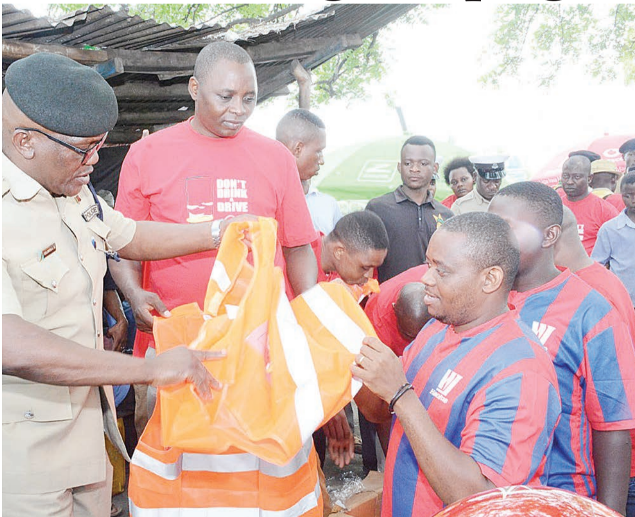
Tanga Regional Traffic Officer, Solomon Mwangamilo (L), presents reflector vests to 'Bodaboda' riders to mark the launch of a 'Don't drink and drive' campaign in Tanga City at the weekend.

"We all know that alcoholism is directly linked to reckless driving which in some cases leads to serious road accidents with serious repercussions in the society. The impacts not only affect the consumers but also others whose lives and property get shattered,"