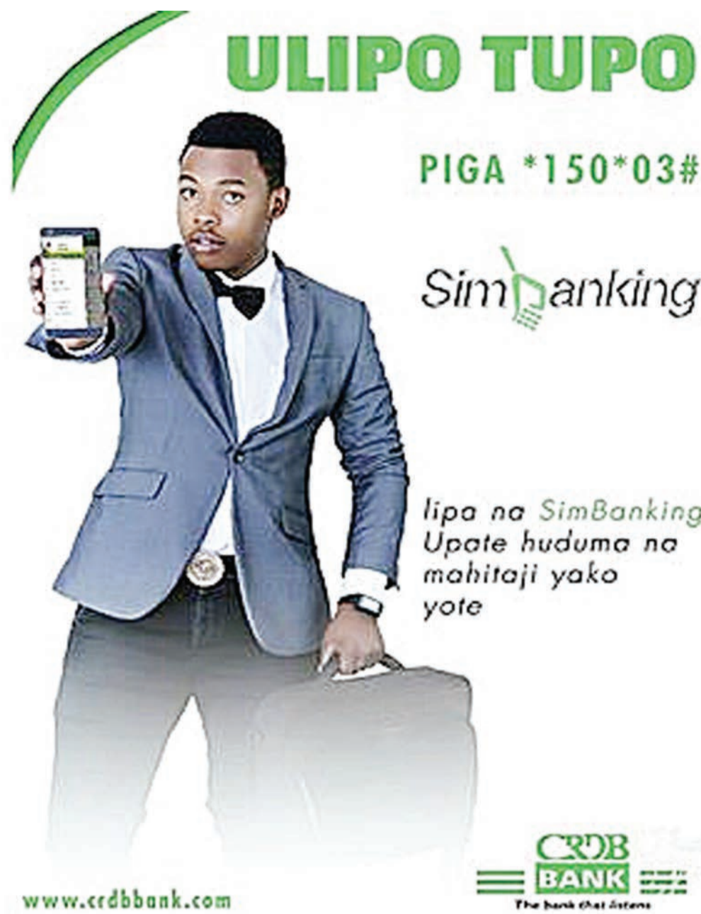
An 'Ulipo-Tupo' poster.