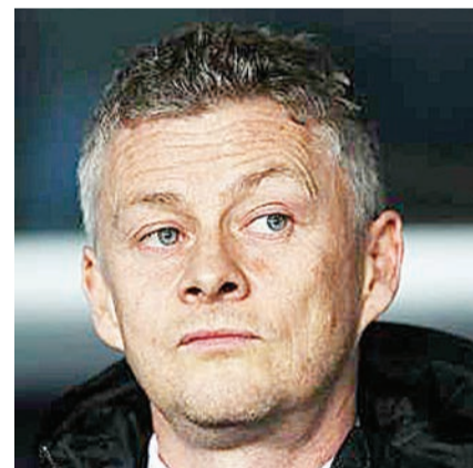
Ole Gunnar Solskjaer

Pogba made his first start in nearly a month after missing time with a