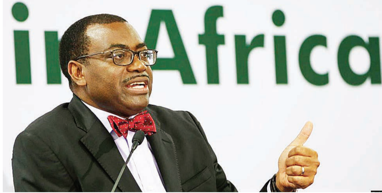
African Development Bank (AfDB) President Akinwumi Adesina gestures as he addresses a news conference at the annual meeting of AfDB in Gandhinagar, India, May 22, 2017.

no planet B." This thought has guided the development of the Sustainable Development Goals (SDGs).