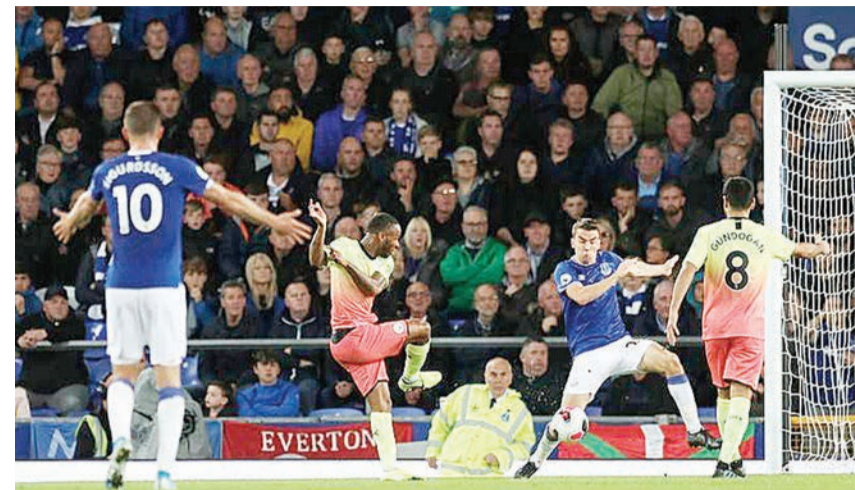
Manchester City's Raheem Sterling scores their third goal during their Premier League match against Everton at Goodison Park in Liverpool, Britain on Saturday.

City were under huge pressure to respond in the late kick-off at Goodison Park and took the lead through