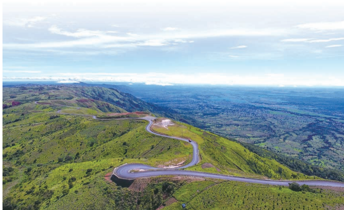
The photo shows the Mbeya-Luwanjiro highway, Tanzania constructed by China Road and Bridge Corporation. Built on an average altitude of 2,000 meters, the highway is the "highest" in the country.

Historian Arnold Toynbee predicted that if China can blaze a new path in its social and economic strategies, then it can prove its capacity to endow a gift on China and the world.