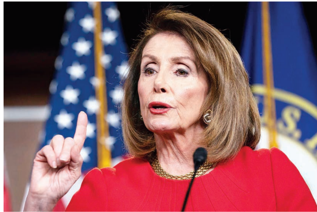
U.S. House Speaker Nancy Pelosi

In a July 25 telephone call between Trump and Zelenskyy, the U.S. leader asked his counterpart to launch an investigation of Democratic presidential hopeful Joe Biden and his son, Hunter, who had served on the board of a