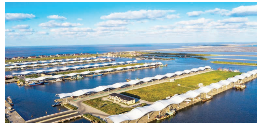
The photo taken on Sept. 15, 2019 shows a magnificent view of a fishing port in Qidong, east China's Jiangsu province, where workers are busy loading and unloading fresh sea food and fishing boats are shuttling.

The BRI is at a new start. The high-quality development of the BRI will gather more strength to promote people's wellbeing of all countries and contribute to the building of a community with a shared future for mankind. People's Daily