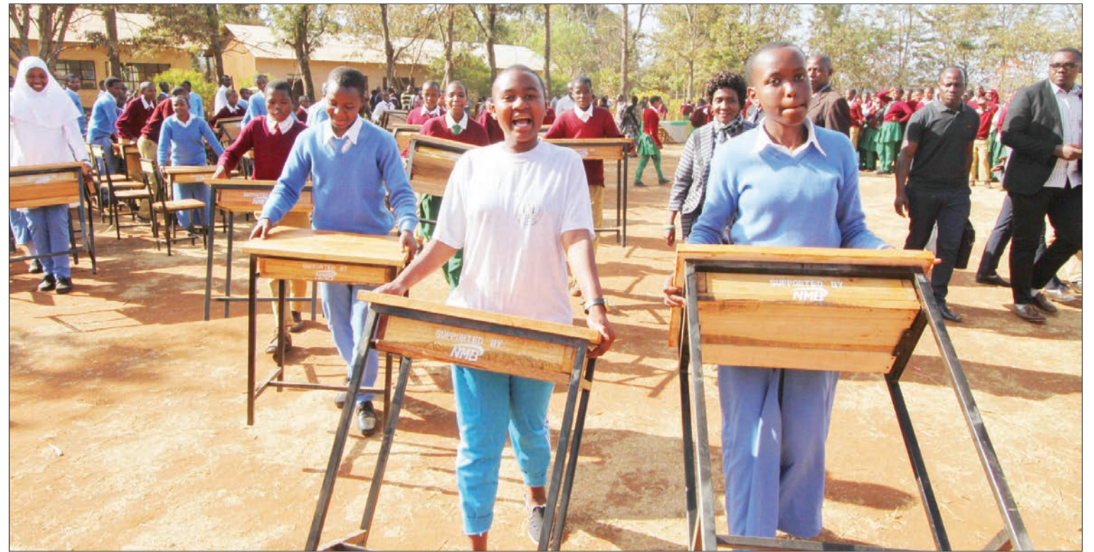
Students of Mbulu District's Chief Sarwat Secondary School visibly elated as they carry desks worth 5m/- donated to the school at the weekend by NMB Bank.