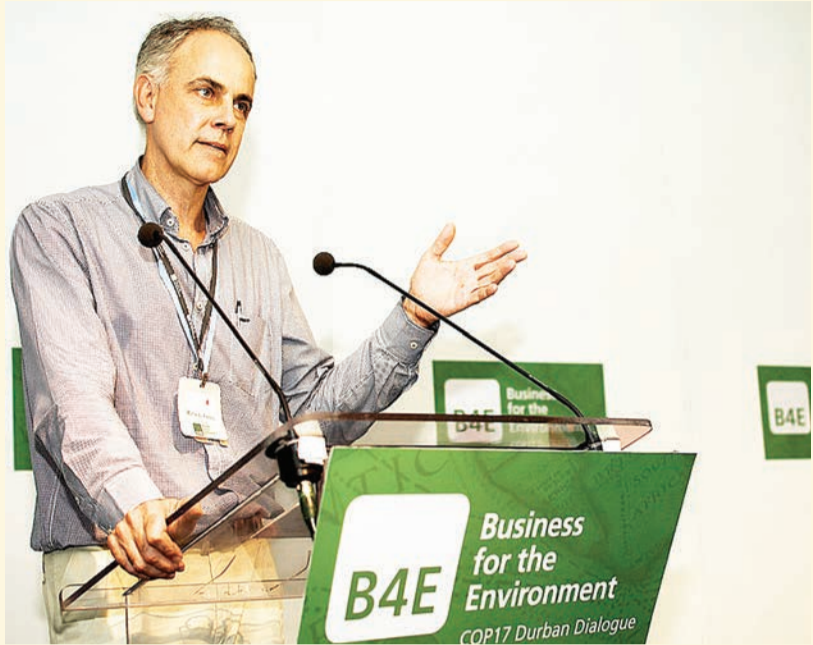
WWF South Africa CEO Morné du Plessis.