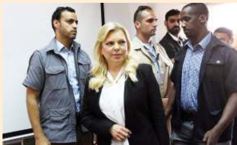
Israeli Prime Minister Benjamin Netanyahu's wife, Sara, arrives in to the Magistrate Court, for a hearing on a plea deal over the misuse of state funds for meals, in Jerusalem yesterday.

over Sara Netanyahu, it has no direct bearing on the prime minister's own troubles - three corruption cases in which he has denied wrongdoing.