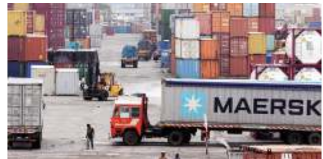
Containers are piled up at a terminal at the Jawaharlal Nehru Port Trust in Mumbai, India. Higher tariffs on 28 US products including almonds, apples and walnuts take effect from Sunday.

New Delhi's new rules in areas such as e-commerce and data localisation have already angered the US and hit companies such as Amazon, Walmart, Mastercard and Visa, among others.