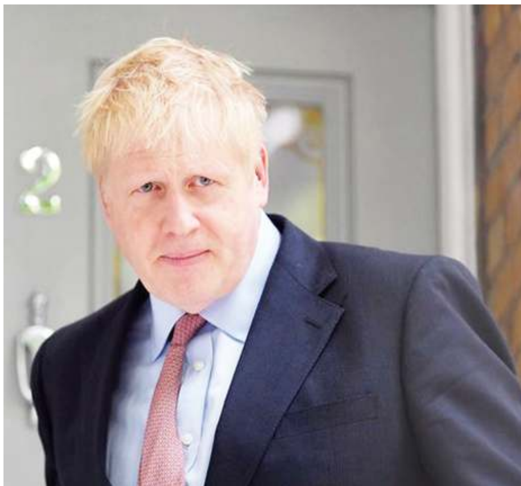
Boris Johnson, leadership candidate for Britain's Conservative Prime Minister, leaves home in London, Britain, on Saturday.

Almost three years since Britain voted to leave the EU, the country, the parliament and both of the main parties are still deeply divided over how,