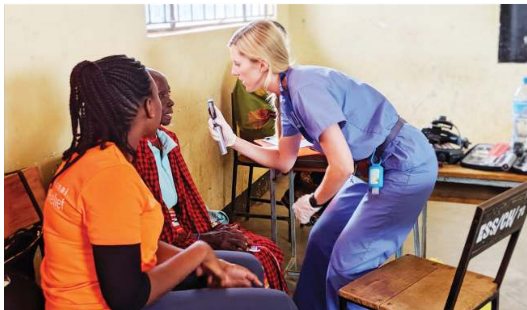
An International Medical Relief surgeon examines residents of Sasi village in Arumeru District at the weekend. The US-based NGO provides mobile medical clinics and sustainable health education to underserved communities in more than 50 countries around the world. It offers short-term assignments for volunteer medical and dental professionals, students and non-medical volunteers to conduct medical and dental clinics that provide free, expert care and health education in areas where it is limited or difficult to obtain.