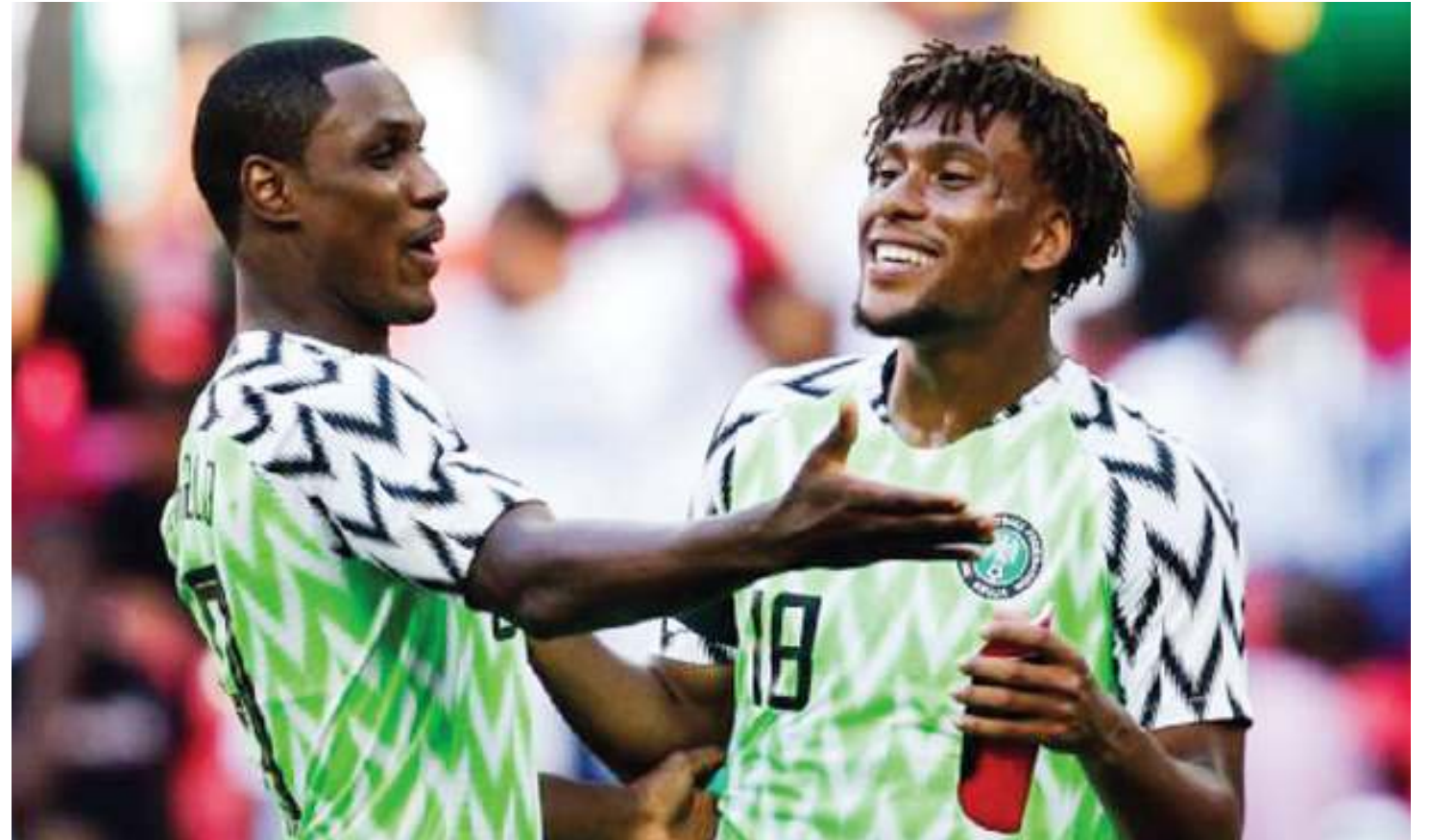
Odion Ighalo (L) and Alex Iwobi form part of the Nigeria frontline, and both will be eager to rack up the goals on the way to an Afcon title in Egypt.

Ighalo is the typical, old-fashioned centre forward who led the rest of the African field in goals scored during qualifying, rattling off seven goals during the series. He offers brute strength, close quarters combat, headed