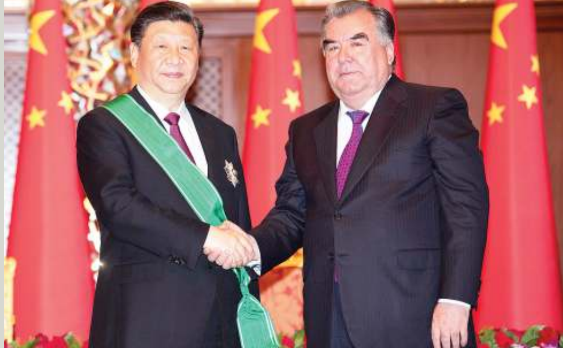
Chinese President Xi Jinping (L) receives the Order of the Crown, Tajikistan's highest decoration, from Tajik President Emomali Rahmon during a ceremony in Dushanbe, Tajikistan on Saturday.

On the one hand, Asian countries all value mutual respect, consensus-building and accommodation of each other's comfort levels, which means it is fea-