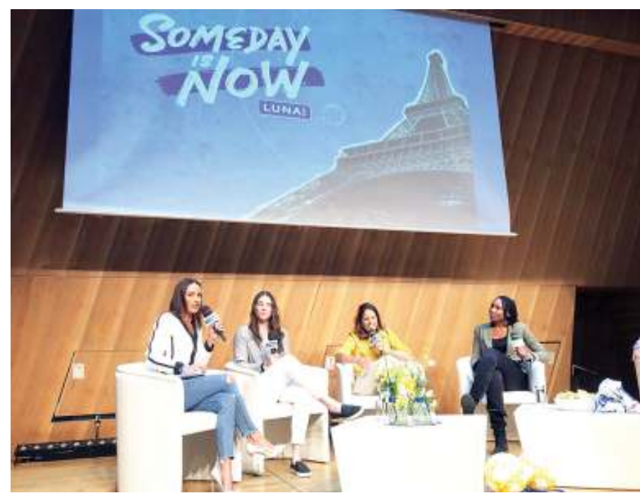
Panelist, from left, Catt Sadler, formerly of E!, hockey player Hilary Knight, retired soccer player and ESPN commentator Julie Foudy and tennis star Venus Williams discuss gender pay inequality Saturday, June 15, 2019, at a forum hosted by IUNA Bar at the Salon Gustave in the Eiffel Tower, Paris, France.

She said she quit when management refused to remedy the situation. Williams, a five-time Wimbledon and two-time U.S. open champion, got involved