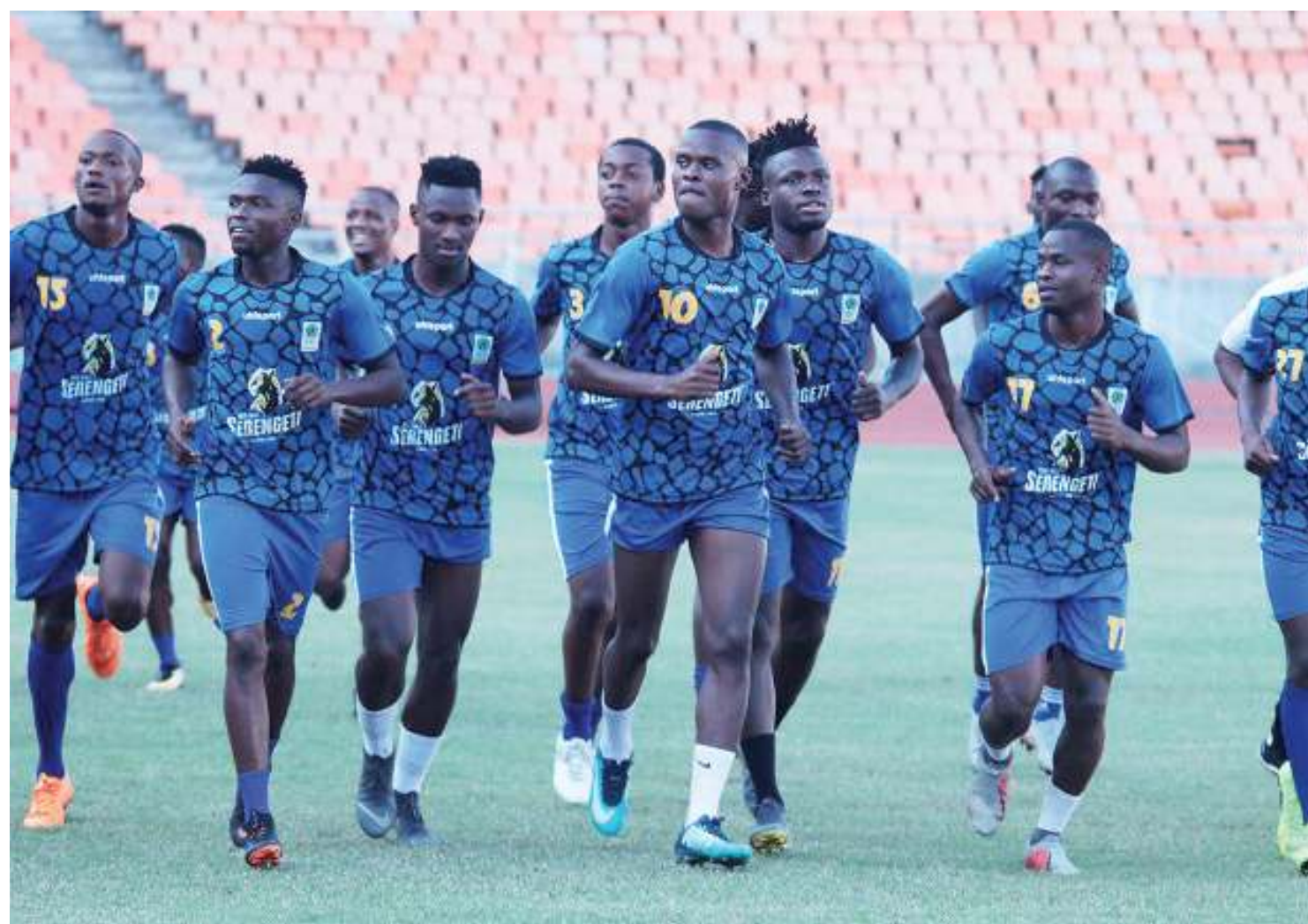
Senior national football team, Taifa Stars.