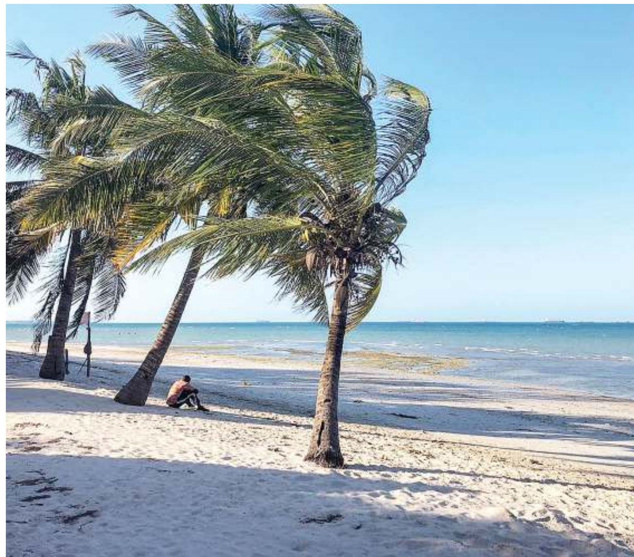
A beautiful and unspoiled beach on Kigamboni, with no buildings, bars with loud music, or anything to detract from its natural beauty...but fast forward to progress, and there's now a large beach resort, fenced off, and possibly off limits to locals unless they can pay the entrance fee. It's called 'development', and it's unstoppable. In Zanzibar, locals have to pay to access what used to be one of their islands, but was leased to investors, and is now a tourist destination. (File photo)

...and let's not forget, a former Mayor of dubious disposition, a decade and a half ago who said "Kivukoni beach could be improved by erecting shopping malls along the shore". Shocking...but god forbid it could still happen...the tarmac over of Tanzania...run for shares in the cement industries quickly, you readers!!