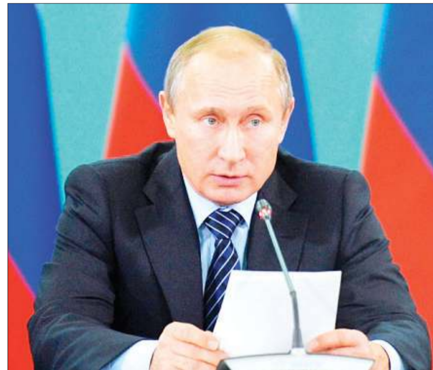
Russian President Vladimir Putin

"I request you to concentrate on achieving tangible results under all national projects so that people can feel positive changes in their life and, importantly, can themselves participate in this joint work and see that all our joint efforts are aimed at positive and qualitative changes in the life of