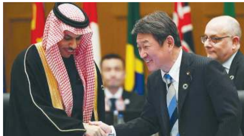
At a meeting in Nagoya, Japan's Foreign Minister Toshimitsu Motegi shakes hands with Saudi Arabia's Foreign Minister Prince Faisal bin Farhan to mark the handover to the kingdom as future host of the G20 forum.