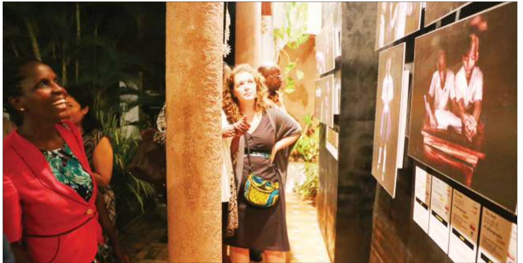
Dar es Salaam residents visit a photo exhibition dubbed The Dark Sight of Photography, which was primarily meant to spread messages to parents and the larger public on the need to communicate and improve the lives of children with disabilities. It was held at the weekend at the city's residence of the Italian Ambassador to Tanzania, Roberto Mengoni.

"From December 4 to 6, in partnership with experts from Switzerland, we will conduct parallel teacher's capacity building workshop on academic approaches to teaching science to pupils."