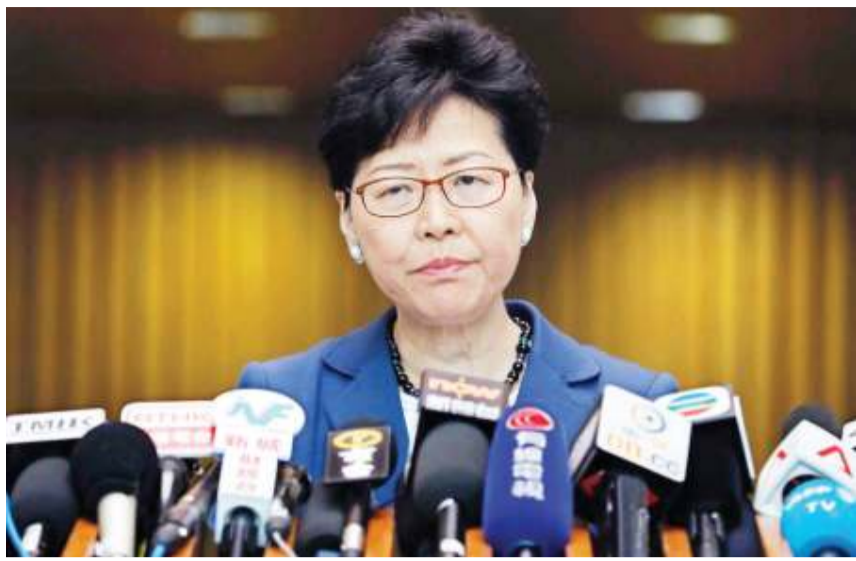
Hong Kong Chief Executive Carrie Lam