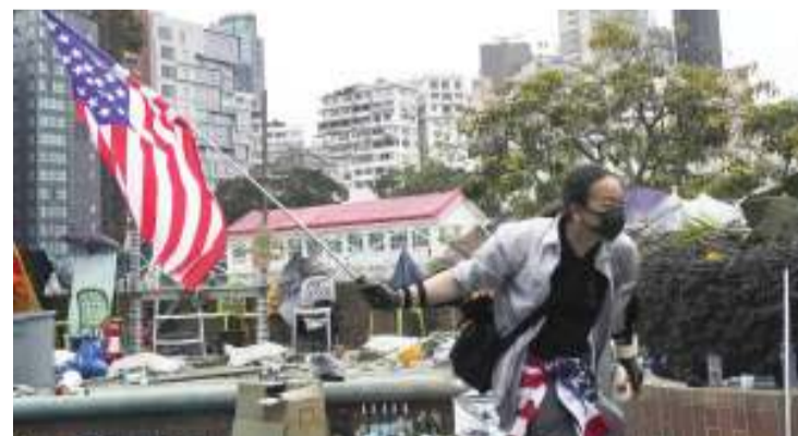
A protestor holds an American flag at Polytechnic University, where anti-government protesters and police are locked in a stand-off.

The US, however, turned a blind eye to the crimes committed by the radicals. Under the guise of human rights and free-