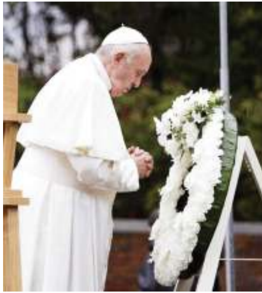
Pope Francis offers prayer after laying a wreath at the Atomic Bomb Hypocenter Park, yesterday, in Nagasaki, Japan.

"One of the deepest longings of the human heart is for security, peace and stability," he said. "The possession of nuclear and other weapons of mass destruction is not the answer to this desire; indeed they seem always to thwart it."