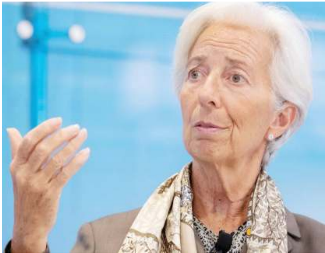
European Central Bank President Christine Lagarde.

"Investment is a particularly important part of the response to today's challenges, because it is both today's demand and tomorrow's supply," she said. "While investment needs are of course country-specific, there is today a cross-cutting case for investment in a common future that is more productive, more digital and