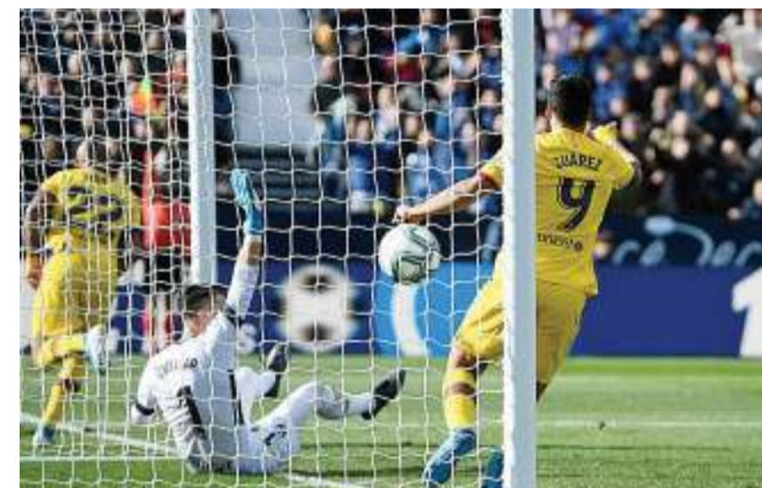
Arturo Vidal scored the winner as Barcelona came from behind to beat Leganes in La Liga

Odegaard impressed, with one through ball in the first half even