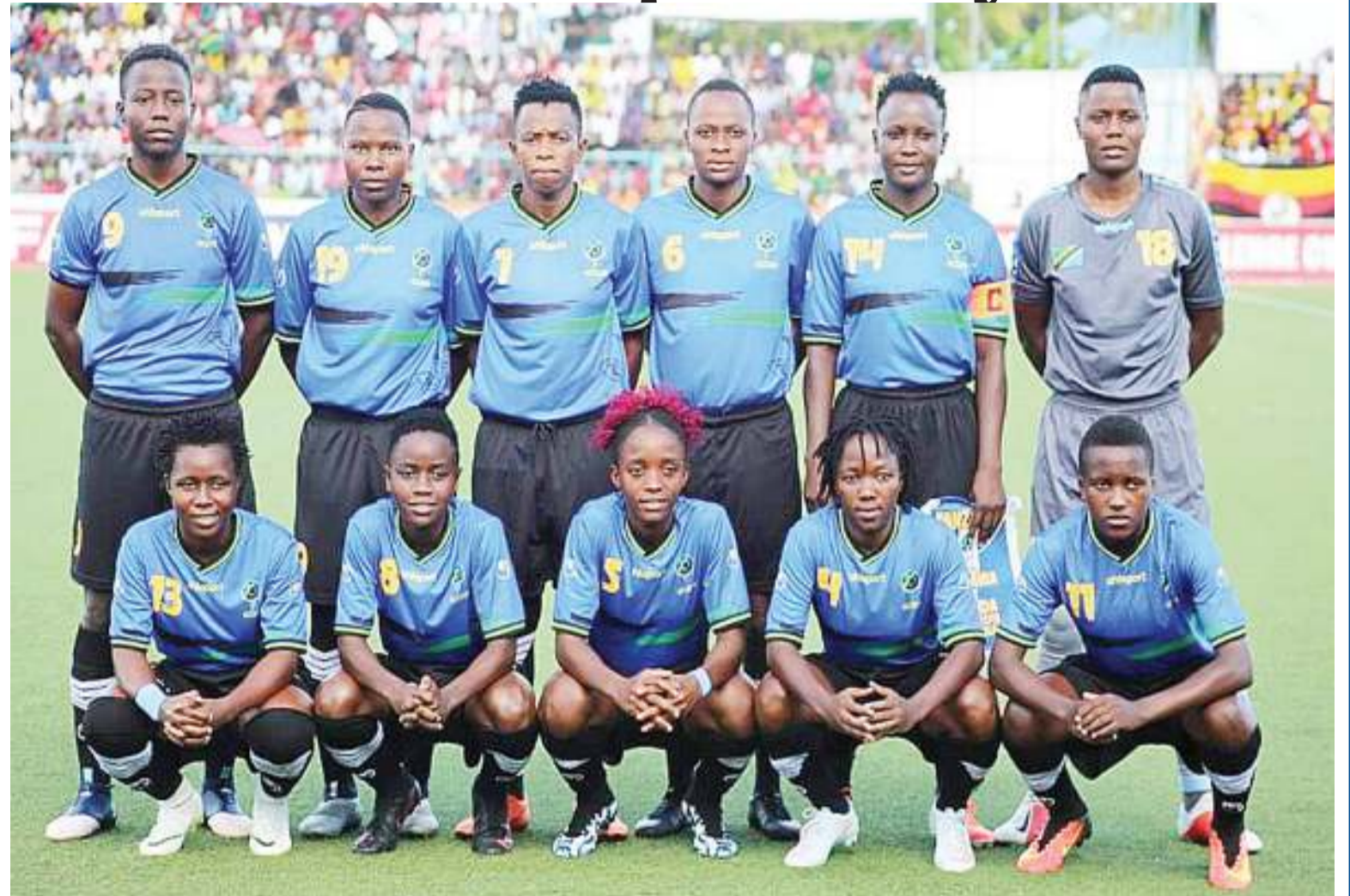
Mainland Tanzania women soccer team 'Kilimanjaro Queens'.