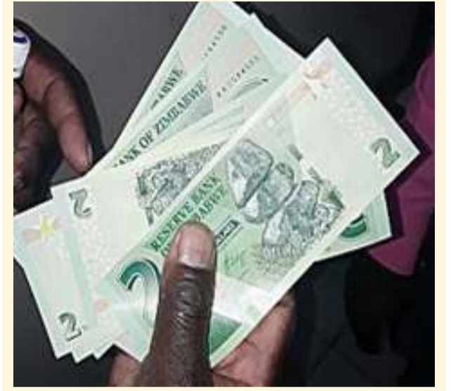
A man holds some of Zimbabwe's new bank notes.