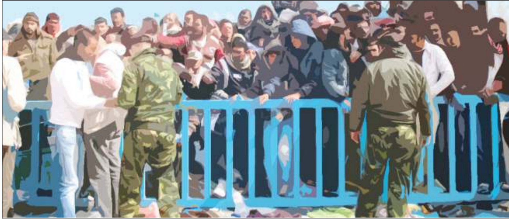
Security sector reform should tackle causes of migration, including the popular view that governments are unresponsive and unfair. File photo