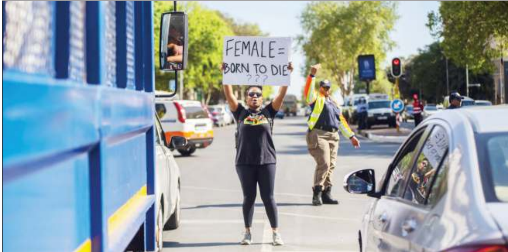
Protesters march against gender-based violence at the JSE in Sandton on 13 September 2019. File photo

Strategic Plan on Gender-Based Violence and Femicide.