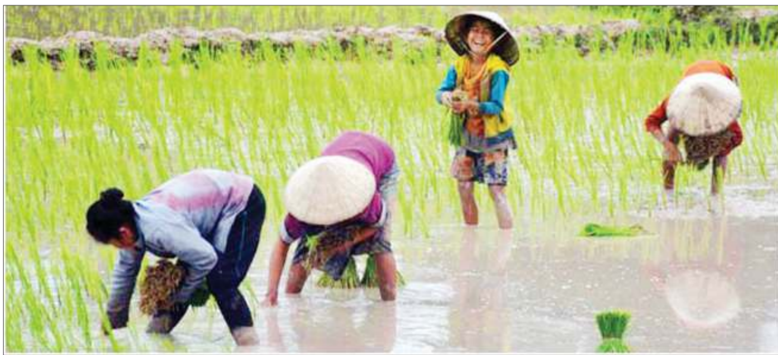
Villagers grow rain-fed rice in Beung Kiat Ngong wetlands, Lao People's Democratic Republic. File photo

CGIAR, which is the recipient of the $650 million funding, and formerly known as the Consultative Group for International Agricultural Research, has an annual research