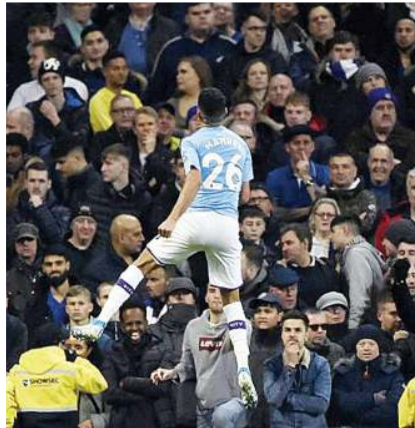
Manchester City's Riyad Mahrez celebrates after scoring his side's second goal during the English Premier League soccer match between Manchester City and Chelsea at Etihad stadium in Manchester, England, Saturday, Nov. 23, 2019.

Guardiola sounded the alarm over all-time top-scorer Sergio Agüero, who limped off in the second half, saying he feared his injury could be "bad".