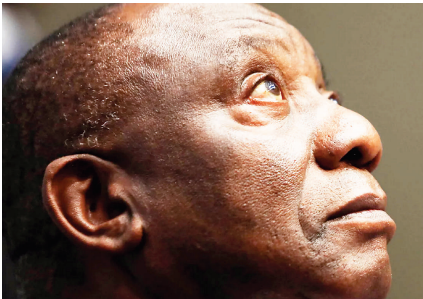
President Cyril Ramaphosa

that [Ramaphosa] should make himself available for another term to continue this programme of tackling corruption," Mashatile said.