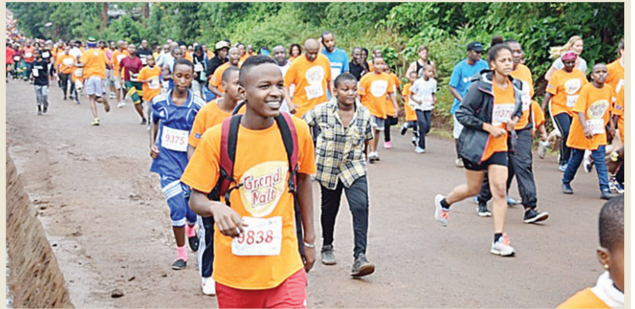
Runners take part in a recent 5km-Fun Run, which is part of the Kilimanjaro Marathon held in Moshi.

Meanwhile, according to the statement, preparations for the