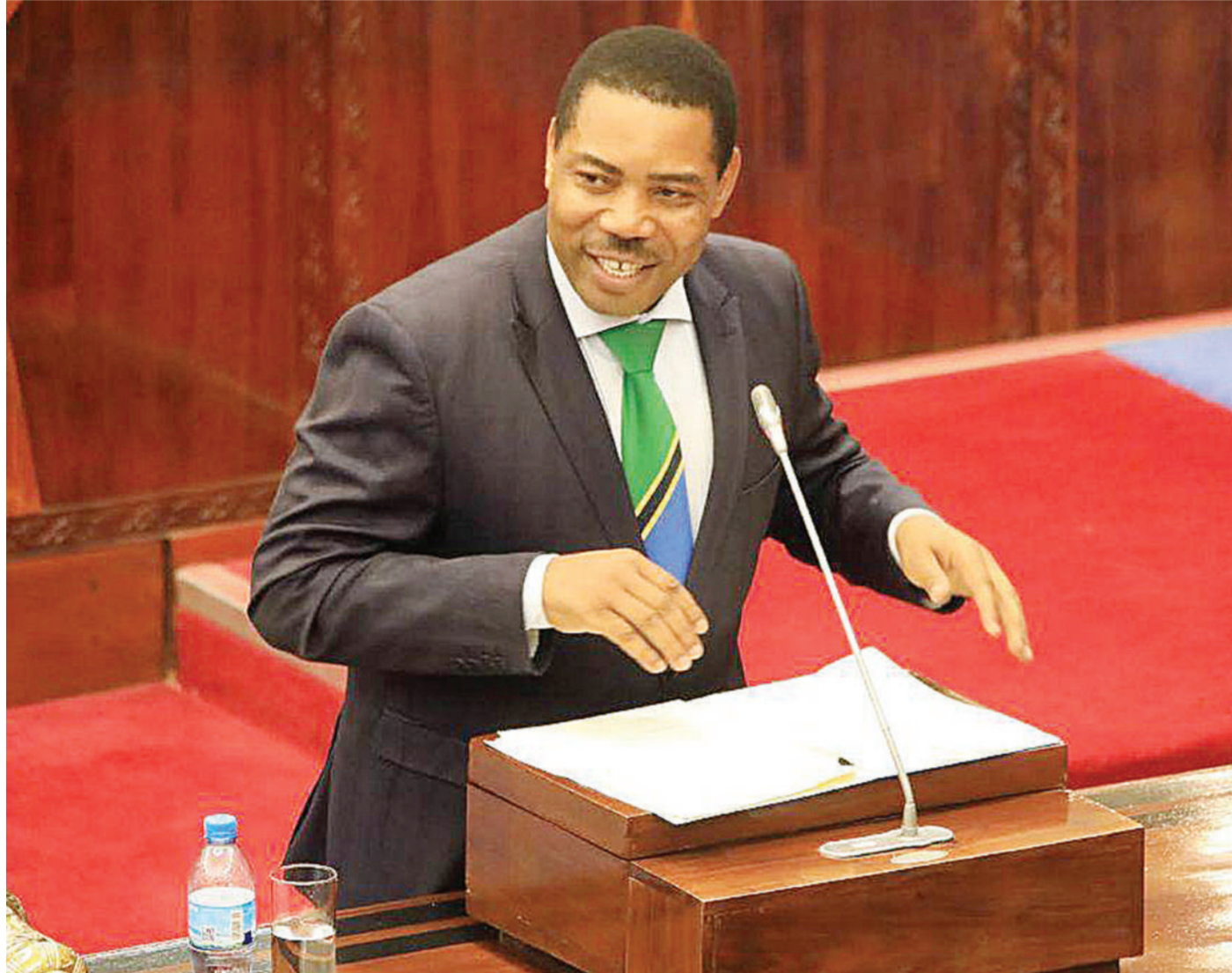
Finance and Planning minister Mwigulu Nchemba