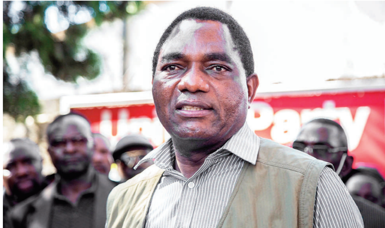
President Hakainde Hichilema declared a "new dawn" for Zambia.

Ultimately, though, it will probably be his efforts to repair the shattered economy he inherited that will determine how he's judged.