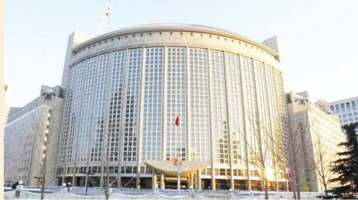
This undated photo shows the building of China's Foreign Ministry in Beijing.