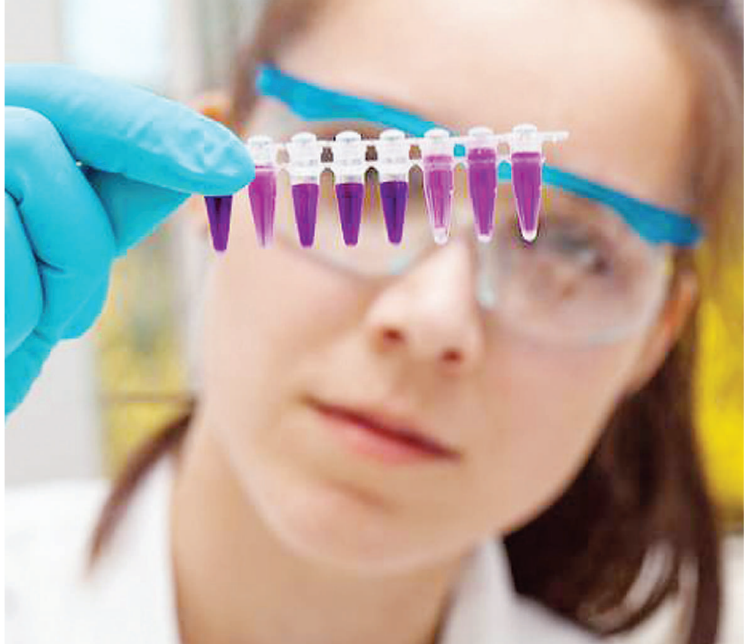
It makes good economic sense for countries to invest in and fully utilise their total populations.

There are big disciplinary differences in women's representation. This perpetuates fa-