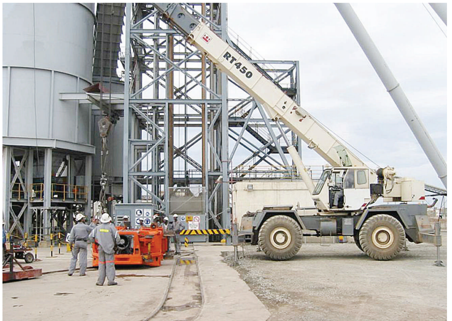
Bulyanhulu Gold Mine site