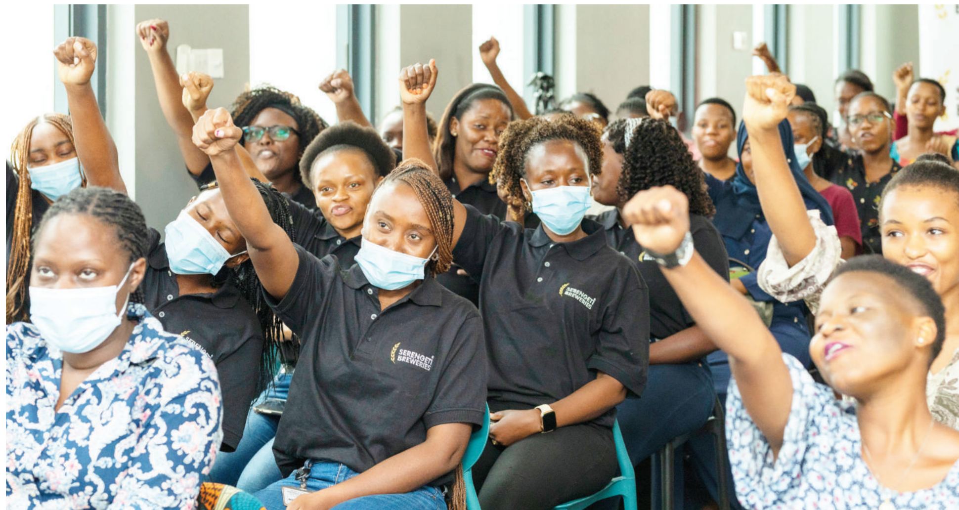
Beneficiaries of Serengeti Breweries Limited's Science Technology, Engineering and Mathematics (STEM) programme come together with girls pursuing science disciplines in various colleges and universities shortly after attending a workshop organised by the firm in commemorating International Day of Women and Girls in Science.

As they both affirmed "I do," a herd of elephants a few meters away looked up. Tree-climbing lions that are the trademark of Lake Manyara also looked down to the couple and possibly nodded too