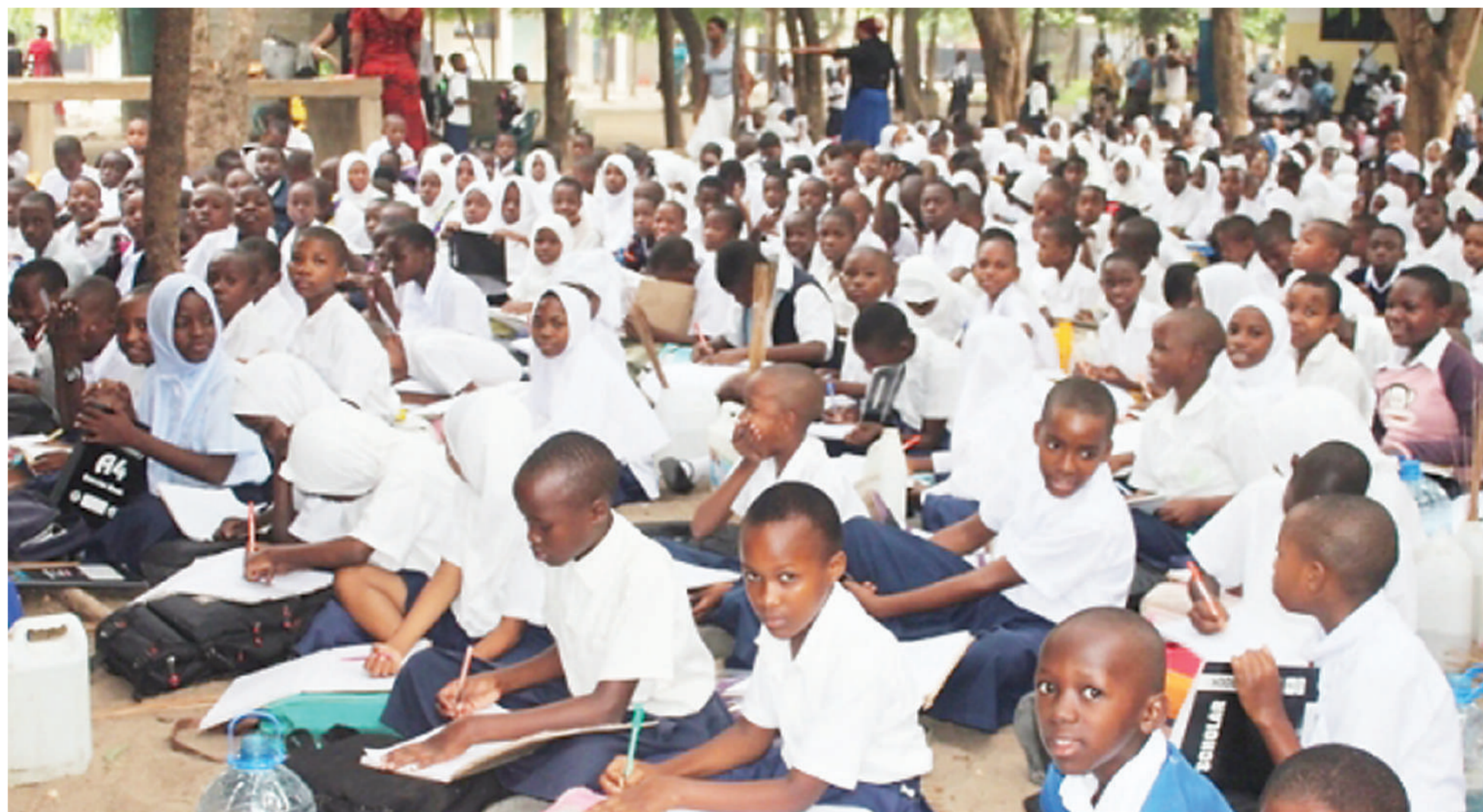
For children to concentrate fully on their studies, they must get enough nutritious food while in school.

A total of 53 local and foreign investors have been lined up to operate the projects, which promise to include skills and the ability to conserve the environment, biodiversity, cultural heritage and to ensure community development, said President Dr Hussein Ali Mwinyi in a televised speech to the nation recently, which marked 58 years of the Zanzibar Revolution. Wonderful!