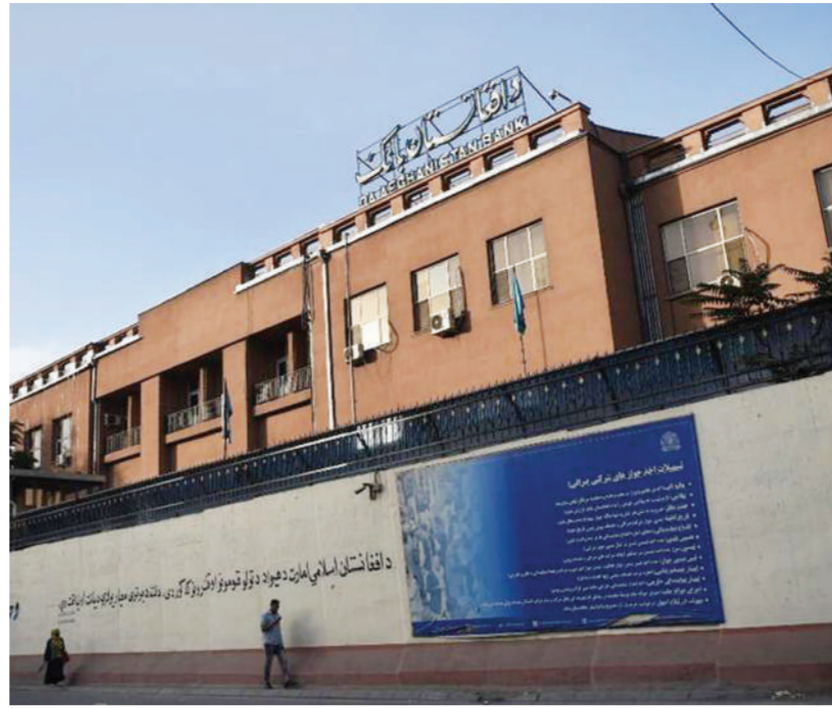
People walk past Da Afghanistan Bank building in Kabul on Oct 10, 2021. File photo