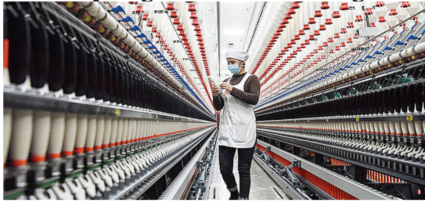
A staff member works in a textile factory at the integrated industrial park in Moyu County of Hotan, northwest China's Xinjiang Uygur Autonomous Region.

One of the country's industrial powerhouses, east China's Jiangsu Province, saw its total electricity use rise 18.27 percent year on year during the holiday, while Hubei, a key manufacturing base in China, reported a 36.45-percent year-on-year increase in power use.