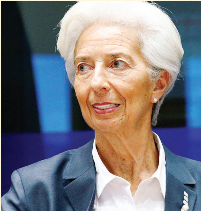
ECB chief Christine Lagarde