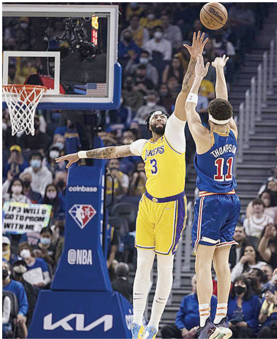
Los Angeles Lakers forward Anthony Davis (3) defends against a 3-point shot by Golden State Warriors guard Klay Thompson (11) during the first half of an NBA basketball game in San Francisco, Saturday, Feb. 12, 2022.