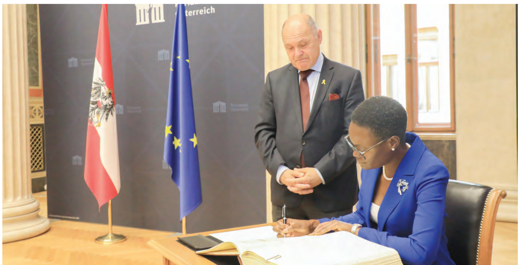
Dr Tulia Ackson, the Inter-Parliamentary Union (IPU) president and Speaker of the National Assembly, signs a record book at the Parliament of Austria in Vienna yesterday. Left is the Speaker of the Austrian Parliament, Wolfgang Sokotka.

They still experience significantly higher HIV prevalence rates than the general population, with an estimated 55 per cent of new HIV infections occurring among these populations and their partners. HIV-related deaths were still high as in 2022 there were 0.63m HIV related deaths, 13 per cent of these occurring in children under the age of 15 years, the report indicated.