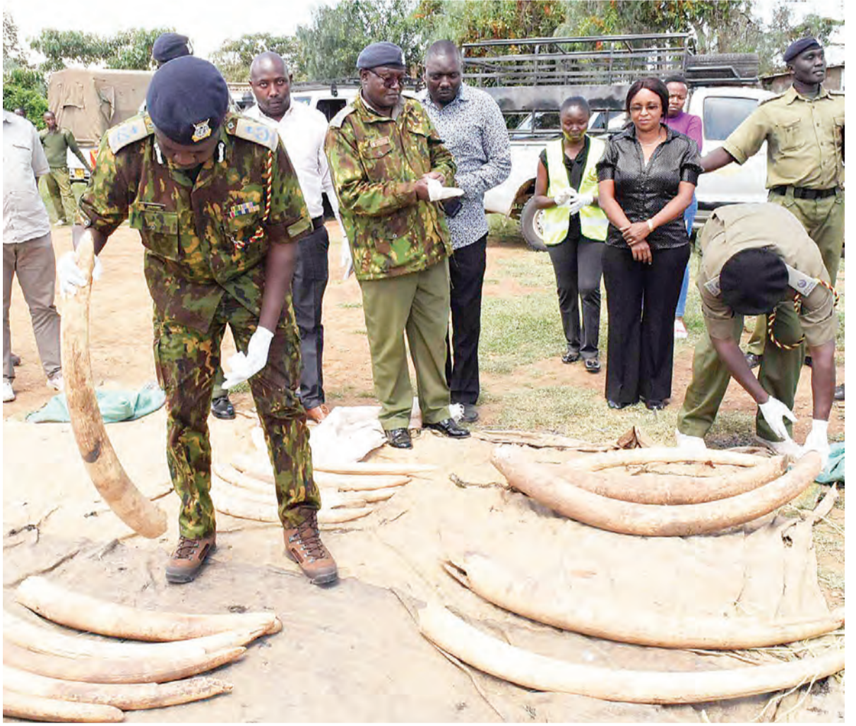
Police display elephant tusks that were seized at Mahiga area in Laikipia West, Kenya

Elephants, carnivores, ranked among the top five species groups seized in both Africa and Asia, indicating the