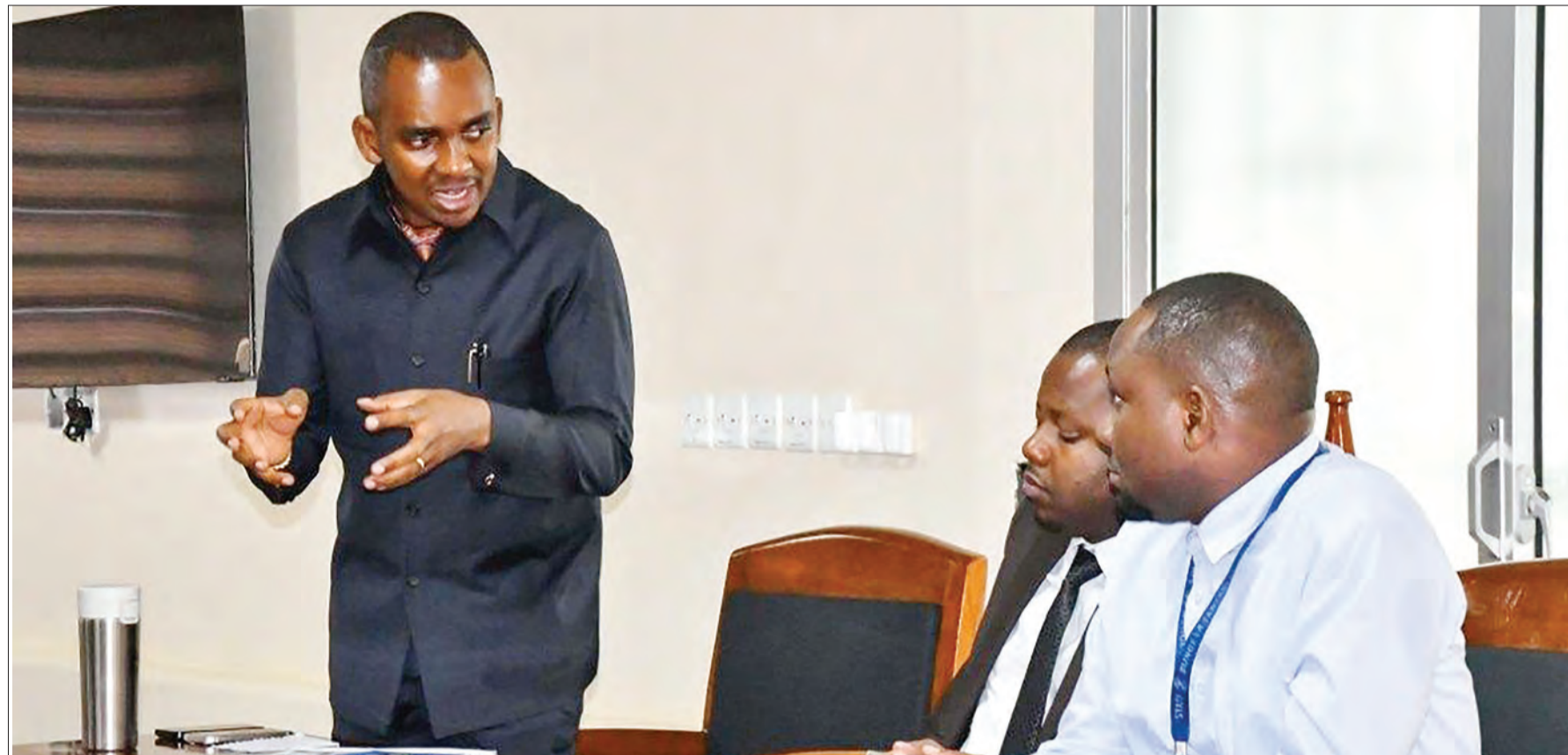
Jerry Silaa, the Lands, Housing and Human Settlement Development minister, stresses a point during a seminar for members of the Land, Natural Resources and Tourism standing committee of the National Assembly regarding implementation of the land tenure improvement project (LTIP) in the capital yesterday.

It was established in 1992 and works in the area of emergency assistance and relief to victims of natural disasters or armed conflict outside the European Union. It enables the EU to replenish DREF for agreed operations (that fit in with its humanitarian mandate) up to a total of €8m, an online entry noted.