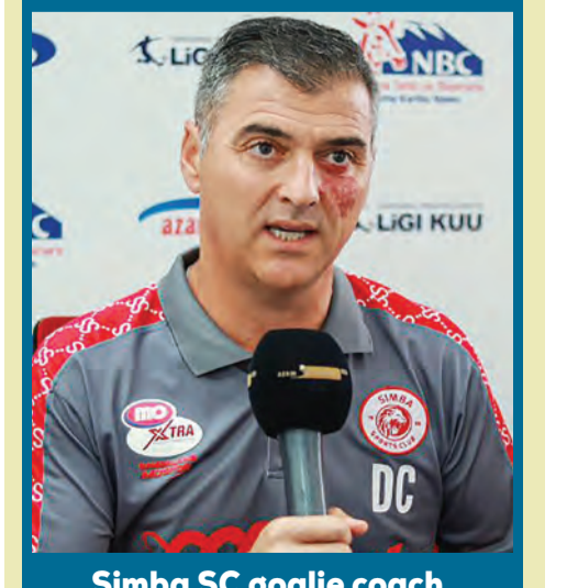
Simba SC goalie coach to leave at the end of the season