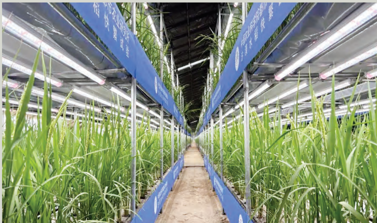
Photo shows rice cultivated in a desert greenhouse in Hotan, northwest China's Xinjiang Uygur autonomous region.