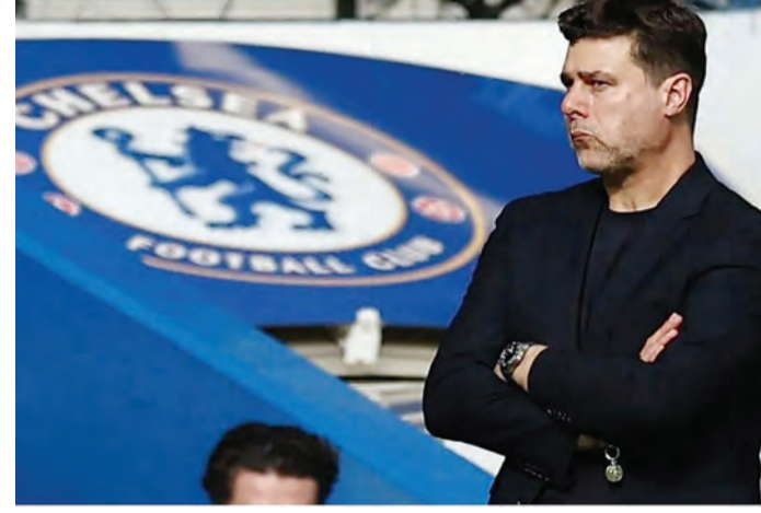
Despite overseeing a late-season surge to finish sixth and qualify for Europe – Mauricio Pochettino's time at the club has ended.