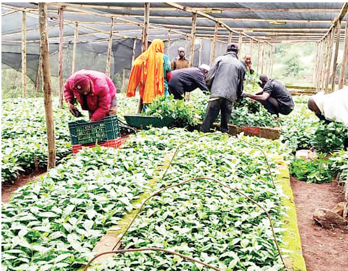
Farmers in a village in Lushoto District, Tanga Region, pictured at the weekend being issued with free coffee seedlings from the Tanzania Coffee Board's Jeggatali Information and Training Centre for Farmers.