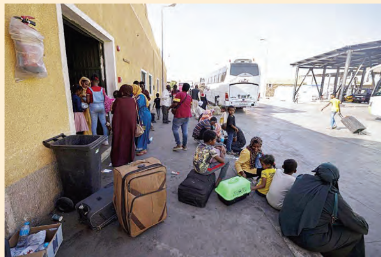
Passengers fleeing war-torn Sudan arrive at Qastal Lan Port crossing between Egypt and Sudan on Saturday.