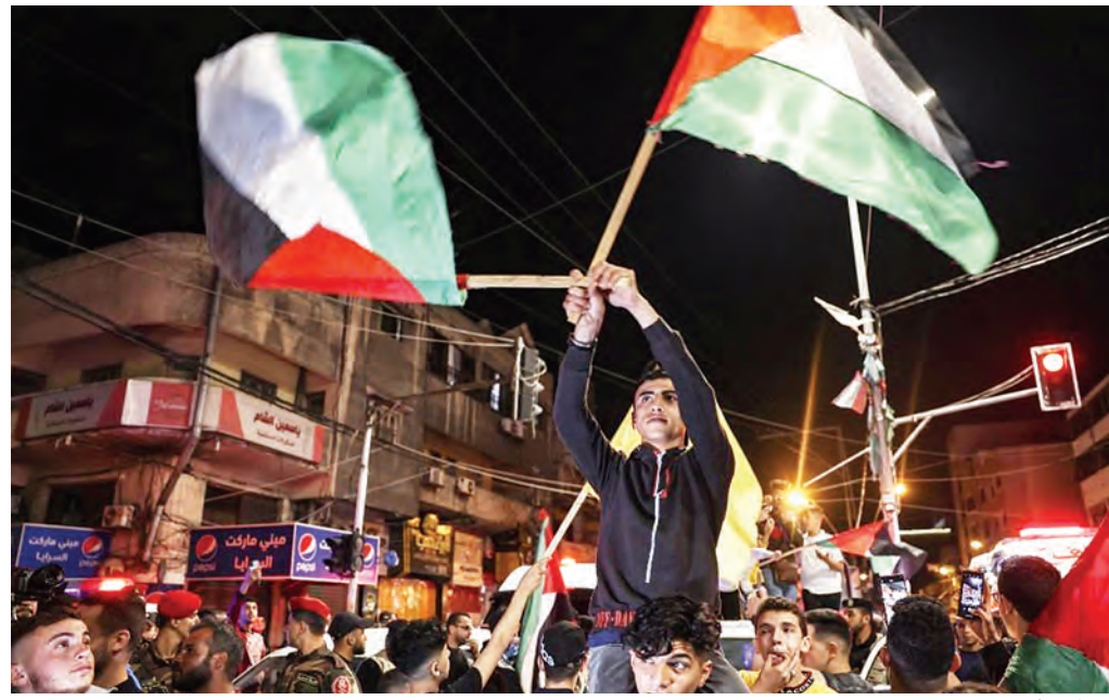
Palestinians and supporters of the Islamic Jihad militant group celebrate in the street after Palestinian factions and Israel reached a ceasefire agreement in Gaza City on May 13, 2023.

Even as the truce was being finalized, the two sides kept up firing, with air raid