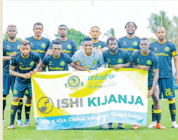
Yanga players are pictured with a banner bearing a message on the fight against cholera outbreak a few minutes before the kick-off of the 2022/23 NBC Premier League game between the outfit and Dodoma Jiji FC that took place at Azam Complex Stadium in Dar es Salaam on Sunday.

People were happy with the efforts done by Yanga to access the former and educate them about their health and the