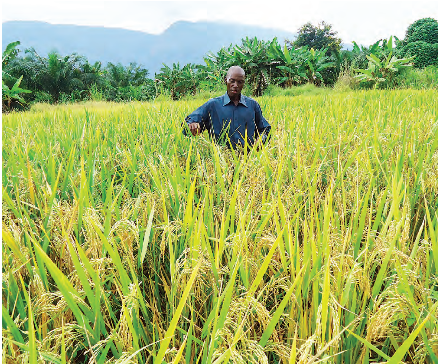
A farmer attends to a rice farm in Tanzania. File Photo

He said Tanzania is fully geared up to leverage its potential as a thriving food hub for Africa and the world, seizing the opportunity to make a substantial impact in ensuring global food security.