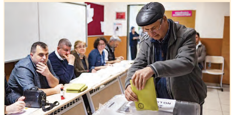
Voters cast their ballots for presidential and parliamentary elections at a polling station in Istanbul, Türkiye yesterday.

Meanwhile, a total of 24 political parties and 151 independent candidates are competing for seats in the 600-member Turkish parliament. Parties must obtain no less than 7 percent of the national vote, either on their own or in alliance with other parties, to enter parliament. Xinhua