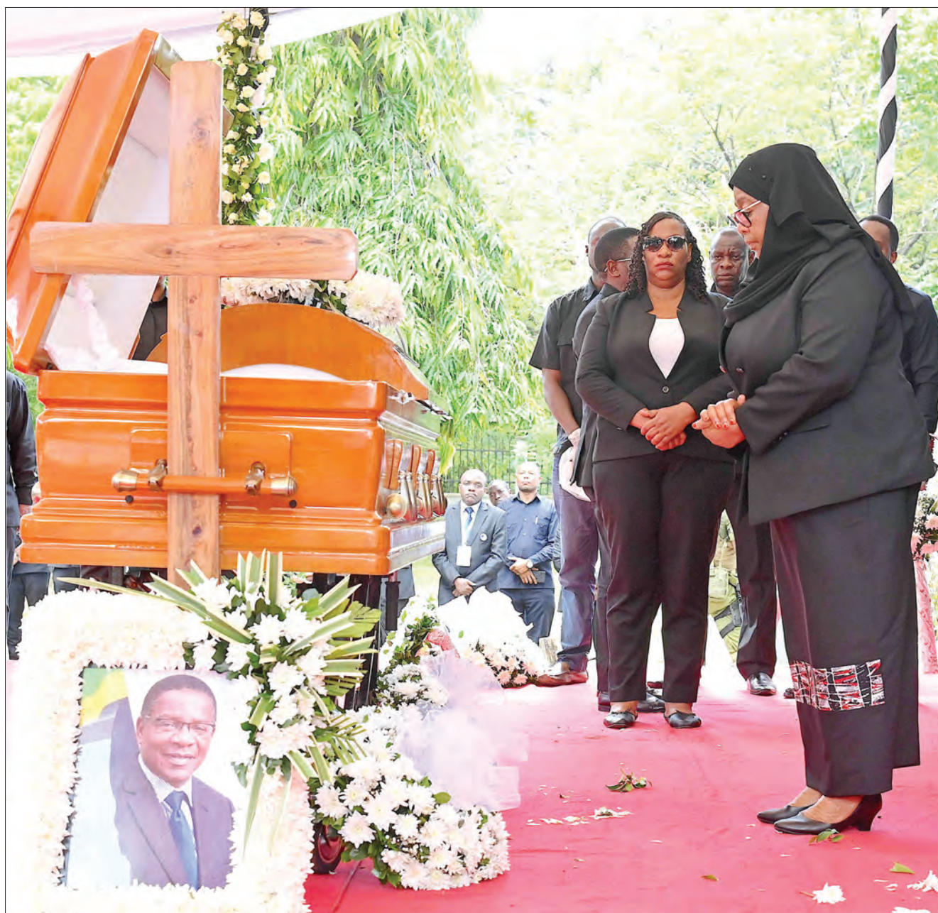
President Samia Suluhu Hassan pictured at the Karimjee Hall in Dar es Salaam yesterday paying her respects to one-time Foreign Affairs and East African Cooperation minister Bernard Kamilius Membe (69), who died on Friday morning while undergoing treatment in a hospital in the city. Hundreds of other mourners also similarly bid the former minister final farewell. Related photo on Page 2.

Membe died on Friday at the Hubert Kairuki Memorial Hospital where he was rushed for treatment. He will be buried tomorrow in his native Rondo village, Lindi region.