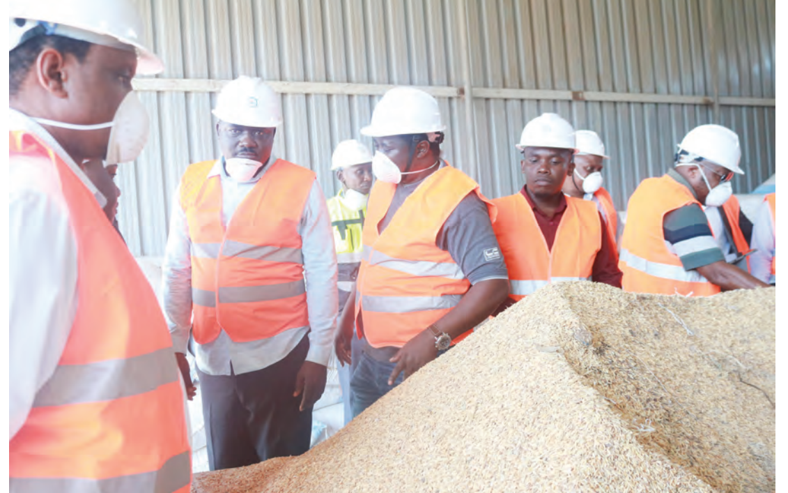
Members of Cereals and Other Produce Board (CPB) board of directors inspect rice expected to be processed at Mkuyuni in Mwanza Region.

He said CPB continues to establish factories, including two for processing cassava to be built in