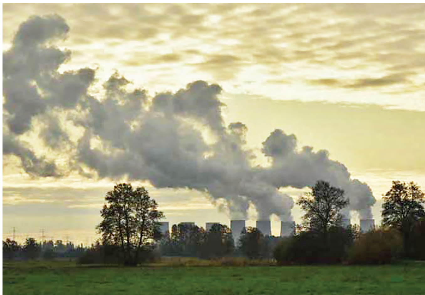
Carbon emission is one of the major causes for climate change. Countries should accelerate their effort to achieve carbon neutrality.

Through the Regional Cooperation Mechanism on Low Carbon Transport, we are working with the public and private sector to lock in the changeover to low-car-