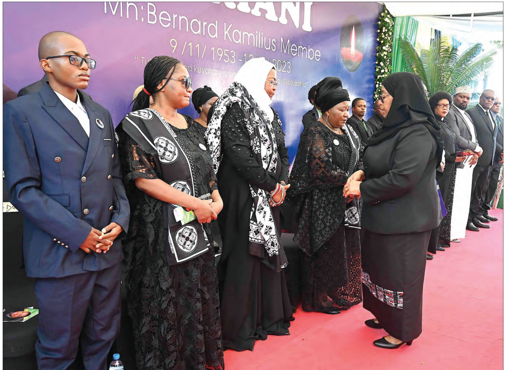
President Samia Suluhu Hassan consoles members of the family of one-time Foreign Affairs and East African Cooperation minister Bernard Membe shortly after he led hundreds of mourners in paying their respects to him in Dar es Salaam yesterday. Membe (69) died on Friday morning while undergoing treatment in a hospital in the city.

Vodacom, MIC-Tigo, Airtel, Halotel and MIC-Zantel were above targets on call setup time in 18 measured service areas, while TTCL failed to reach targets in Mafinga and Mara, the statement added/