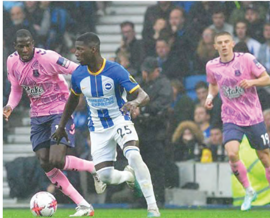
Moises Caicedo has established himself as one of the Premier League's most dynamic and exciting midfielders.

It did not take long for De Zerbi to form a strong opinion of Caicedo. The