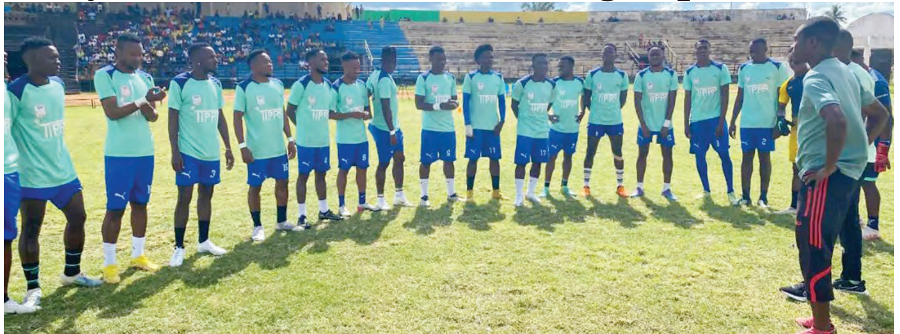
Kitayosce FC players listen to their coaches' instructions when they were shaping up for a past Championship League tie at Ali Hassan Mwinyi Stadium in Tabora.