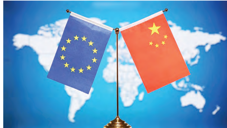
Flags of China and the European Union are seen in this photo.

China accounts for 20 percent of the EU's imports and receives 9