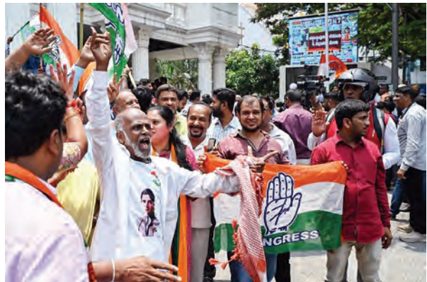
Congress supporters celebrate the party's victory in the Karnataka state legislative assembly election in front of the Karnataka Pradesh Congress Committee (KPCC) office in Bengaluru on Saturday.