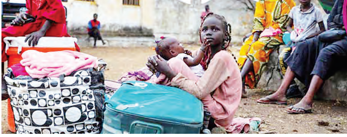
A UNHCR emergency transit centre in Renk, South Sudan receives displaced people from Sudan. According to the UN, Sudan has a population of 48 million and is the third largest on the African continent.

The United Nations High Commissioner for Refugees (UNHCR) estimated some 50,000 people to have crossed the border into Egypt