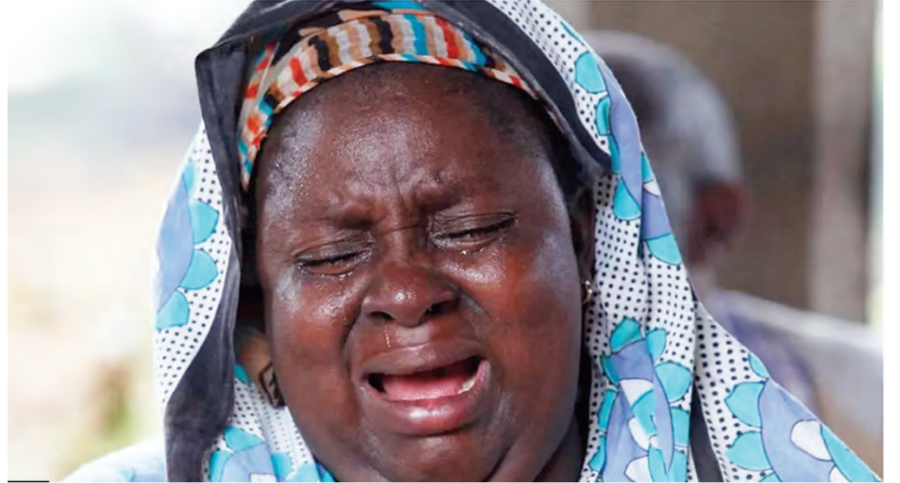
Family members of those who died in the cult have been mourning