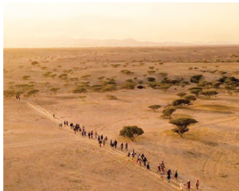
Many migrants cross deserts to reach their destination (file photo).

I did not end up going back for the appointment because, after going through that experience, I did not believe I would get the support I needed. The lesson I took away was that I couldn't rely on INGOs for support and care when in need of ur-