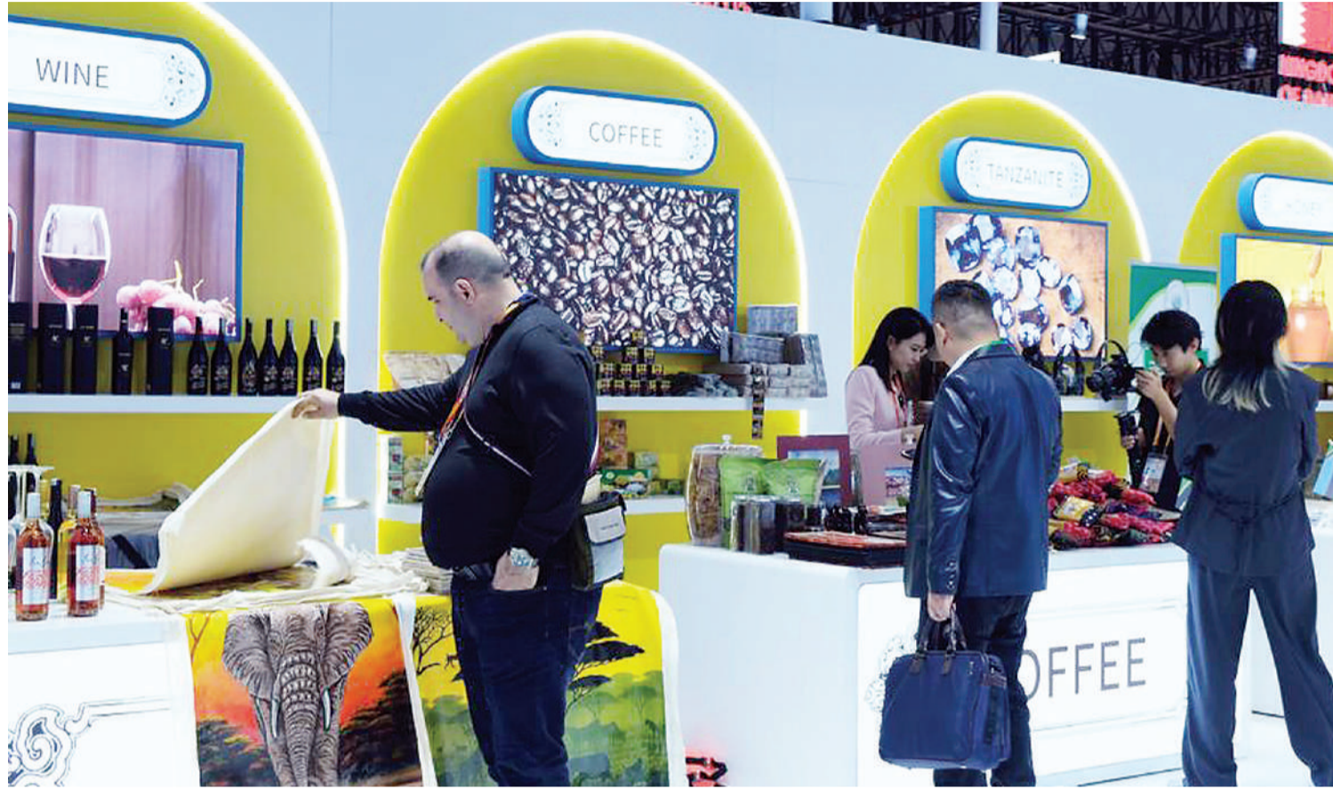
People visit the Tanzania Pavilion during the seventh China International Import Expo (CIIE) in east China's Shanghai, Nov. 5, 2024.

at least double its growth in the next three to five years.