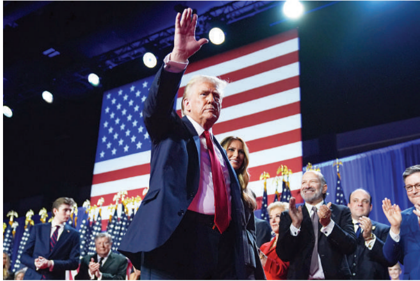
Republican presidential nominee former President Donald Trump waves as he walks with former first lady Melania Trump at an election night watch party at the Palm Beach Convention Center on Wednesday in West Palm Beach, Florida.

Hispanics also tend to be younger than average in America, which means many have had less time to build wealth and have also been more exposed to the economic troubles of recent years, including high inflation and soaring interest rates for mortgages. Trump won