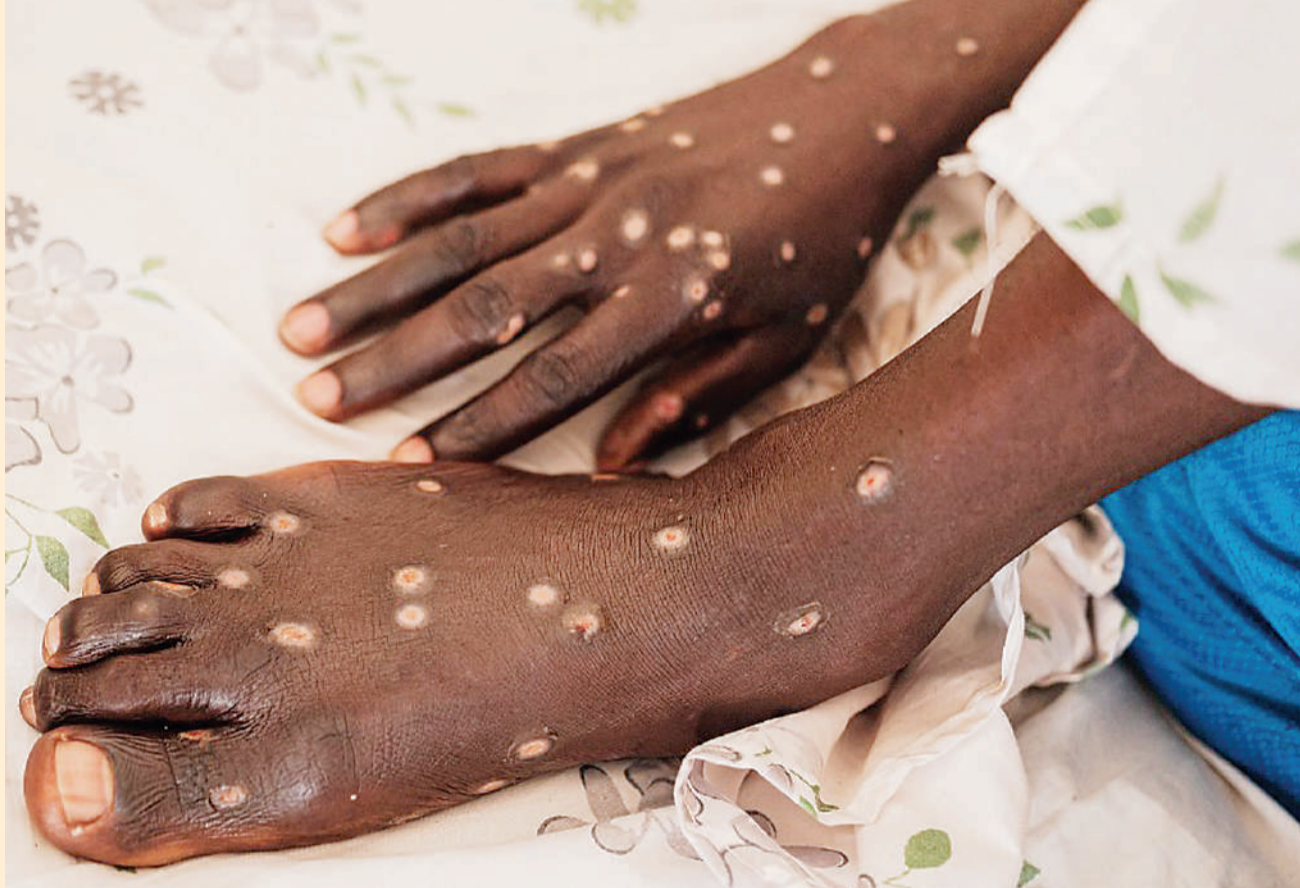
A man infected with mpox lies on a bed inside a ward at the Kamenge University Hospital's mpox treatment center in Bujumbura, Burundi, on Aug 22, 2024.

The allocated vaccines are from European countries, the United States, Canada and Gavi, a public-private alliance that co-funds vaccine purchases for low-