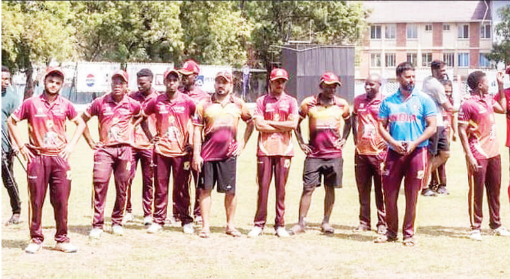
Aces A cricket team.