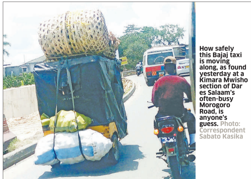
How safely this Bajaj taxi is moving along, as found yesterday at a Kimara Mwisho section of Dar es Salaam's often-busy Morogoro Road, is anyone's guess.

According to the latest WHO figures, there have been more than 46,000 confirmed and suspected cases of mpox in Africa this year, and more than 1,000 deaths in the continent due to the viral illness.