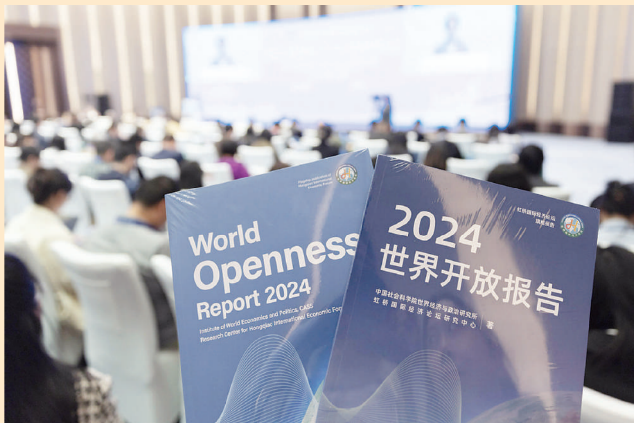
The World Openness Report 2024 is pictured at the press conference on World Openness Report 2024 and International Symposium on World Opening-Up during the 7th Hongqiao International Economic Forum in Shanghai.

According to the report, in terms of global openness, the index continued to decline in 2023, dropping 0.12 percent year-on-year to 0.7542.