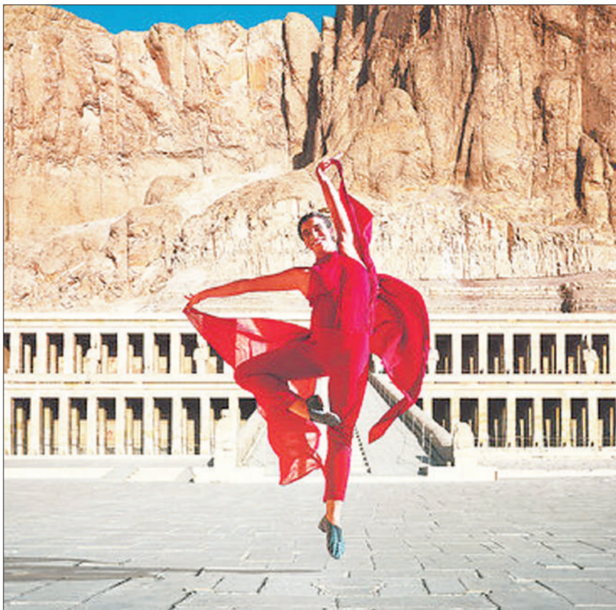
A dancer takes to the air against the backdrop of an ancient Egyptian temple.

They are actively marketing Egypt as a diverse destination, both online and offline, offering experiences beyond the traditional visits to the pyramids. More Chinese tourists are