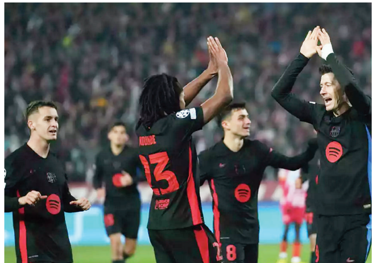
Barcelona's Robert Lewandowski (R) celebrates after scoring during the Champions League opening phase soccer match between Red Star and Barcelona at the Rajko Mitic Stadium in Belgrade, Serbia, Wednesday, Nov. 6, 2024.

Liverpool, which on Tuesday routed Bayer Leverkusen 4-0, leads the standings at the midway point of the