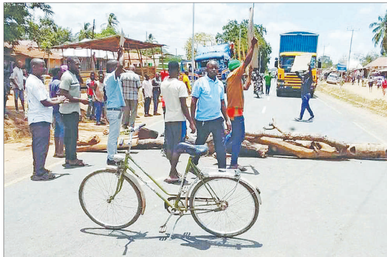
Residents of Ndanda ward in Masasi District block a section of Masasi-Mtwara-Lindi road with logs on Wednesday, rendering it temporarily impassable to vehicular traffic. Sources said it was in connection with delays in payments for cashewnuts sold during the first and second auctions of the 2024/2025 crop season.