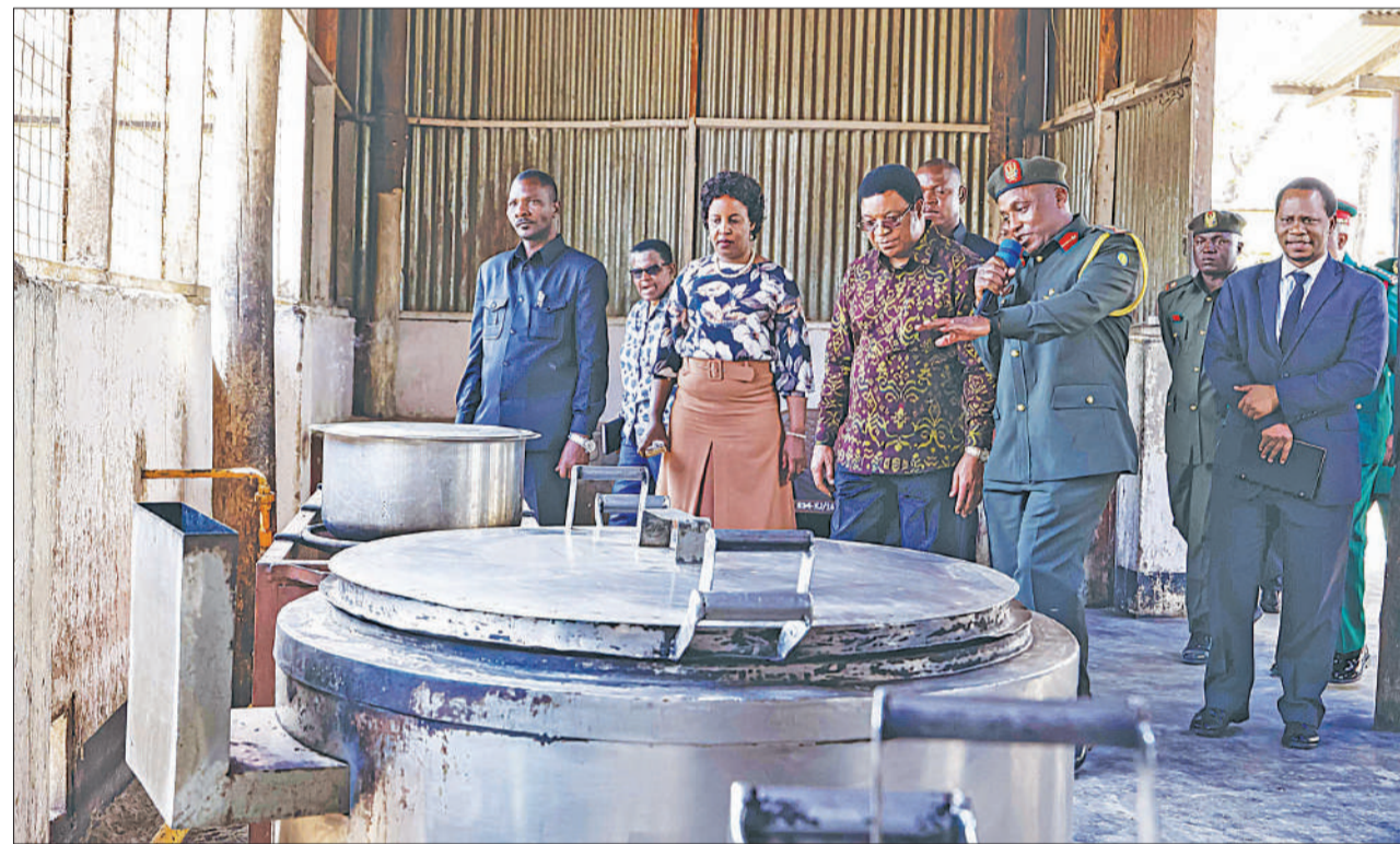
Colonel Festo Mbanga of the Tanzania People Defence Forces briefs Prime Minister Kassim Majaliwa in Dodoma city yesterday as the PM made an assessment tour of progress in the use of clean energy in cooking in line with President Samia Suluhu Hassan's directive to all government institutions serving more than 100 people to turn to the option.

A Global Status Report on road safety for 2023 issued by the World Health Organisation (WHO) said road traffic injuries are the most noticeable death factor among people aged 5-29 years