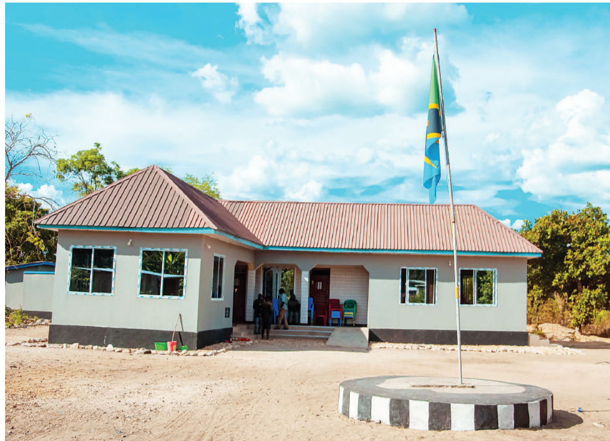
Villagers in Mtawatawa have constructed their own office with funds collected from selling forest products.

Liwale is one of the districts where all its forests are covered by native trees; he said adding that buyers prefer two types of trees which are 'Mninga' and 'Mkongo'. A few of them would ask for 'Mtondoro', he added.