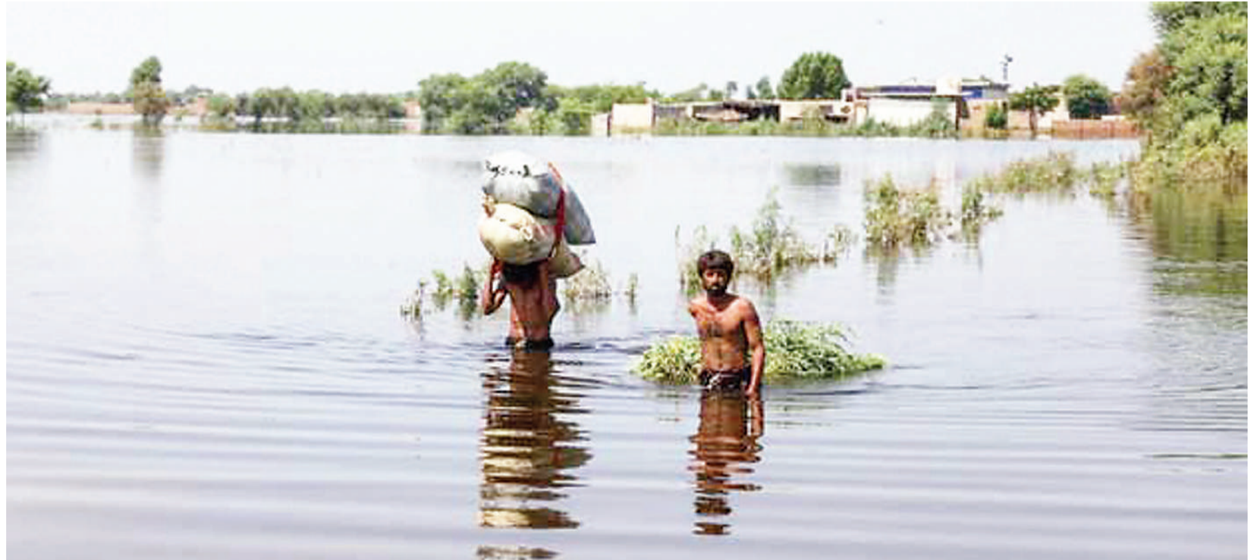
Cart laden with firewood in Gonzoma, Zimbabwe. Woodpoaching for household fuel is having an impact on forests in Zimbabwe.

THE United Nations Environment Programme's (UNEP) 2024 Adaptation Gap Report has warned that adaptation actions are not keeping pace with the surging demands of a warming planet. Released ahead of the COP29 climate conference in Baku, Azerbaijan, the report—titled Come Hell and High Water —projected a bleak future where vulnerable communities bear the brunt of climate-induced hardships.