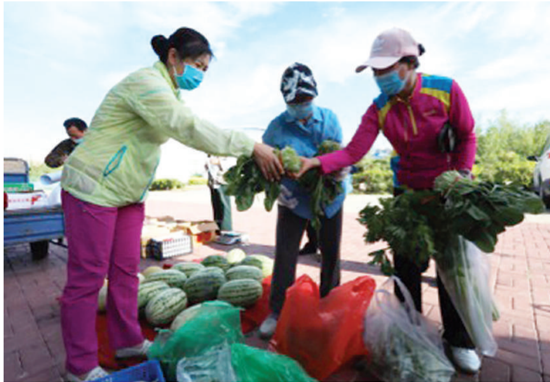
Residents in a community of Shuanghe, Xinjiang Uygur Autonomous Region, purchase vegetables and fruits amid the city's lockdown on July 29. (File Photo)

domestically, China has strived to build a global community of shared future amid the pandemic, which is also one of its attempts to safeguard human rights.