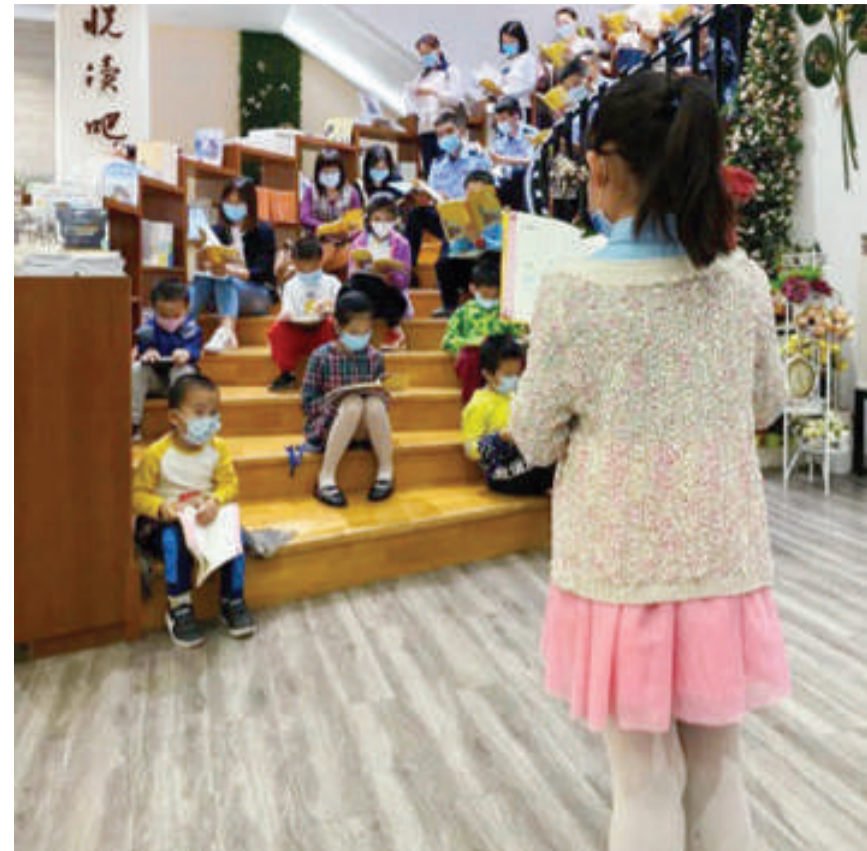
Readers read at a bookstore in Xinhui, Jiangmen, Guangdong Province, during the "Reading Half Hour" activity held by the Shenzhen Library.