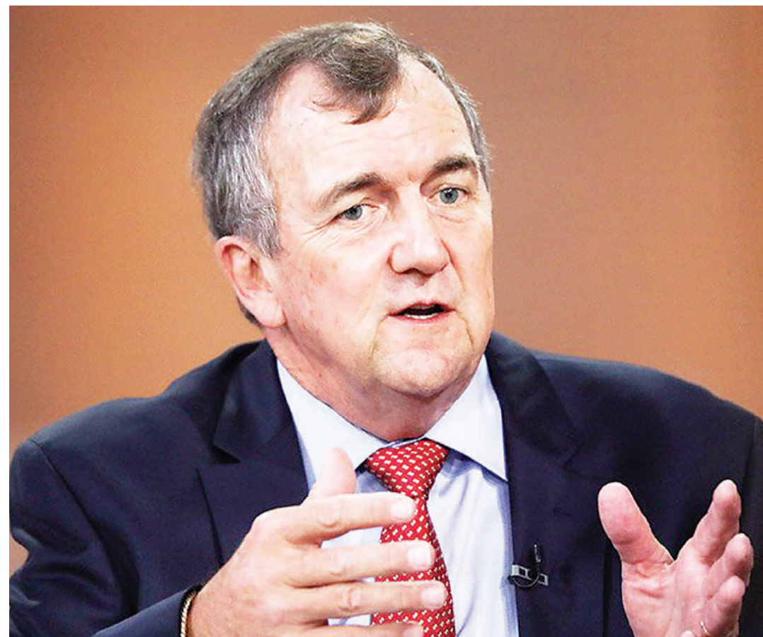
Barrick Gold Corp's CEO, Mark Bristow

“It's the best deal that Papua New Guinea has in its resource base today,” Bristow said. On the earnings call, Bristow said the company would continue to pursue deal-making