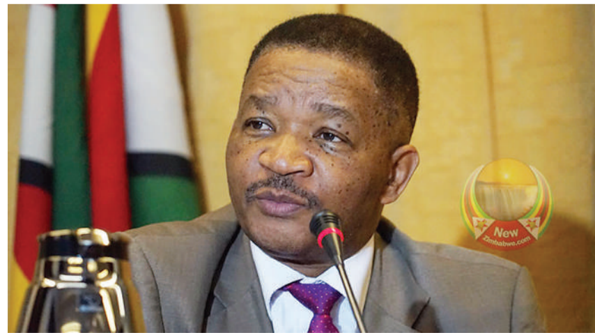
Zimbabwean Transport and Infrastructure Development Minister Joel Matiza.

that once that have been signed both countries can enjoy the fruits, but as it stands we had been informed that it's a matter of signing an agreement not a Memorandum of Understanding.