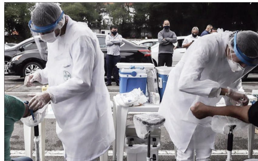
Medical workers conduct COVID-19 tests for taxi drivers in Sao Paulo, Brazil, June 26, 2020.

Meanwhile, the pandemic is also grave in other regions around the world. Brazil, the second hardest-hit in the world, has registered more than 3 million confirmed cases and 100,000