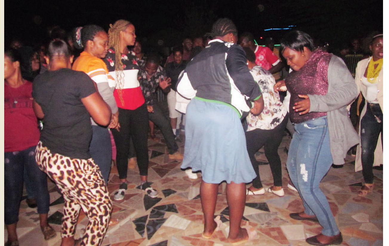
Music fans dance to a track performed by Waluguru Original Band at the troupe's new album launch, which took place in Morogoro last Friday.

The show also served as an opportunity for the Dar es Salaam-based troupe to introduce itself to