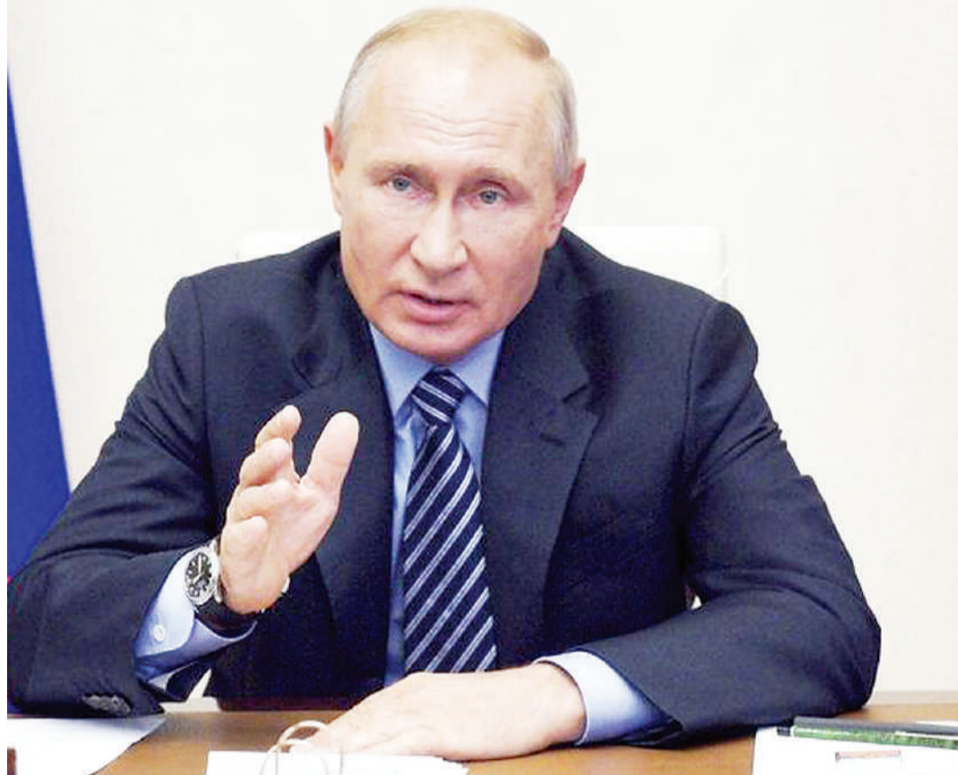
President Vladimir Putin

Russian health workers treating COVID-19 patients will be offered the