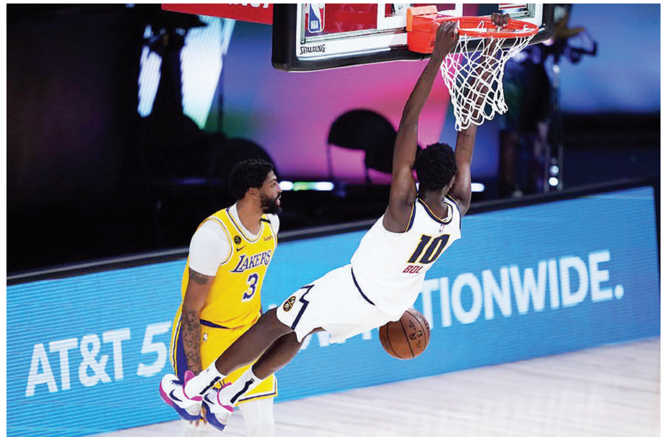
Denver Nuggets' Bol Bol (10) hangs on the rim after a dunk during the second half of an NBA basketball game against the Los Angeles Lakers, Monday, Aug. 10, 2020, in Lake Buena Vista, Fla.

Dozier scored 18 and Michael Porter Jr. had 15 for the Nuggets, who are currently the No. 3 seed in the West. "I couldn't be more proud of our group," Denver coach Michael Malone said. "They played extremely