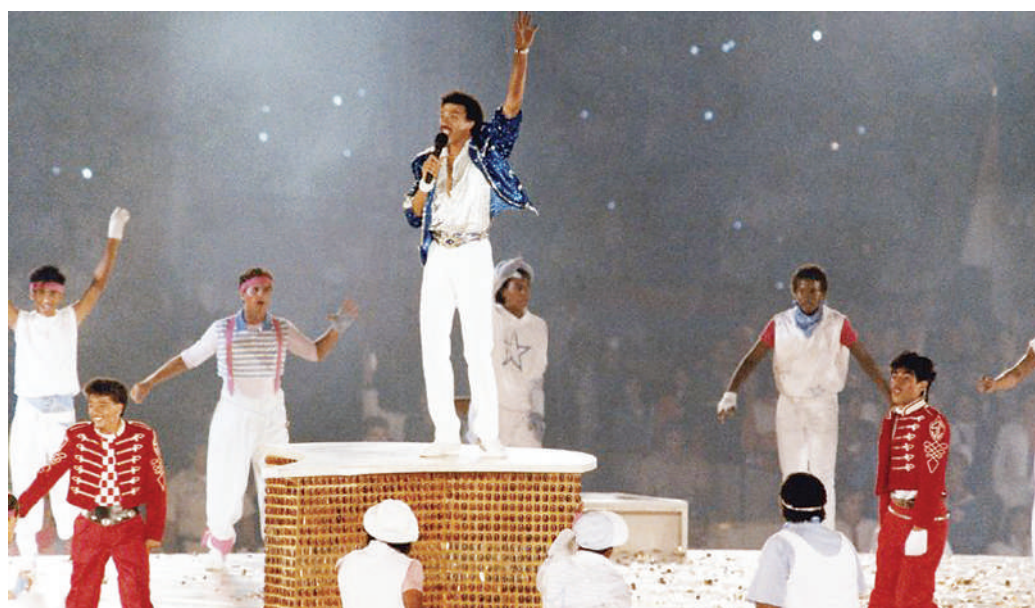
In this Aug. 12, 1984, file photo, American singer Lionel Richie performs during the closing ceremony of the Summer Olympics Games in Los Angeles.