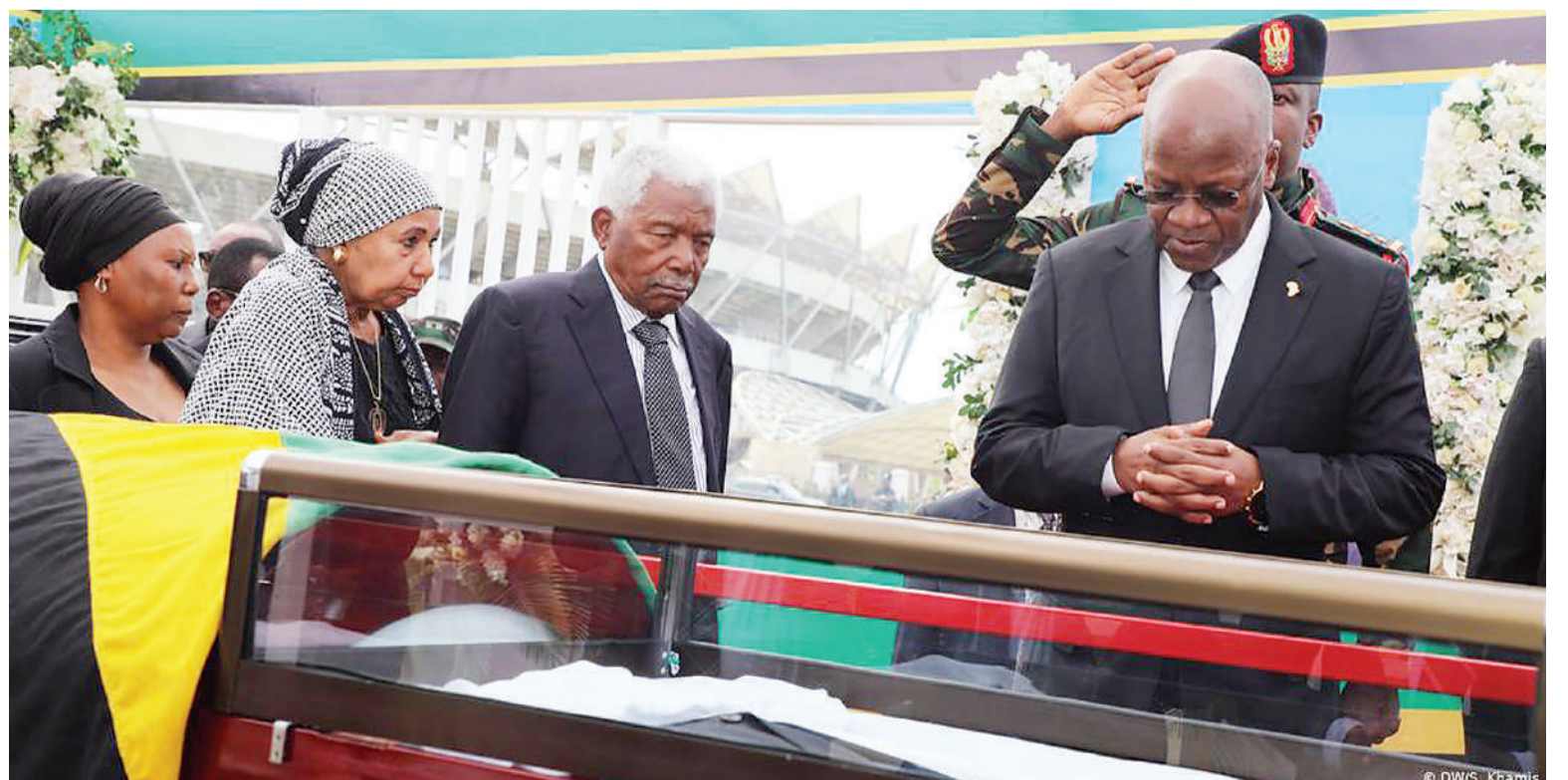
President John Magufuli and former president Ali Hassan Mwinyi pay last respect to former president Benjamin Mkapa. (File photo)