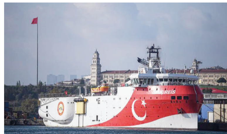
View of Turkish General Directorate of Mineral research and Exploration's Oruc Reis seismic research vessel docked at Haydarpaşa port. (File photo)

coastline in the eastern Mediterranean but that it is penned in to a narrow strip of coastal water by the presence of numerous small Greek islands close to its shore. Greece and other regional states cite a United Nations accord to support their maritime demarcations.