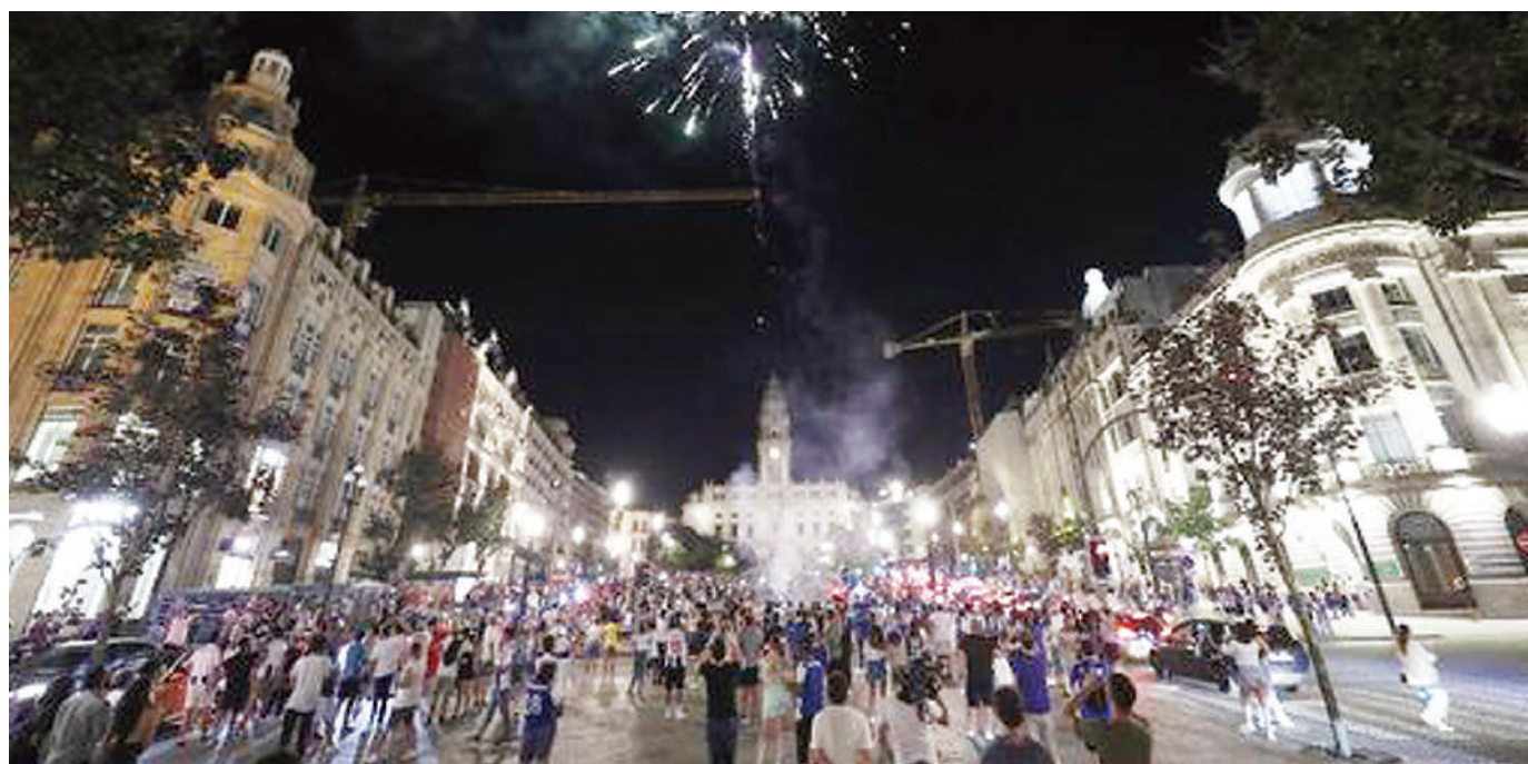
In this July 16, 2020 file photo, FC Porto fans celebrate in downtown Porto, Portugal, after their team beat Sporting CP 2-0 to win the championship.