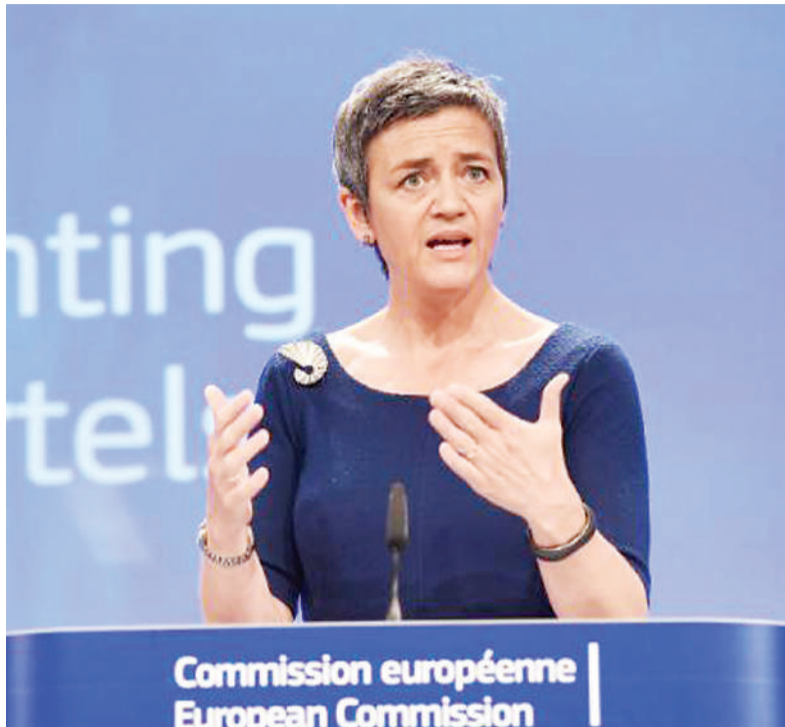
Margrethe Vestager, the EU's antitrust commissioner

The EU said Google had offered to store some of Fitbit's data separately from other Google data.