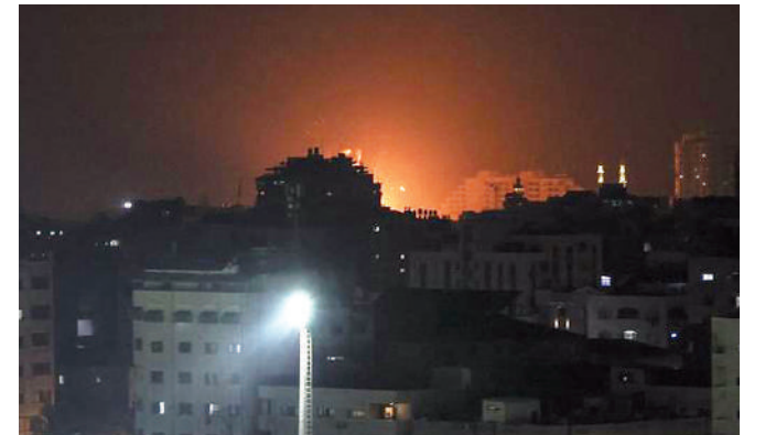
Explosions light-up the night sky above buildings in Gaza City as Israeli forces shell the Palestinian enclave, early yesterday. Israel struck Gaza on Saturday after clashes between its troops and Palestinians protesters on the border left dozens injured, including an Israeli policeman and a 13-year-old Palestinian boy who were both critically wounded.

Cross-border fire from Gaza seriously wounded an Israeli border police soldier, who is in hospital receiving medical treatment, the military said. There was no claim of responsibility for