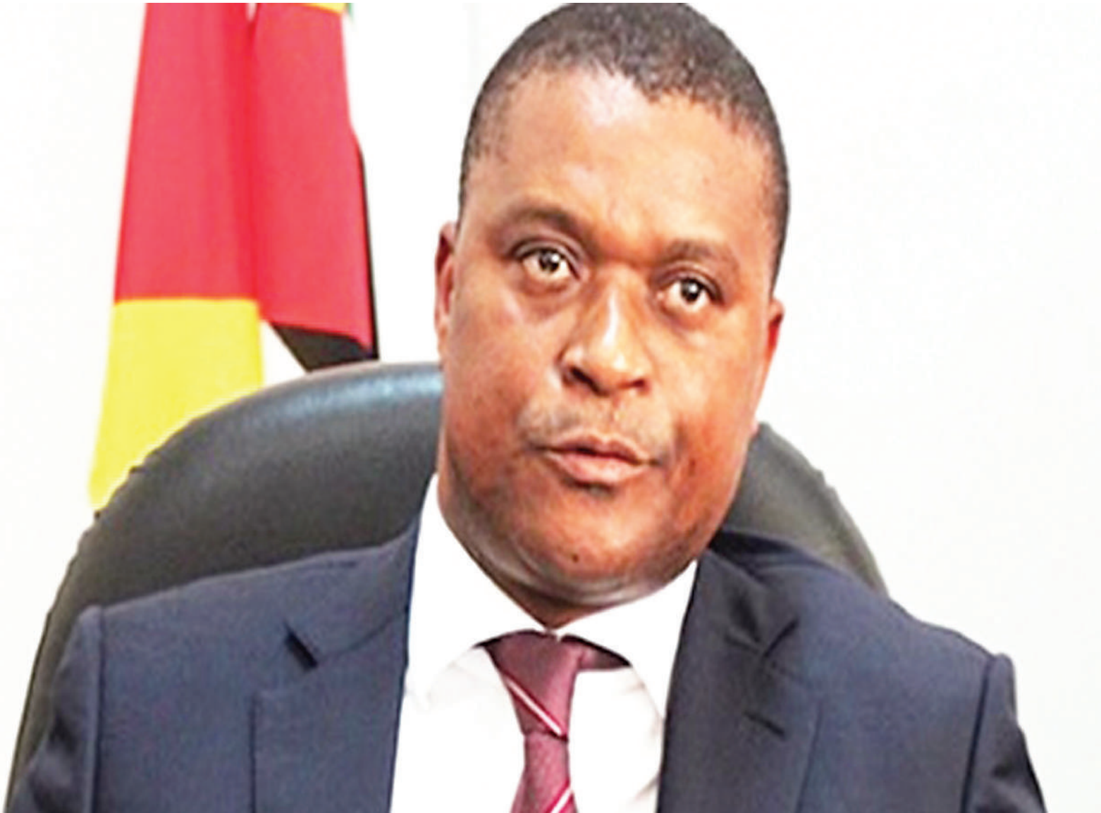
Mozambique's Mineral Resources and Energy minister, Max Tonela.

The UGPK executive secretary maintains that Mozambique's admission to the Kimberley Process will bring great benefits, including the entry of companies interested in prospecting and mining for diamonds, providing Mozambicans with jobs and state revenue, as well as increasing exports.