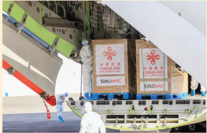
Staff members unload vaccines donated by China at a Philippine Air Force base in Manila, the Philippines on Feb 28, 2021.

China was overcoming difficulties to produce and provide anti-pandemic