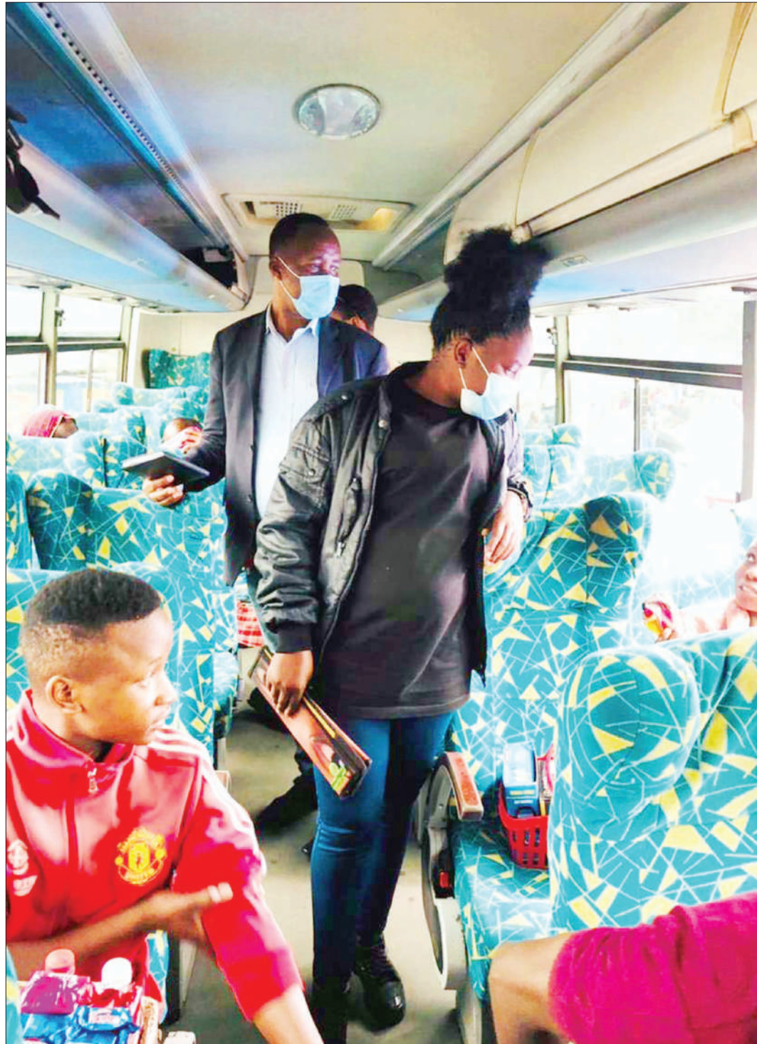
Officials with the northern zone of a national association crusading for the rights of passengers aboard a bus that was just about to make a trip from Arusha city yesterday. Their mission was to underscore the importance of travellers taking precautions against Covid-19 infections.

The government has scrapped a number of taxes, among them the tax in workers' Pay as You Earn (PAYE) posters, importation of thick cotton and polyester wrap pieces (vitenge) so as to further create a conducive environment for businesses.