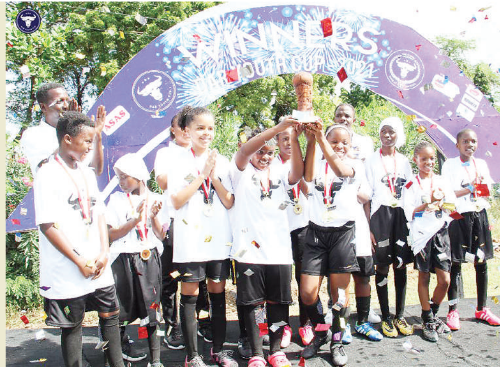
Academy Girl Bulls soccer outfit's players celebrate with a trophy they won in this season's Dar Youth Cup tournament's U-14 girls' event at Dar es Salaam Gymkhana Club (DGC) in June.

Grealish is up and running, and so are Man City