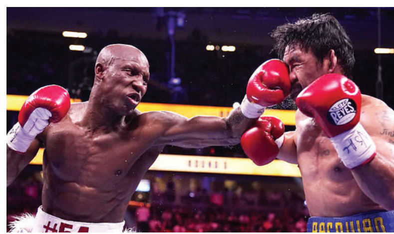
Yordenis Ugás, left, of Cuba, hits Manny Pacquiao, of the Philippines, in a welterweight championship boxing match Saturday, Aug. 21, 2021, in Las Vegas.

A visibly disappointed Pacquiao said he hasn't decided whether he will fight again after an unimpressive performance in his return from the longest layoff of his quarter-century in the sport. He also wouldn't confirm whether he will enter the Philippines' presidential race, as is widely expected. He intends to make an announcement next month. "In the future, you may not see Manny Pacquiao again to fight