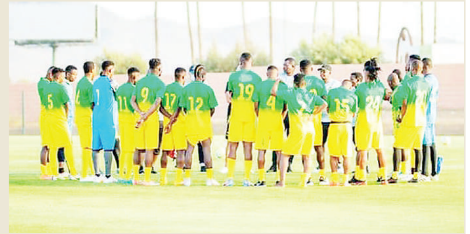
Yanga's players attend training in Morocco last week to shape up for the next season's Mainland Premier League fixtures.

An ideal training camp for either of the city rivals would have been in a cooler environment, as they don't gain anything trying to be capable of playing under ex-