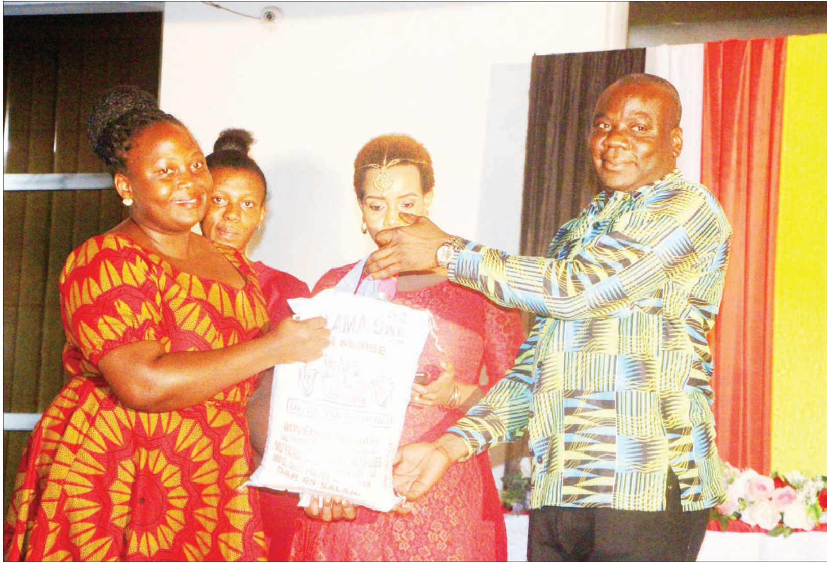
Dar es Salaam City mayor Omary Kumbilamoto (R) presents a prize to one of eight women who emerged winners in the second season of a value-added campaign for food vendors campaign conducted by East Africa Radio and EATV as part of 'MamaMia' programme. It involved some 400 women in total. The event was held in Dar es Salaam at the weekend.