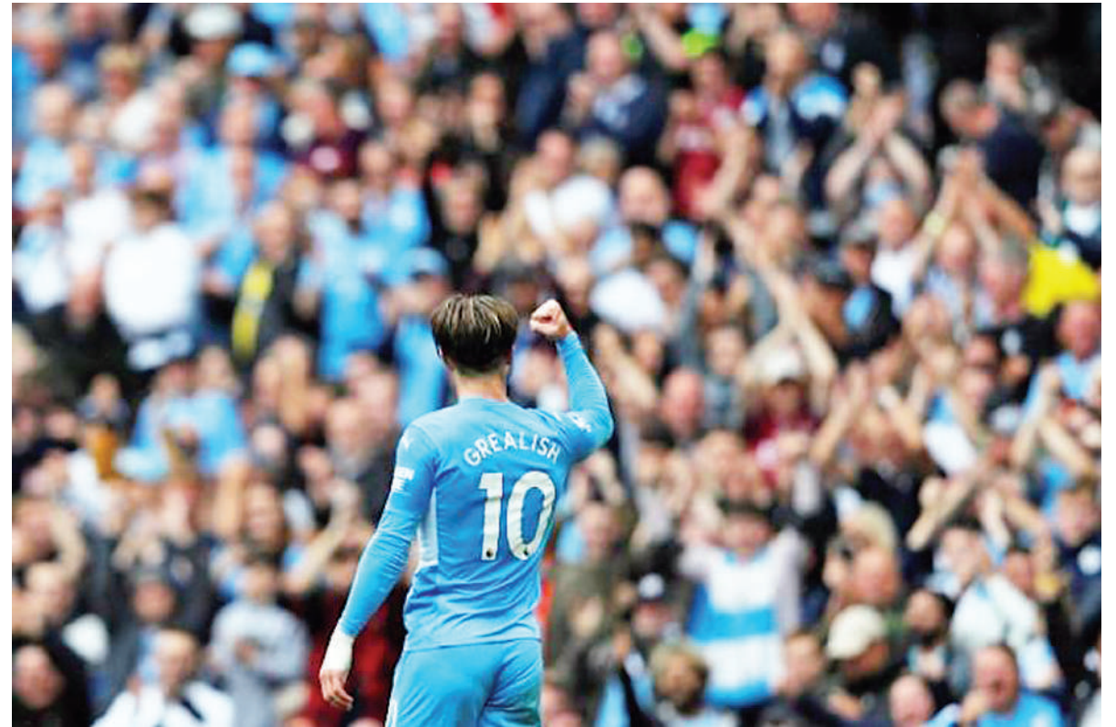
Jack Grealish scored his first Manchester City goal in a 5-0 thrashing of Norwich.

Grealish cited Guardiola as one of the reasons he chose to leave his boyhood club this summer, and it's not hard to understand why. Under the Catalan, Raheem Sterling went