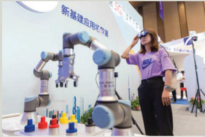
A visitor experiences a 5G-driven robotic arm at an exhibition on the application scenarios of new infrastructure in Nantong city, east China's Jiangsu province, July 30, 2020. File photo

The 5G unmanned bridge cranes have enabled the manufacturer to increase its daily shipments by 1,305 tons and its