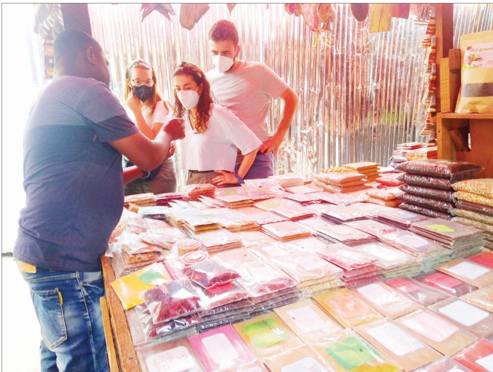
A small trader at Zanzibar's popular Darajani market pictured yesterday displaying to tourists the spices he sells.

Tanzania and the US have maintained cordial relations for 60 years now, hence this year when you are celebrating 60 years of your independence, we shall work together with you to mark our relations, hence the centres handed are part of efforts to strengthen those relations