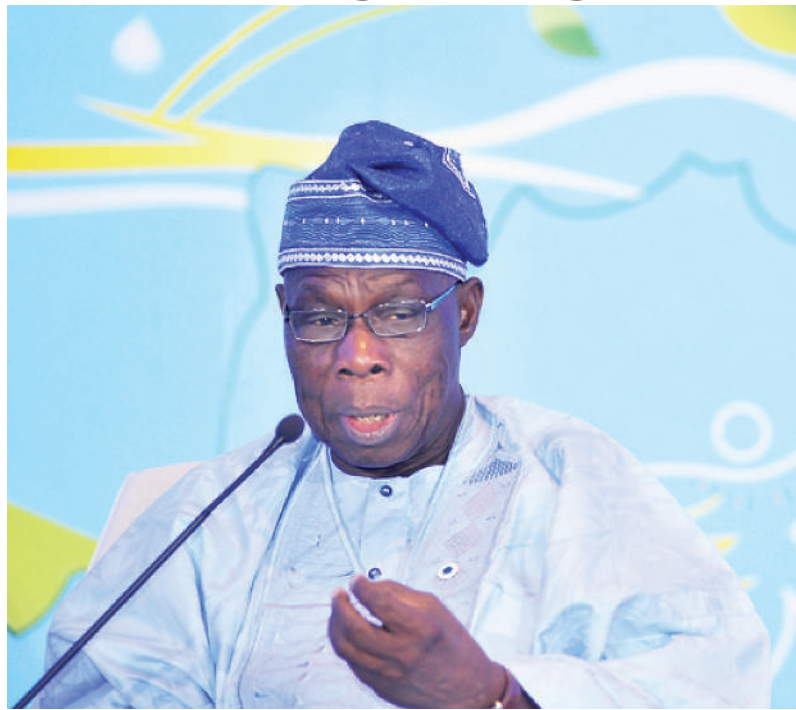
Former Nigerian president Olusegun Obasanjo

In the context of the public sector in modern states, governance is about "steering" the course amidst "the changing boundaries between the public, private and voluntary actors, [which] may include a range of themes [such as] "the process of engagement (politics), the substantive issues (policy), and the institutional structures through which state and other actors relate to one another (polity)" (Hardiman, 2014: 228). Even in stable democracies, the complex interactions and associated