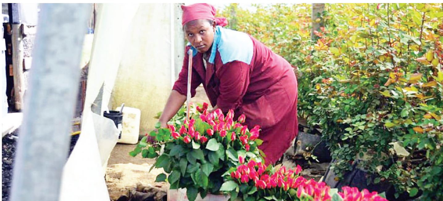
A worker packs flowers for export at a farm in Naivasha Kenya, in February this year.

"The taxable value is amorphous, ambiguous and arbitrarily imposed on the petitioners' members for compliance, thus