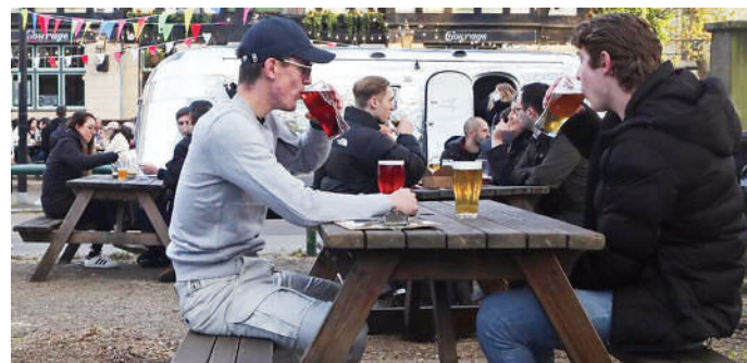
Customers drink outside the Gregorian Pub in London as COVID-19 lockdown restrictions were further eased. (File photo)

Morocco registered 6,513 new COVID-19 cases in the past 24