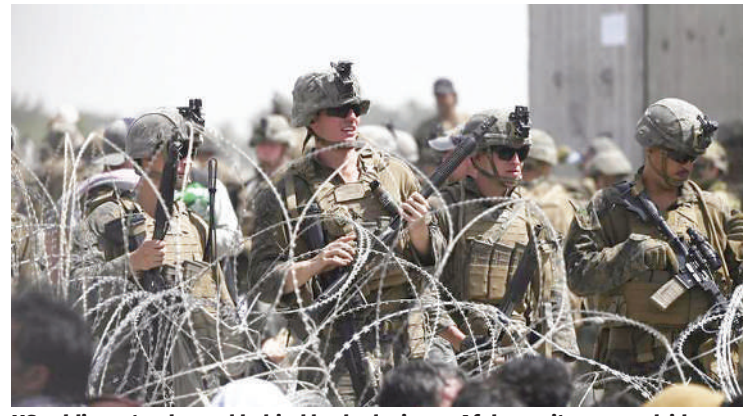
US soldiers stand guard behind barbed wire as Afghans sit on a roadside near the military part of the airport in Kabul on Friday, hoping to flee from the country after the Taliban's military takeover of Afghanistan.

Crowds have grown at the airport in the heat and dust of the day over the past week, hindering operations as the United States and other nations attempt to evacuate thousands of their diplomats and civilians as well as numerous Afghans. Mothers, fathers and children have pushed up against concrete blast walls in the crush as they seek to get a flight out.