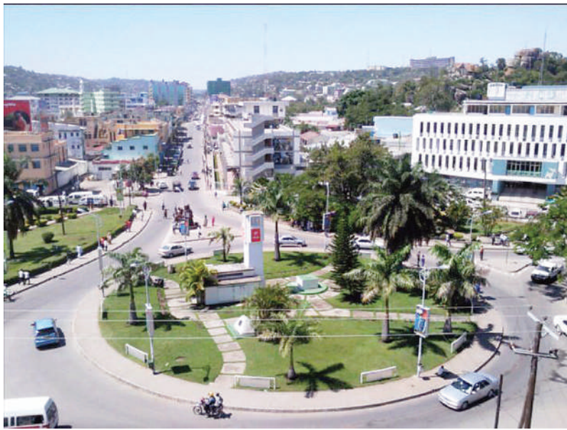
Blessed by magical Mount Kilimanjaro, which overlooks the compact town of Moshi. The people that live on the maintain's slopes find life easier now that they have electricity from the national grid. (File photo)

I was in a compound of two small houses, which uses a few light bulbs only, so where had the Luku