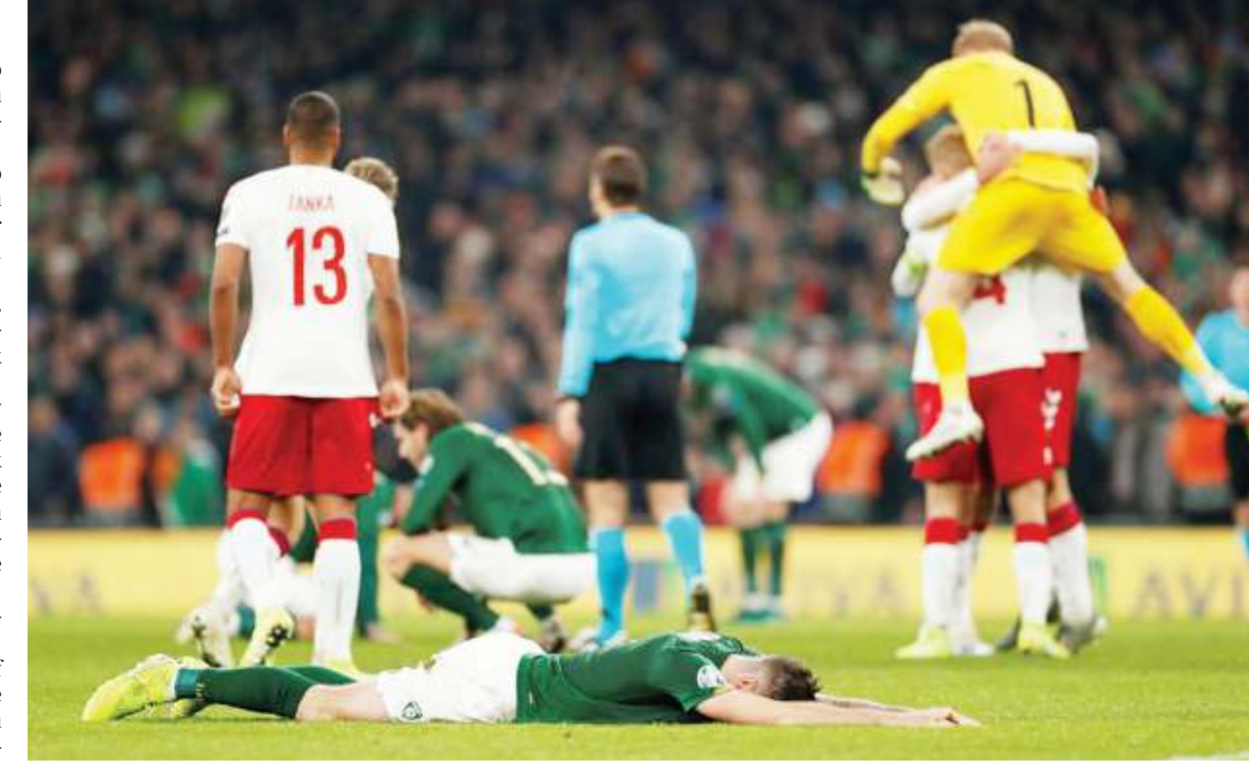
Contrasting emotions: Denmark qualify for Euro 2020 while the Irish are consigned to a four-nation playoff in March.

Riccardo Orsolini came off the bench to score on his Italy debut and Federico Chiesa finished off the scoring after Edgar Babayan had pulled one back earlier, Finland lost 2-1 to Greece in Athens