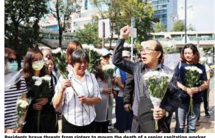
Residents brave threats from rioters to mourn the death of a senior sanitation worker in Sheung Shui of Hong Kong, south China, on Friday. The man died after being hit in the head by a hard object hurled by the rioters.

concerning fugitives' transfers sparked unrest, rioters have vandalized shops, attacked police officers, blocked roads, torched mass transit railway stations, turned universities into strongholds, and forced classes to be suspended.