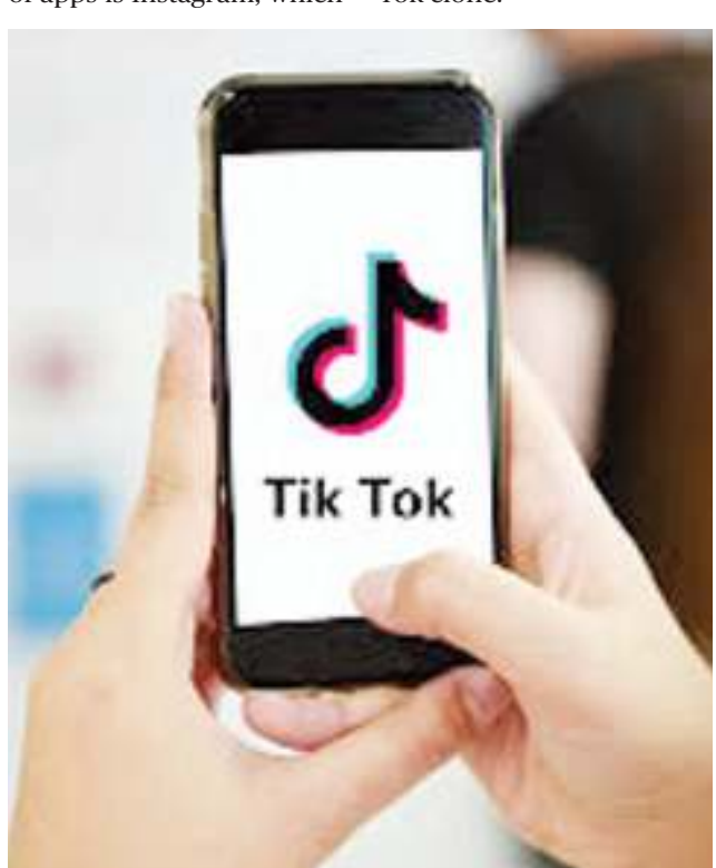
An icon of TikTok App displayed on a handset

Earlier this month Instagram started testing a new feature called Reels with its Brazilian users, which was widely perceived as a Tik-Tok clone.