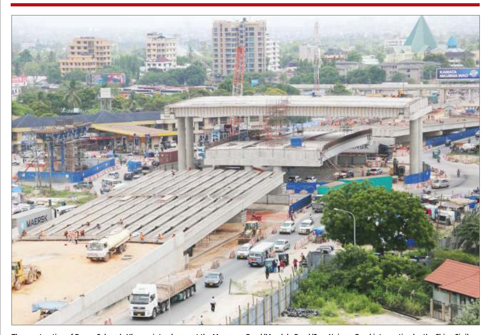
The construction of Dar es Salaam's Ubungo interchange at the Morogoro Road/Mandela Road/Sam Nujoma Road intersection by the China Civil Engineering Construction Corporation is registering steady progress. Chief